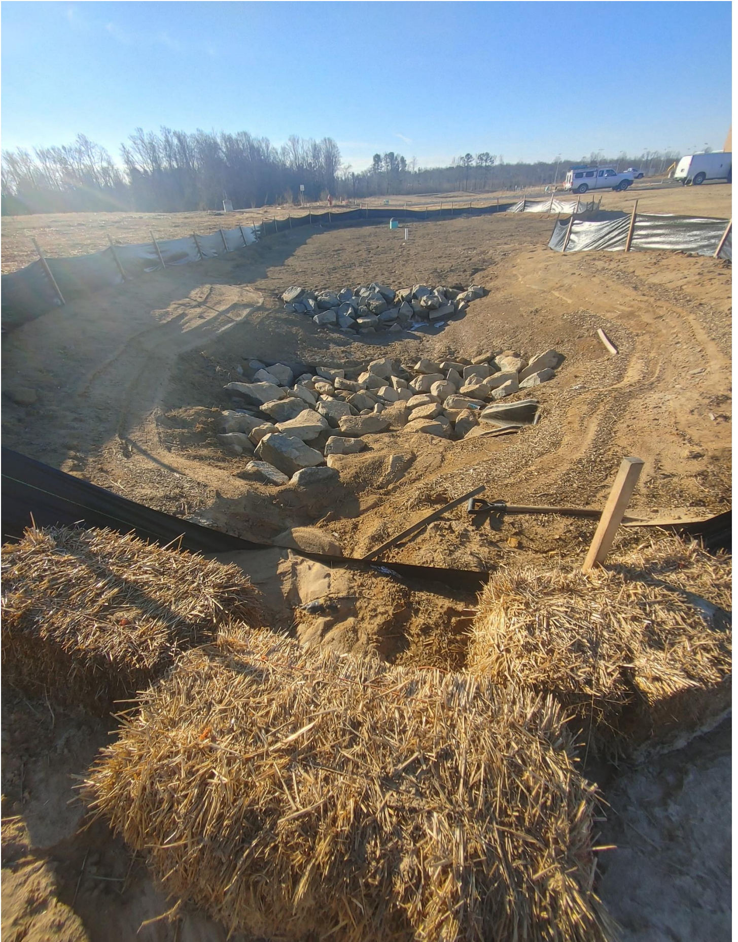
Photo 1 - BMP2B silt fence in need of repair.