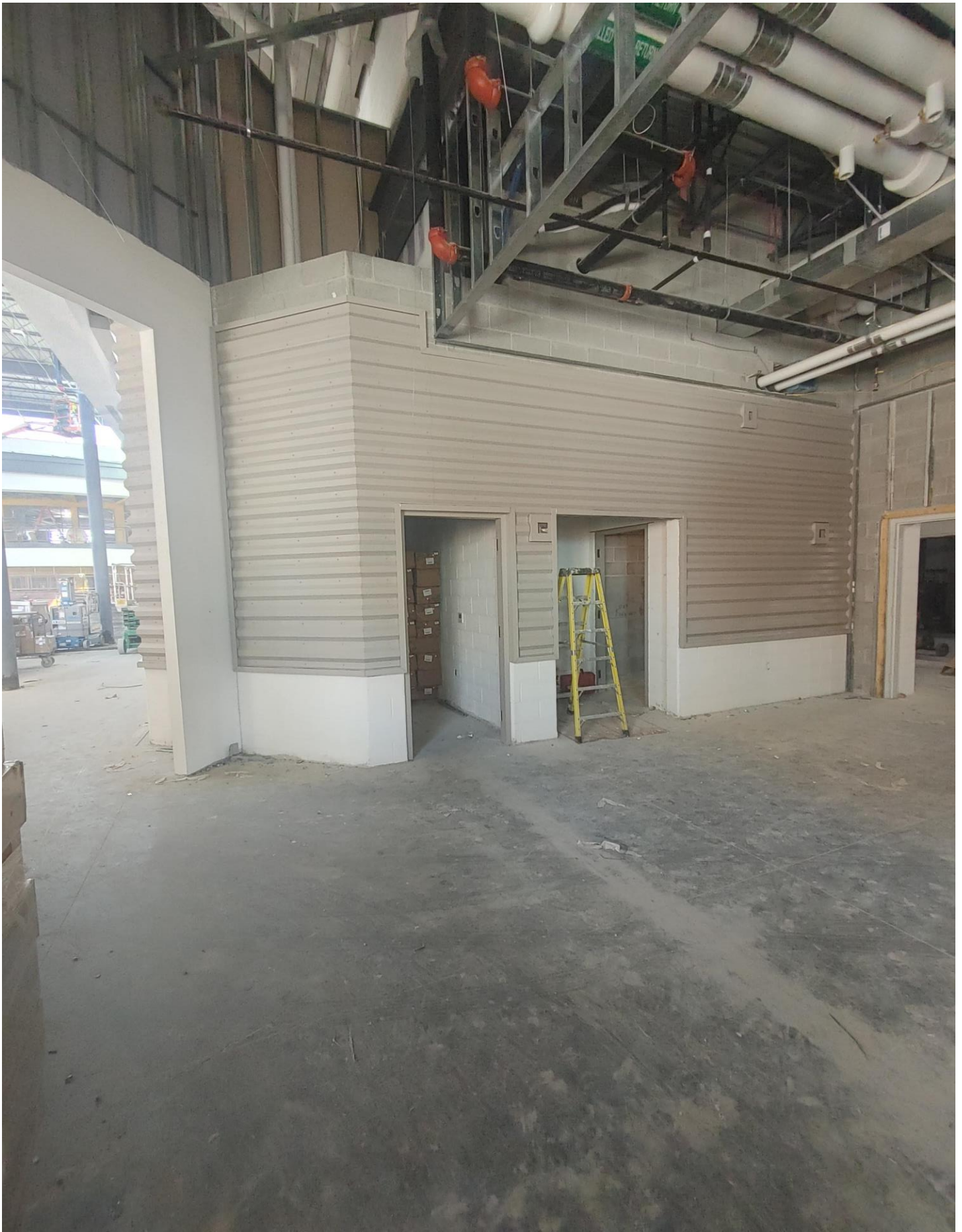
Photo 5 - Metal Wall completed outside of D104 and D117