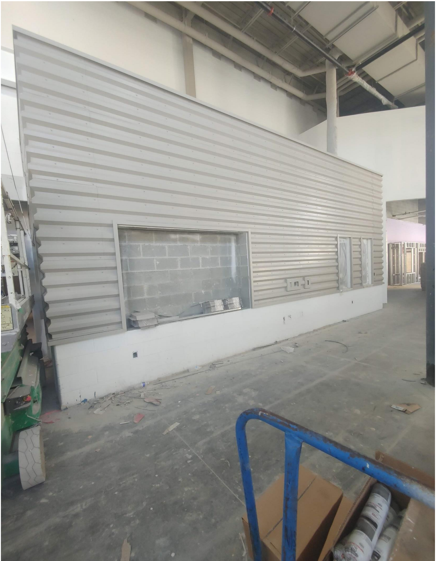
Photo 4 - Metal wall has been completed in Area C