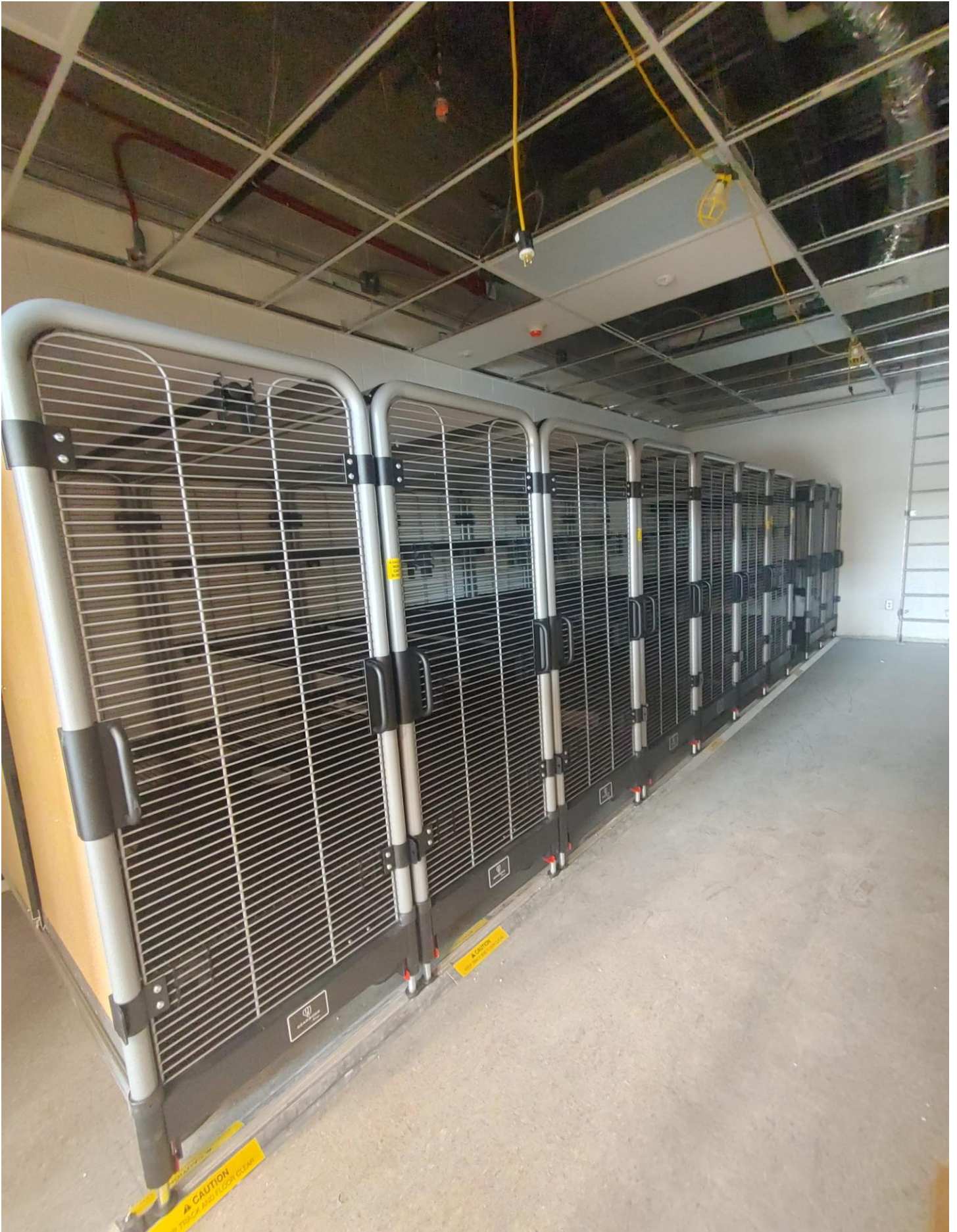
Photo 5 - Equipment Cages have been installed in Room E130