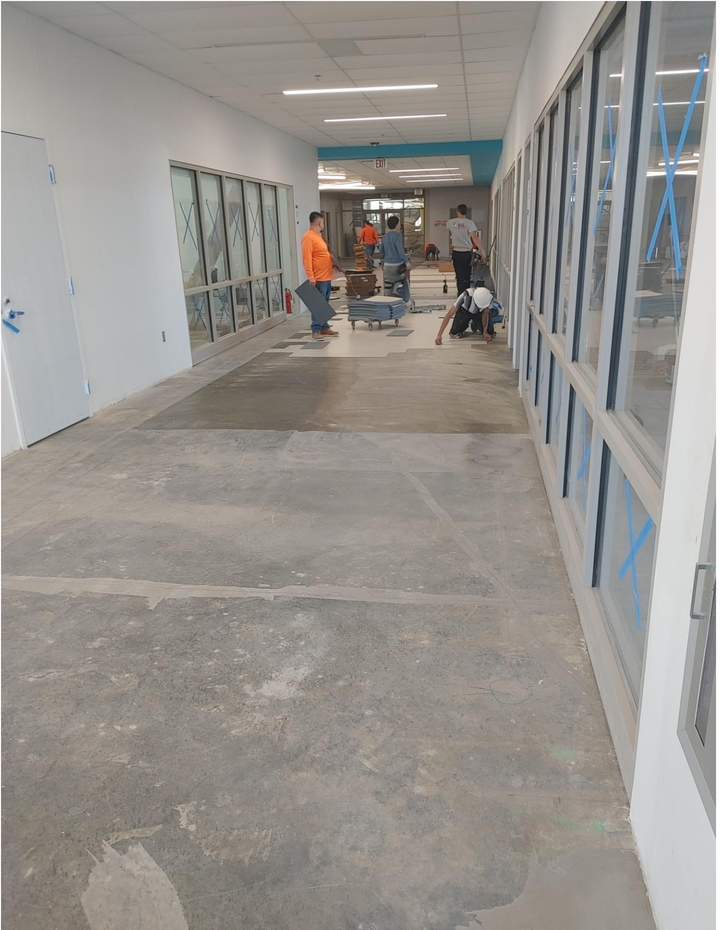
Photo 9 - VCT is being laid in A10 Design Commons