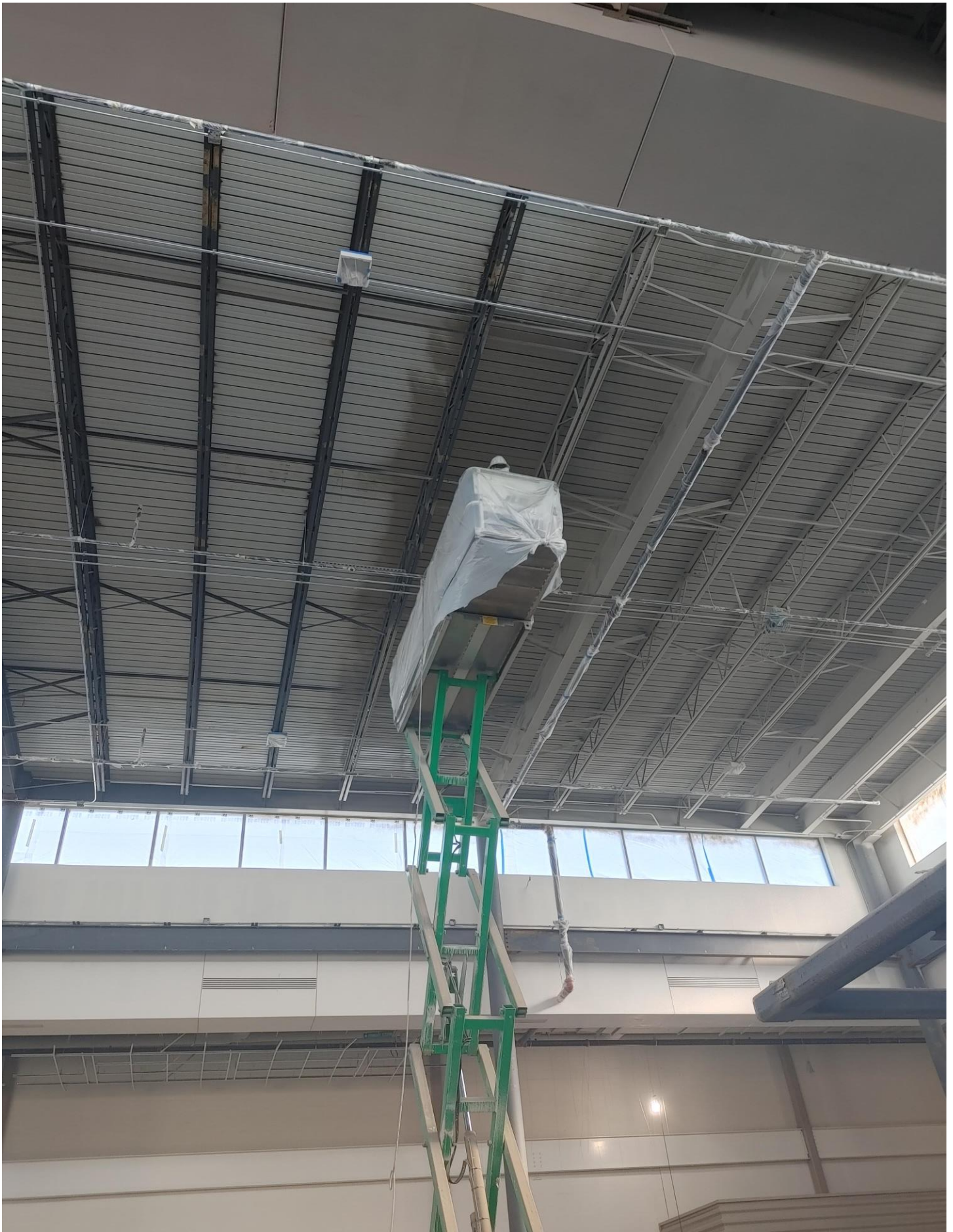
Photo 4 - Roof Deck is being painted in Area C.