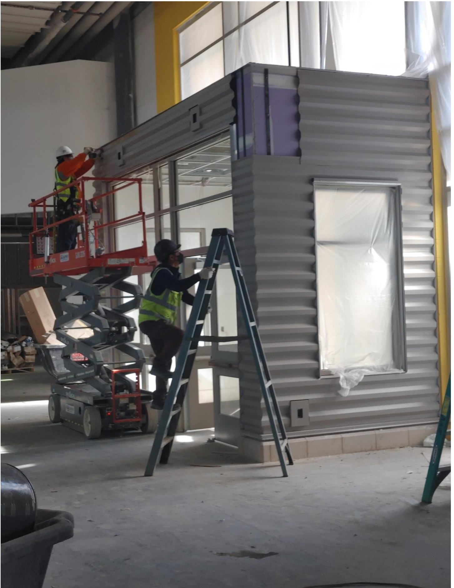
Photo 6 - Metal Panels are being installed in Area C.