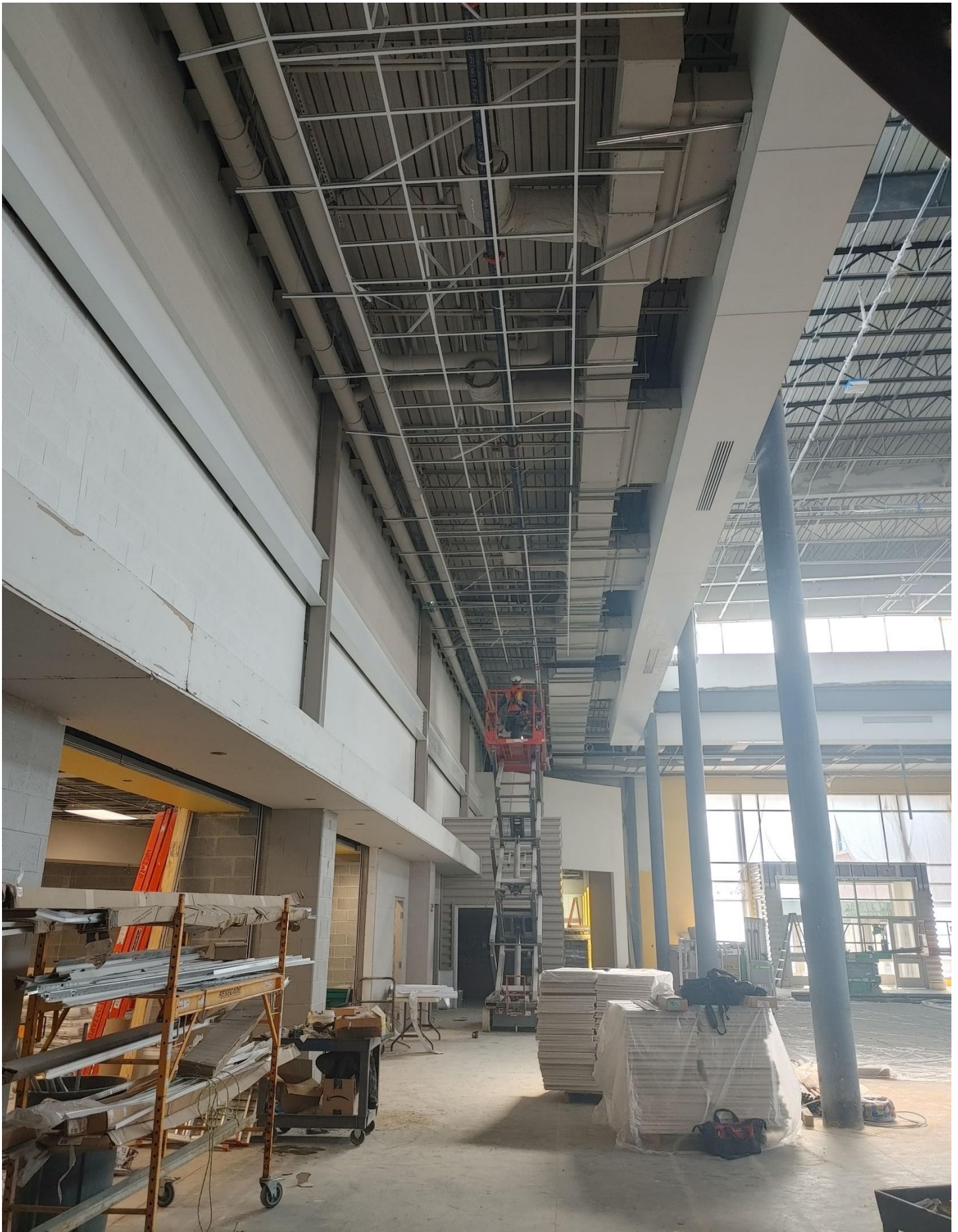
Photo 1 - Acoustical Cloud Ceiling is being installed in Area C