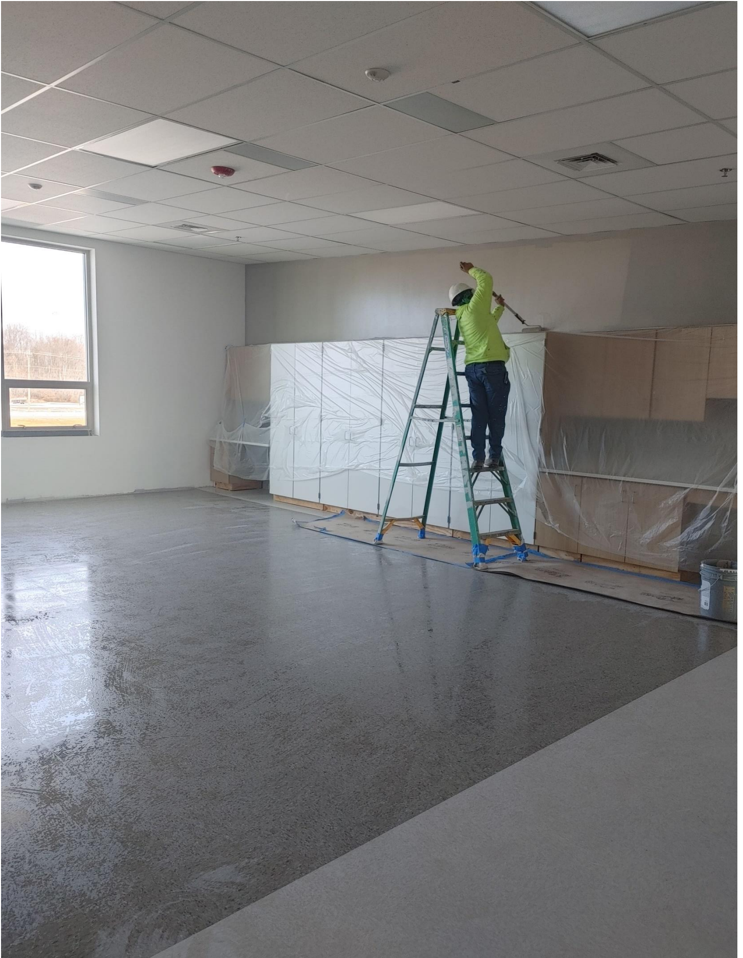
Photo 3 - Painter is painting in Area B