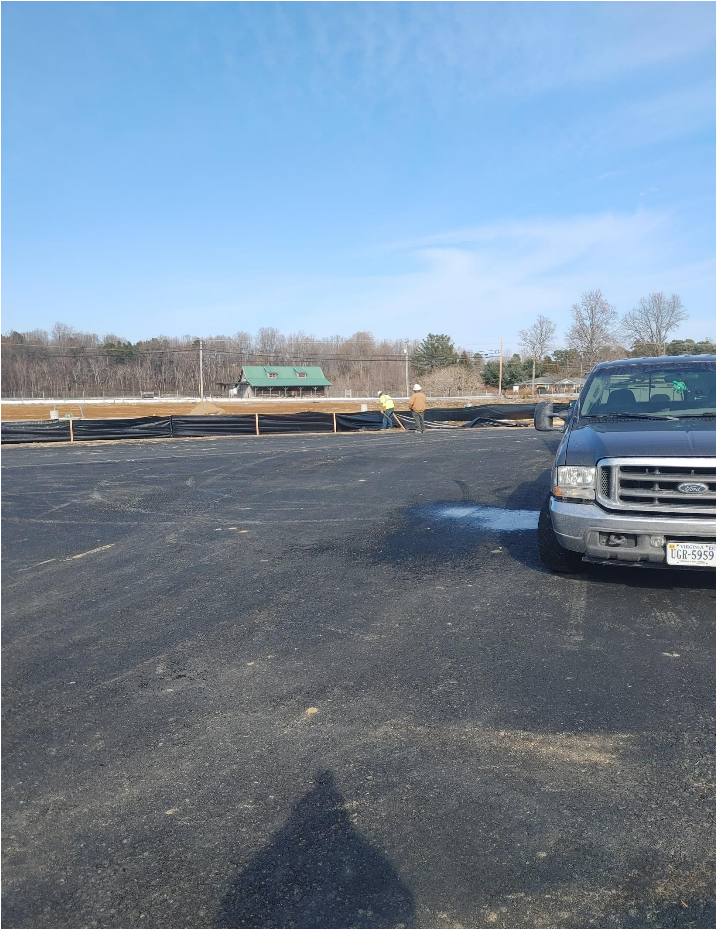
Photo 10 - Silt Fence is being erected around the site.