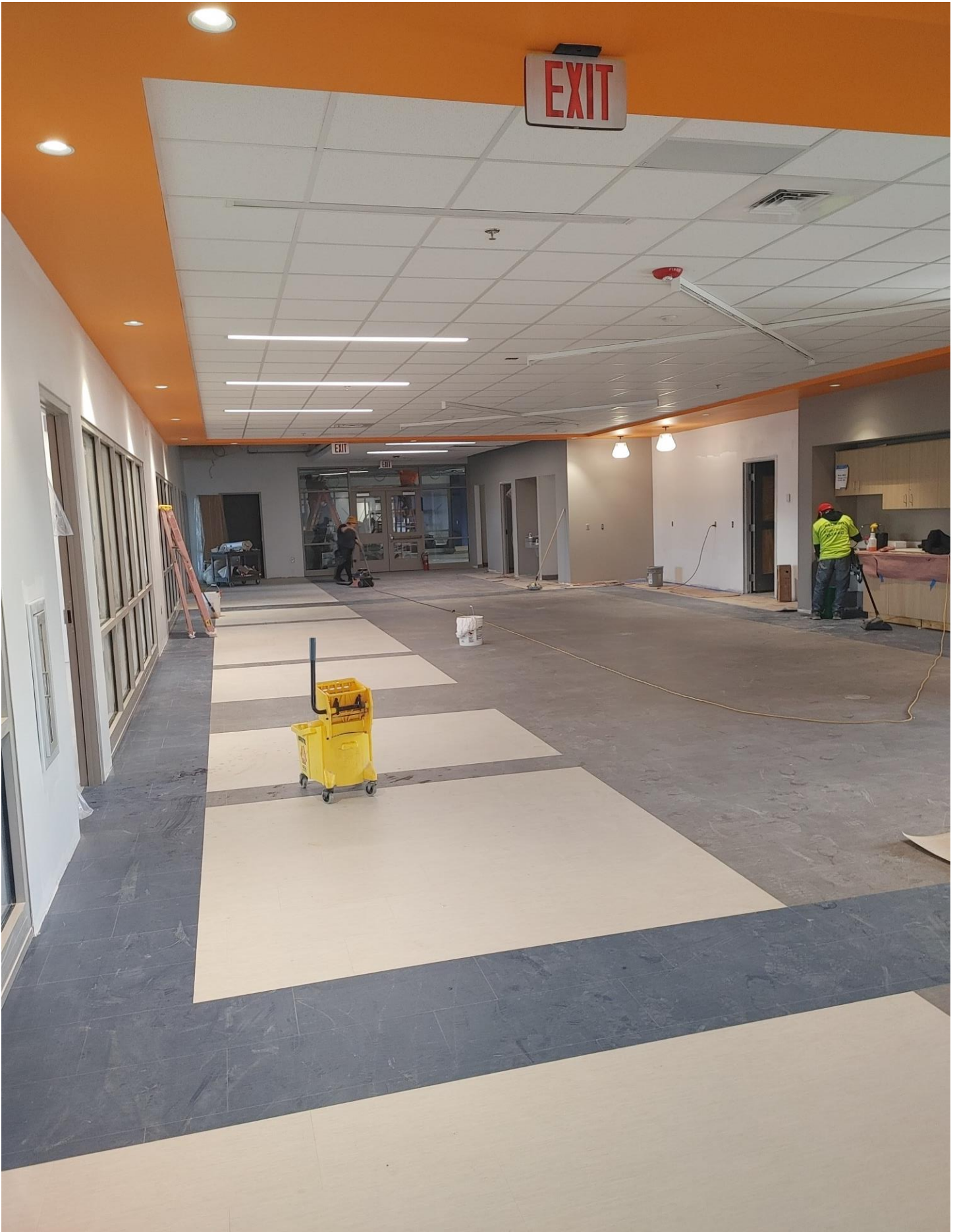
Photo 2 - 1st Floor, Area B, Room B10 - Design Commons