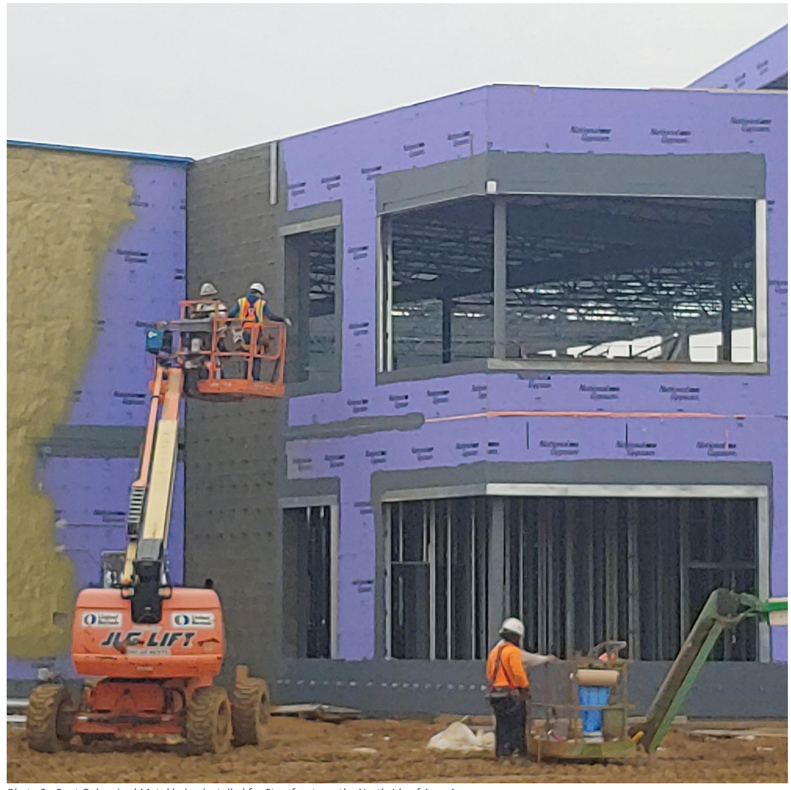
Photo 3 - Bent Galvanized Metal being installed for Storefronts on the Northside of Area A