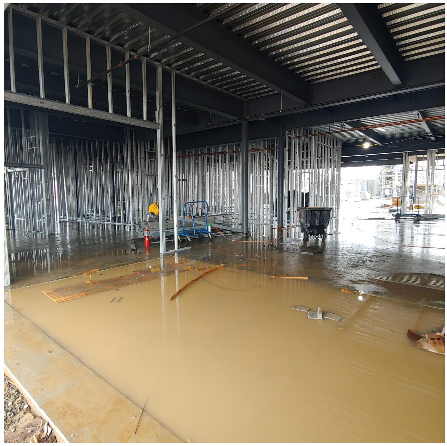
Photo 4 - Framing continues in the Administrative Office area of Area A