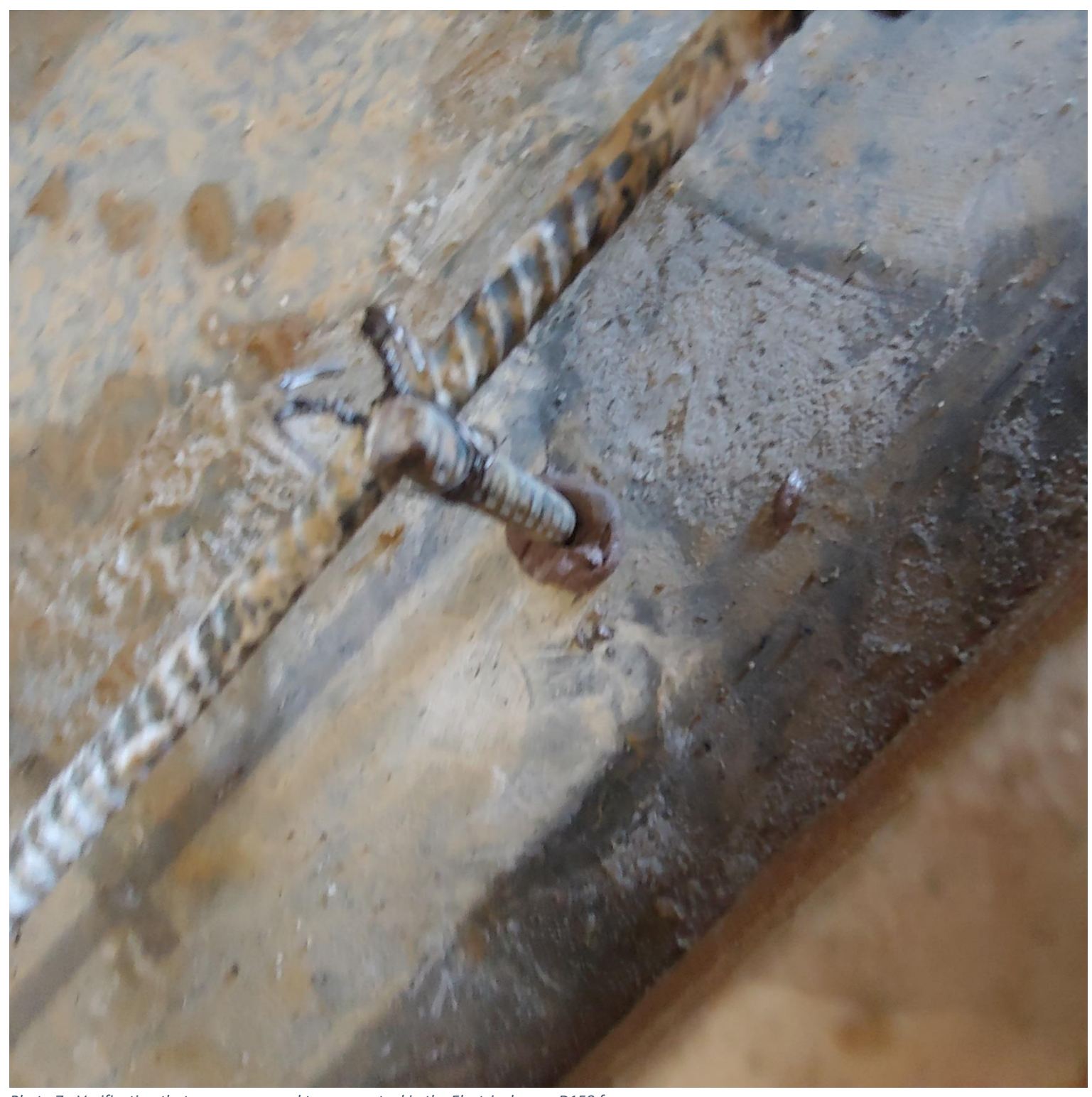
Photo 7 - Verification that epoxy was used to secure steel in the Electrical room D158 forms.