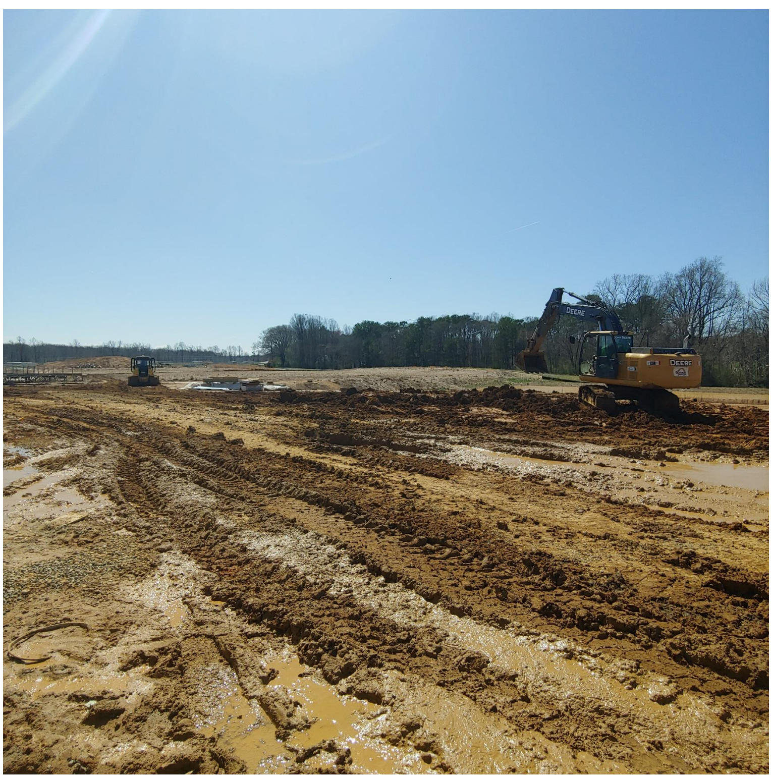
Photo 4 - Dozer and Excavator dressing up the Westside of the site.