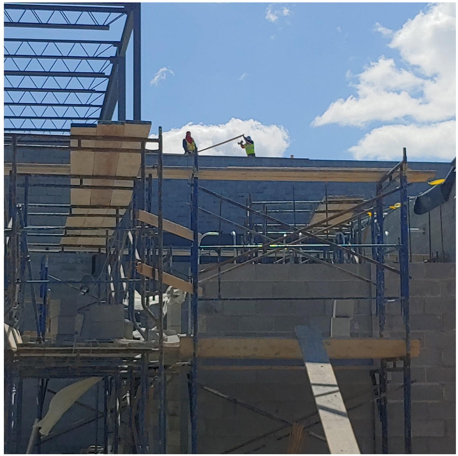
Photo 1 - Parapet wall being constructed on the high roof of Area E