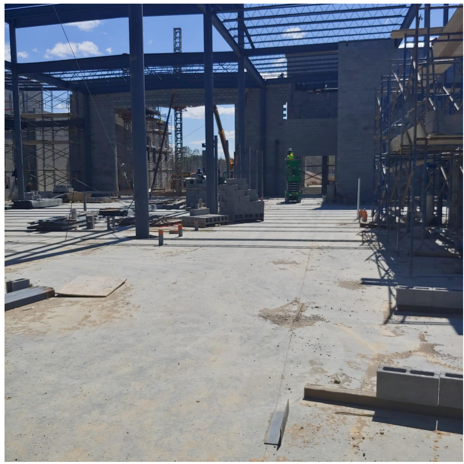
Photo 2 - Masons are finishing the blockwork on the South wall of Area C