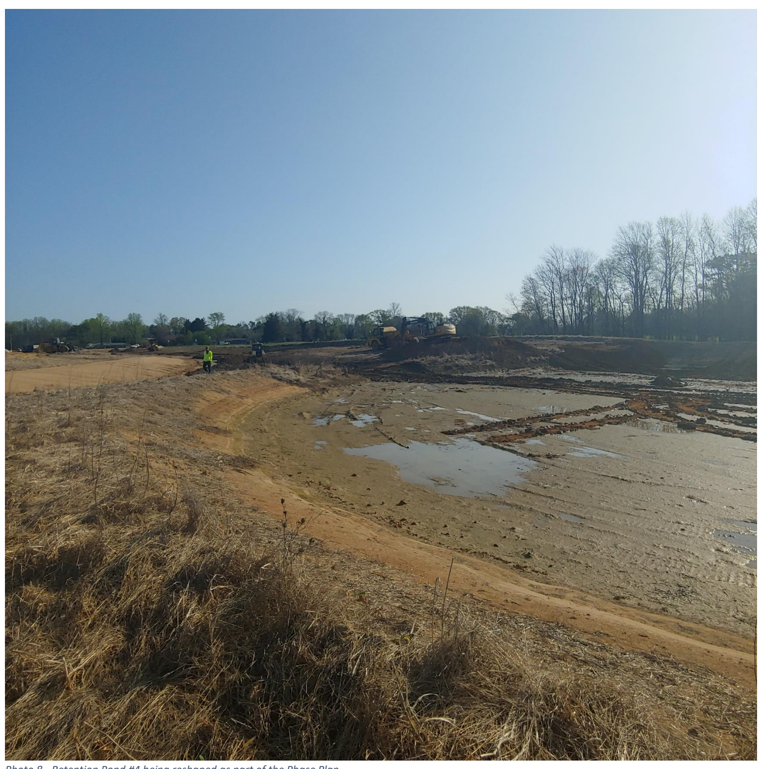
Photo 8 - Retention Pond #4 being reshaped as part of the Phase Plan.