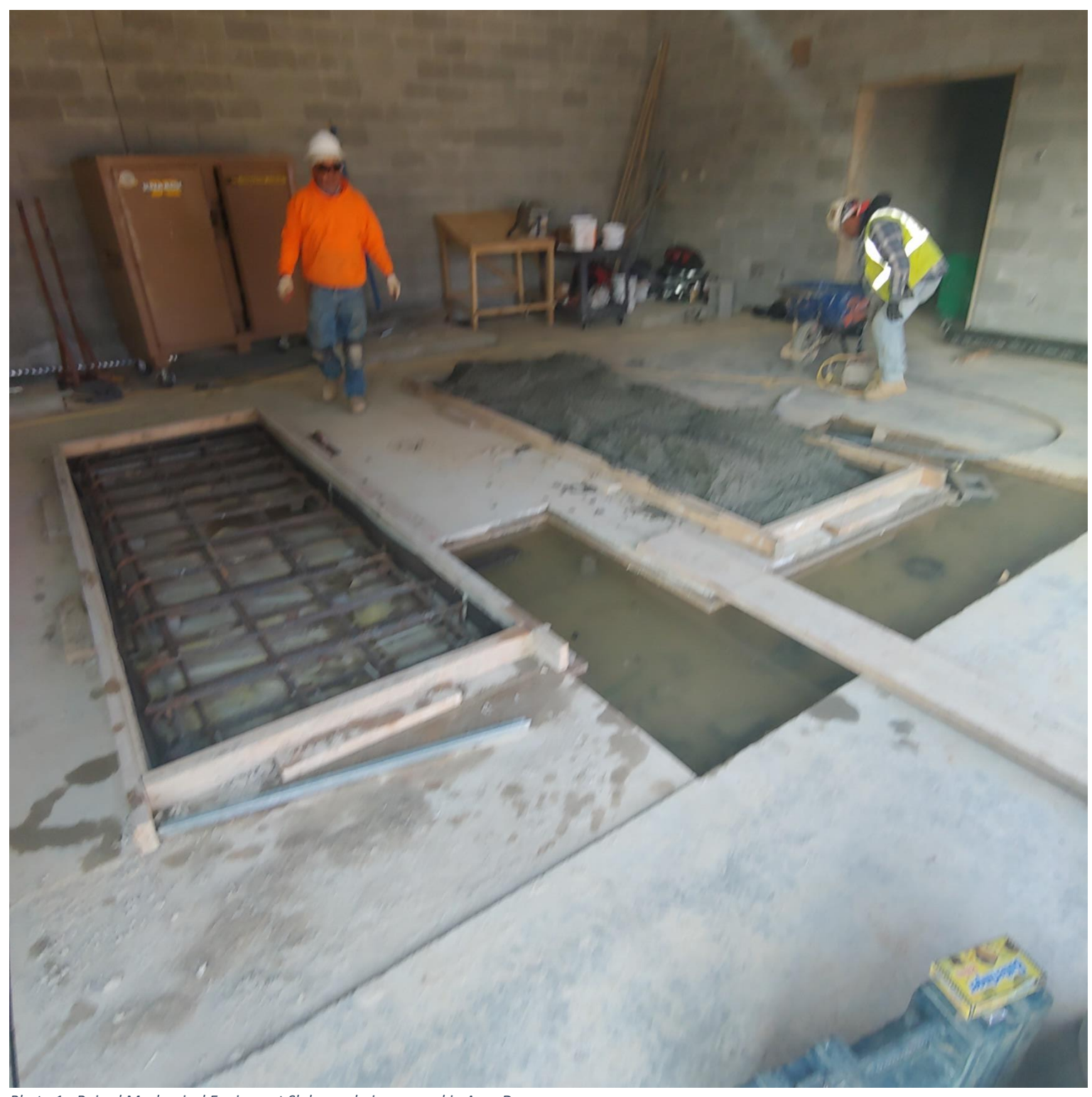
Photo 1 - Raised Mechanical Equipment Slabs are being poured in Area D