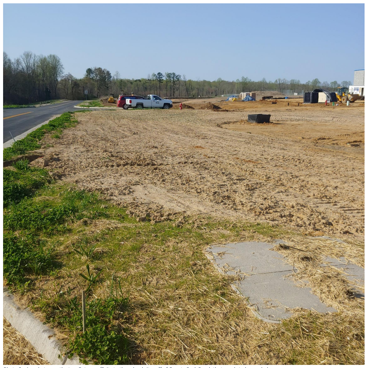
Photo 9 - Area between the two Entrance/Exits to the school site, off of County Park Road, that needs to be seeded.