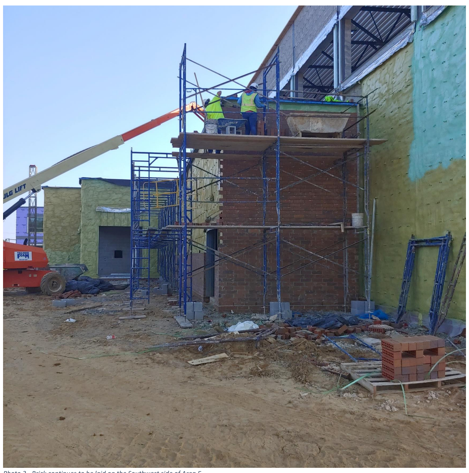
Photo 2 - Brick continues to be laid on the Southwest side of Area E