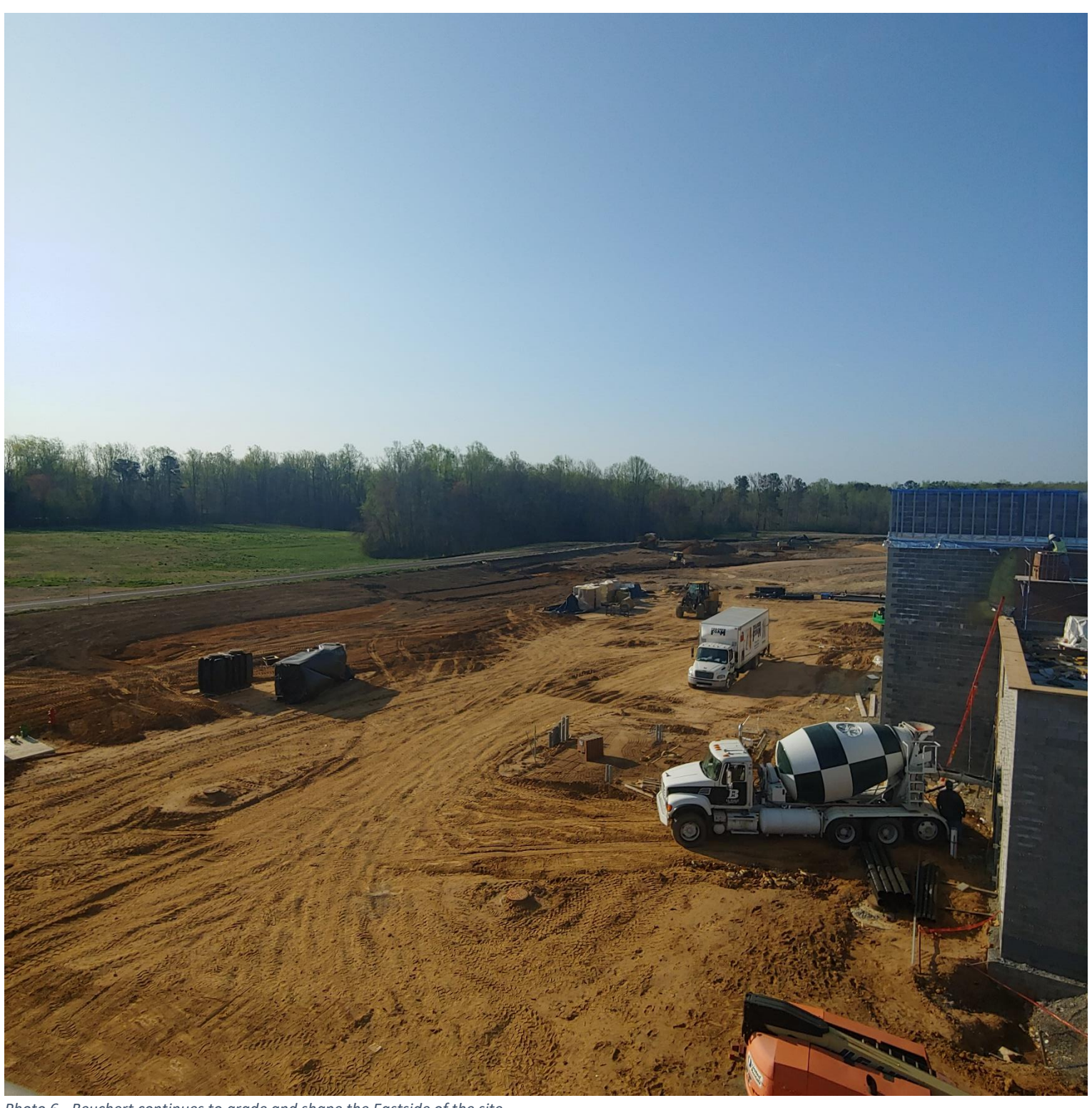
Photo 6 - Beuchert continues to grade and shape the Eastside of the site.