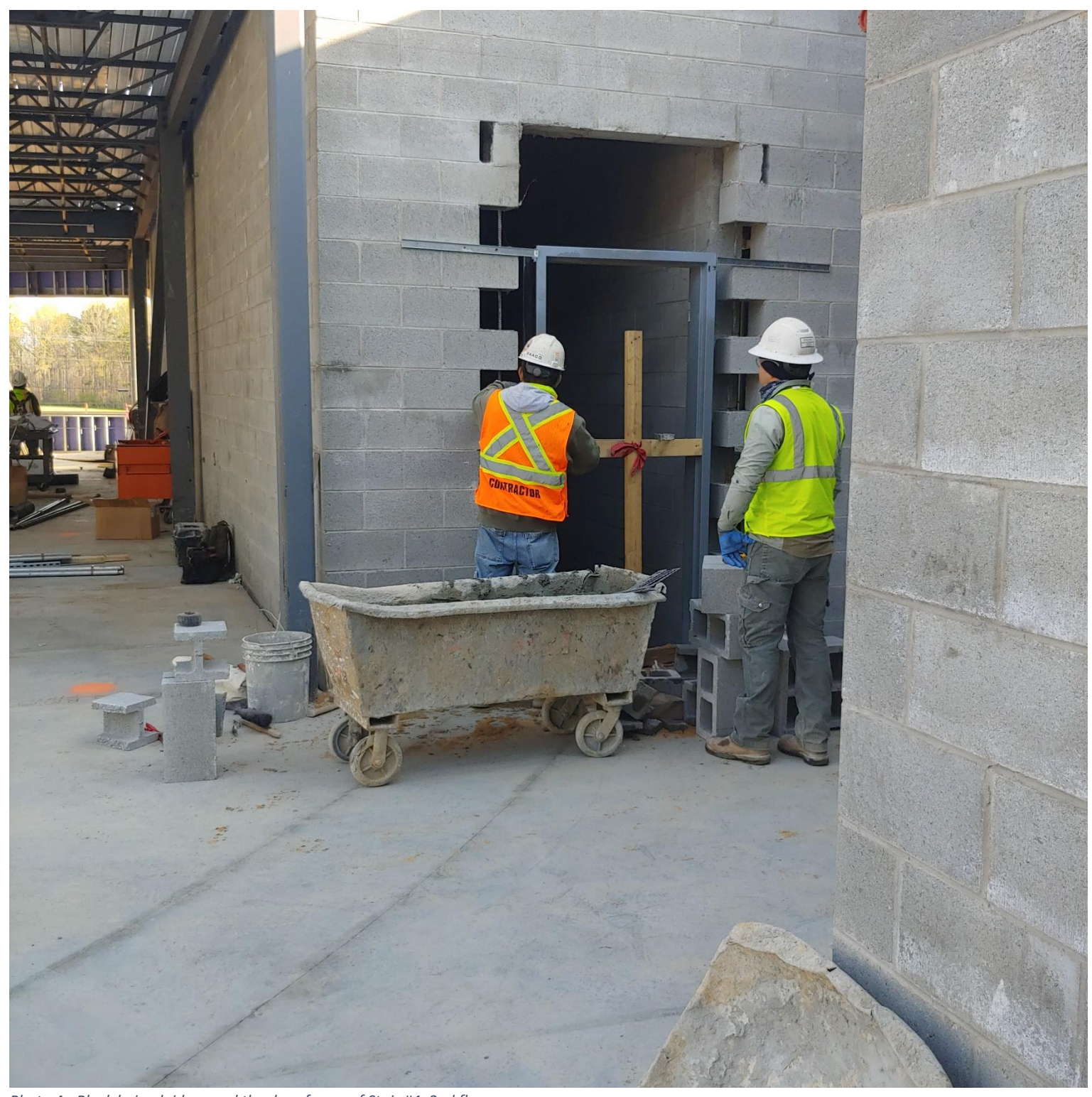
Photo 4 - Block being laid around the door frame of Stair #4, 2nd floor.