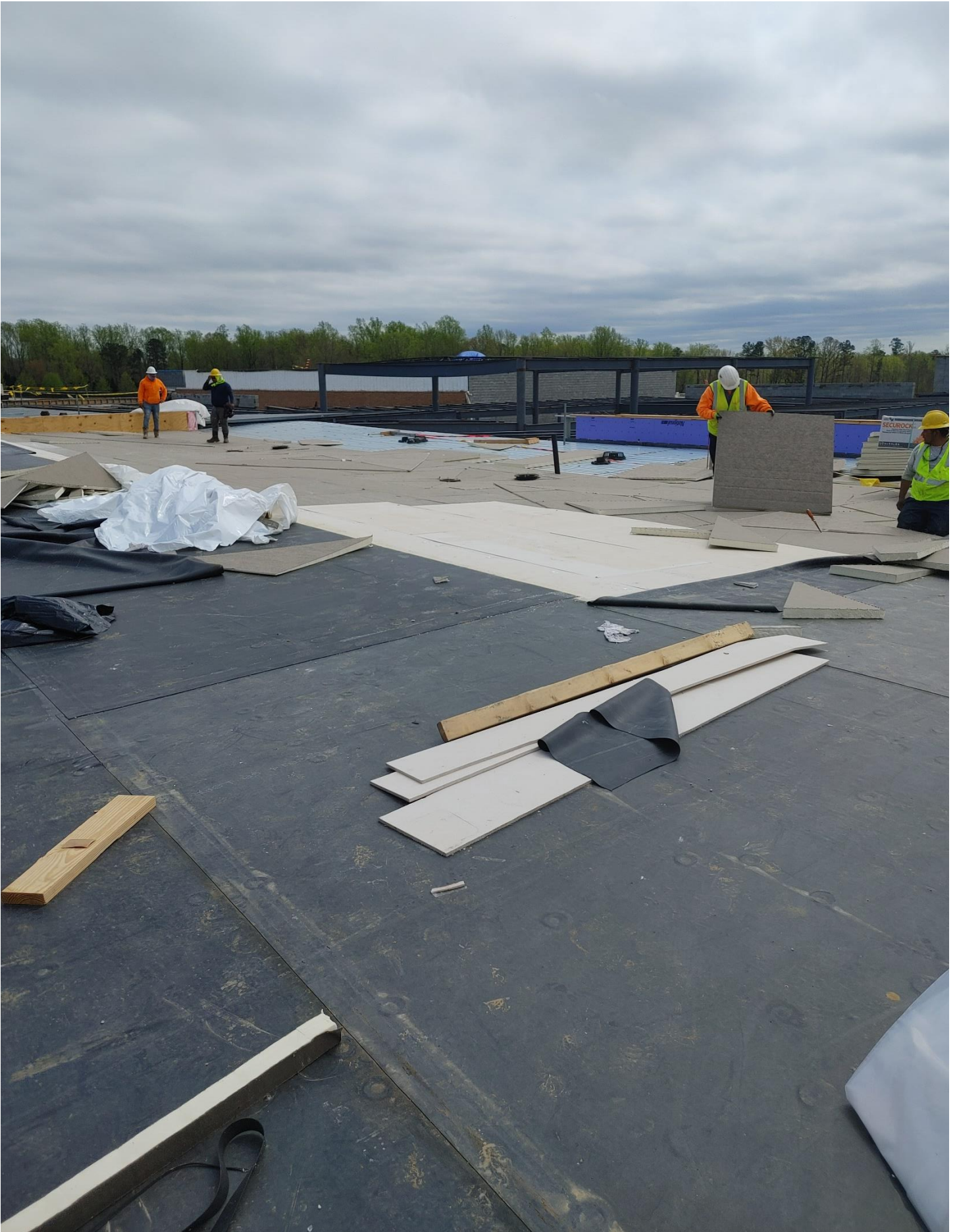
Photo 10 - Roofers continue to work on the Rook of Area B