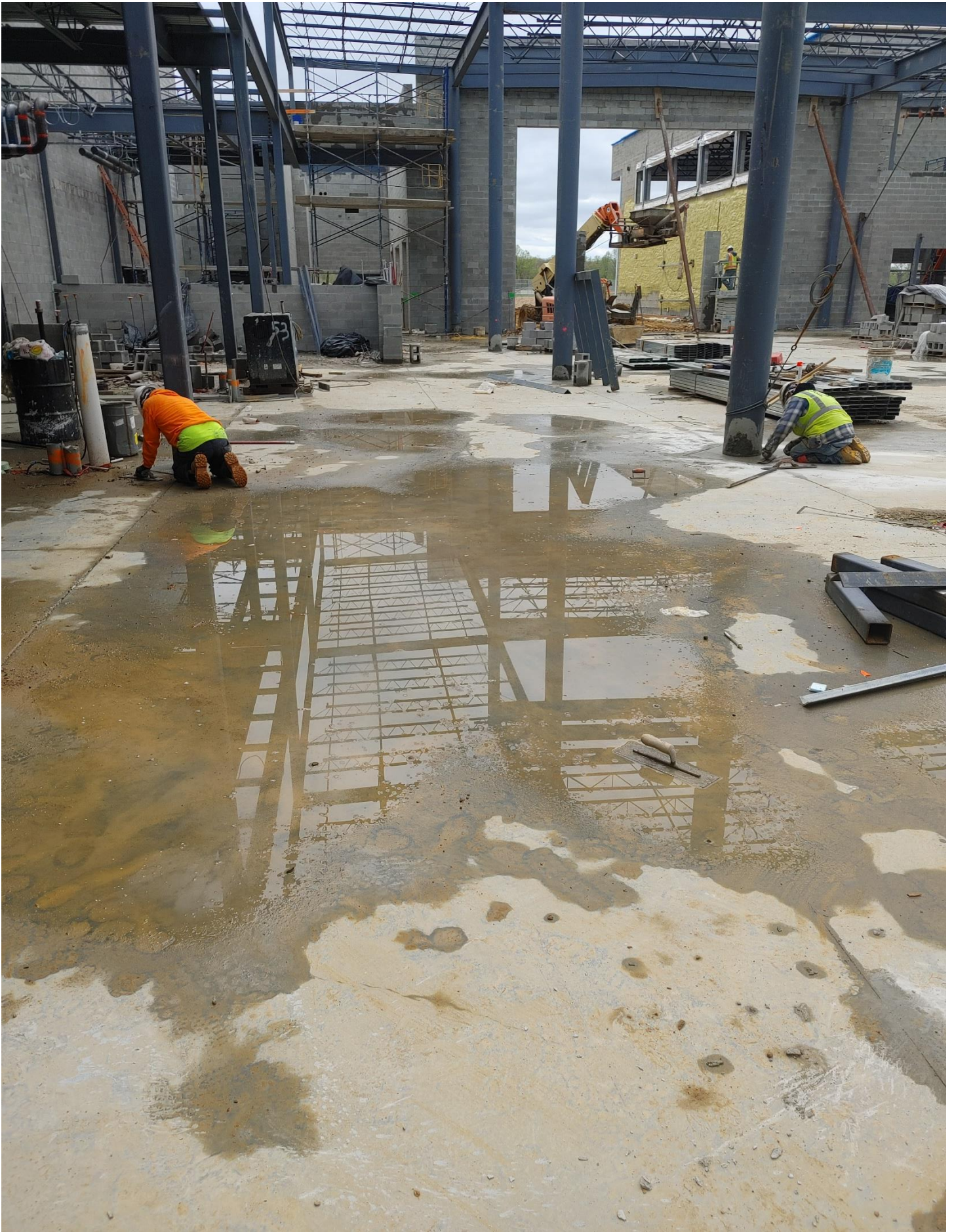
Photo 6 - Diamonds be poured and finished in Area C