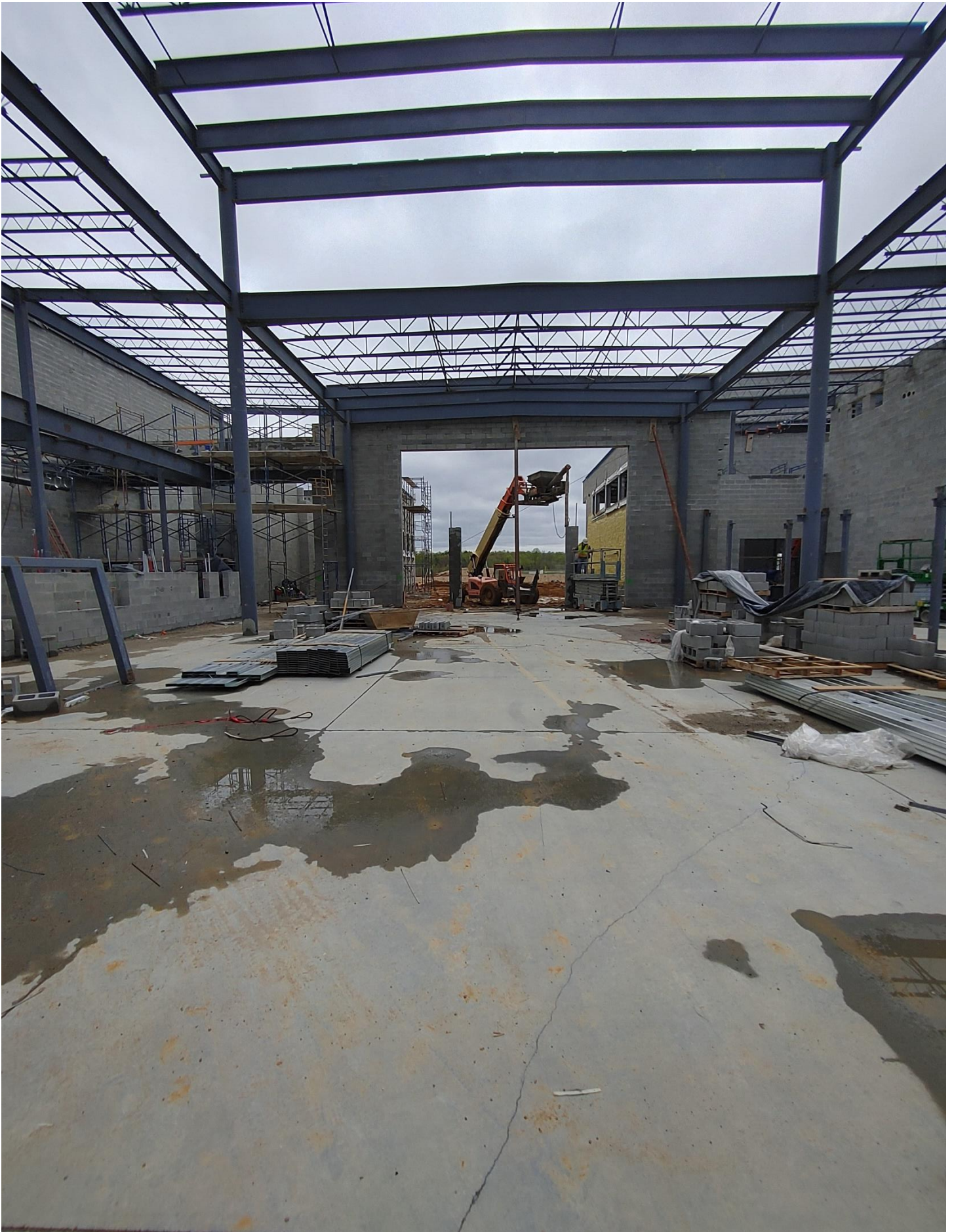
Photo 7 - Block being grouted on the Southside of Area C