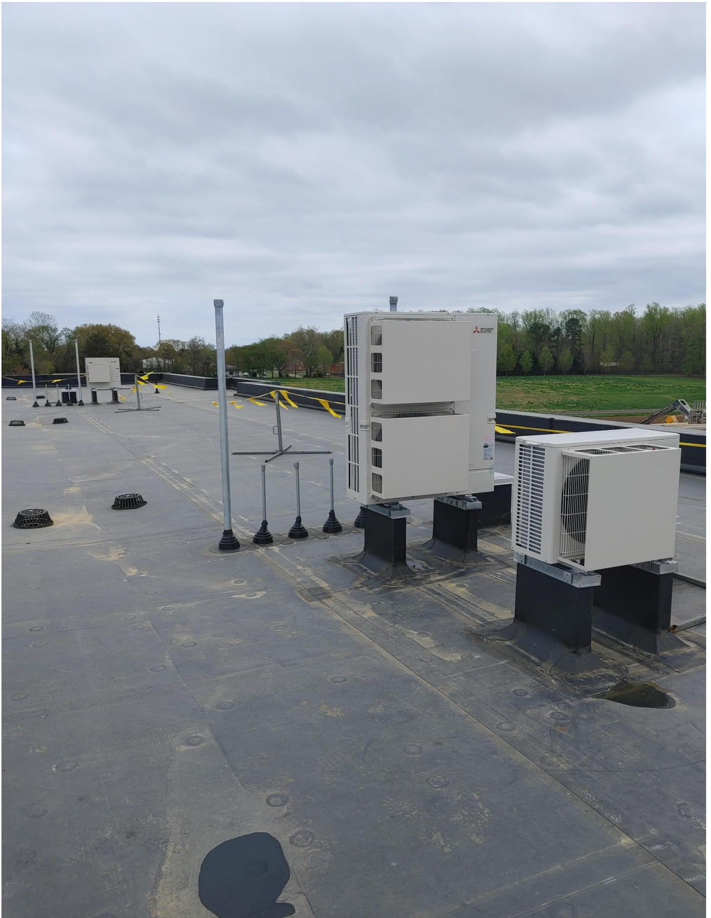
Photo 3 - HVAC Units set on the roof of Area A