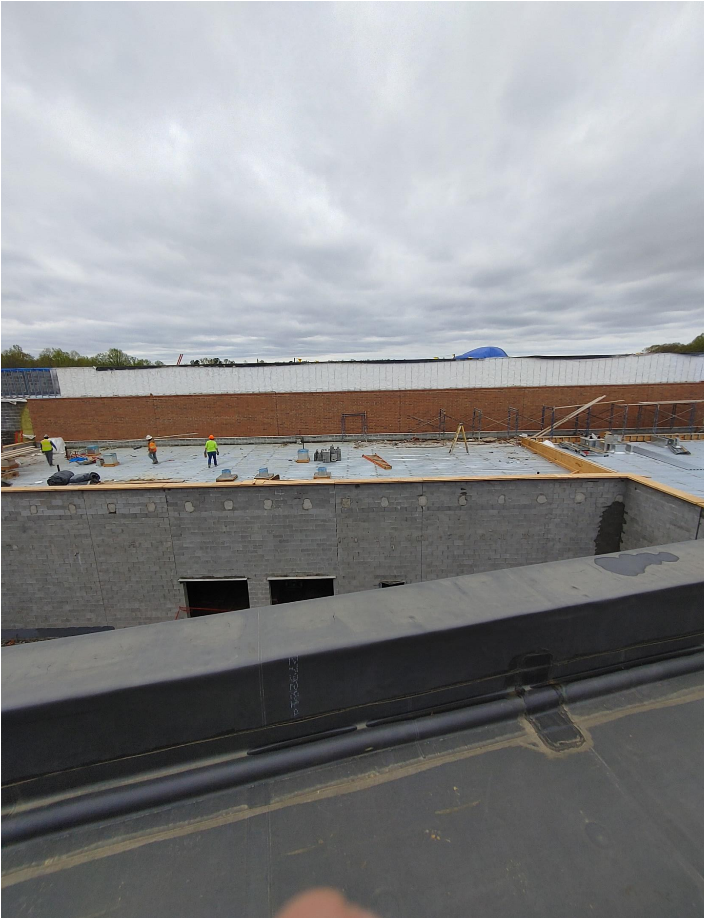
Photo 2 - Masons are breaking down Scaffolding on the low roof of Area A