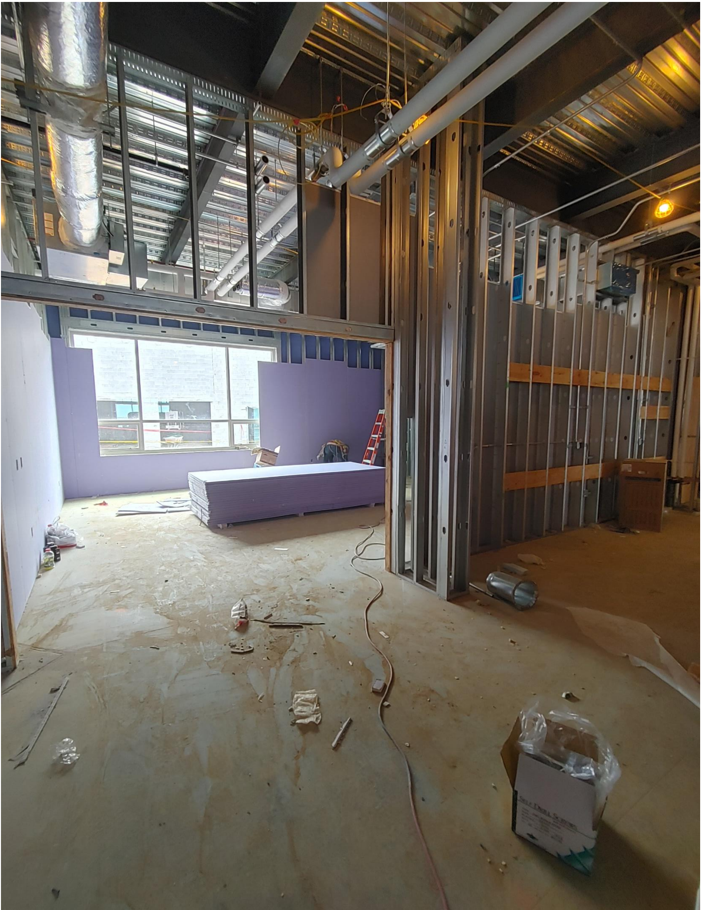
Photo 4 - Sheetrock being hung in Area A