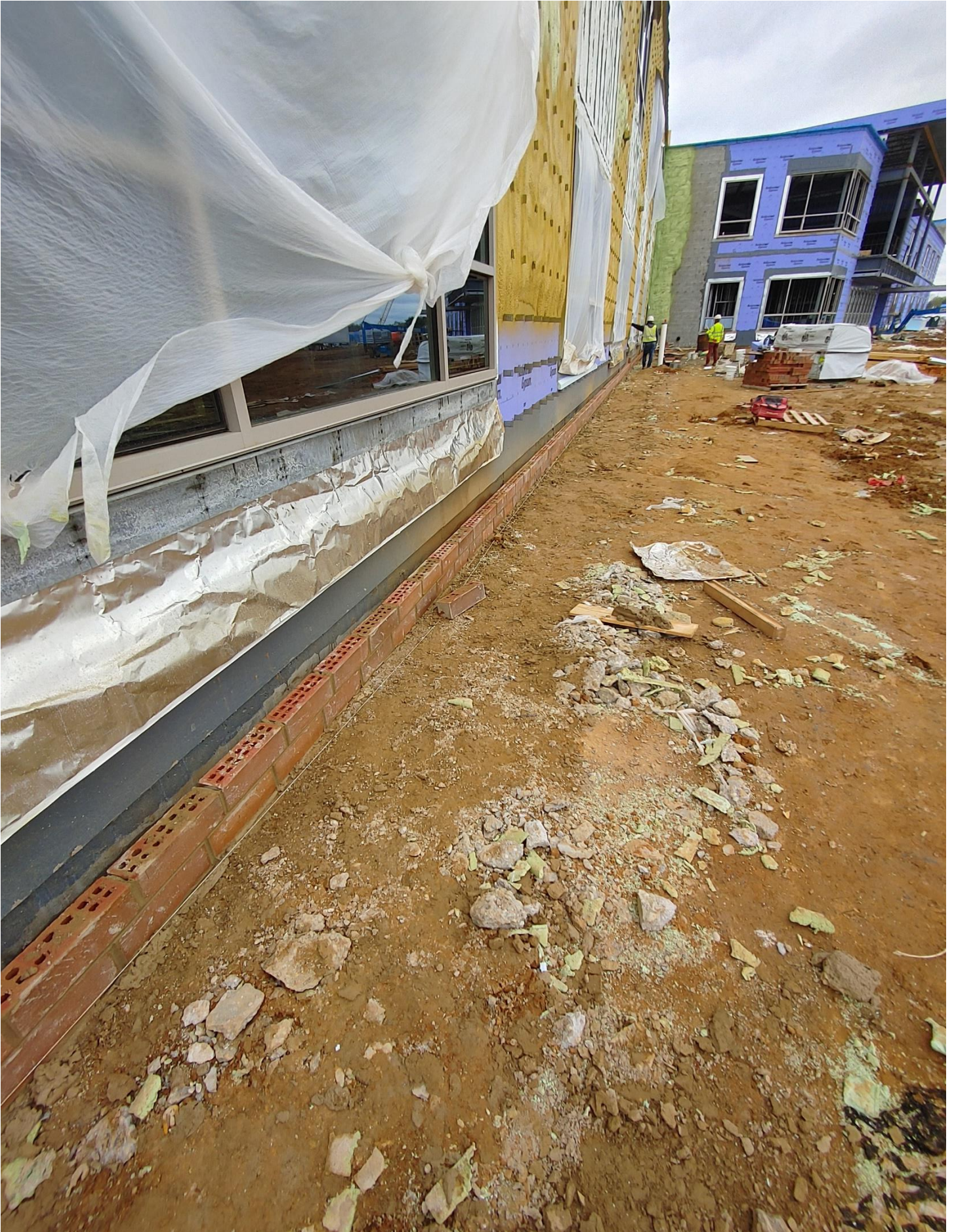
Photo 1 - Brick being laid on the Northside of Area A