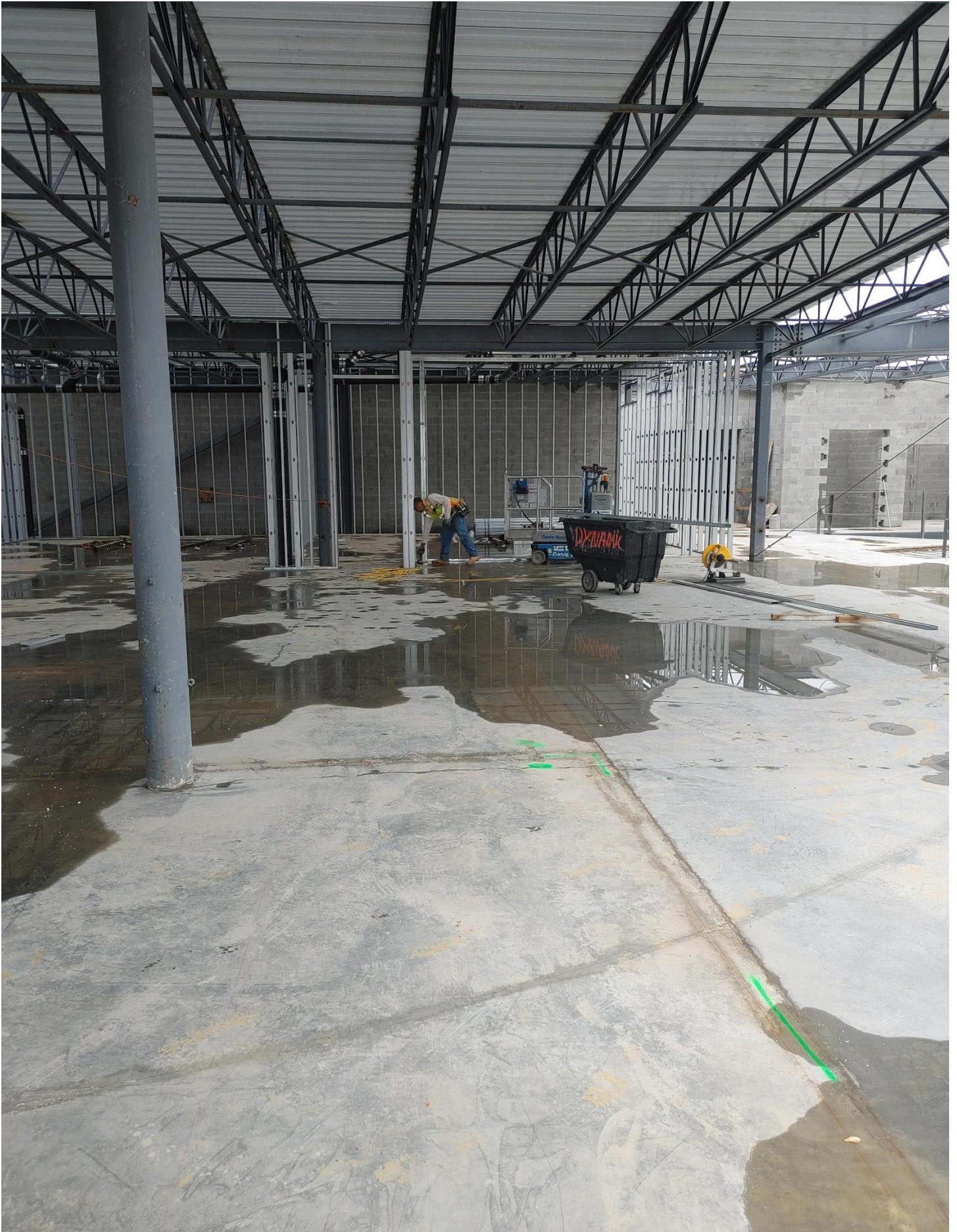
Photo 8 - Walls are being framed on the 2nd floor of Area A