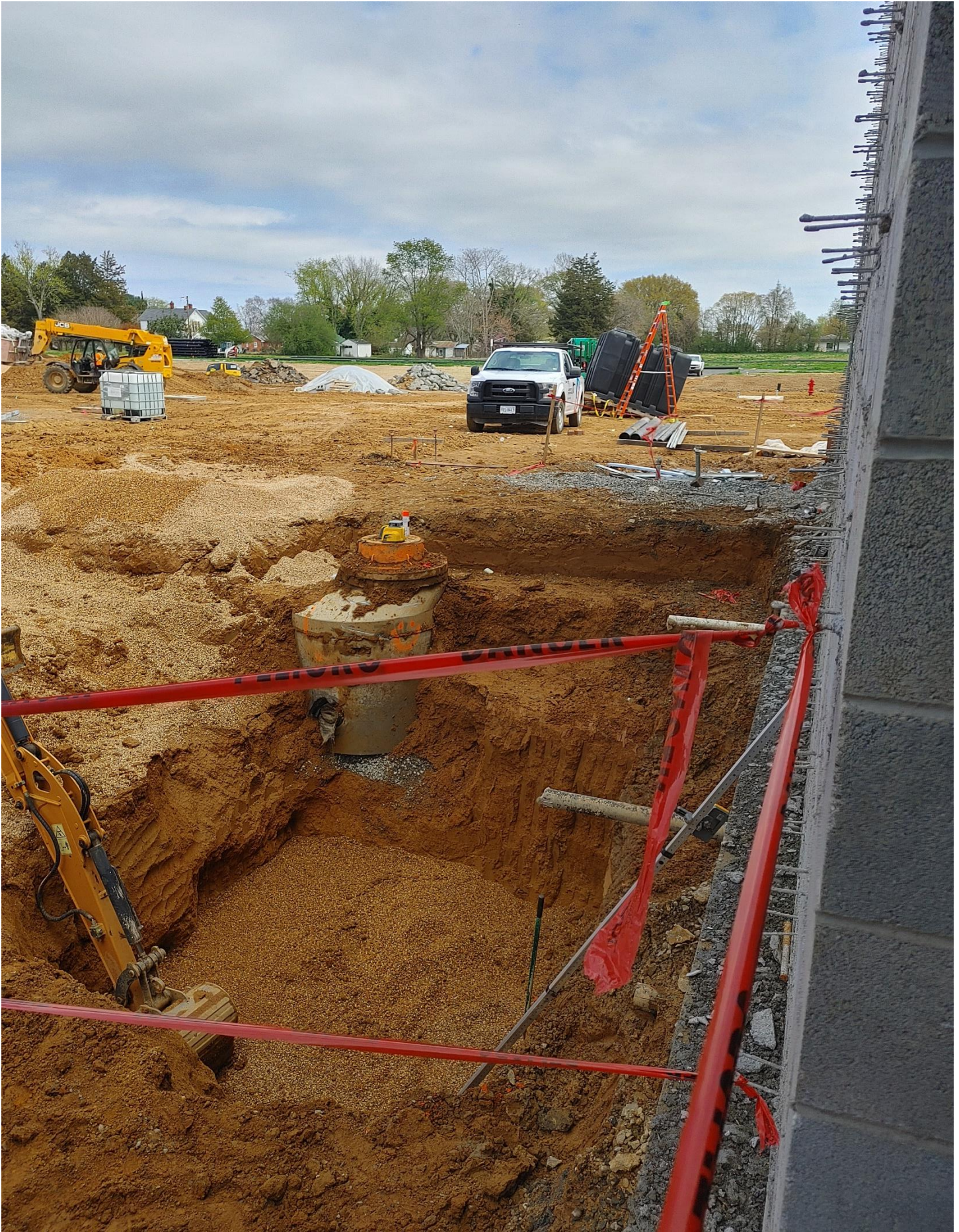
Photo 11 - Colonial is preparing to set the Grease Trap (in the back ground) into the pit on the Northside of Area D.