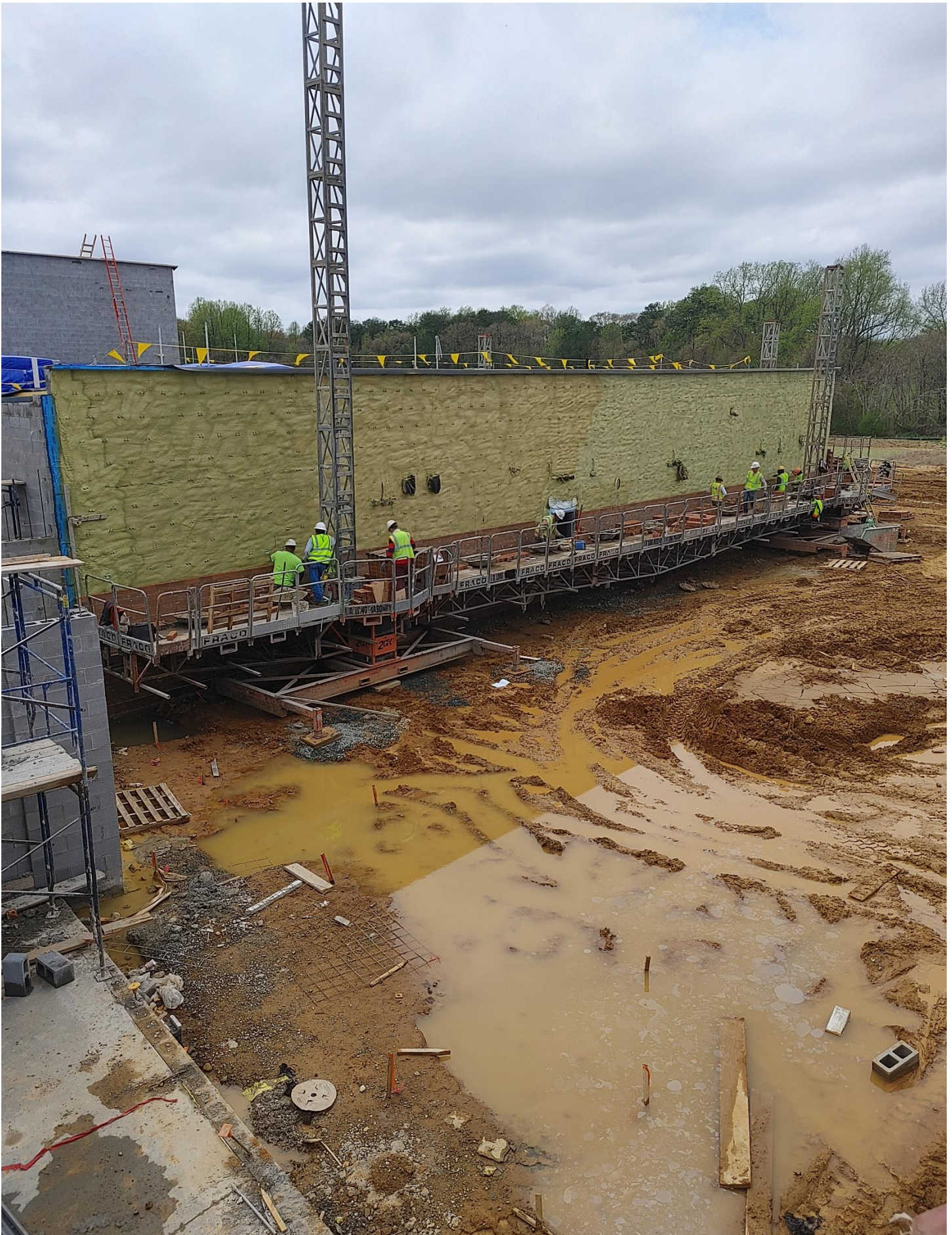
Photo 9 - Masons are laying Brick on the Northside of Area E