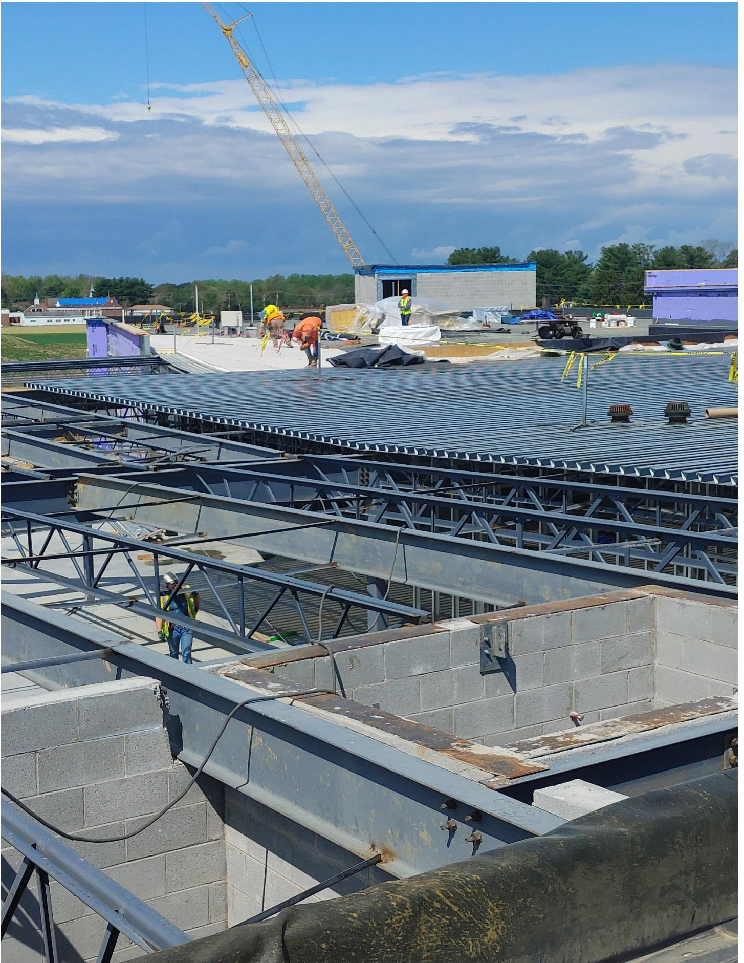
Photo 7 - Roofer continue to work on the roof of Area A