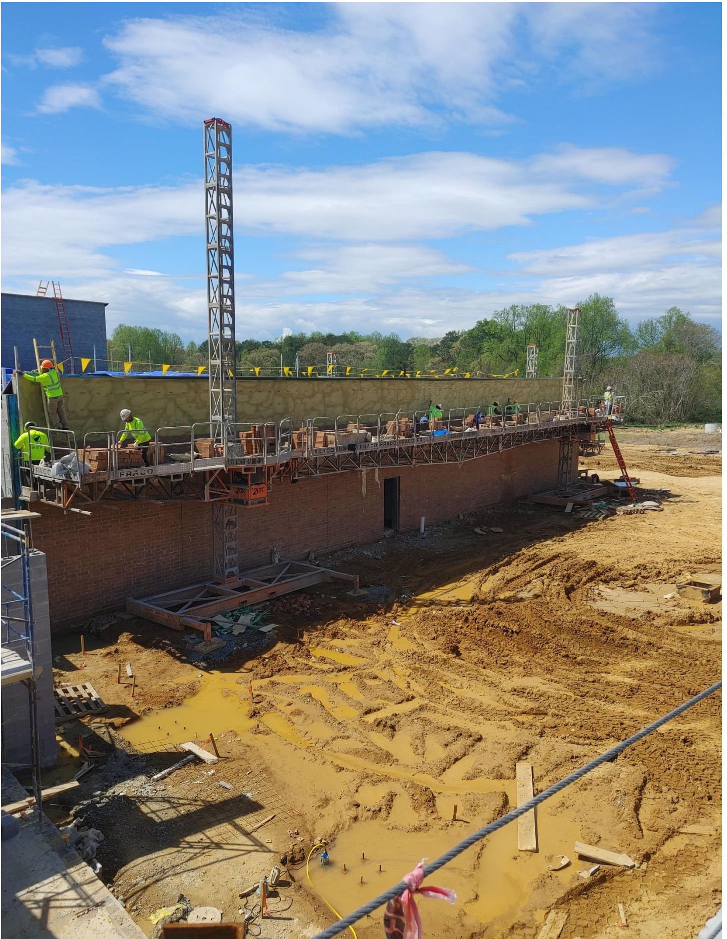
Photo 10 - Brick continues to be laid on the Northside of Area E