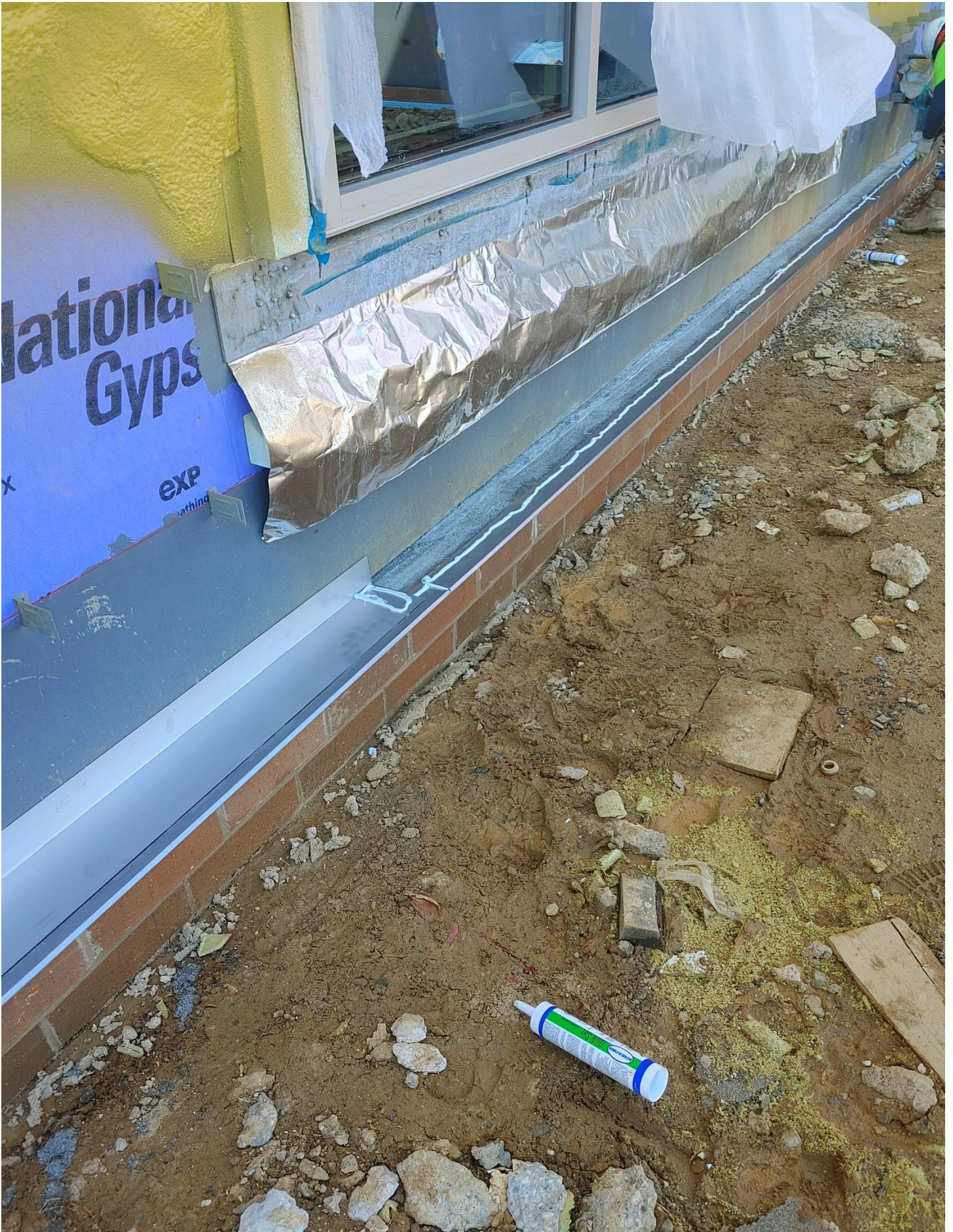
Photo 2 - Adhesive being applied prior to the second part of the flashing is installed on the Northside of Area A