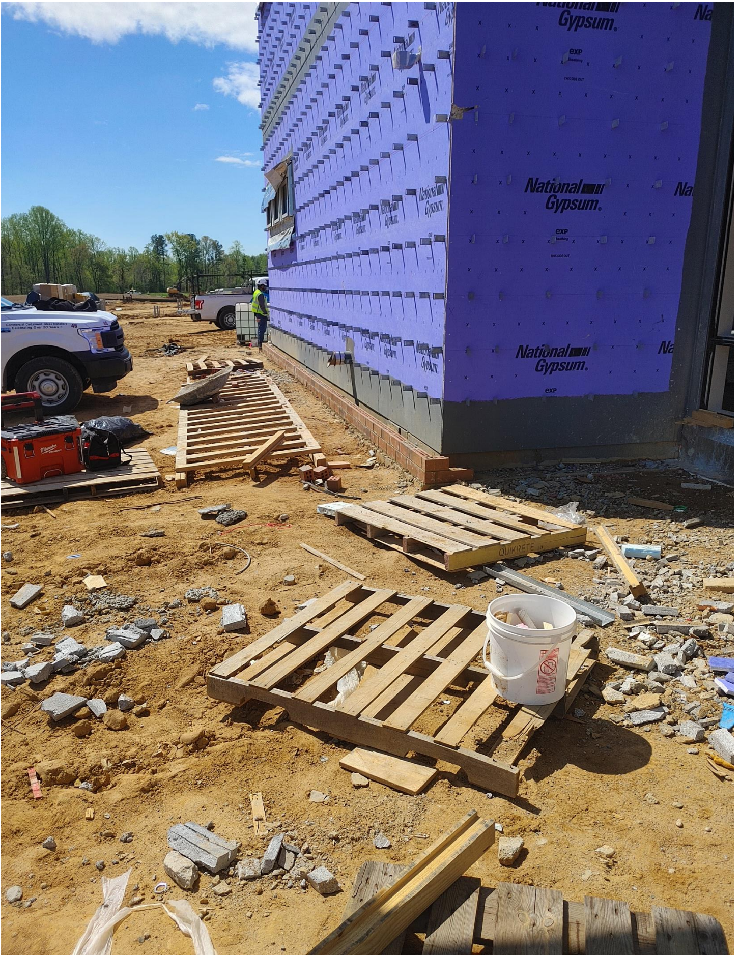
Photo 4 - Brick continues to be laid on the Eastside of Area A