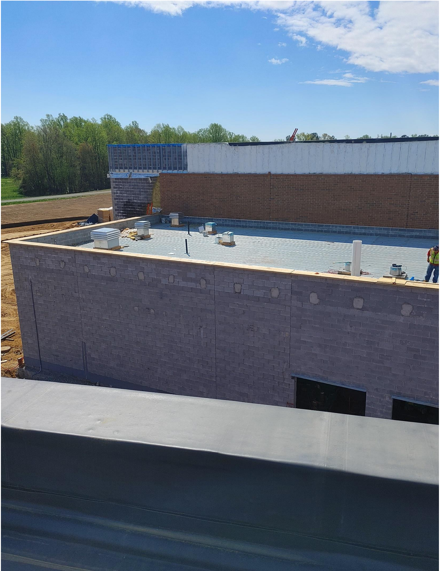
Photo 6 - Colonial Webb is setting Vent hoods and preparing to set rooftop units.