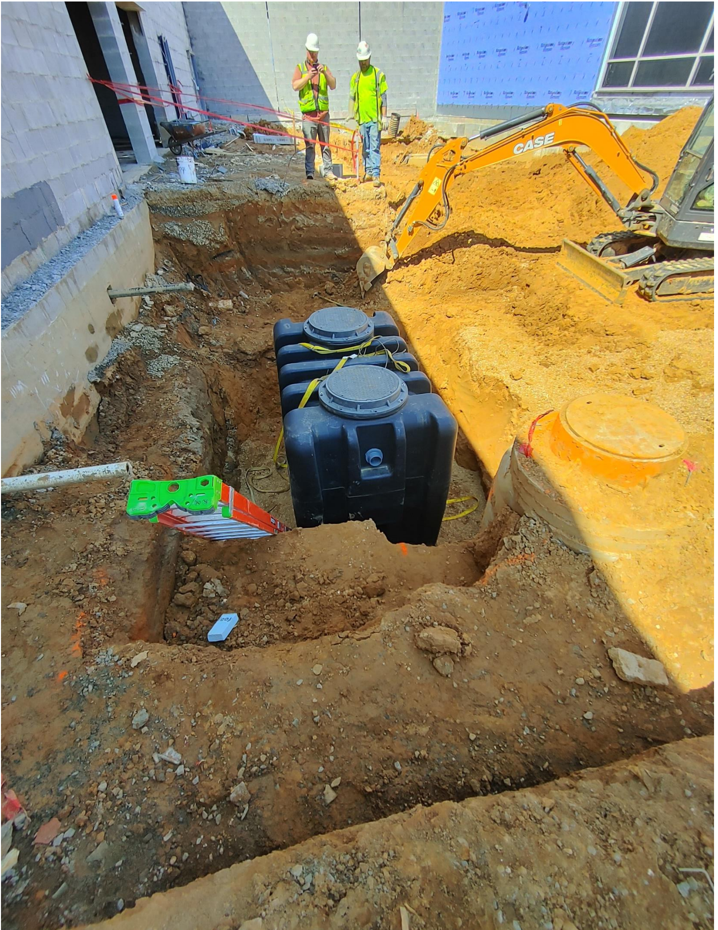
Photo 5 - Grease Trap has been set