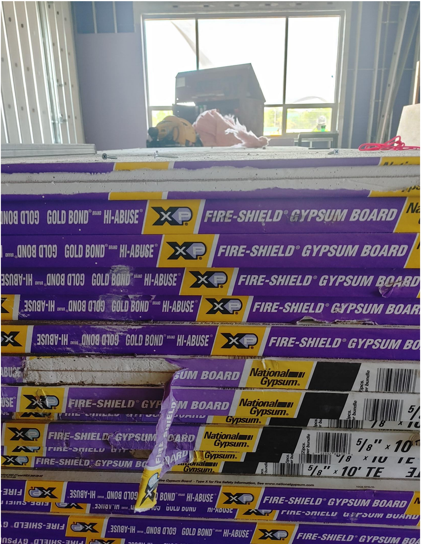
Photo 9 - Hi-Abuse Fire Shield Rock is being hung on the 1st floor of Area A