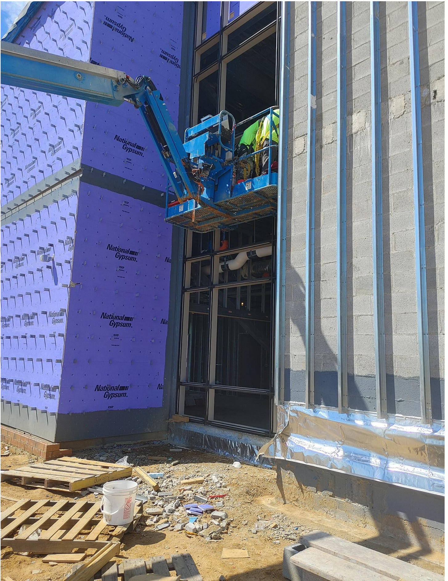
Photo 3 - Fredericksburg Mirror and Glass working on the Storefront on the Eastside of Area A