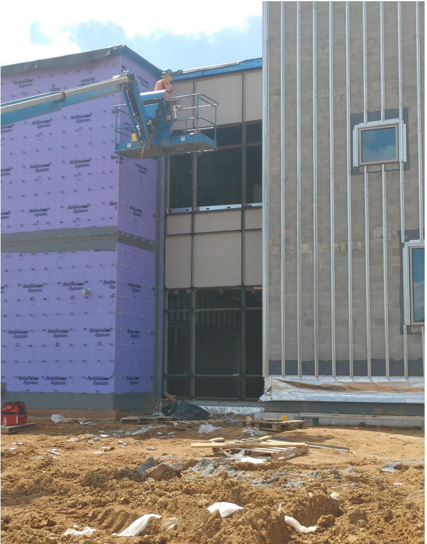
Photo 1 - Work continues on the Storefront located on the Eastside of Area A