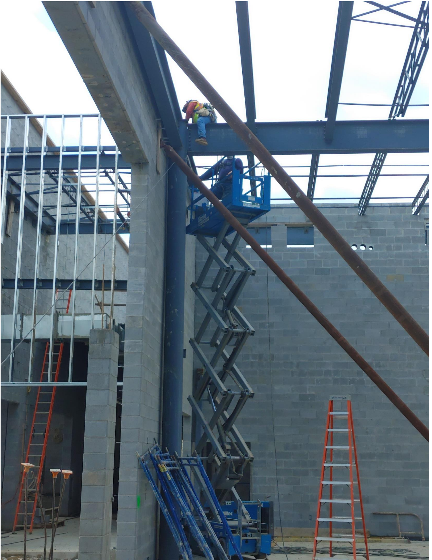
Photo 3 - Steel being welded in Area C