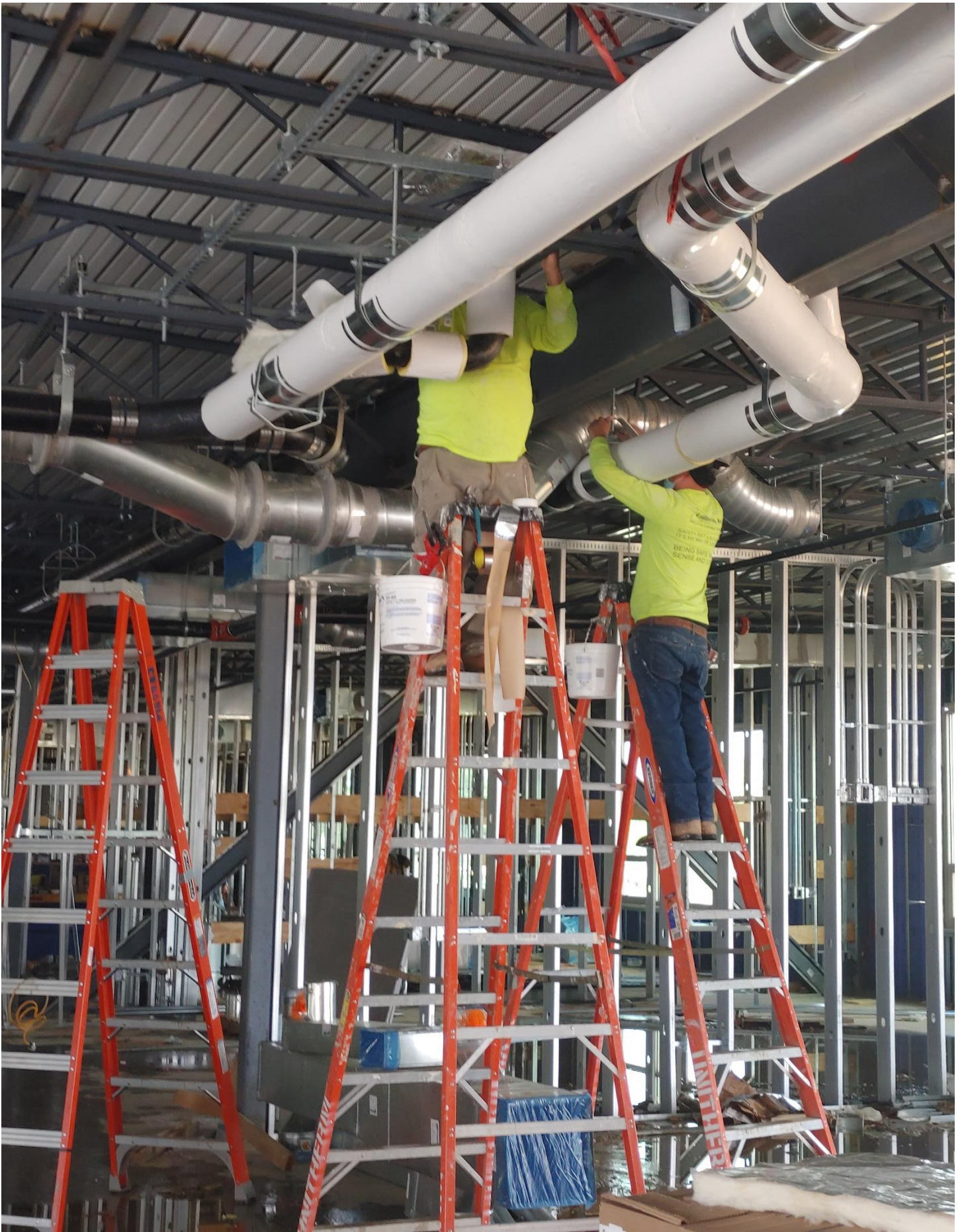
Photo 10 - Pipe being insulated in Area B