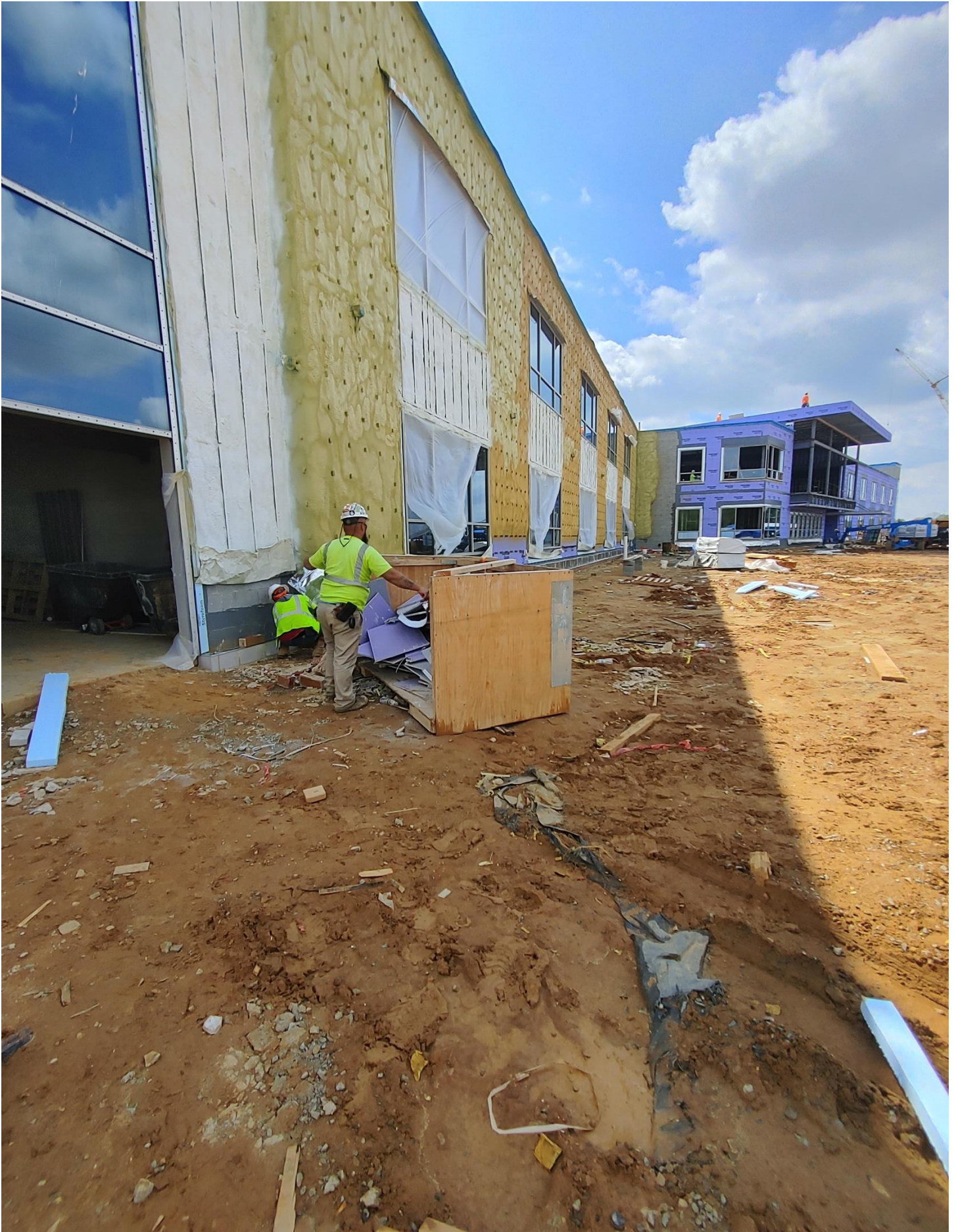
Photo 13 - Brick Flashing continues to be installed on the Northside of Area A