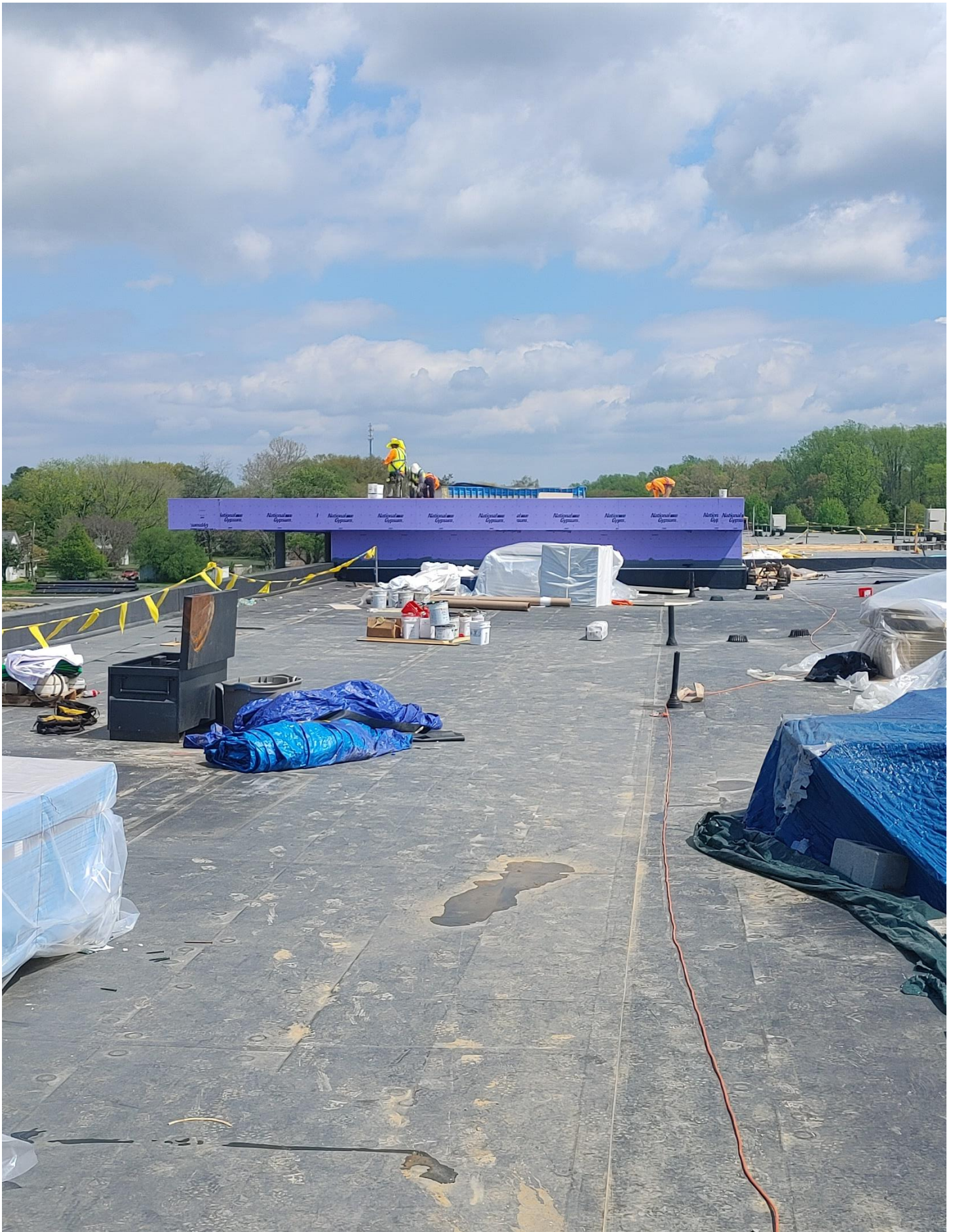
Photo 11 - Roofers working on the high roof of Area A