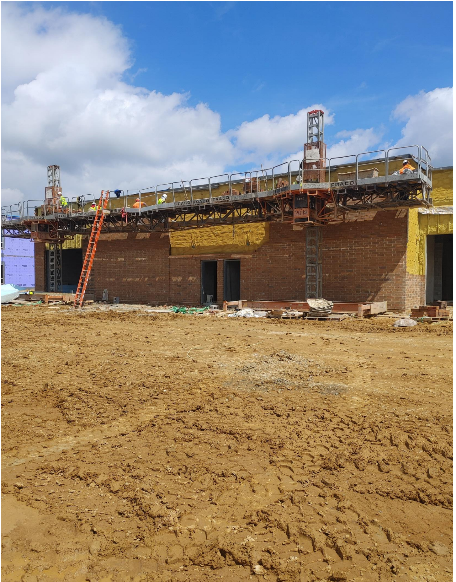
Photo 7 - Masons laying Brick on the Westside of Area E