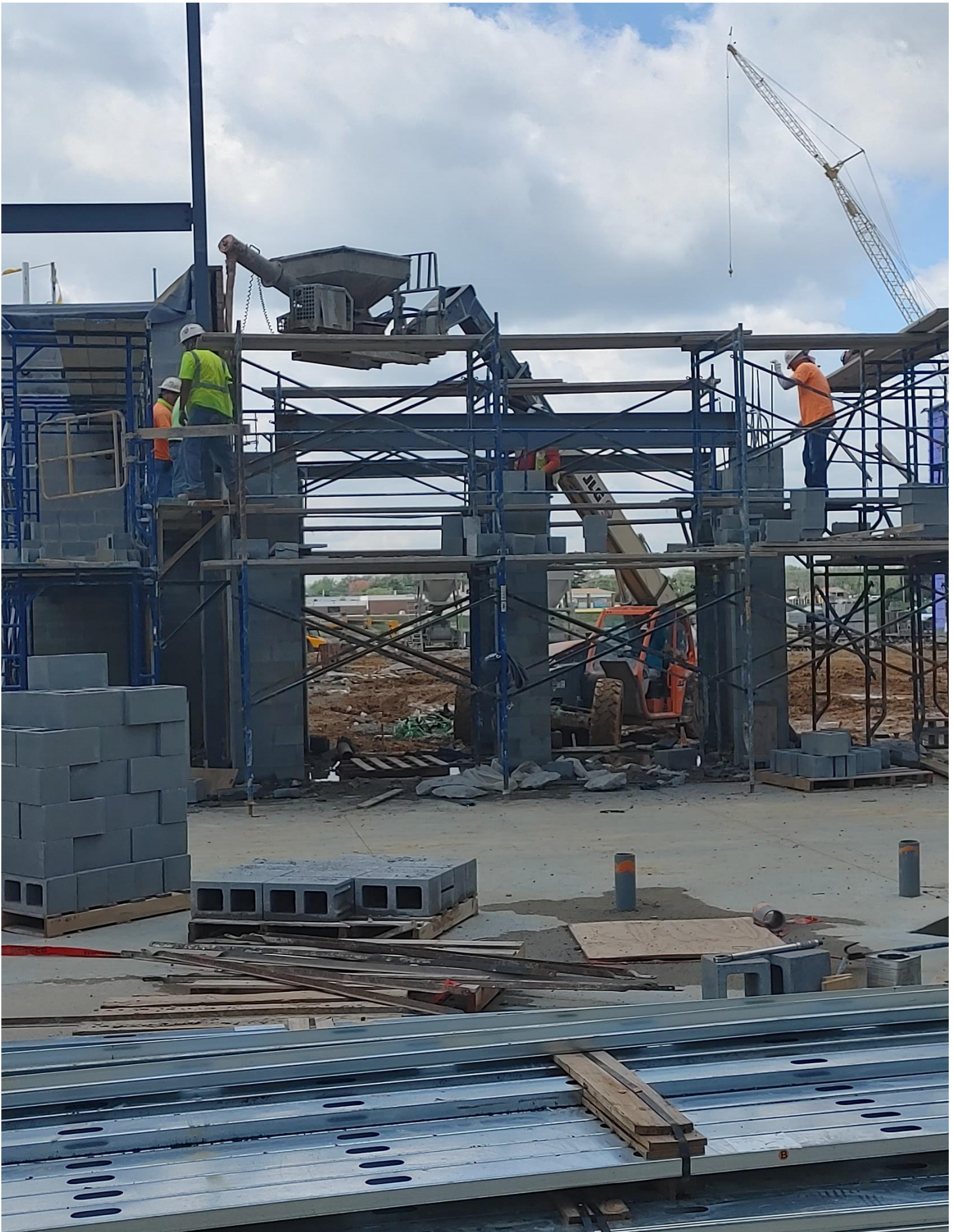
Photo 6 - Block being laid and Grouted in Vestibule C10