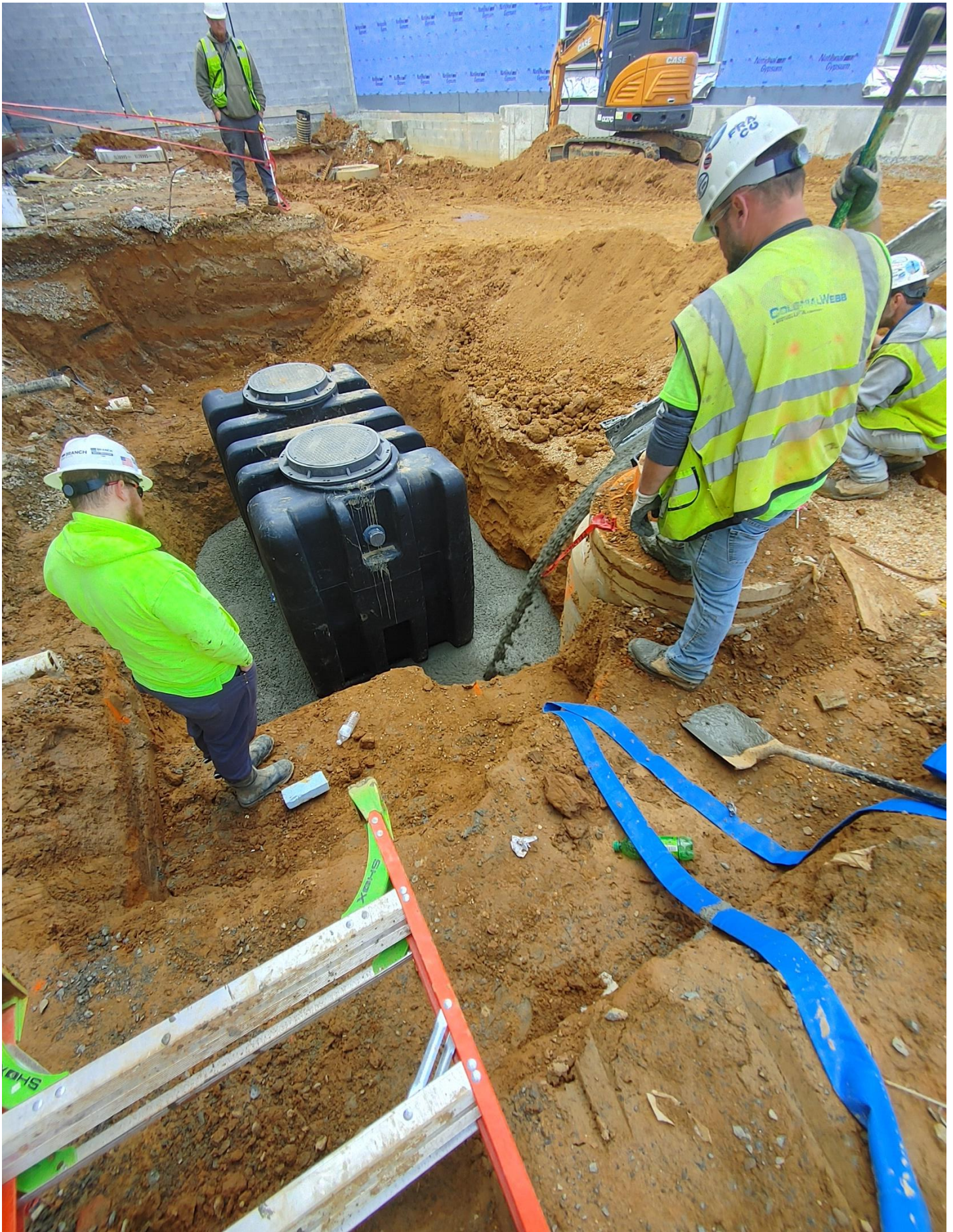
Photo 2 - Concrete being poured around Grease Trap