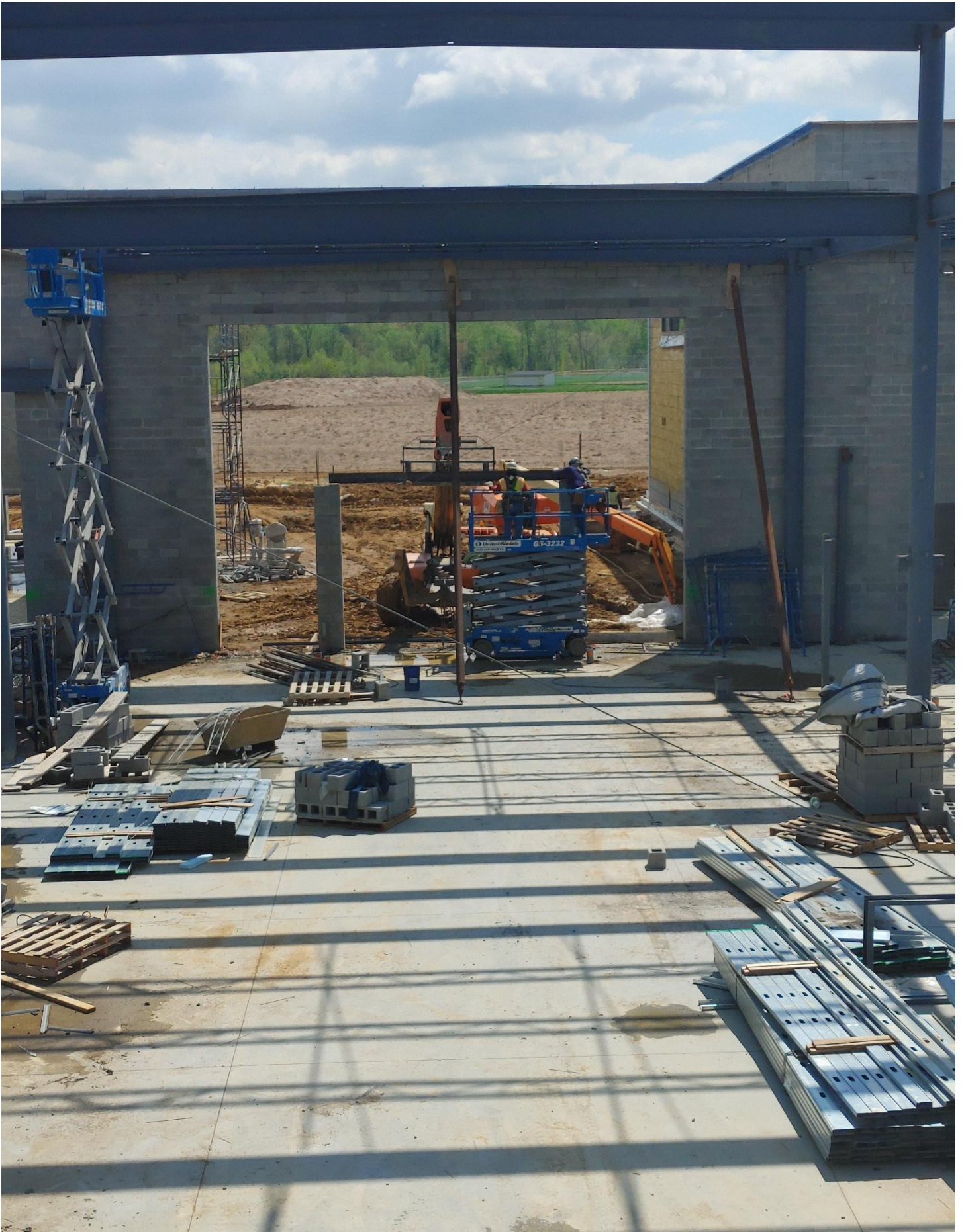
Photo 12 - Weldon Steel setting steel I-Beam in Area C