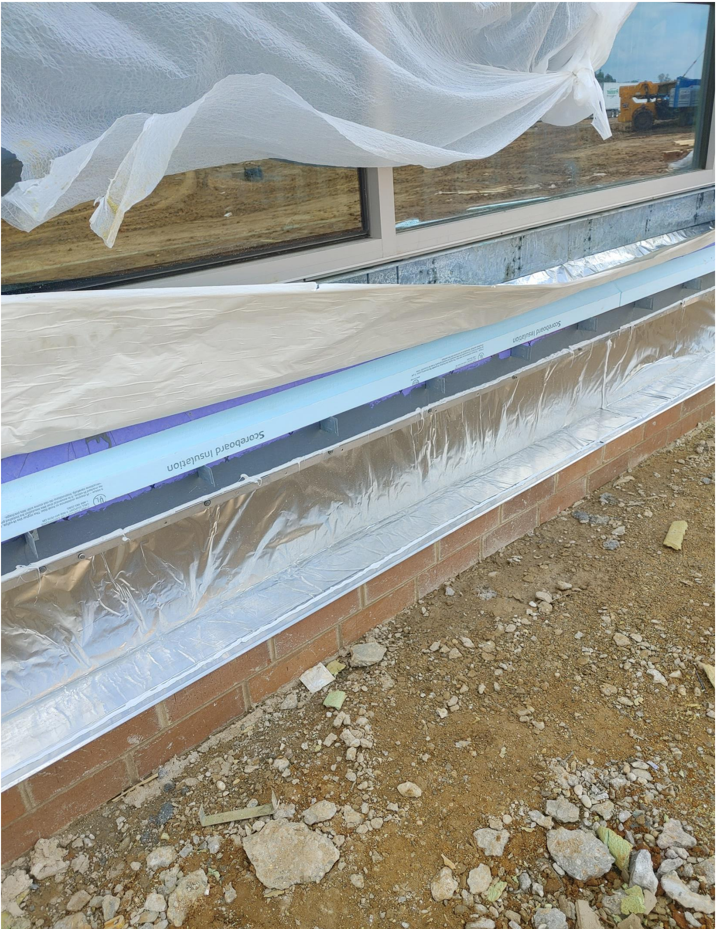
Photo 14 - Completed Brick Flashing on the Northside of Area A