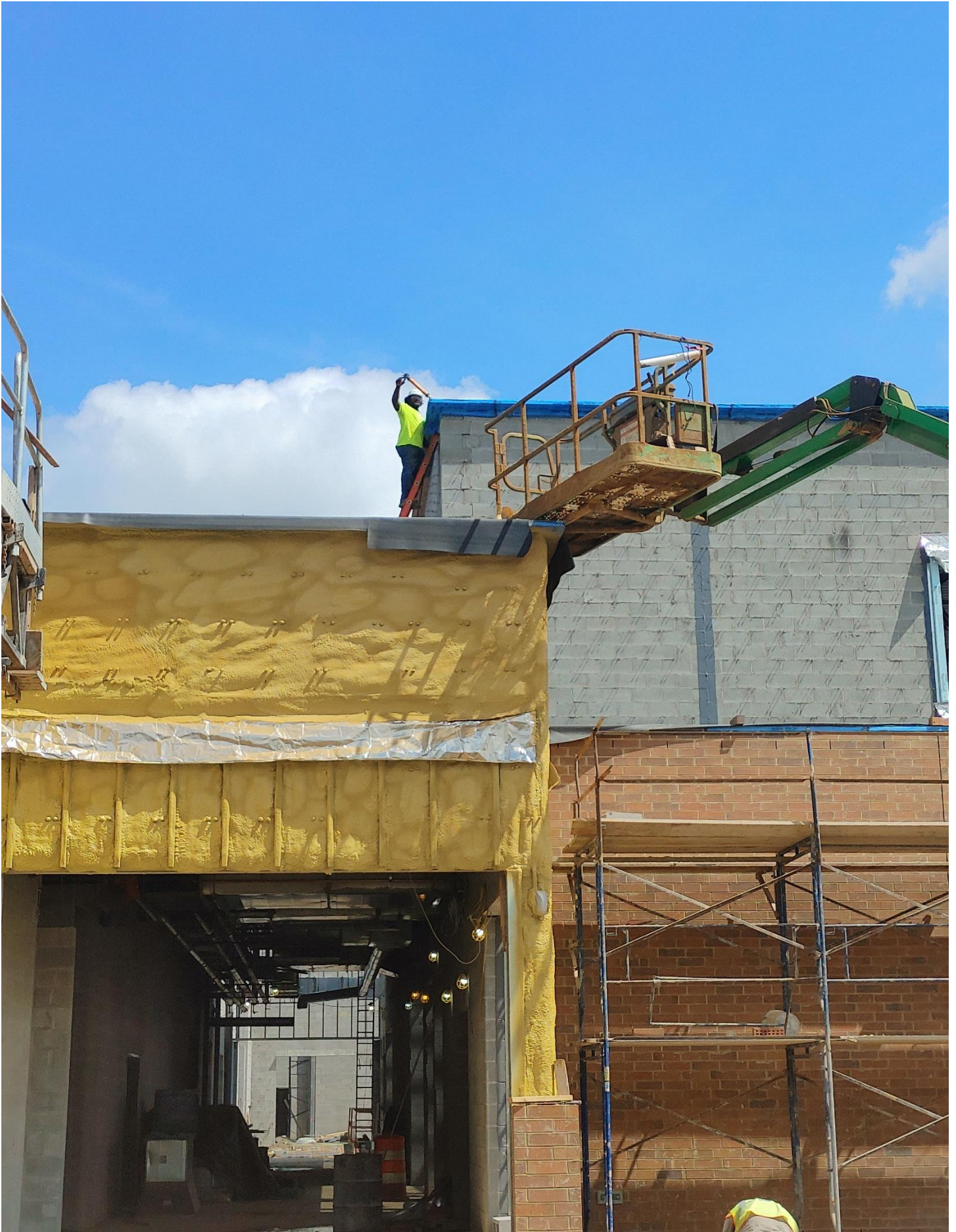
Photo 8 - High Roof Parapet Roof Cap being flashed and caulked Area E