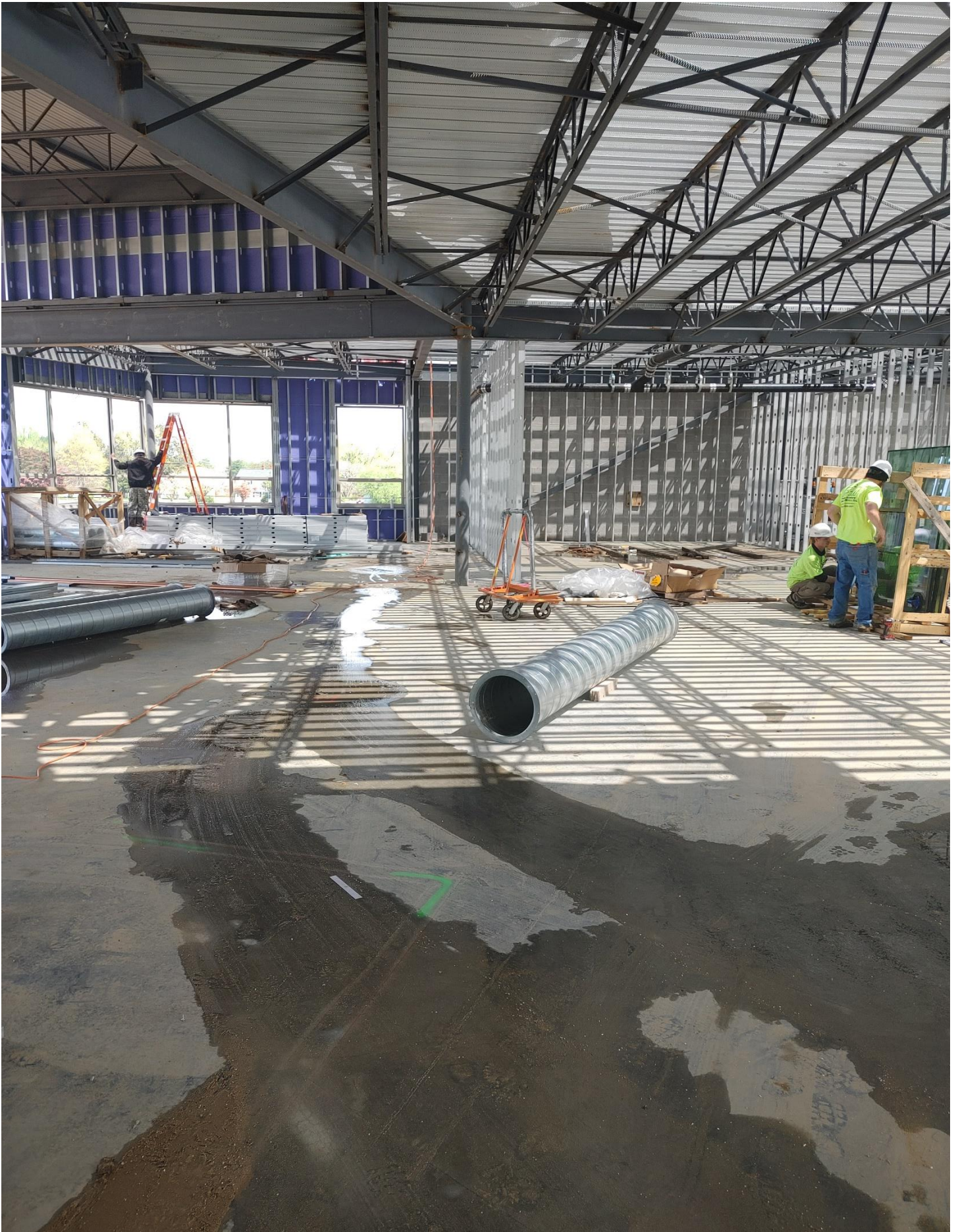
Photo 9 – Fredericksburg Glass & Mirror setting Glass on the 2 nd floor of Area A