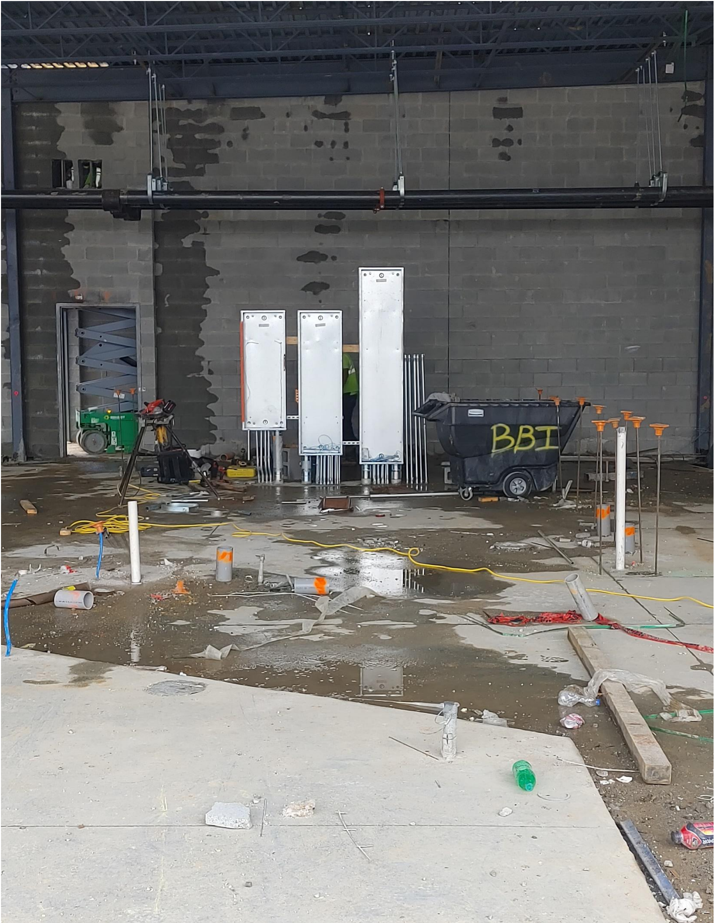
Photo 5 - Hazzard Electric setting Panel Boxes in the Kitchen Area