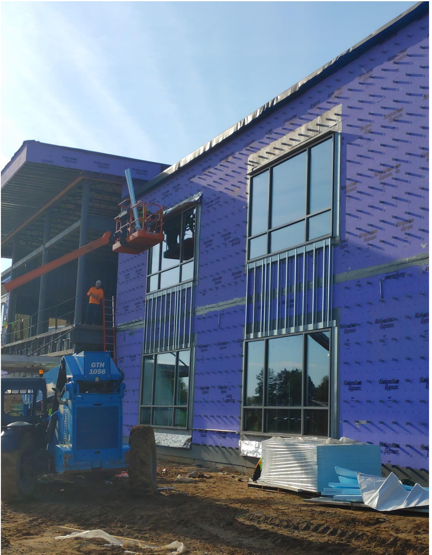
Photo 5 - Windows are being flashed on the Northside of Area B