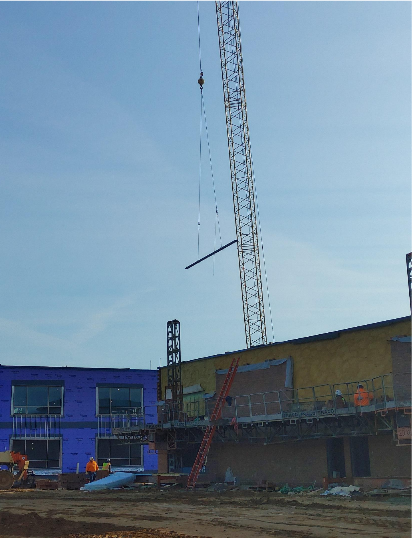
Photo 3 - Weldon Steel setting steel in Area C