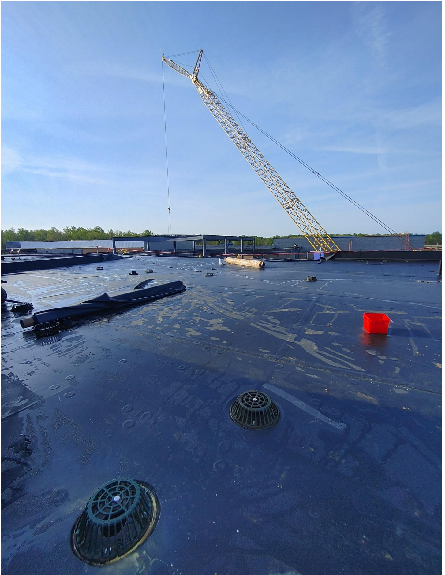
Photo 8 – The Roofers are making progress on the roof from of Area B to Area A.