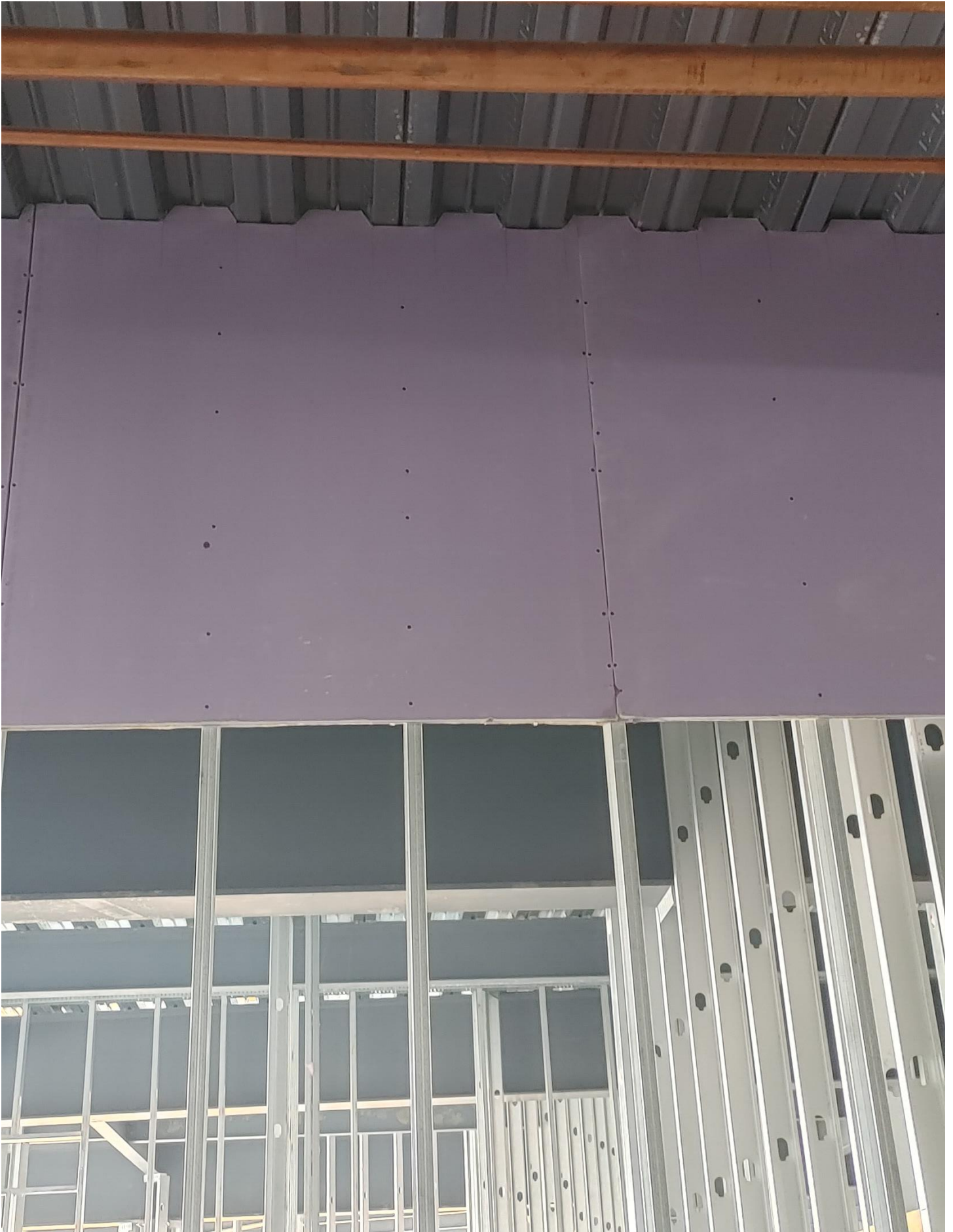
Photo 7 - Sheetrock is being hung up to the Metal Decking in Area A, 1st floor.