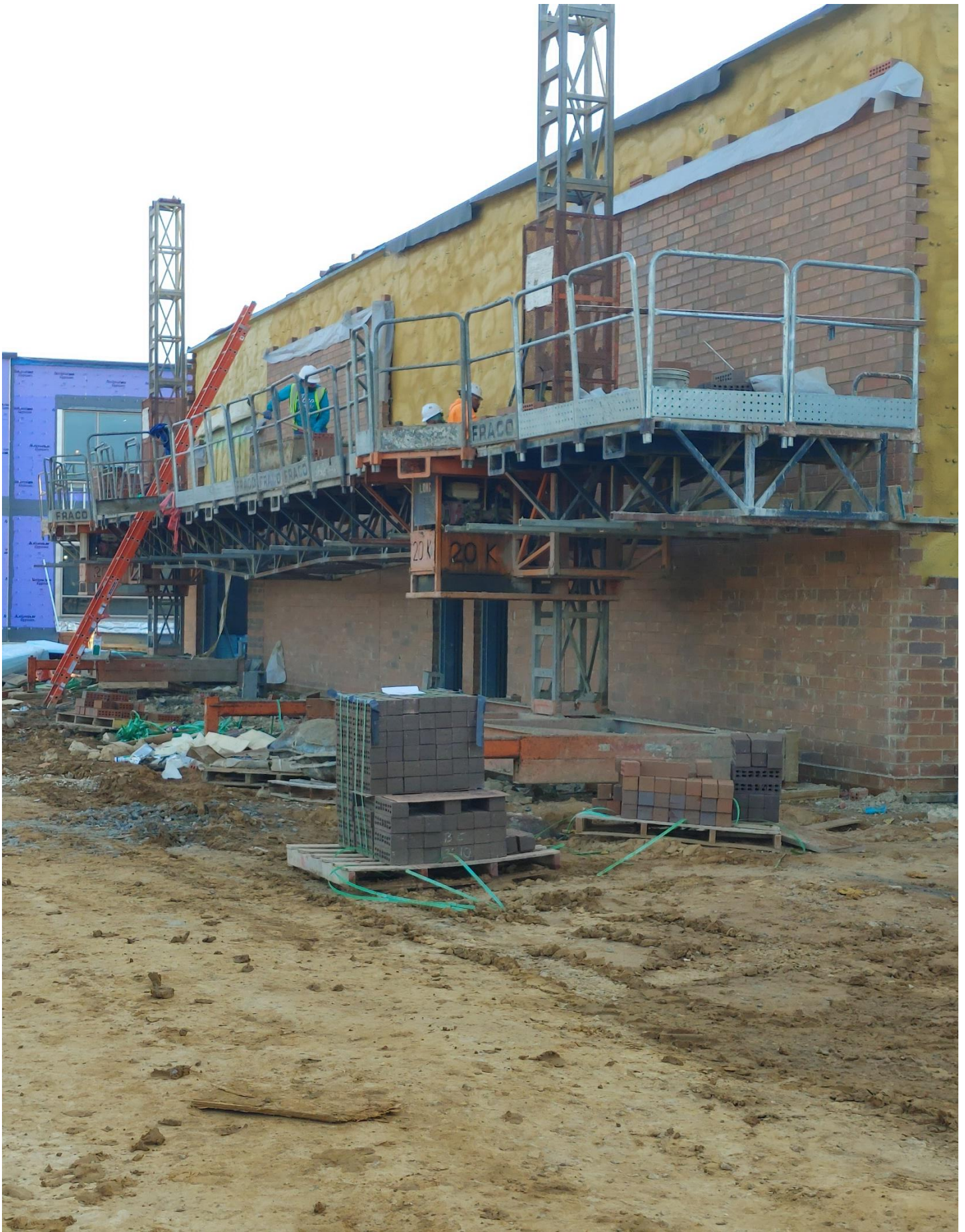
Photo 4 - Masons laying brick on the Westside of Area E