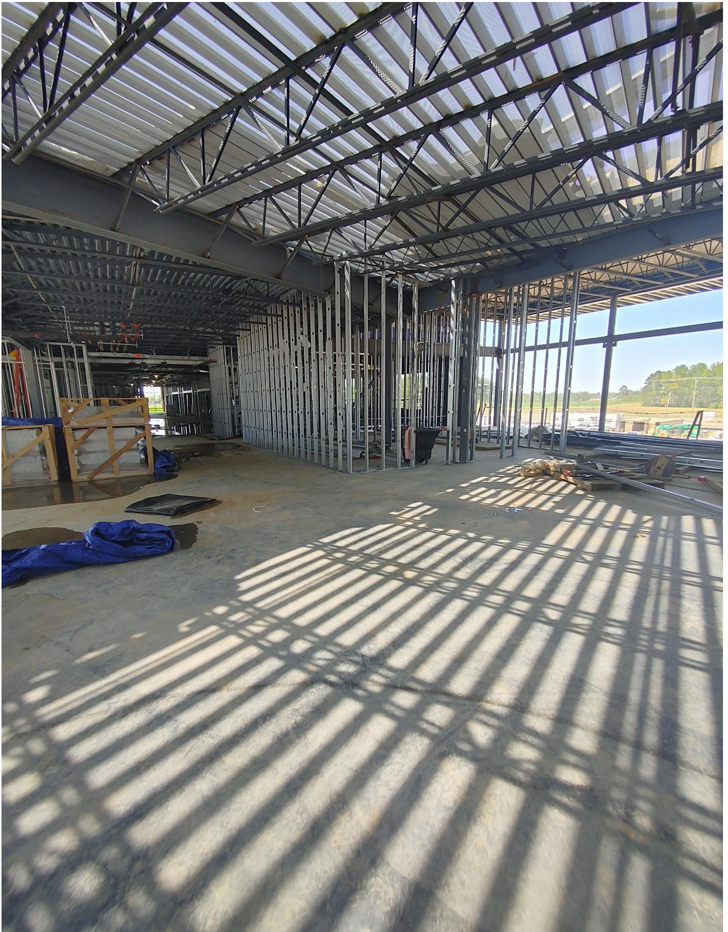
Photo 7 - Interior walls being framed on the 2nd Floor or Area A