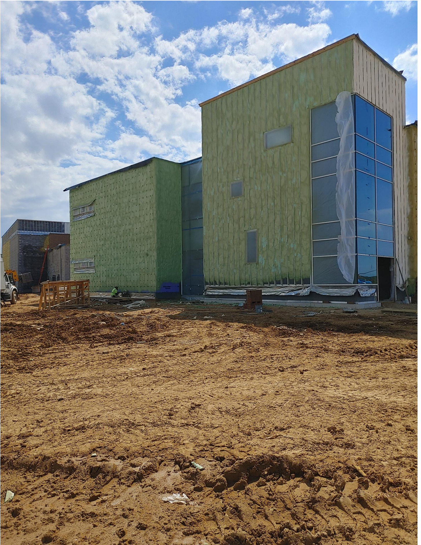
Photo 2 - The East side of Area A has been foamed.