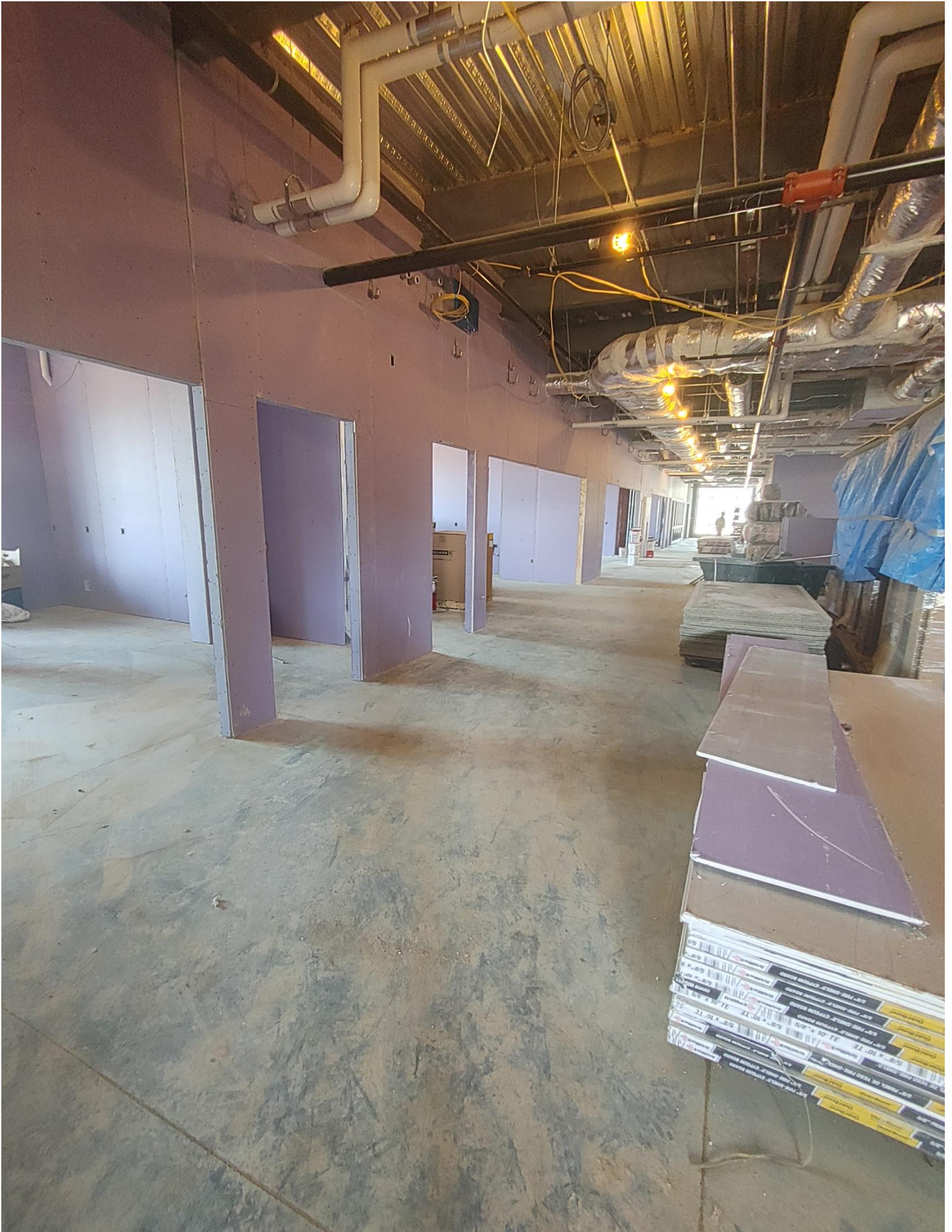
Photo 6 - Walls have been insulated and now are being sheet rocked on both sides in Area A, 1st floor.