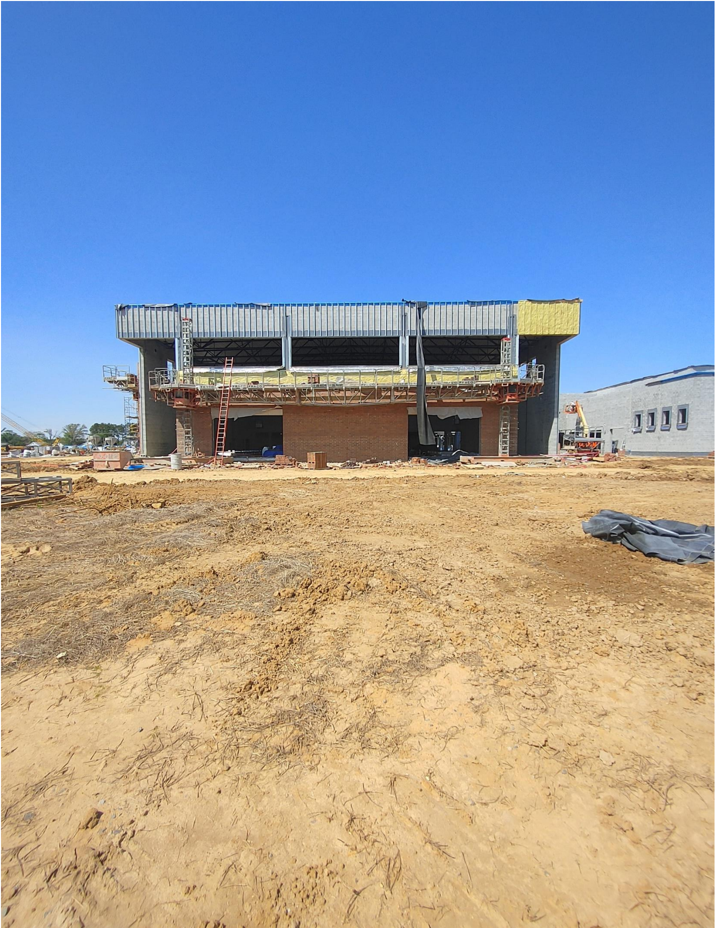
Photo 3 - The Masons are bringing up the brick on the South side of the Gym