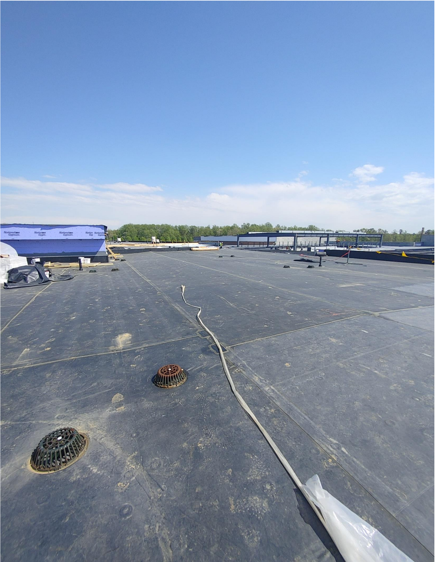
Photo 8 - Roofers are making progress on the Roof of Area A