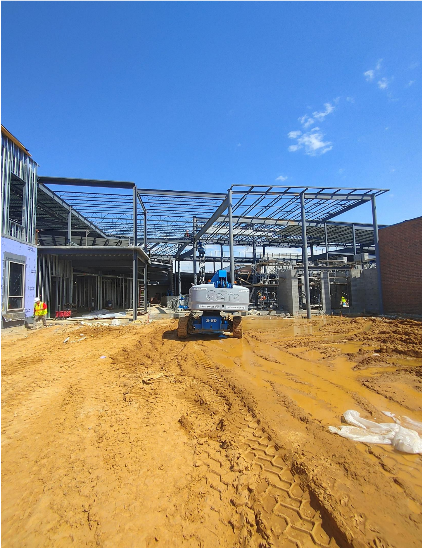
Photo 4 - Steel continues to be set in Area C