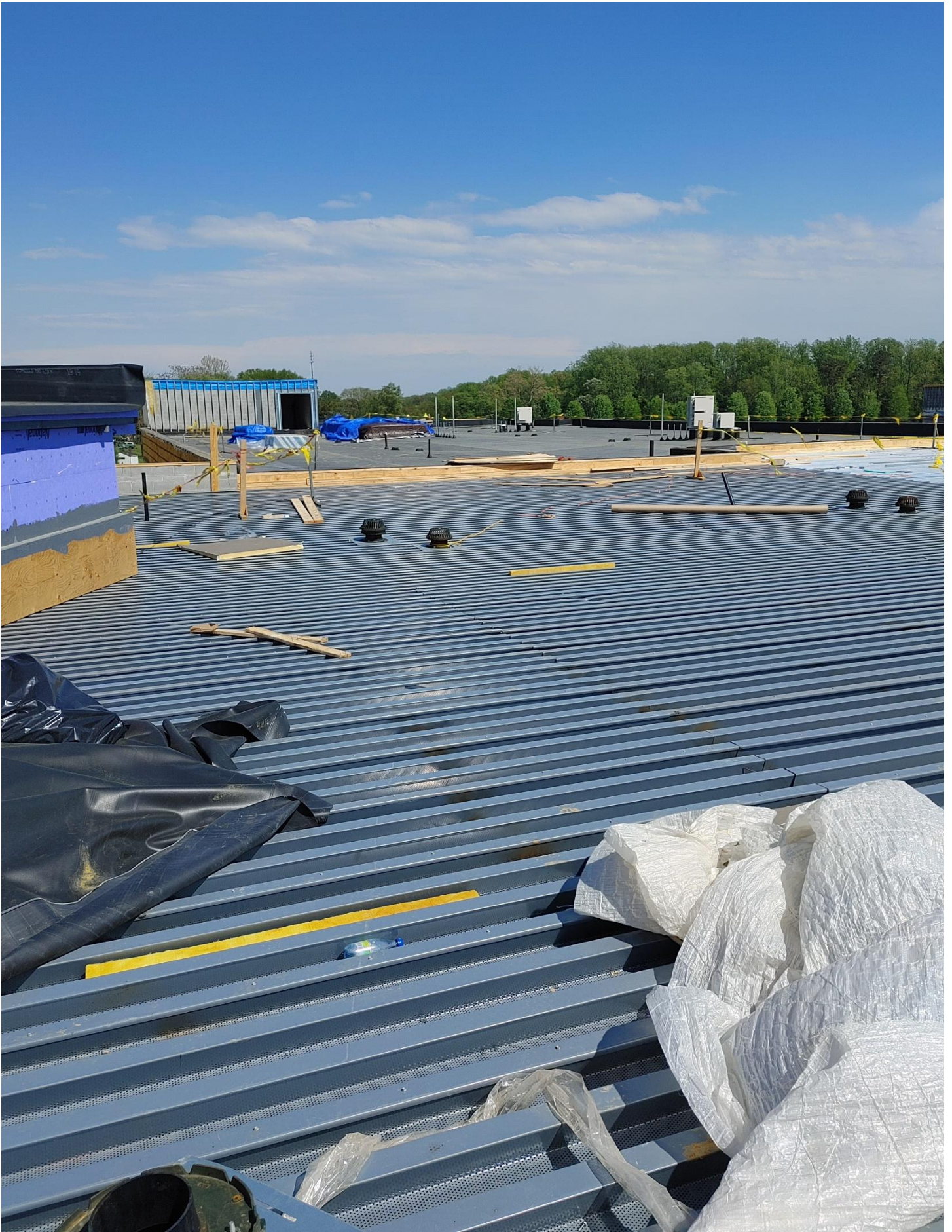
Photo 9 - Parapet Wall being framed in Area A