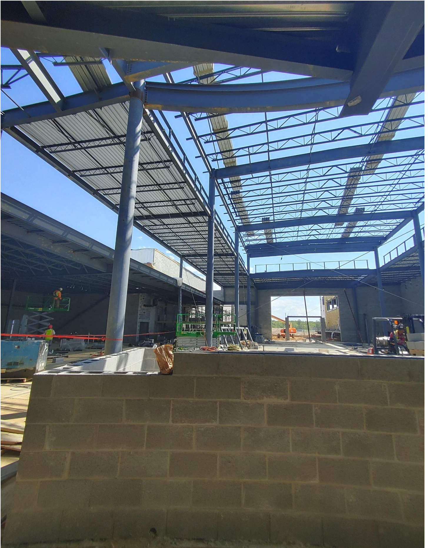
Photo 5 - Metal Decking is being laid in Area C