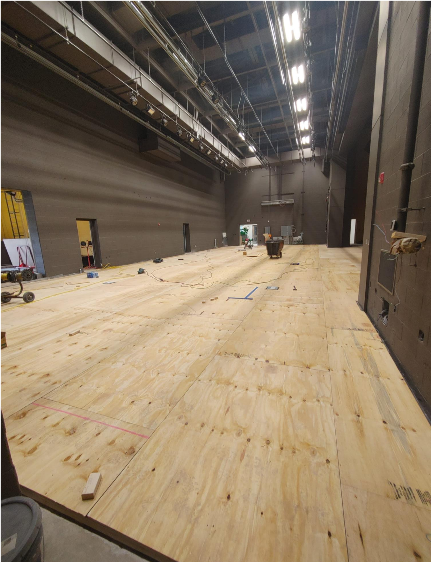
Photo 12 - Sub Floor has been laid in the Stage Area of the Auditorium.