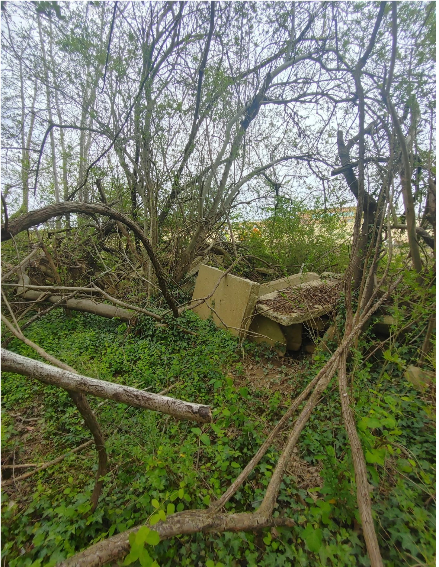
Photo 10 - Another view of the concrete that is piled up.