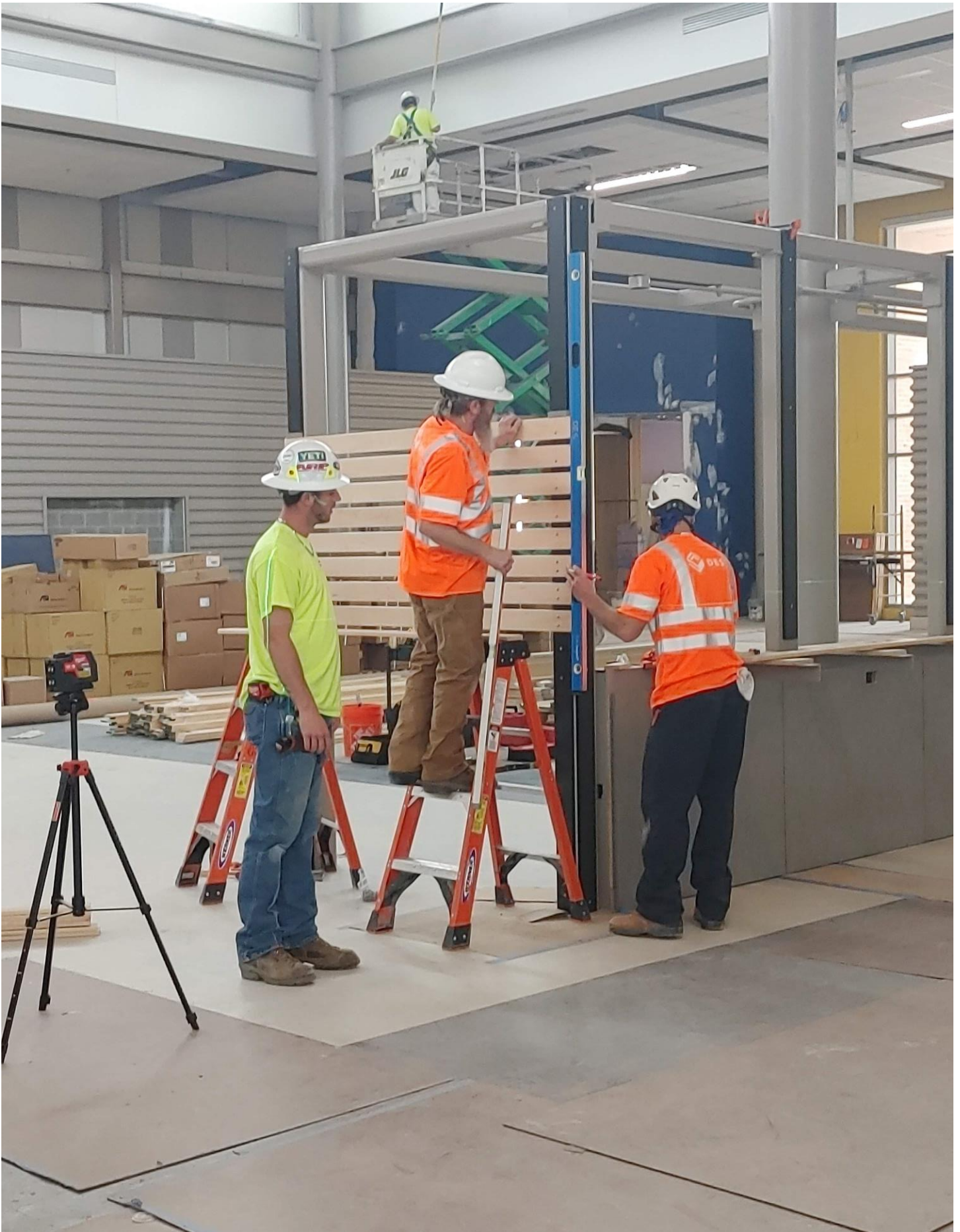
Photo 5 - Wood Slats are being installed in the Student Commons Area - Area C