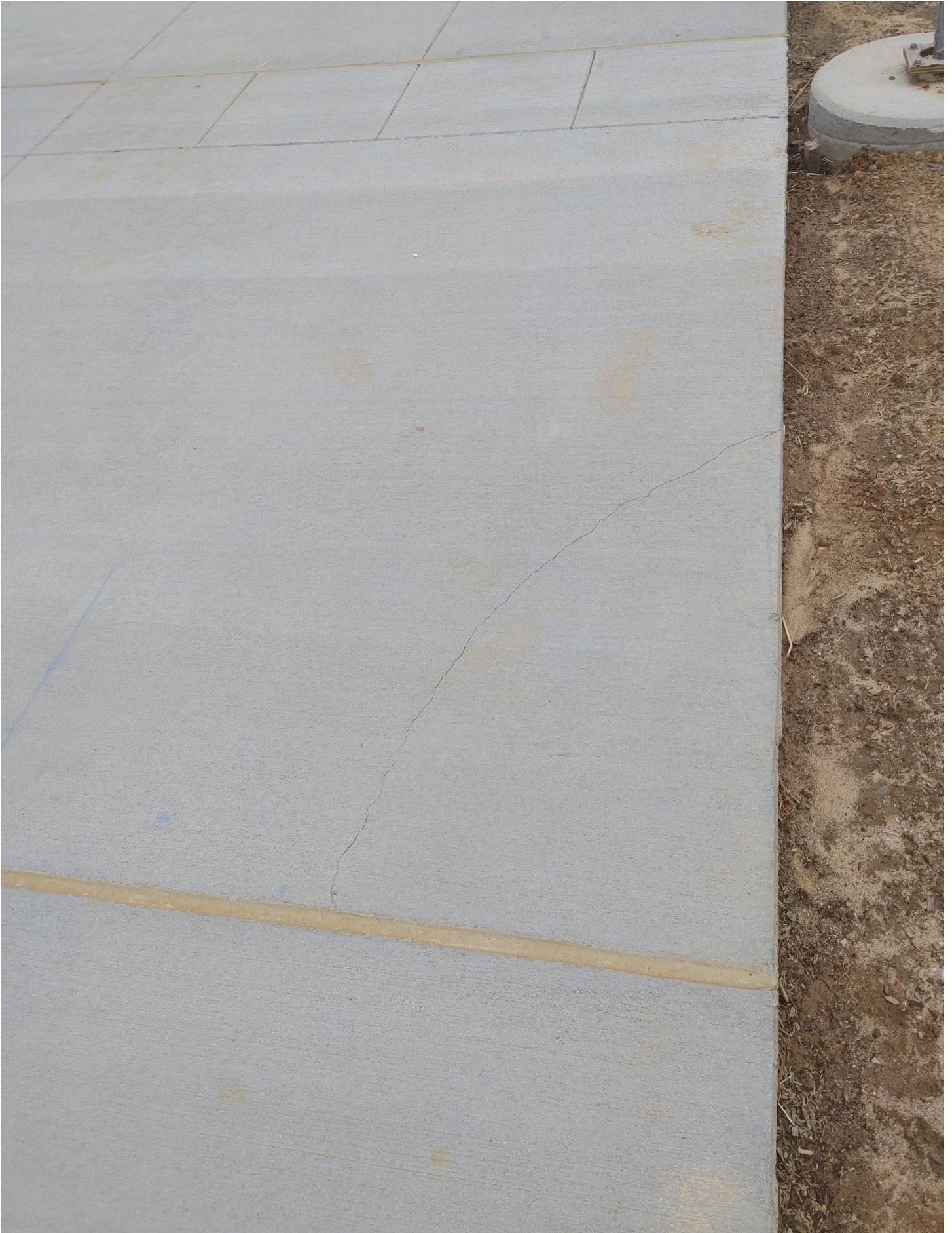
Photo 11 - Concrete is cracked on Student Entranceway from Bus Loop.