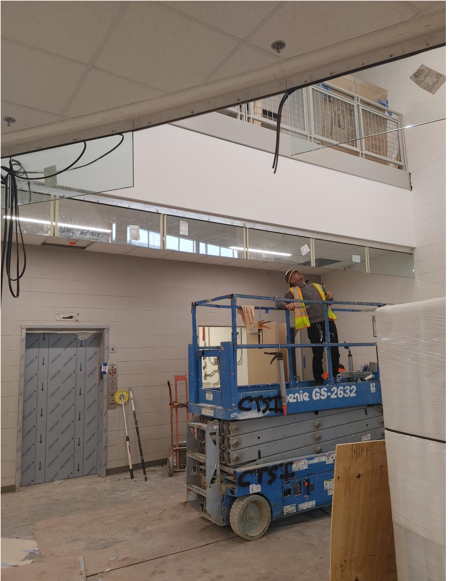
Photo 7 - Curtain Wall Glass is being installed in Area C