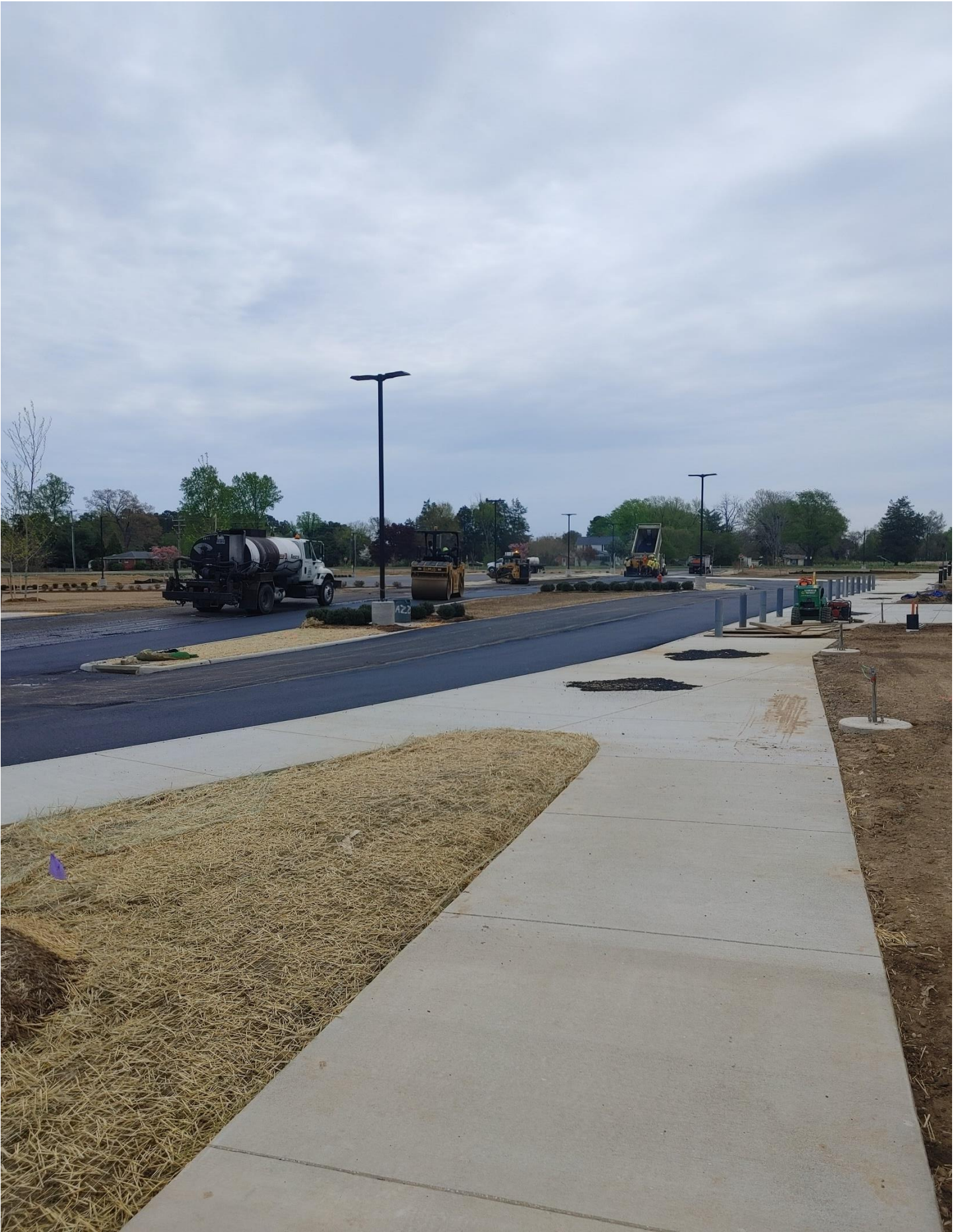
Photo 13 - Asphalt continues to be laid in the front of the School.