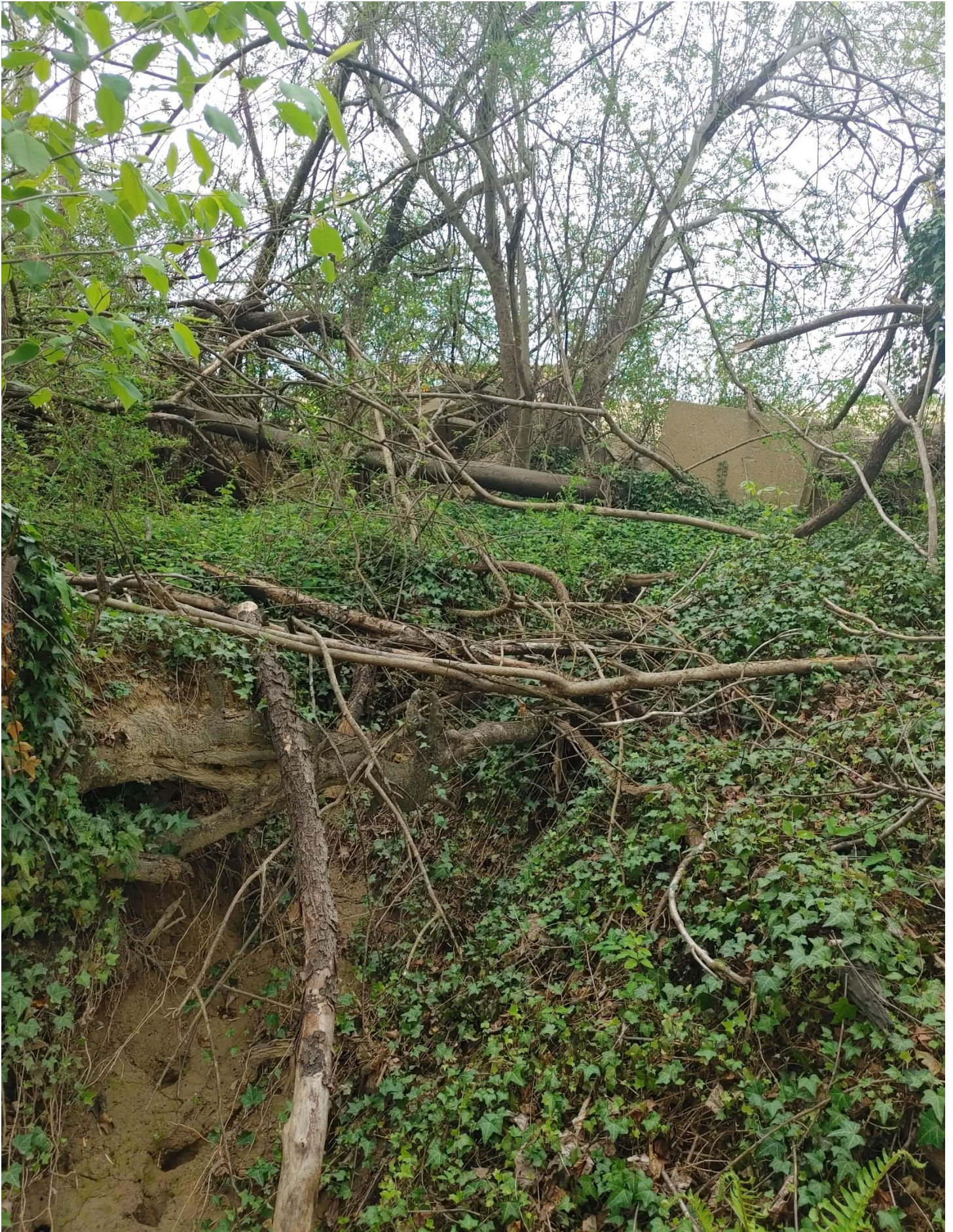
Photo 8 - Concrete blocking Spillway on Farmers Property