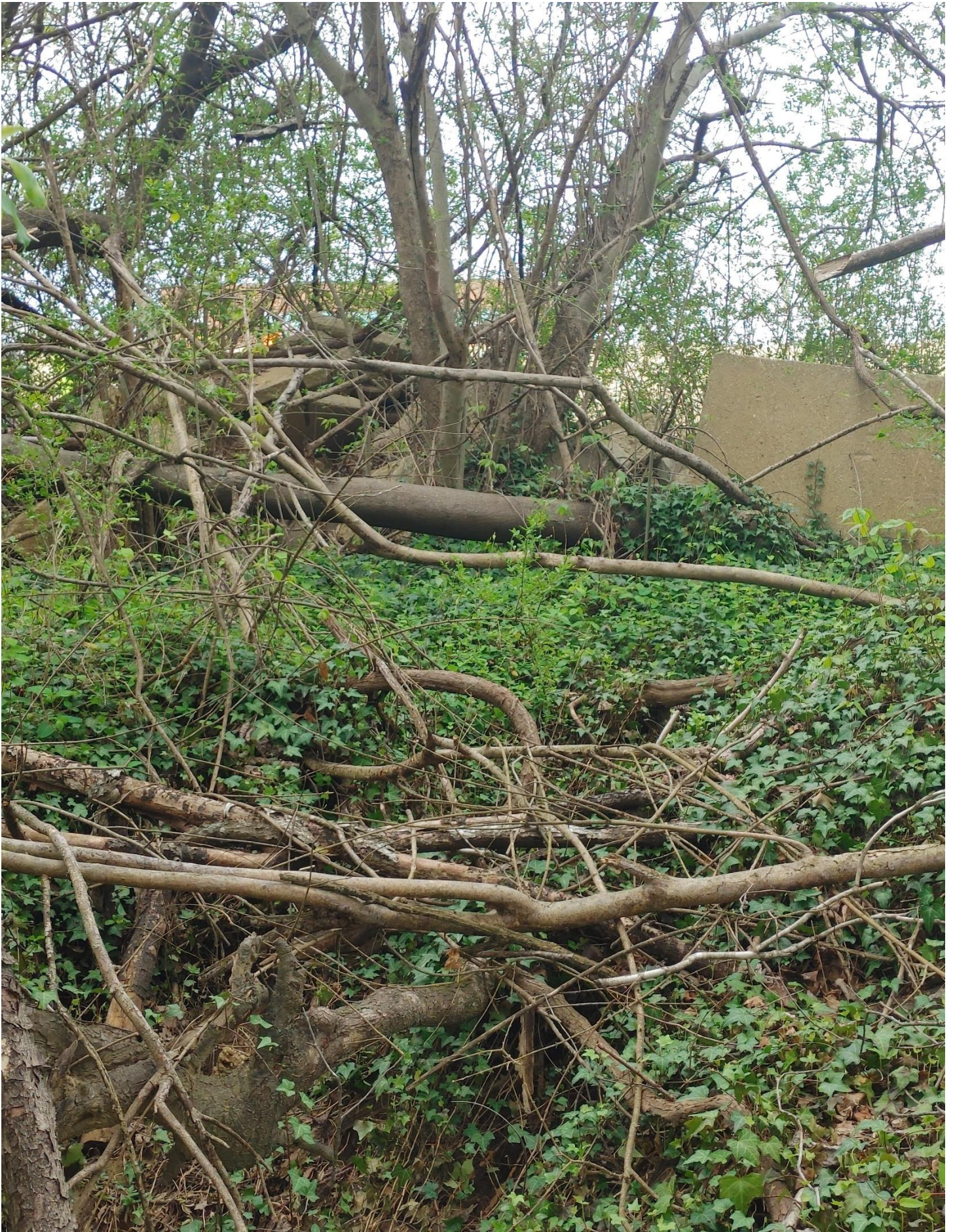
Photo 9 - Concrete is piled up in Spillway of Farmer's Property