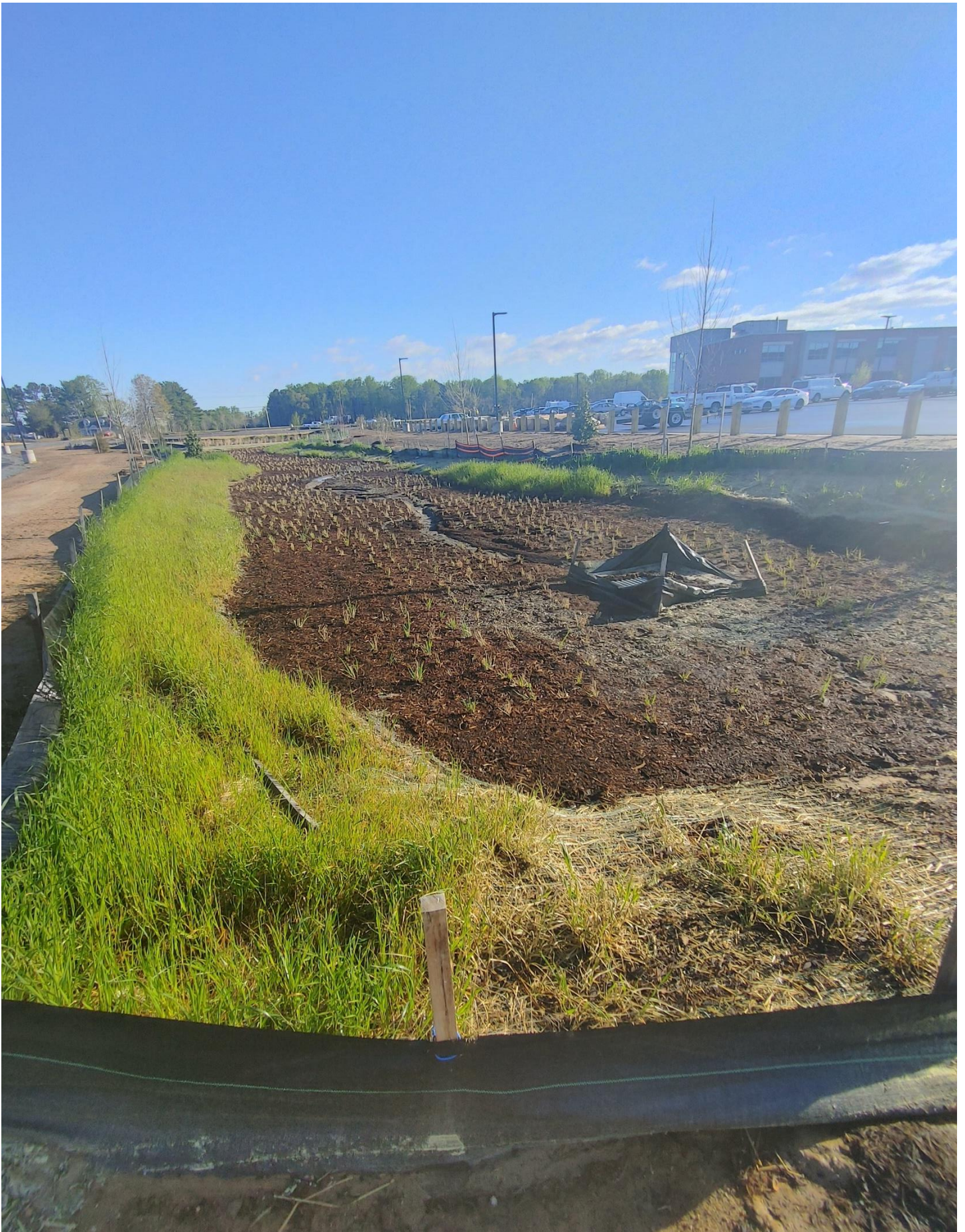
Photo 4 - Taken 4/19/2022 - Inlet Protection Failed.