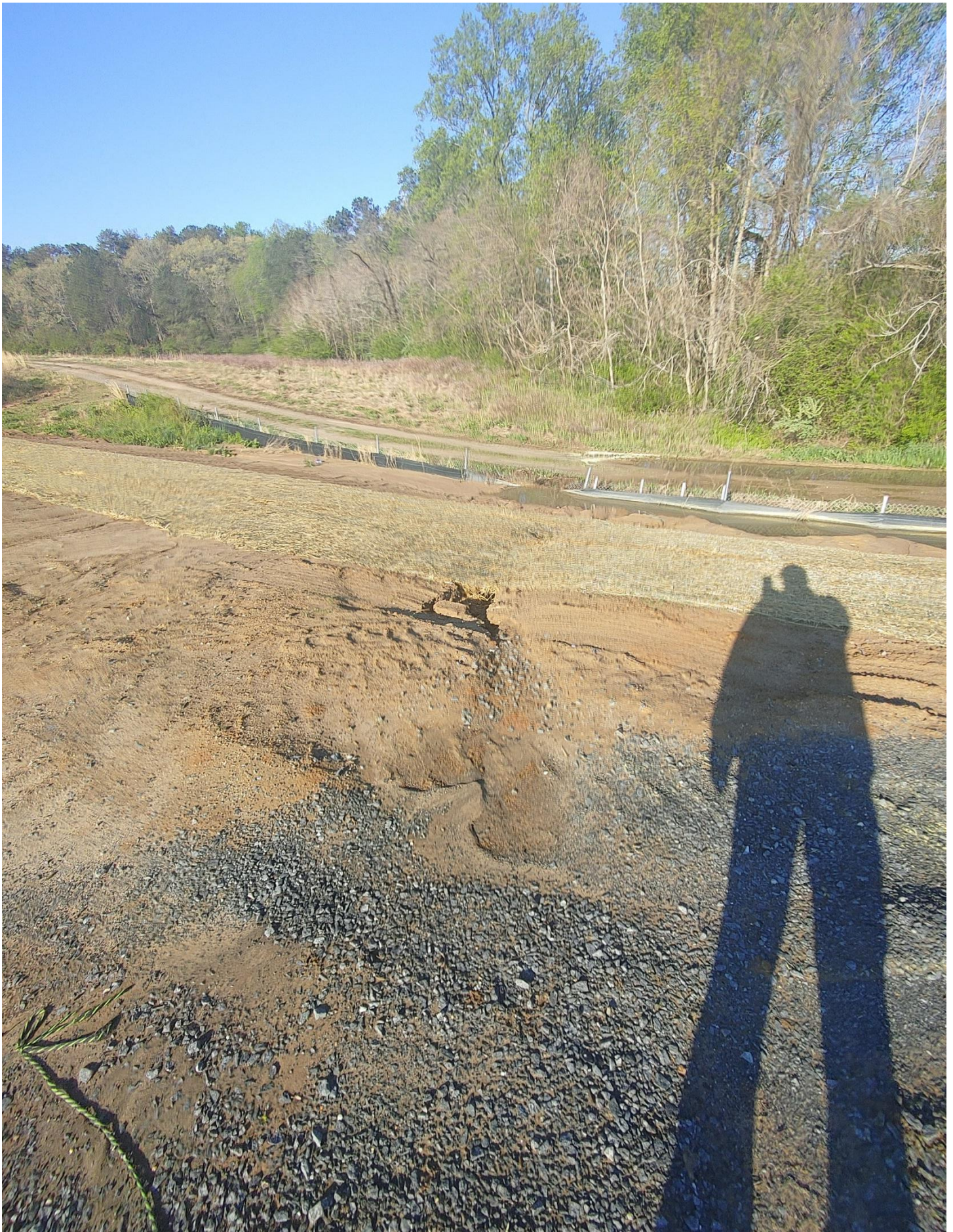
Photo 2 - Super Silt Fence Failed - Taken 4/19/2022