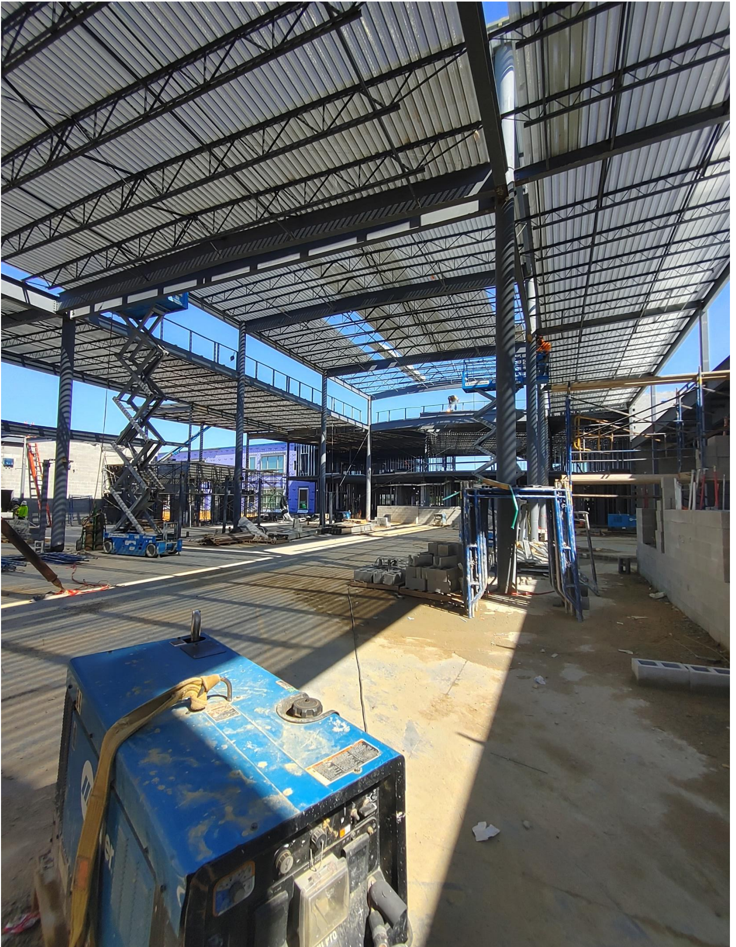
Photo 3 - Weldon Steel continues to install roof decking and temporary railing around the perimeter of the Cafeteria Roof.