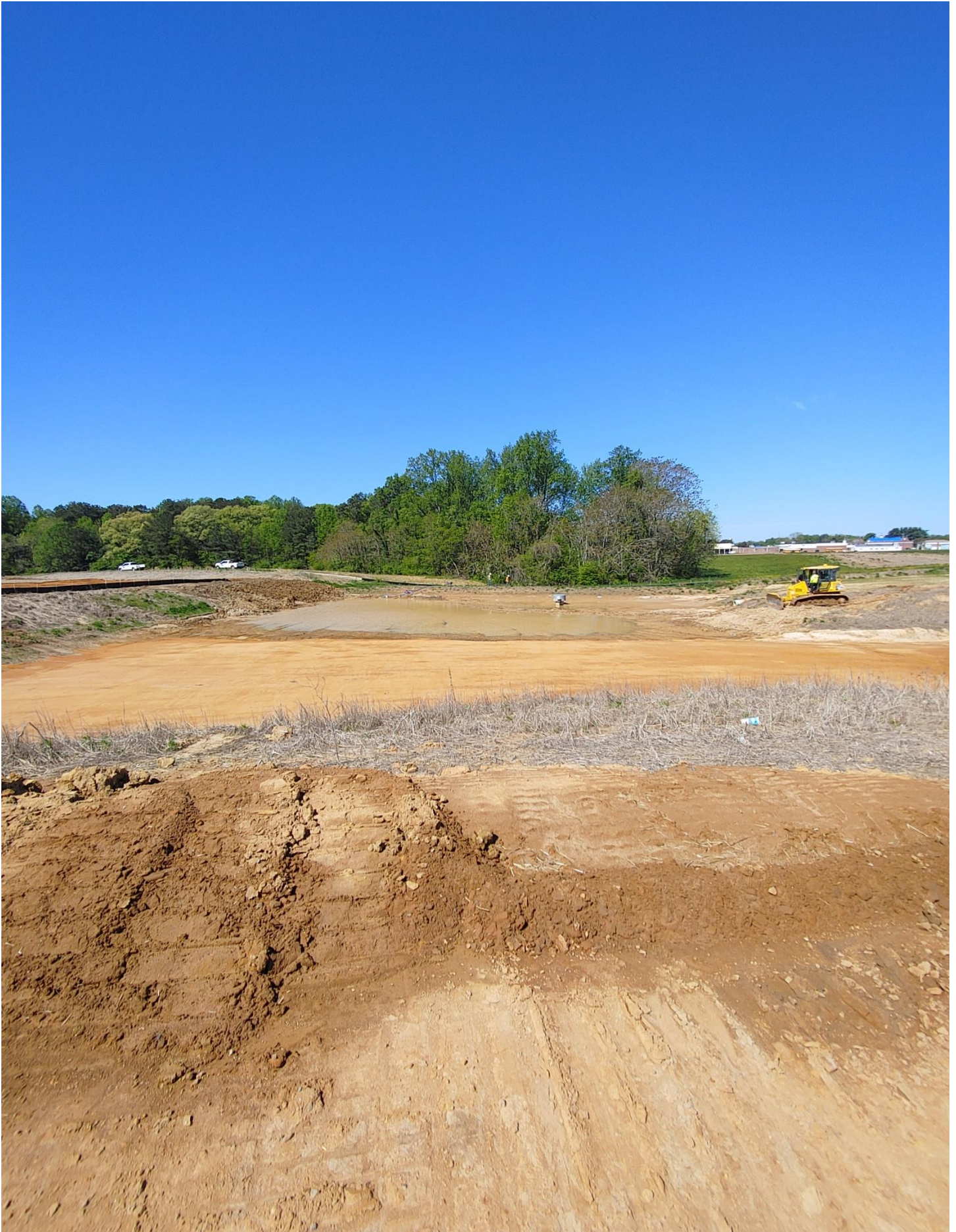
Photo 4 - Beuchert continues to work on the West side of the site, Retention Pond #1.