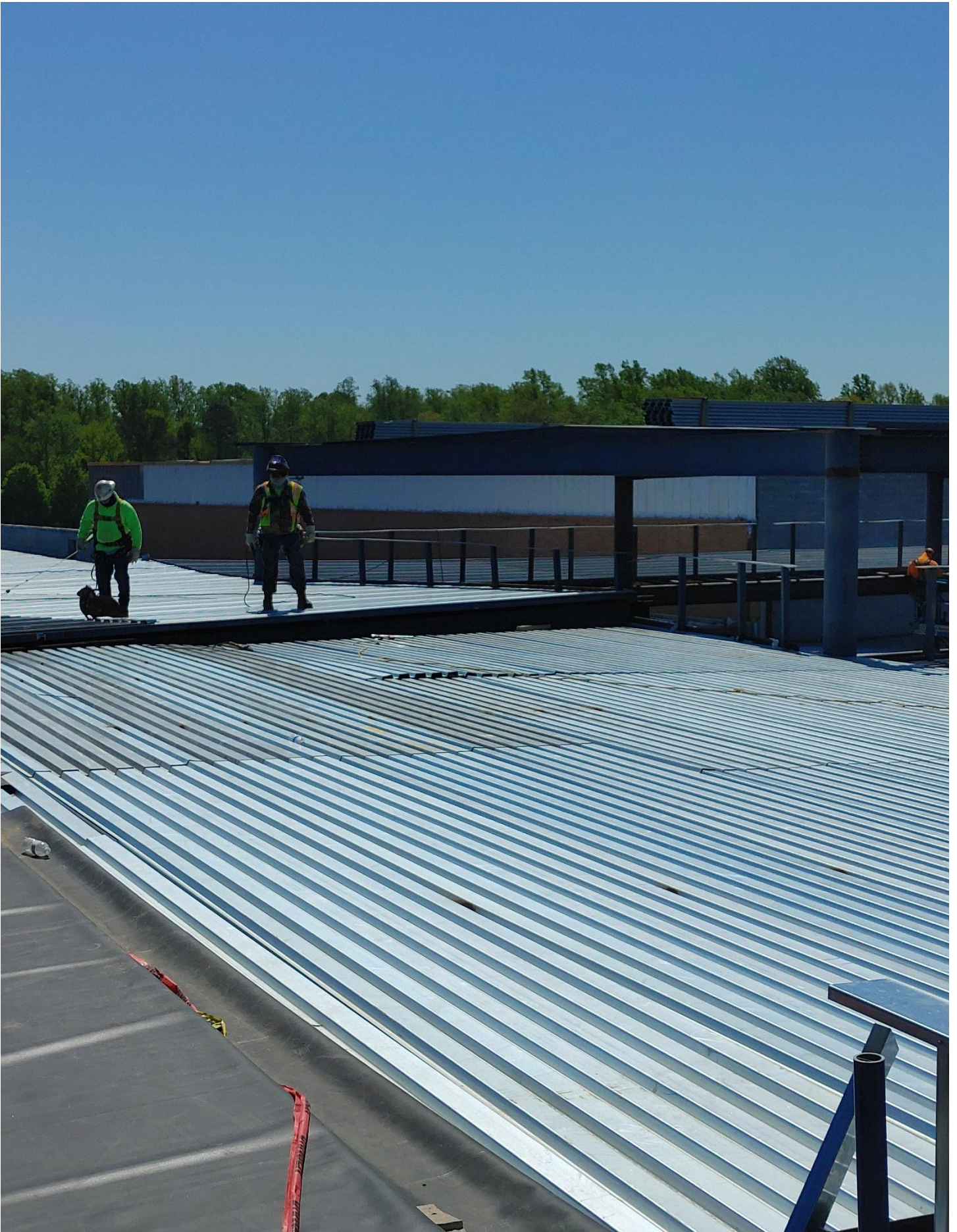
Photo 8 - Weldon Steel installing metal decking , Area A