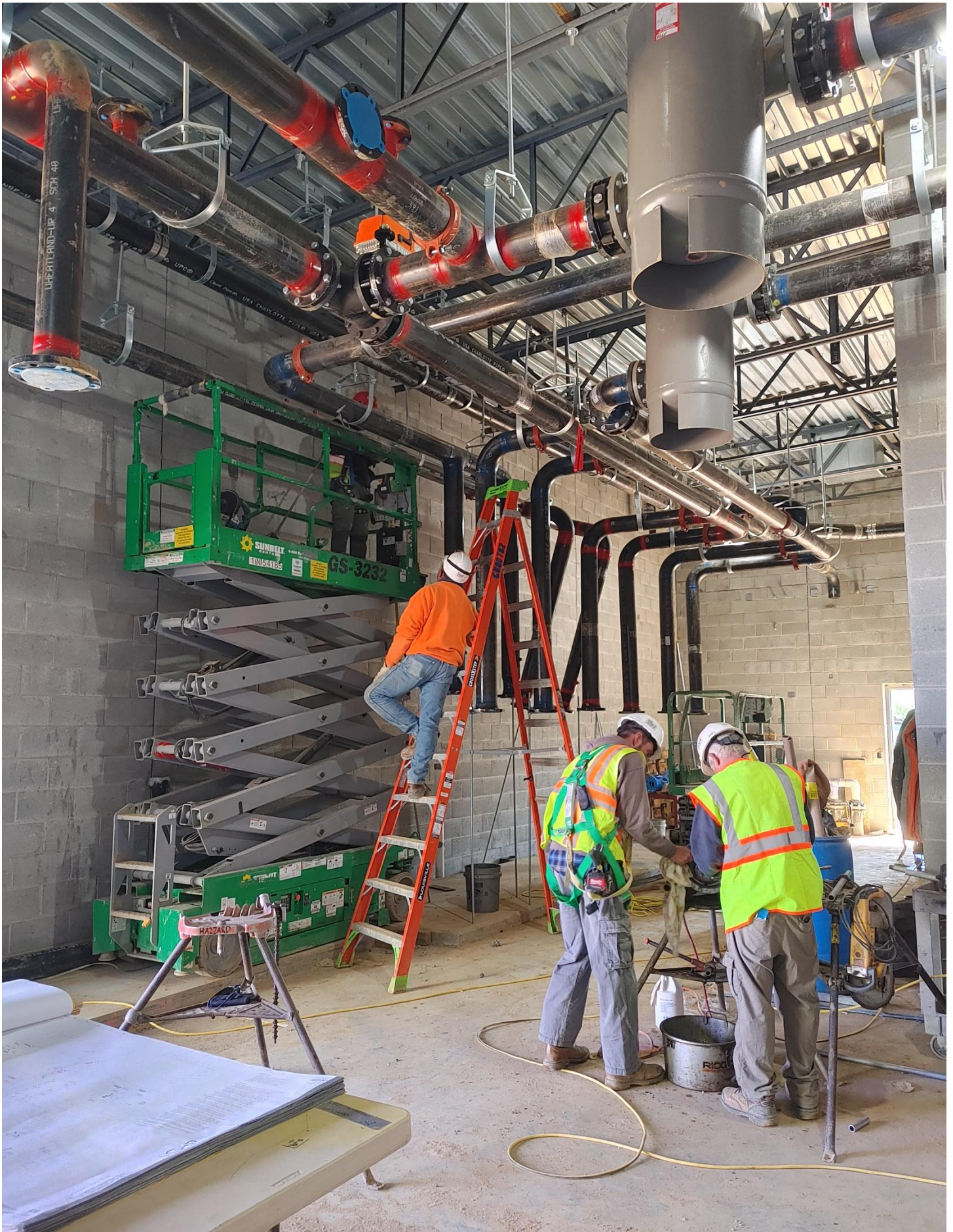
Photo 1 - Colonial Webb continues to run pipe in the Mechanical Room, Area D.