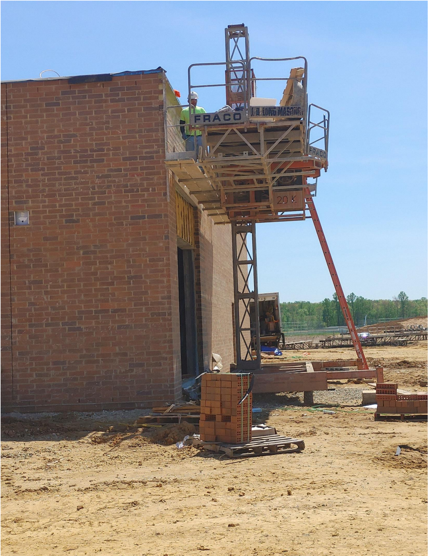
Photo 8 - Lintel and Precast set above Storefront SF6