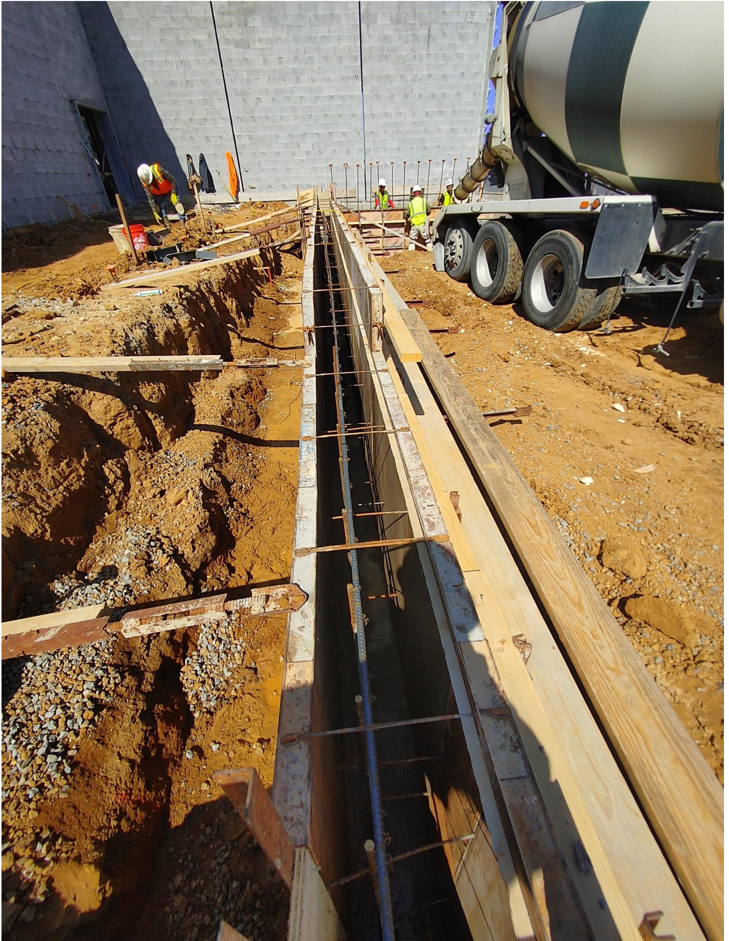
Photo 4 - Verification of Rebar in Loading Dock Wall