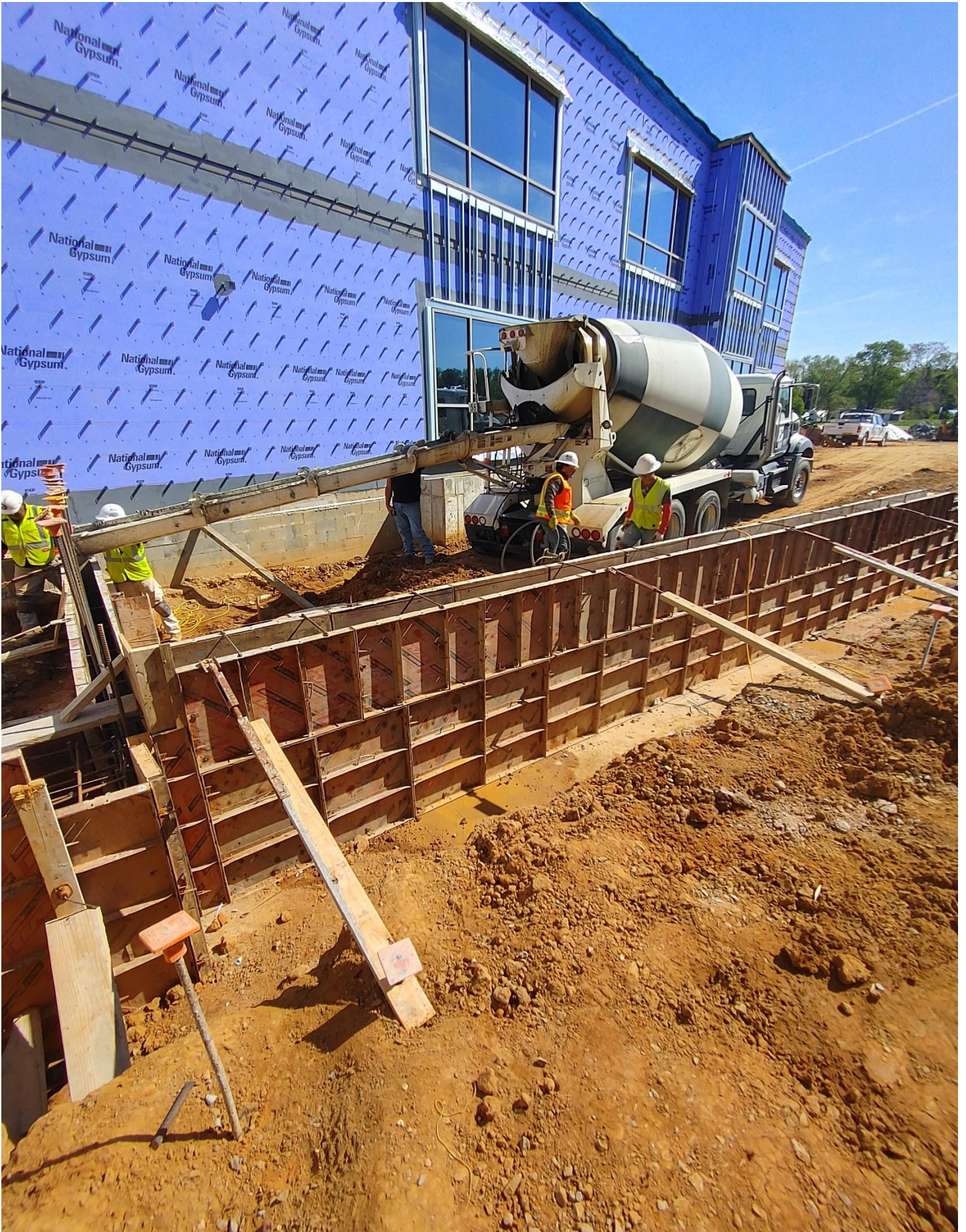
Photo 2 - Loading Dock wall being poured