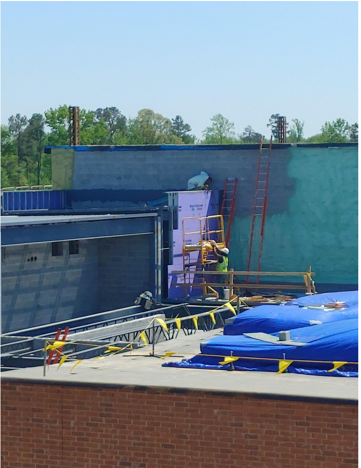
Photo 10 - Area E high wall on the North side being foamed.