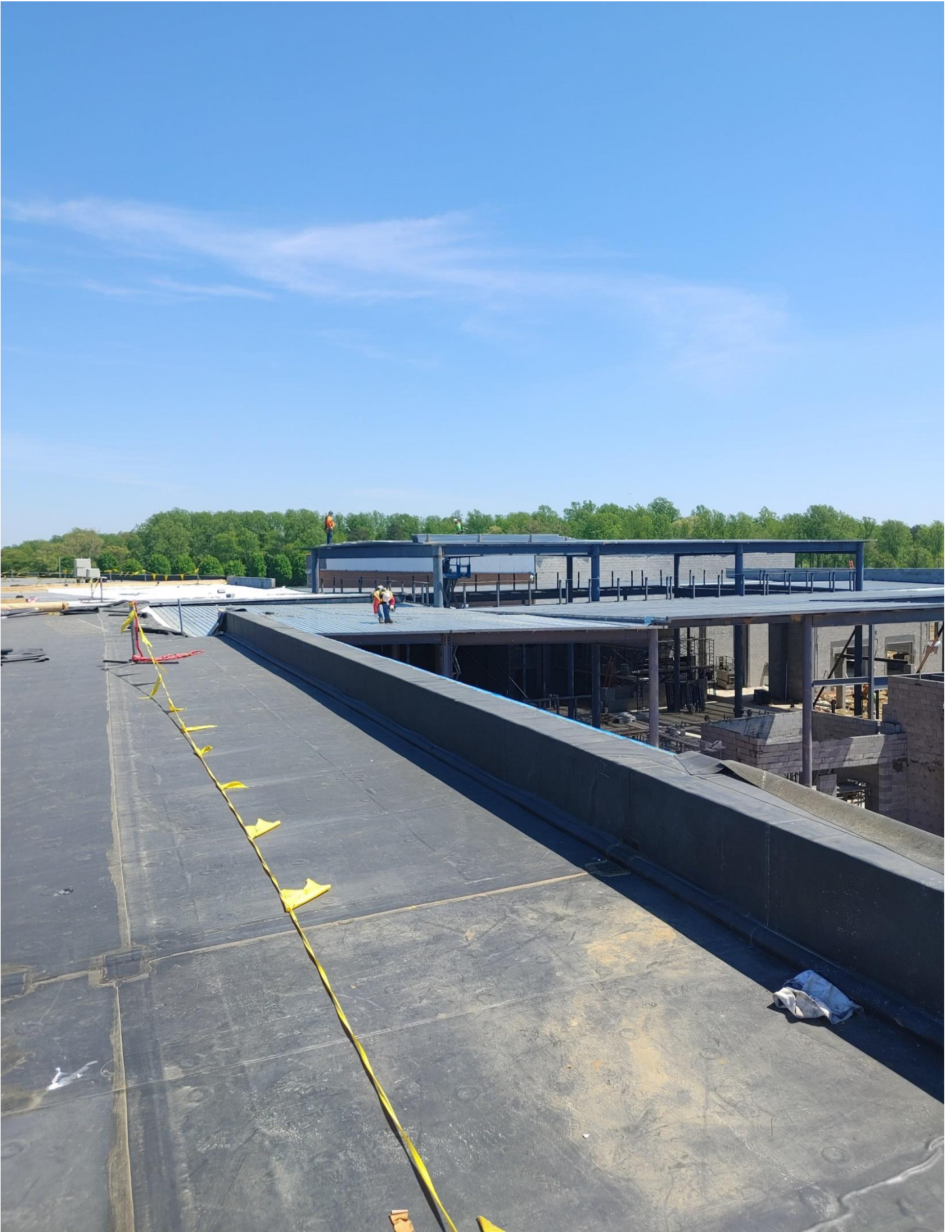
Photo 11 - Metal Decking continues to be laid in Area C