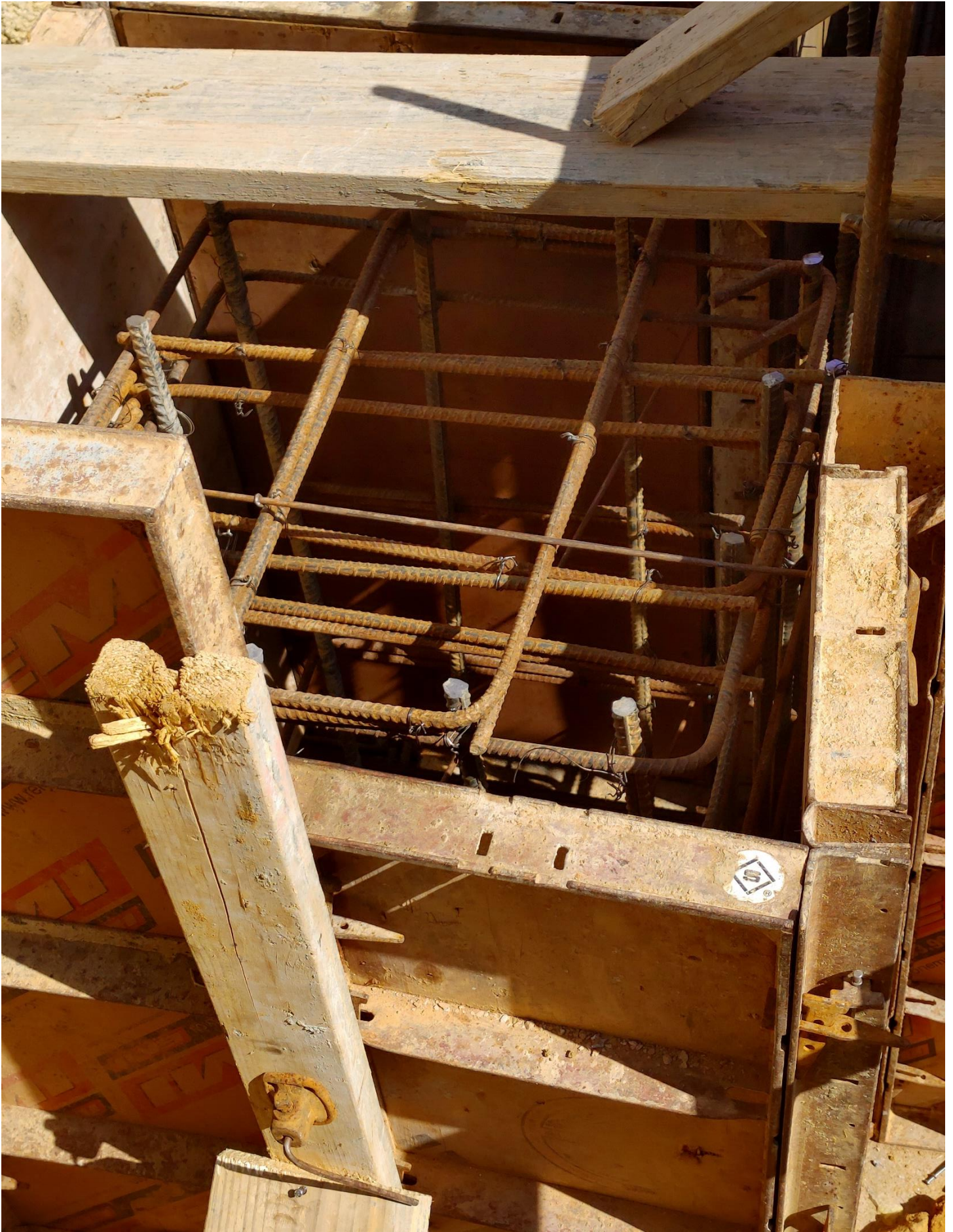
Photo 3 - Rebar cage in corner of Loading Dock Wall