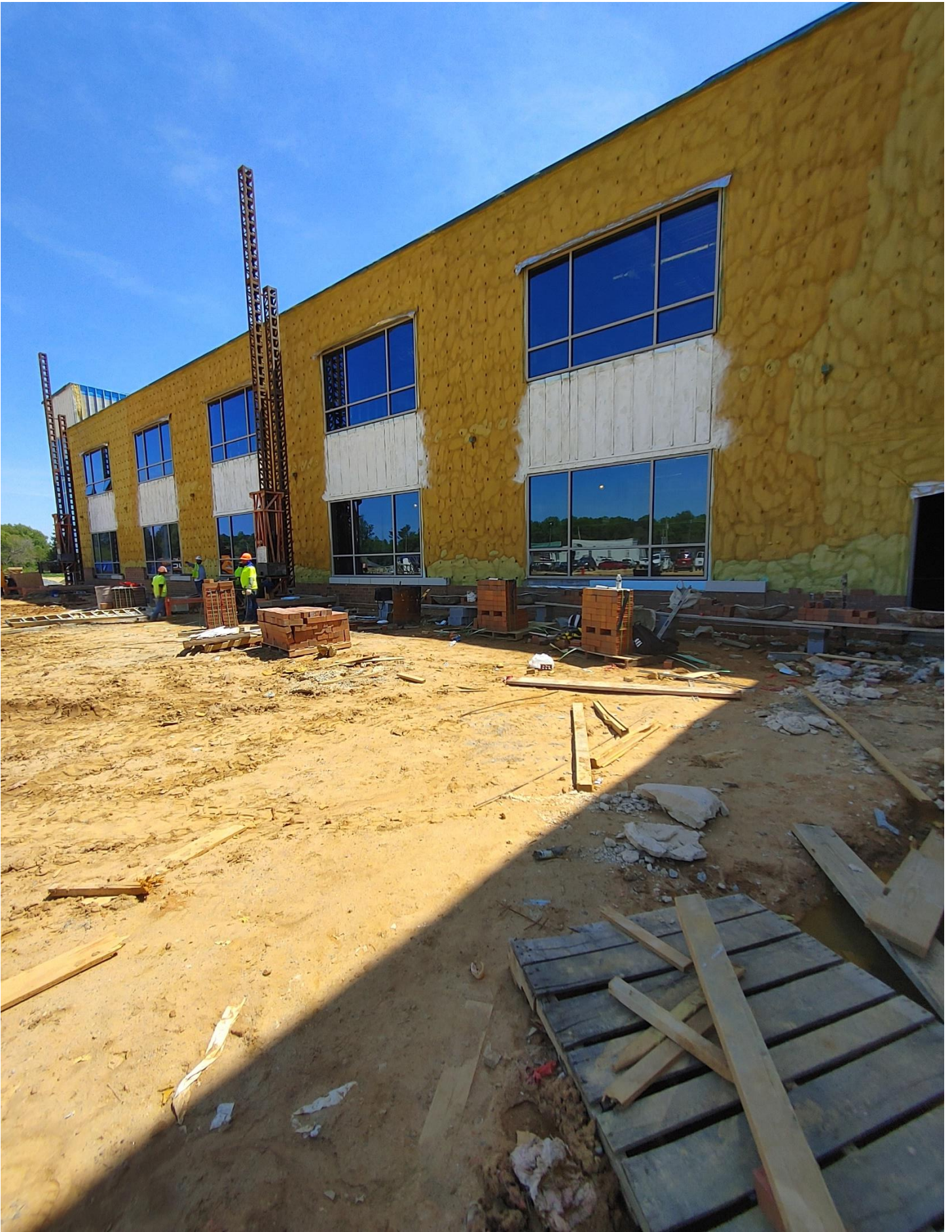
Photo 6 - Brick being laid on the Northside of Area A. Fraco Scaffolding being erected.