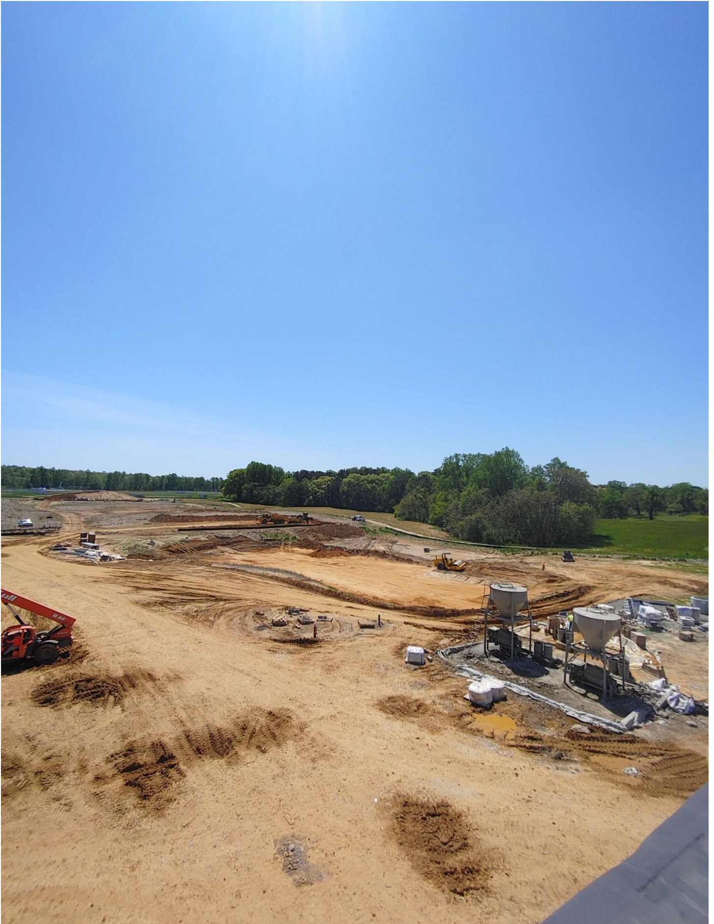
Photo 9 - Beuchert continues to work on the West side of the site.