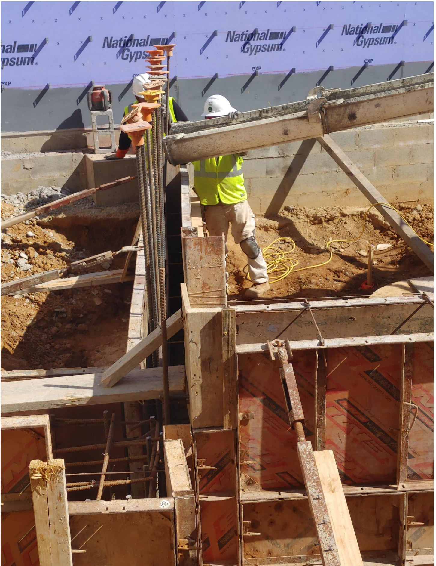
Photo 1 - Preparing to pour the Concrete for the Loading Dock Wall