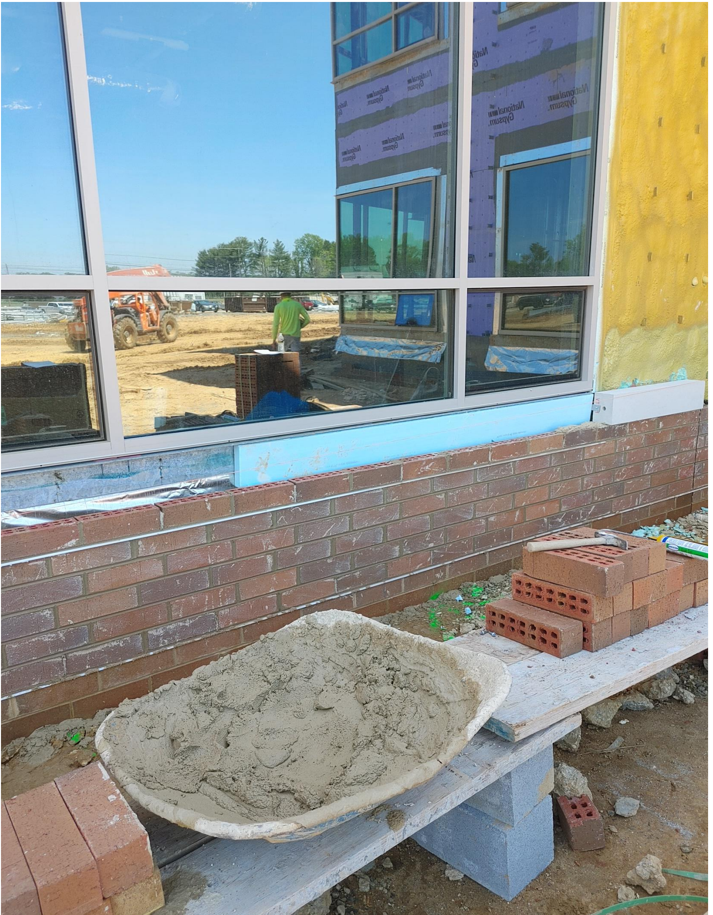
Photo 5 - Brick being laid on the North side of Area A. Flashing is installed and Precast being laid.