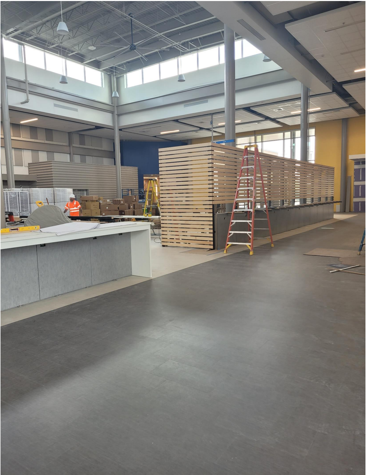
Photo 1 - Decorative Wood wall is being constructed in Area C