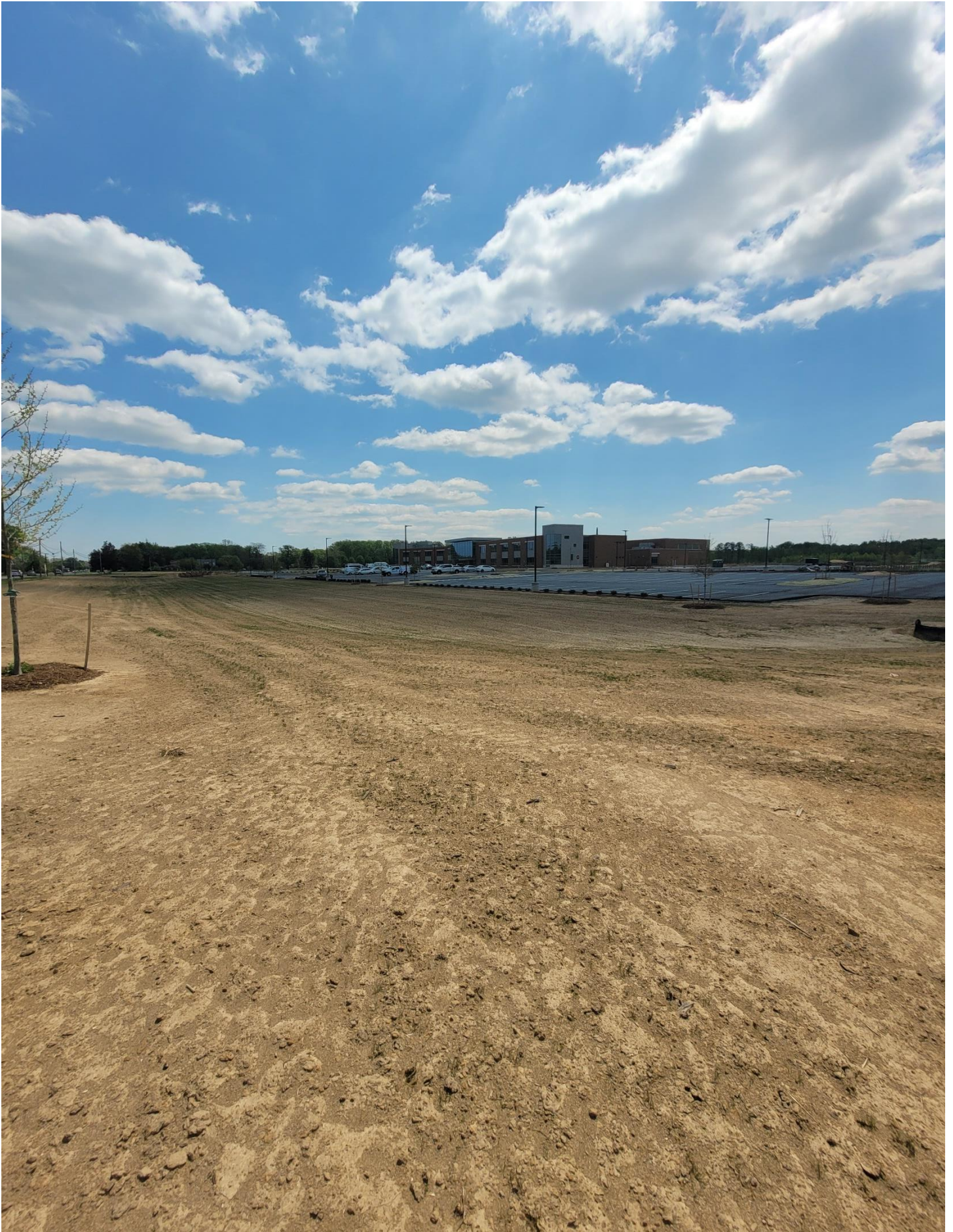
Photo 11 - Grass is starting to come up in Various areas