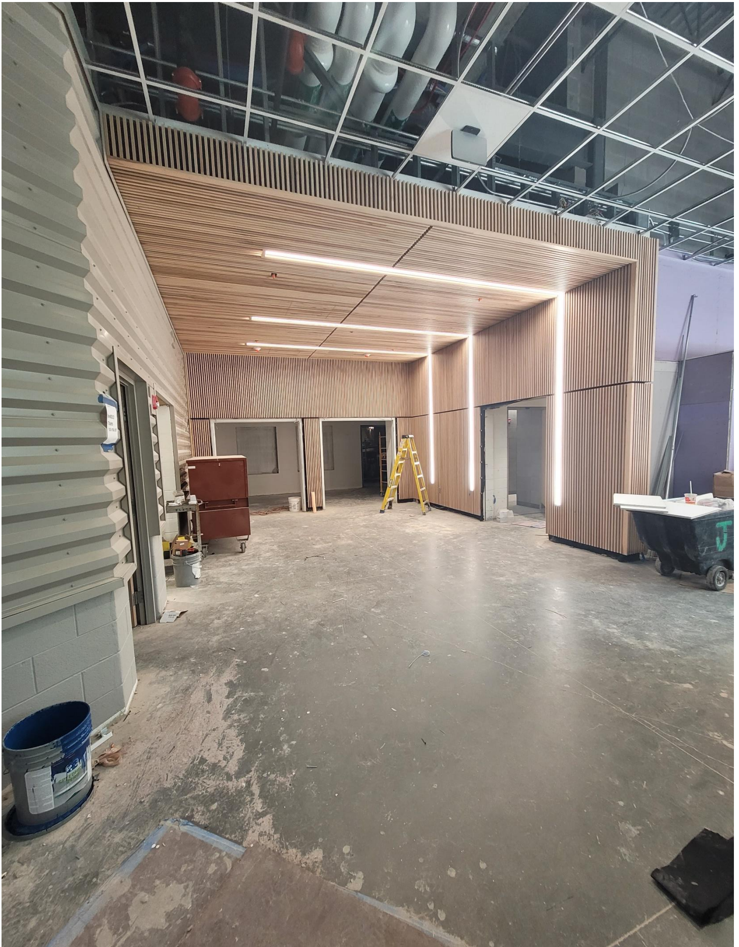
Photo 3 - Entrance to Auditorium