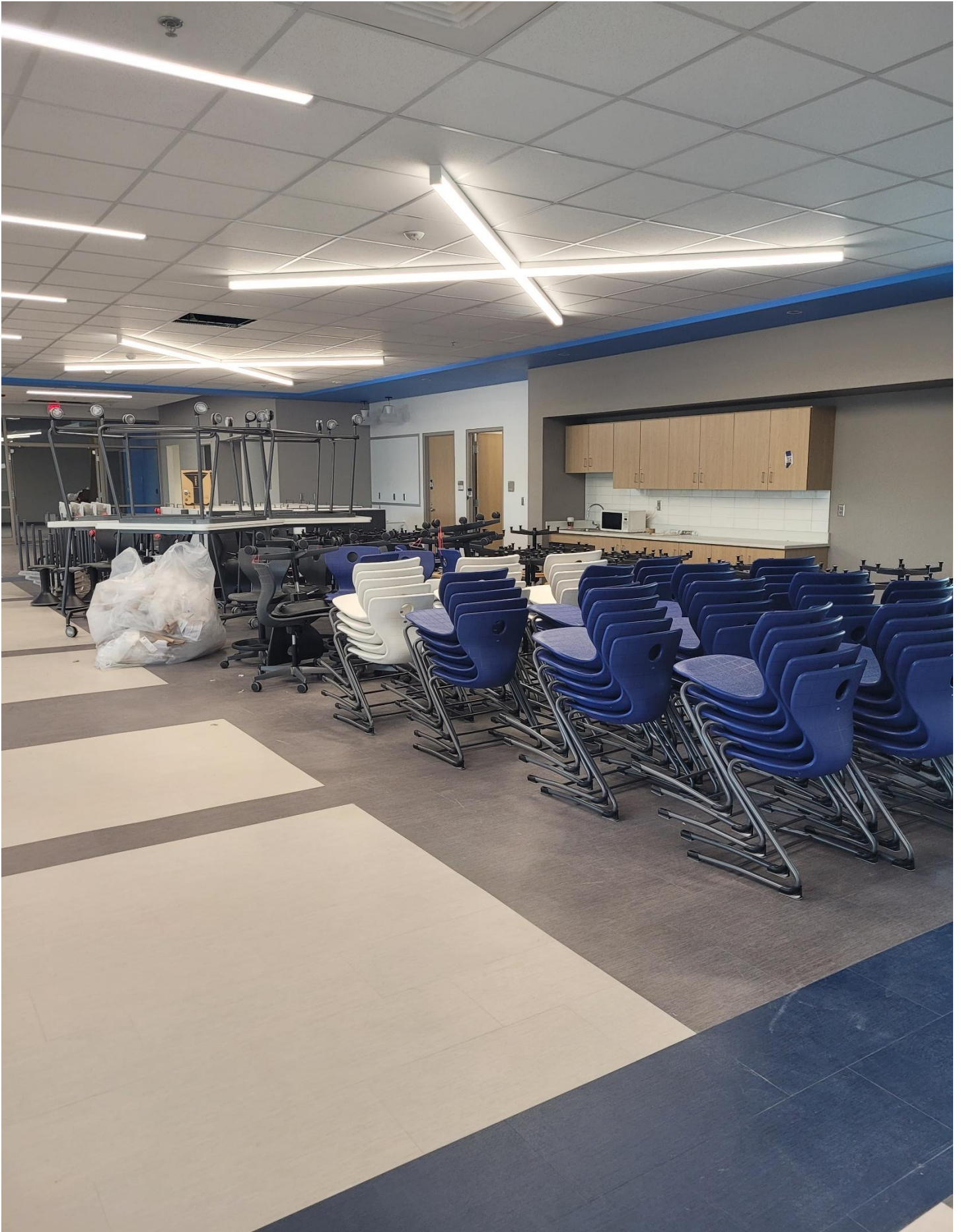
Photo 10 - Furniture is being stored in Area B