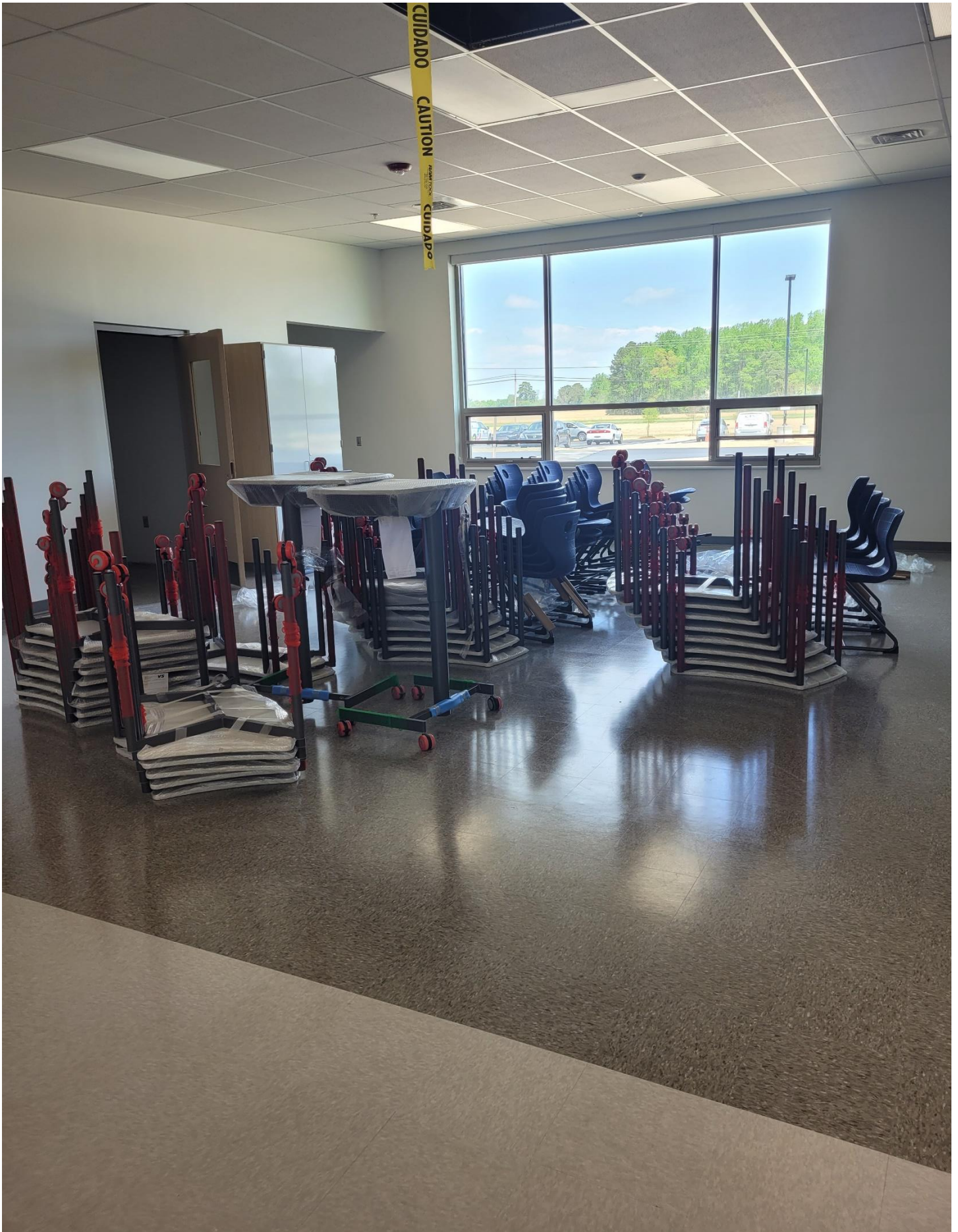
Photo 9 - Furniture is being stored in the Learning Labs of Area A & B, 1st floor