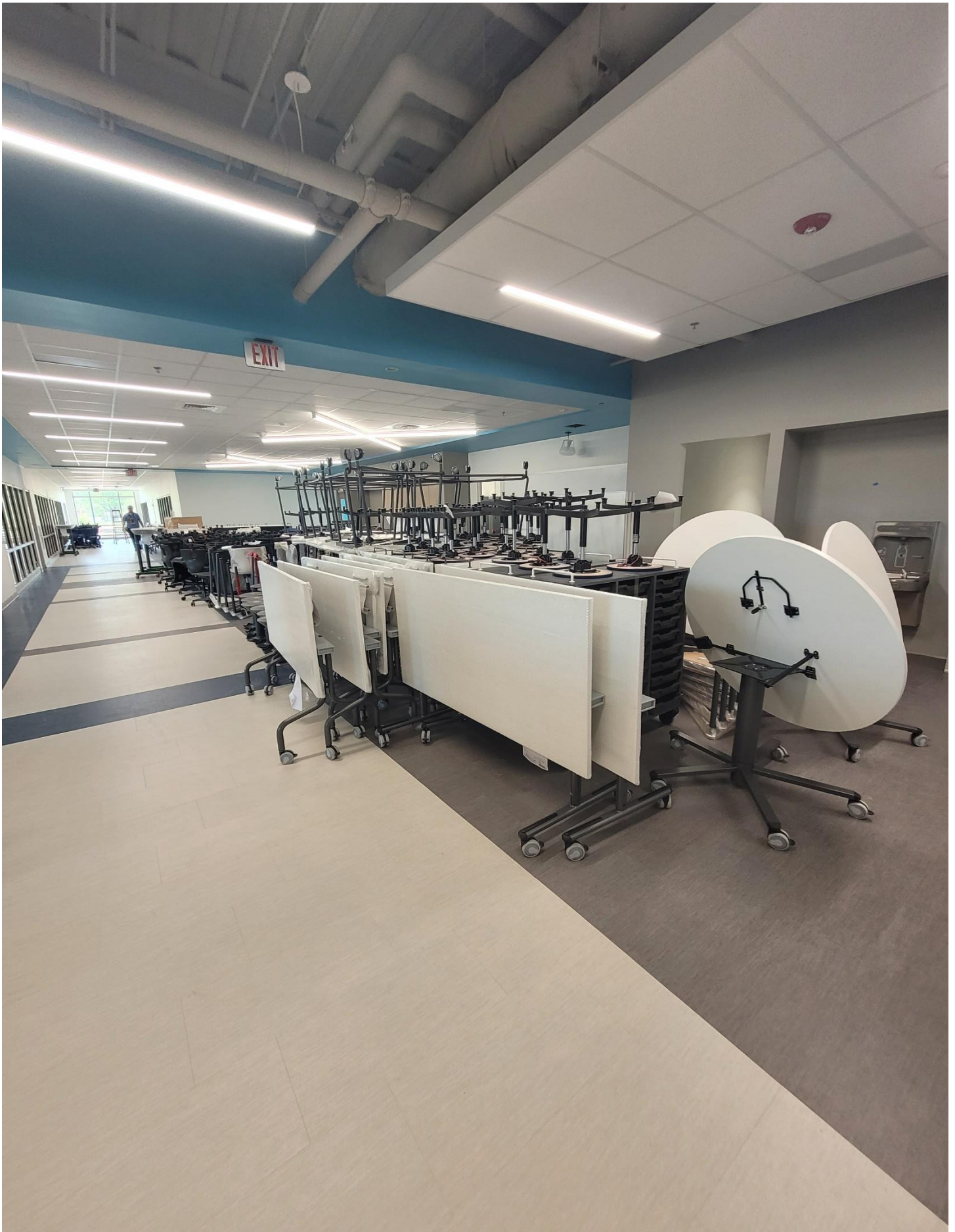
Photo 6 - Furniture stored in Area A