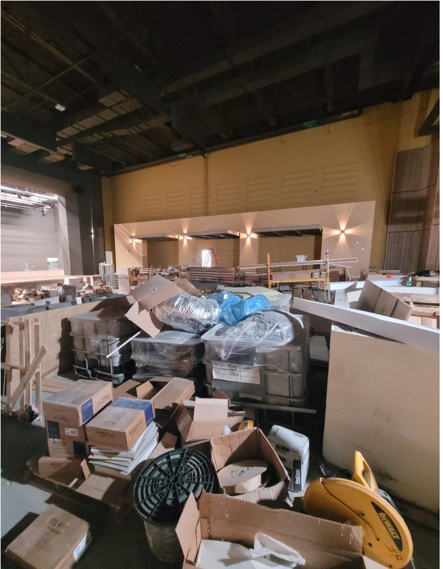
Photo 5 - Side wall lighting has been installed in Auditorium