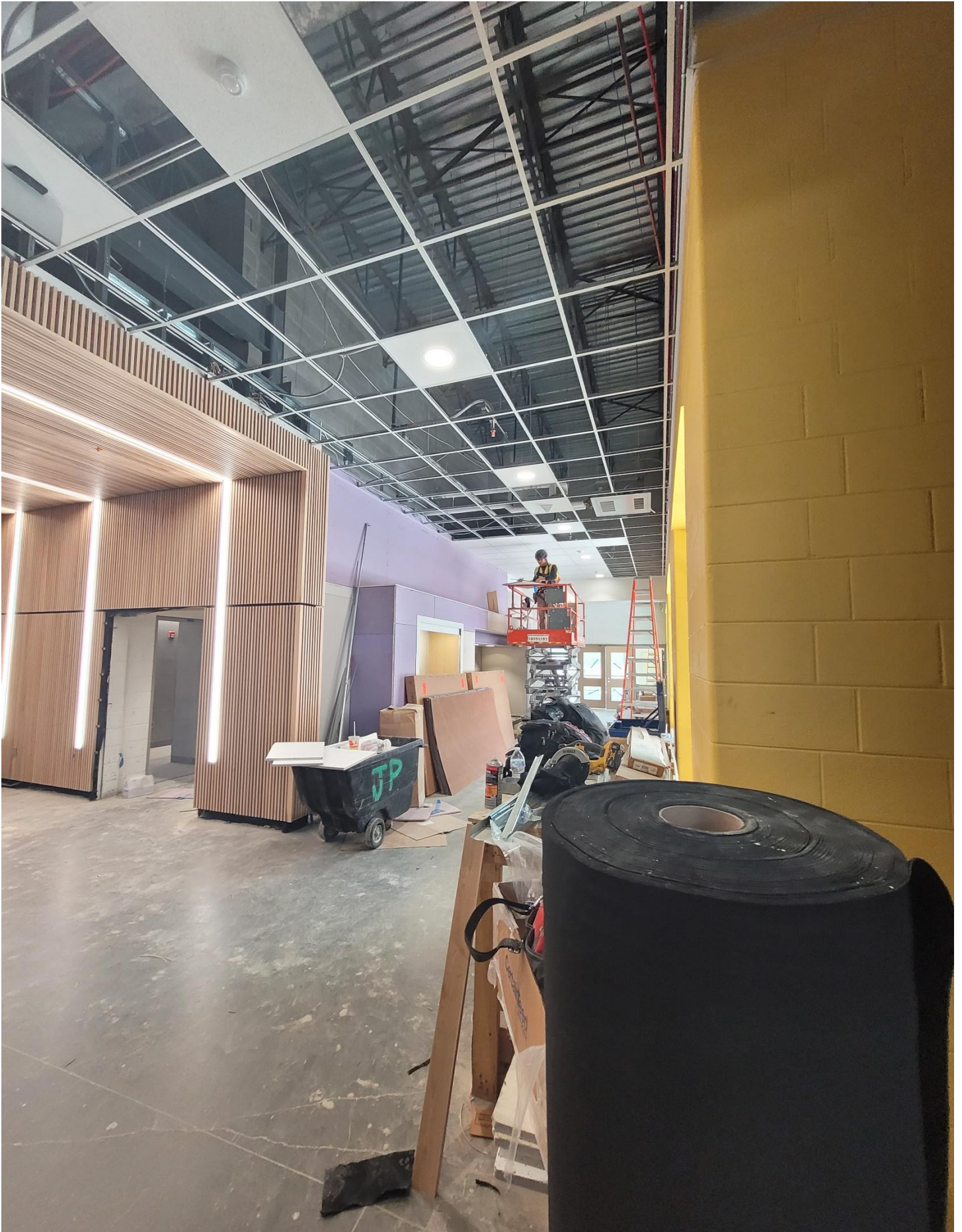
Photo 4 - Acoustical Ceiling is being installed outside of the Auditorium