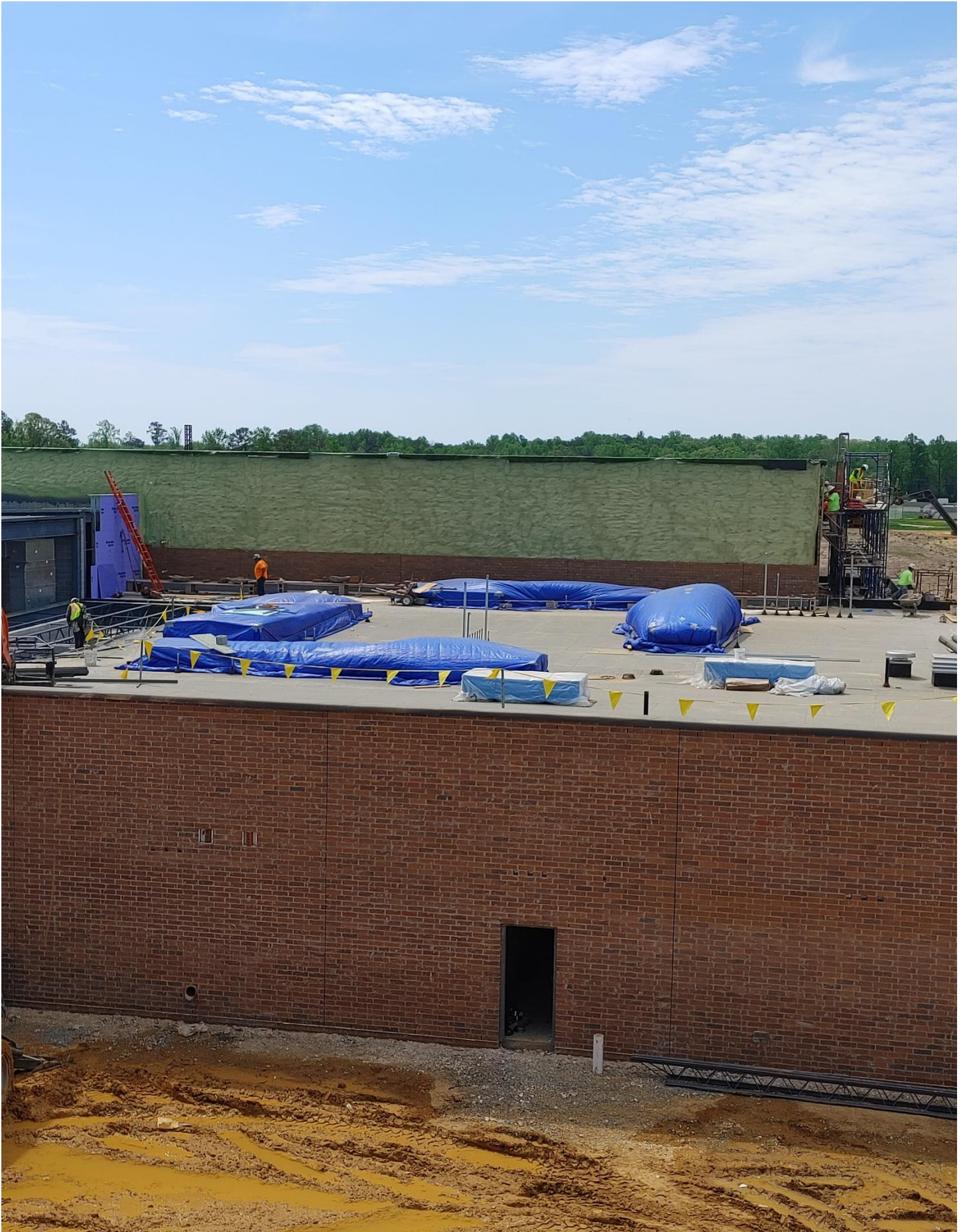
Photo 5 - J.D. Long has begun to lay Brick above the low roof in Area E