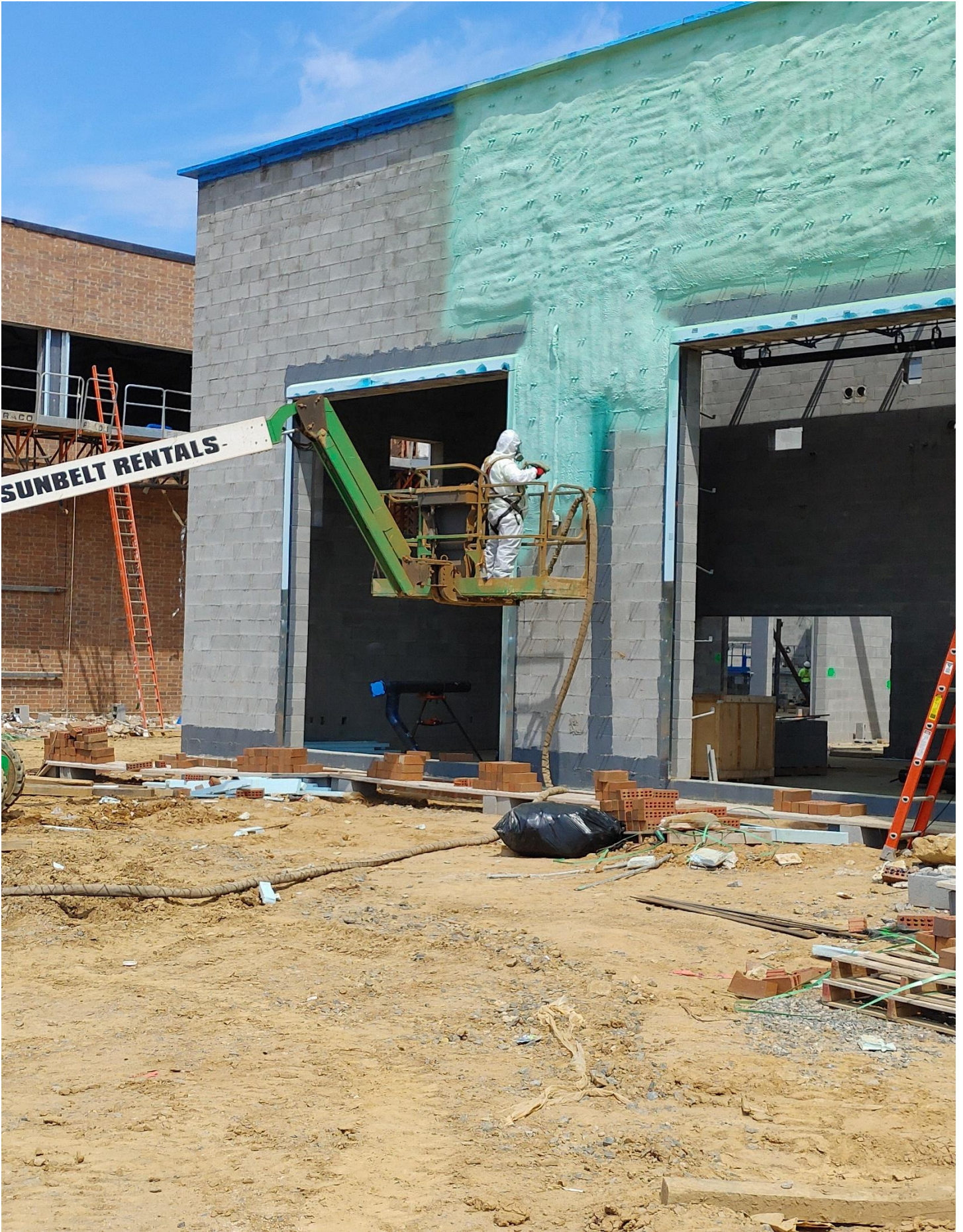
Photo 12 - Spray Foam is being applied to the South side of Area D.