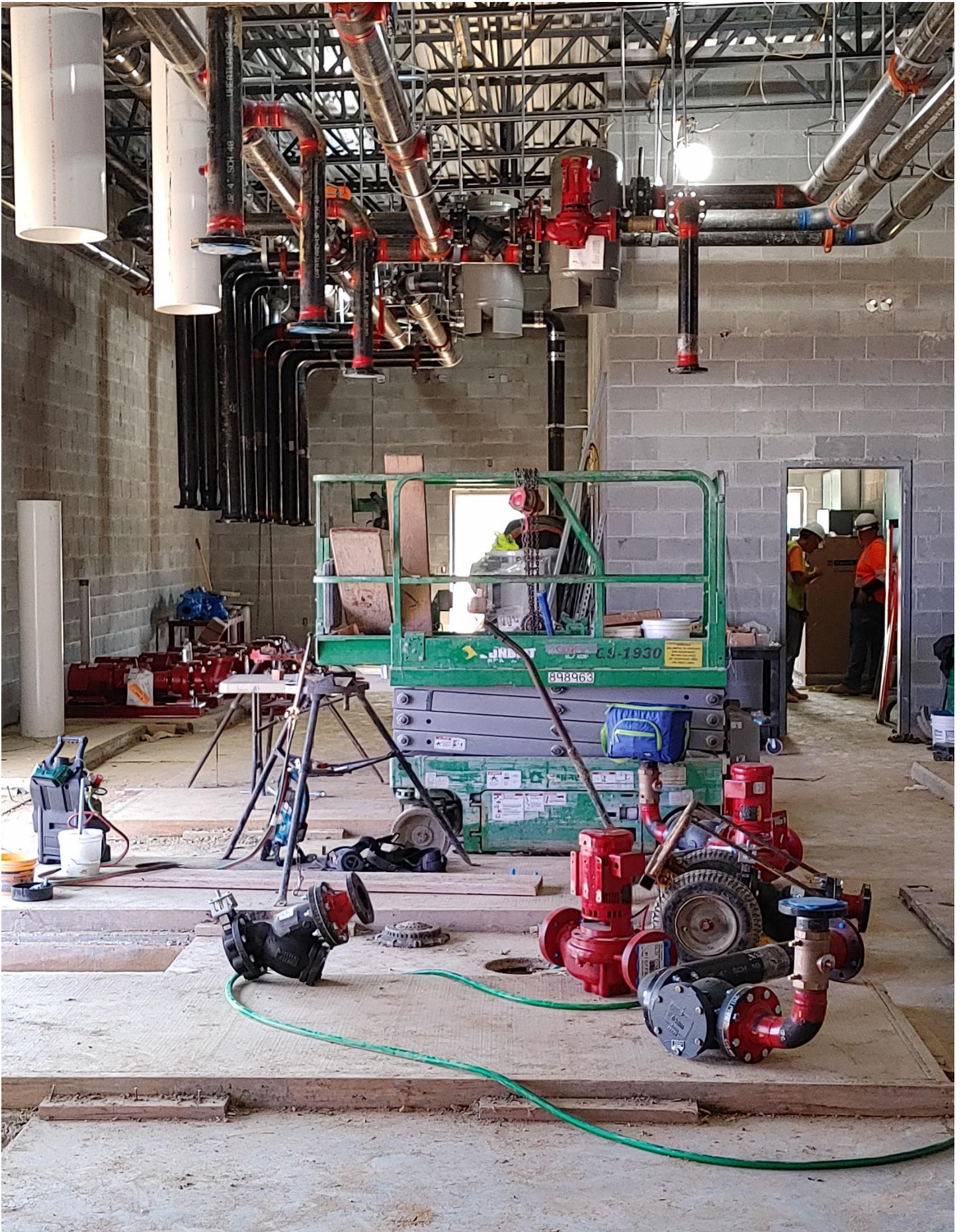
Photo 7 - Colonial Webb continues to run pipe in the Mechanical Room of Area D