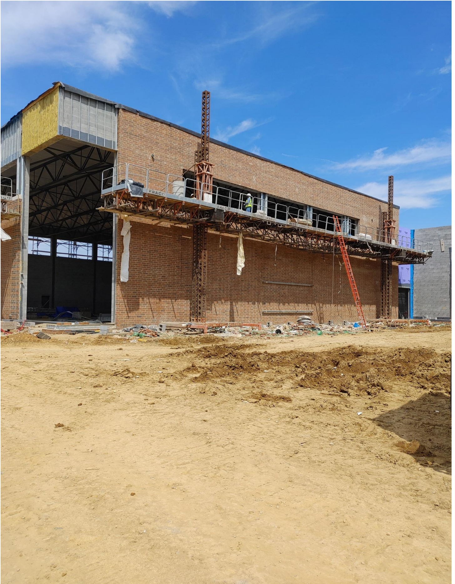
Photo 9 - Masons finishing up Brick work on the East side of Area E.