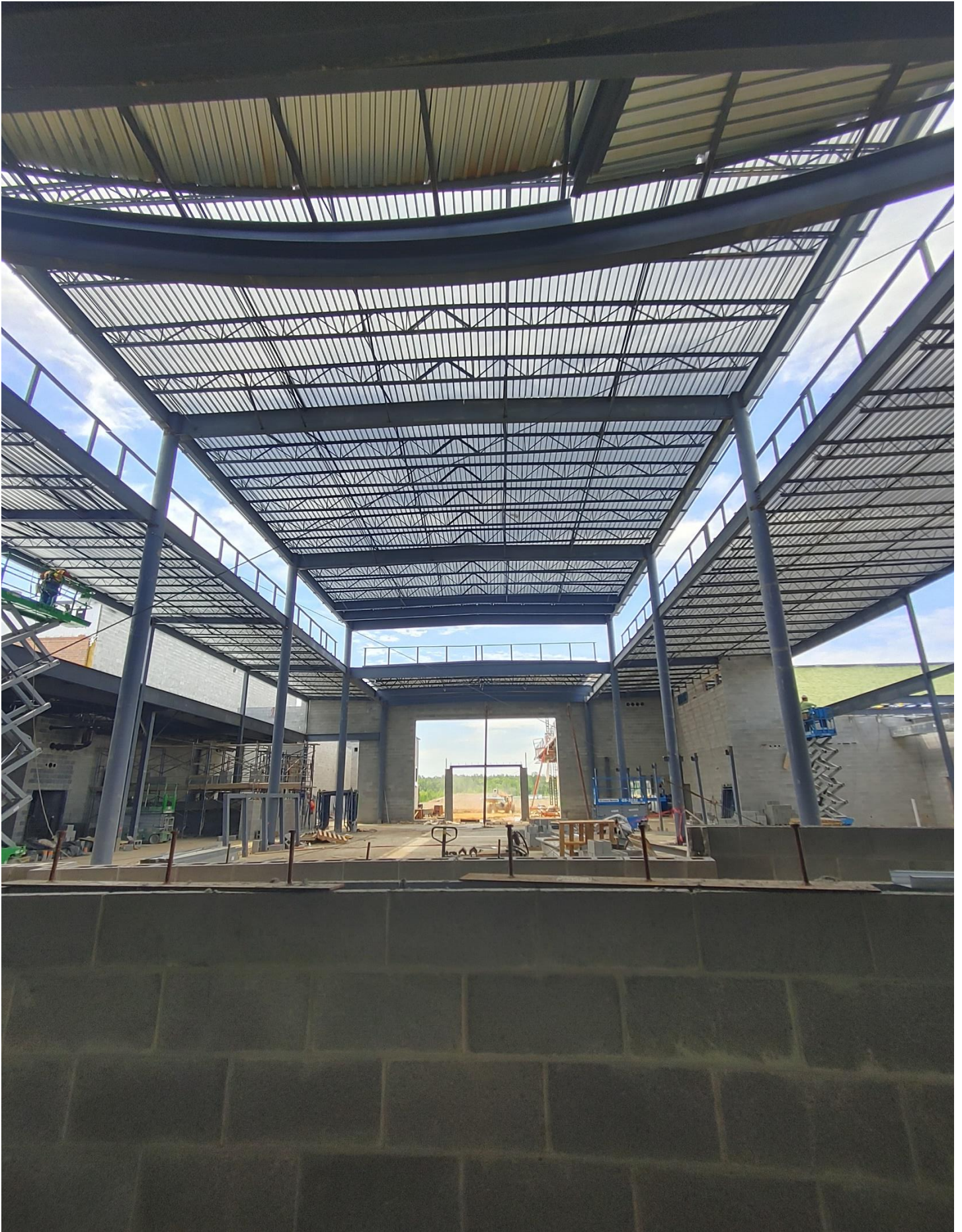
Photo 1- Roof Decking almost completed in Area C