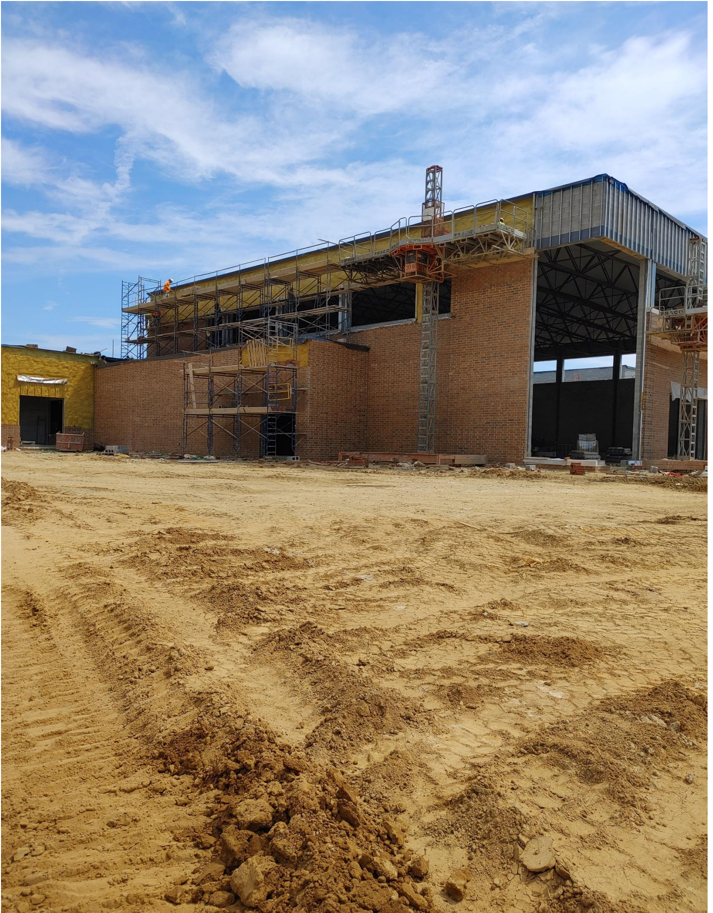
Photo 10 - Masons are preparing to lay Brick on the West side of Area E.