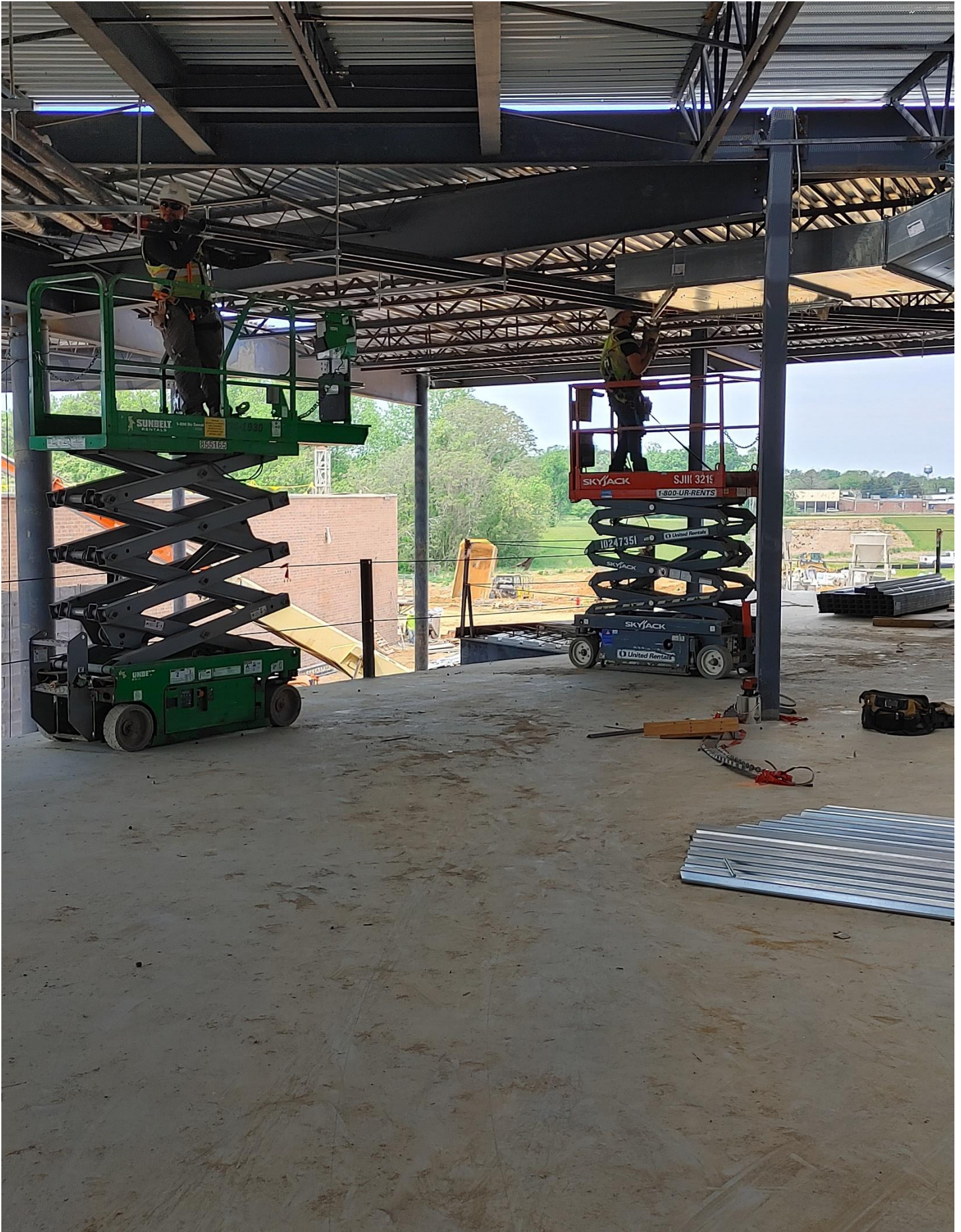
Photo 4 - Colonial Webb continues to run pipe in Area A