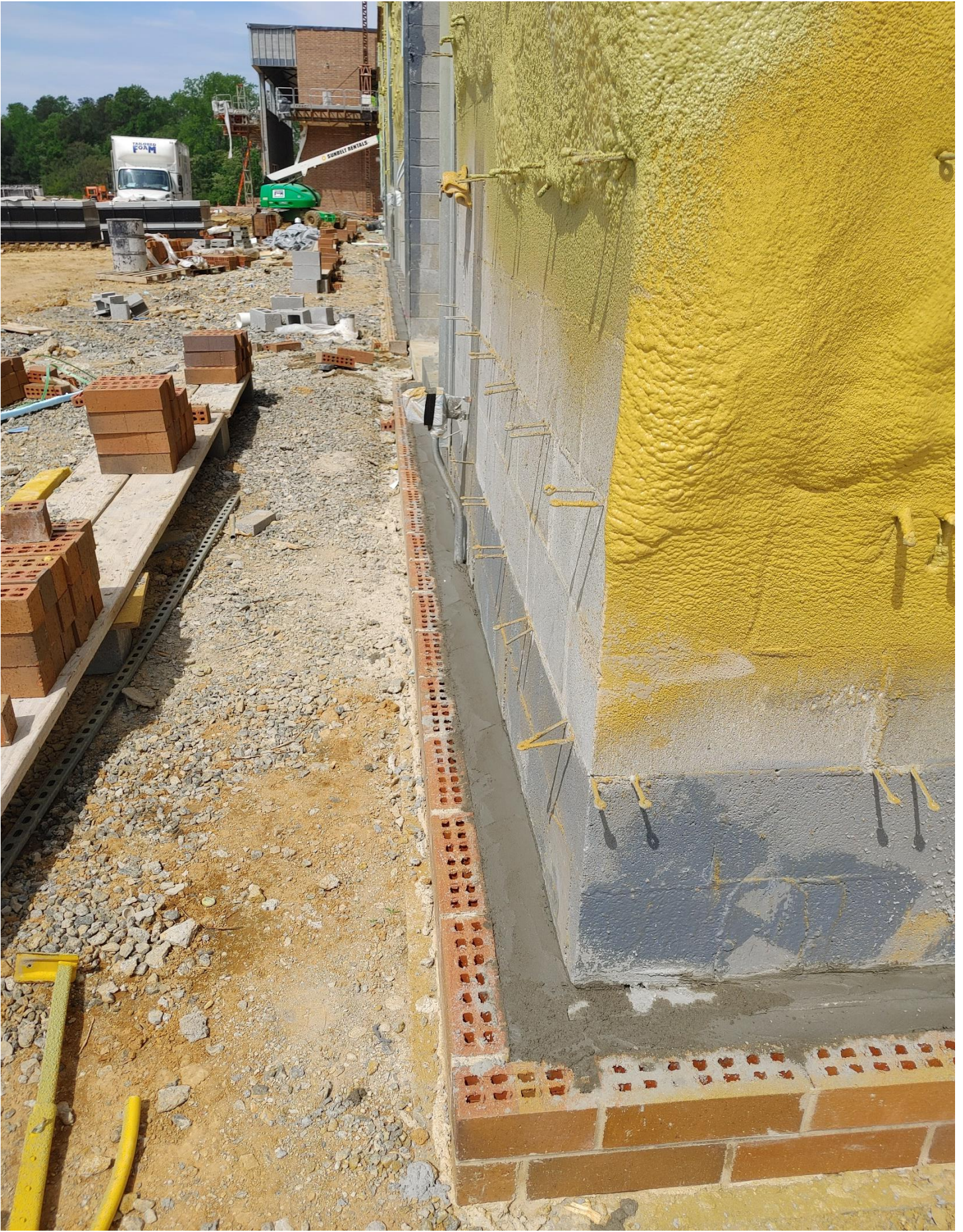
Photo 11 - Brick being prepped for flashing on the South side of Area D.