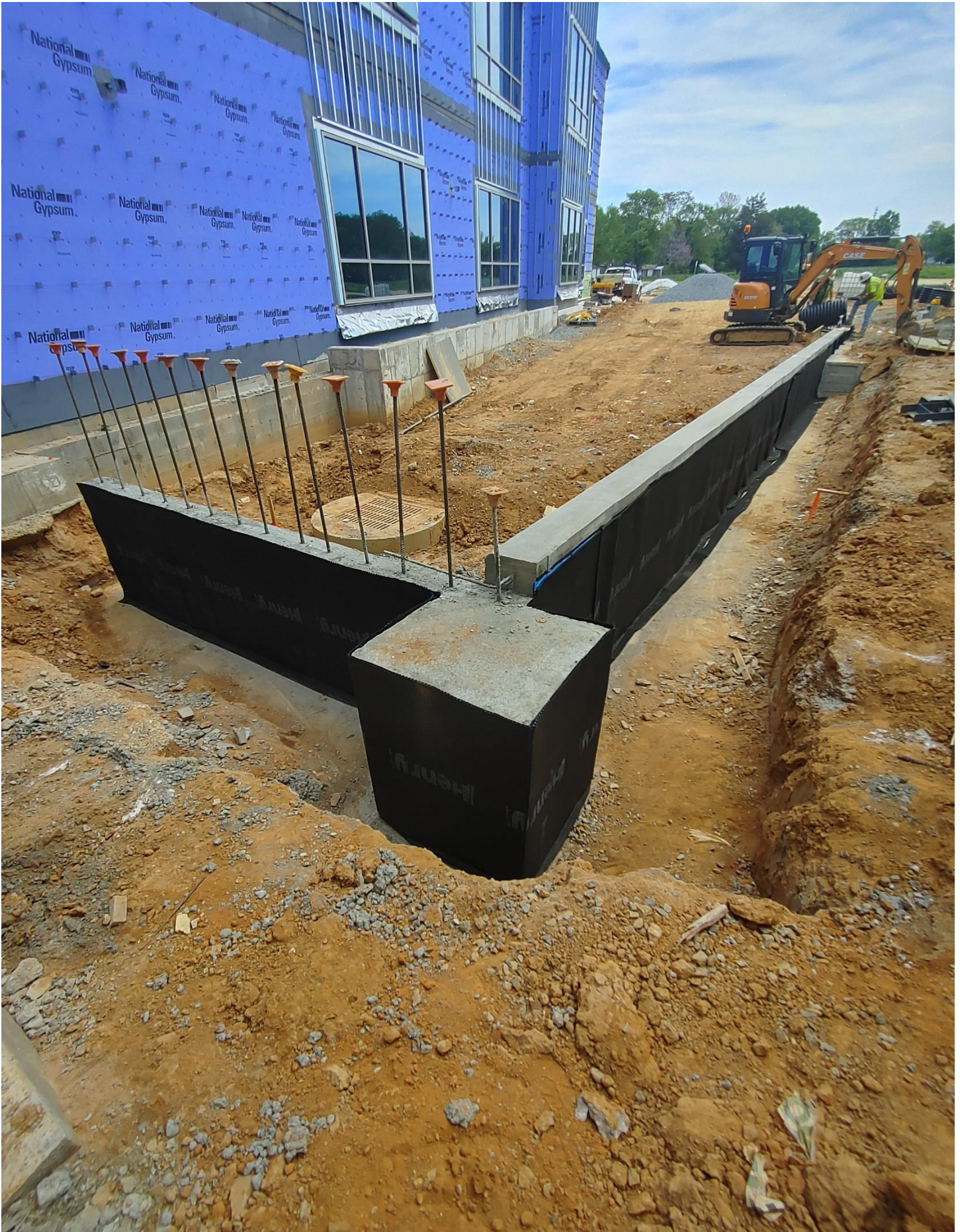
Photo 3 - Loading Dock Wall has waterproof Membrane installed.