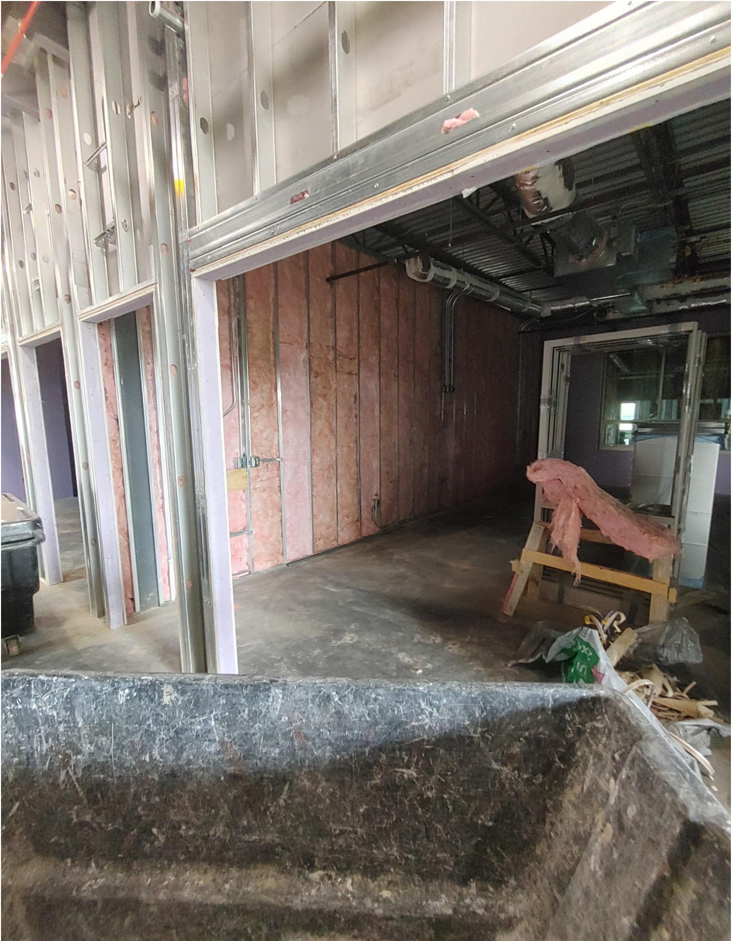
Photo 5 - Walls being insulated in Area A