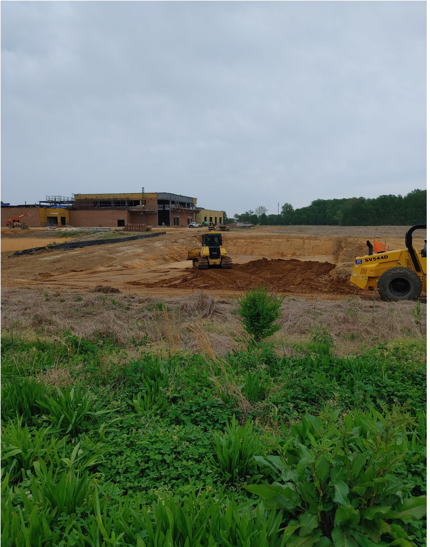
Photo 1 - Beuchert continues to move dirt on the West side of the site.