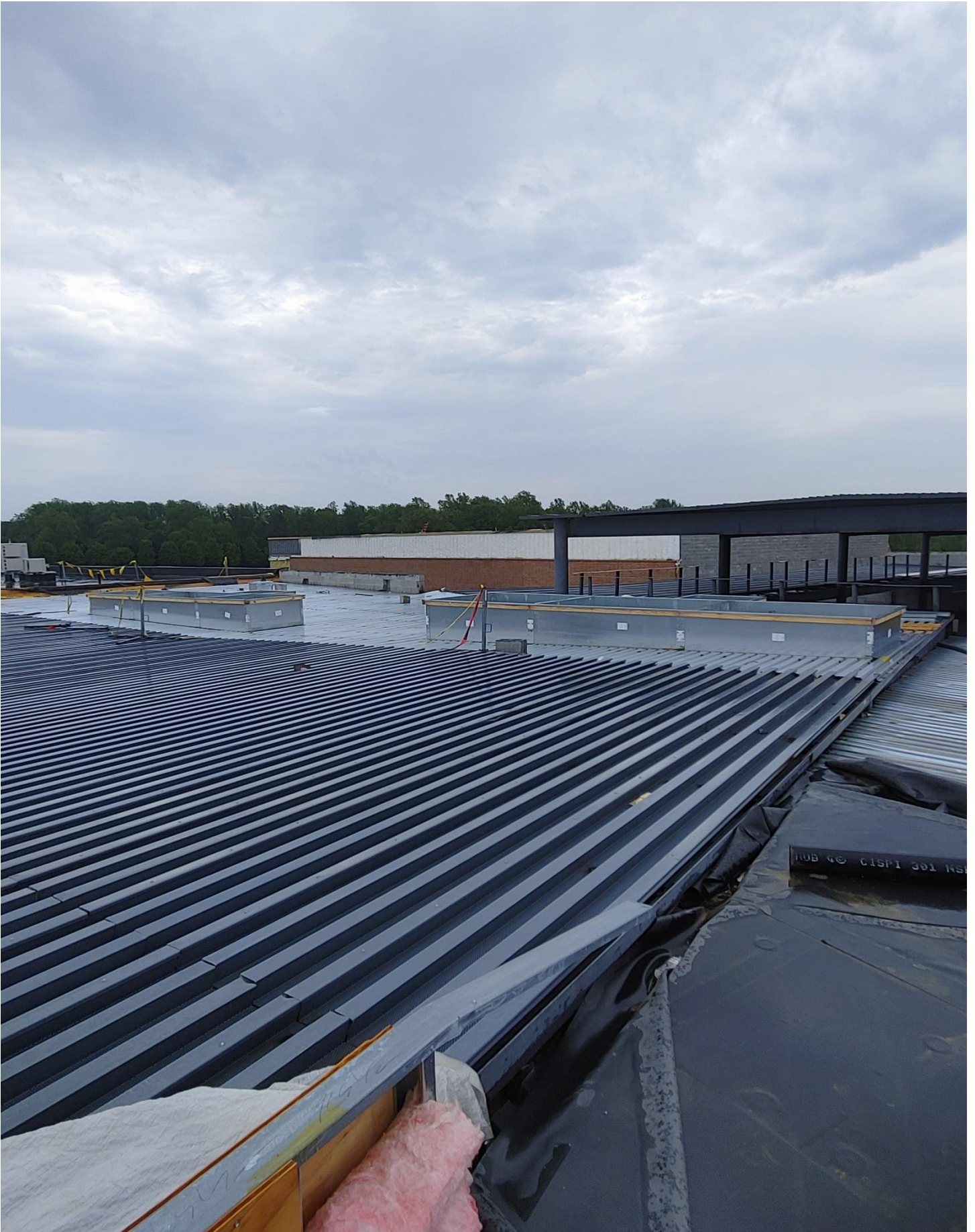
Photo 7 - HVAC equipment curbs being constructed above Area A.