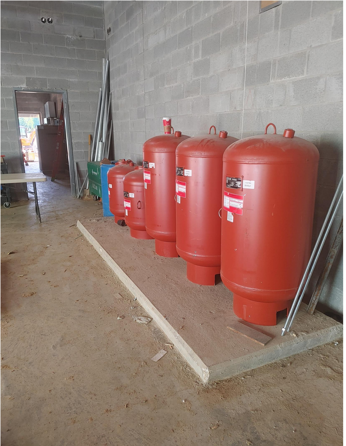
Photo 4 - Expansion Tanks Set in Area D