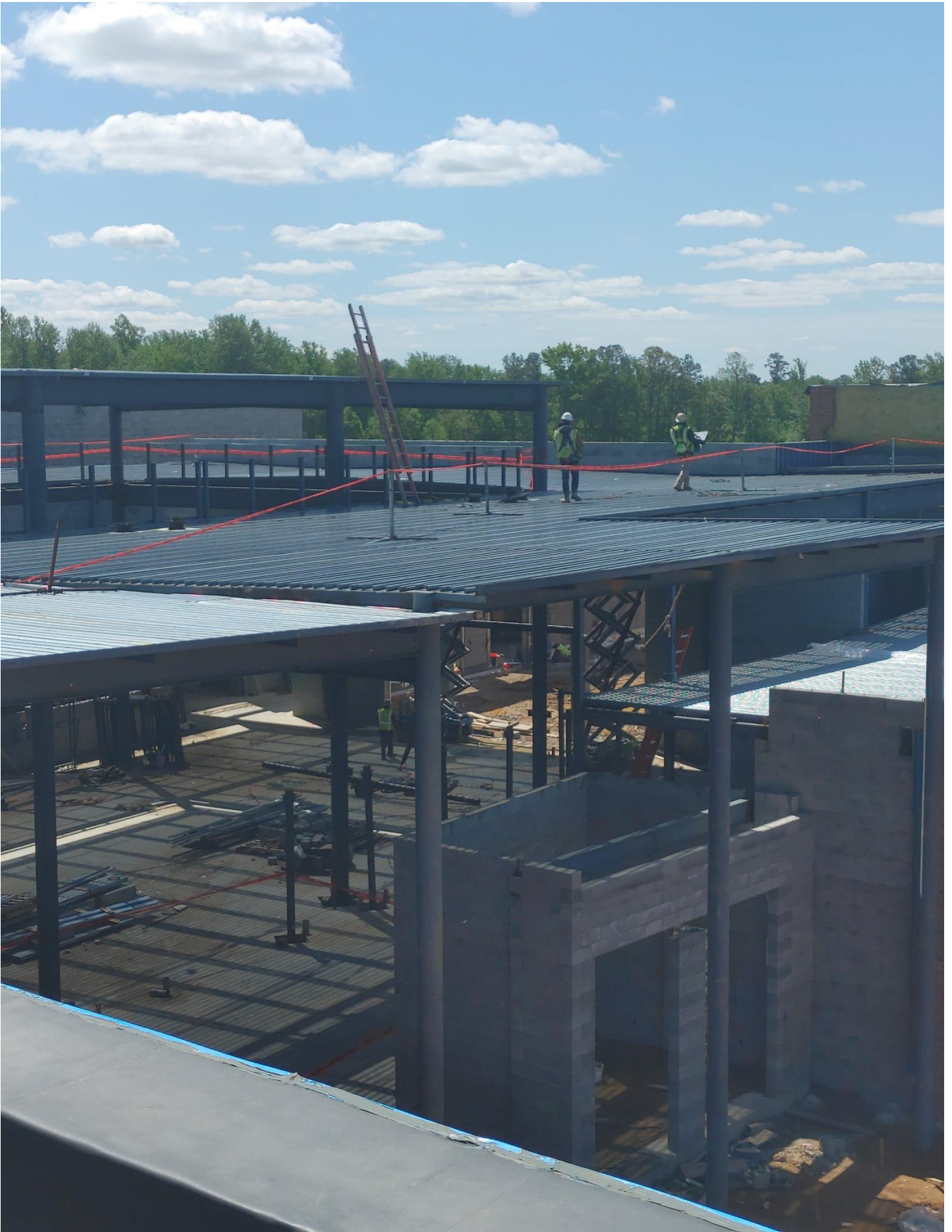
Photo 12 - Roof Drains being set in Area C