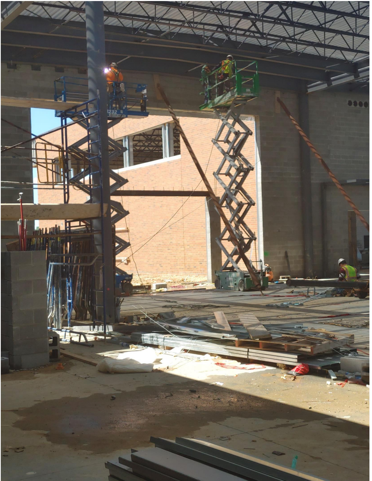
Photo 6 - Steel being welded in Area C