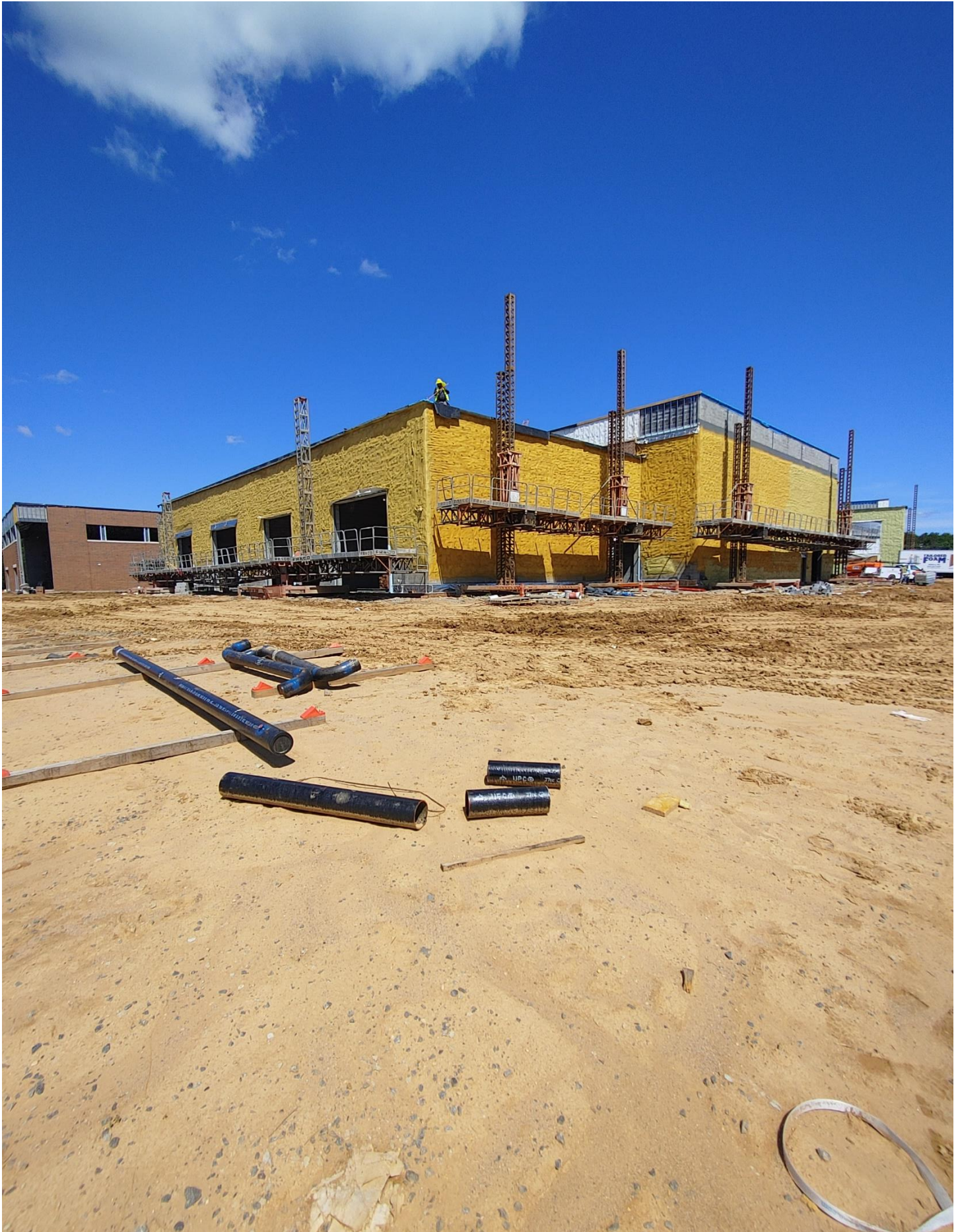
Photo 8 - Fraco Scaffolding has been erected on the East and South side of Areas D and on the East Side of Area A