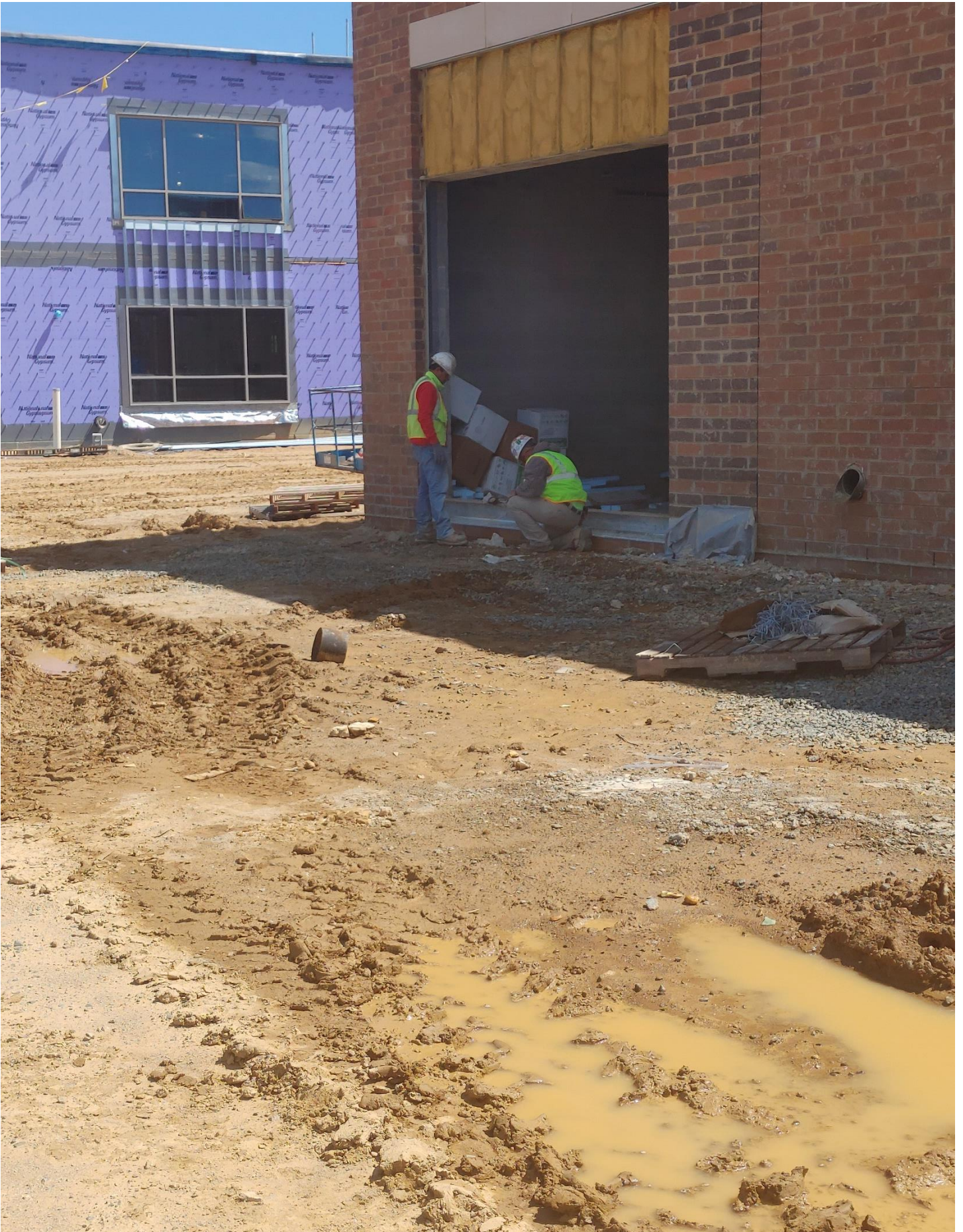
Photo 10 - Display Nook on the West side of Area E is being flashed.