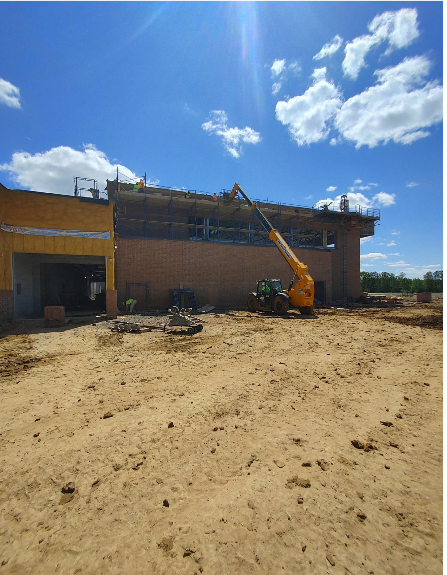
Photo 9 - Masons are laying Brick on the West side of Area E