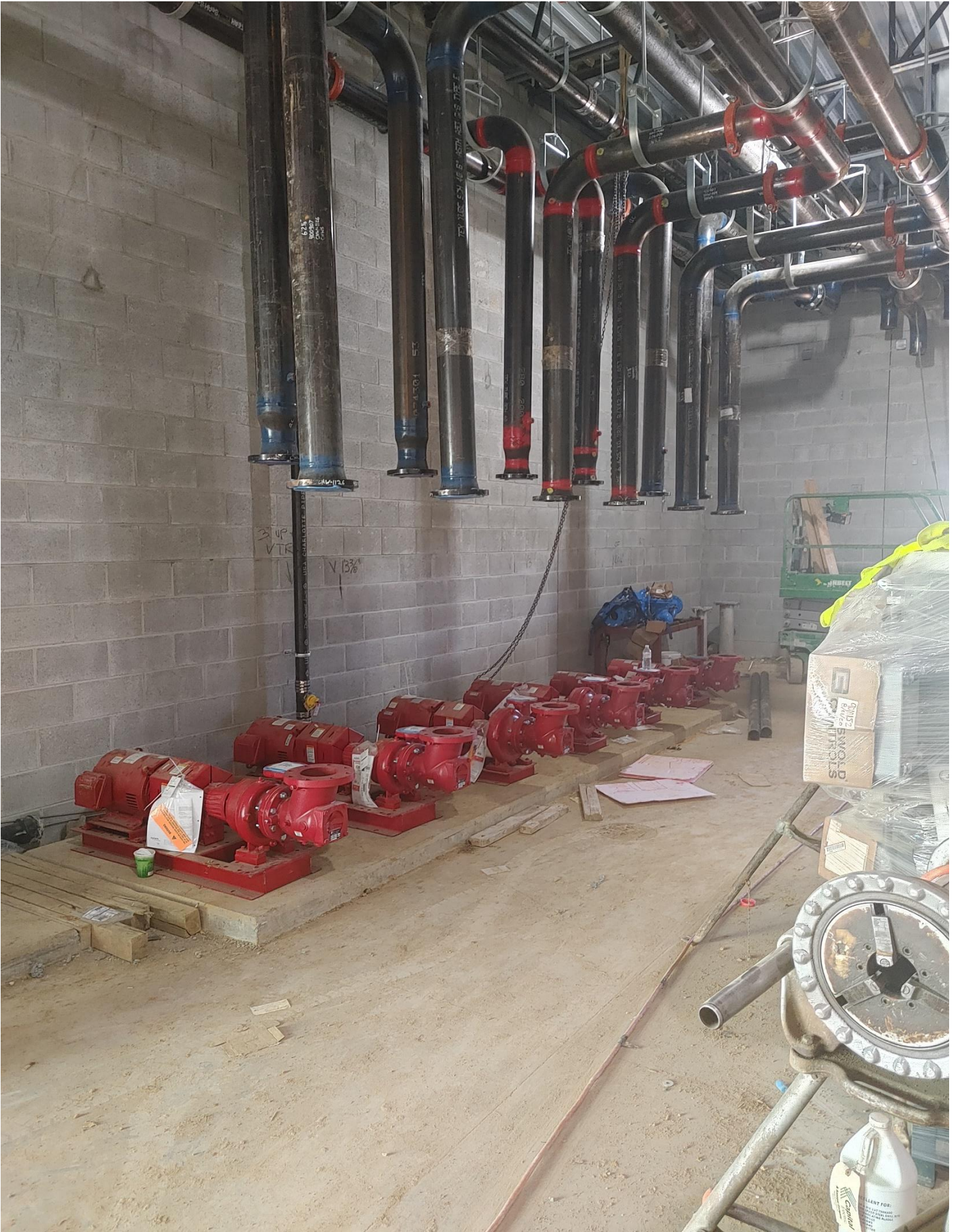
Photo 3 - Circulating Pumps set in Area D