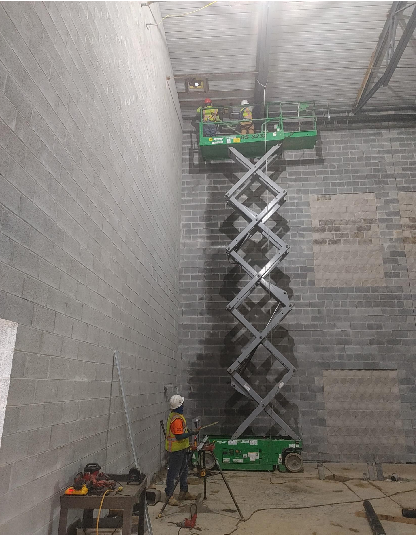
Photo 7 - Pipe is being connected to Roof Drains in Area D Auditorium