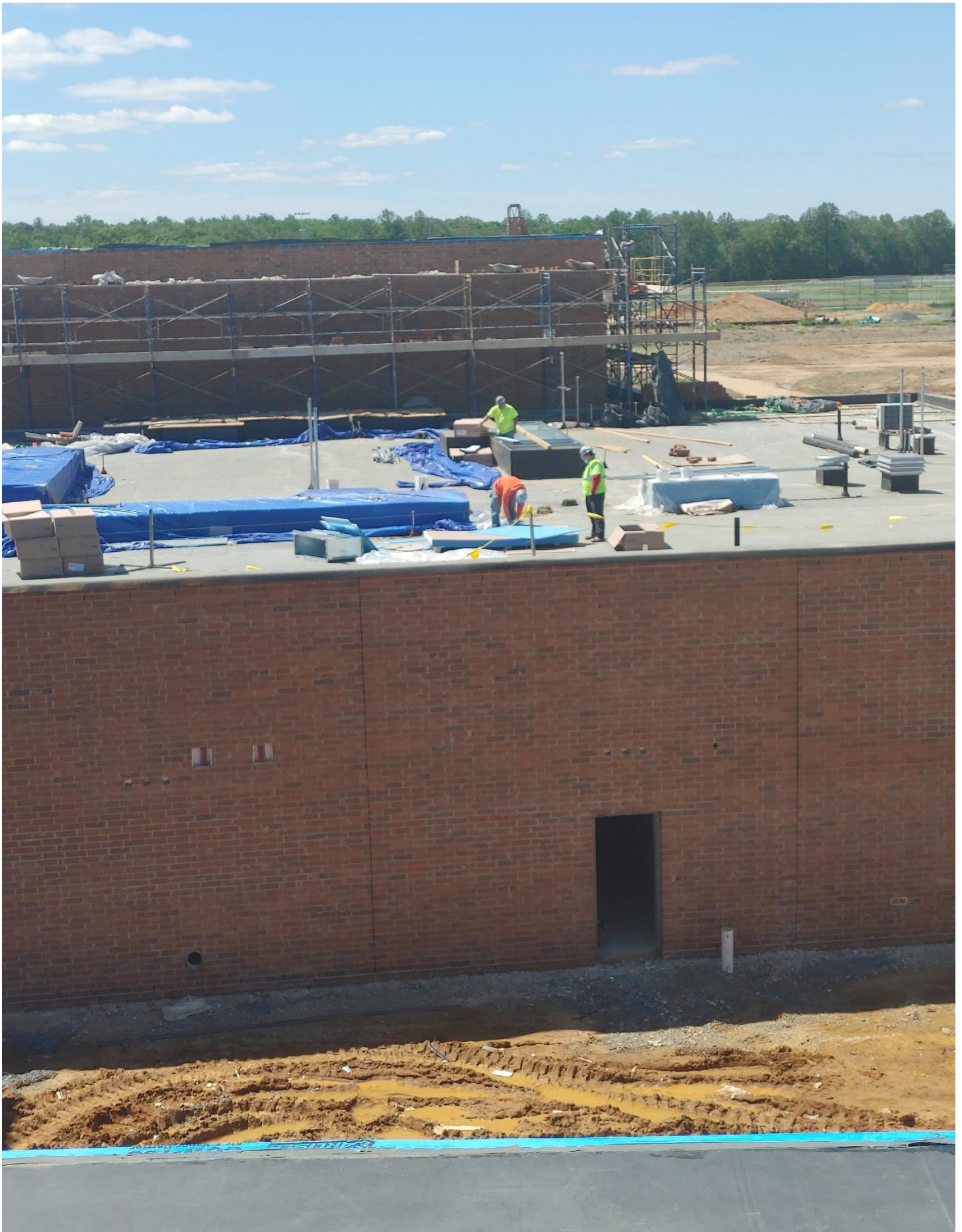
Photo 13 - Colonial Webb working on Curbs on the Roof of Area E