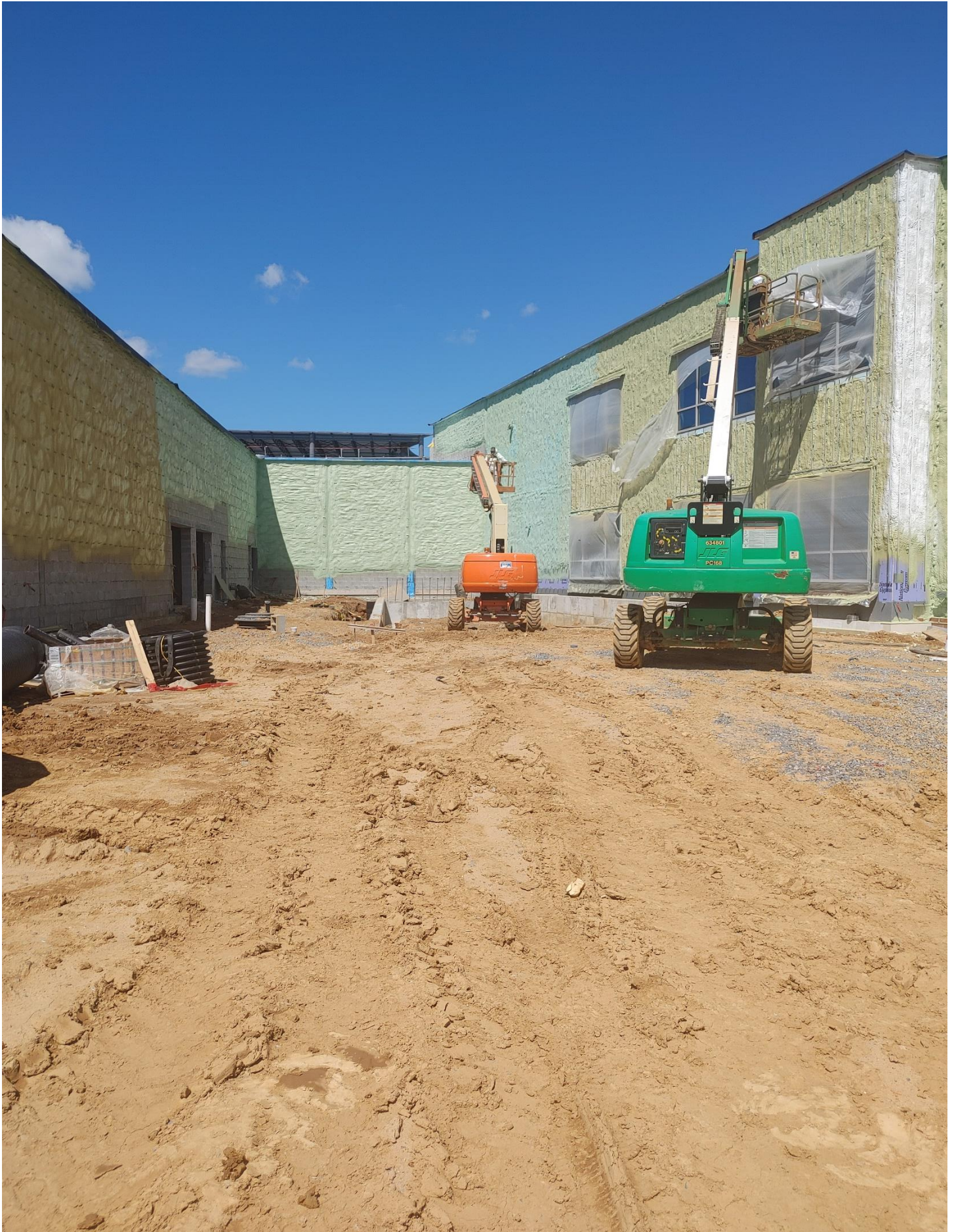
Photo 2 - Spray foam being applied to the East side of Area C