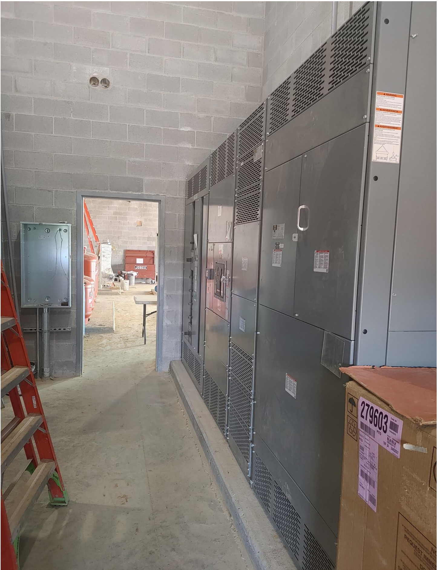
Photo 5 - Switch Gears in the Electrical Room of Area D