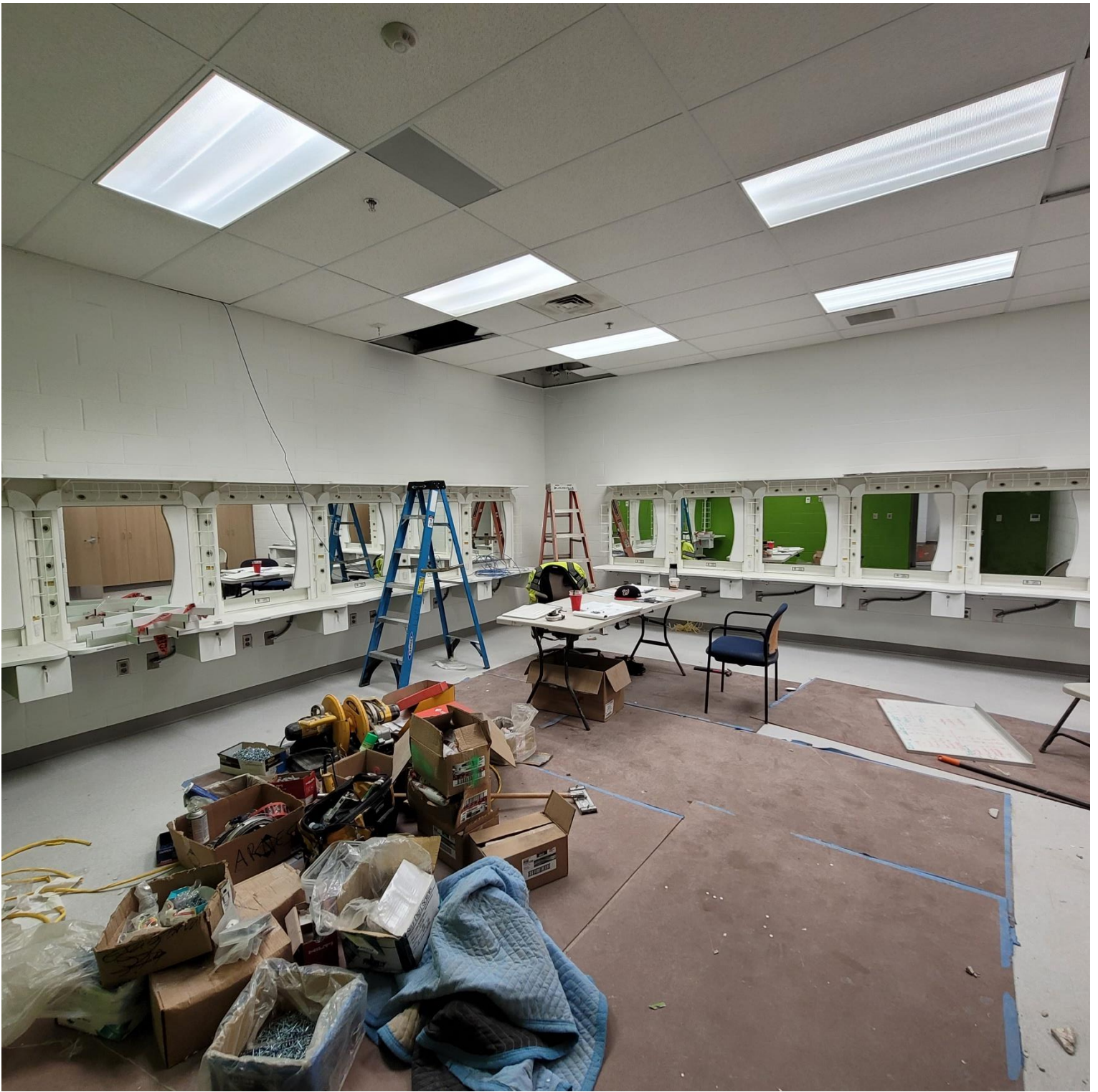
Photo 8 - Dressing Room D132