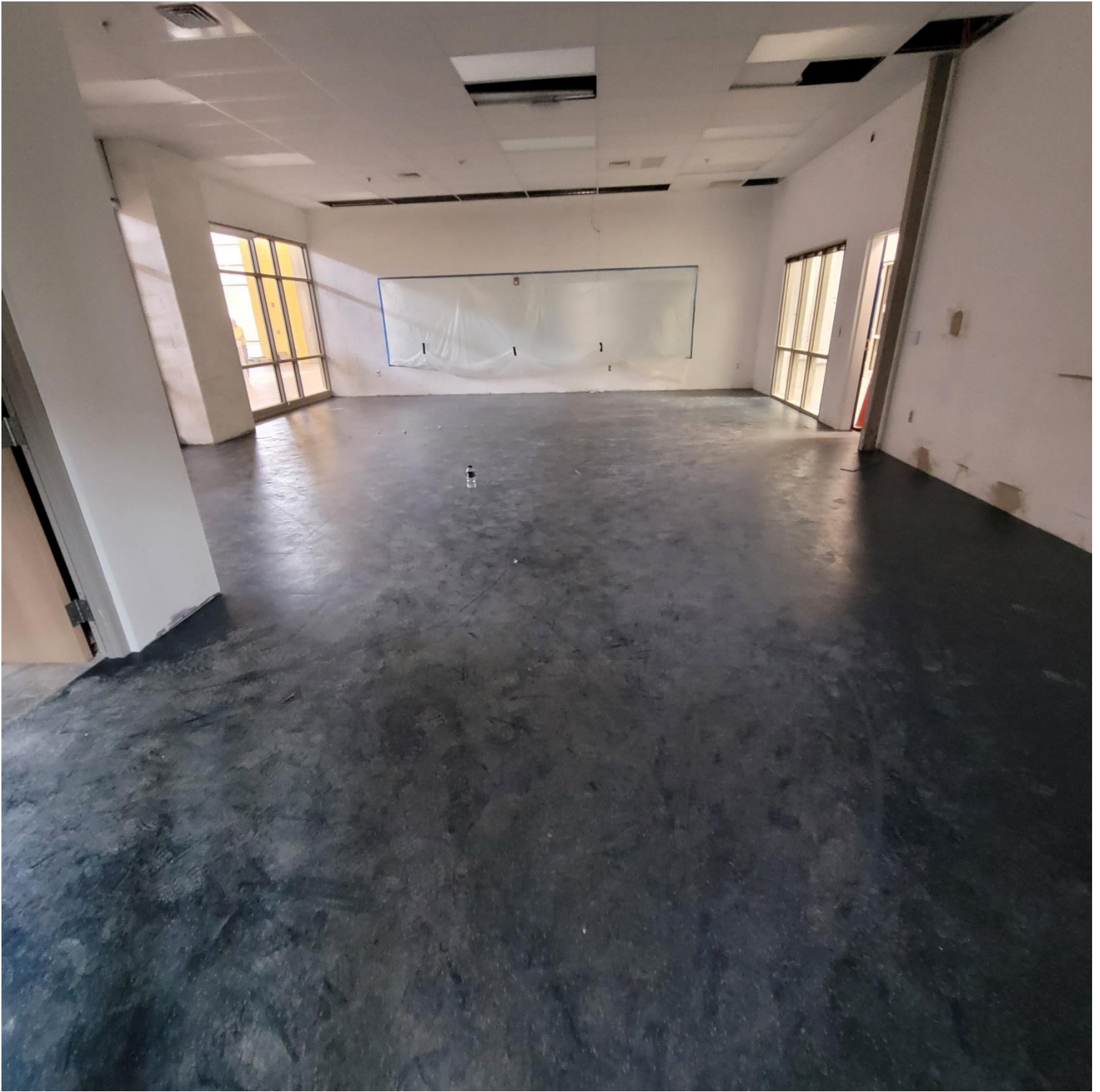
Photo 12 - Fitness E122 Floor has been installed