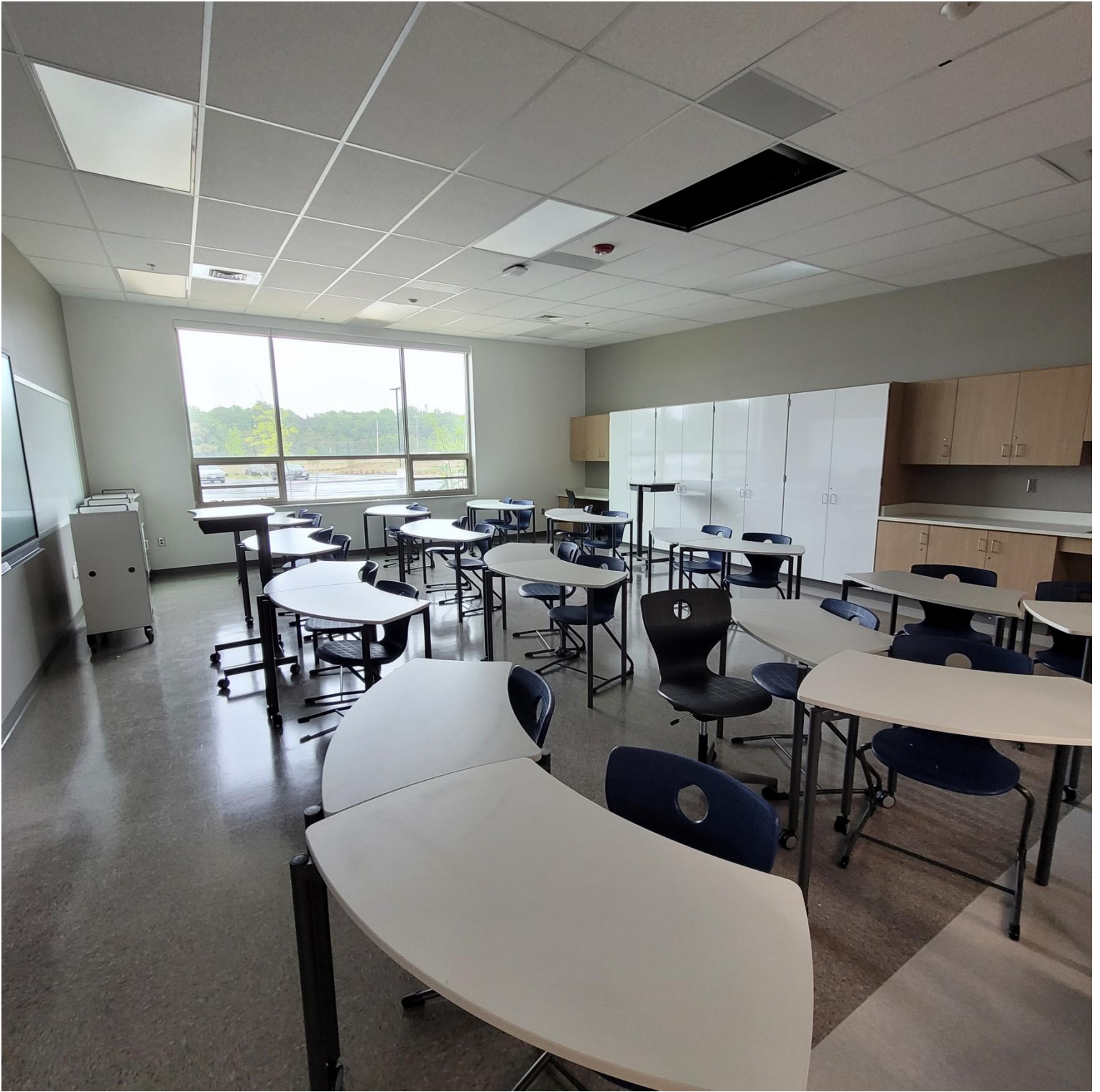
Photo 18 - Furniture has been set up in one of the Learning Studios