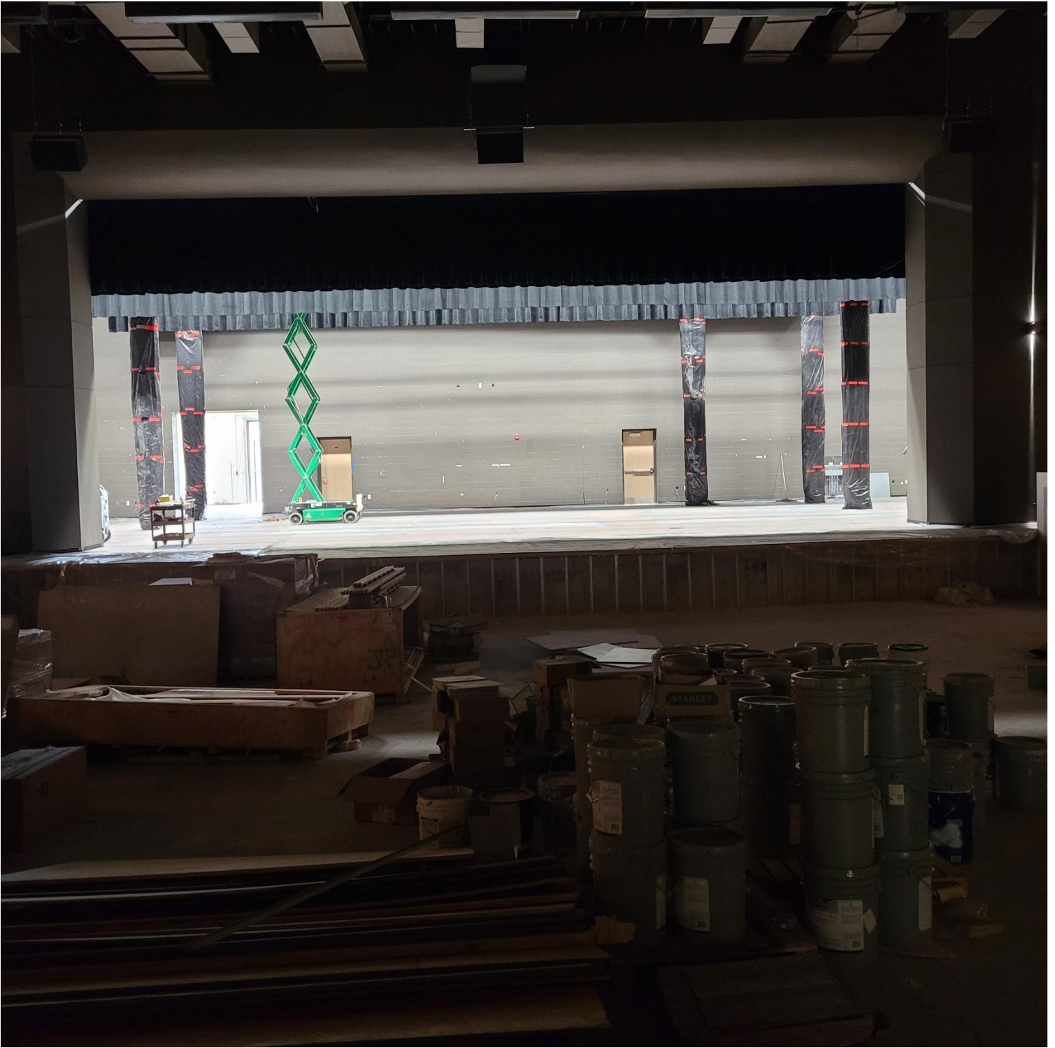
Photo 7 - Stage Curtains have been installed