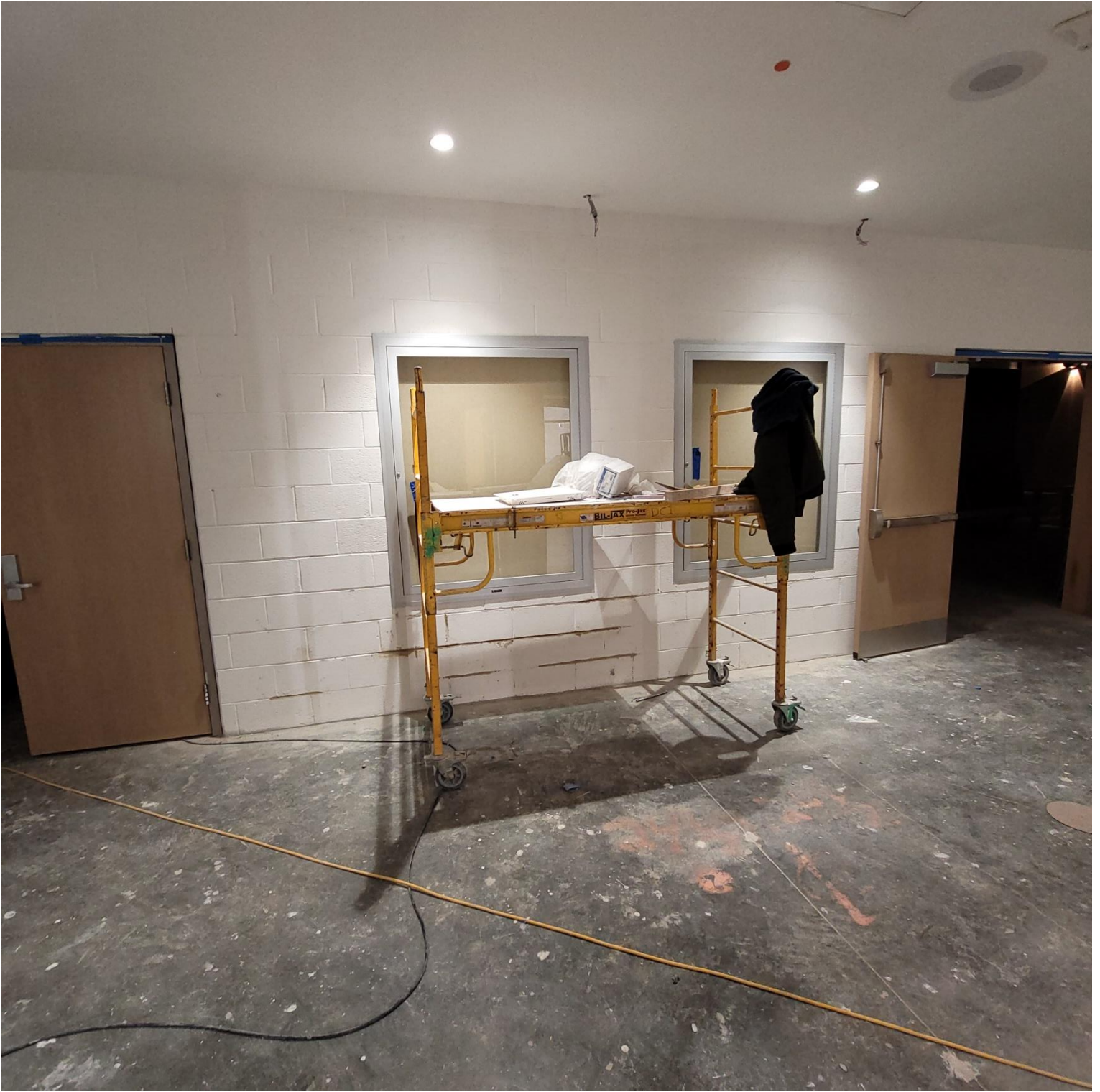
Photo 6 - Marquee Boards and door to Auditorium have been installed