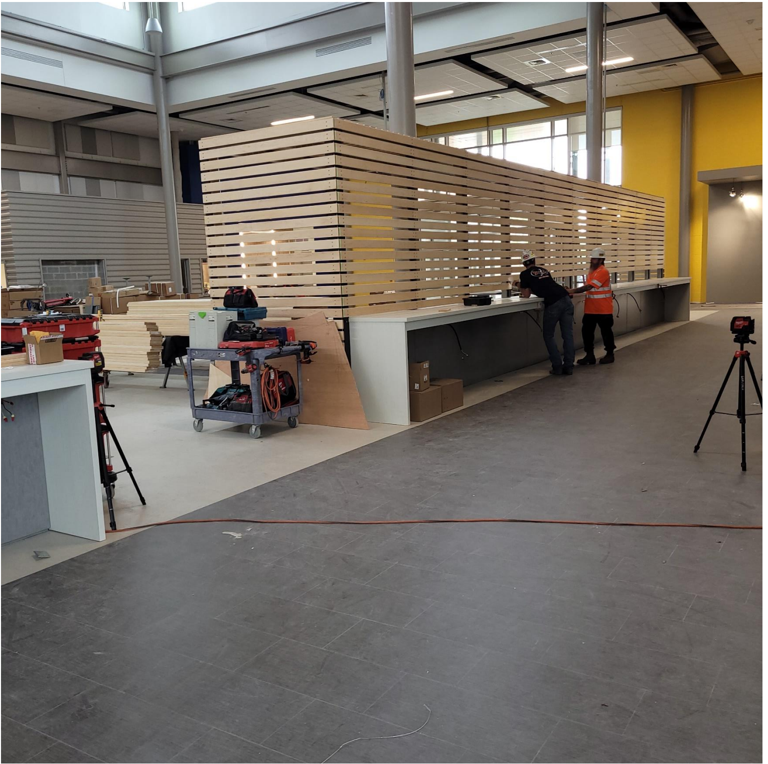
Photo 4 - Work continues in Area C - Commons Area - Wood Slats