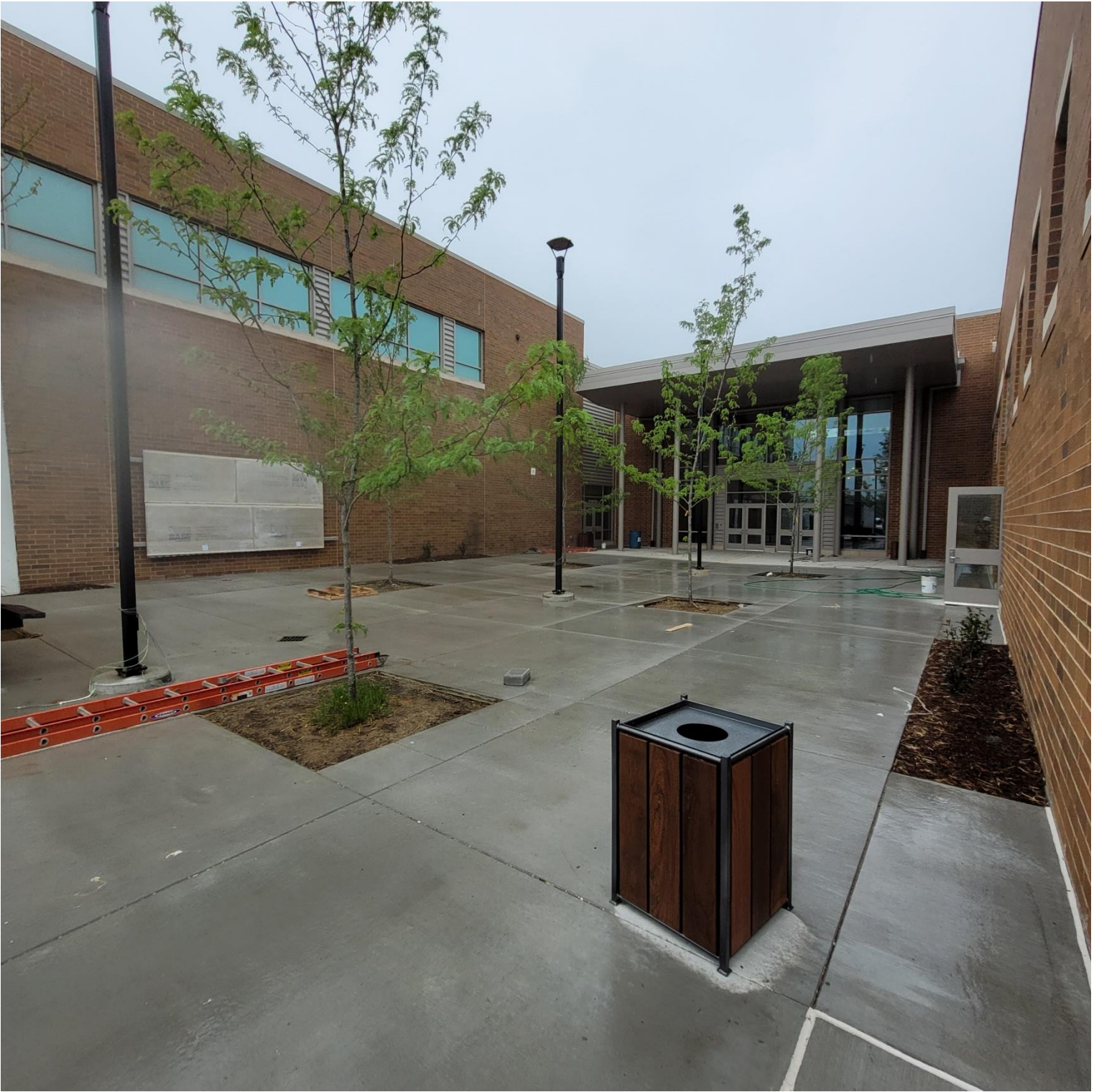
Photo 10 - Court Yard - Southside of Area C