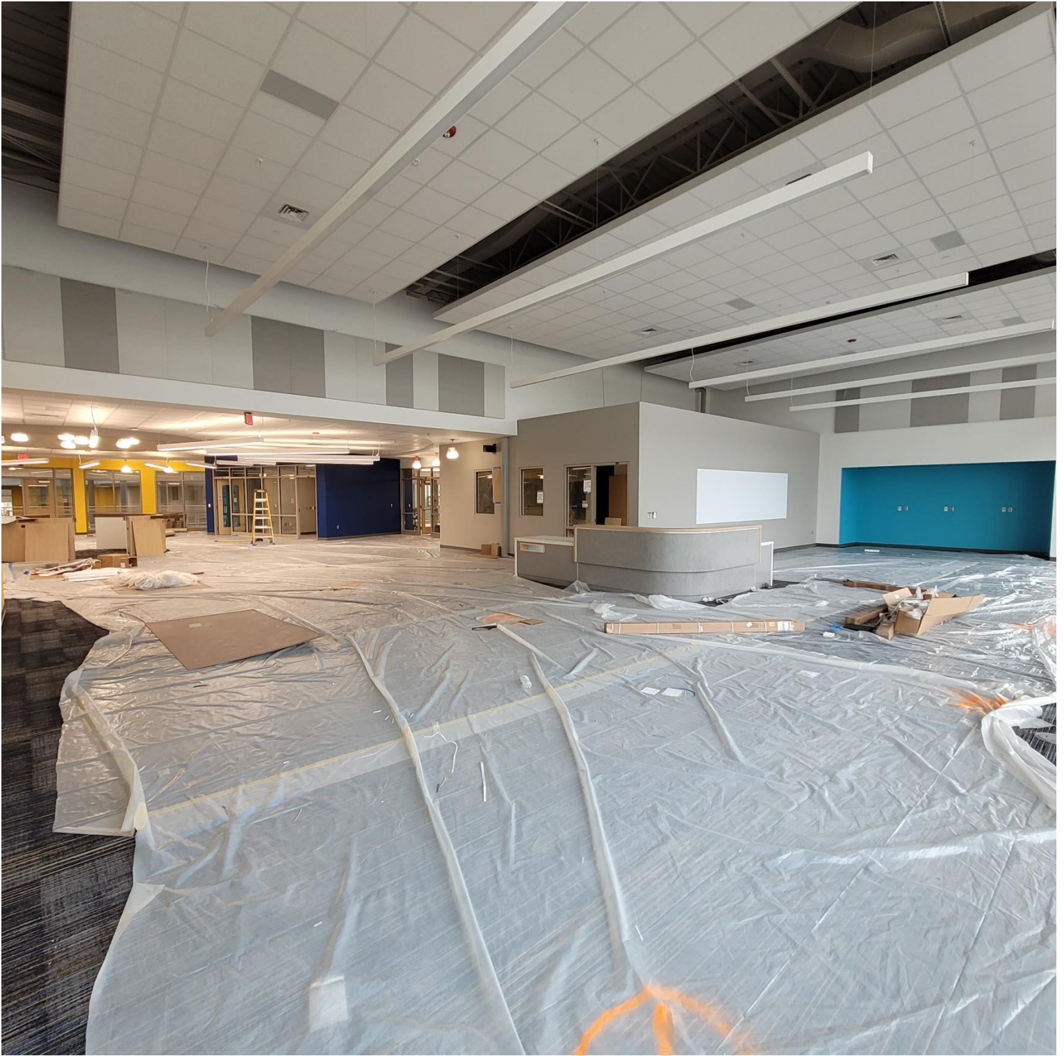
Photo 16 - Innovation Commons A220