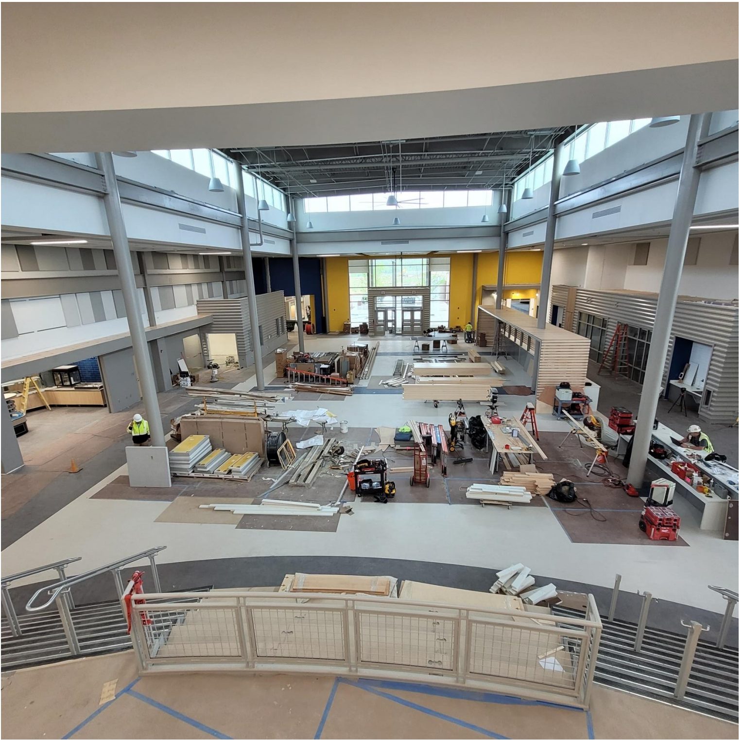
Photo 14 - Area C Mezzanine view