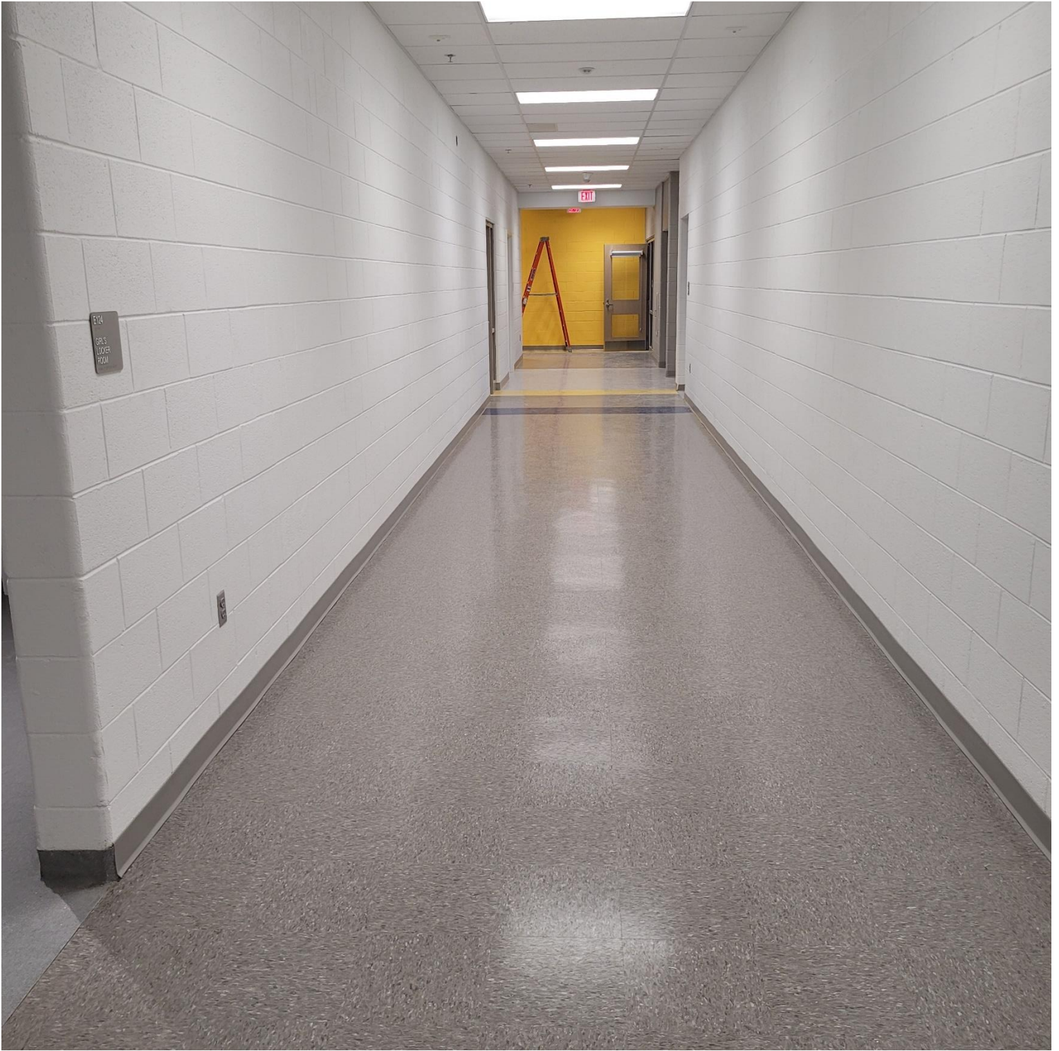
Photo 11 - Corridor E15