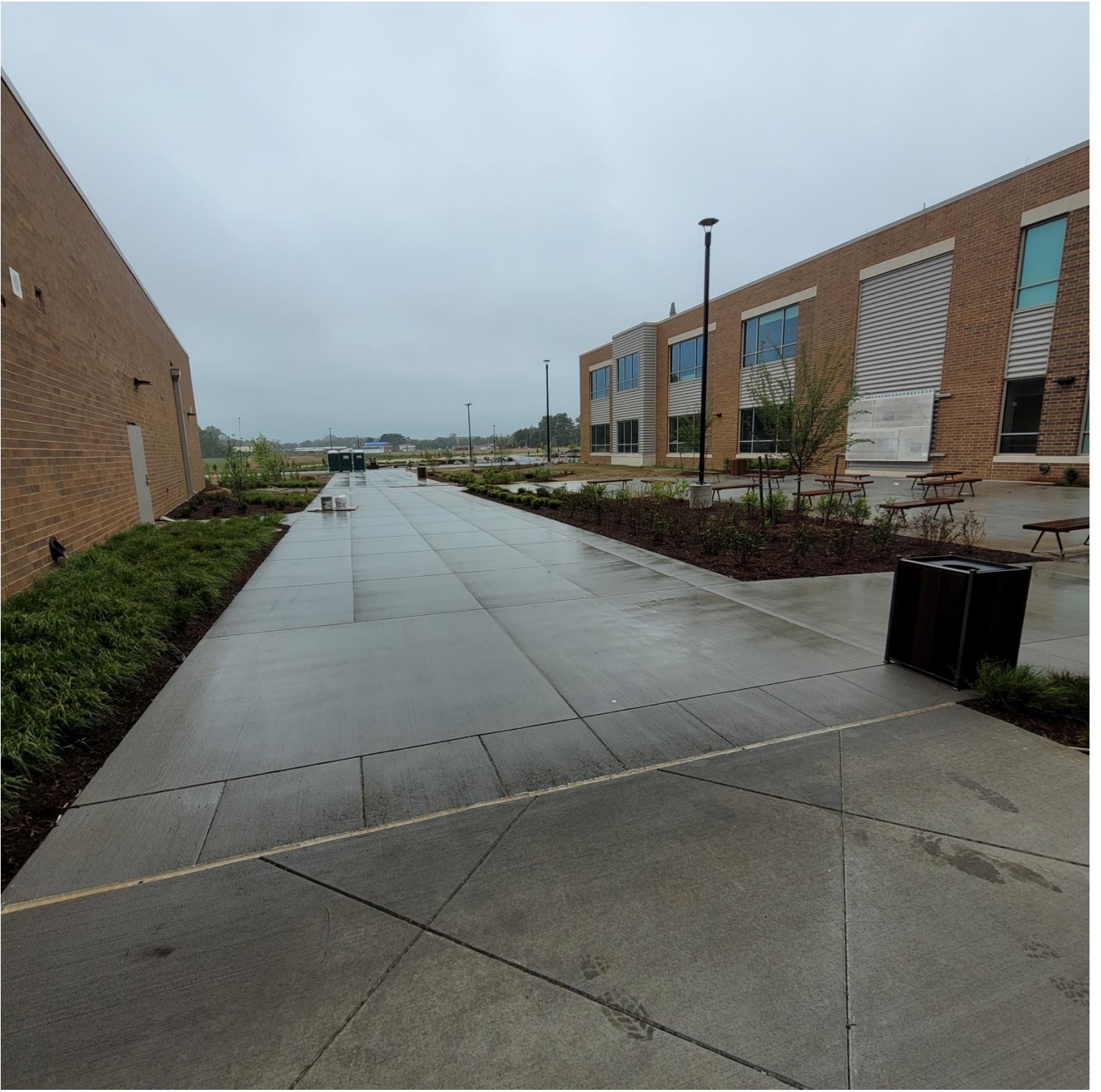
Photo 13 - Court Yard between Areas B & E