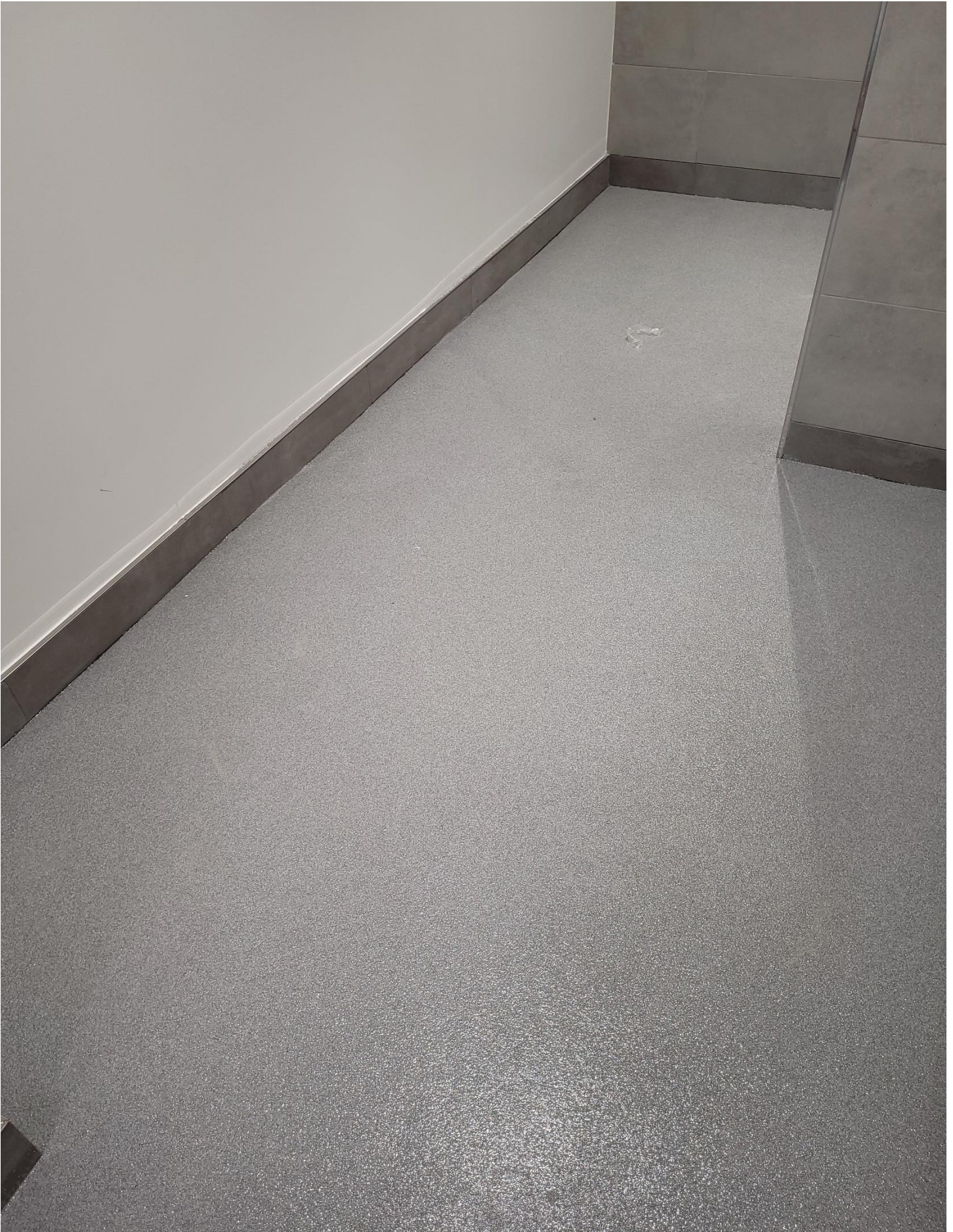
Photo 3 - Diamonds in Restroom are being filled and blended to match existing floor