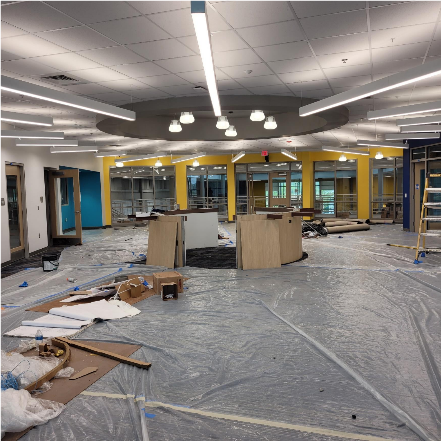
Photo 17 - Innovation Commons A220