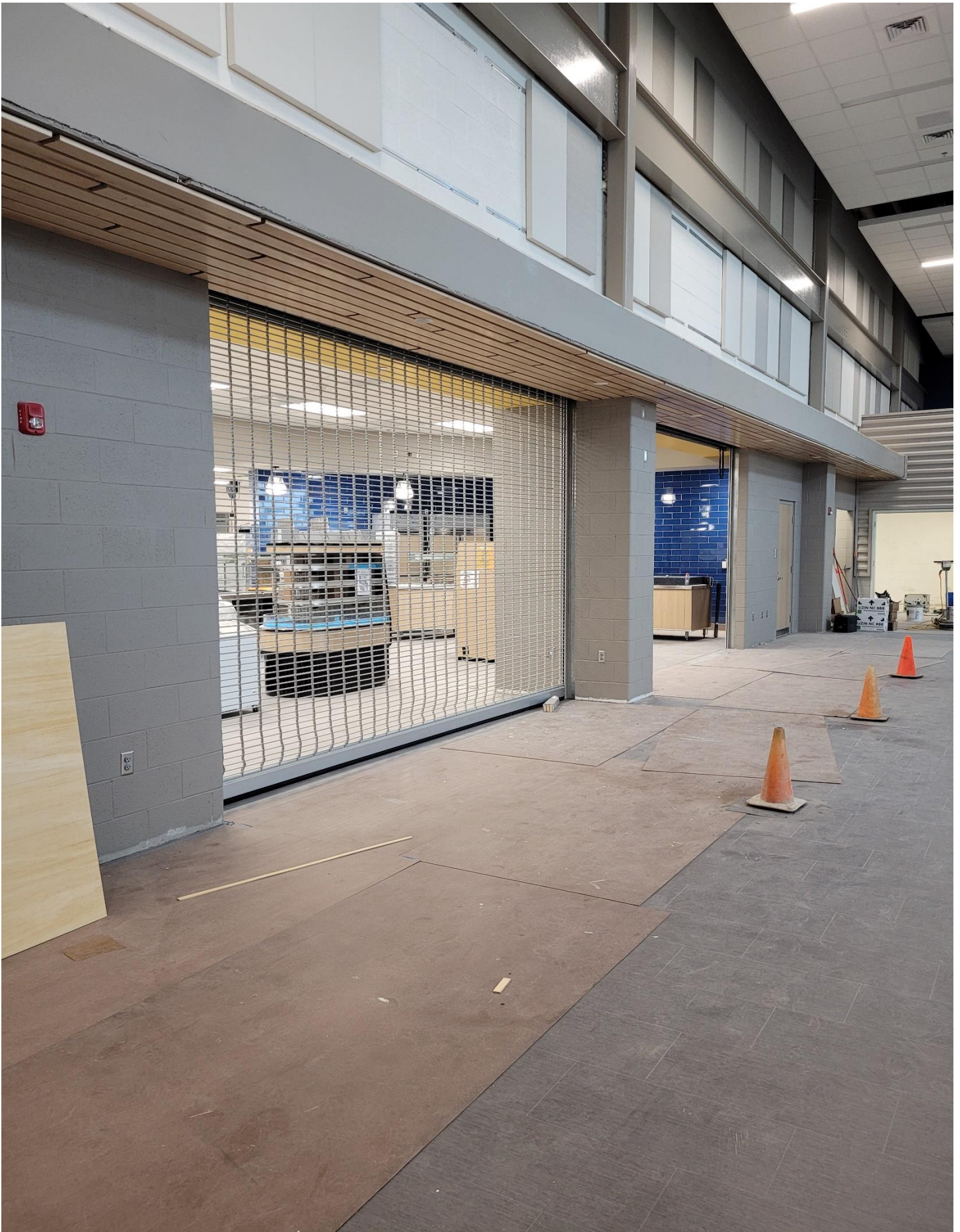
Photo 1 - Kitchen Overhead Roll Up Security Grills have been installed.