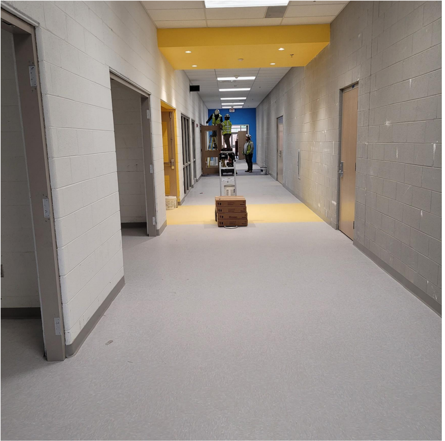
Photo 9 - Tile has been laid and doors are being installed in Corridor D12