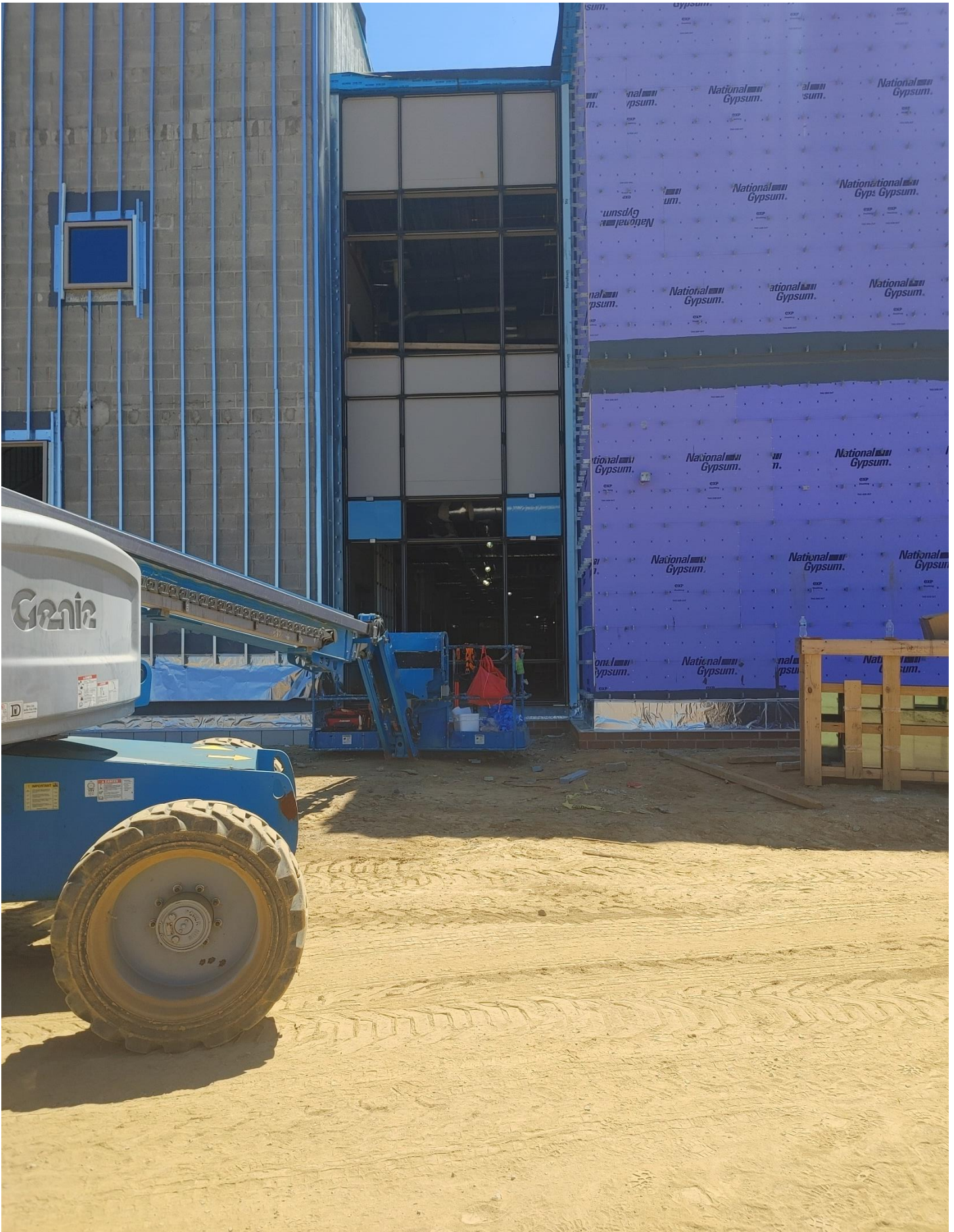
Photo 9 - Glass is being installed in the Curtain Wall on the West side of Area B