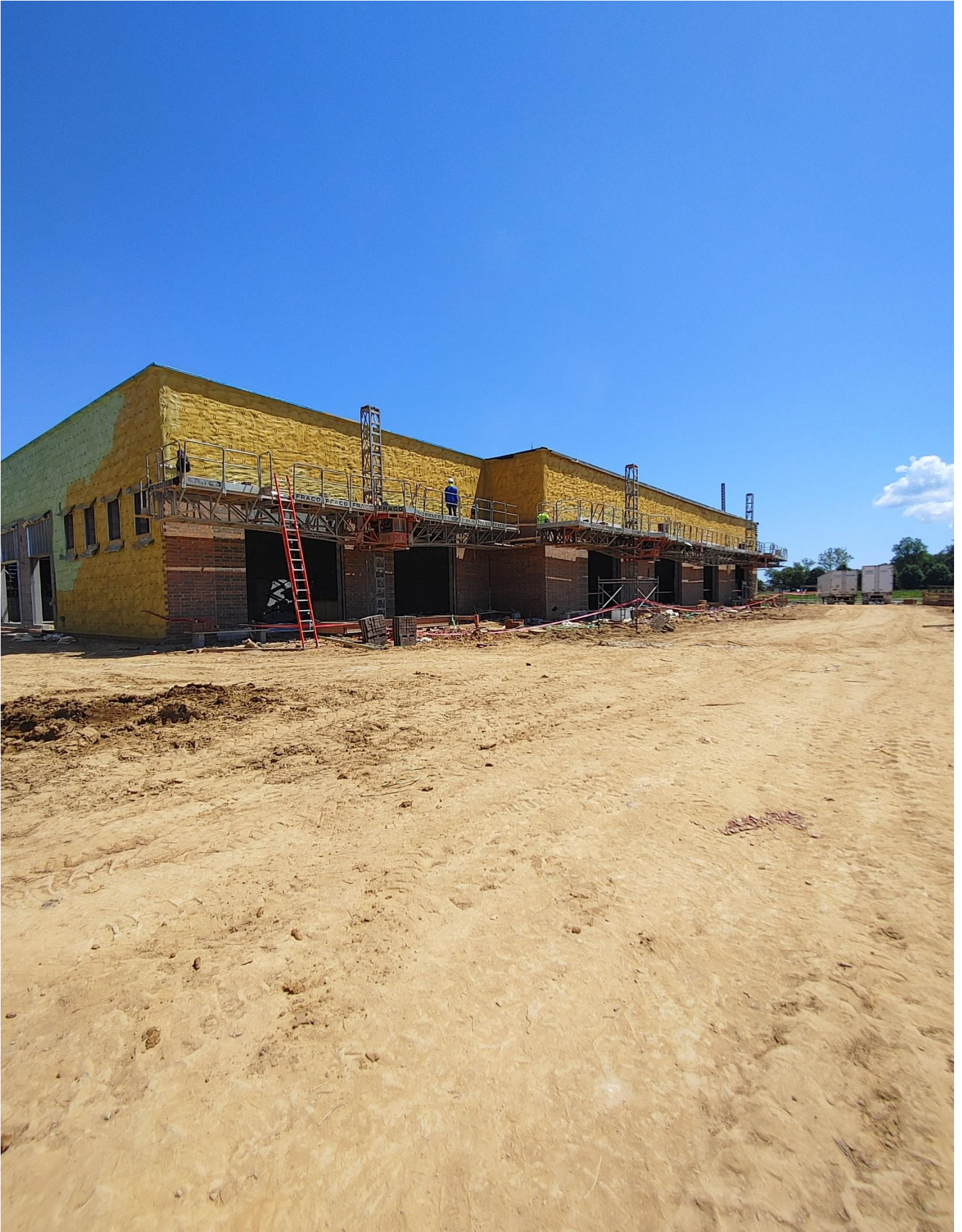
Photo 4 - Brick is being laid on the South side of Area D