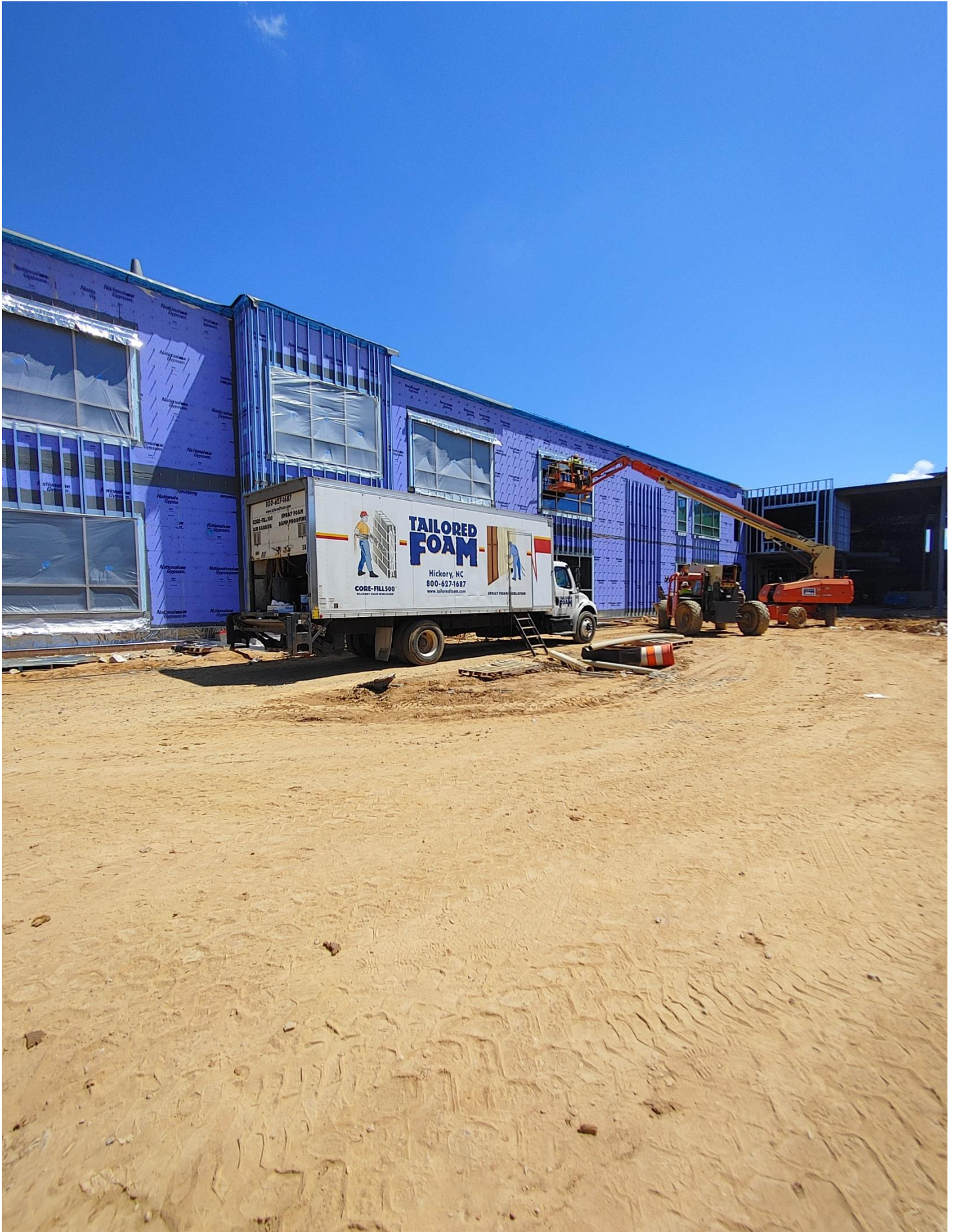
Photo 8 - Tailored Foam setting up on the South side of Area B