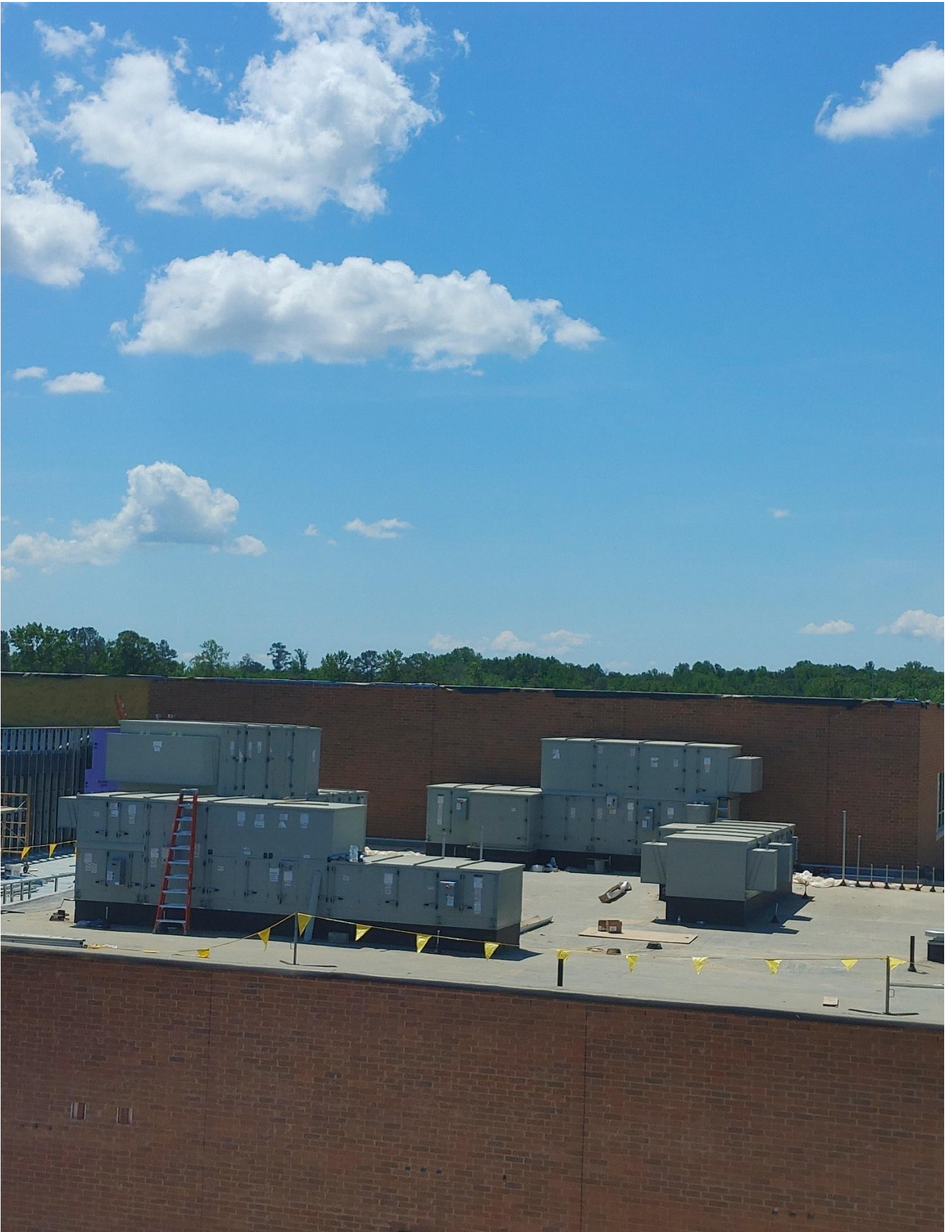
Photo 13 - Roof Top units have been set in Area E