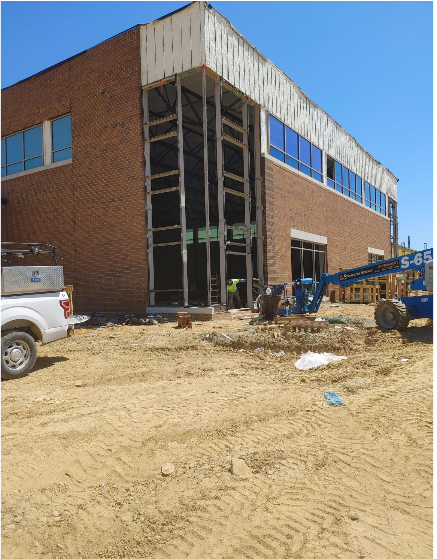
Photo 6 - FG&M working on Curtain Wall on the Southwest corner of Area E