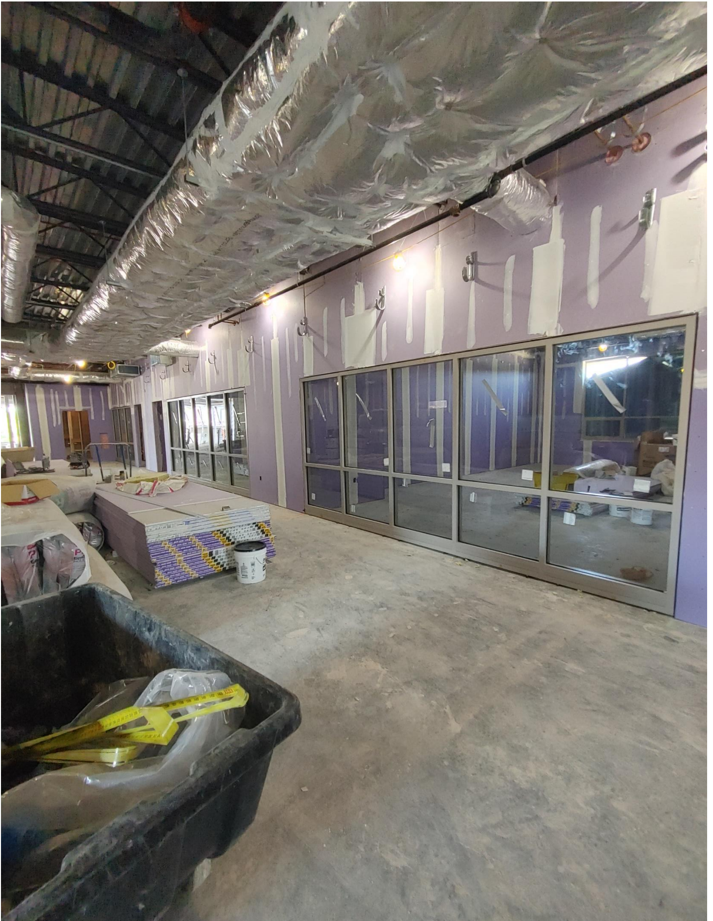
Photo 12 - Glass is being installed in the Storefronts on the 2nd floor of Area A