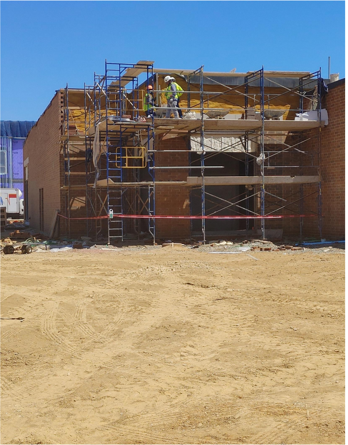
Photo 7 - Brick is being laid on the West side of Area E