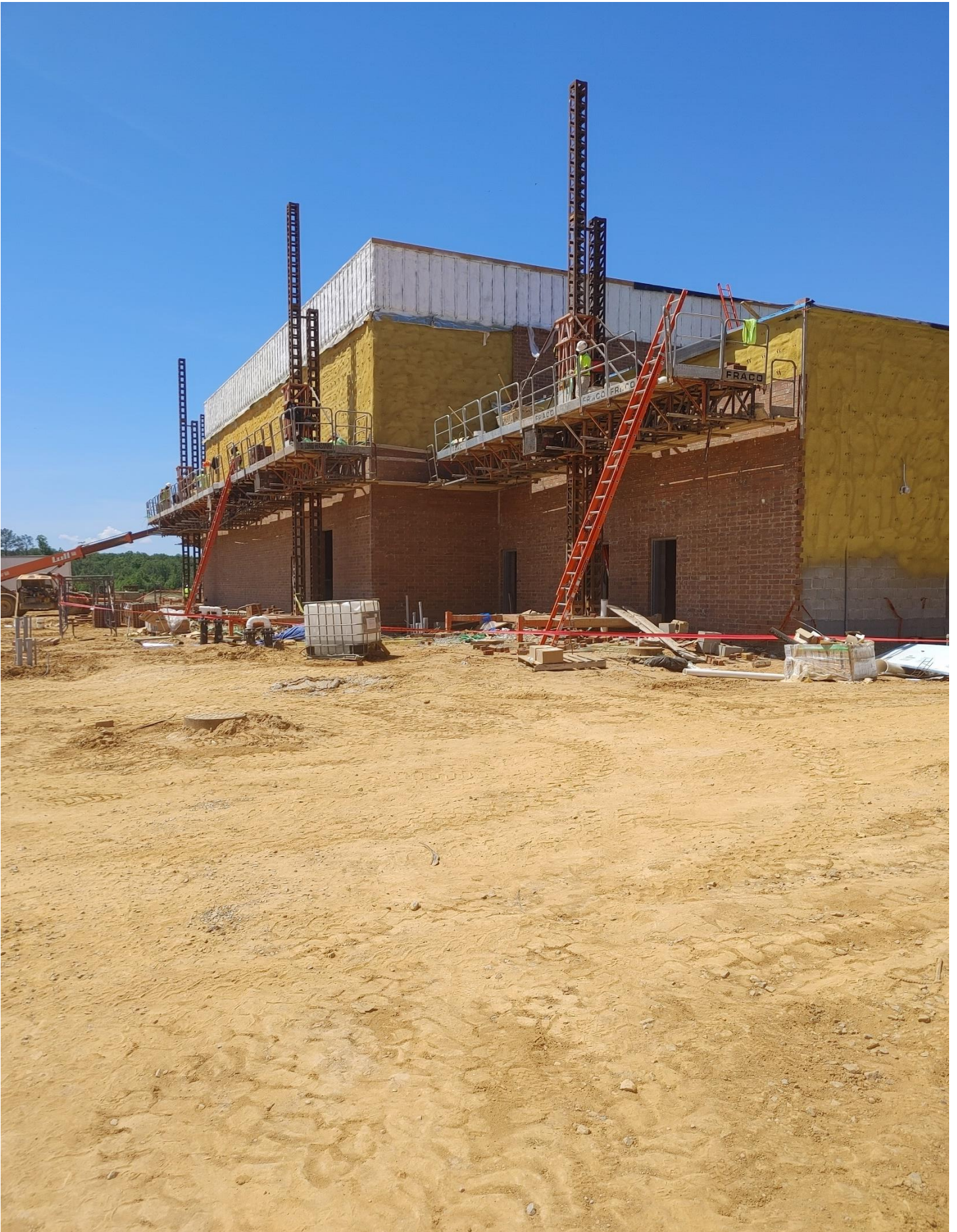
Photo 3 - Masons are laying brick on the East side of Area D