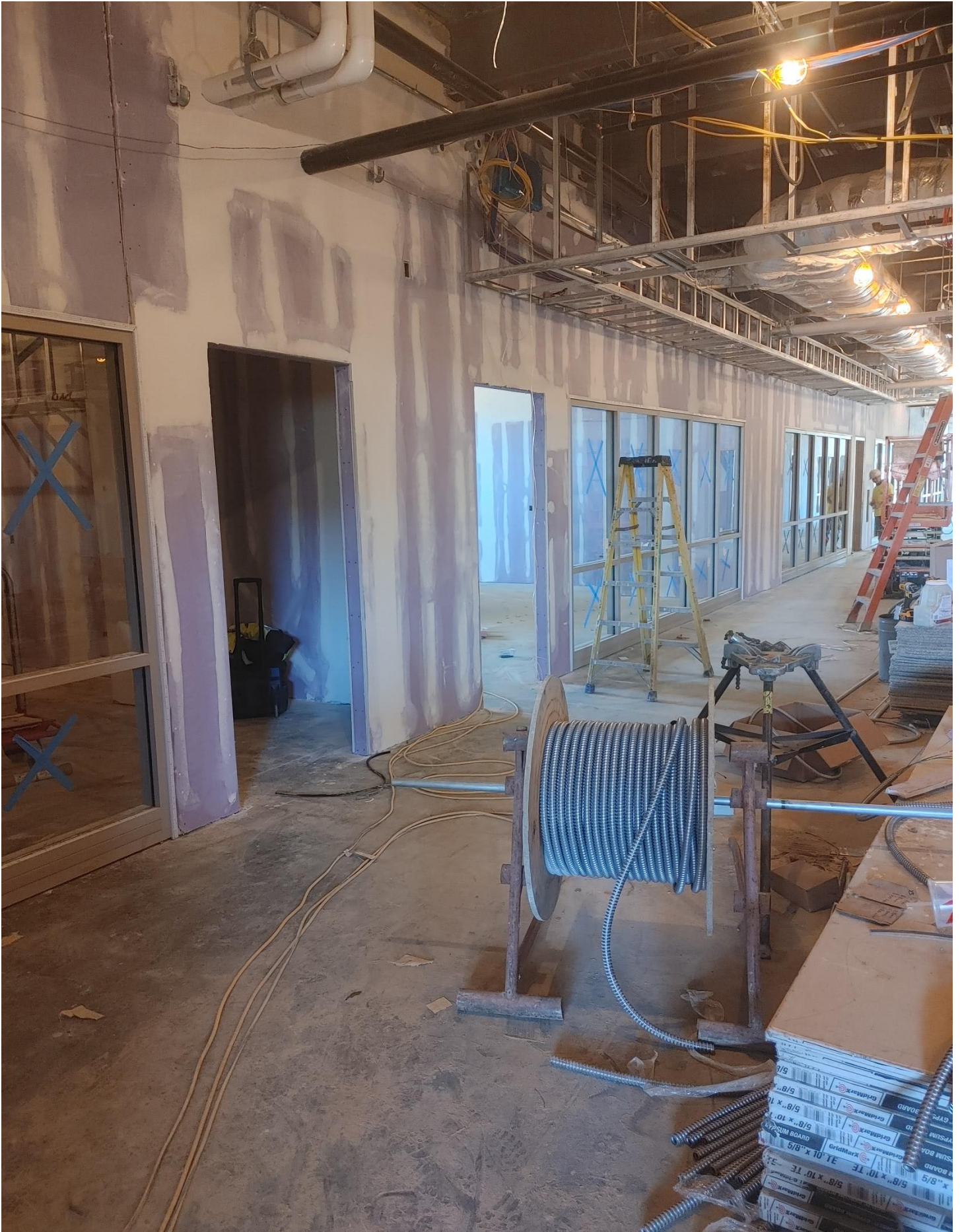
Photo 11 - Glass has been installed in some of the Storefronts on the 1st floor of Area A