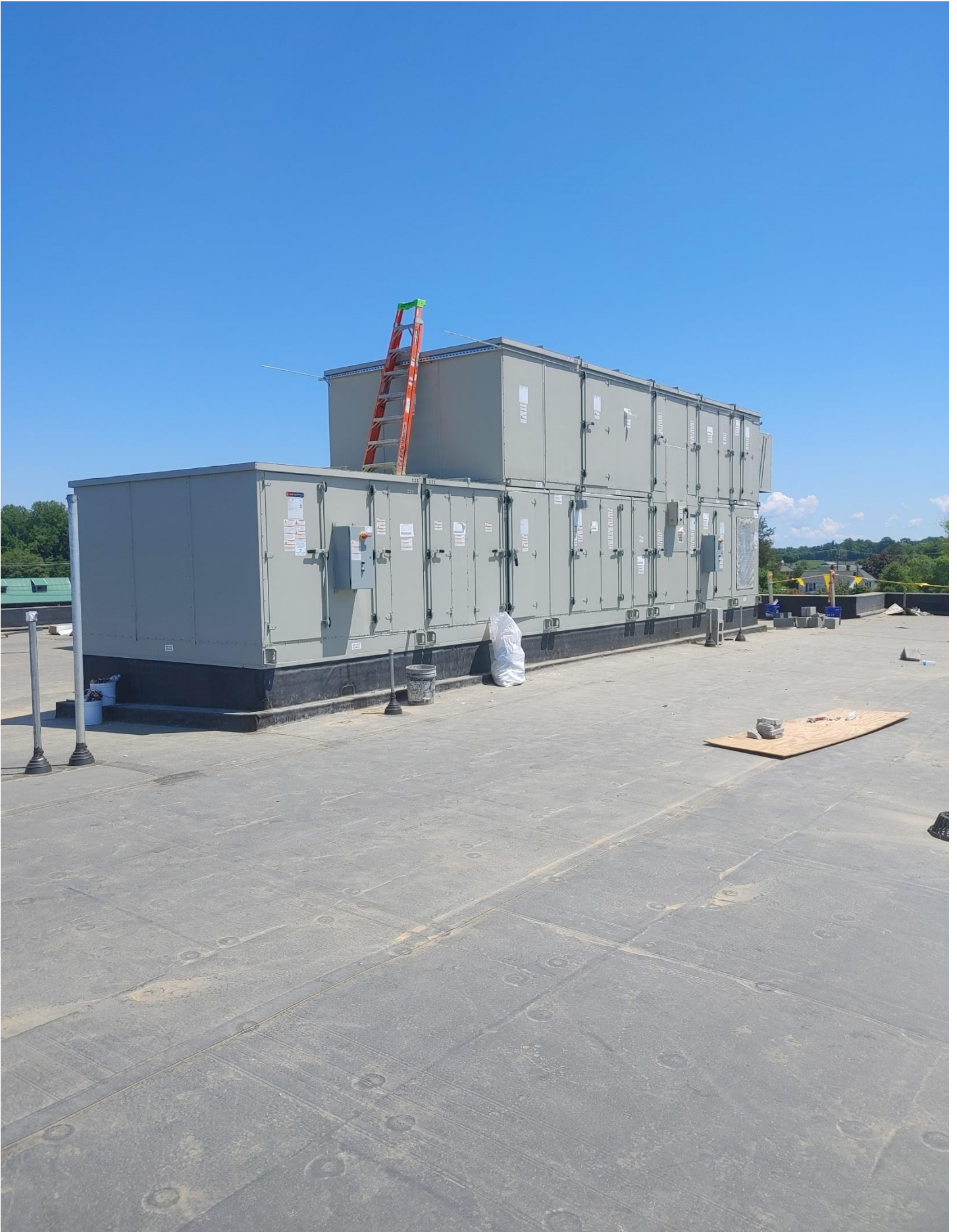
Photo 14 - Roof Top Unit has been set in Area A