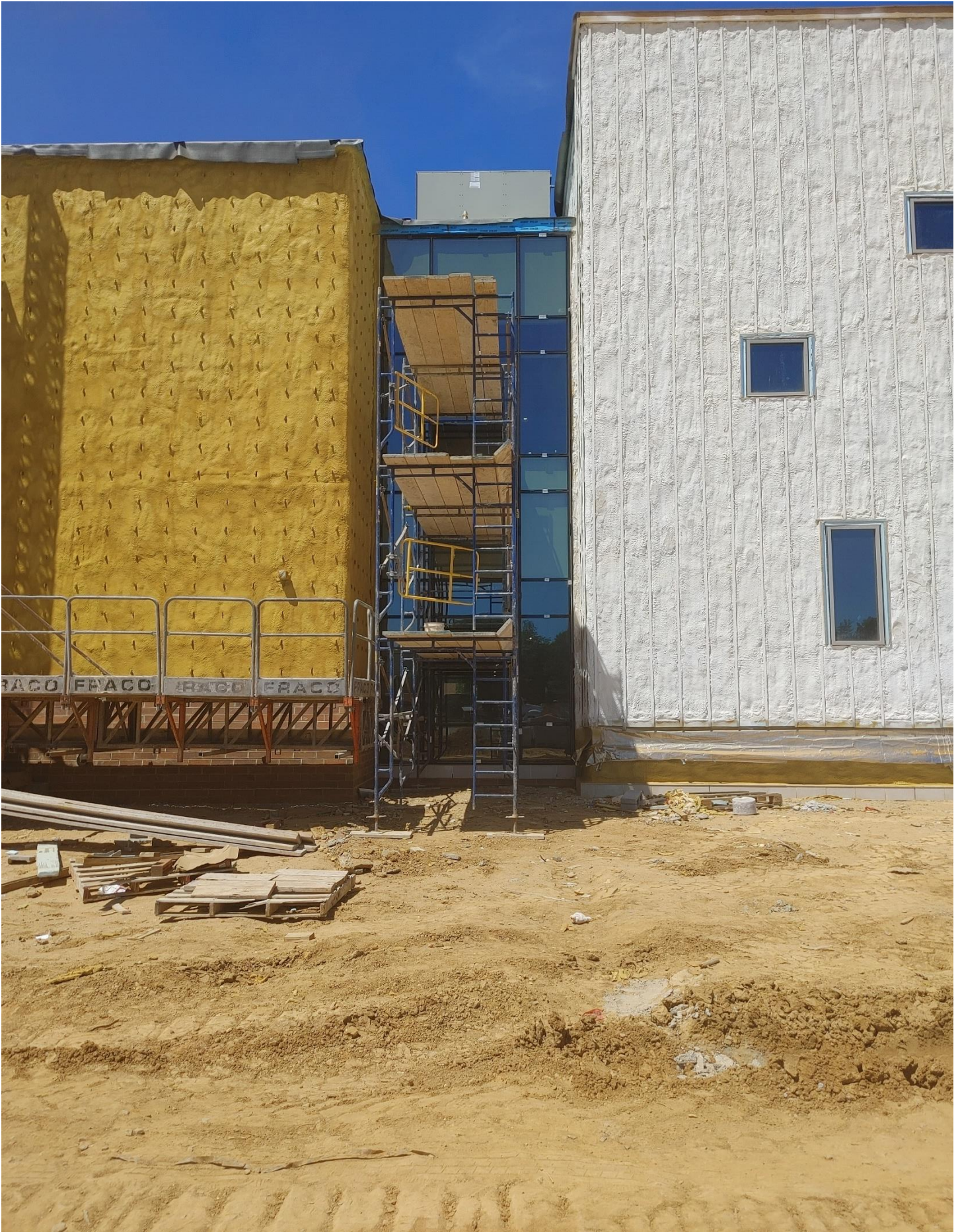
Photo 2 - Glass has been installed in the Curtain Wall on the East side of Area A