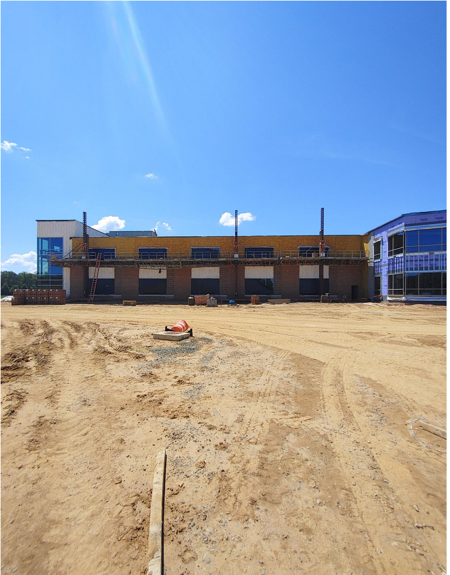
Photo 1 - Brick continues to be laid on the North side of Area A