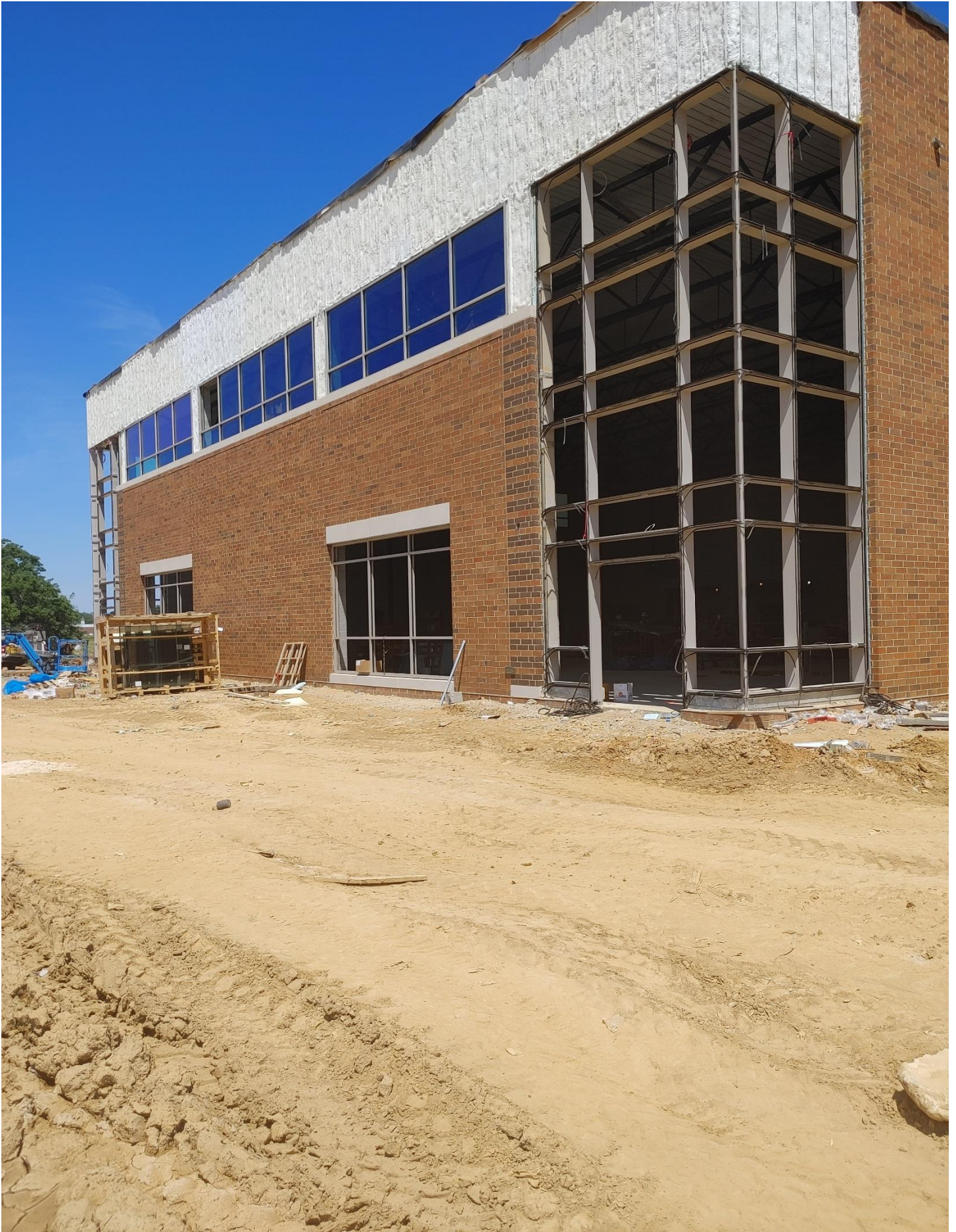
Photo 5 - Progress is being made on the Gymnasium Curtain Walls and Store Fronts