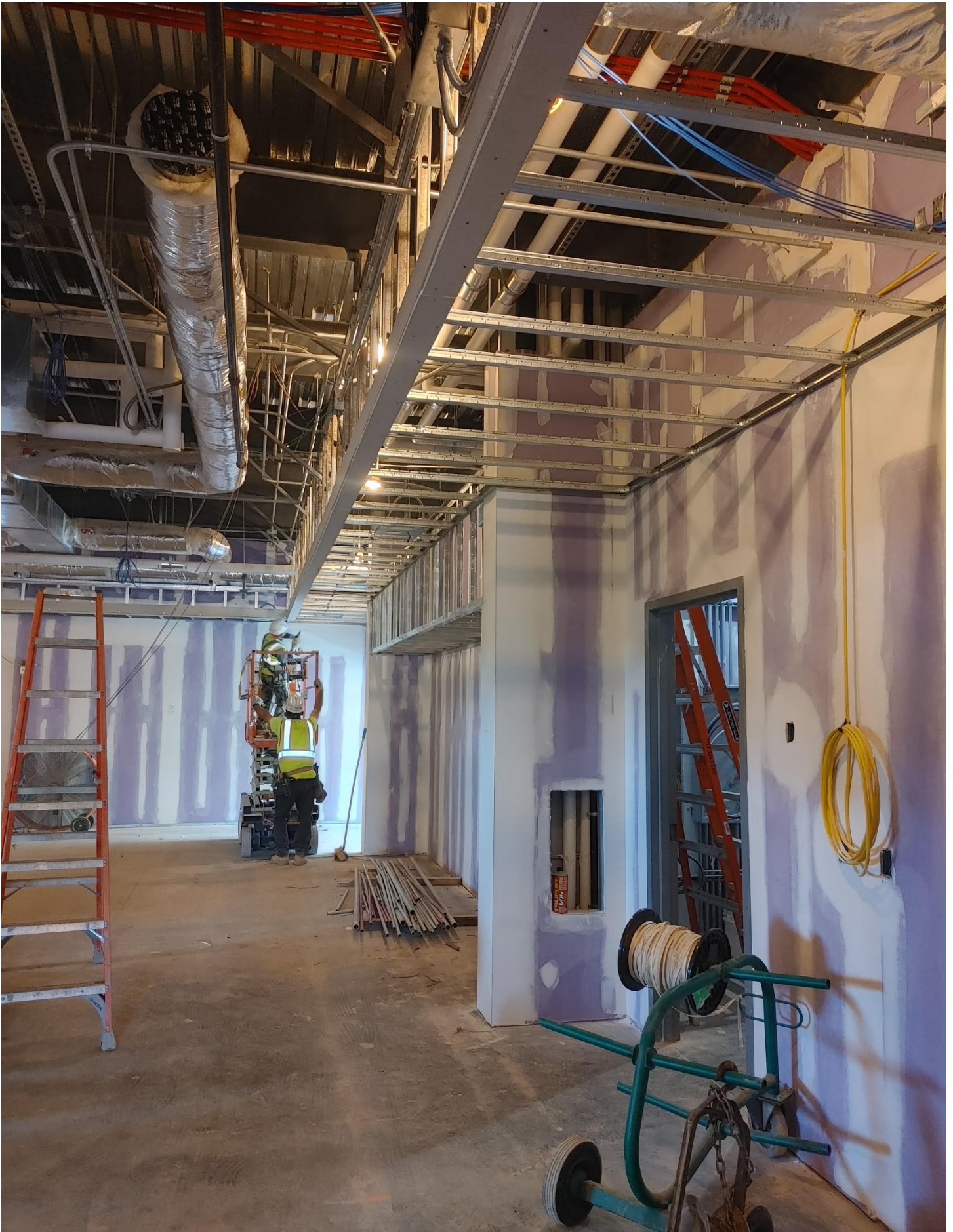
Photo 2 - Bulk Heads being constructed in Area A