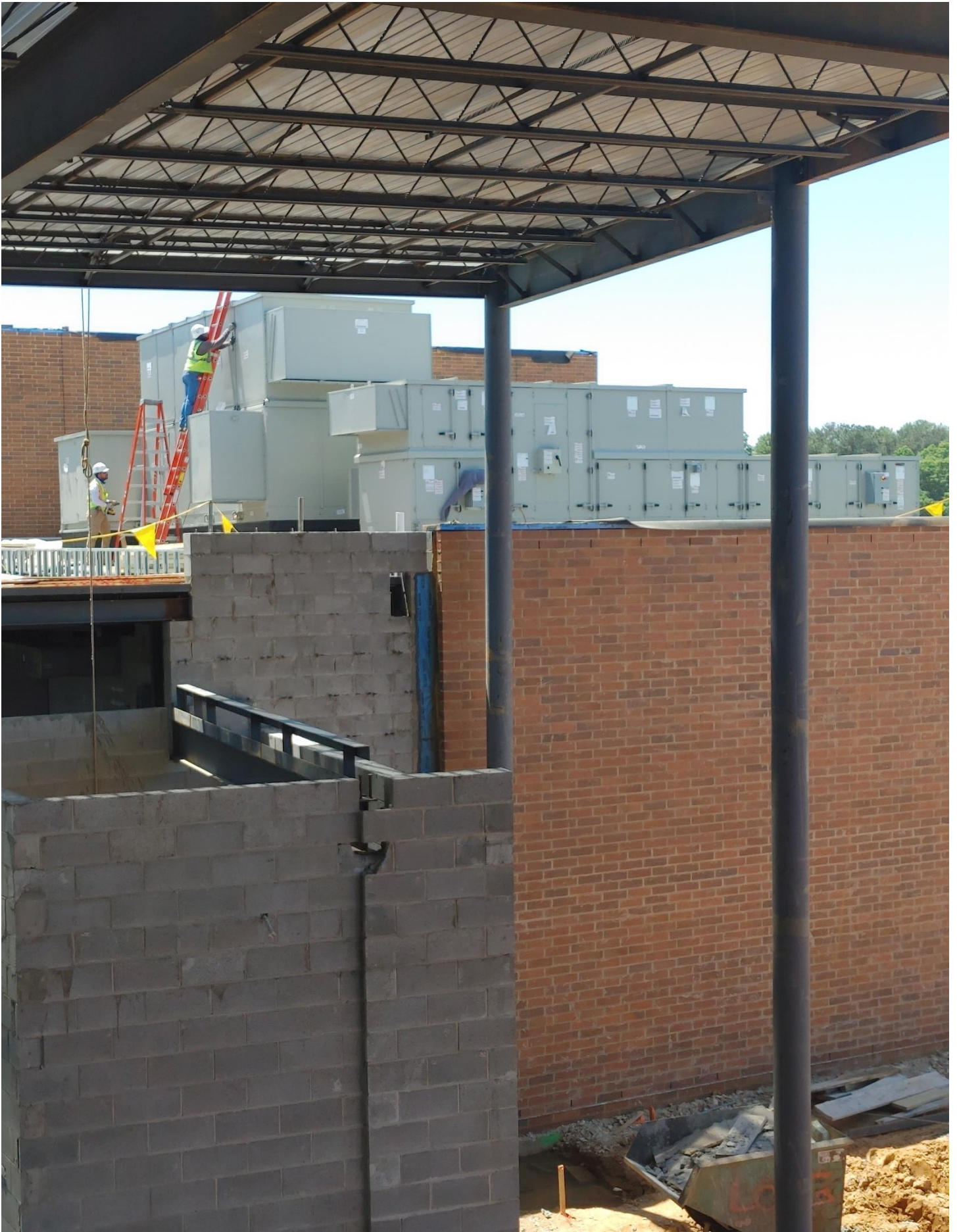
Photo 5 - Work continues on the roof top units in Area E