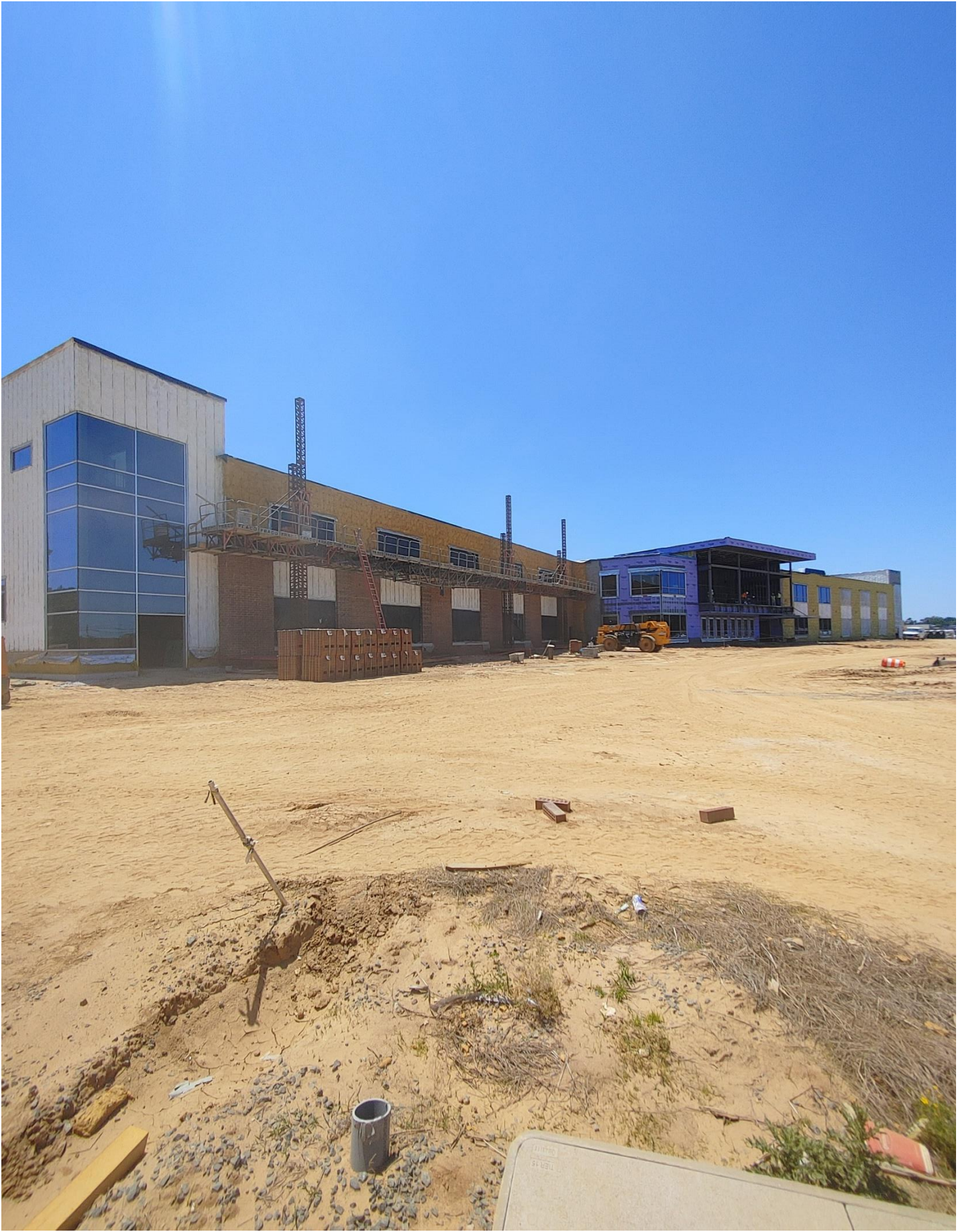
Photo 8 - Front elevation coming along