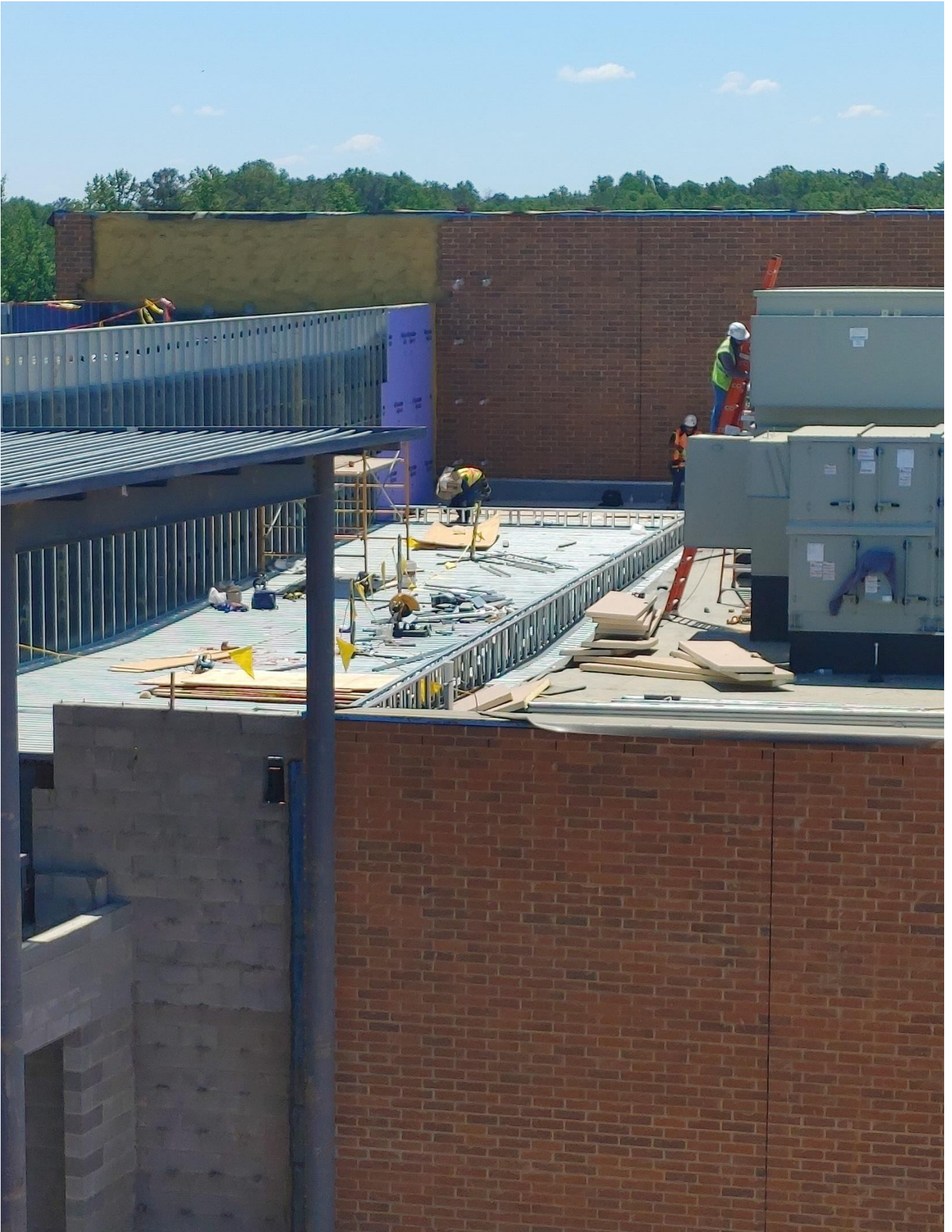
Photo 7 - Parapet walls being constructed on the roof of Area E