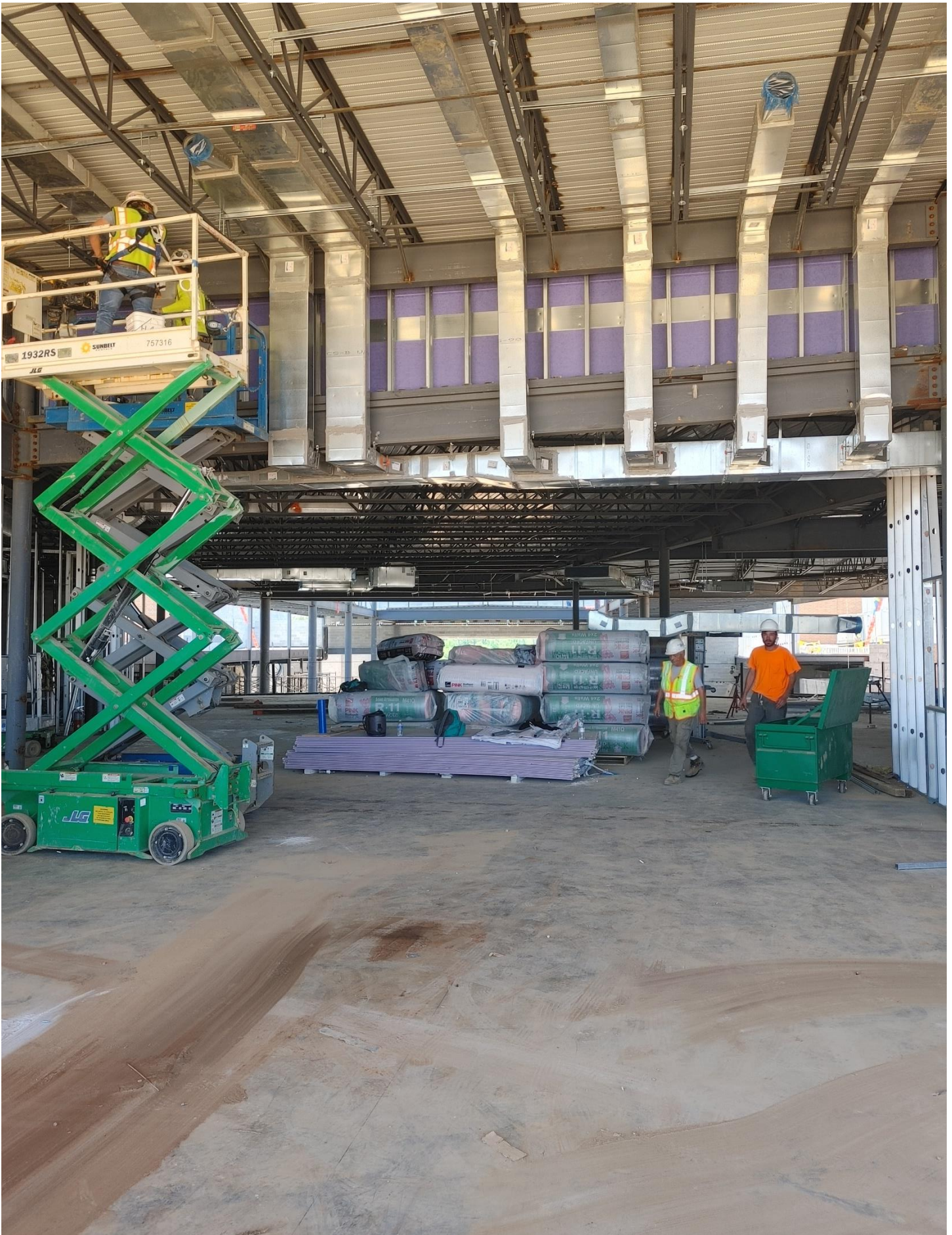
Photo 4 - Duct Banks being run in Area A