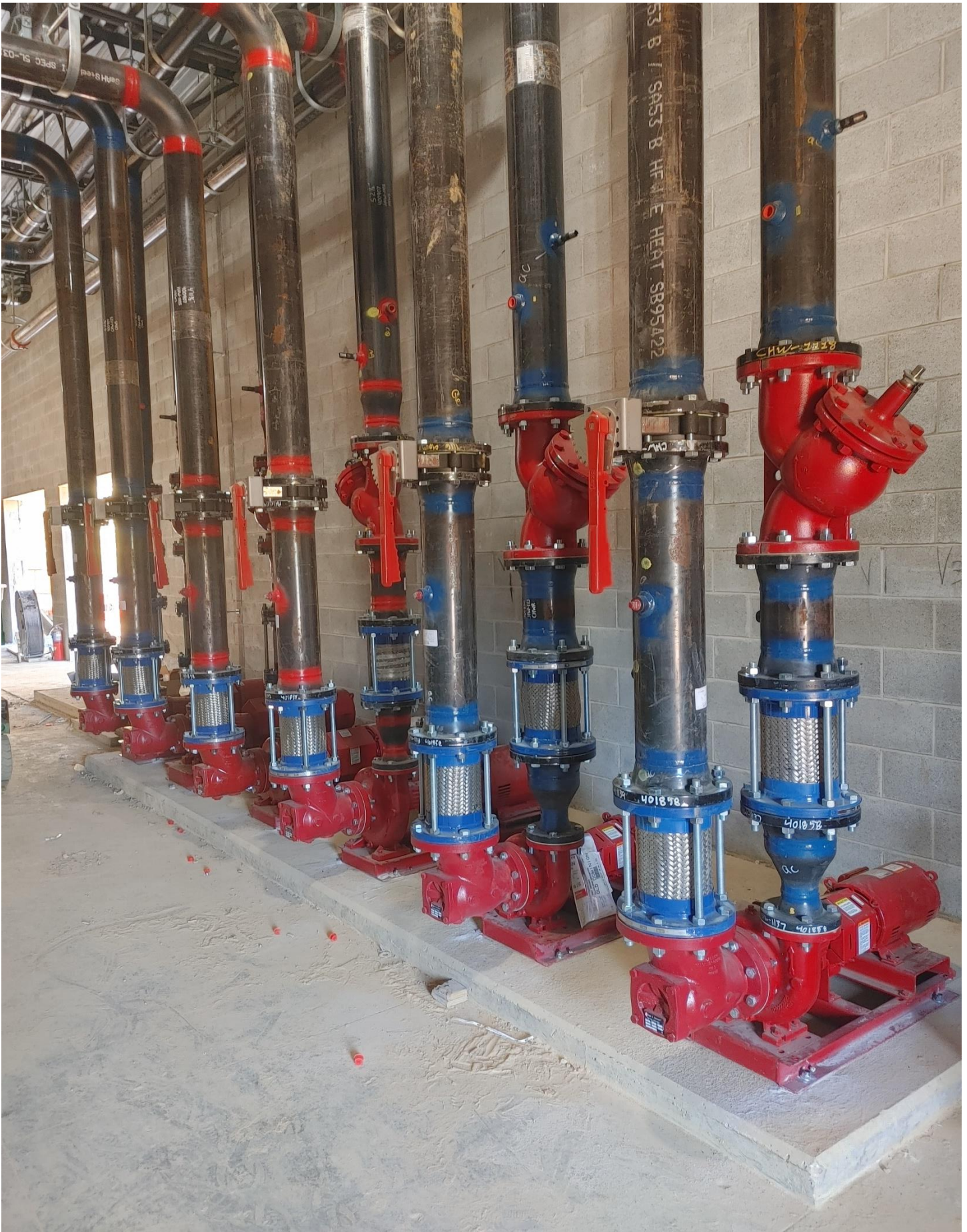
Photo 1 - Work continues in Area D Mechanical Room