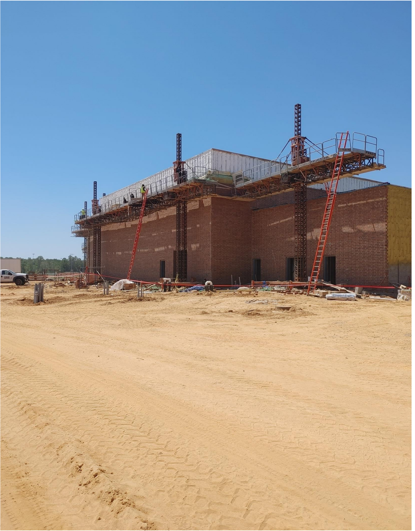
Photo 1 - Brick continues to be laid on the East side of Area D