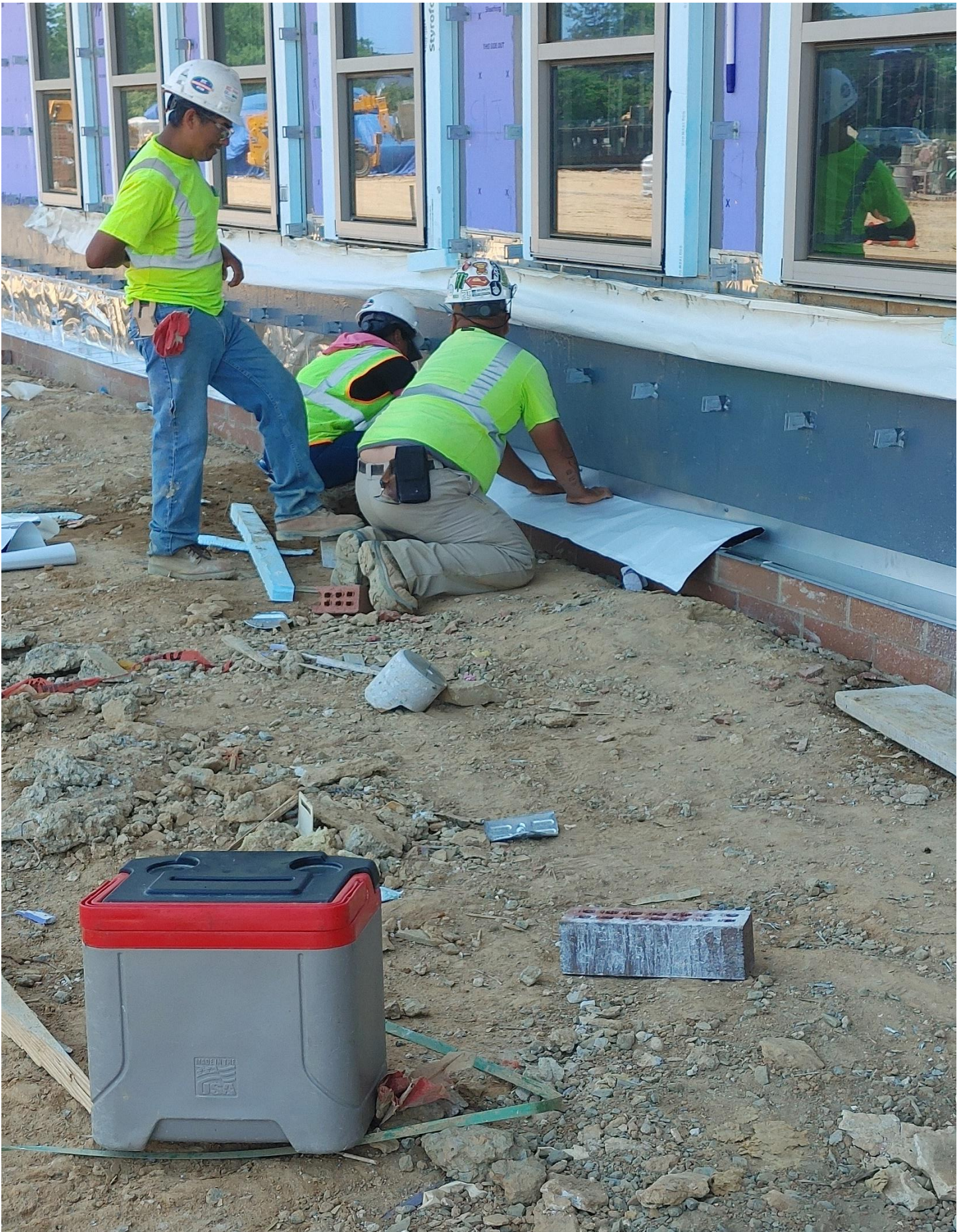
Photo 10 - Brick being flashed on the North side of Area A