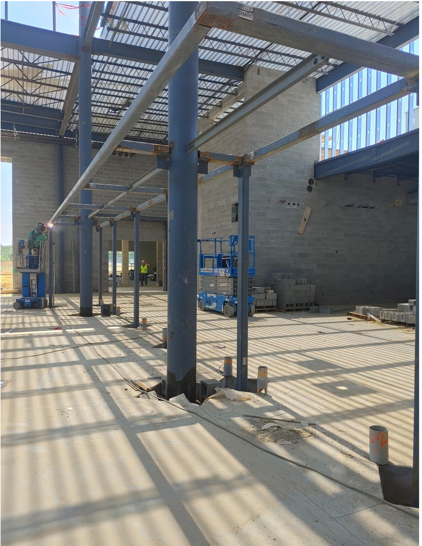
Photo 7 - Steel being welded in Area C.