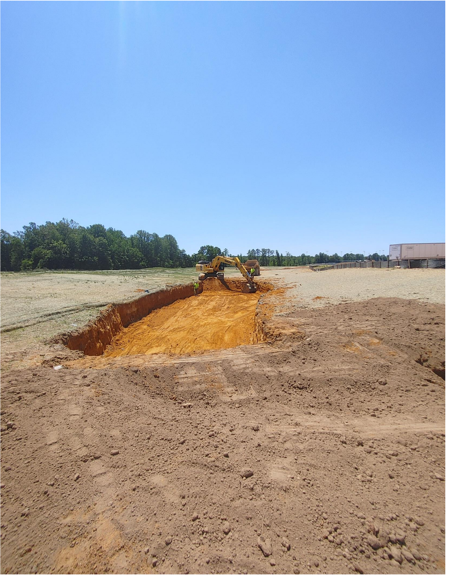
Photo 2 - Beuchert continues to remove soils on the East side of the site to be mixed for use in the BMPs.