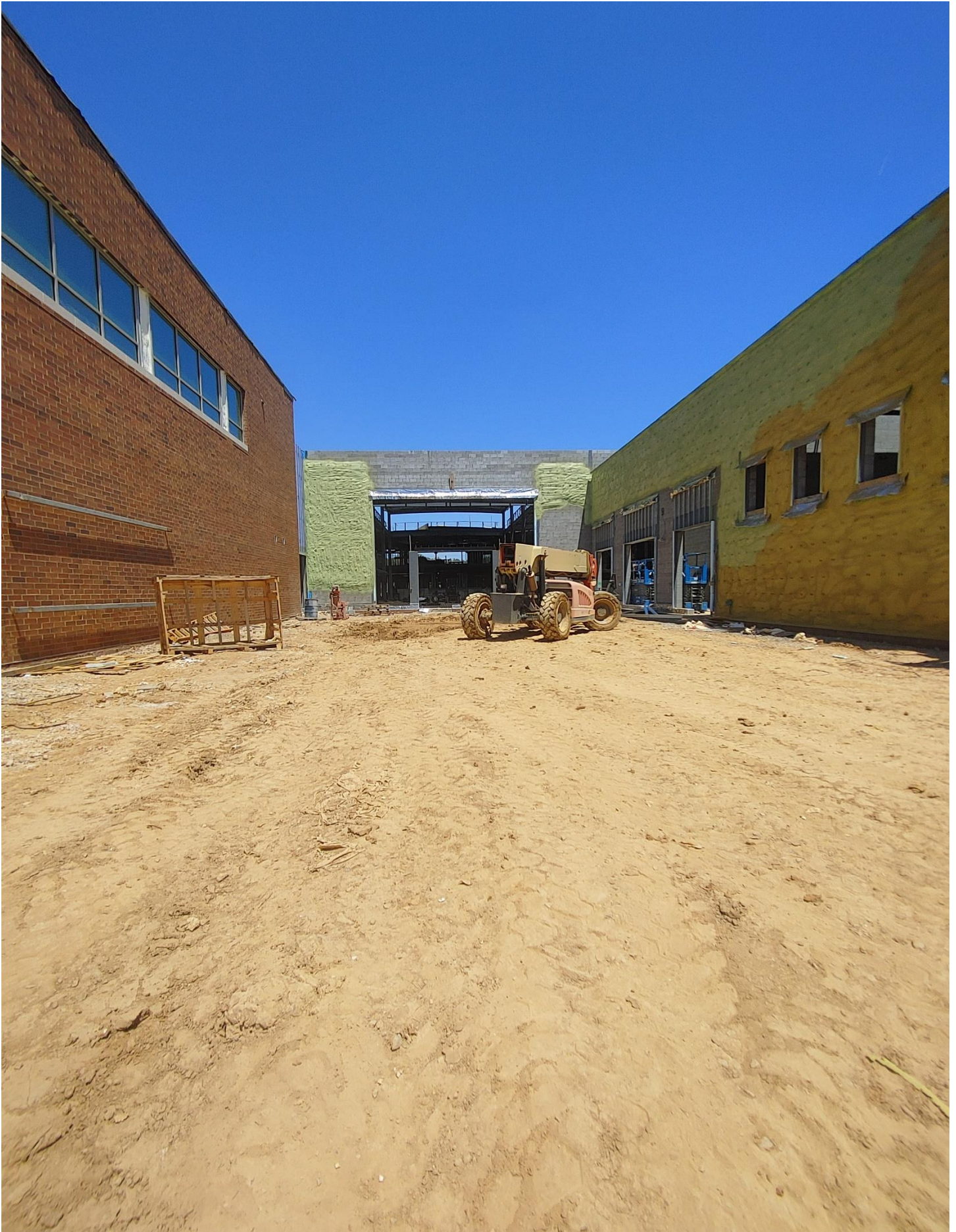
Photo 3 - The South side of Area C has begun to receive foam.