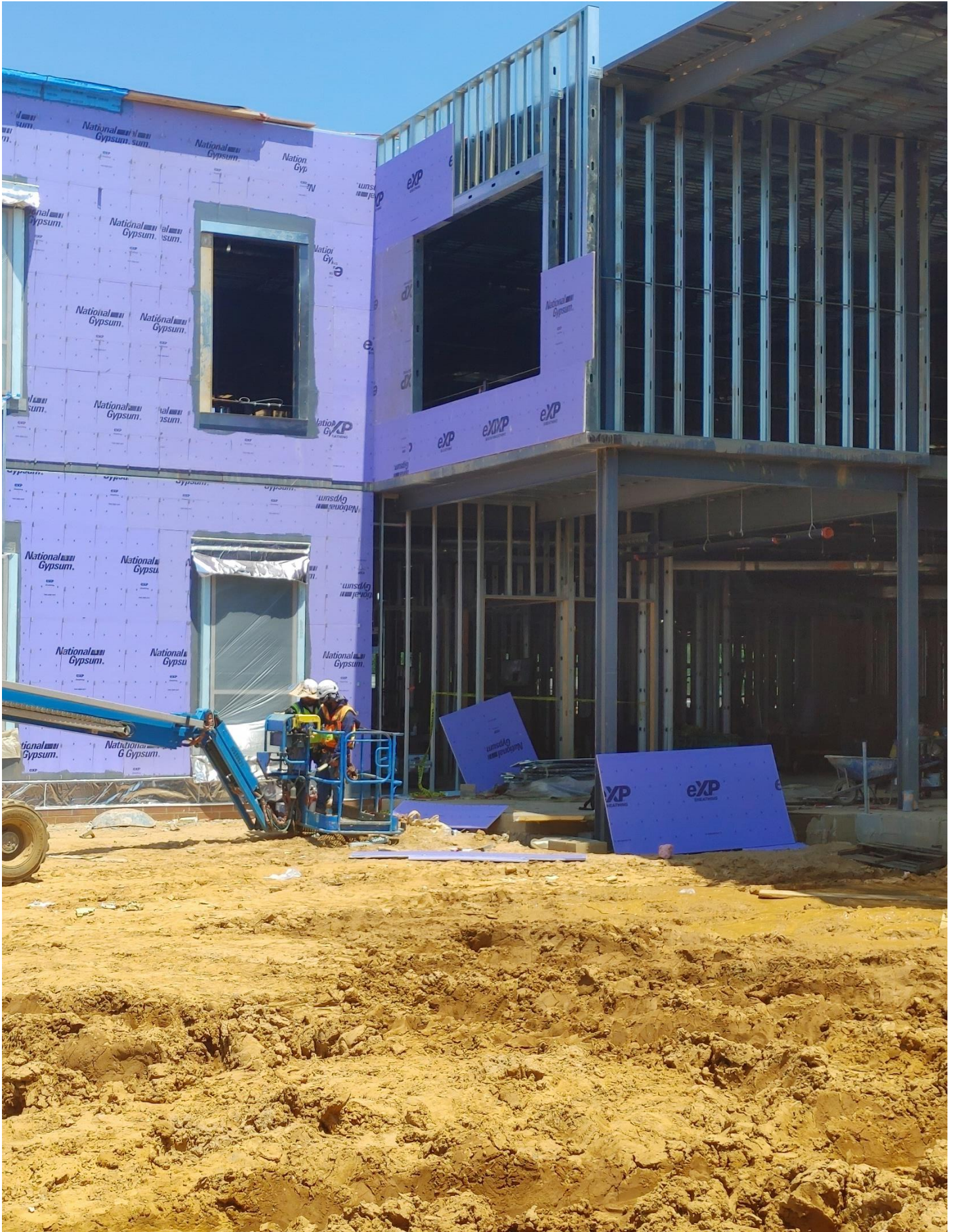
Photo 8 - Gyp Board being hung on the West side of Area C