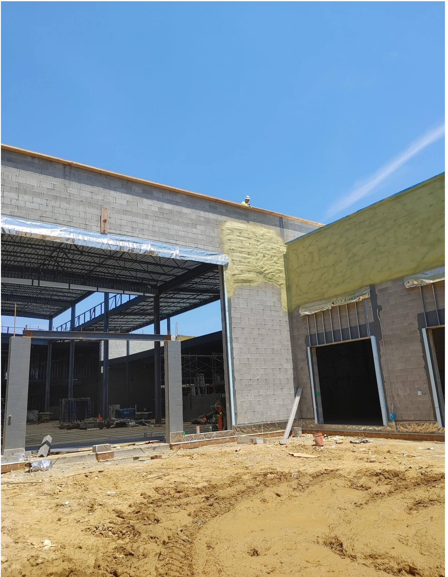
Photo 5 - the Cap of the Parapet wall is being constructed.