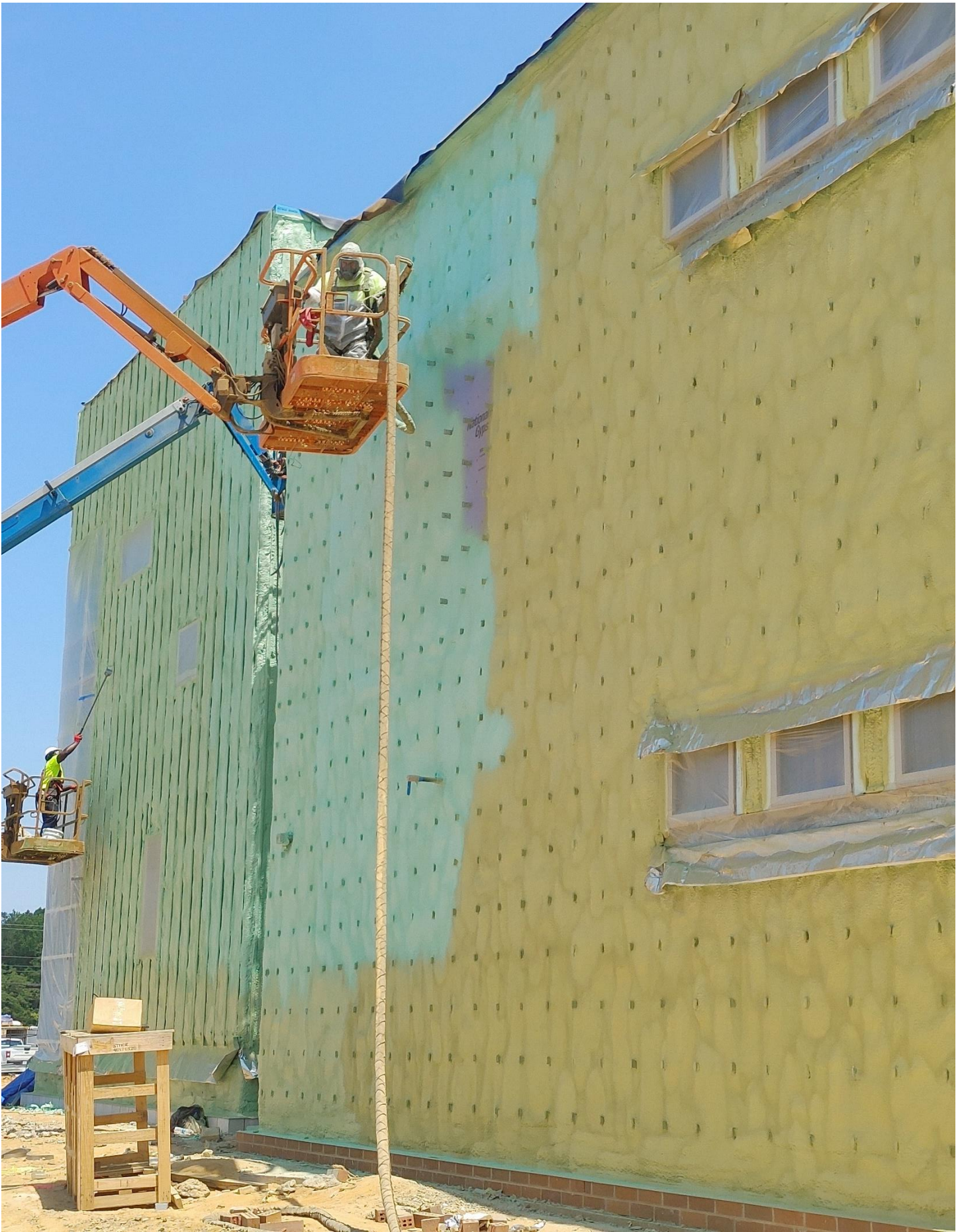
Photo 9 - West side of Area B receiving Spray Foam