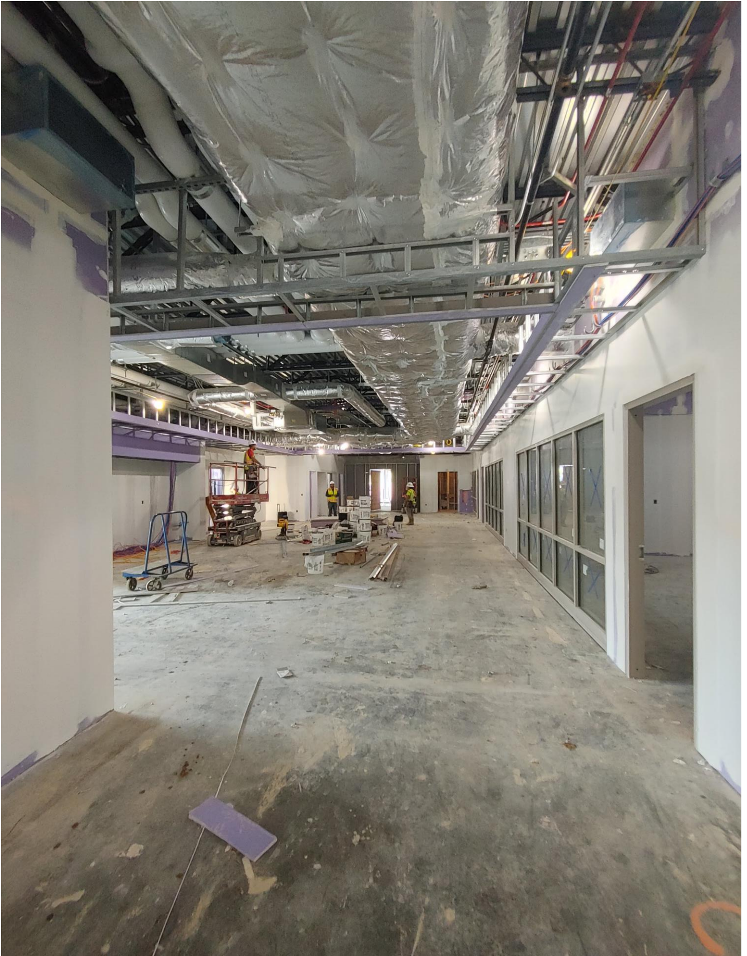
Photo 3 - Bulk Head is being framed on the 1st floor of Area A.