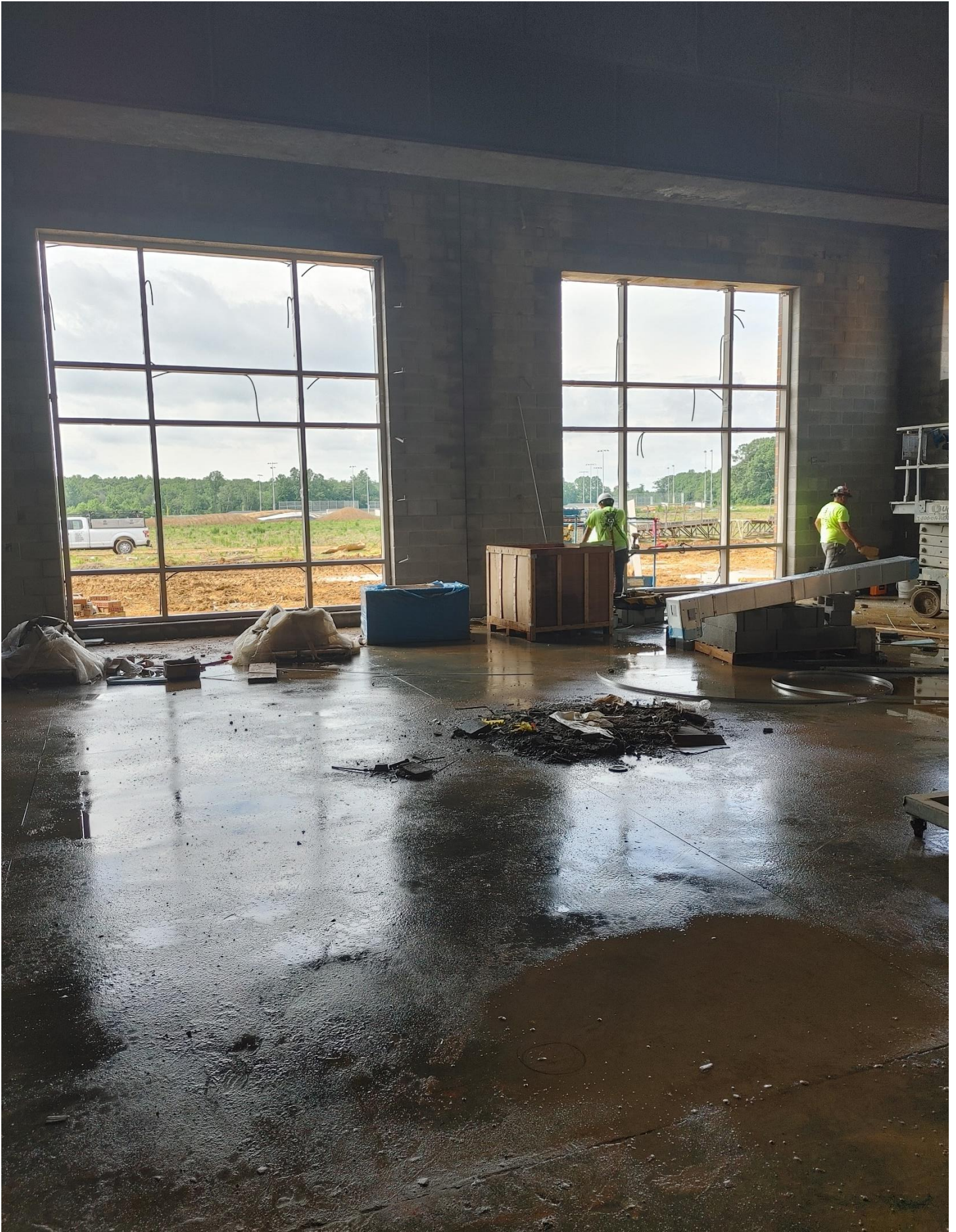
Photo 10 - Storefront frames are being installed in Area D.