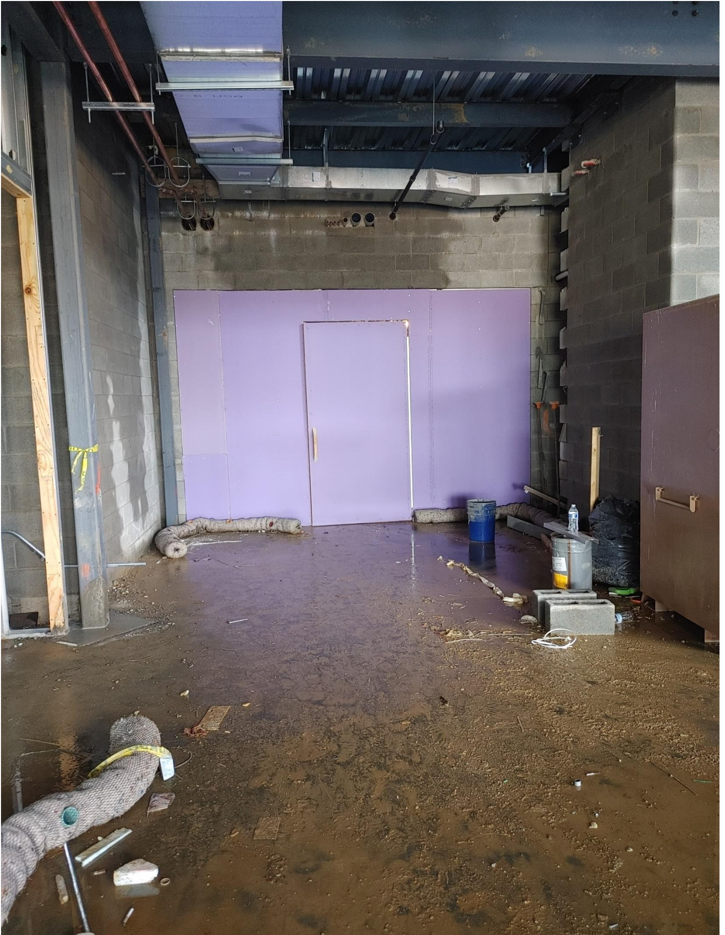
Photo 7 - A section of Area A, beginning at the Elevator, has been sealed off so that it can be climatized.