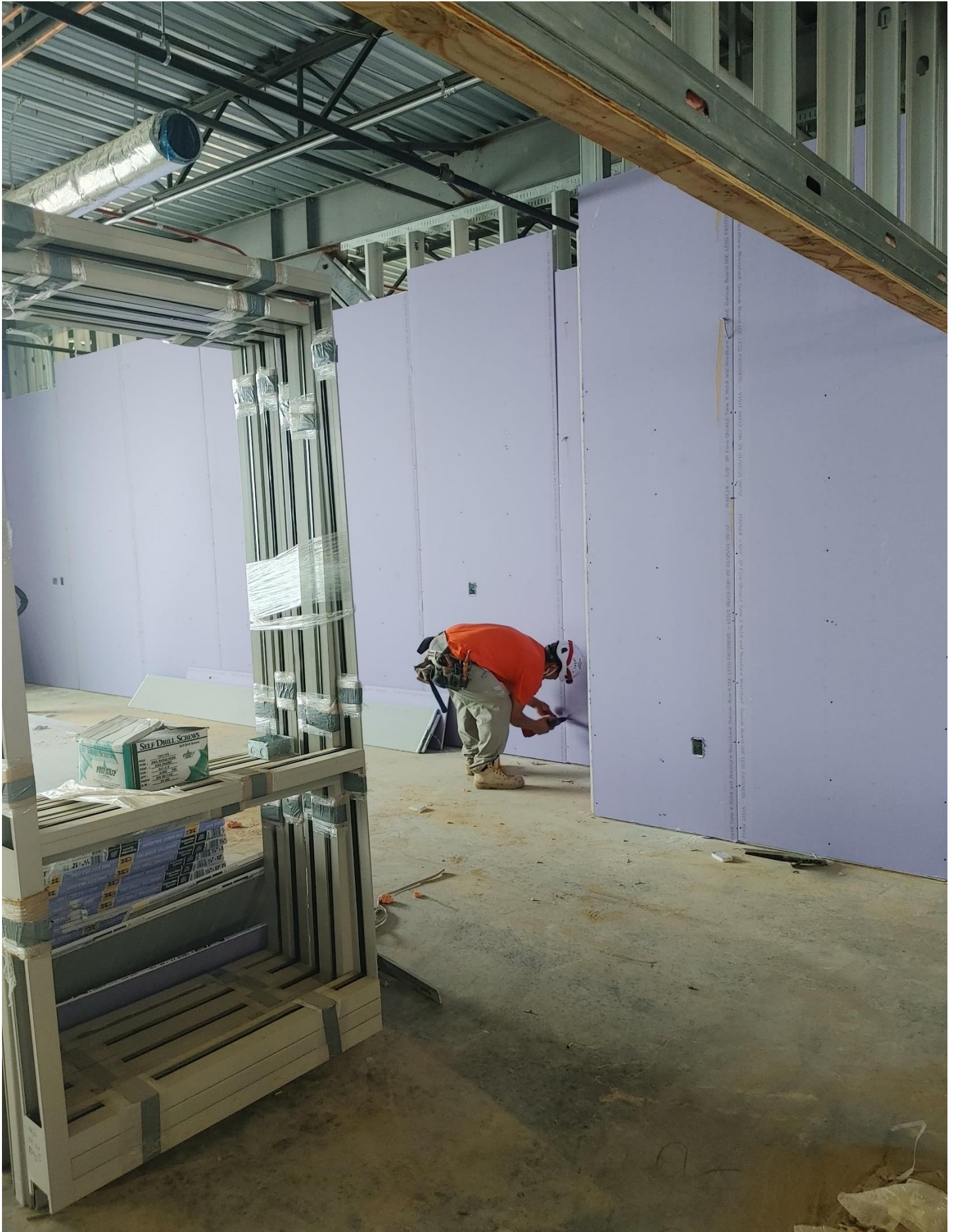
Sheetrock is being installed in Area B.