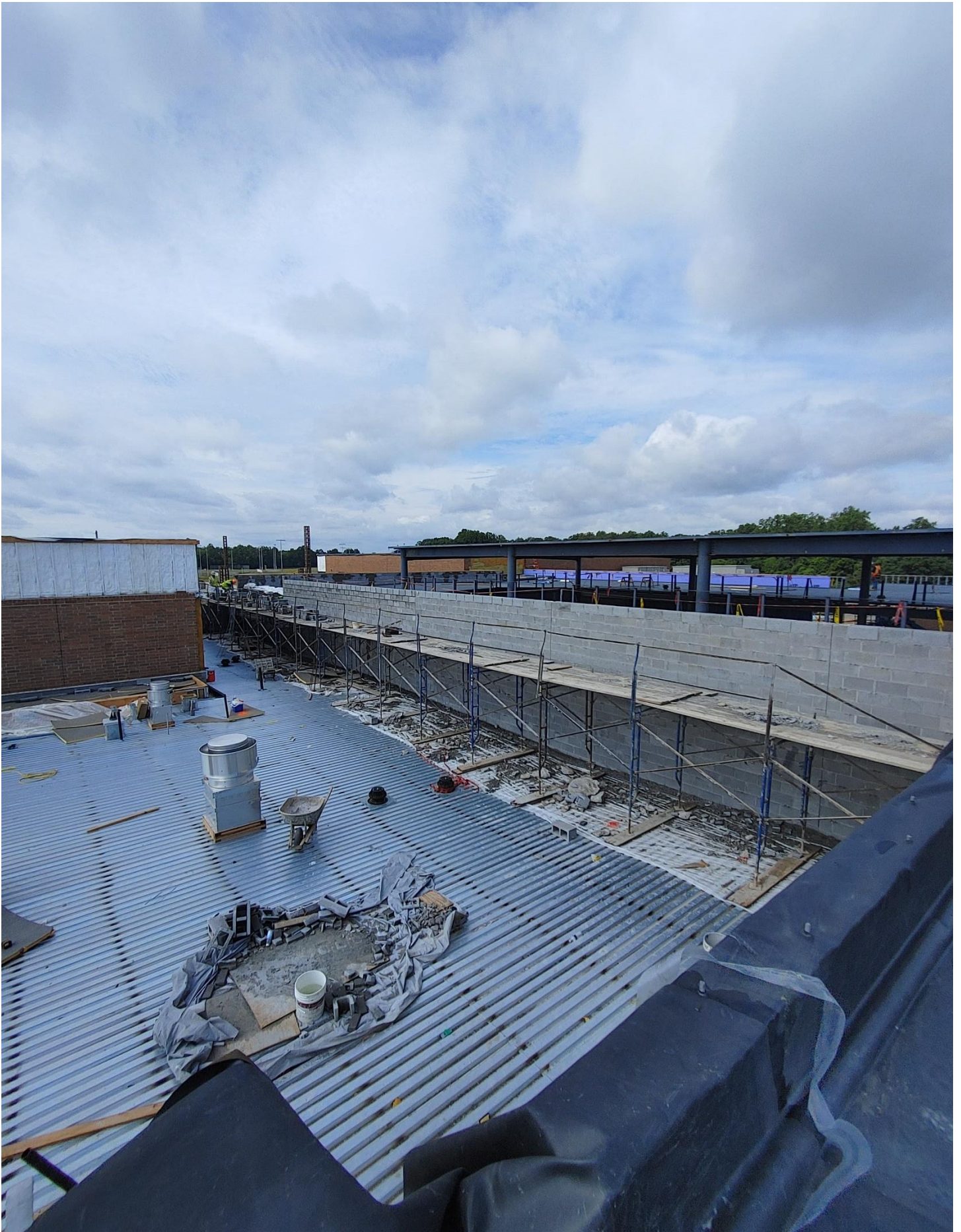
Photo 2 - Masons are laying block between Area D and C.