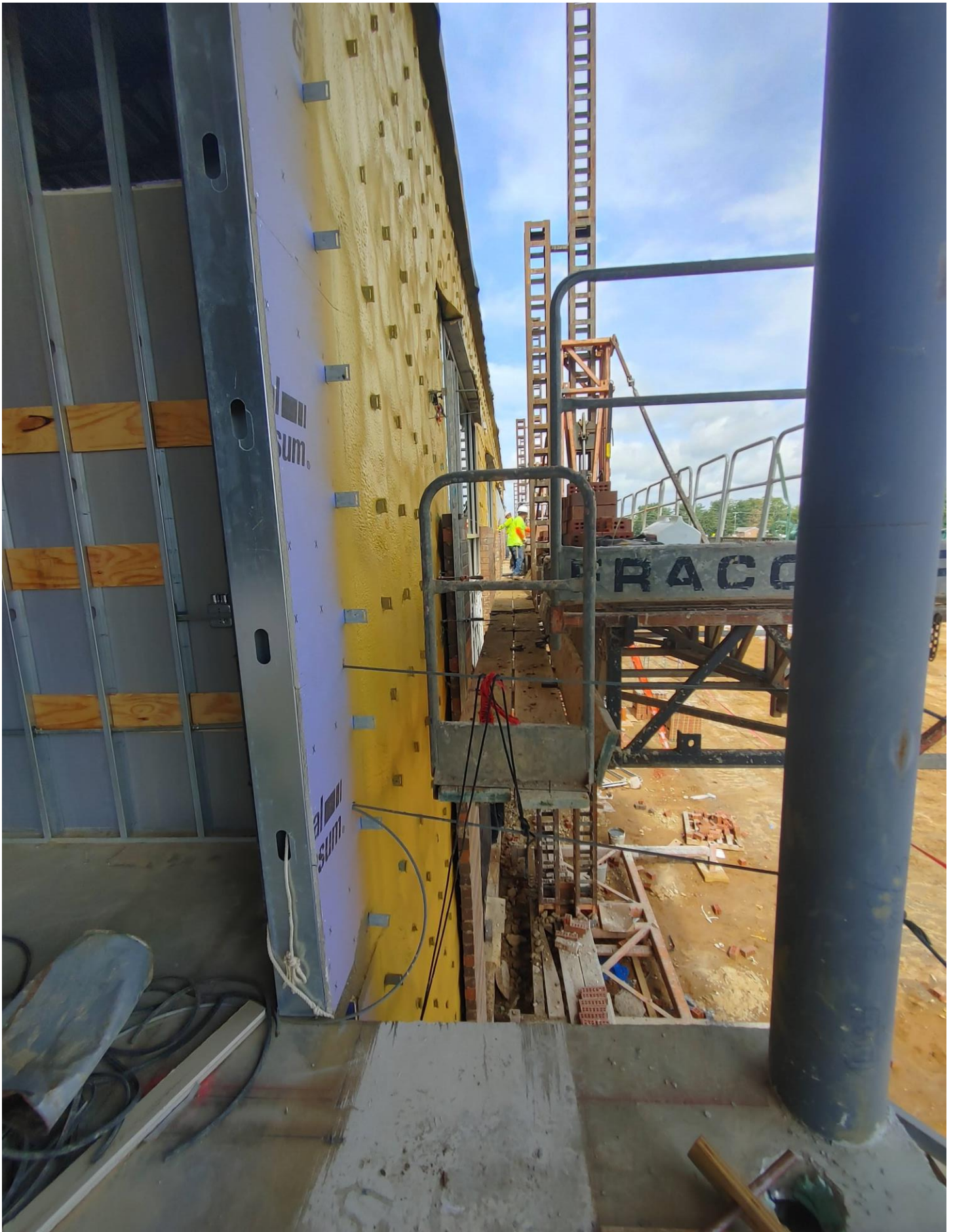
Photo 4 - Masons are laying Brick on the North side of Area B.