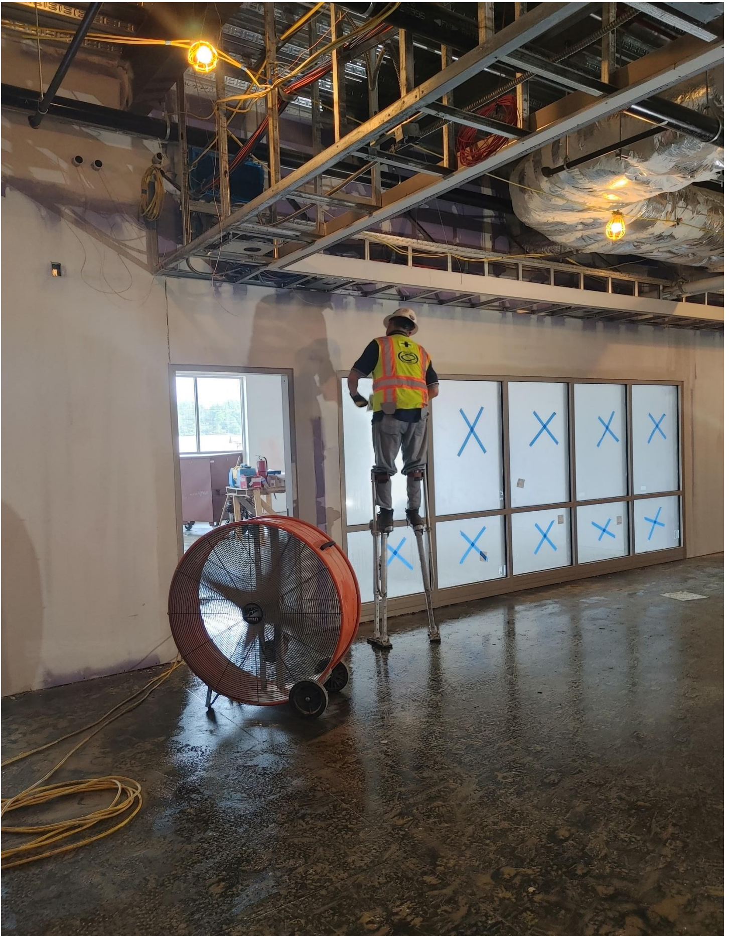
Photo 8 - Finish coat of Mud is being applied around door and storefront frames in Area A.