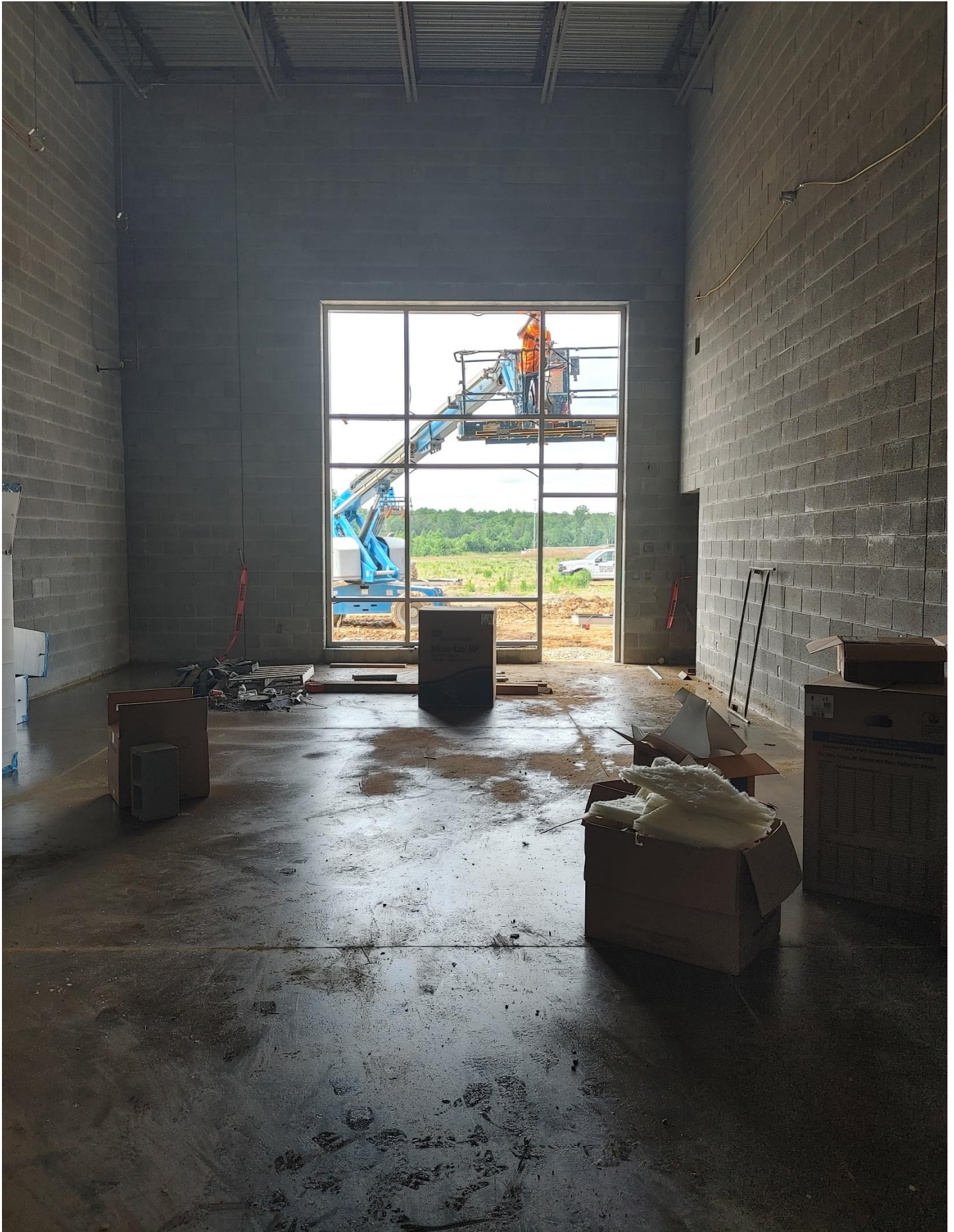
Photo 9 - Storefront frames being installed in Area D.