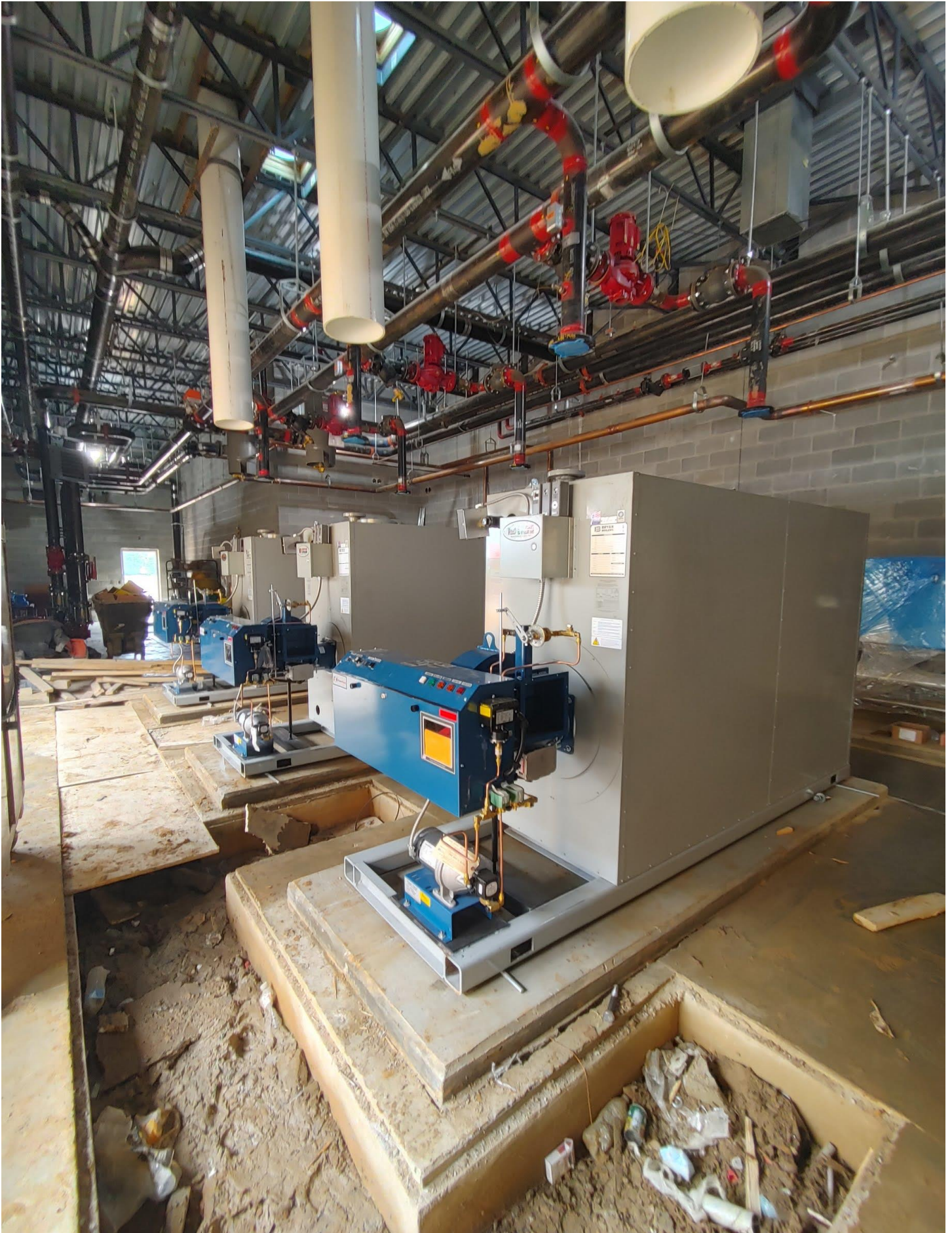
Photo 3 - The Boilers were set yesterday in the Mechanical Room of Area D.