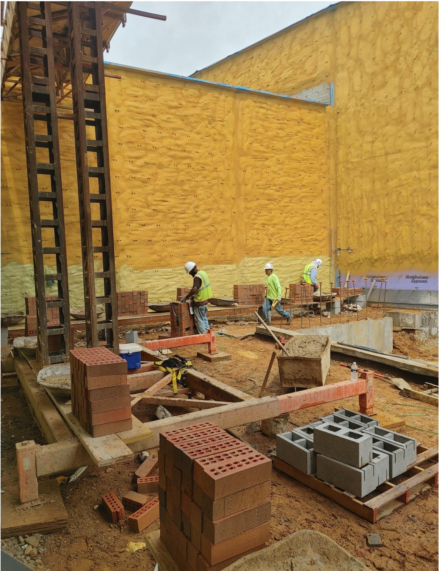
Photo 1 - Masons are laying Brick on the East side of Area C in the Loading Dock Area