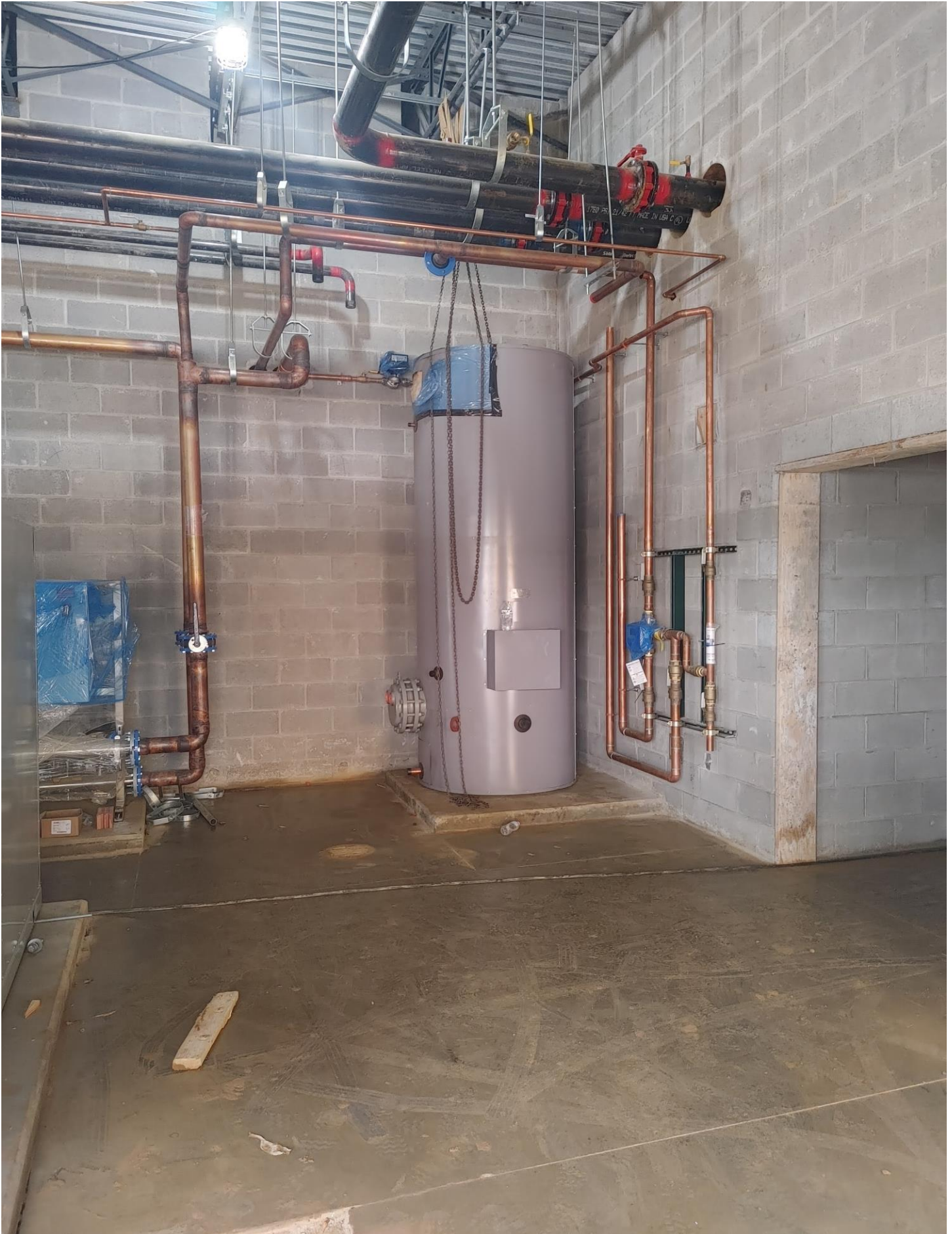
Photo 2 - Water Heater was set yesterday in the Mechanical Room of Area D.