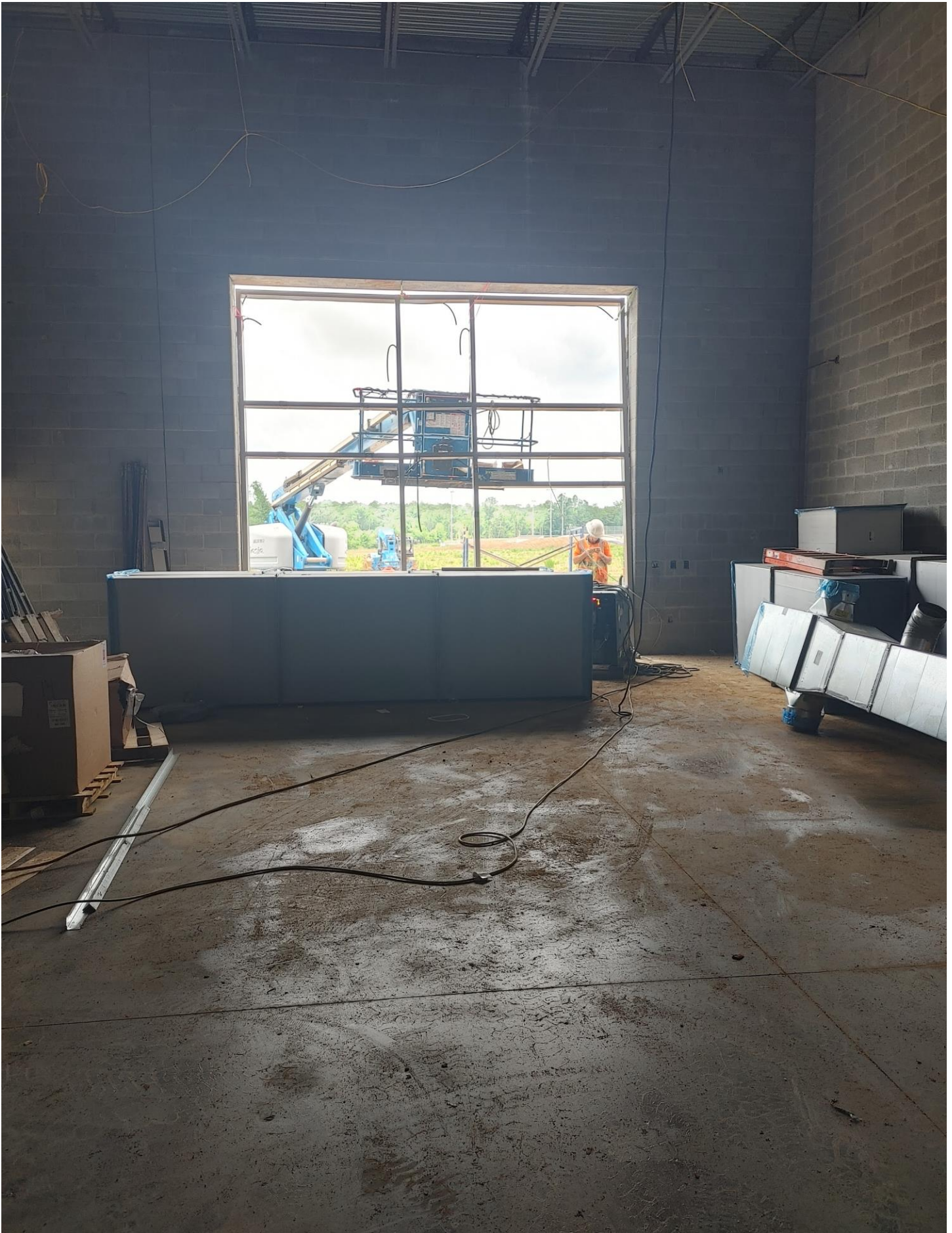
Photo 5 - Storefront being set on the South side of Area D.