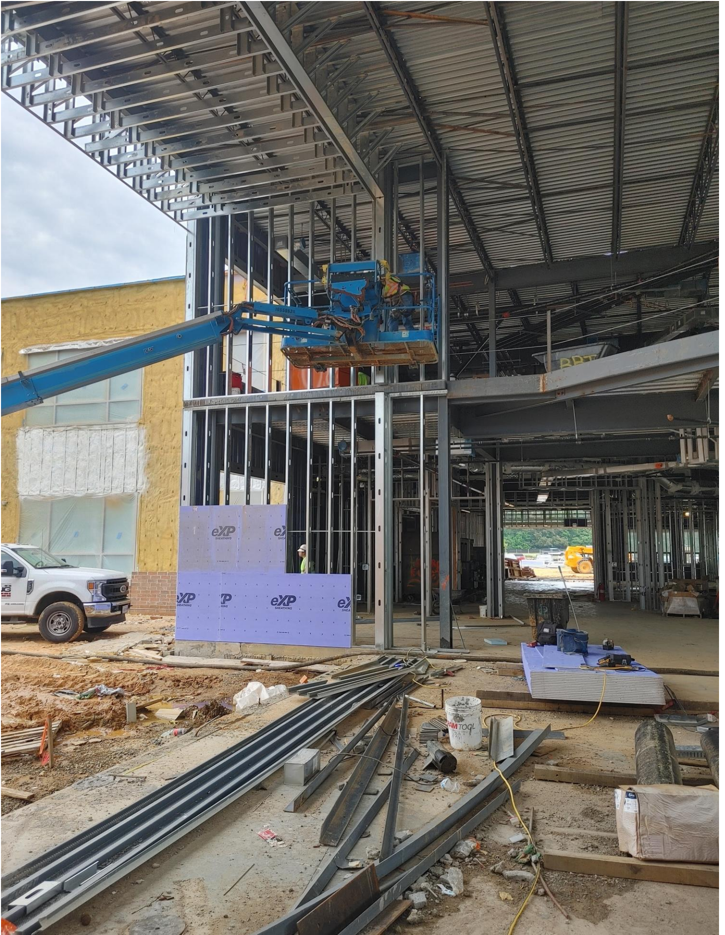
Photo 4 - Walls being framed in Area C.