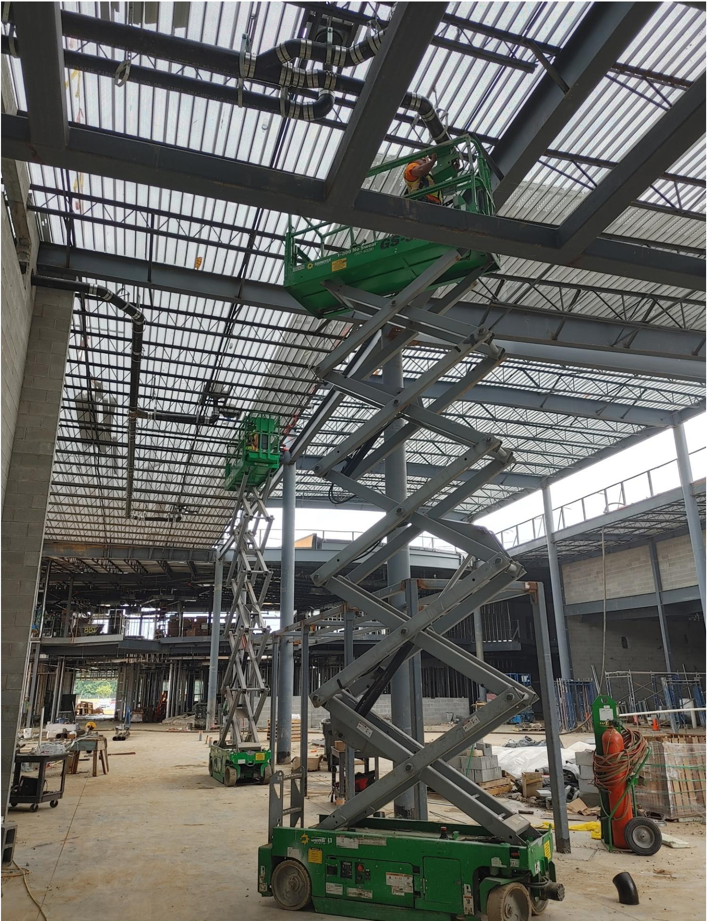
Photo 6 - Roof Drains being installed in Area C.