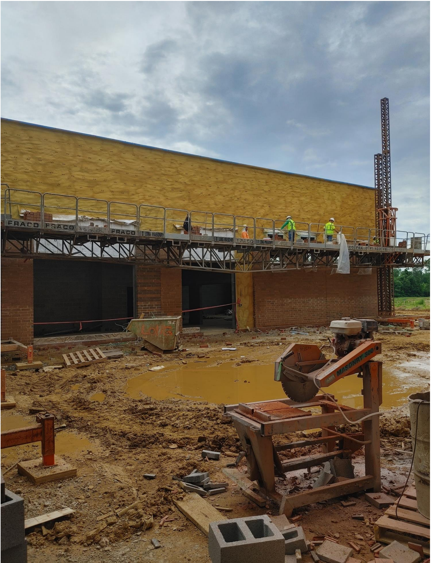
Photo 5 - Brick is being laid on the West side of Area D.