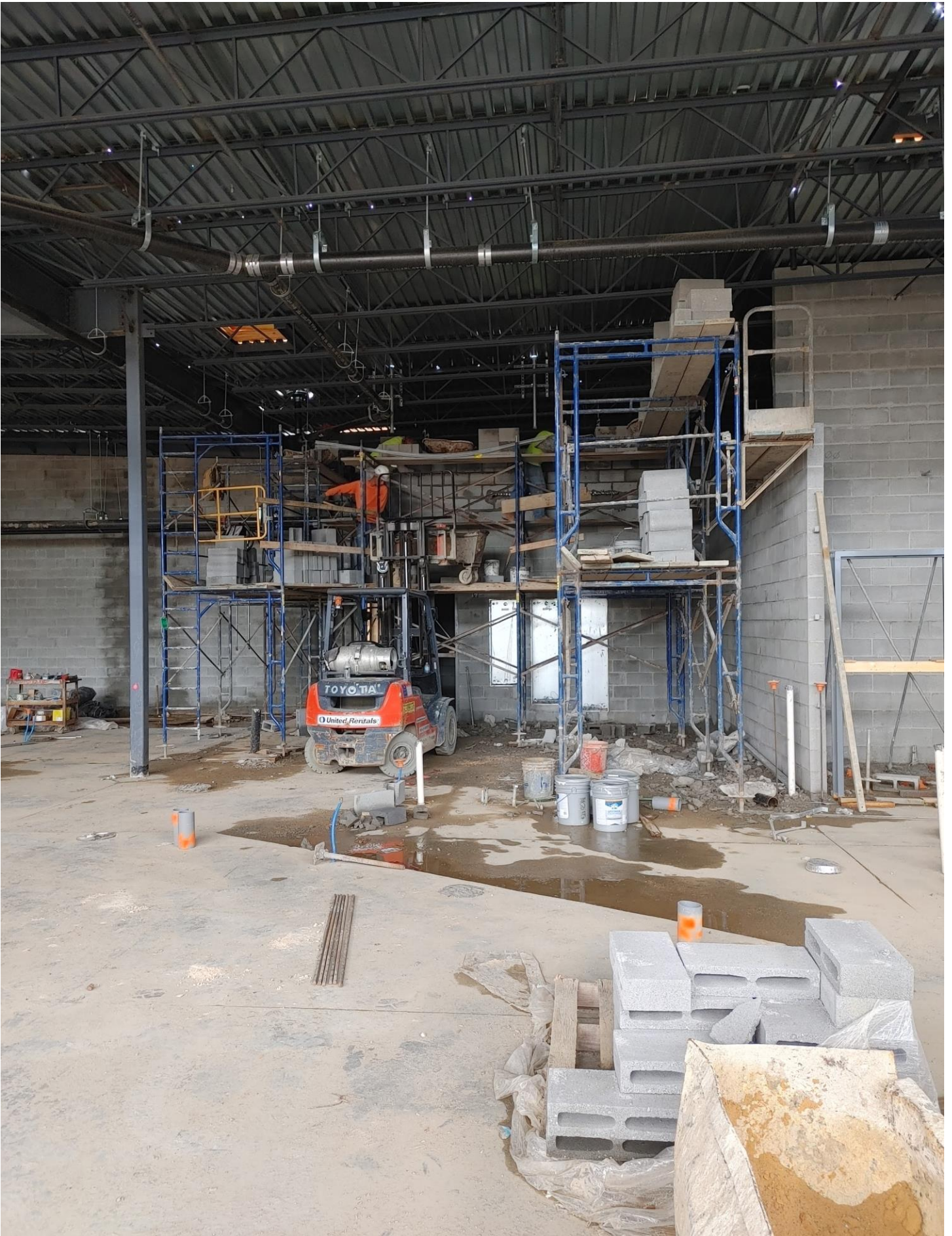
Photo 7 - Block continues to be laid in the Kitchen.