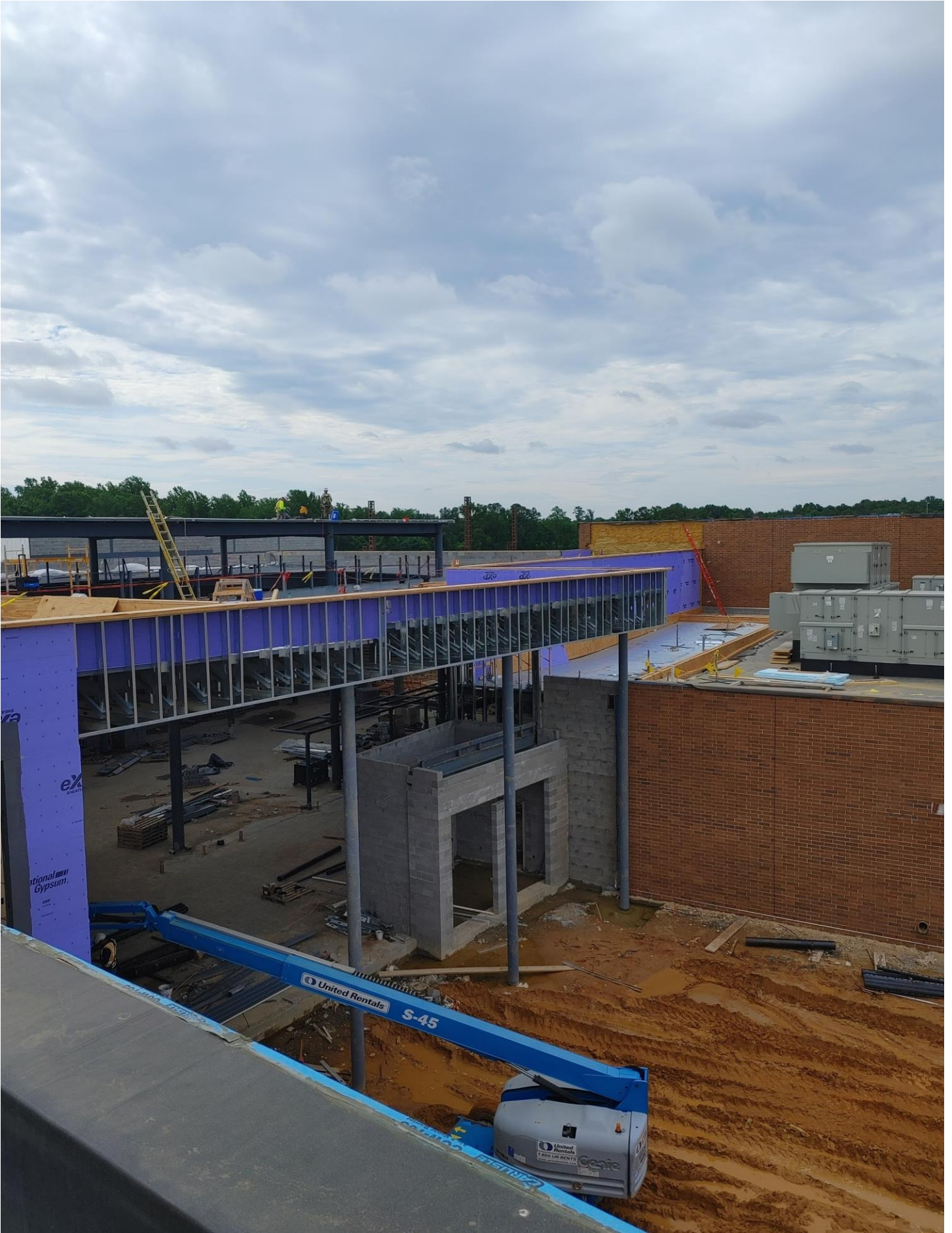
Photo 3 - Parapet Walls are being constructed