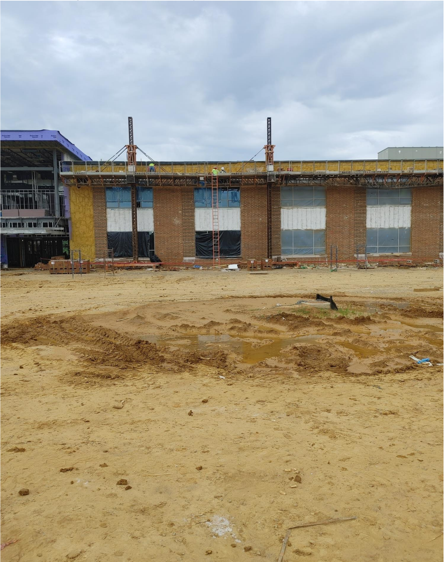
Photo 12 - Brick is being laid on the North side of Area B.