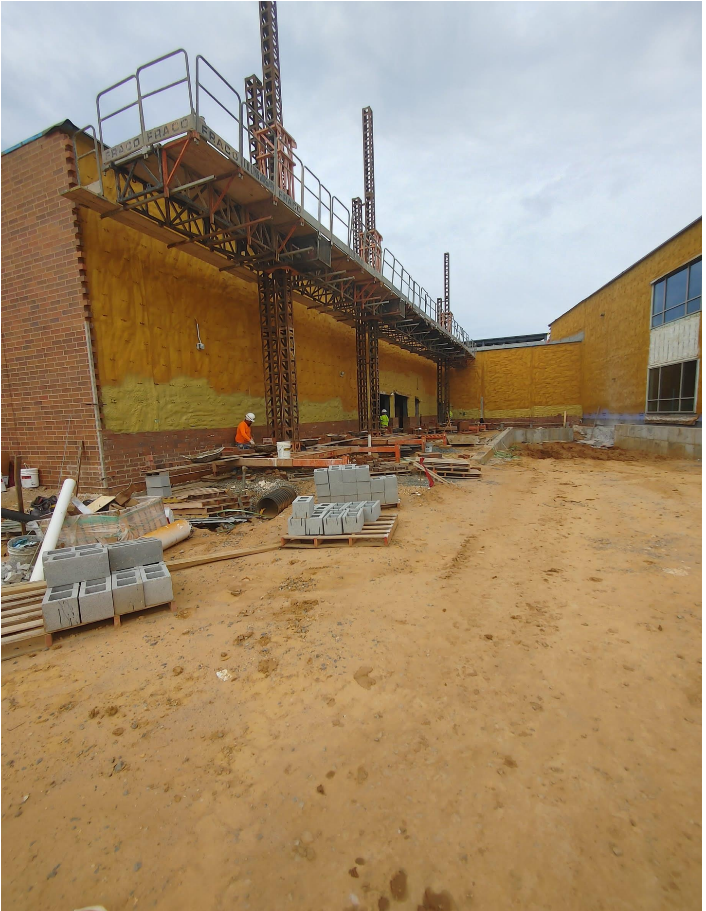
Photo 8 - Brick is being laid on the North side of Area D and the East side of Area C.