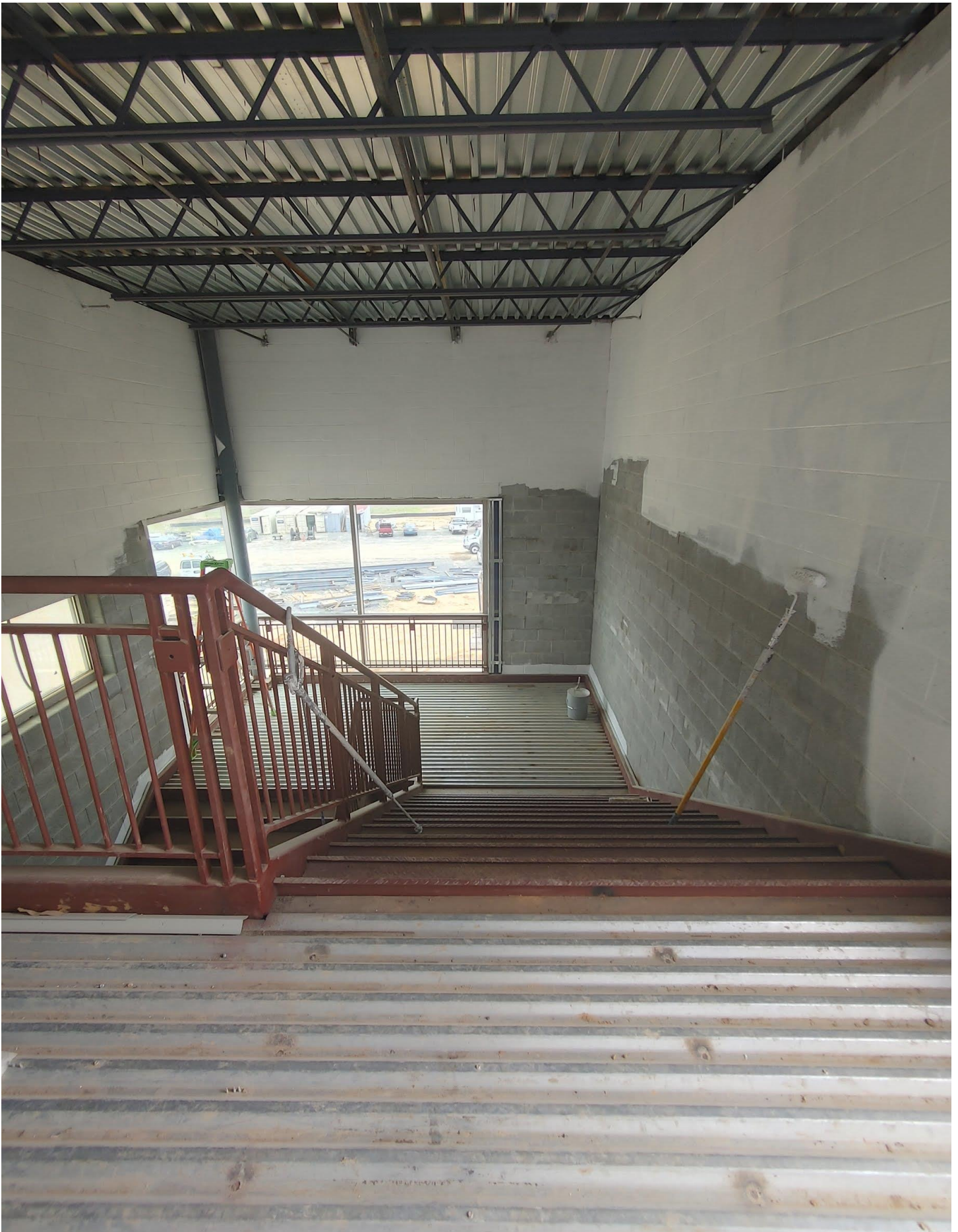
Photo 2 - Block sealer being sprayed and rolled on walls in Stairwell #2