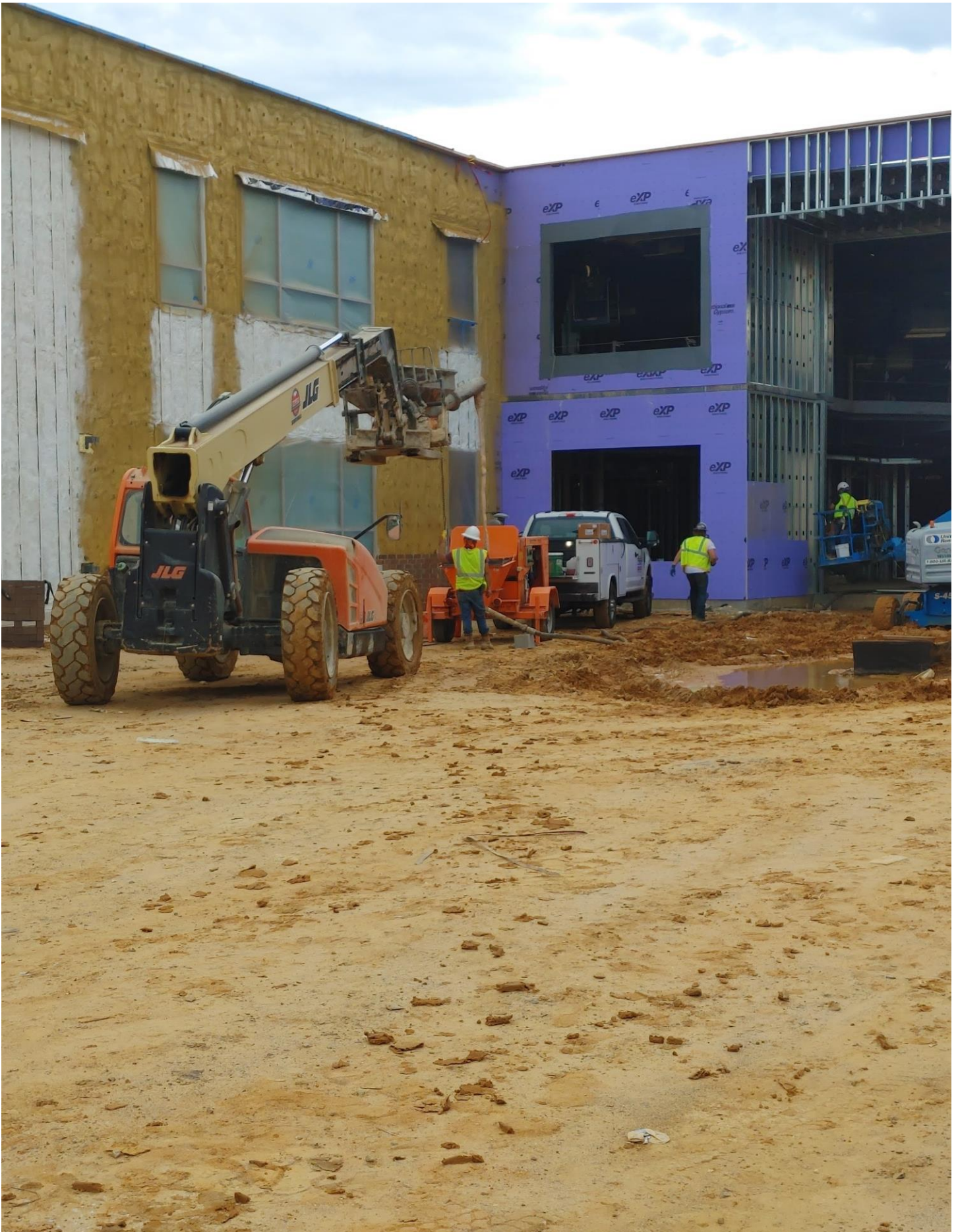
Photo 10 - The Masons are grouting block in Area C.