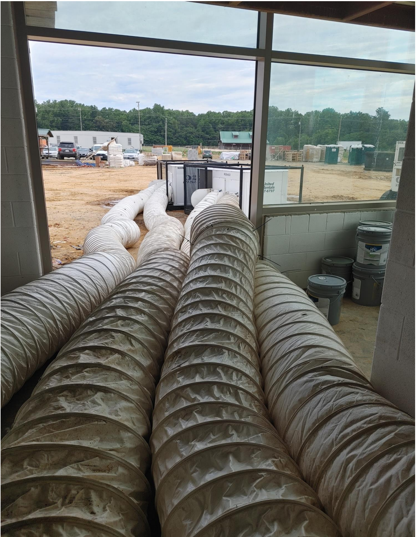
Photo 1 - Temporary Cooling Units have been run into Area A to condition the space.