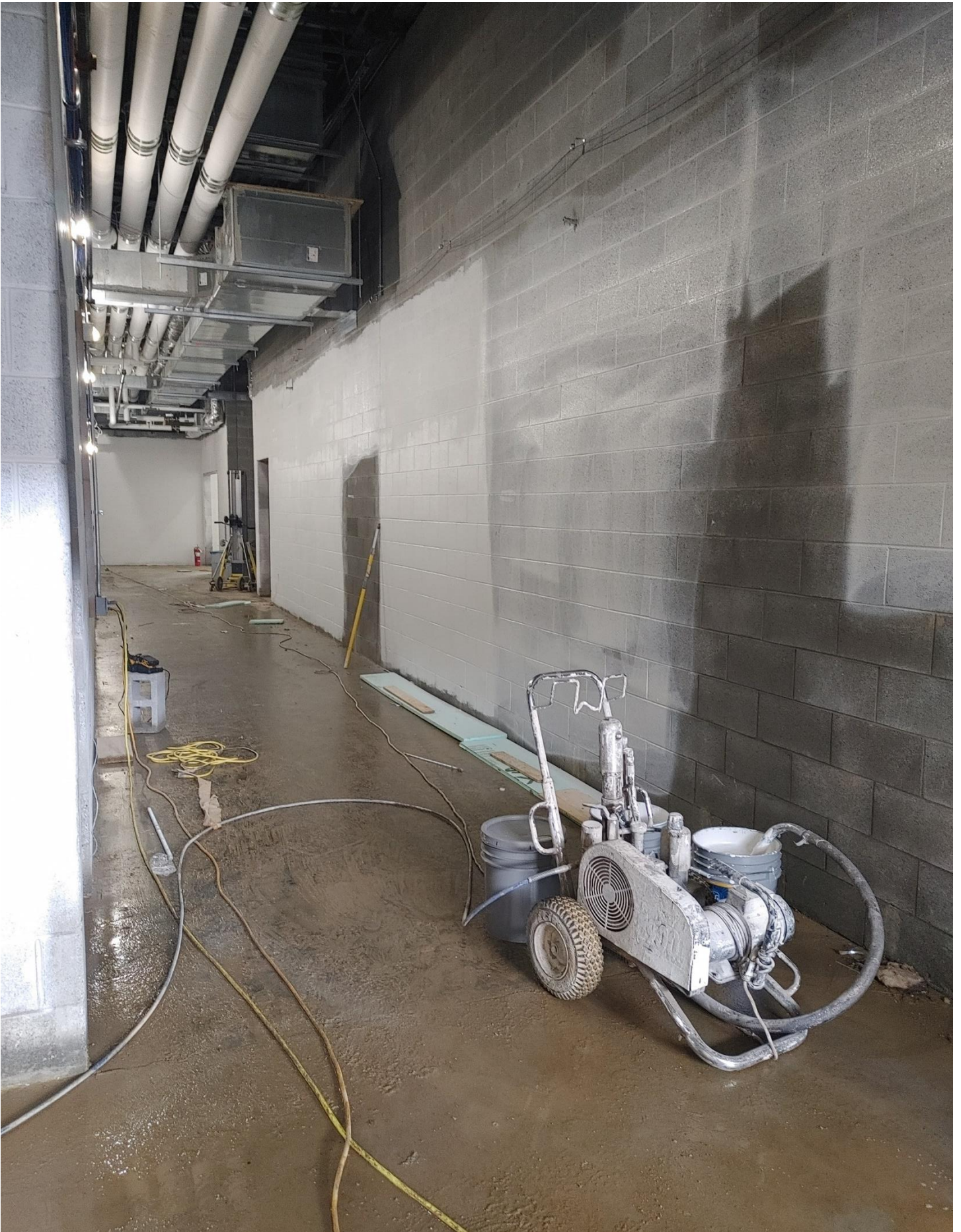
Photo 4 - Block sealer is being sprayed and back rolled in Area E.