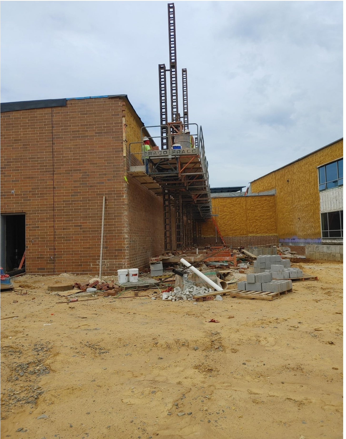
Photo 5 - Brick is being laid on the North side of Area D.