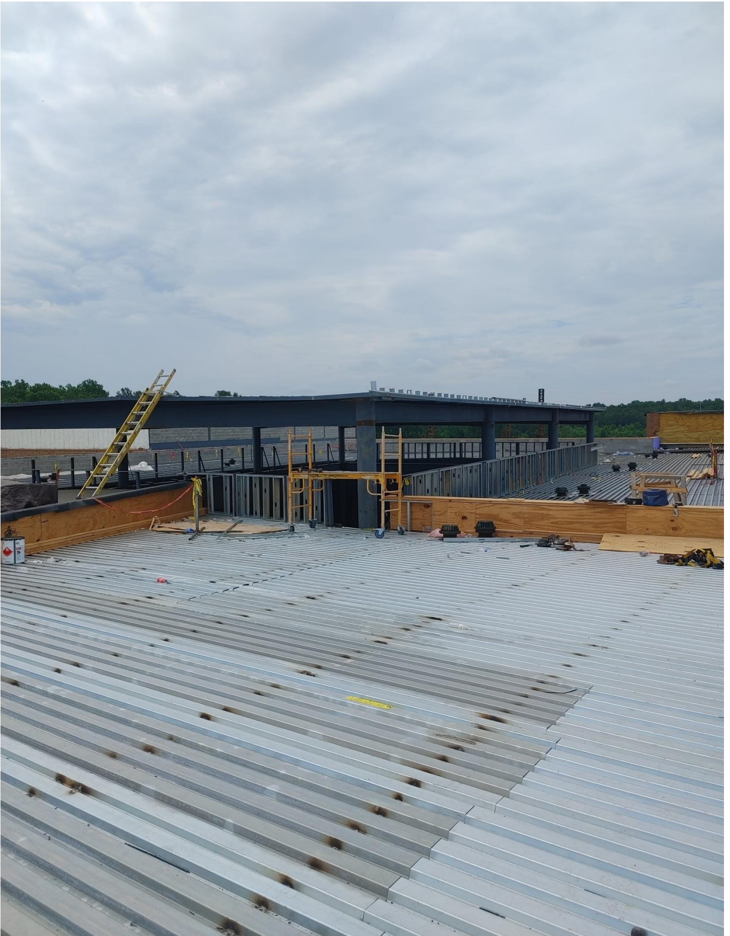
Photo 6 - Parapet walls are being framed in Area C.