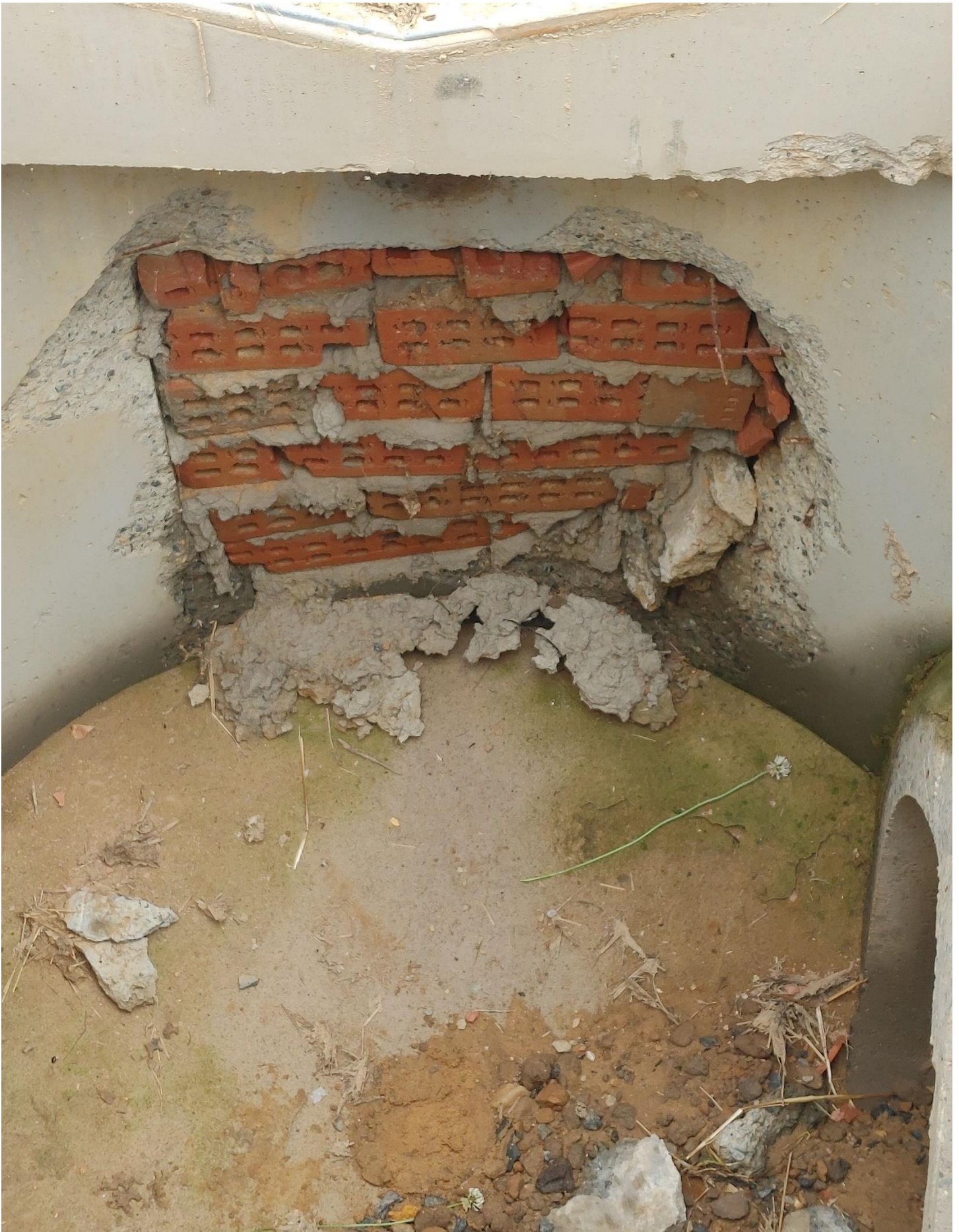
Photo 1 - Manhole along Rec Park Road that was patched by Beuchert.