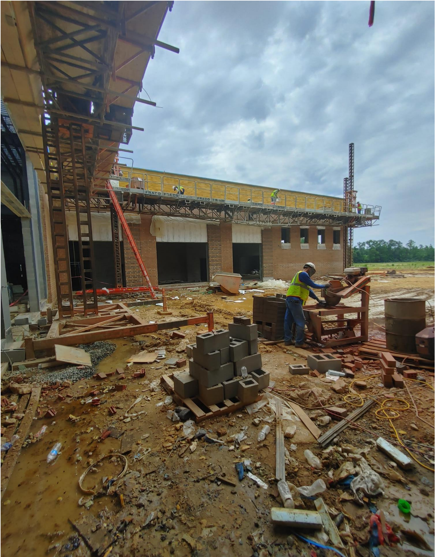
Photo 3 - Brick is being laid on the West side of Area D.