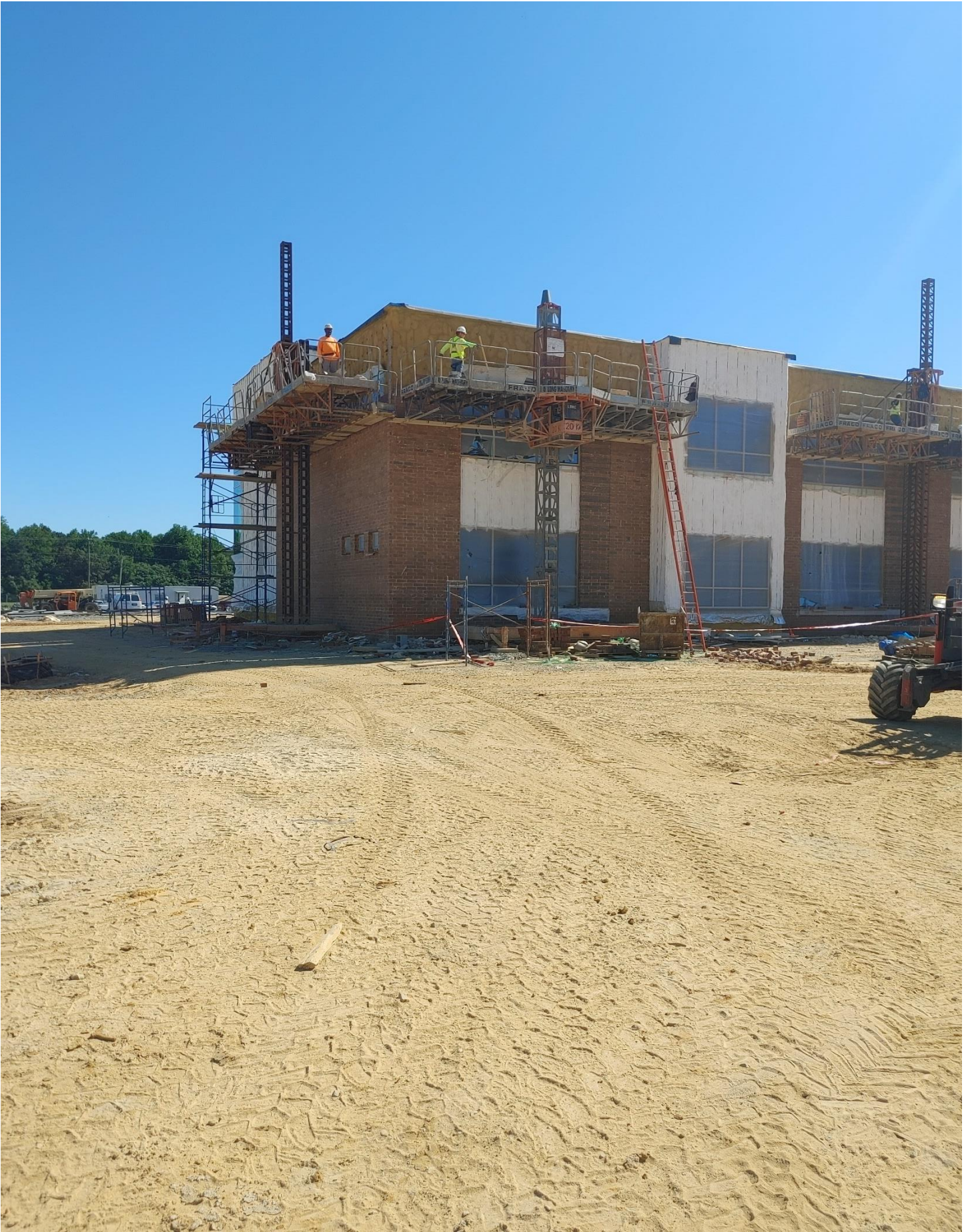
Photo 4 - Masons are laying brick on the West and South side of Area B.