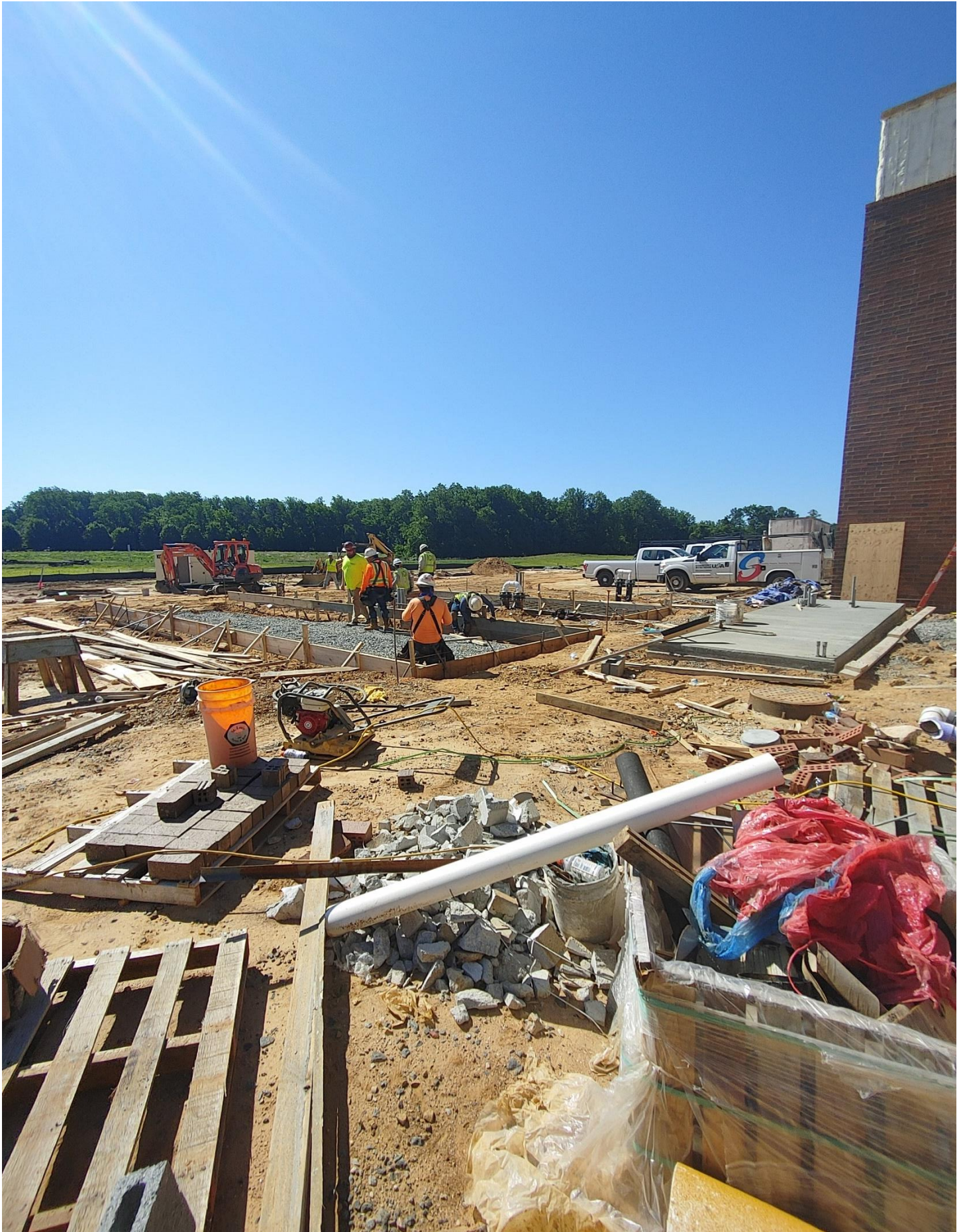
Photo 1 - Generator Pad has been poured. Forming up the Fuel Tank and Chiller slabs.