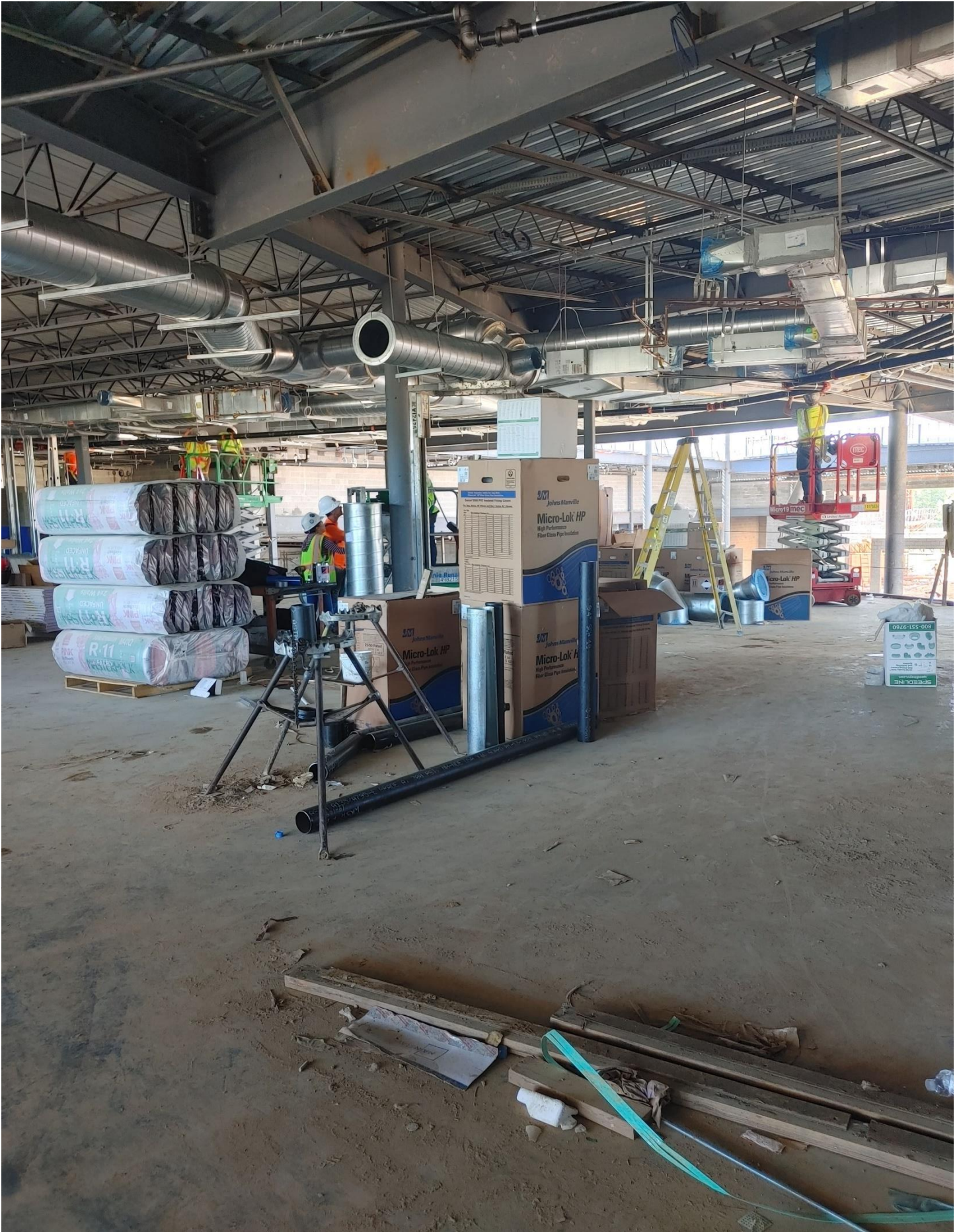
Photo 7 - Duct work is being run and pipe is being insulated in Area A.