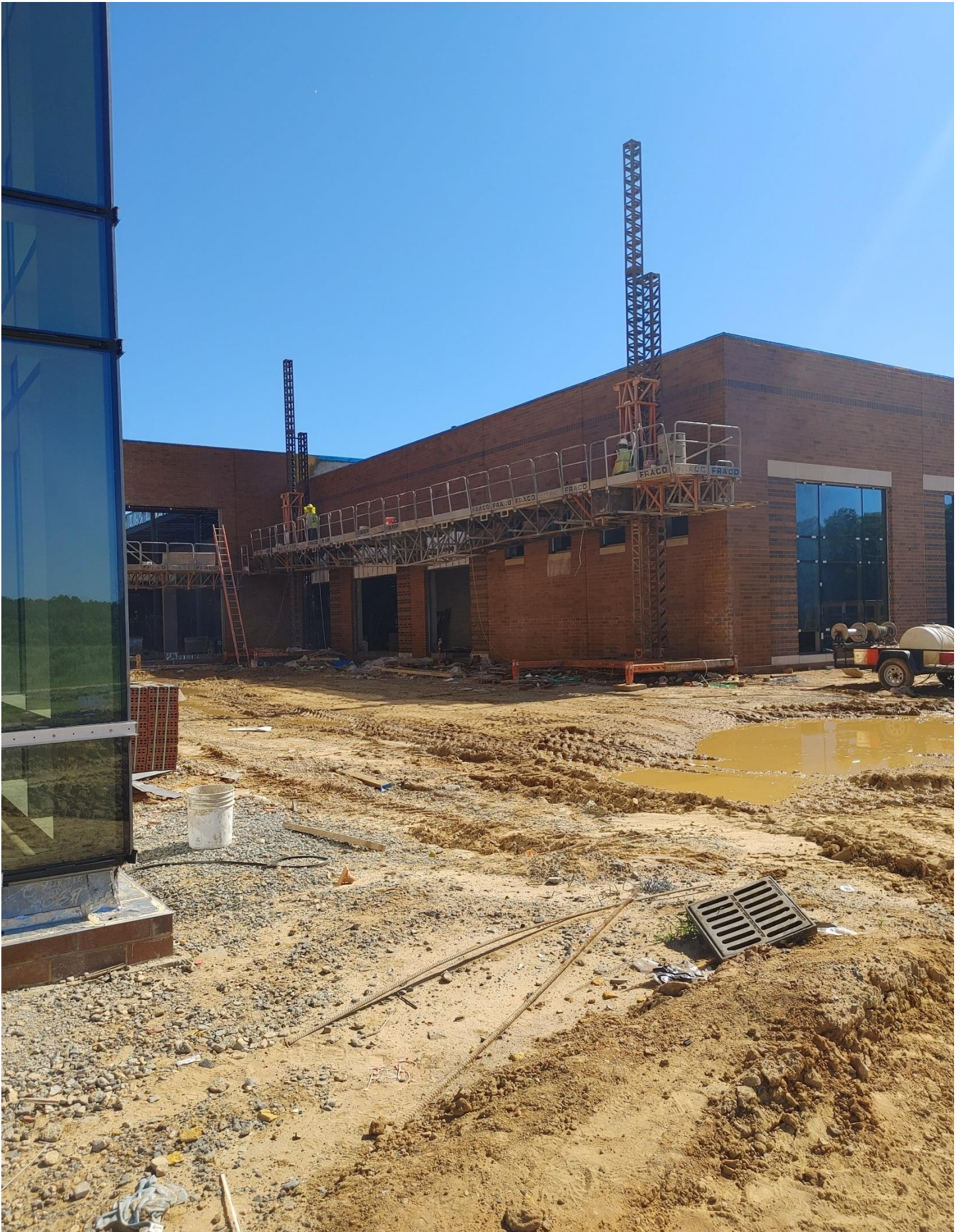
Photo 2 - Brick is being power washed on the West side of Area D.