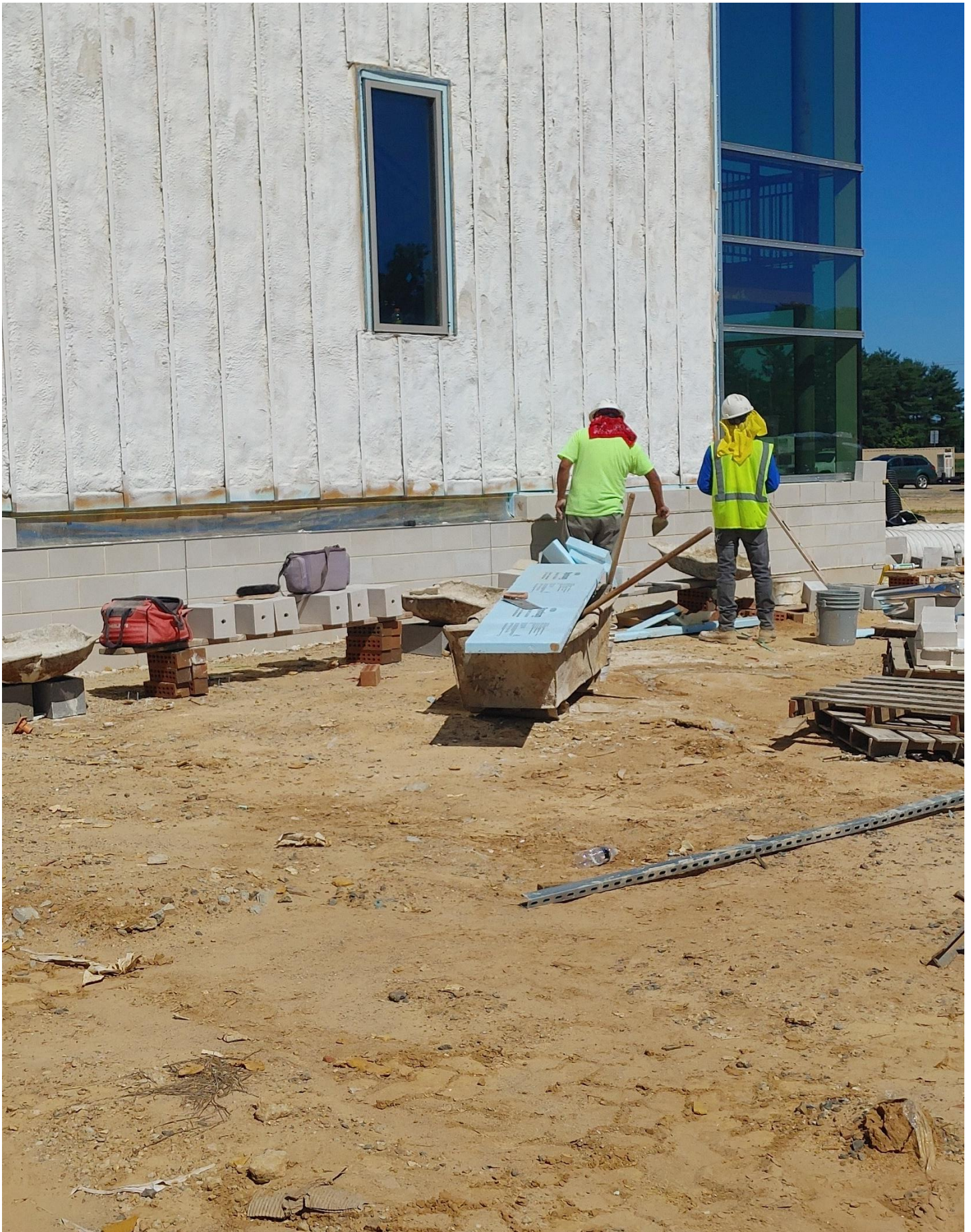
Photo 11 - Pre-cast is being laid on the East side of Stairwell #1.