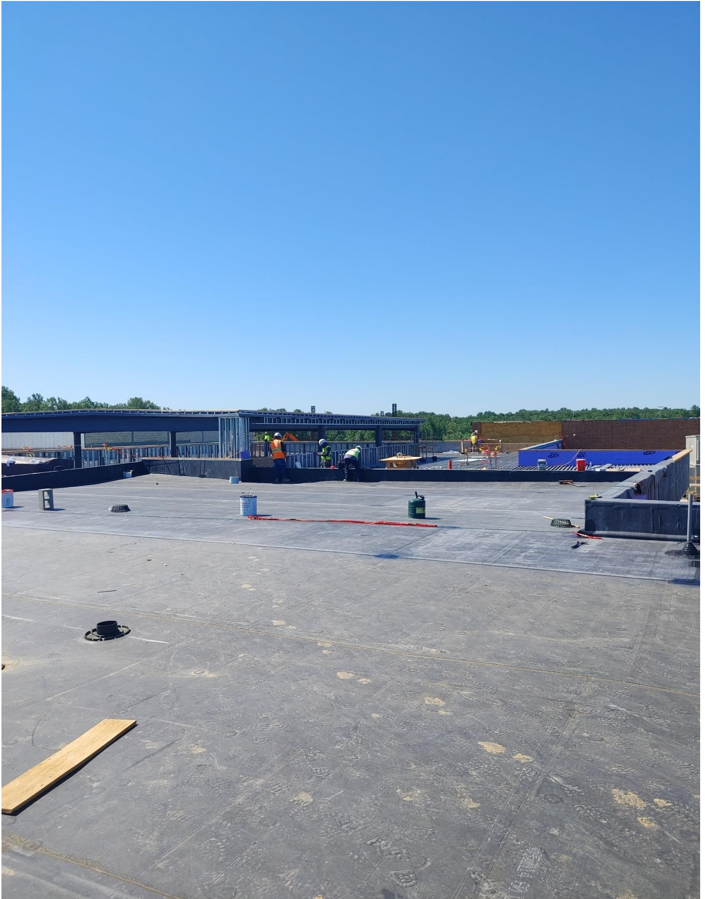
Photo 9 - Roofers are working on the Parapet Wall between Area A & C.