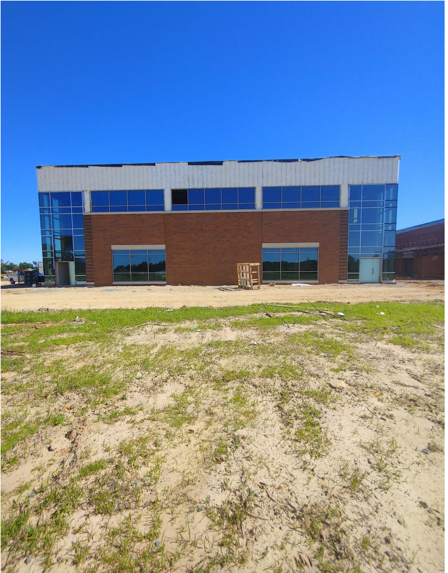
Photo 3 - All but two pieces of glass has been installed in the Gym.