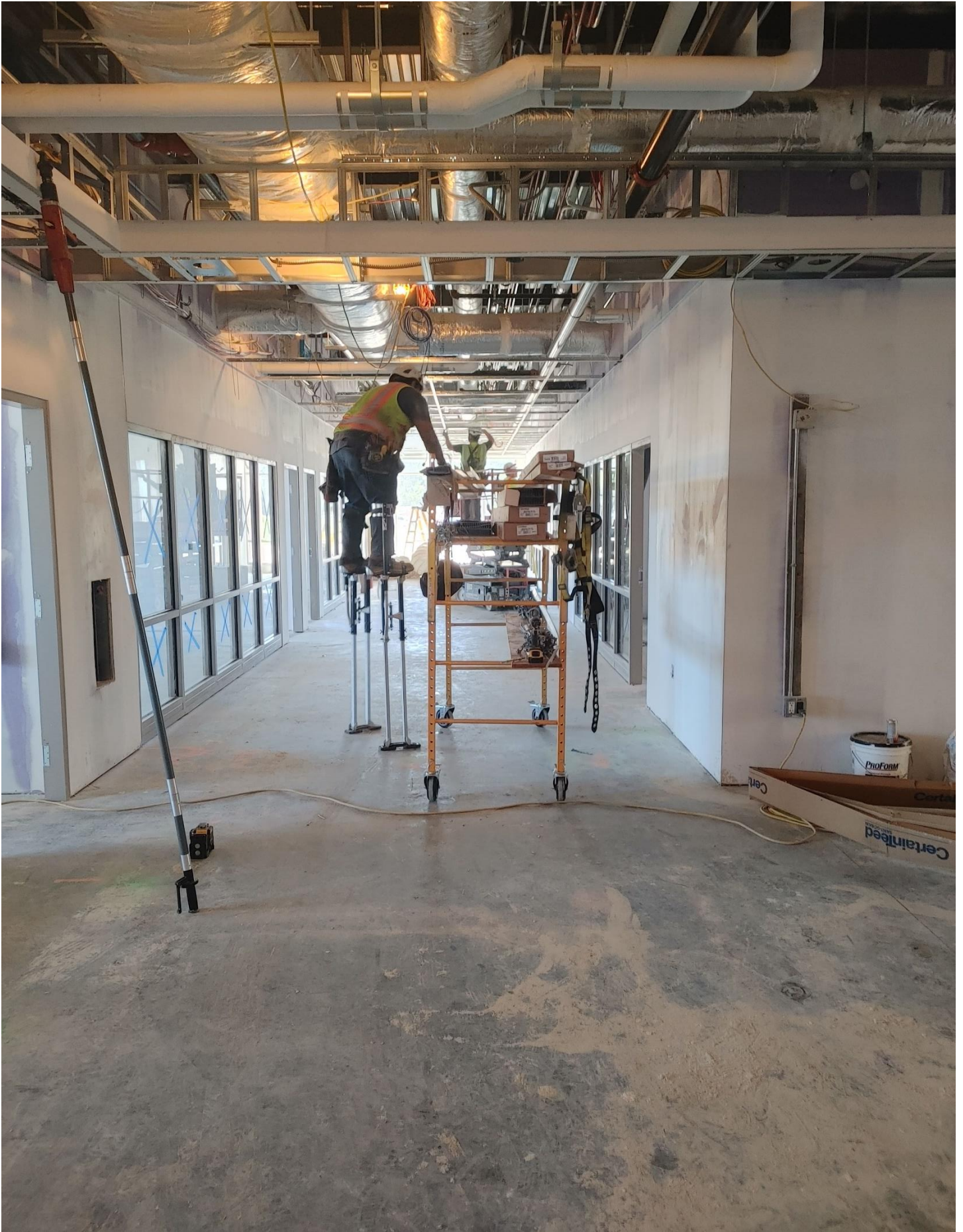
Photo 8 - Ceiling Grid is being run on the 1 st floor of Area A.