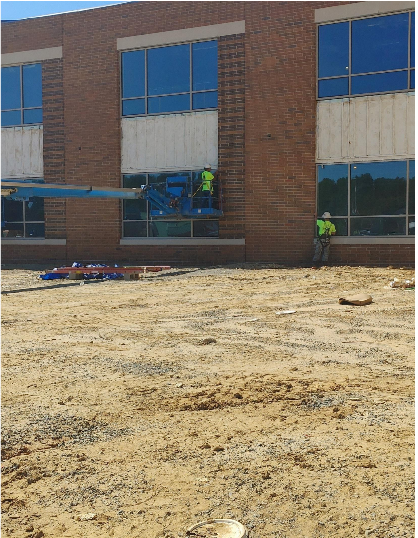
Photo 5 - FM&G installing Backer Rod around windows in Area A.