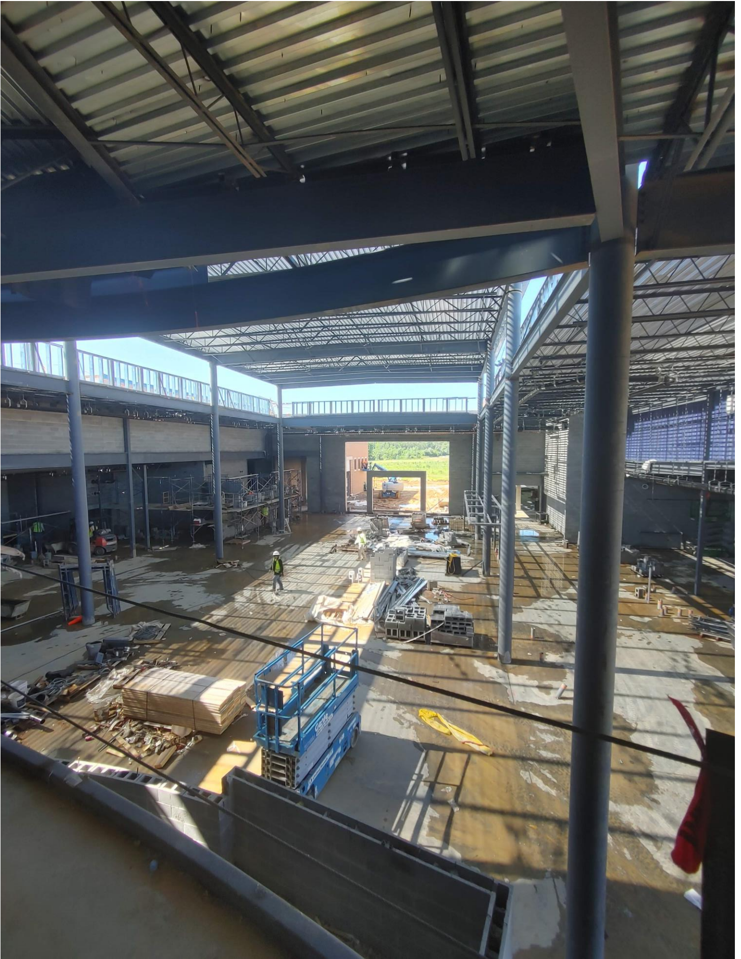
Photo 2 - View from the 2nd floor of Area A into Area C