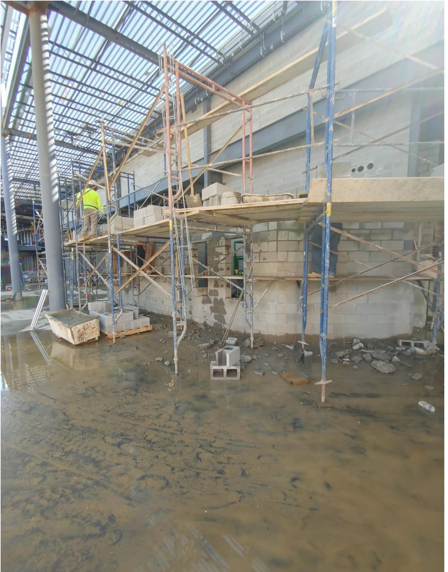
Photo 6 - Block is being laid in Area D, D117.