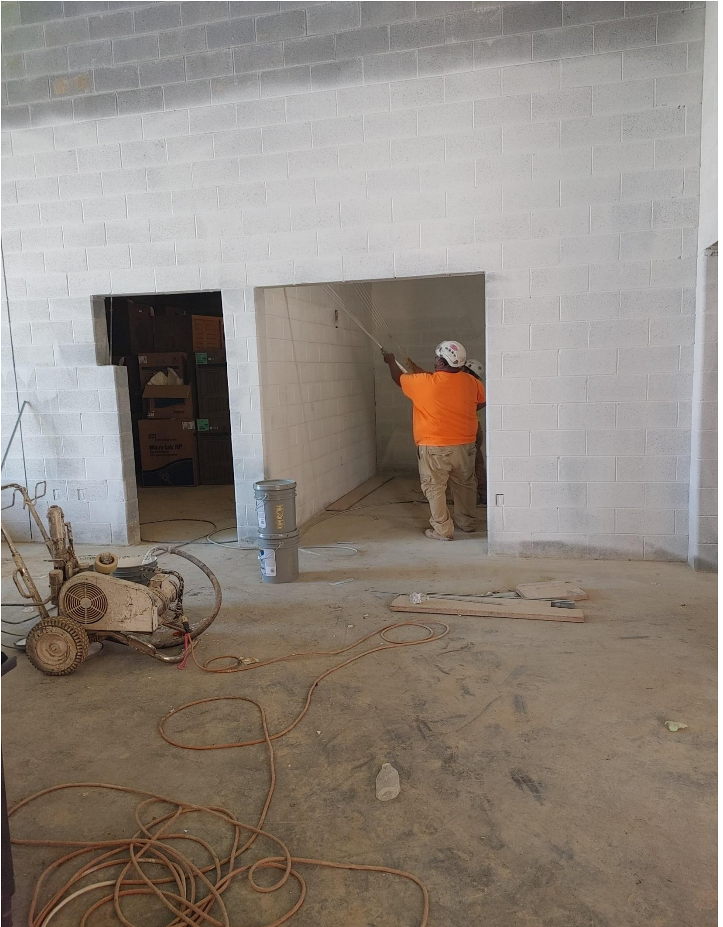
Photo 8 - Block filler is being sprayed and rolled in Area D, in room D125B