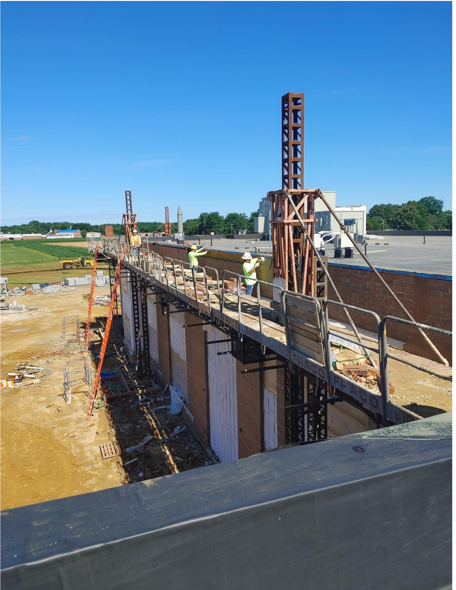
Photo 4 - Mason are laying Brick on the South side of Area B.