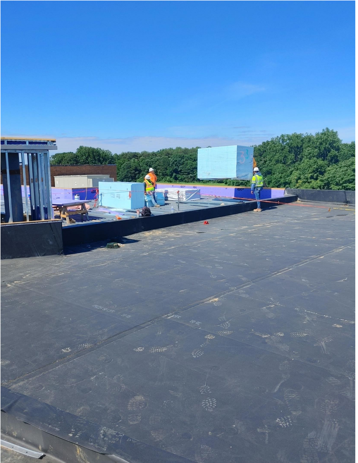
Photo 3 - Roofers are working on the Roof of Area C.