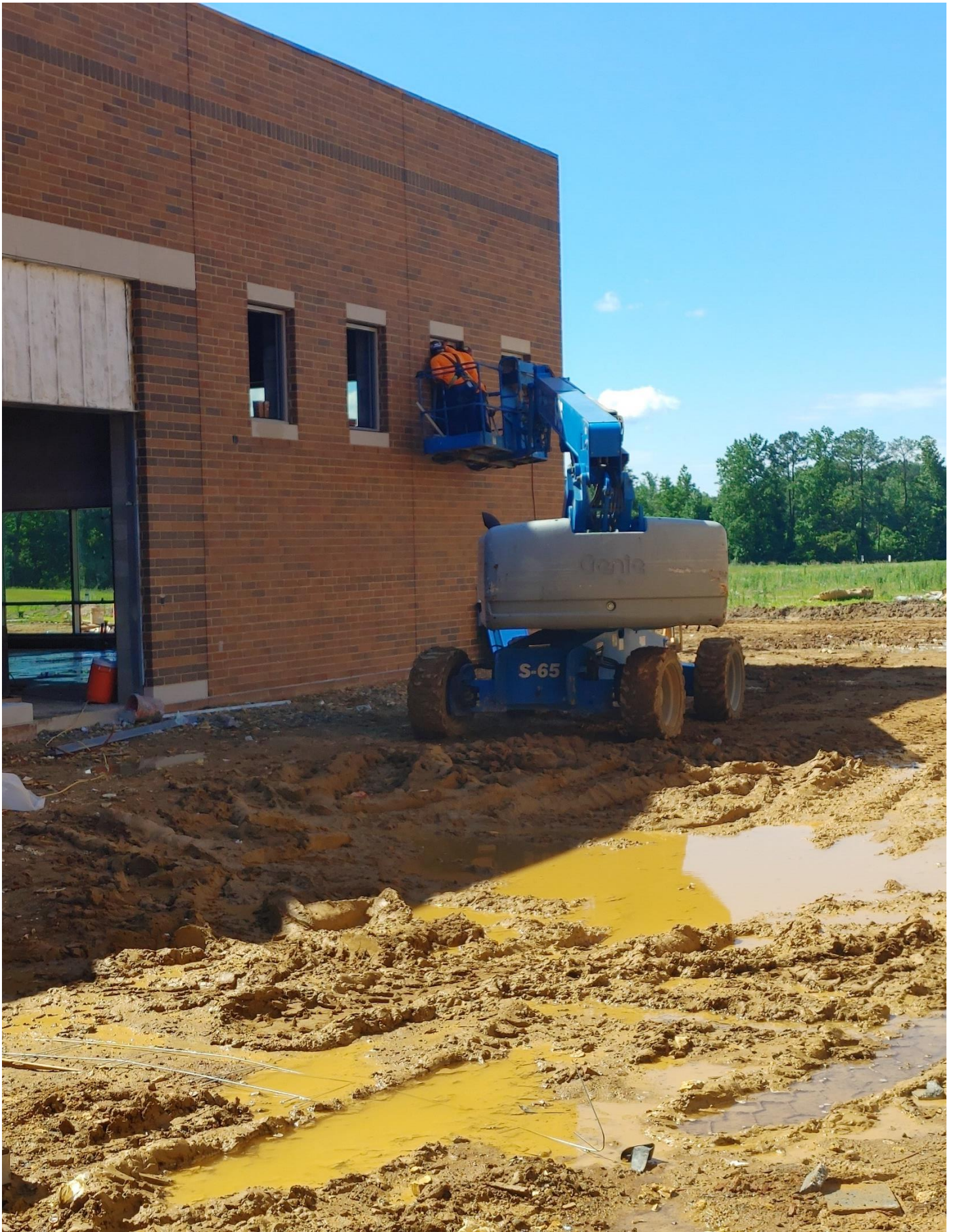
Photo 5 - Frames being installed by FG&M on the West side of Area D