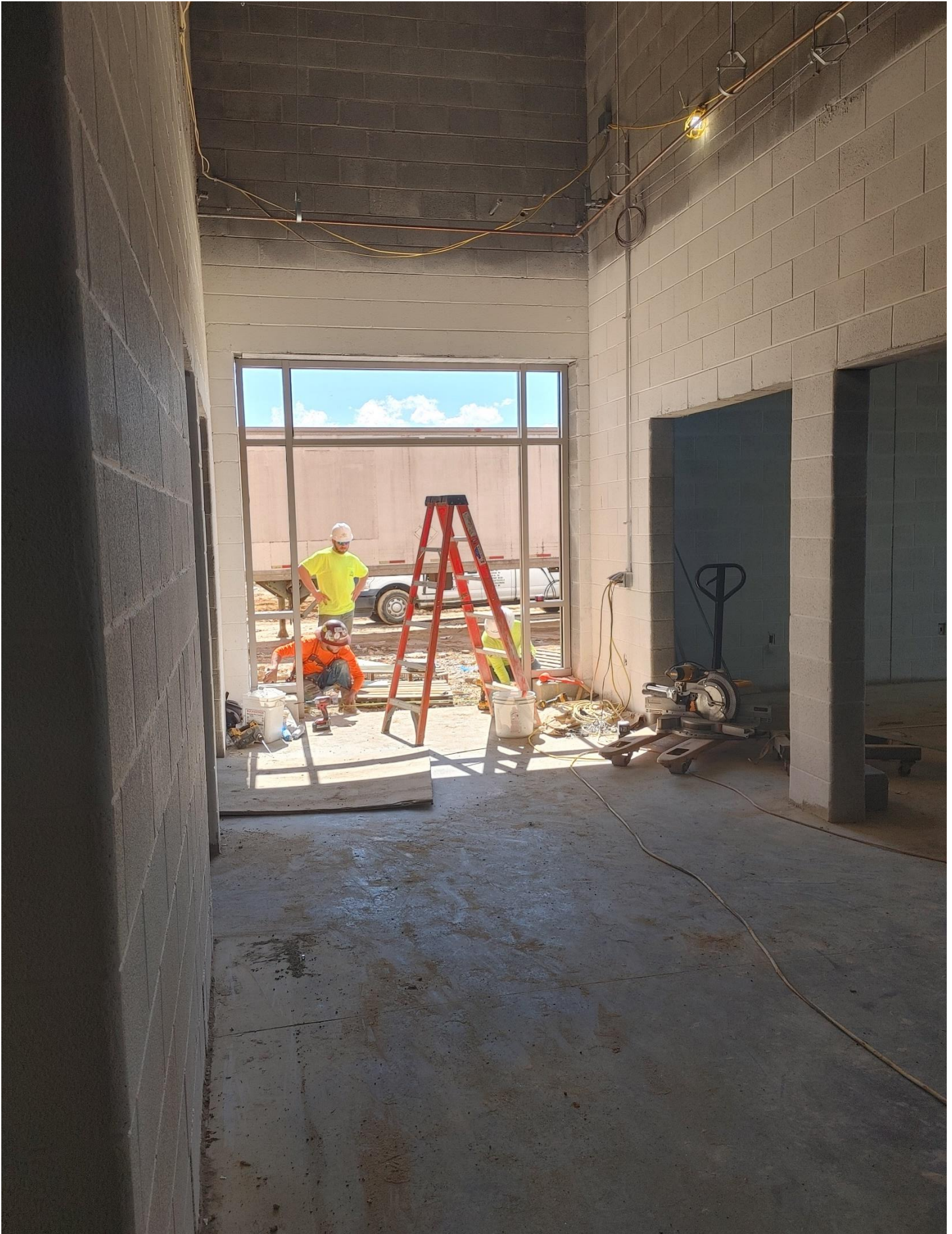
Photo 7 - Storefront SF21 is being set on the East side of Area D.