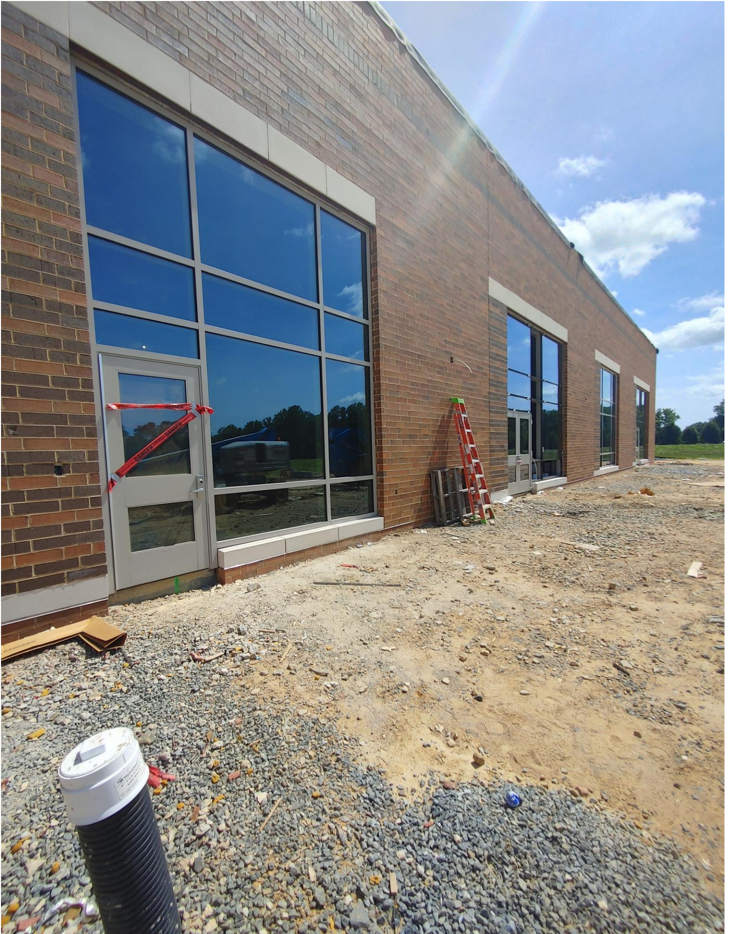
Photo 7 - Doors have been set in CW6 & CW7 on the South side of Area D