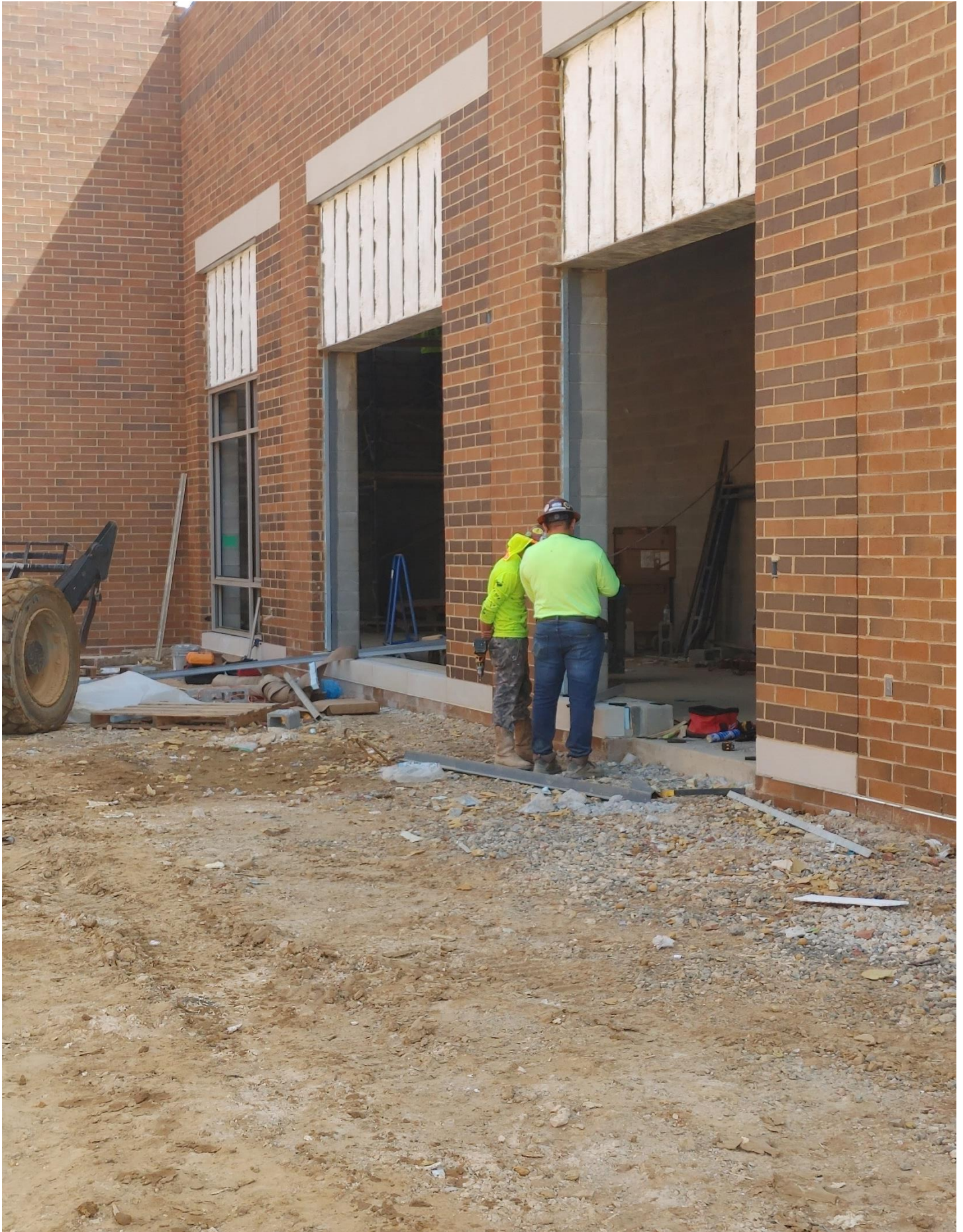
Photo 8 - FG&M is preparing openings to set SF22 & SF23