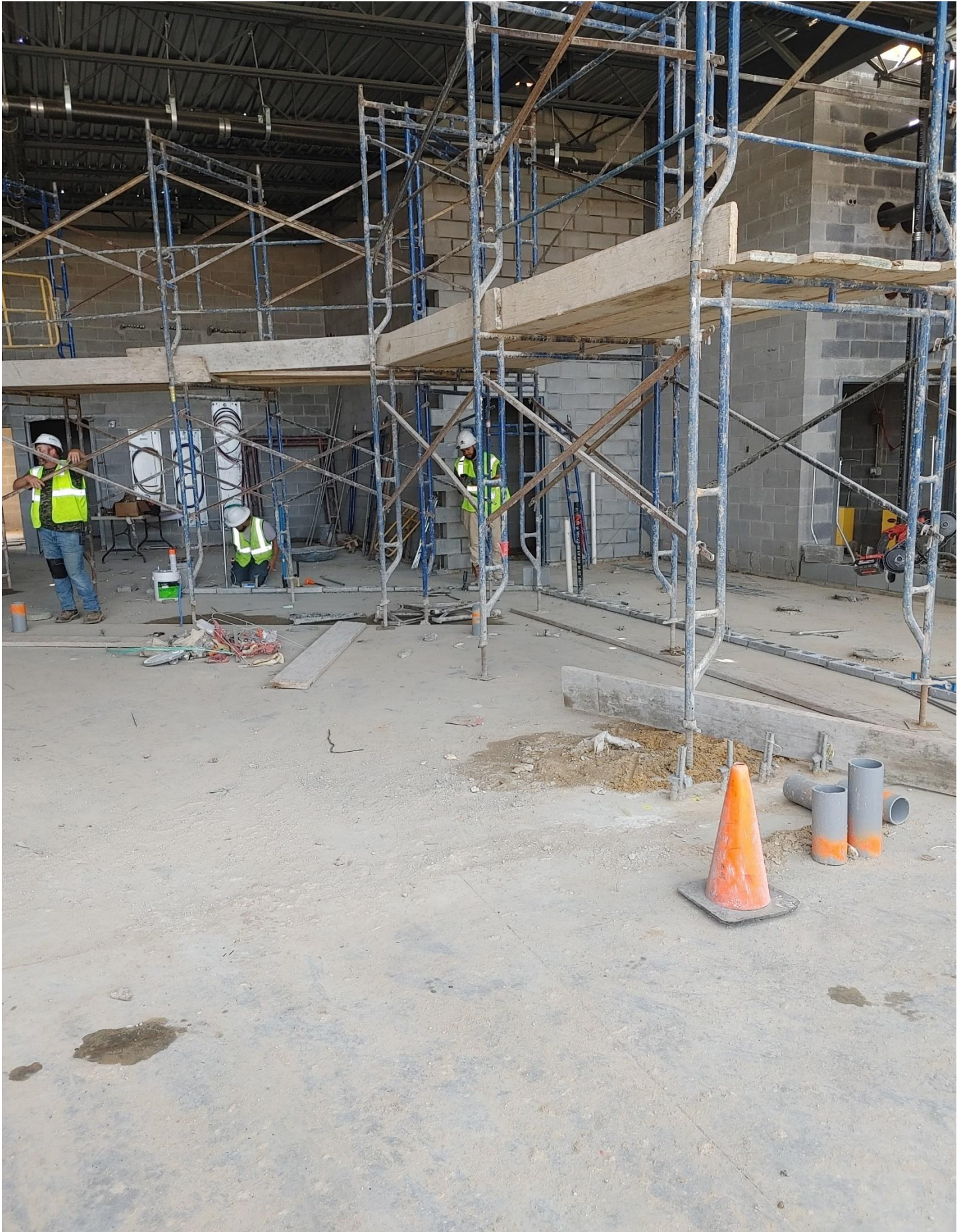
Photo 3 - Masons have begun to lay block for the wall that separates the dishwashing area from the Kitchen. Electricians are running conduit in this picture.