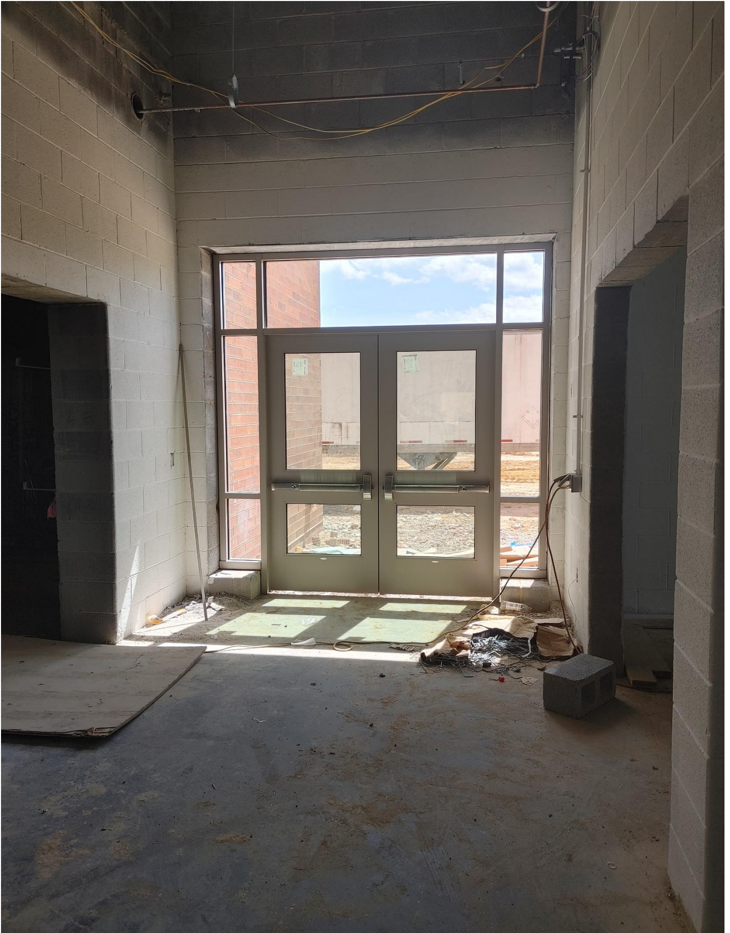
Photo 6 - Doors have been set in SF21.