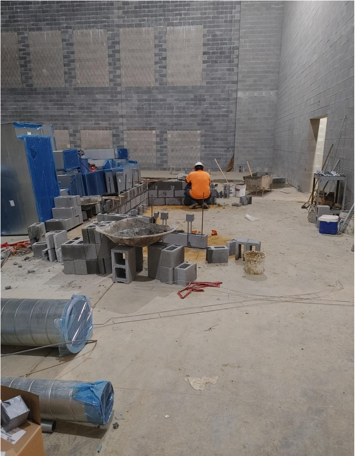
Photo 5 - Mason is laying block in the Auditorium.