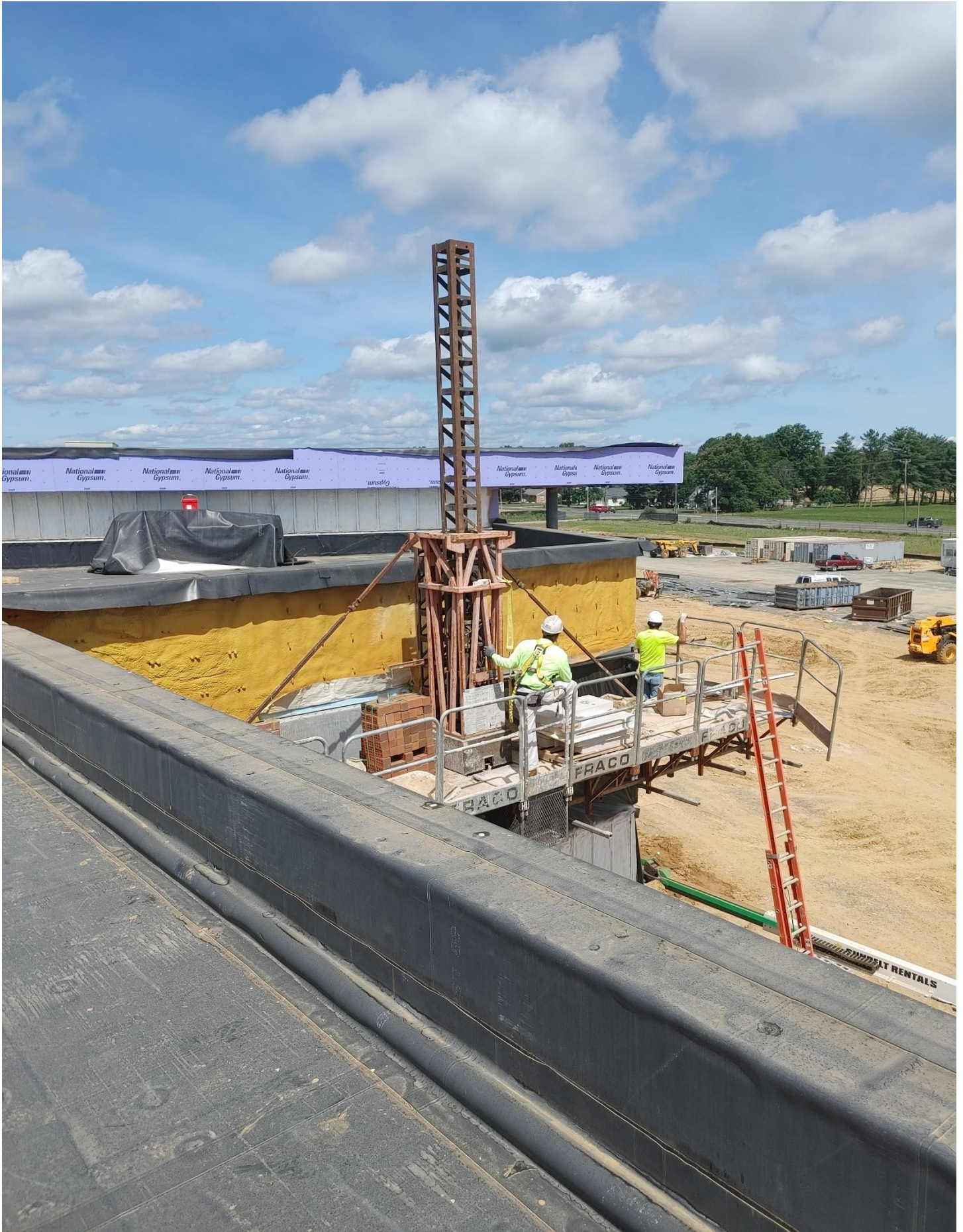
Photo 1 - Brick is being laid on the East side of Area A