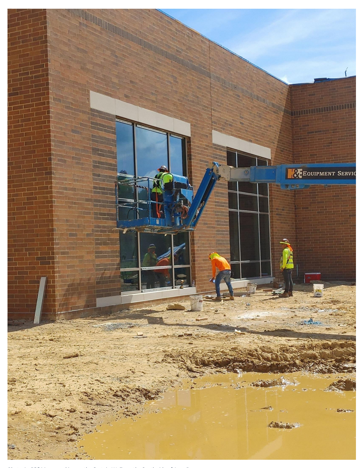
Photo 4 - FG&M are working on the Curtain Walls on the South side of Area D.