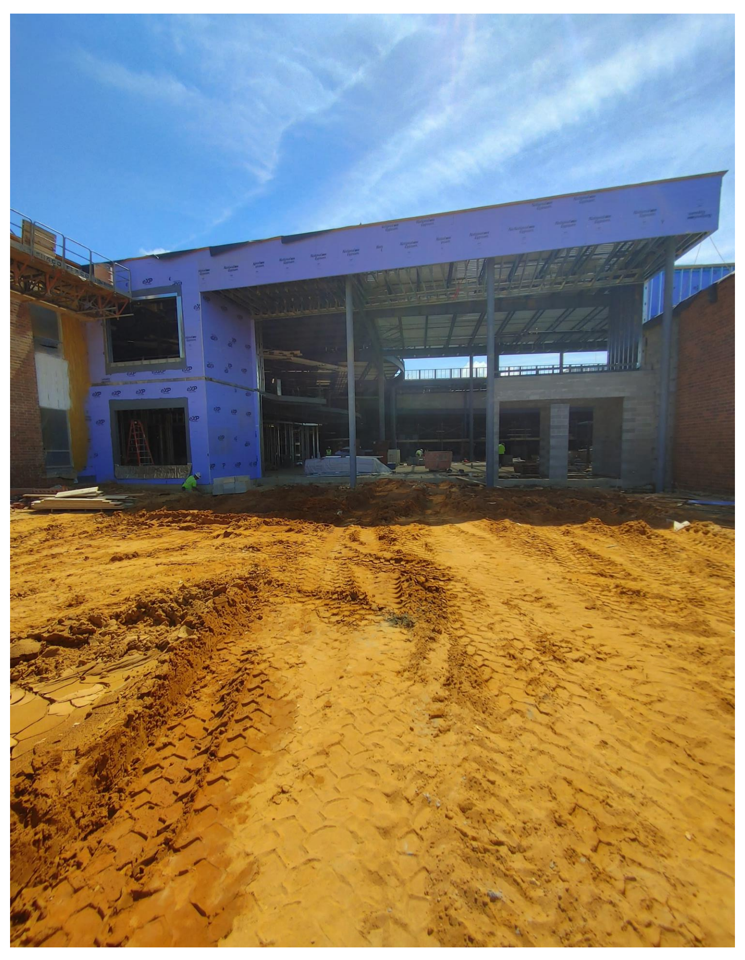
Photo 5 - Footer on the West side of Area C is being prepped for Precast.