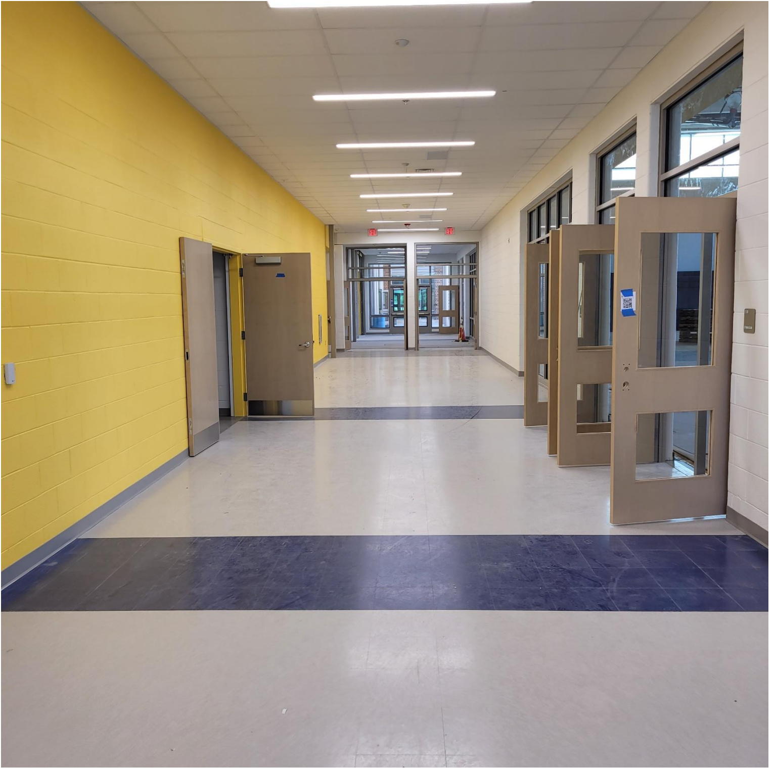
Photo 15 - Gymnasium Hallway looking East