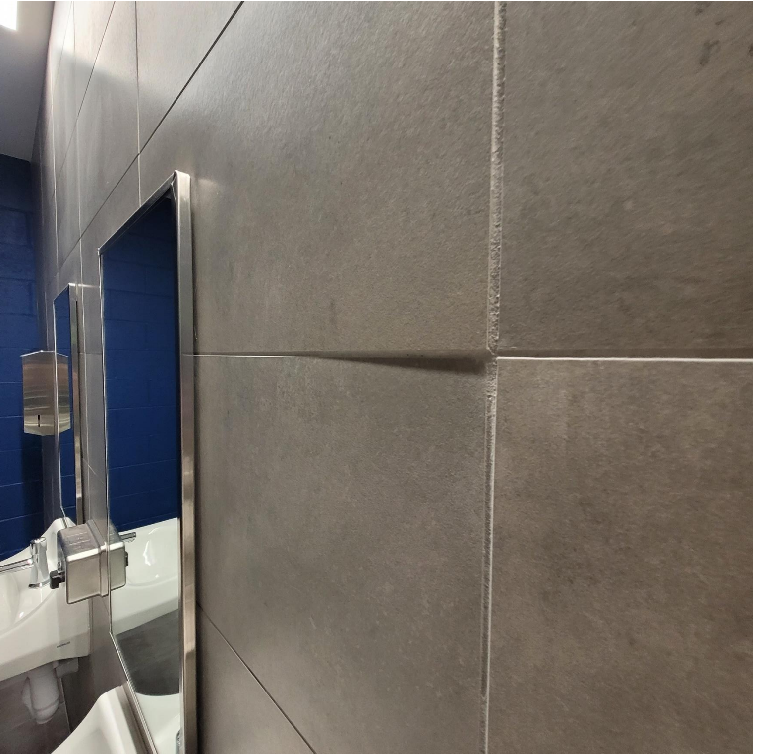
Photo 13 - Wall Tile in Boys Restroom E103