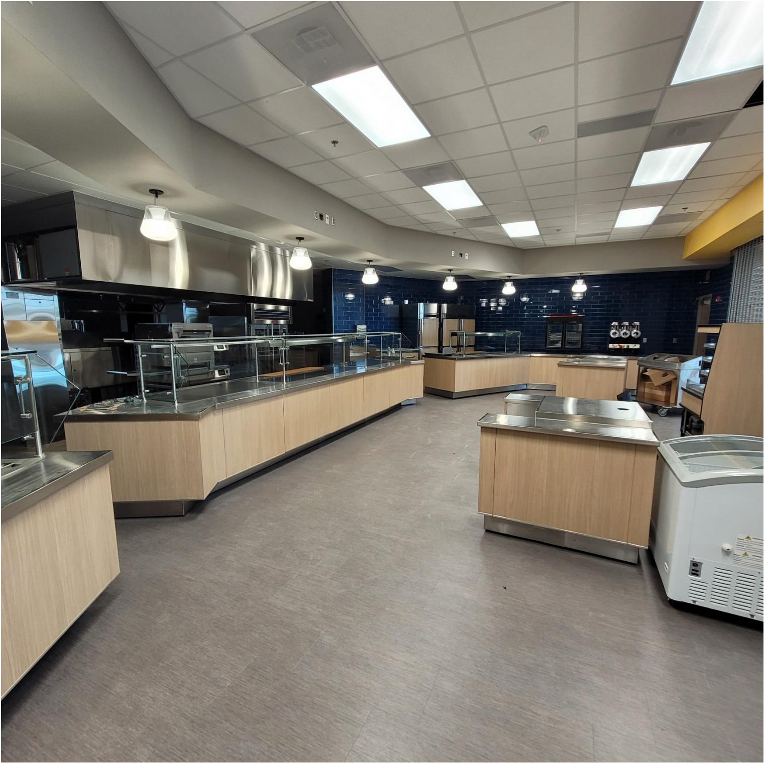
Photo 2 - Kitchen Serving Line