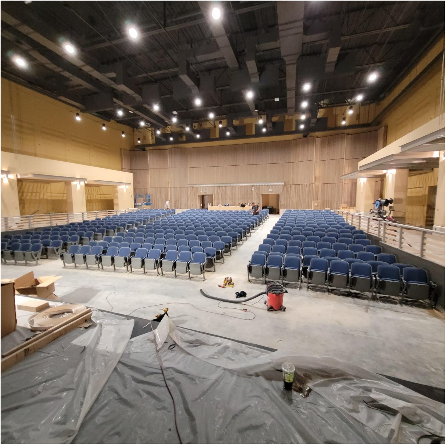
Photo 5 - Auditorium Seats are being installed