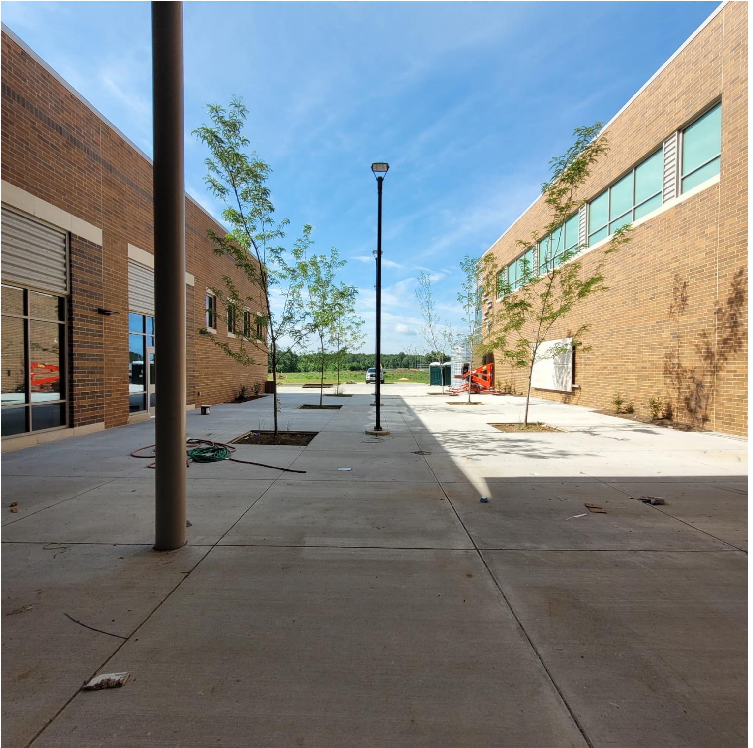
Photo 12 - Courtyard between Areas D & E