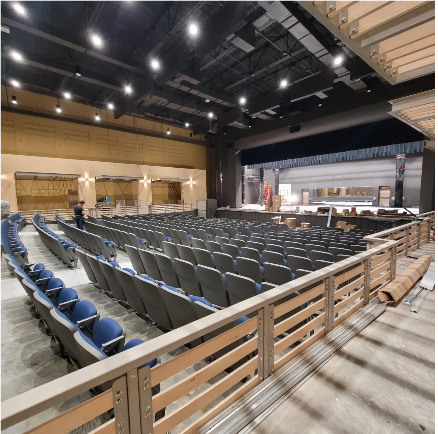
Photo 6 - Auditorium and Stage