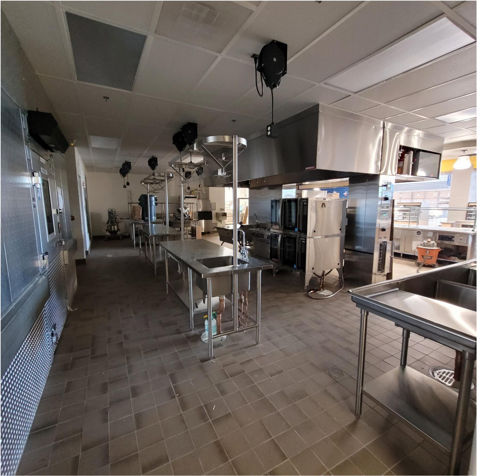
Photo 3 - Kitchen Prep Area