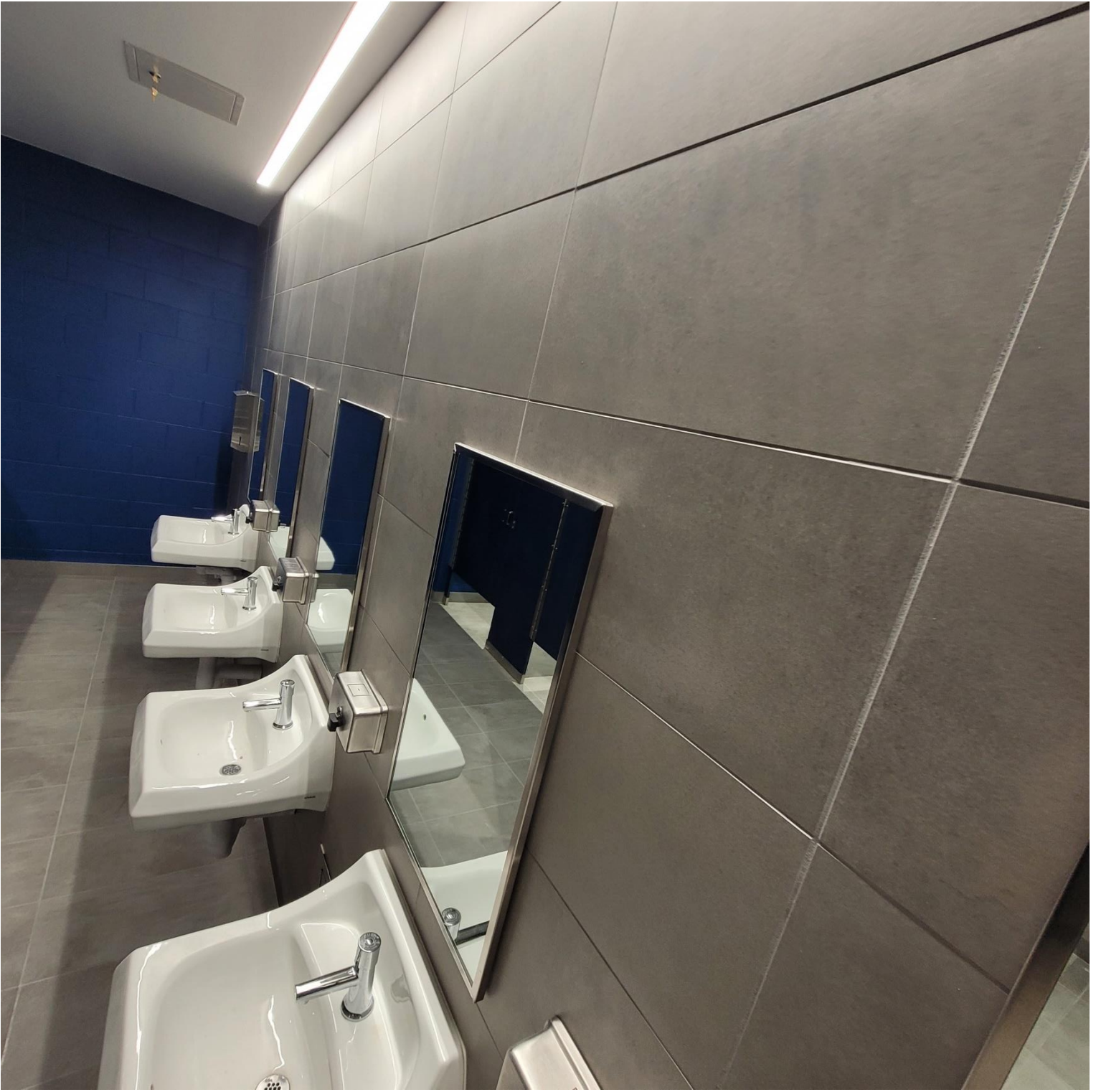
Photo 14 - Wall Tile in E103