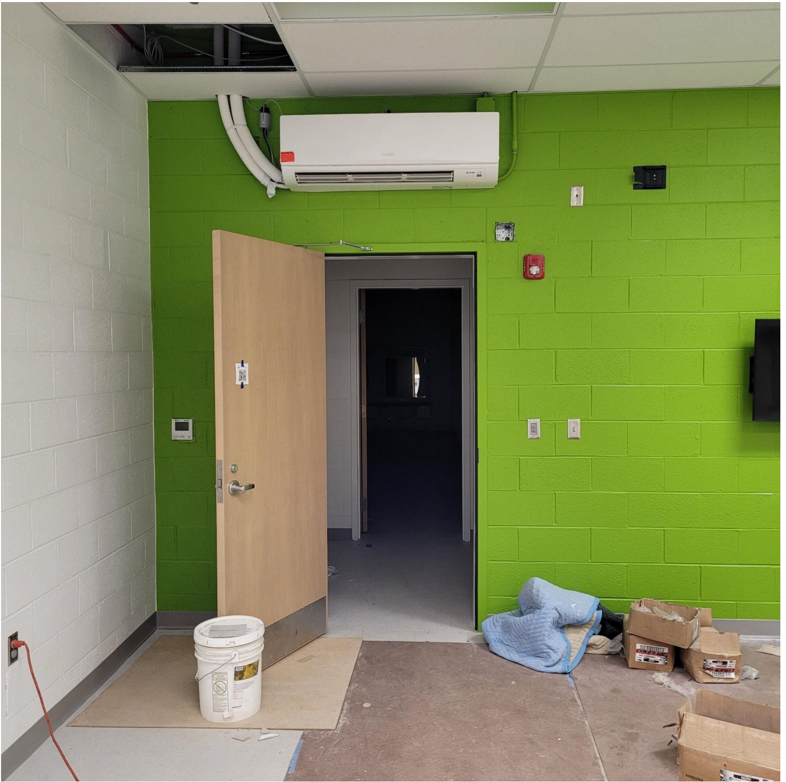
Photo 7 - Dressing Room #132 HVAC Unit is mounted approximately 14" above Door Frame as compared to the next picture in Room #132 where it is mounted literally on top of the Door Frame.