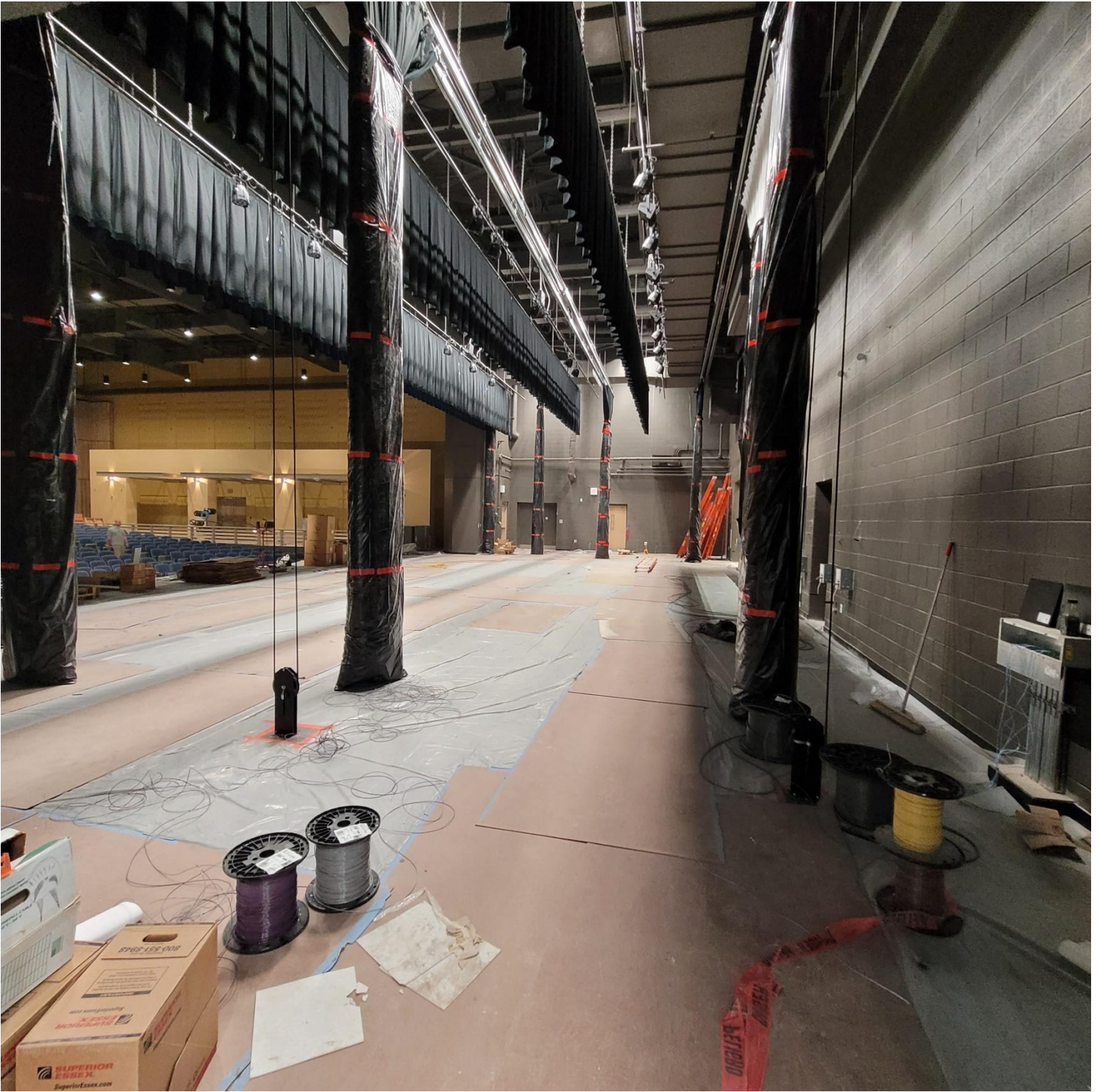
Photo 9 - Auditorium Stage