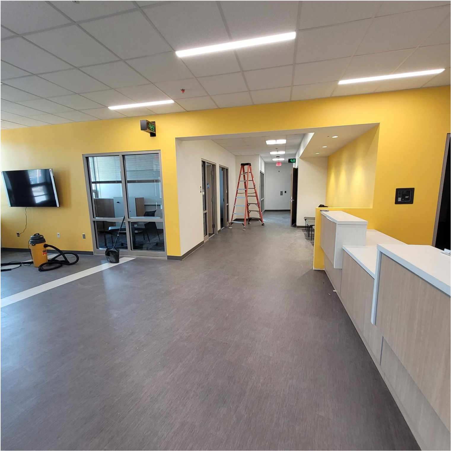
Photo 1 - Administrative Office Area