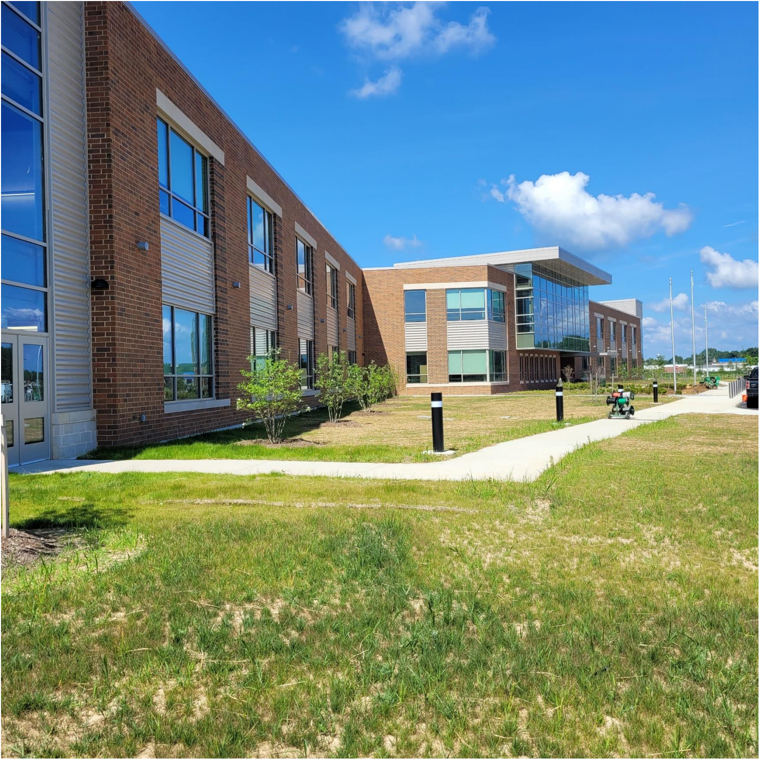
Photo 21 - Front of High School