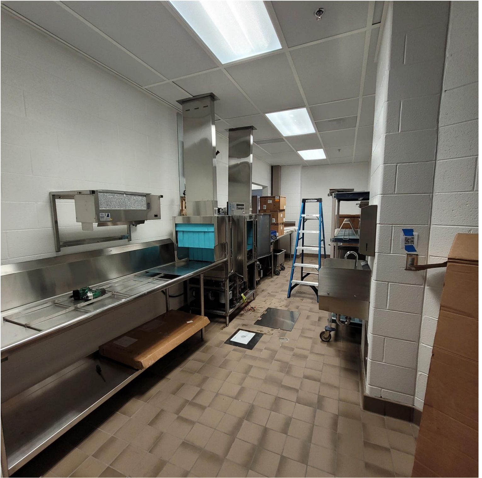
Photo 4 - Dishwasher Area