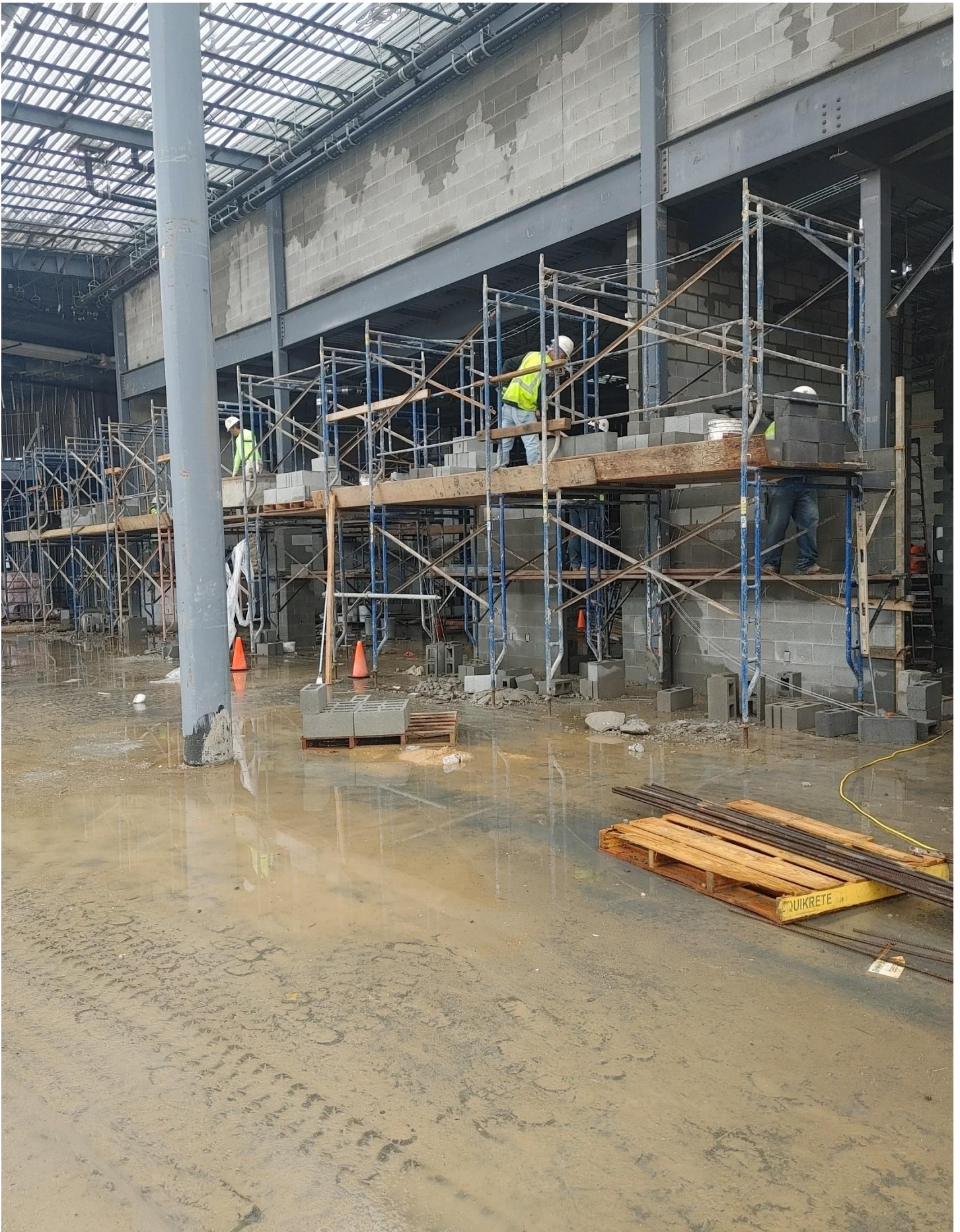
Photo 4 - Masons continue to lay block in the Kitchen