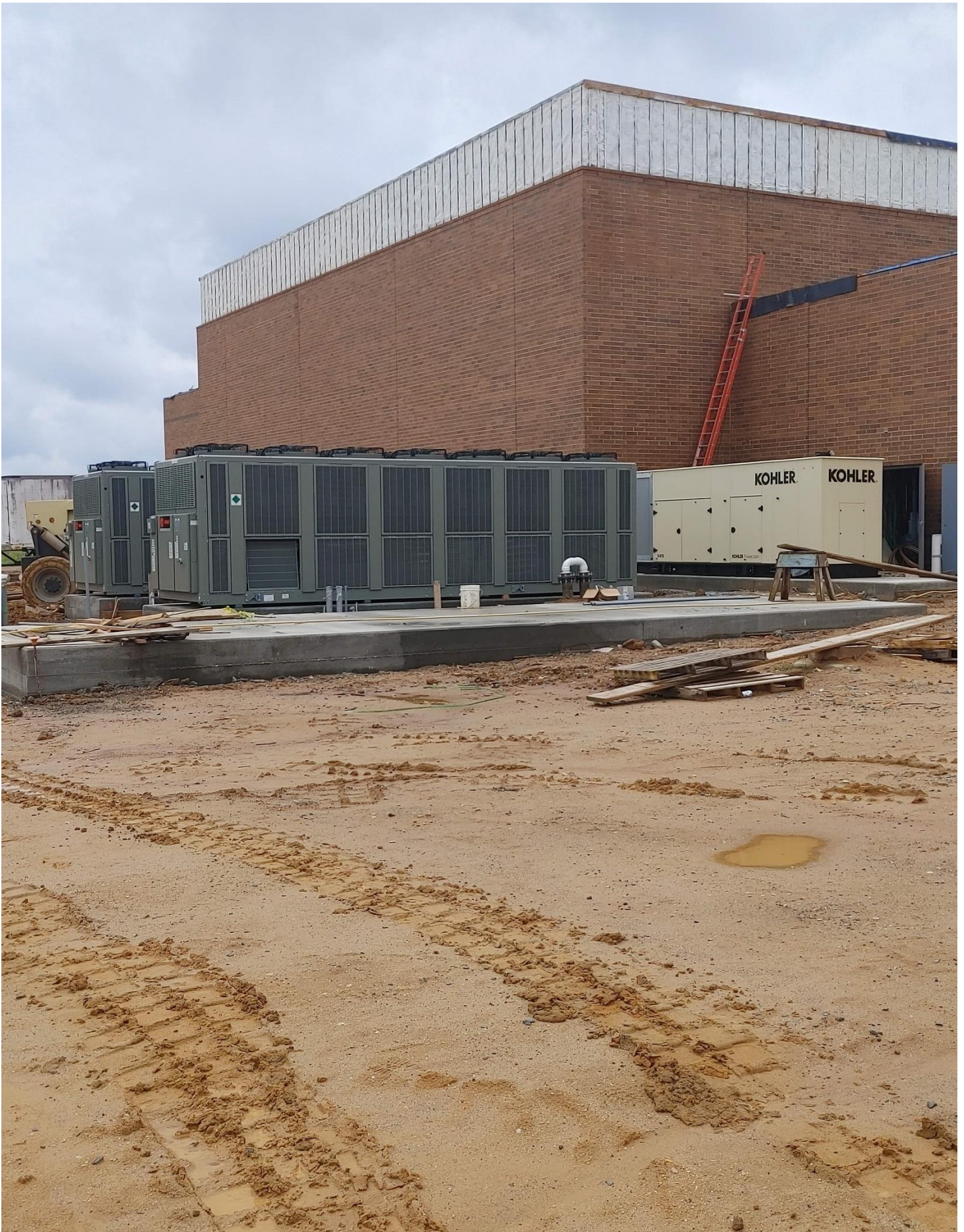
Photo 1 - Chillers and Generator have been set