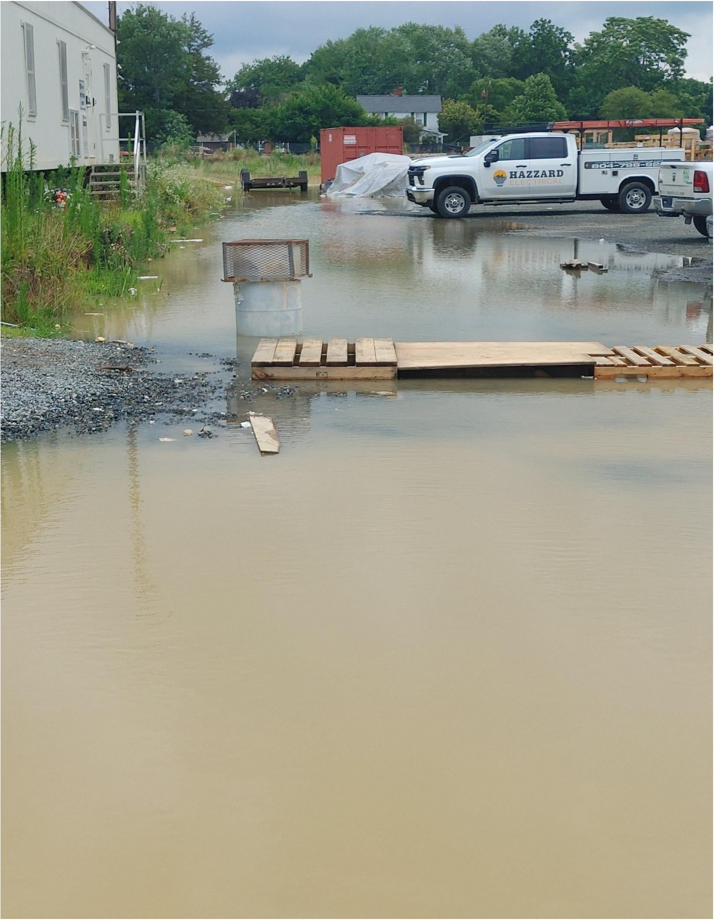
Photo 6 - Water is ponding in front of the Construction Trailers from the storms we received.