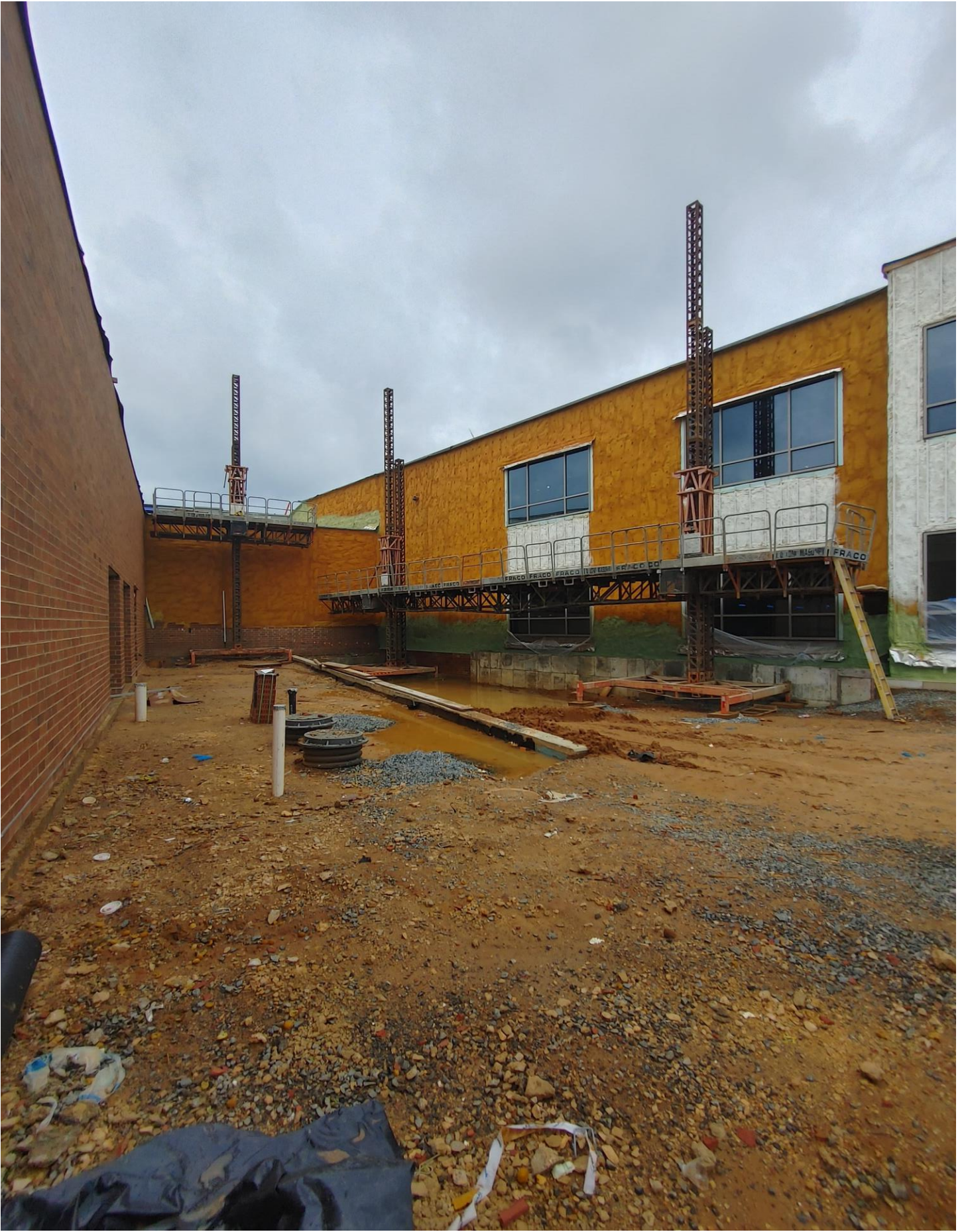
Photo 2 - FRACO has been set up on the South side of Area A