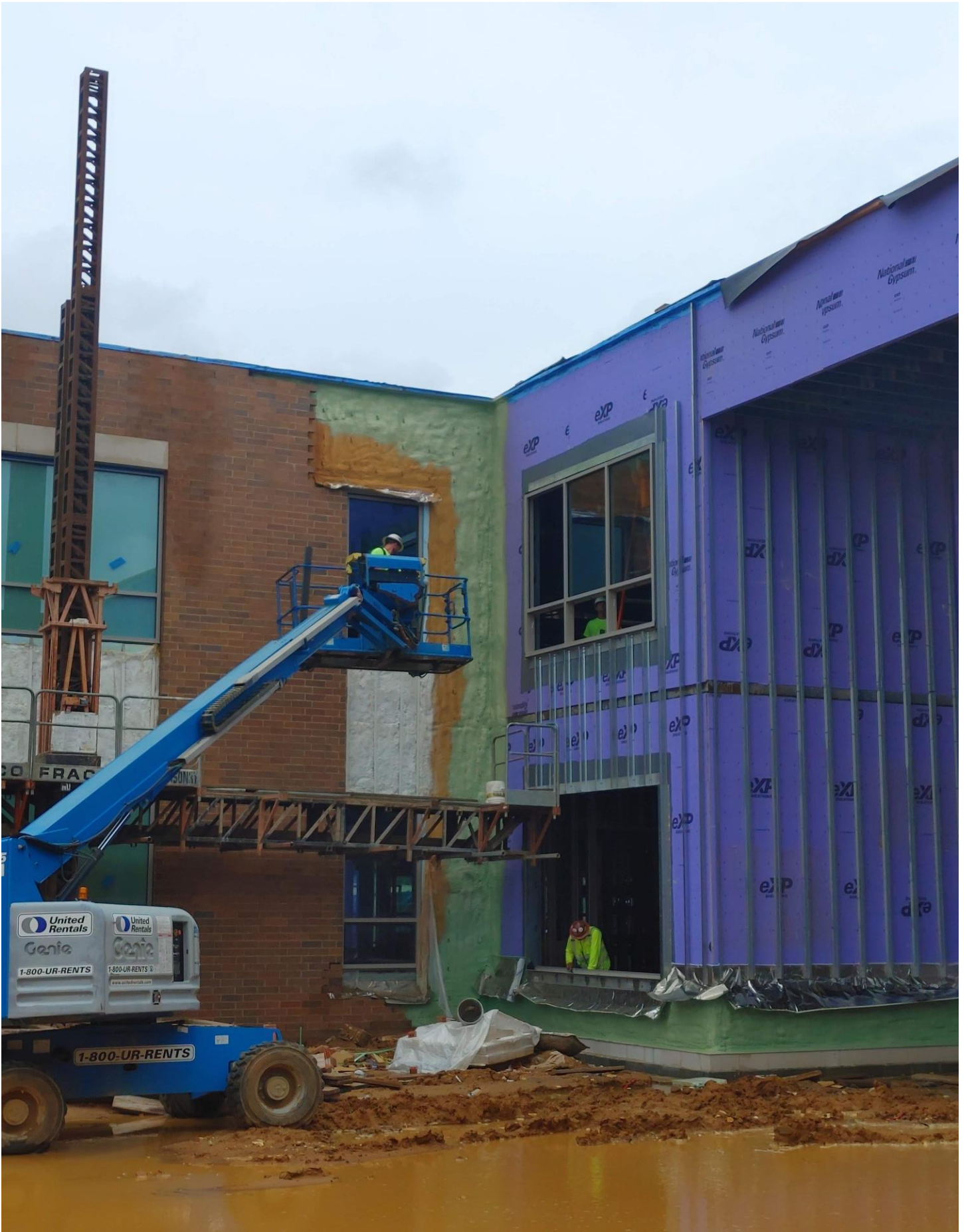
Photo 5 - Glass being set on the South side of Area B and the West side of Area C.