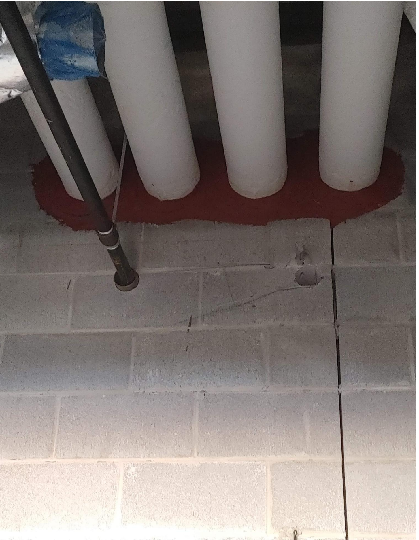
Photo 5 - Fire caulking has been applied around pipe in Area A