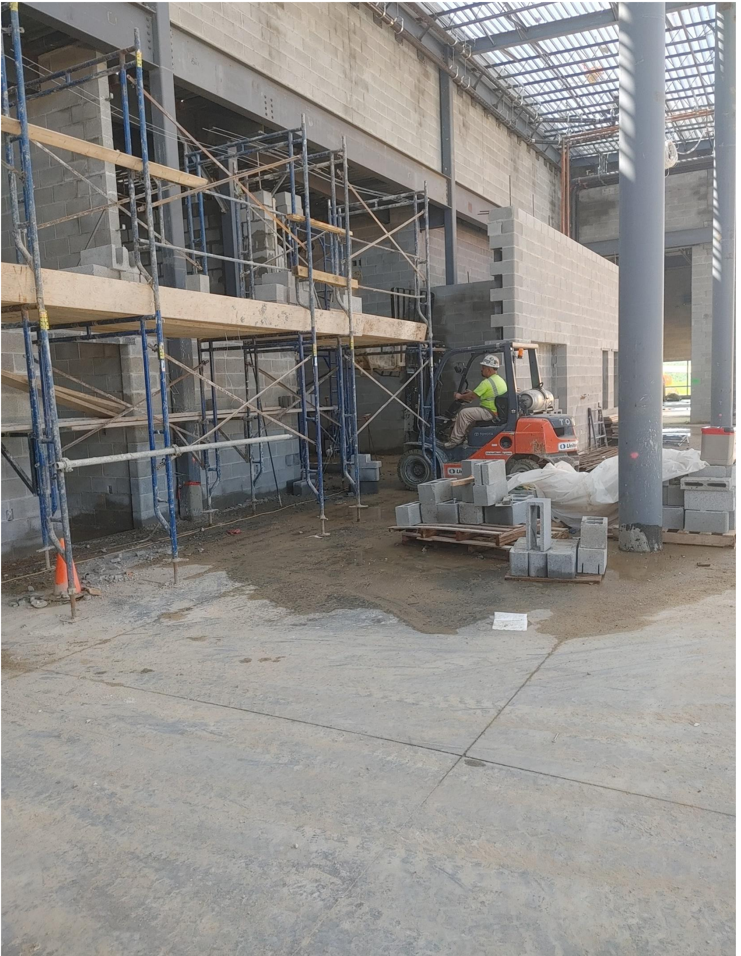
Photo 6 - Masons continue to lay block in the Kitchen area