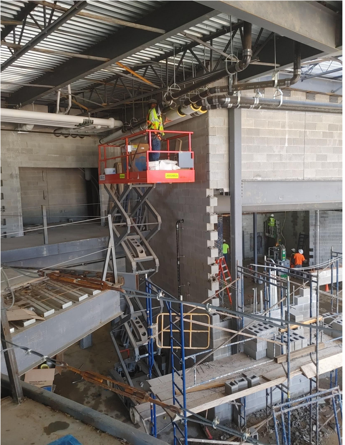
Photo 4 - Pipe being insulated in Area A