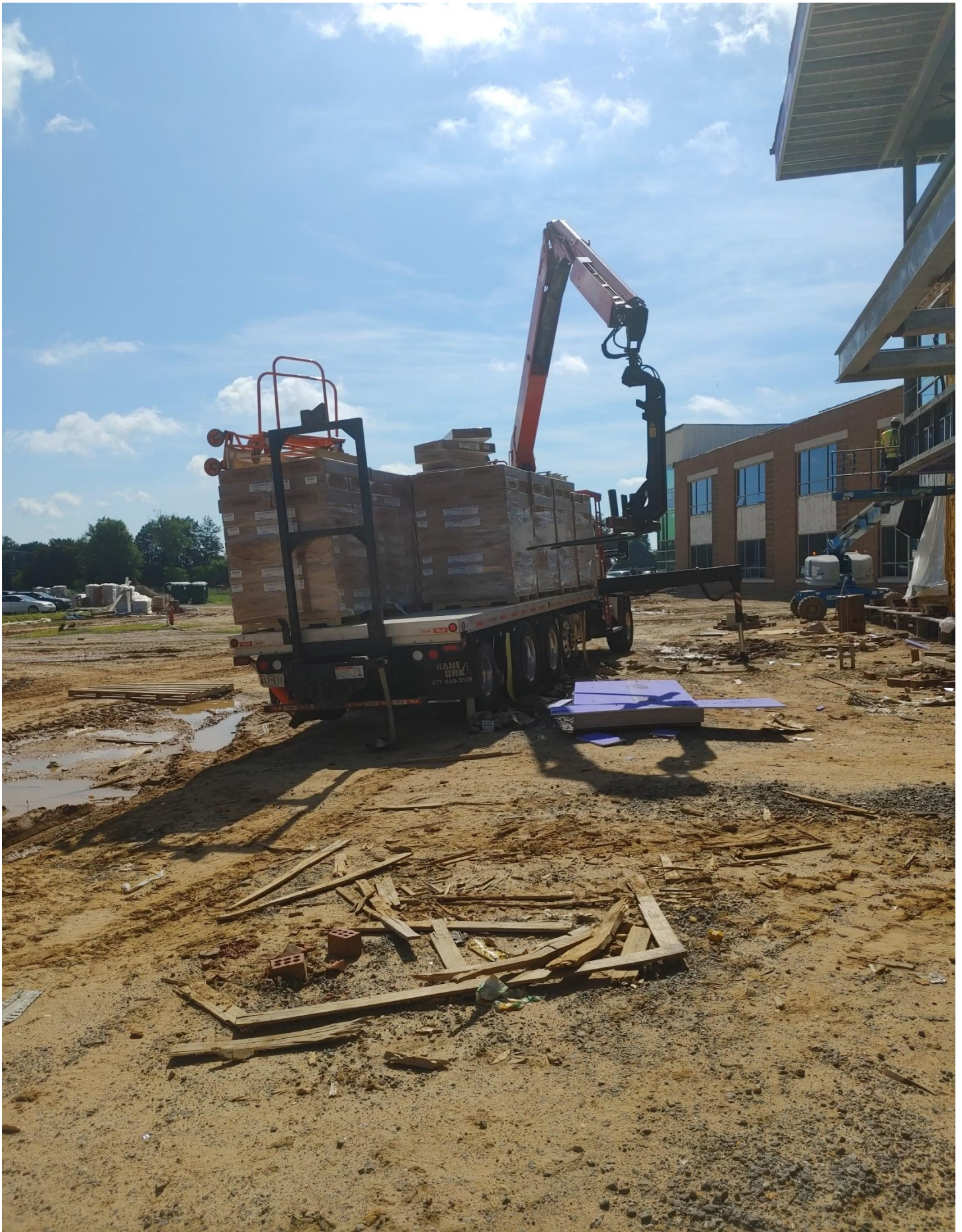
Photo 1 - A shipment of Acoustical Ceiling tile is being off loaded on to the 2nd floor of Area A