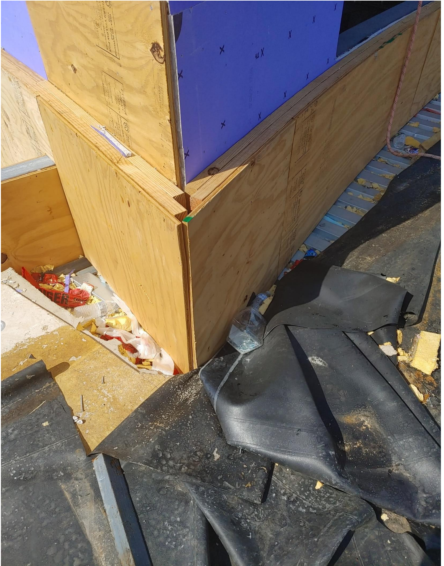
Photo 3 - Trash and debris on the metal pan in areas around parapet wall in Area C needs to be cleaned before roofing material is applied