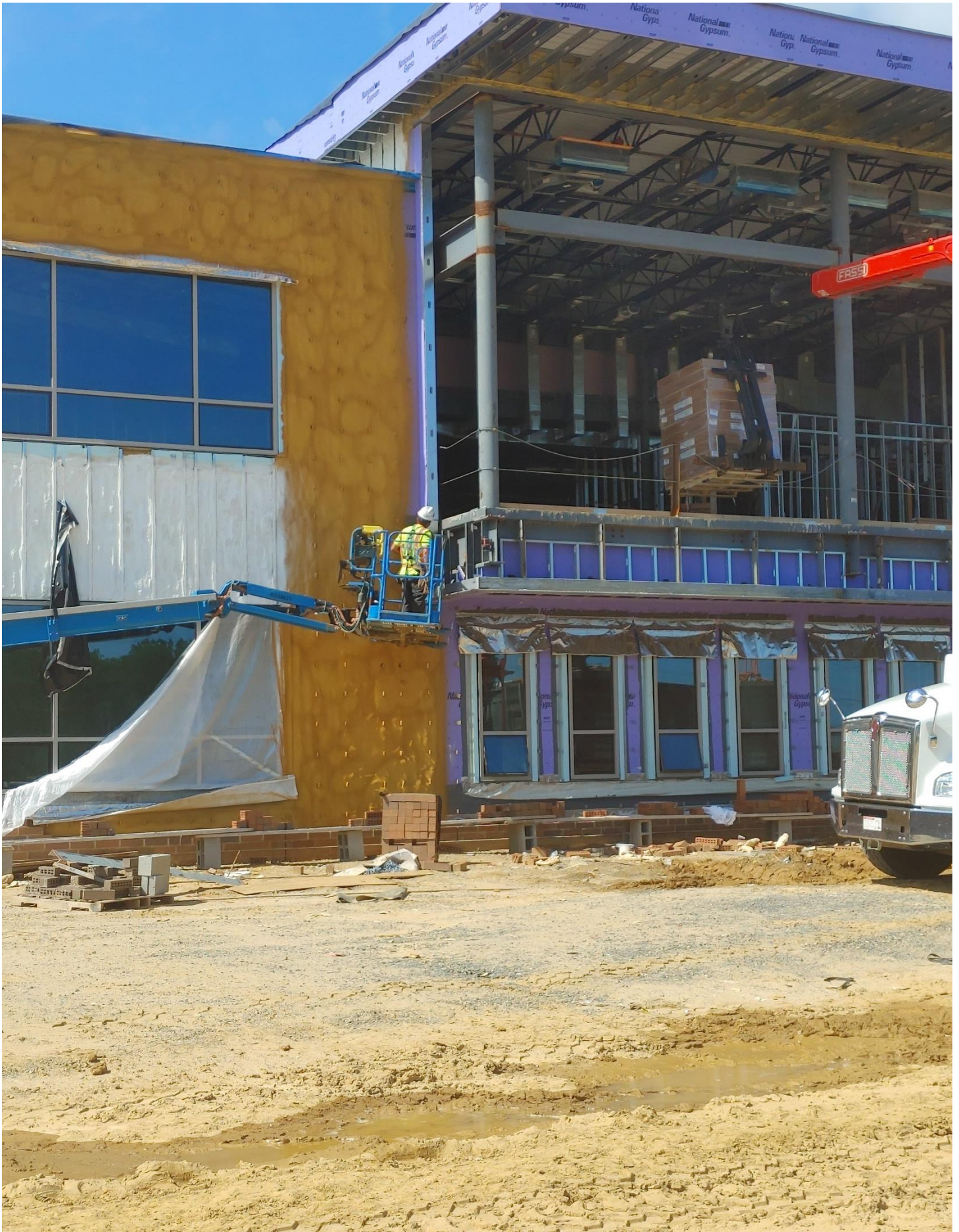
Photo 8 - Metal framing is going up on the front entrance