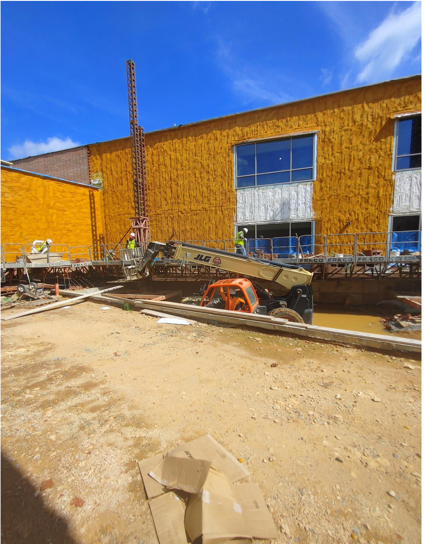
Photo 7 - Brick is being laid in the Loading Dock Area