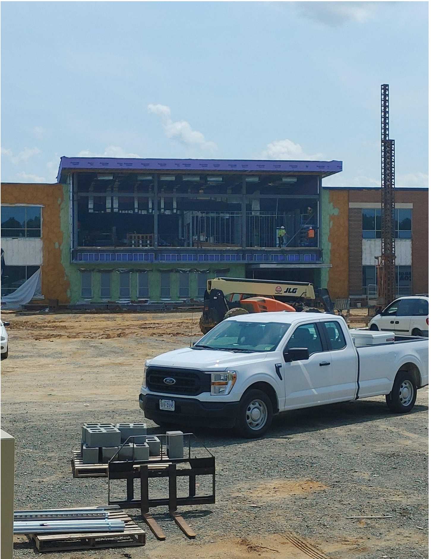
Photo 8 - Tailored Foam spray foamed the front of Area A. Green foam was sprayed today.