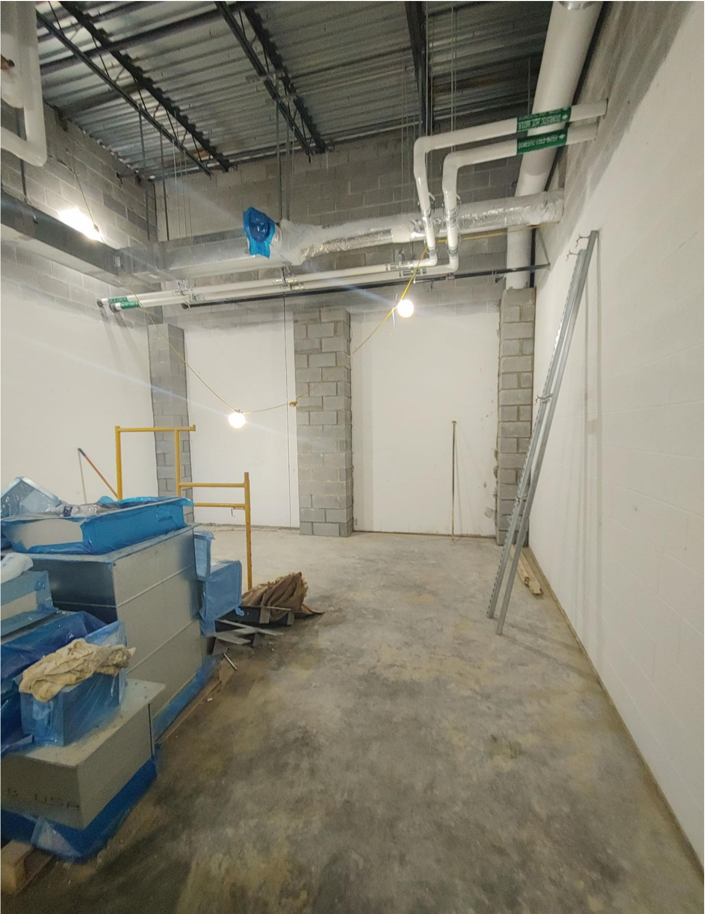
Photo 4 - The Masons are laying chase walls in Area e