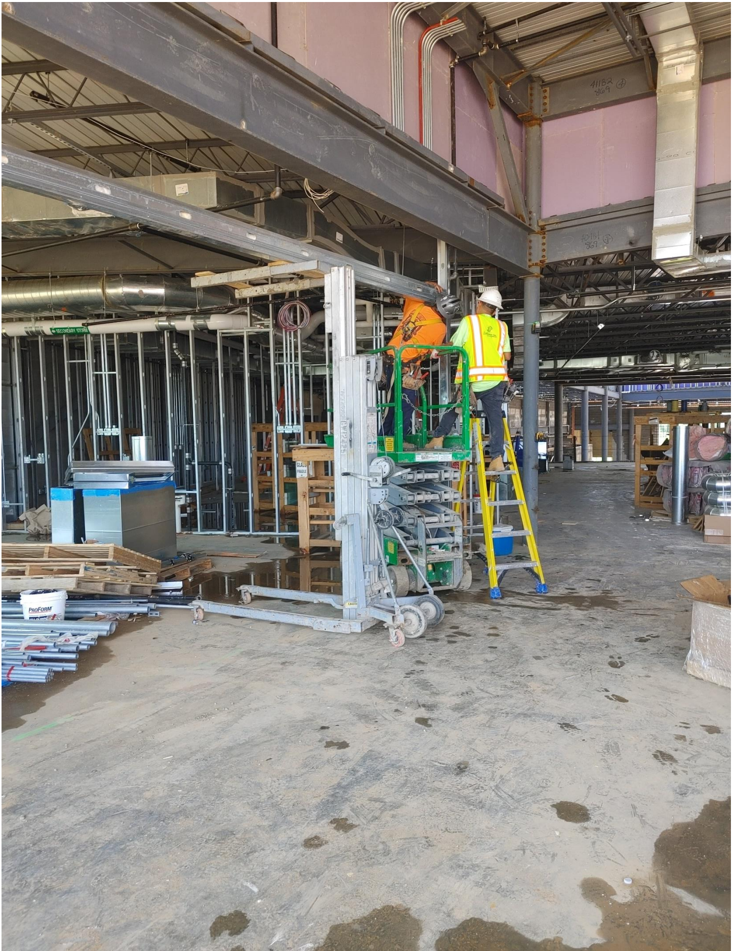
Photo 6 - Walls being framed on the 2nd floor of Area A