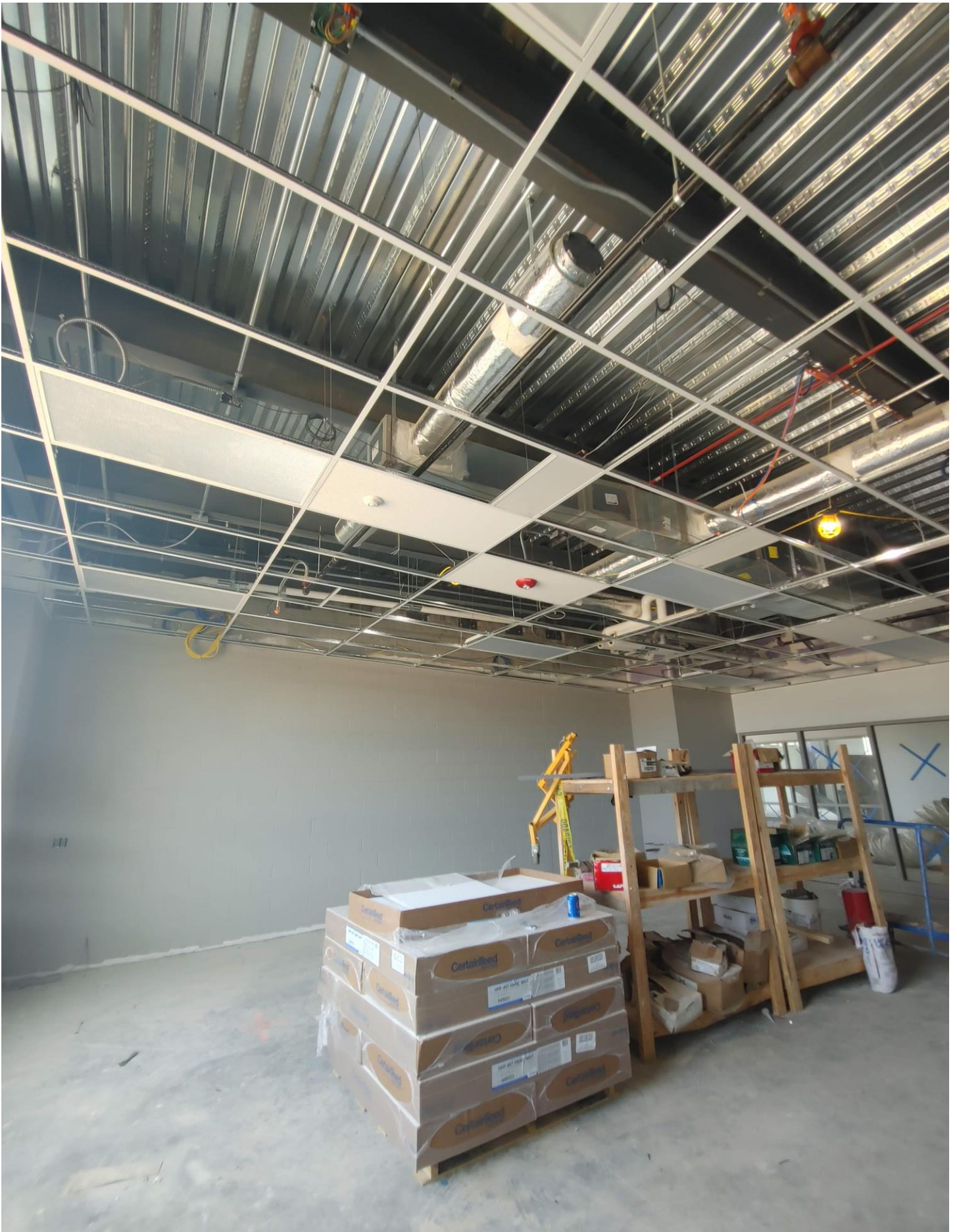
Photo 7 - Motion Light Sensors, Fire Alarms Horns and Strobes, Sound System Speakers and Sprinkler Heads are being installed in Area A