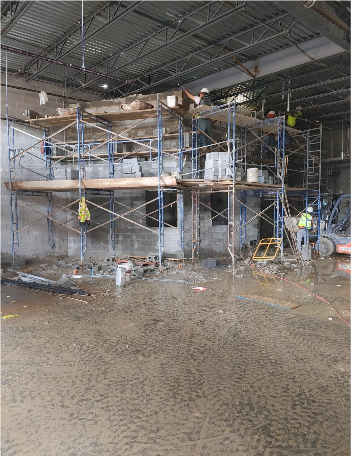
Photo 3 - Mason continue to lay block in the Kitchen area.