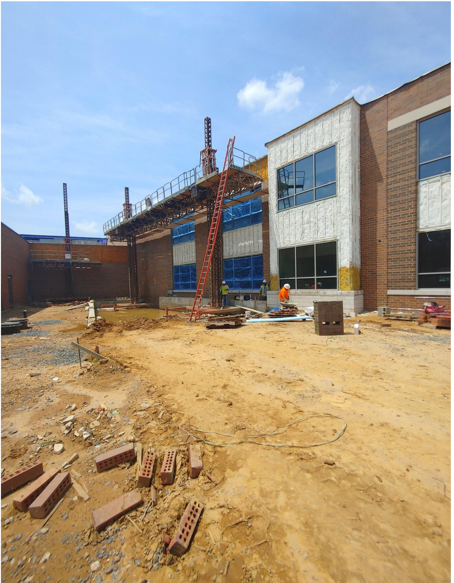
Photo 1 - Precast is being laid on the South side of Area A