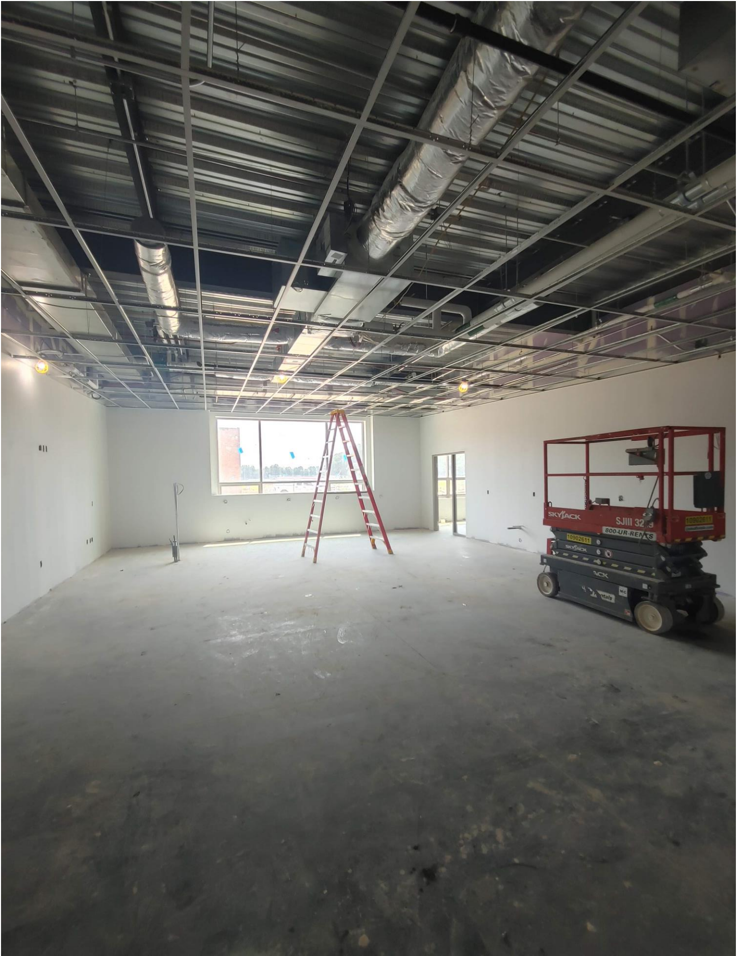
Photo 5 - Acoustical Ceiling Grid is being installed in Area B