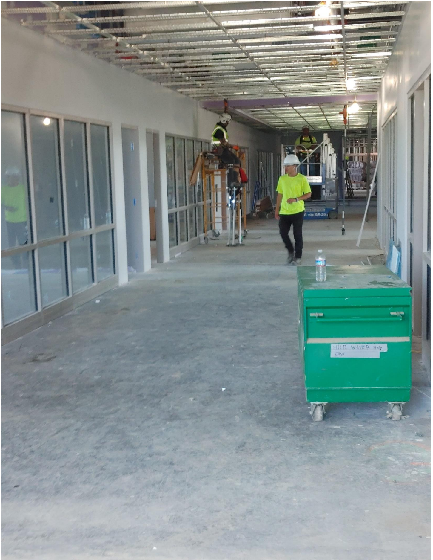
Photo 6 - Ceiling grid is being installed on the 2nd floor of Area B.