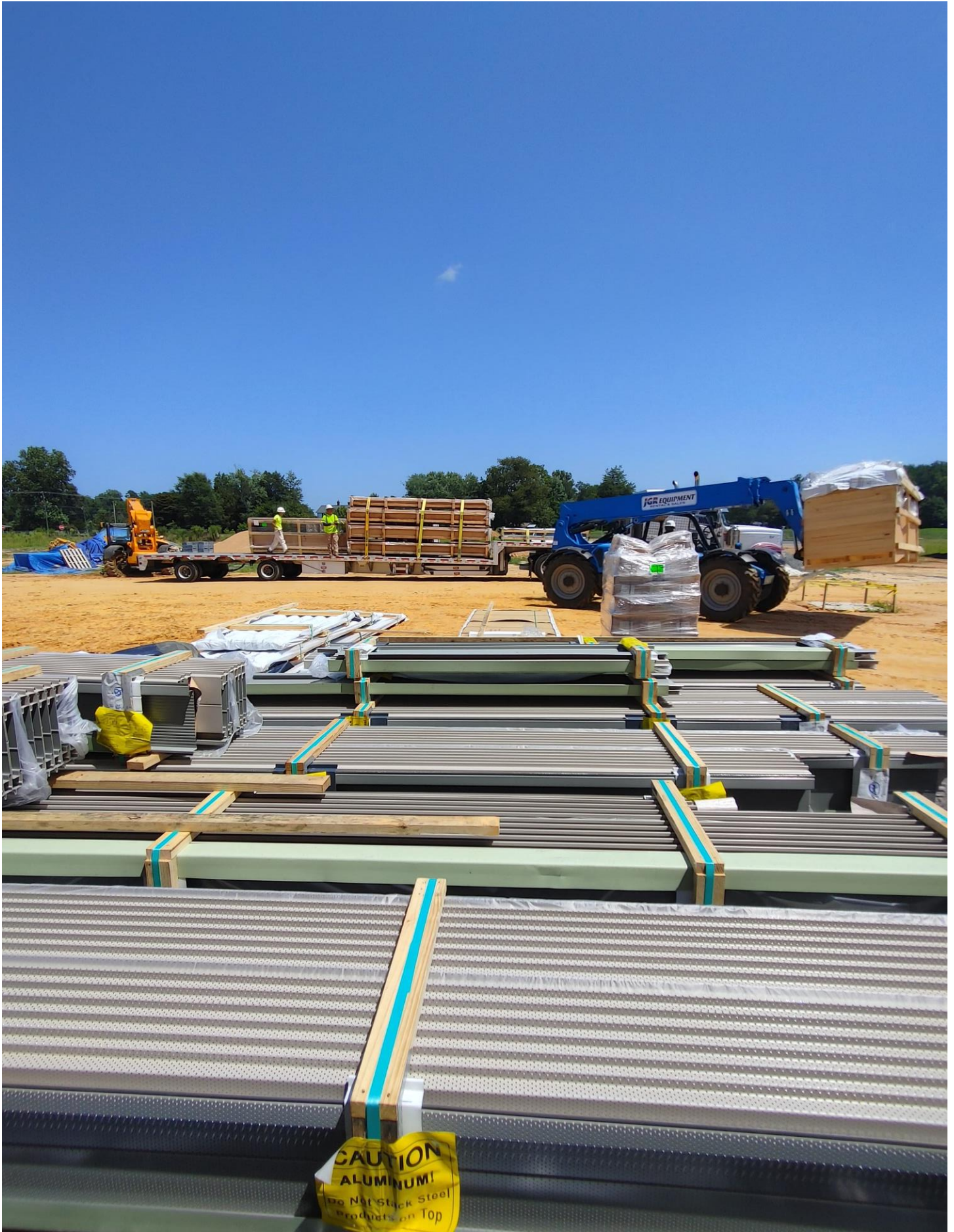
Photo 10 - Metal Panels are being off loaded and staged.