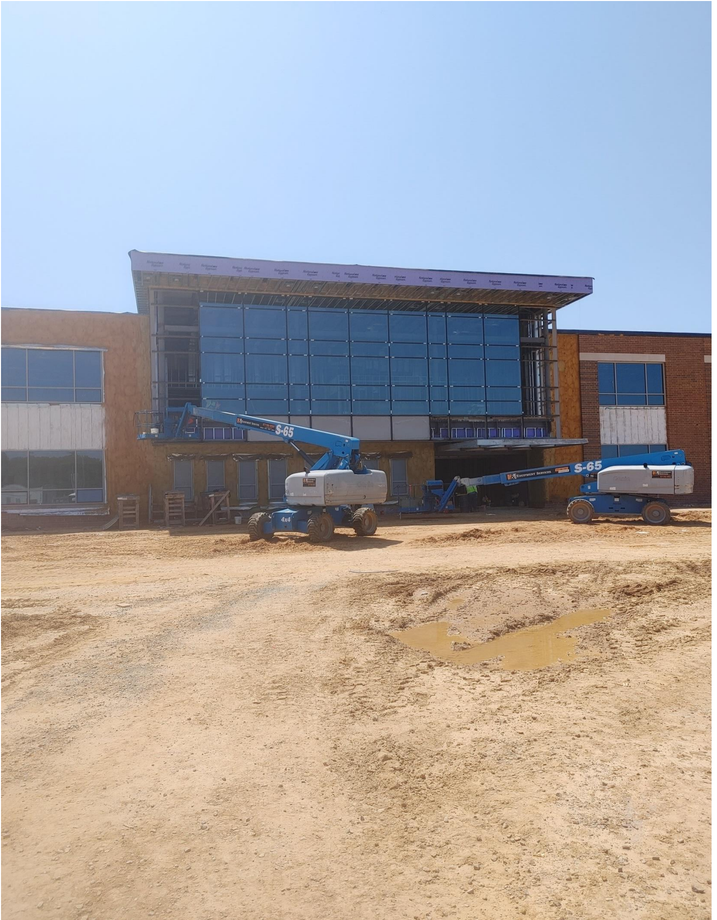
Photo 1 - Glass is being installed on the front of Area A