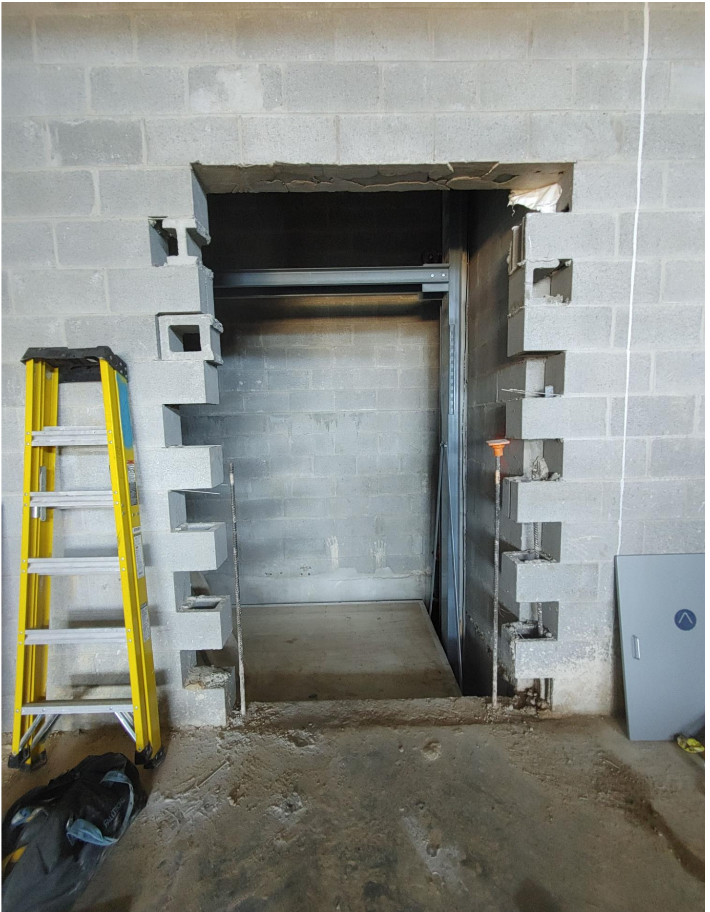
Photo 2 - They have begun to install the elevator