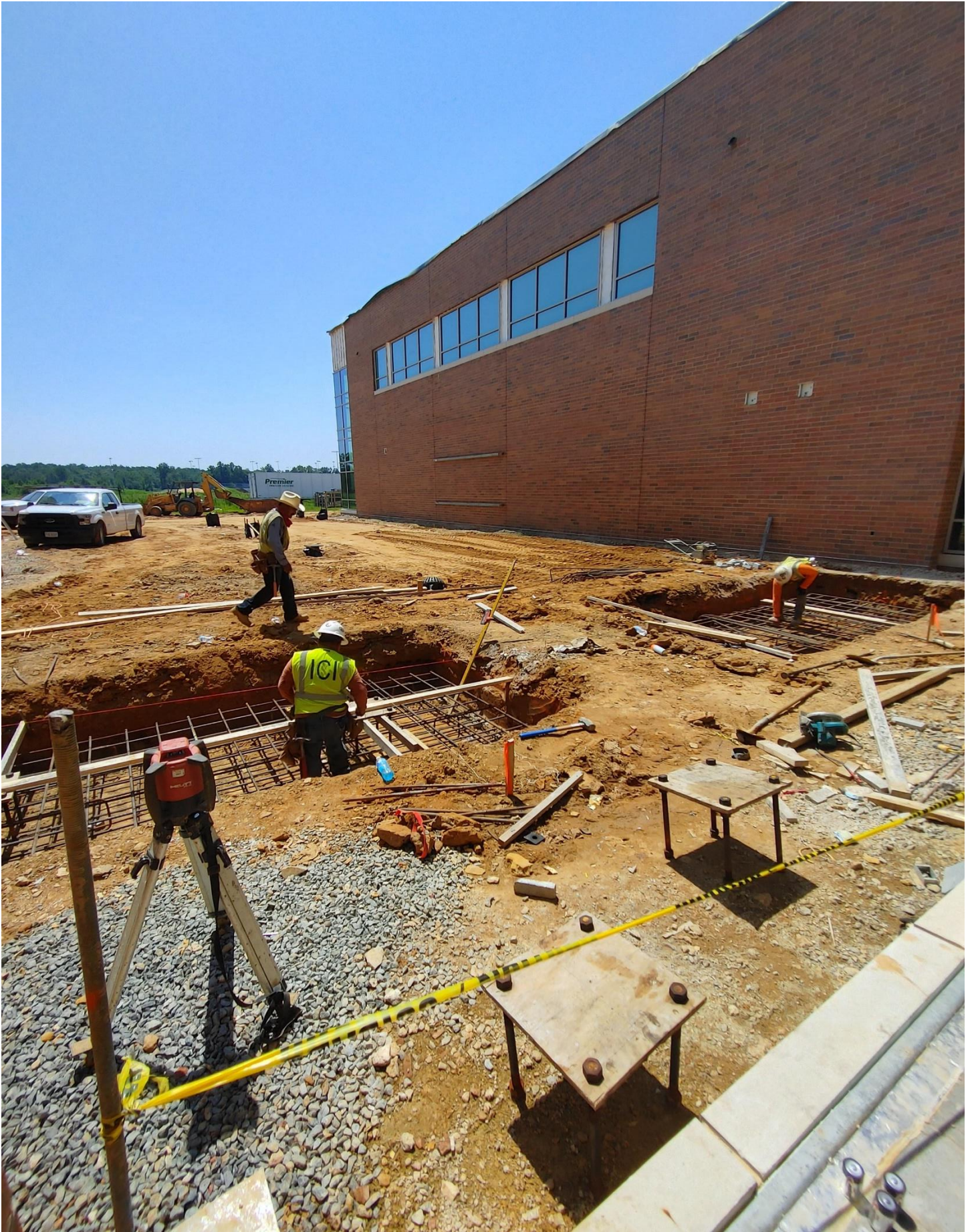
Photo 7 - Footers are being formed on the South side of Area C for the Canopy Columns.