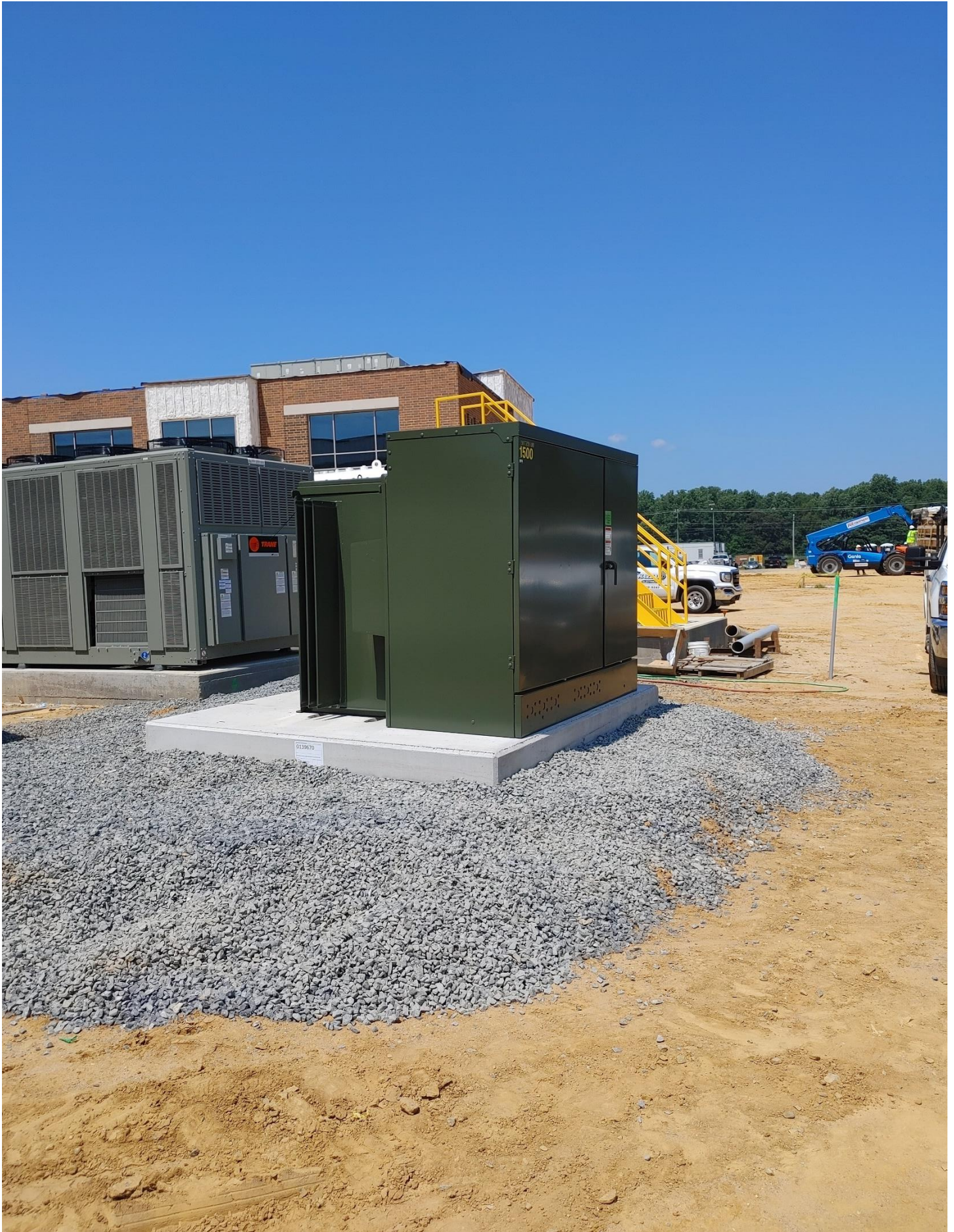
Photo 9 - Dominion Power Transformer has been set