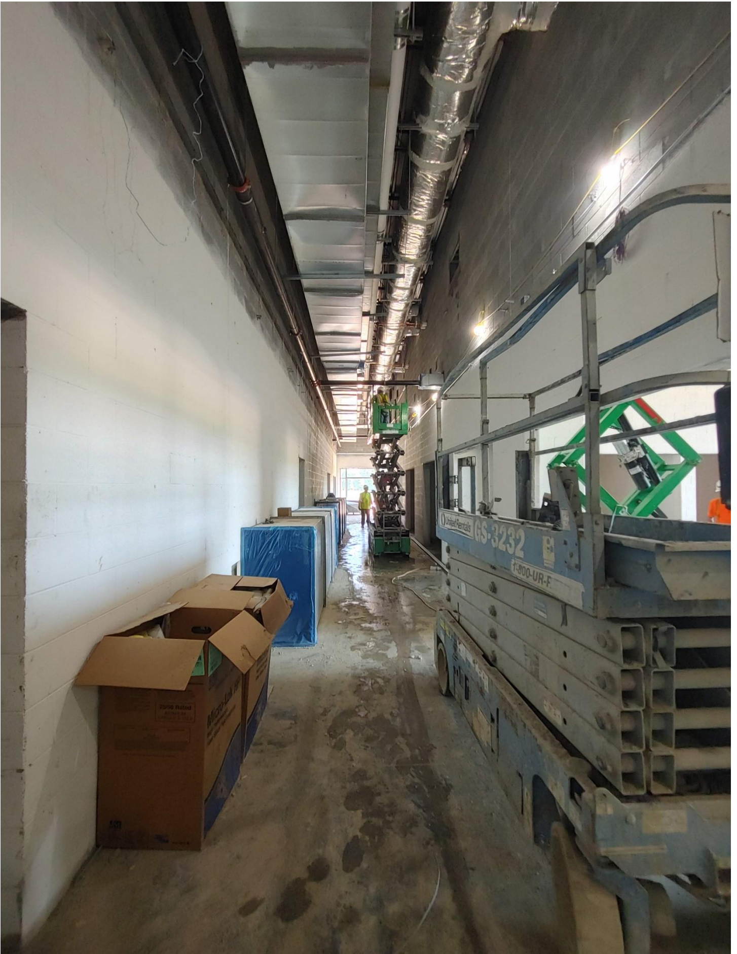
Photo 8 - HVAC duct is being installed in Area D