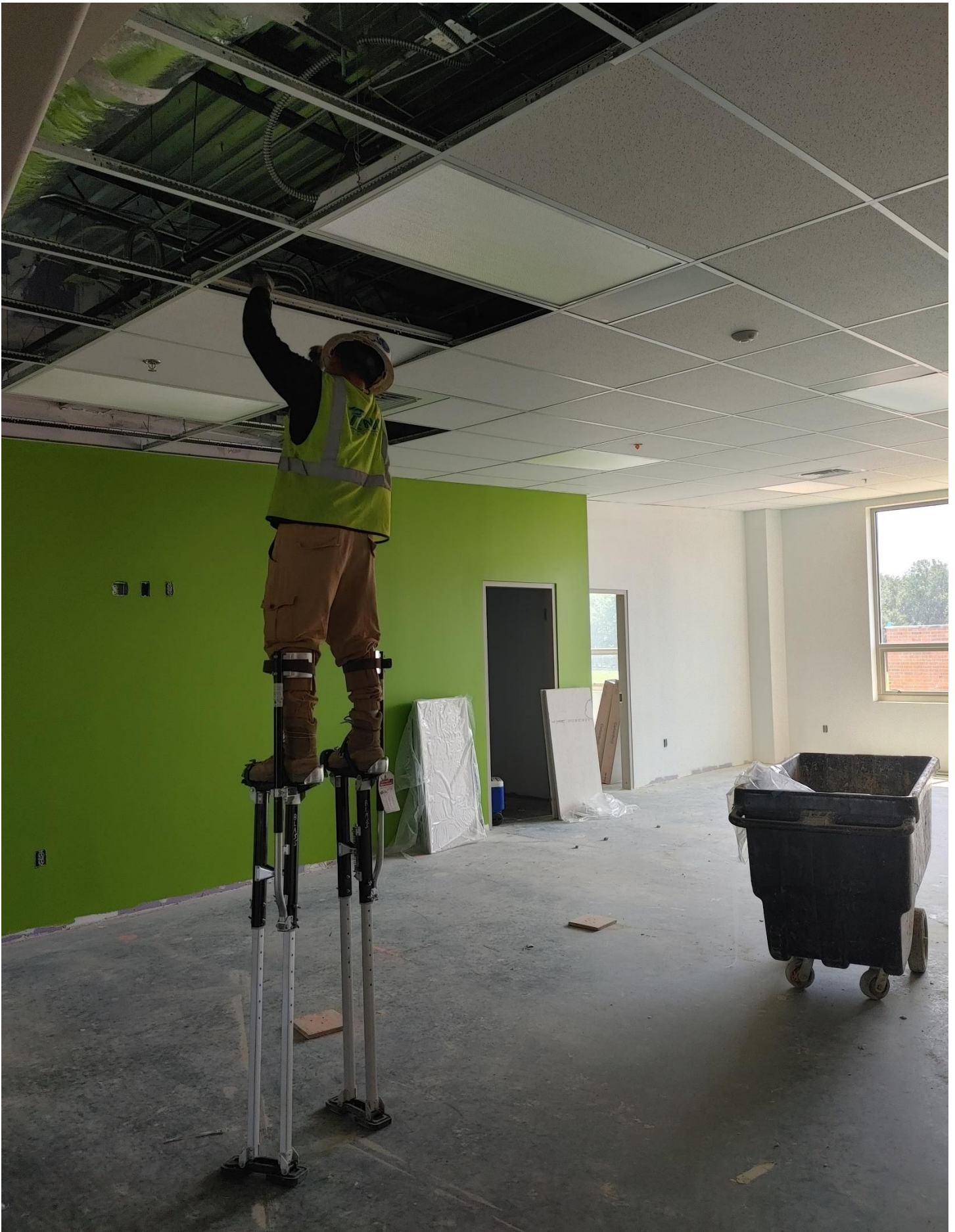
Photo 3 - Acoustical Ceiling tiles are being installed in Area A