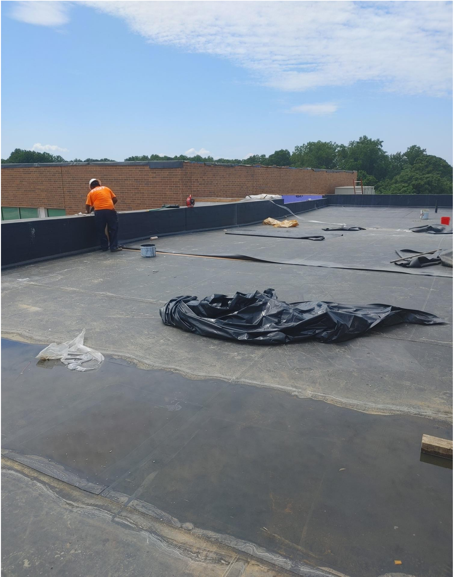
Photo 4 Roofers working on Area C Roof.