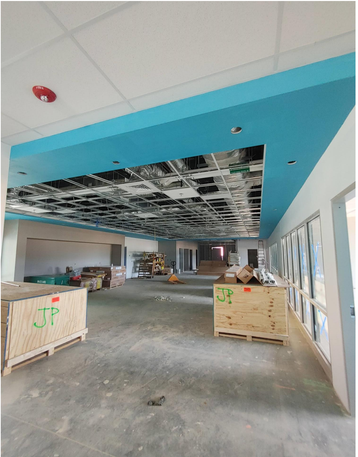
Photo 6 - Soffit has been painted in Area A.