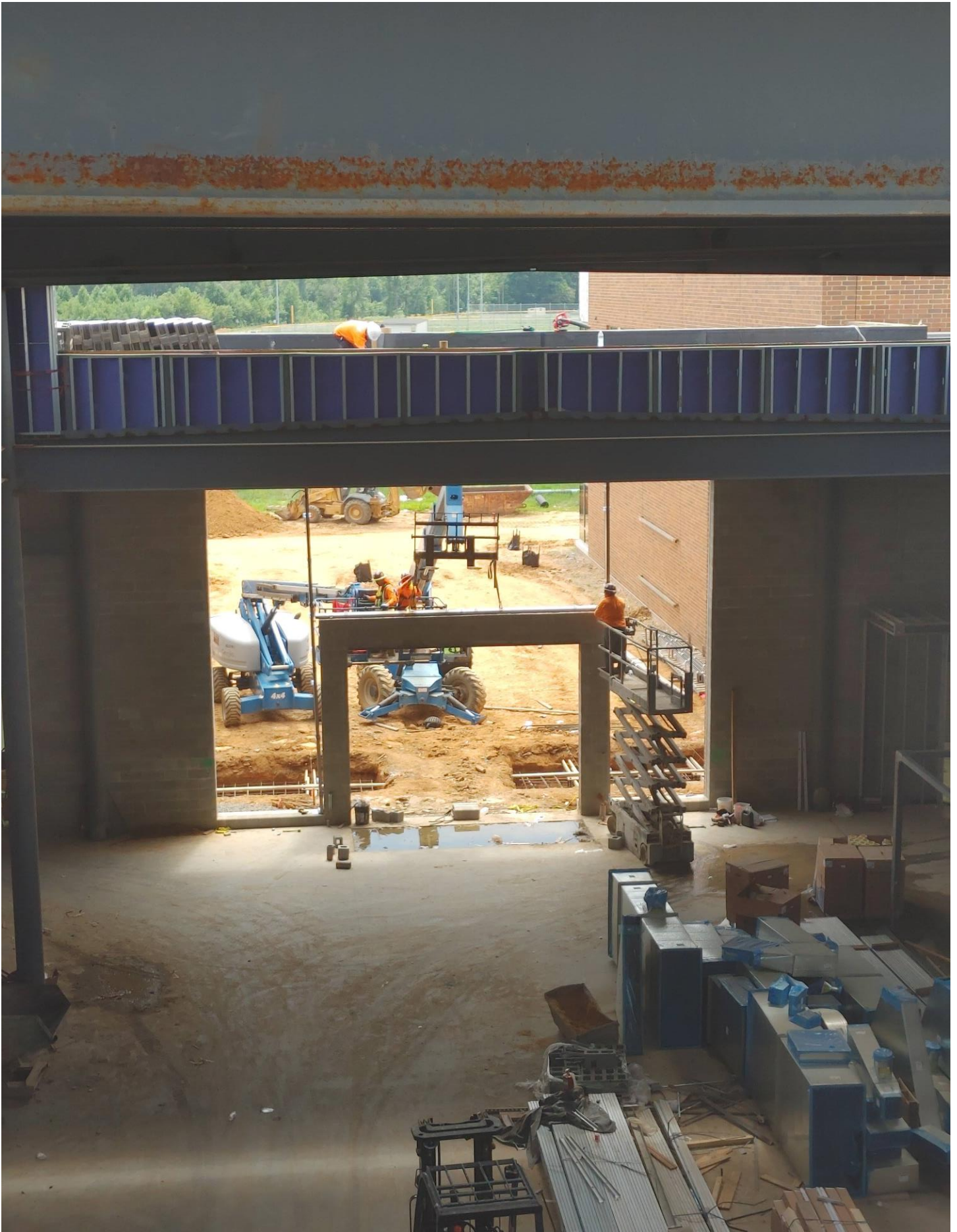
Photo 3 - Curtain wall framing going up on the South side of Area C.