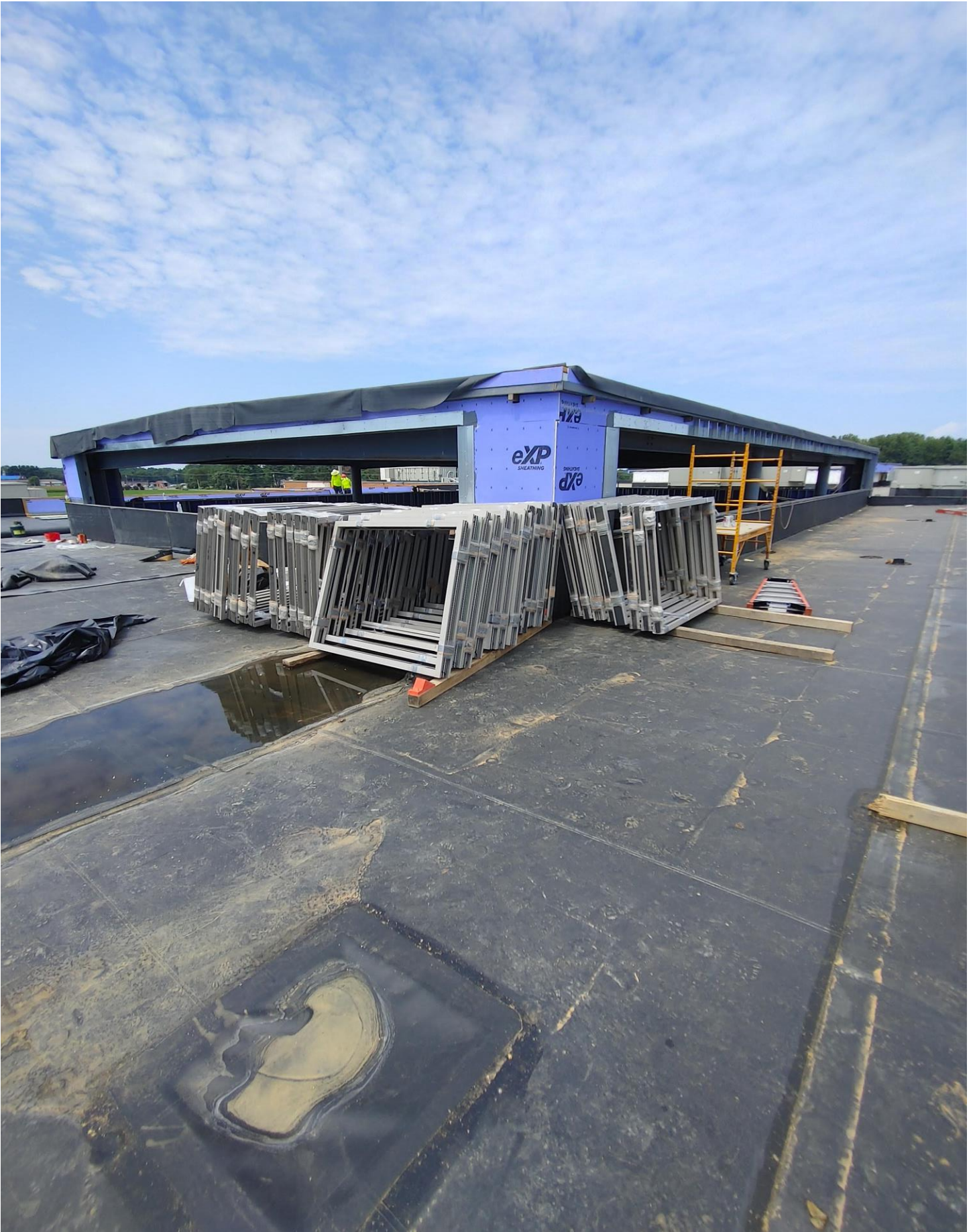
Photo 5 - Window frames have been staged on the roof of Area C.