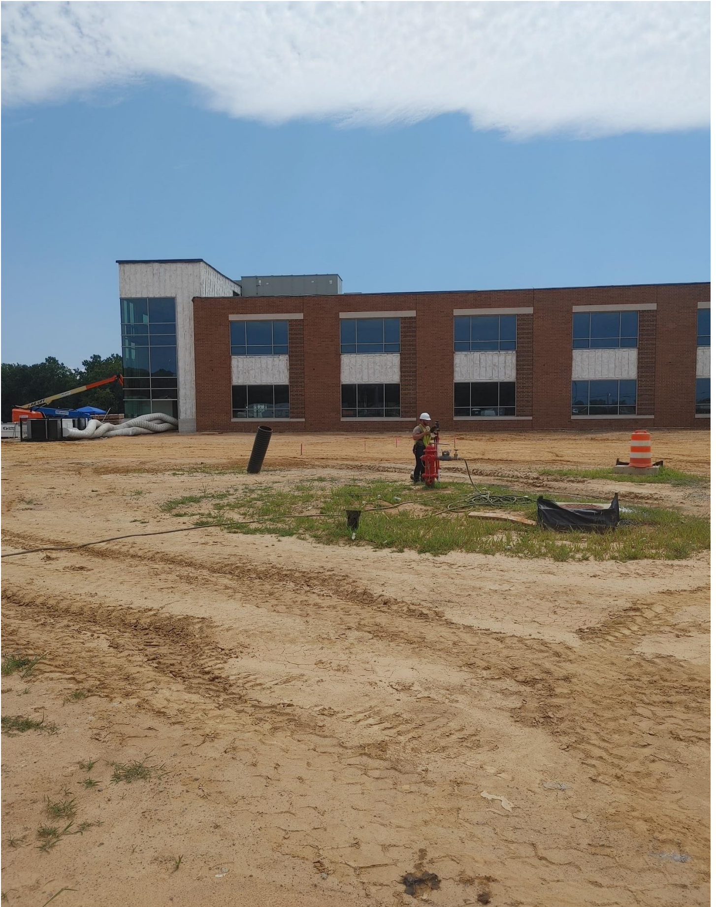
Photo 1 - Surveyors laying out reference points.