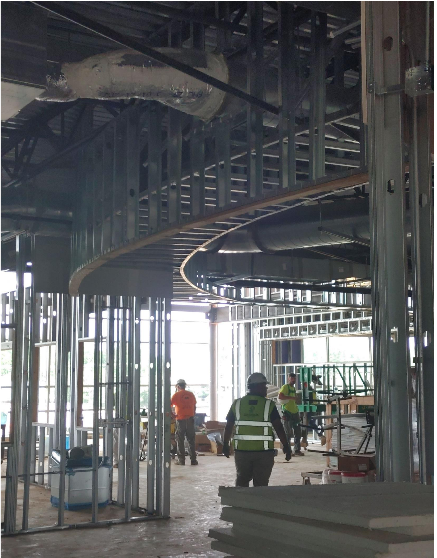
Photo 8 - The radius bulkhead has been completed on the 2nd floor of Area A.