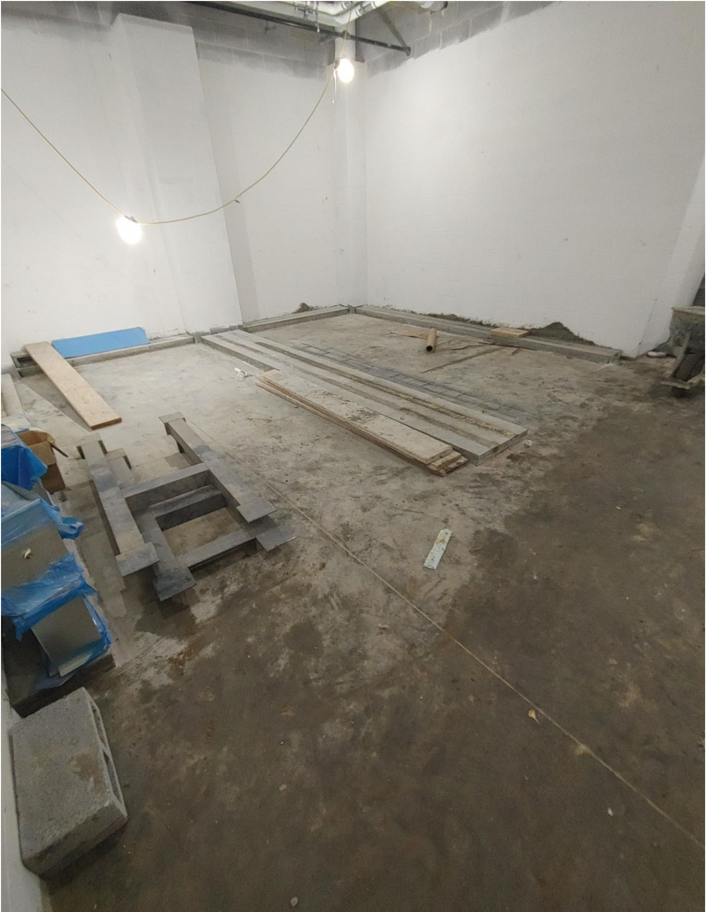
Photo 6 - Raised concrete slabs have been poured in E126 for lockers.