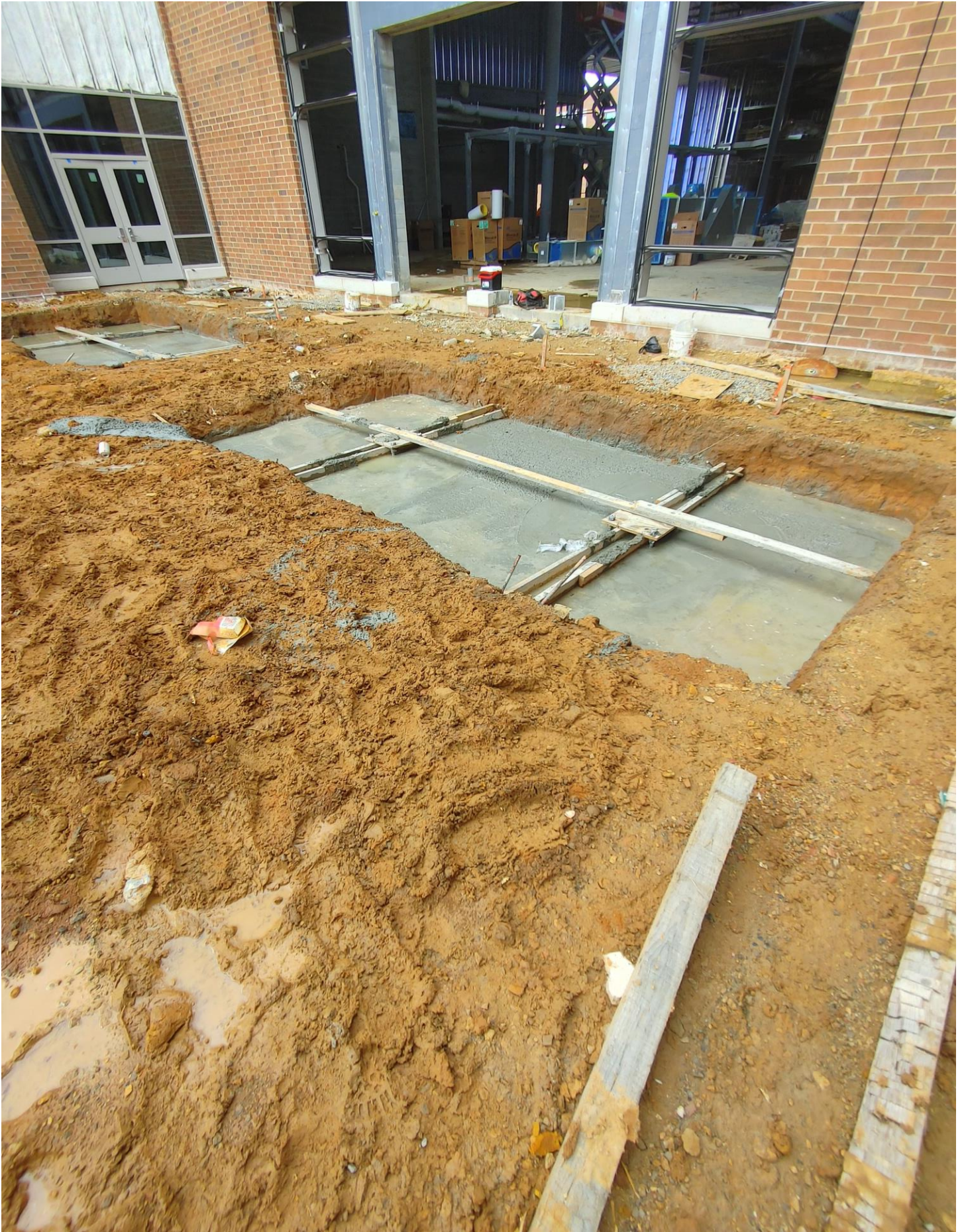
Photo 2 - Footers for Canopy Columns have been poured on the South side of Area C.