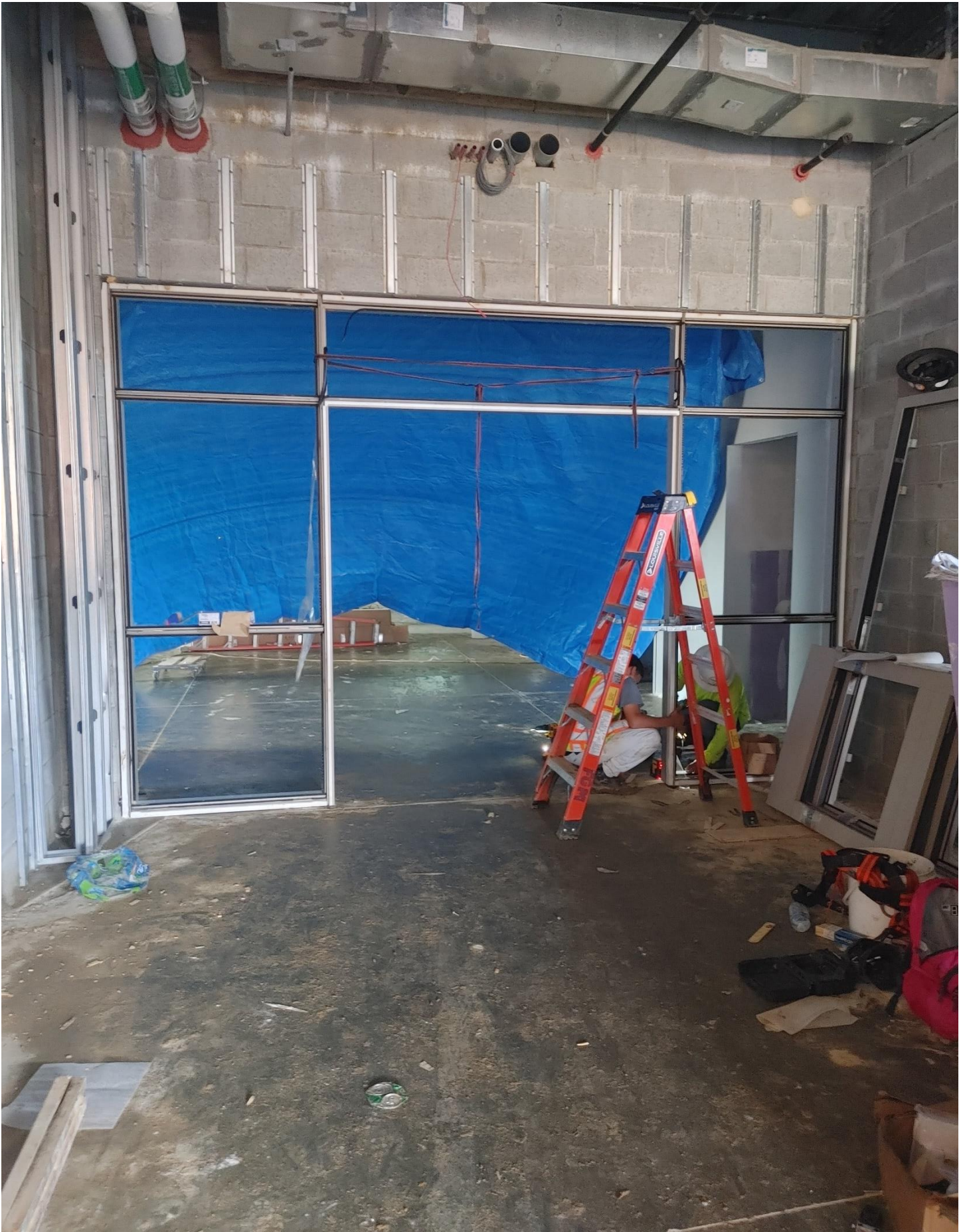
Photo 11 - A10 Frame is being installed. A tarp has been hung to help maintain conditioned space.