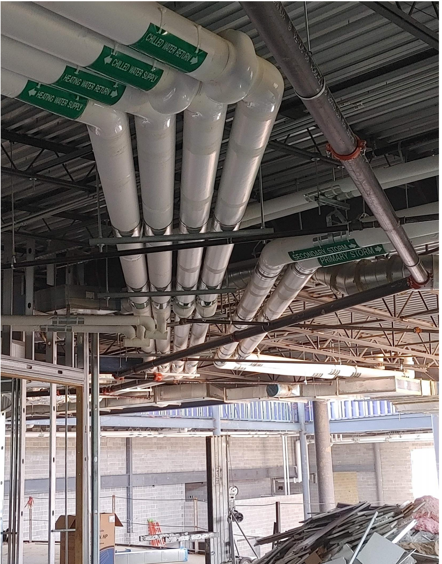
Photo 7 - Pipes are being labeled