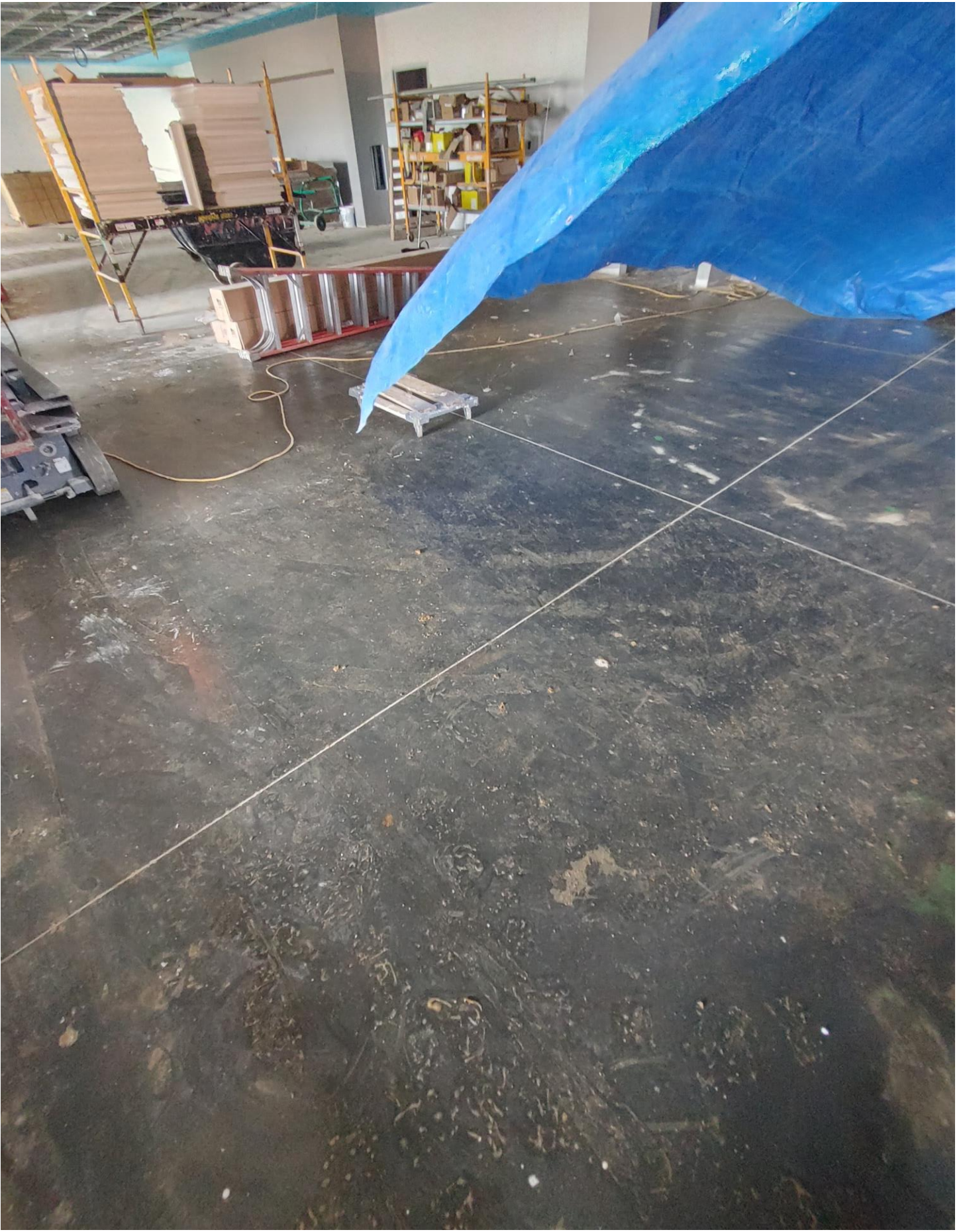
Photo 13 - Accumulation of condensation on the first floor of Area A.