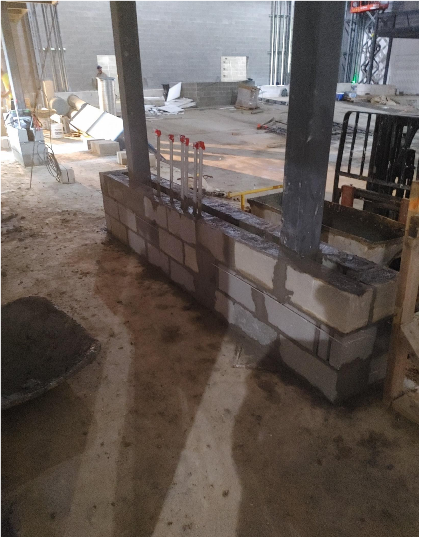
Photo 3 - Masons are laying block around columns in Auditorium.