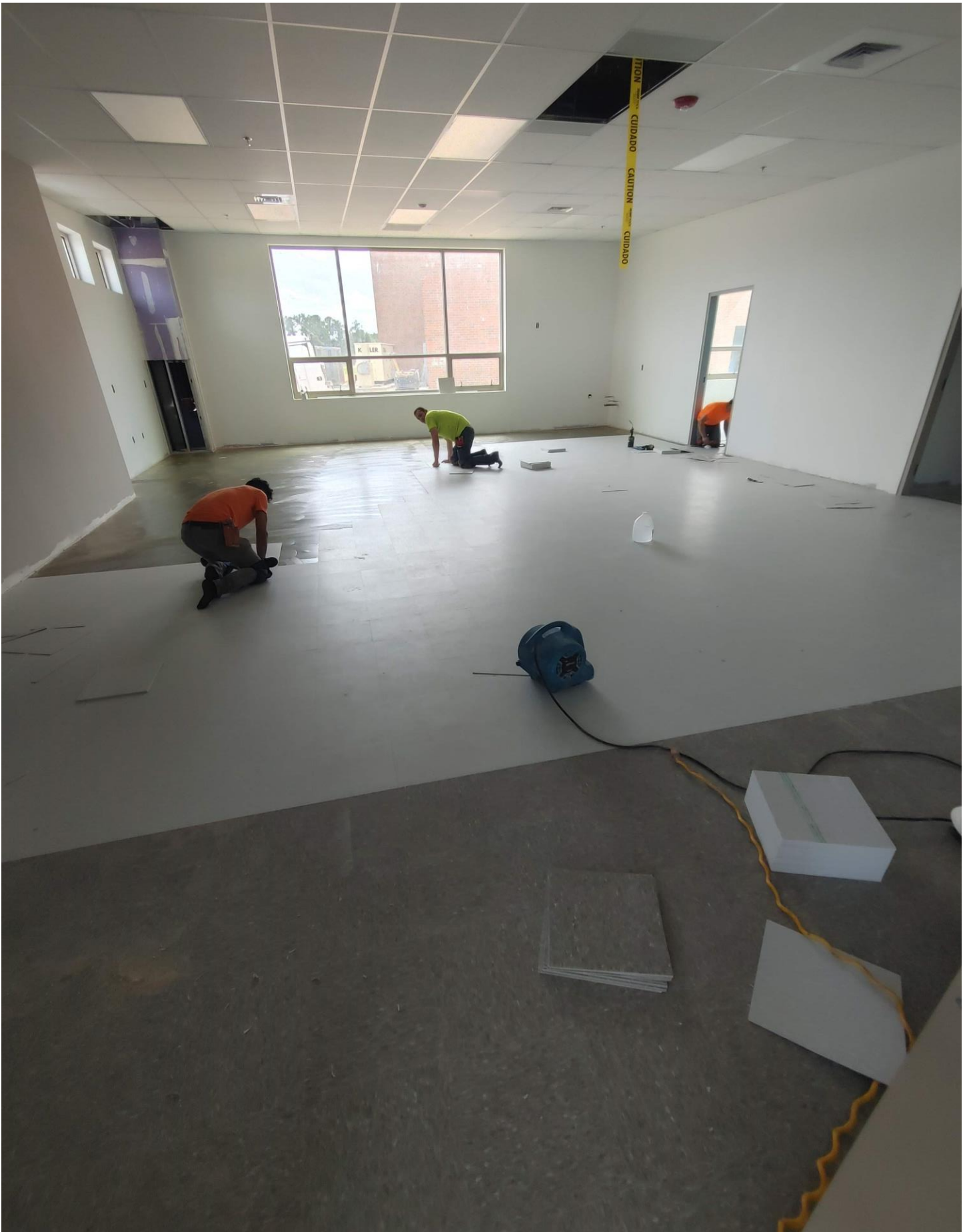
Photo 12 - VCT is being laid in A106