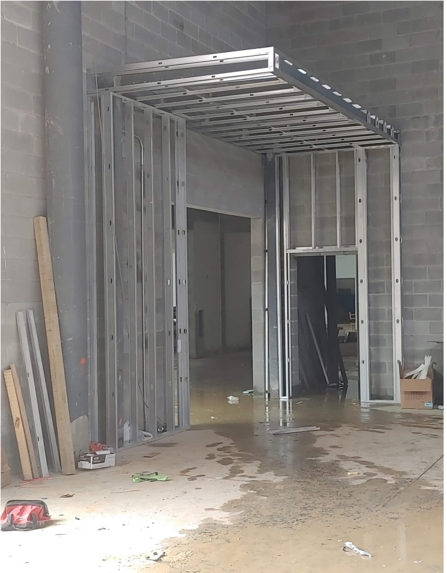
Photo 5 - Canopy has been framed in Area C as you enter Area E.