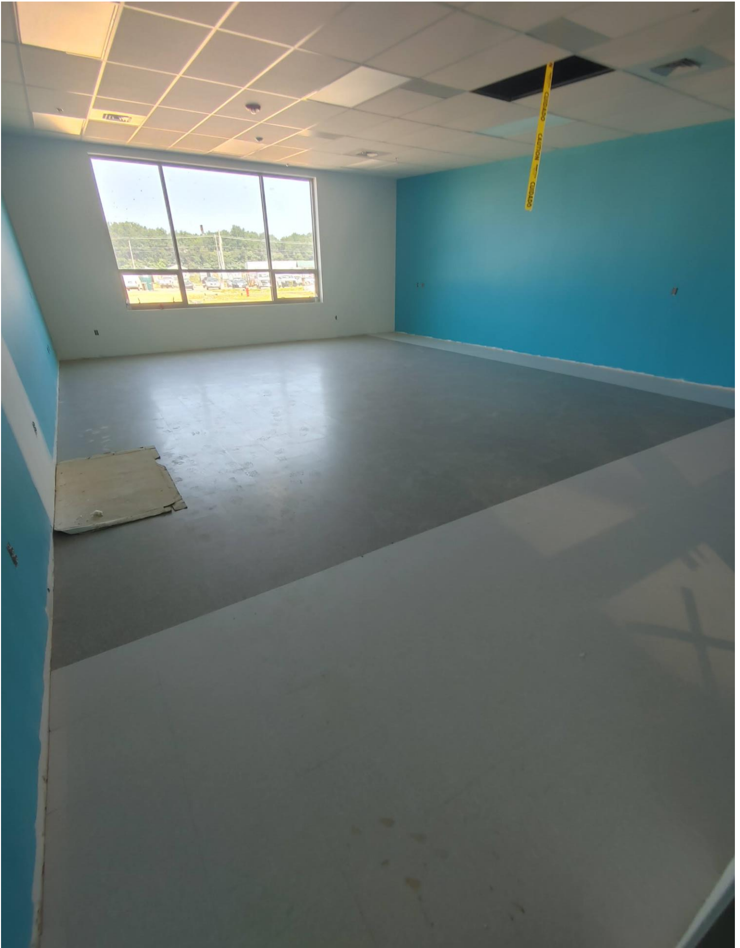
Photo 7 - Tile has been laid in all of the Learning Studios on the 1st floor of Area A.