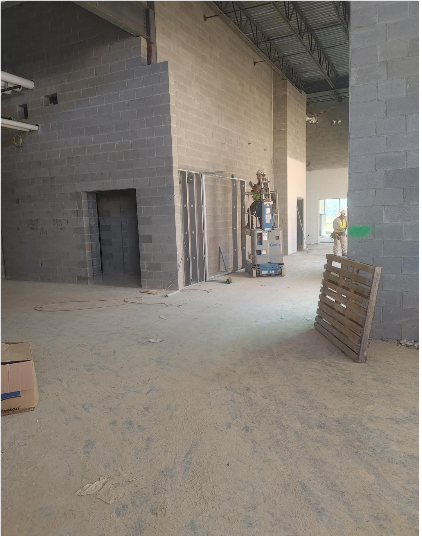
Photo 2 - Walls are being framed in Area D.