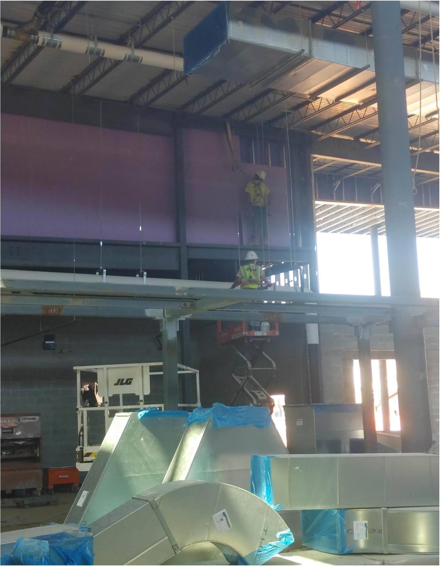
Photo 3 - Sheetrock is being hung in Area C.