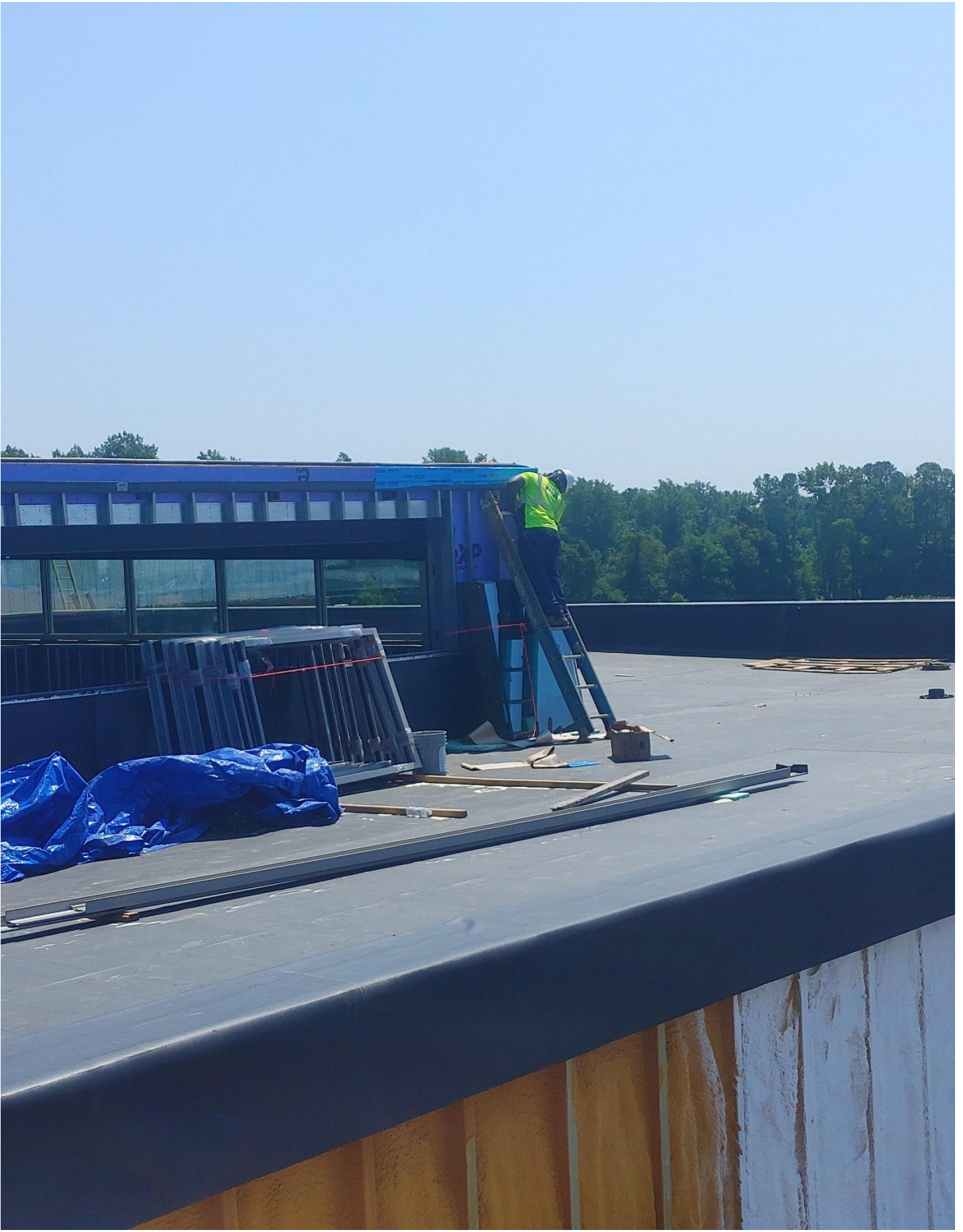
Photo 10 - Flashing being applied to the high roof of Area C.