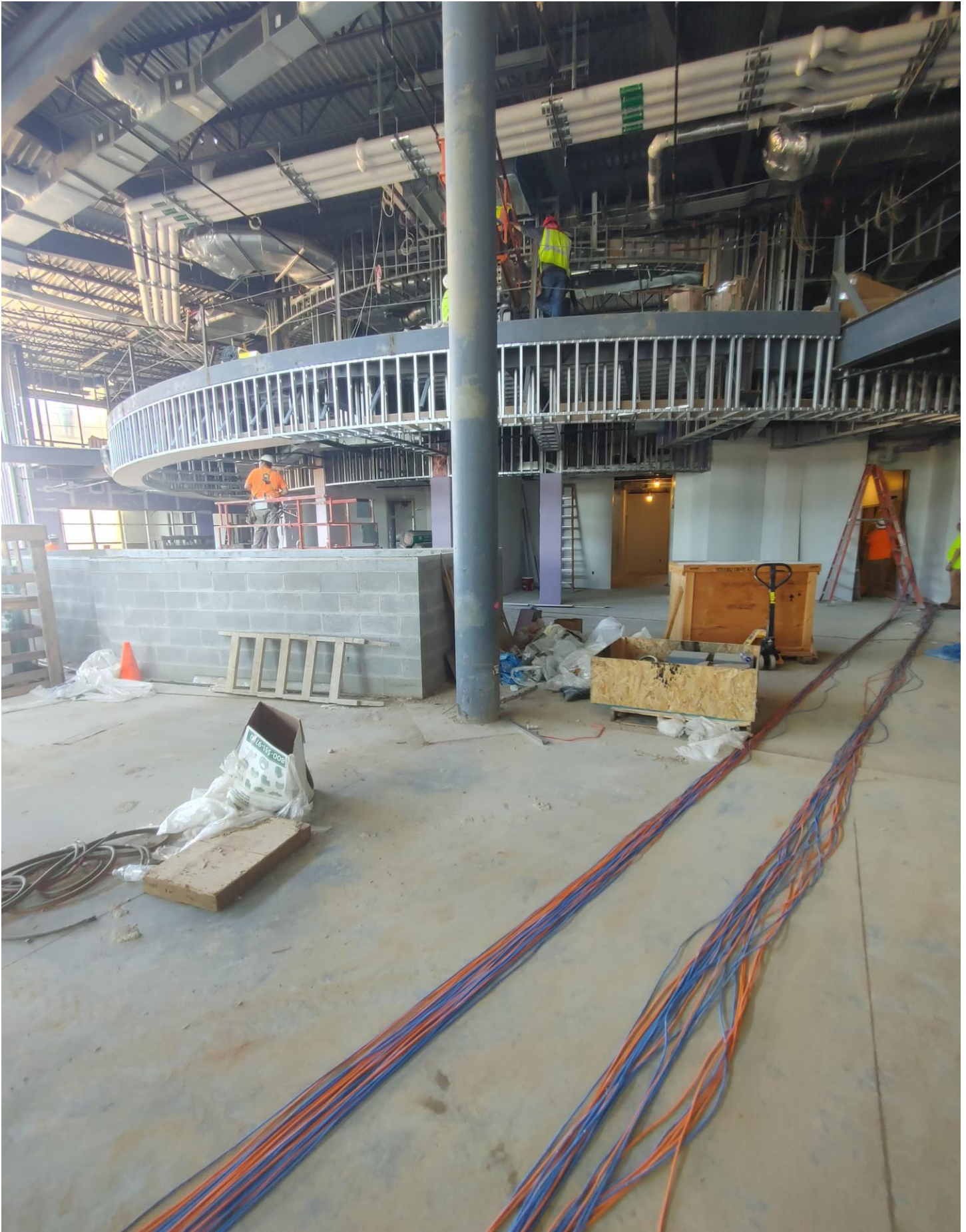
Photo 4 - Sheetrock is being hung on the radius bulkhead.