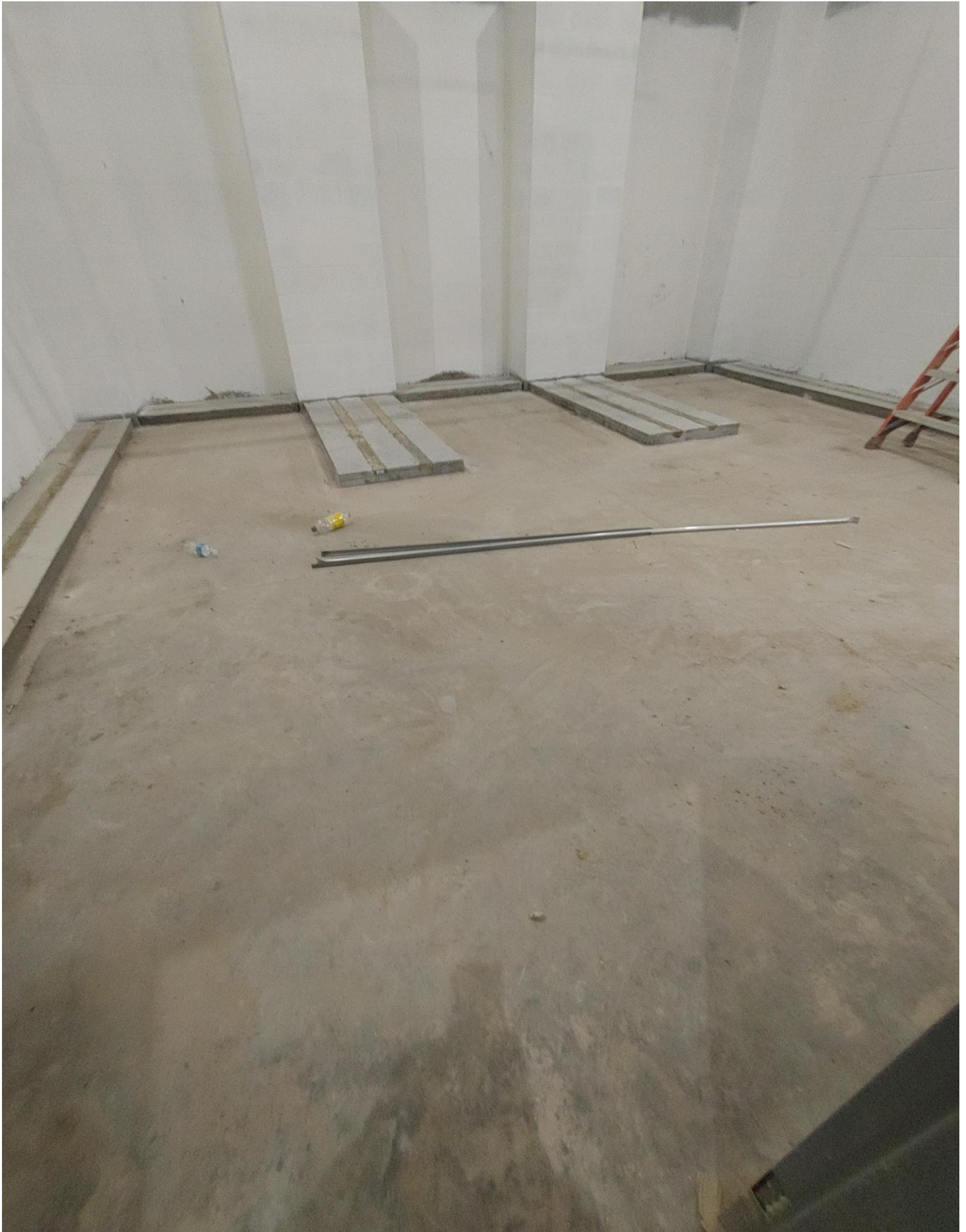
Photo 5 - Raised slabs for locker have been poured in Rooms E135B & E136B