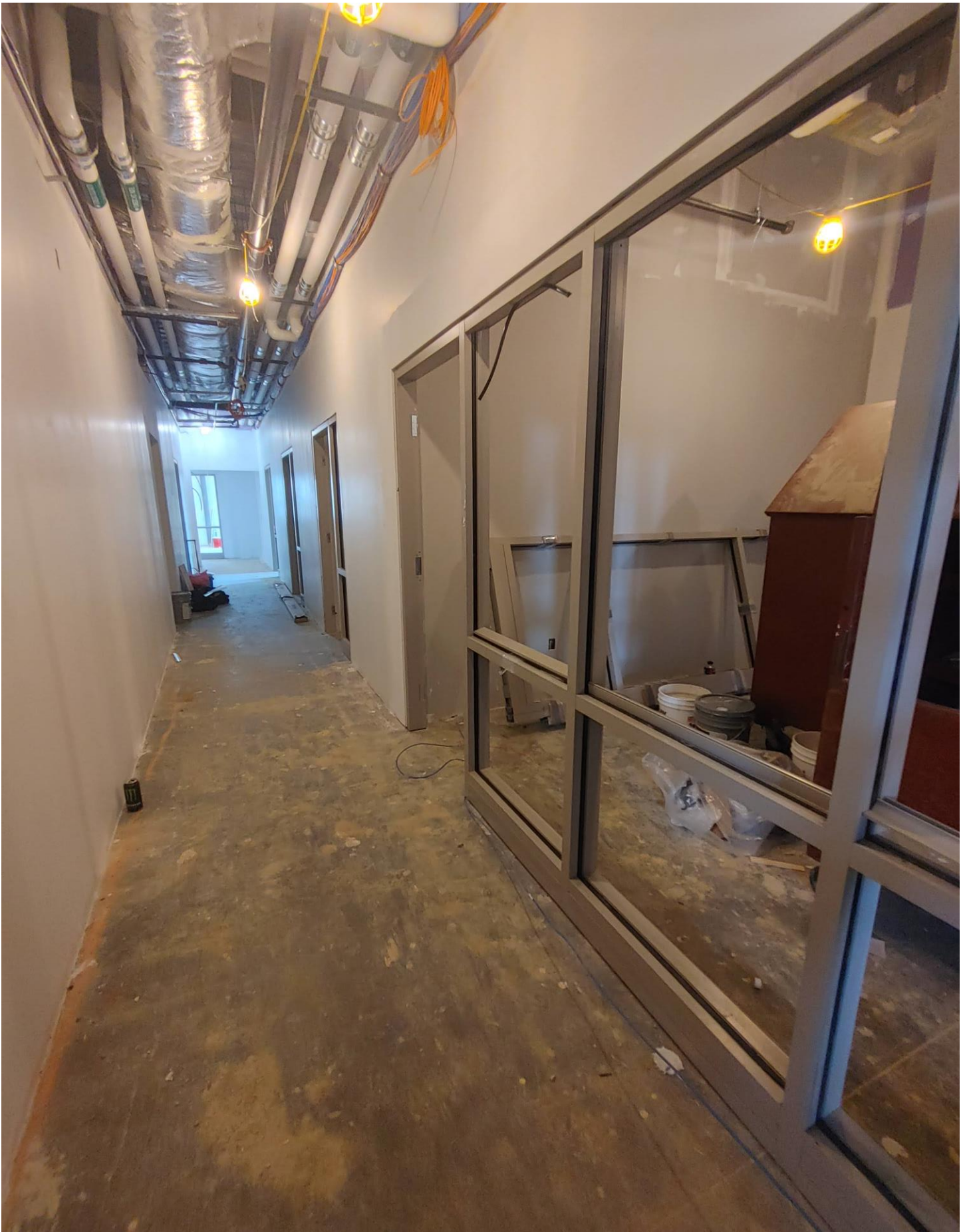
Photo 12 - Storefronts and door frames are being installed in the Administrative area.