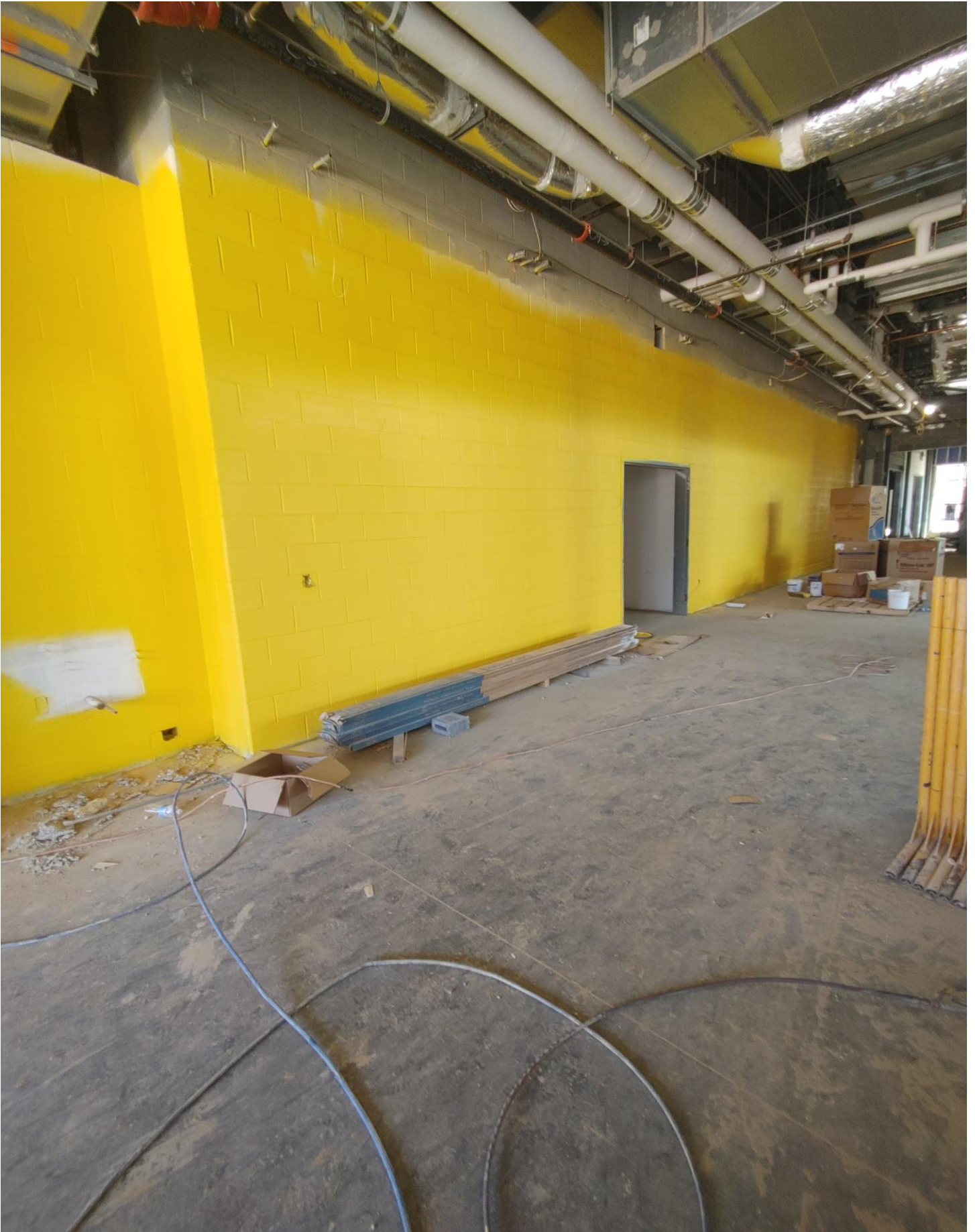
Photo 6 - Painters are working in Area E.