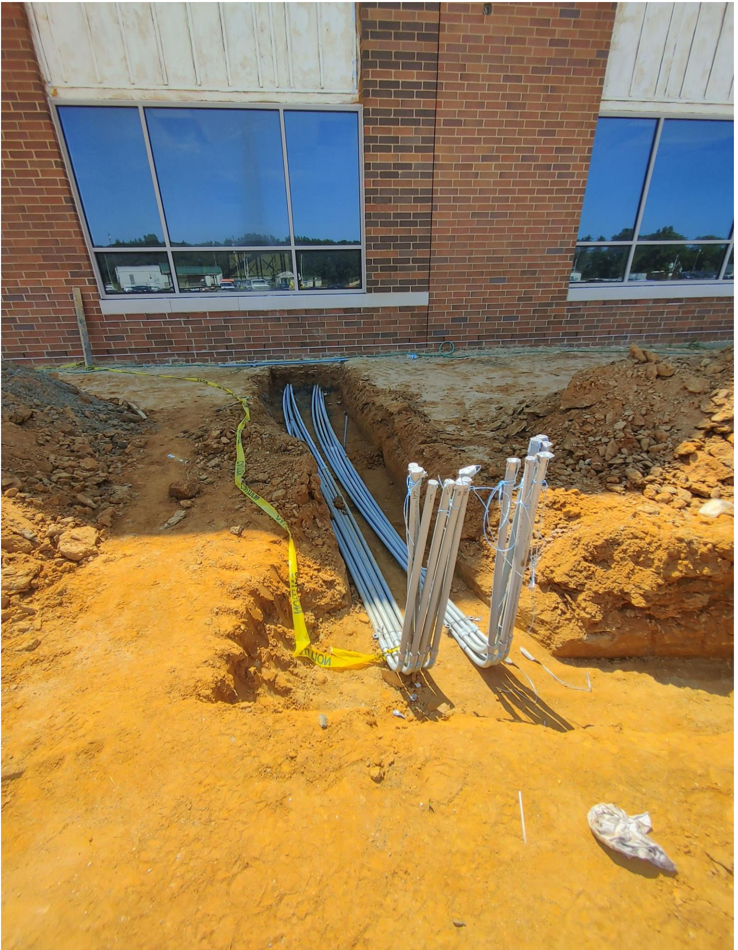
Photo 1 - Conduit for lighting stubbed up in front of Area A