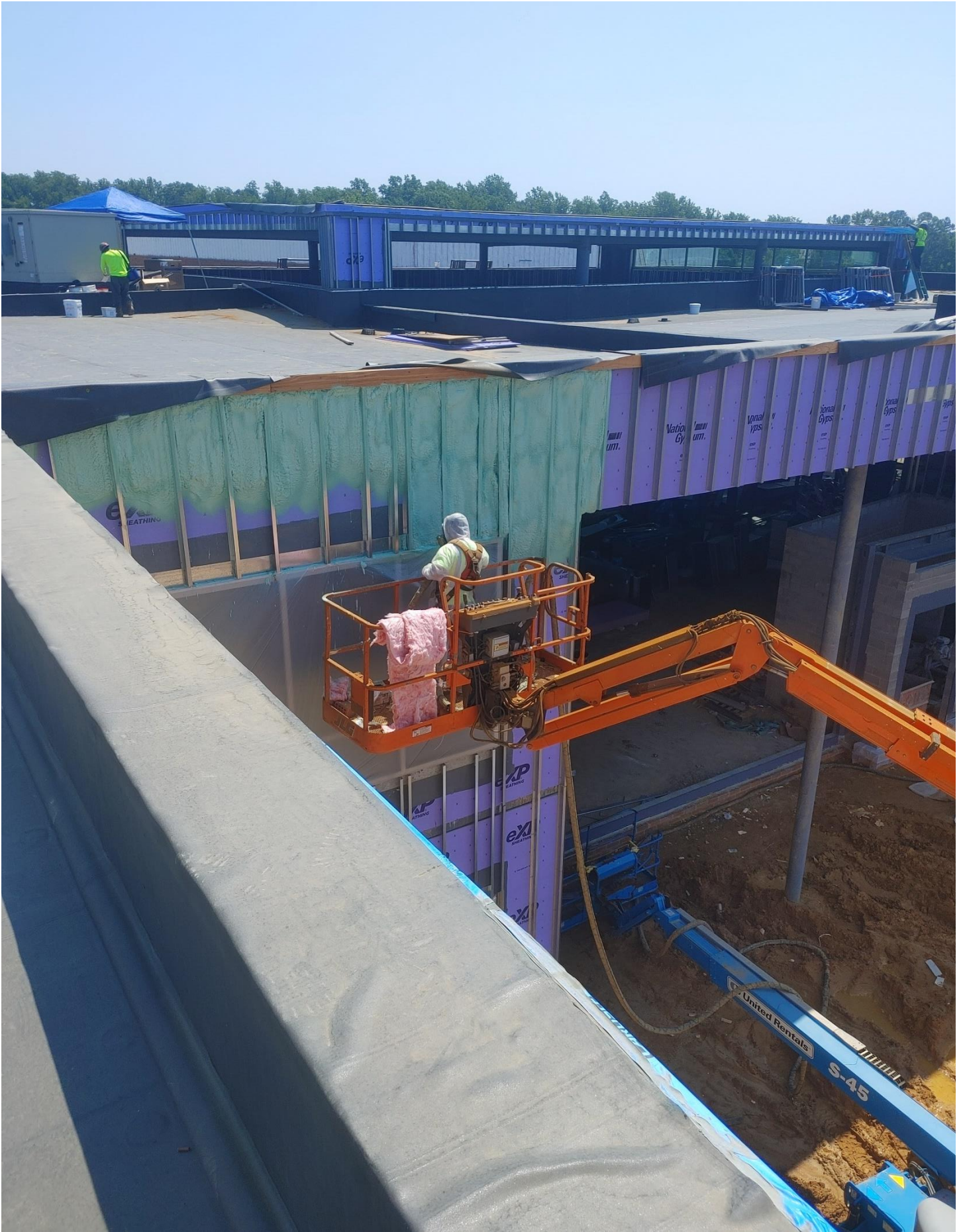
Photo 9 - Spray Foam being applied to the West side of Area C.