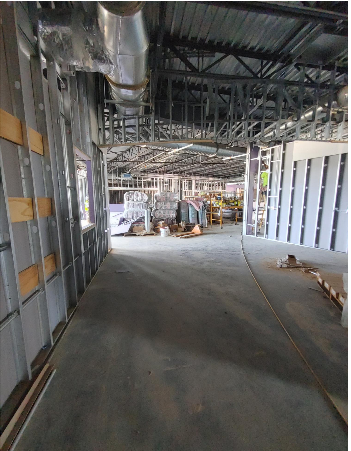
Photo 8 - Sheetrock is being hung on the 2nd floor of Area A.