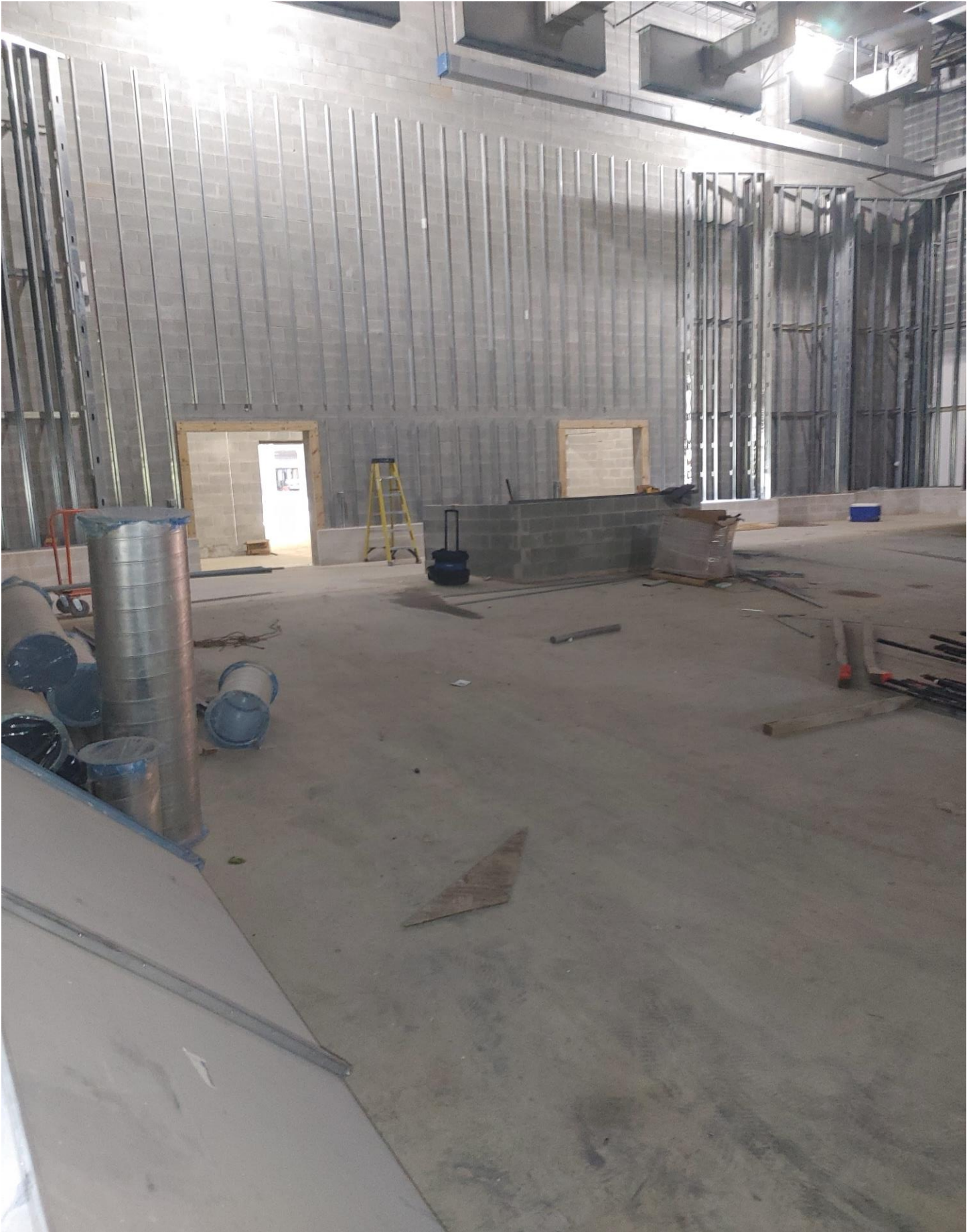
Photo 9 - Hat Channel has been installed on the rear wall of the Auditorium.