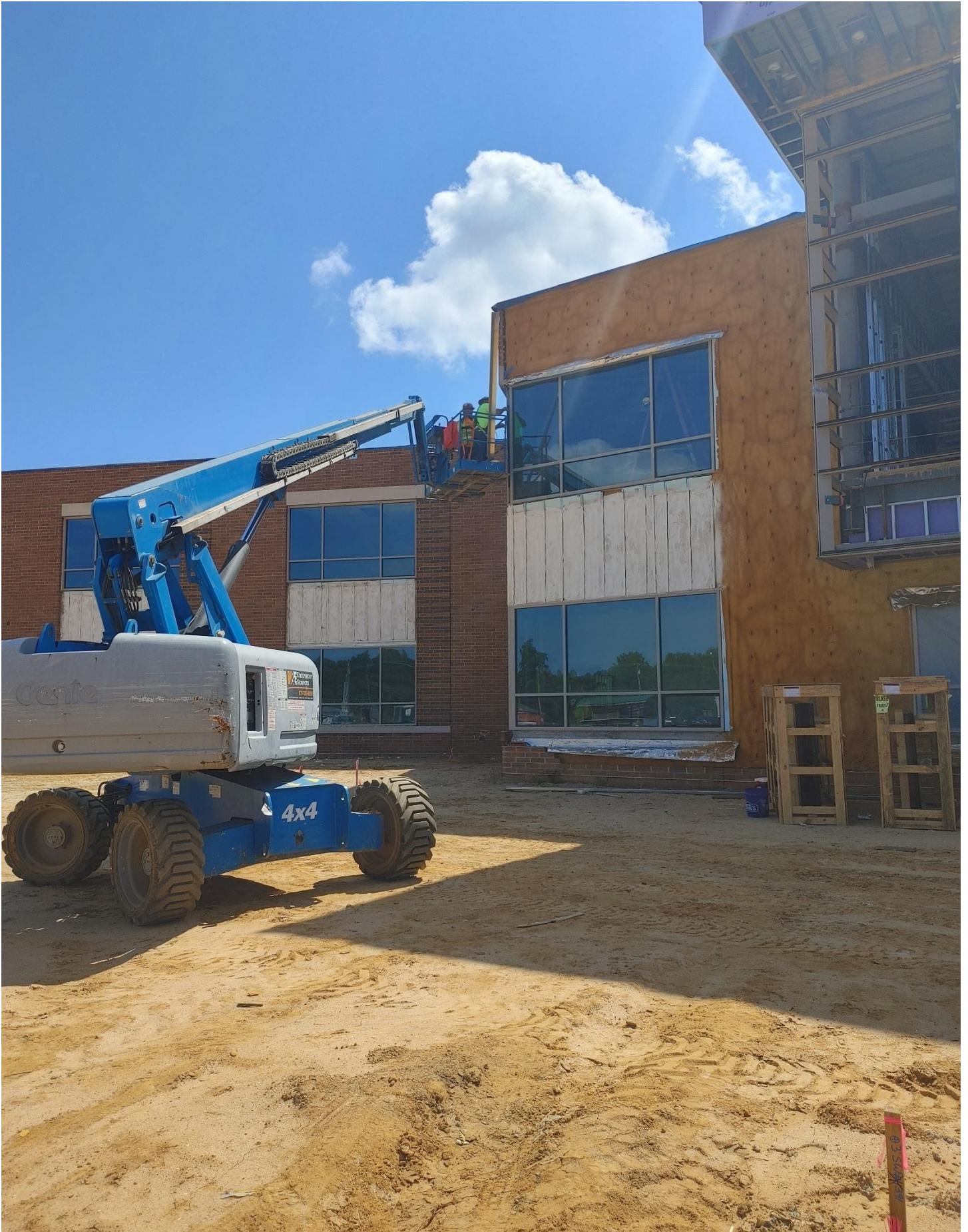
Photo 1 - FG&M working on Frames on the North side of Area A.