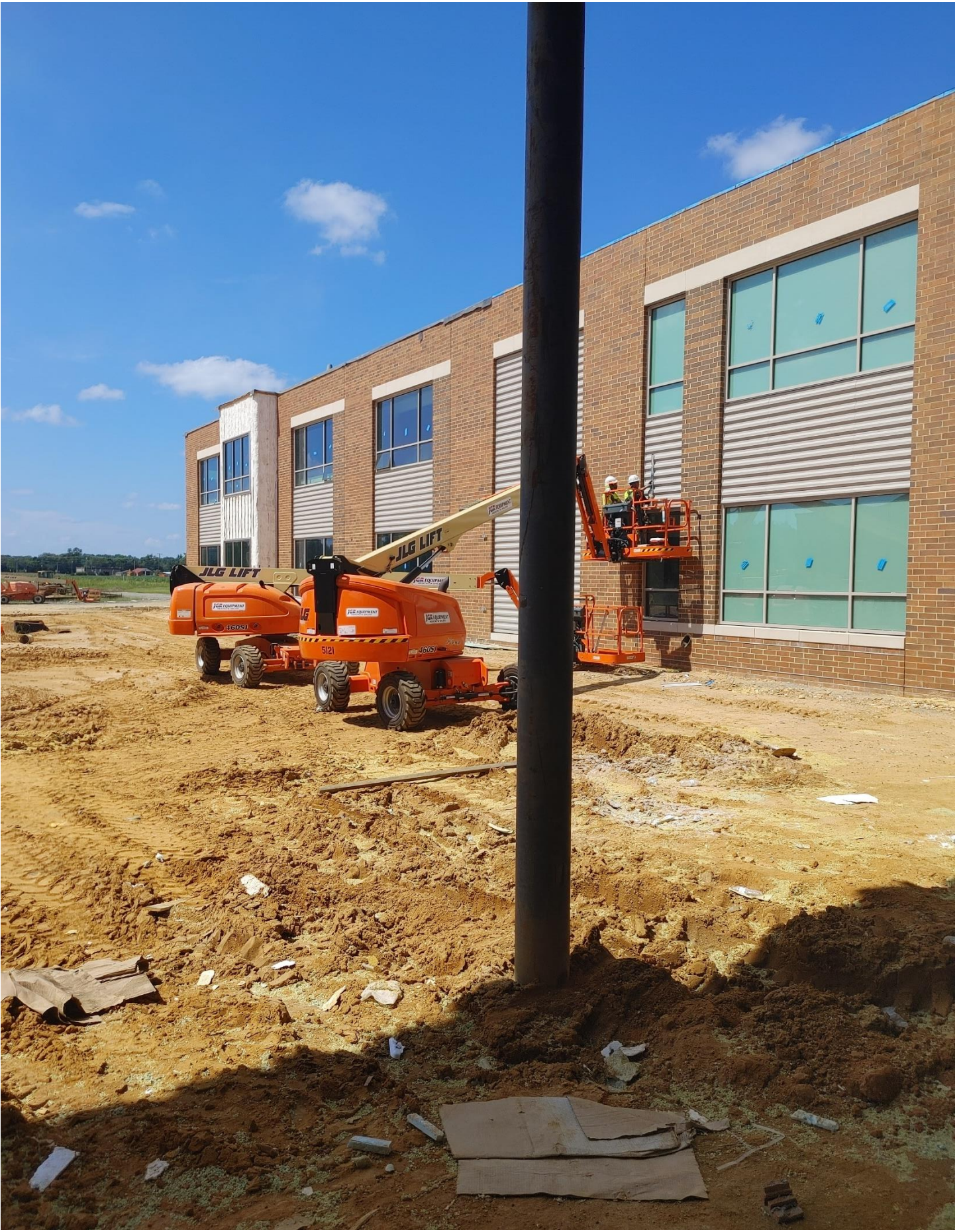
Photo 4 - Metal Panels are being installed on the South side of Area B.