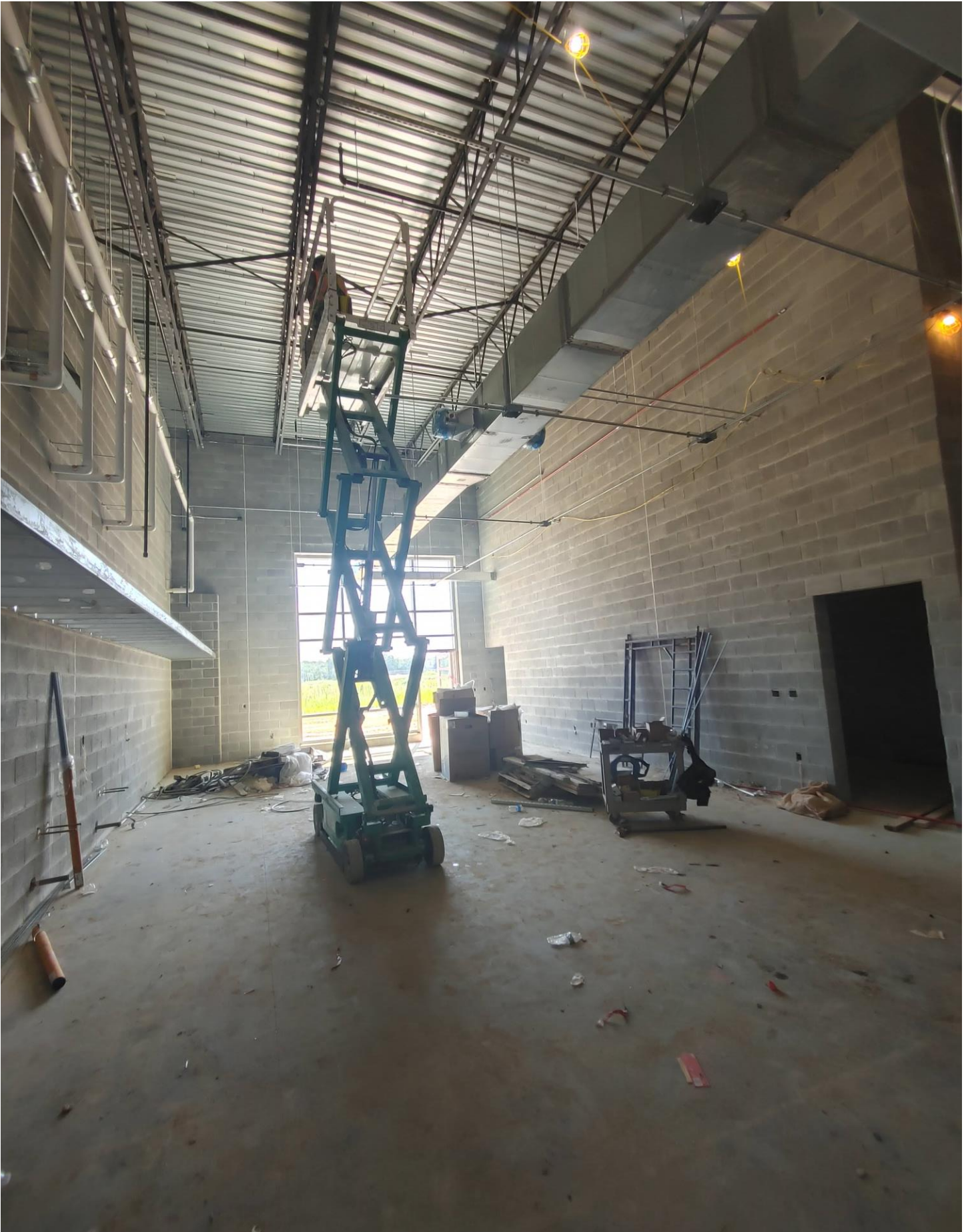
Photo 7 - Electrical Conduit is being run in Area D.