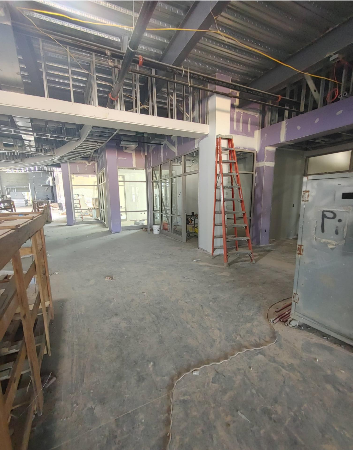
Photo 2 - Storefronts continue to be set on Area A.