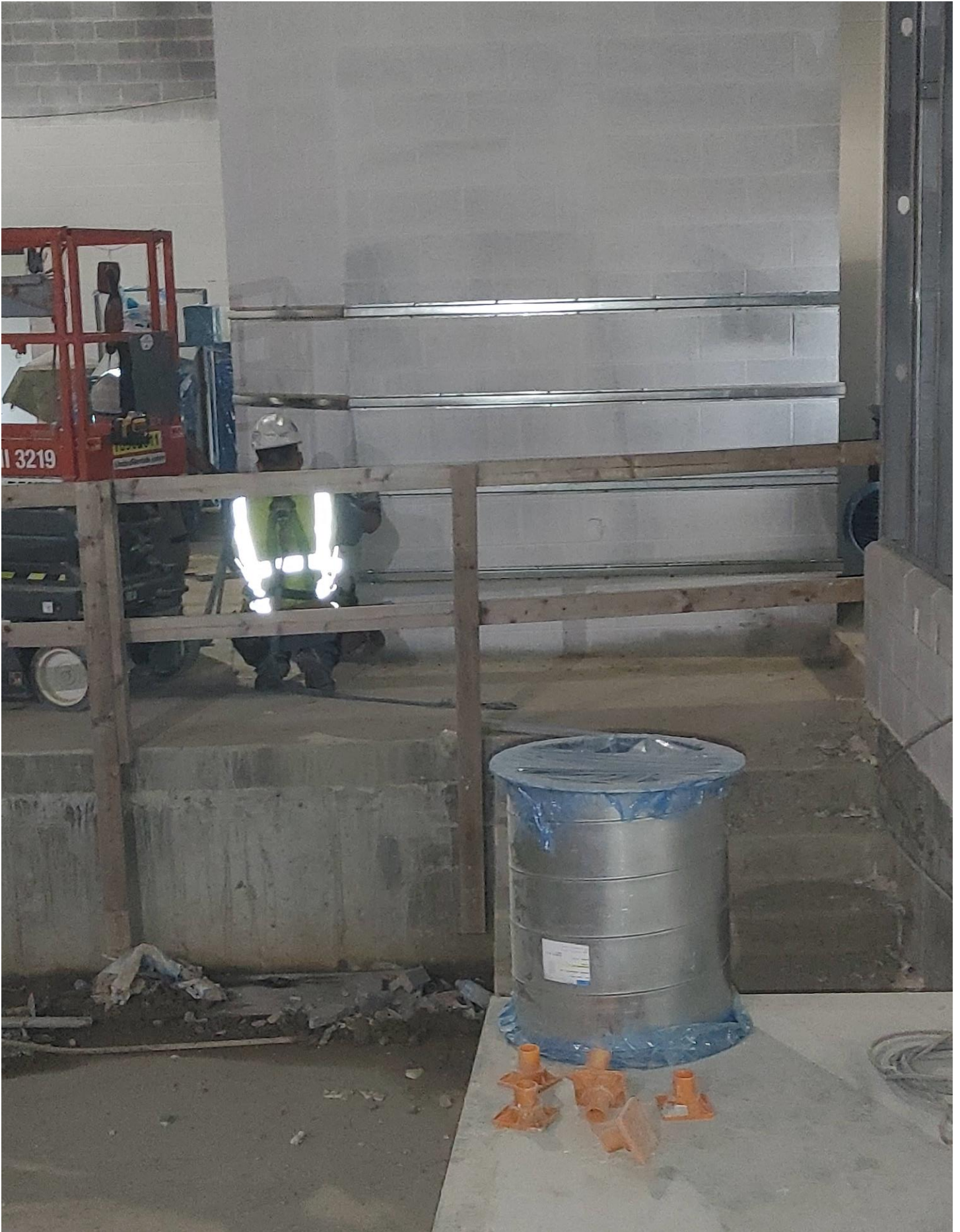
Photo 8 - Hat Channel is being installed in the Auditorium.