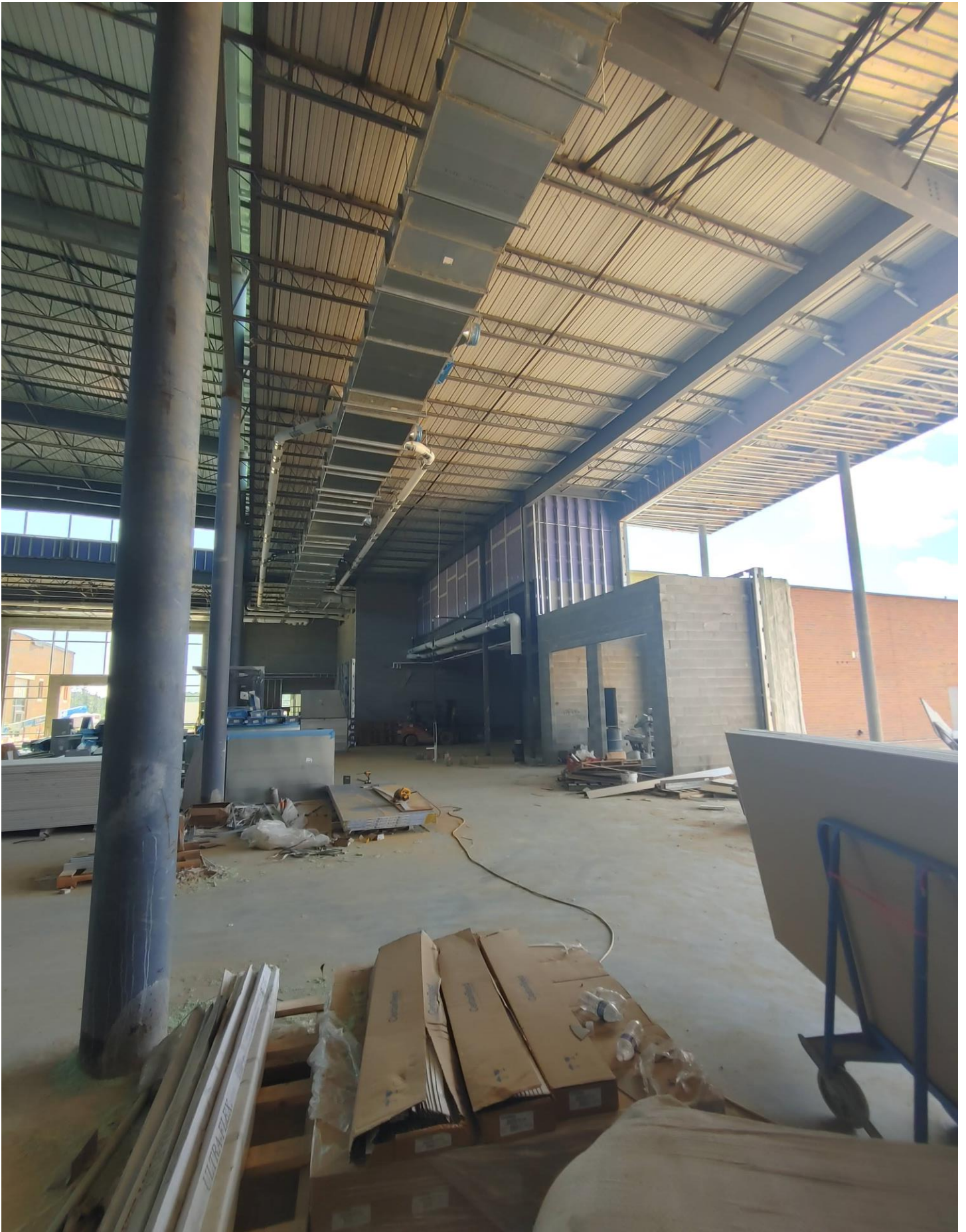
Photo 3 - HVAC Duct is being run in Area C and sheetrock is being finished.