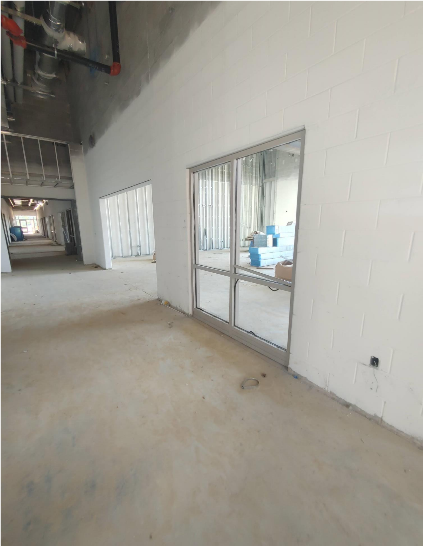
Photo 6 - Storefronts are being et in Corridor D12