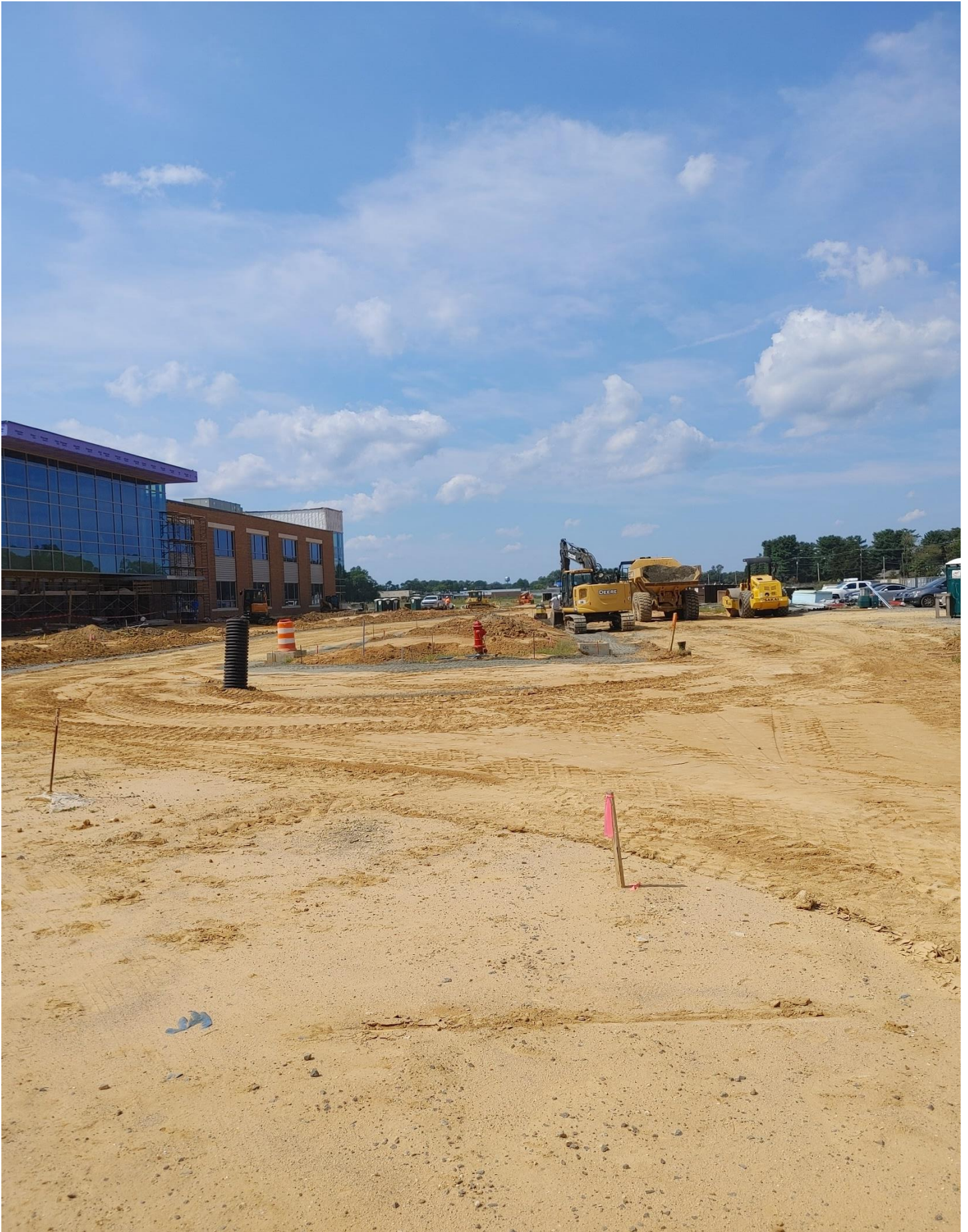
Photo 4 - Drive Lanes in front of the school have been laid out and are being graded