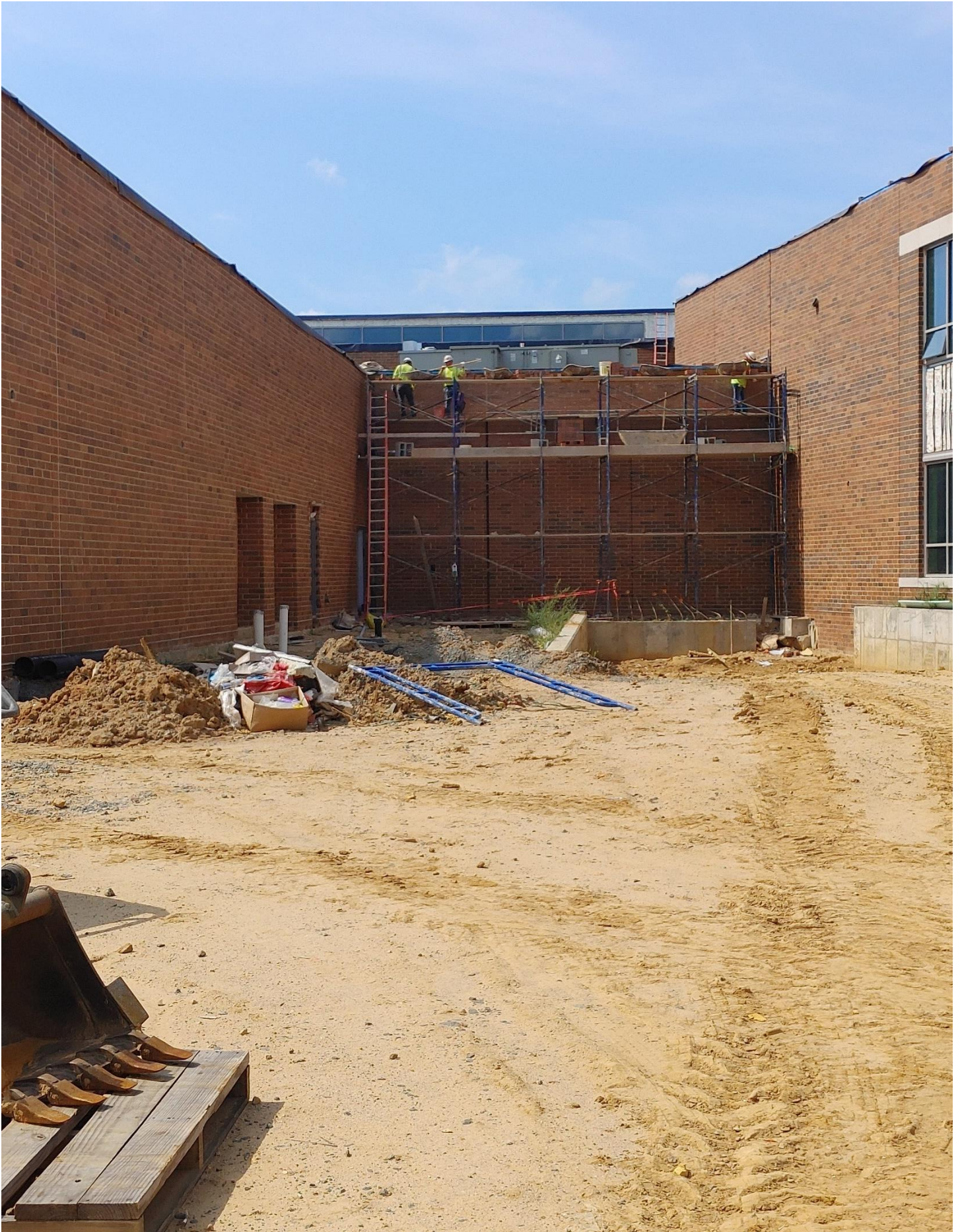
Photo 18 – The Masons are laying Brick of the East side of Area C.