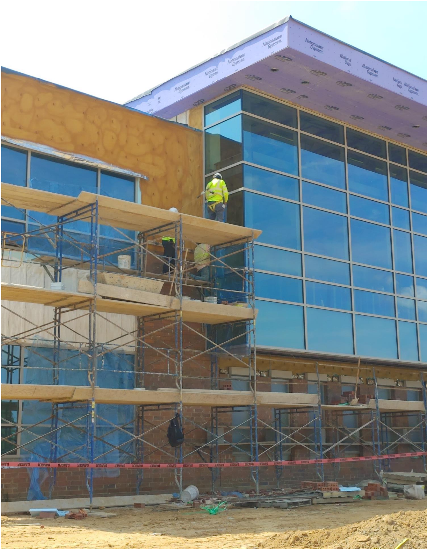
Photo 6 - Steps are being taken to protect the Curtain wall as the mason lays brick.