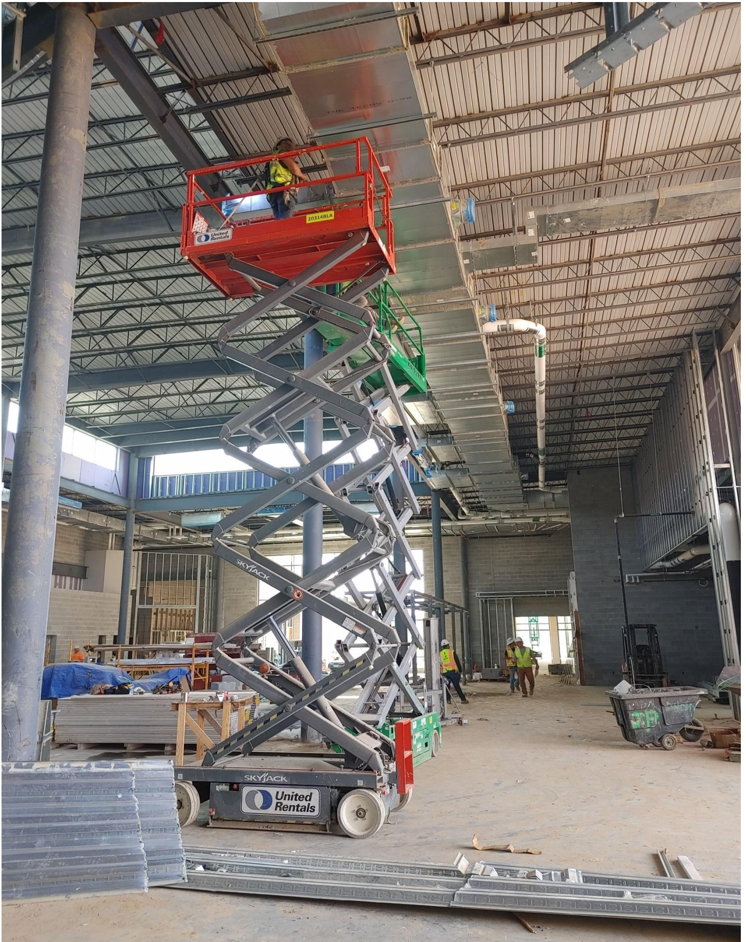
Photo 10 - Duct work is being installed in Area C.