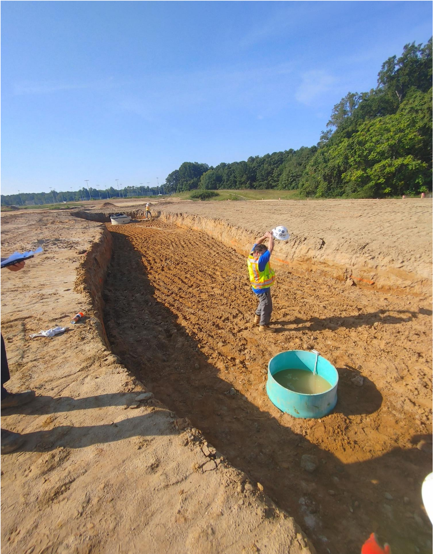
Photo 2 - The BMP on the West side of the Site is being constructed