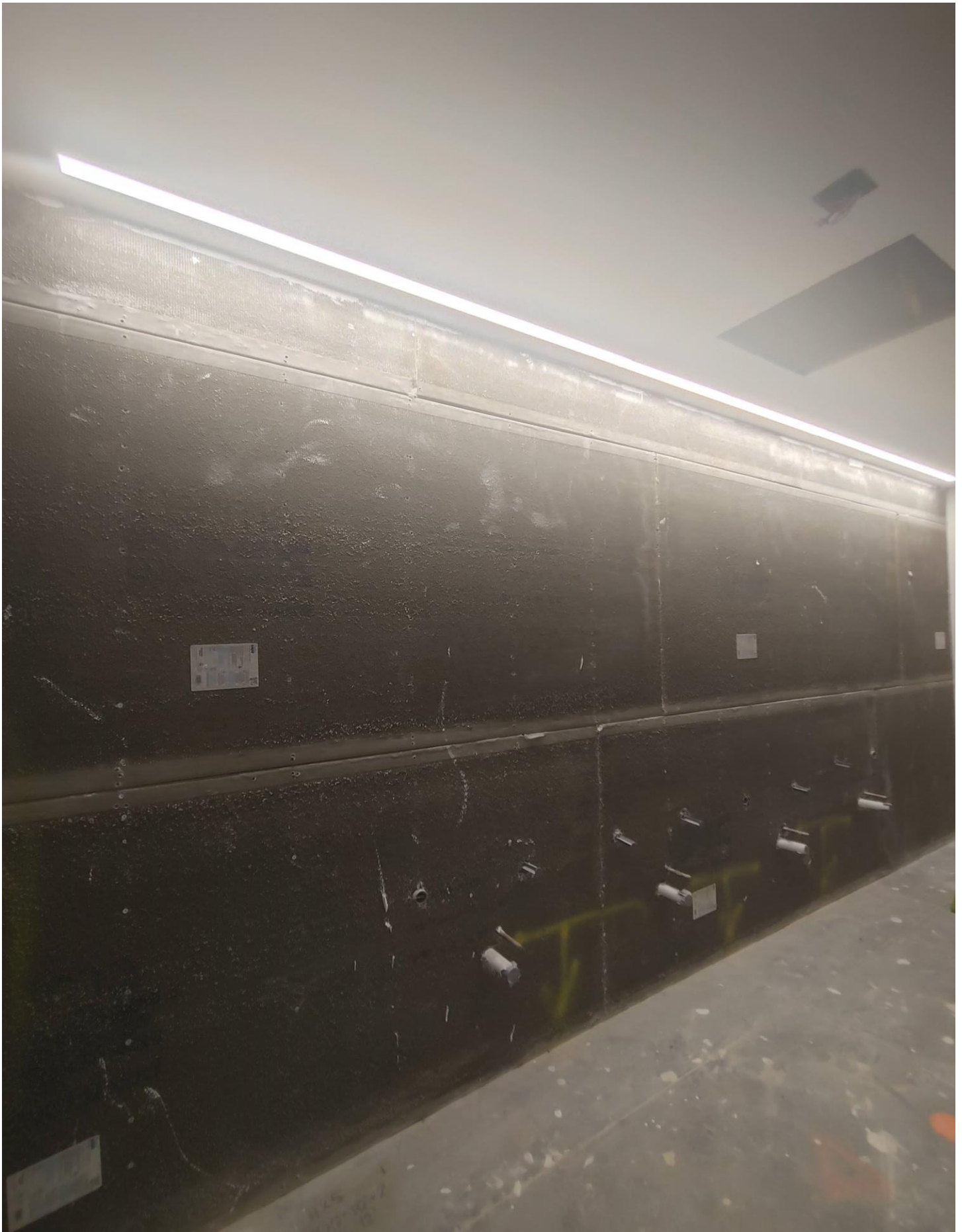
Photo 13 - Lighting has been installed in A118