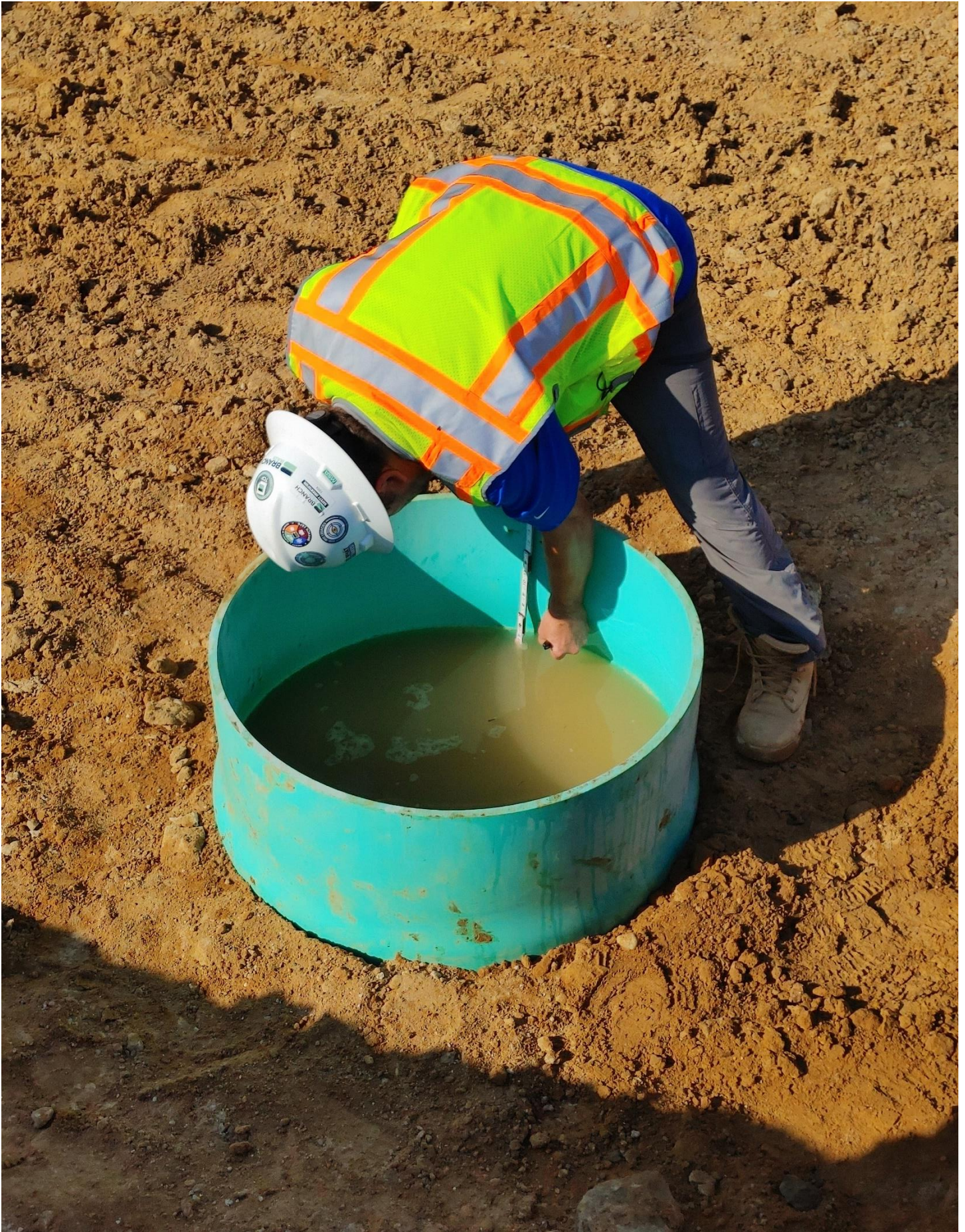
Photo 1 - Infiltration Test being performed in the BMP on the West side of the School Bus Parking Area