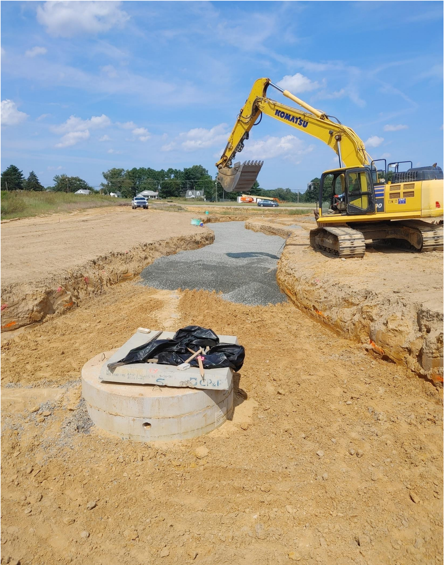
Photo 15 - 12" of 57 Stone is being installed in the BMP on the West side of the School.