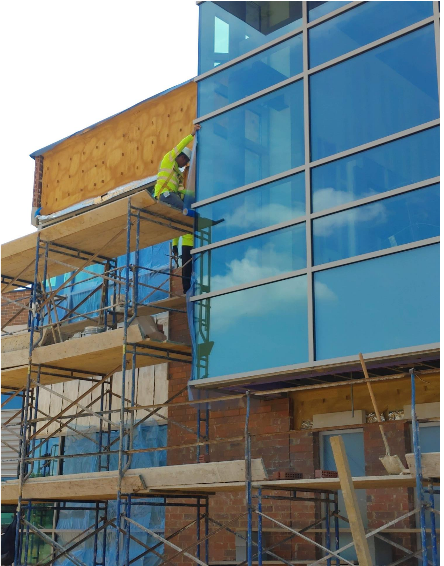
Photo 7 - Poly is being hung over the storefront to protect it as the Mason lays brick.