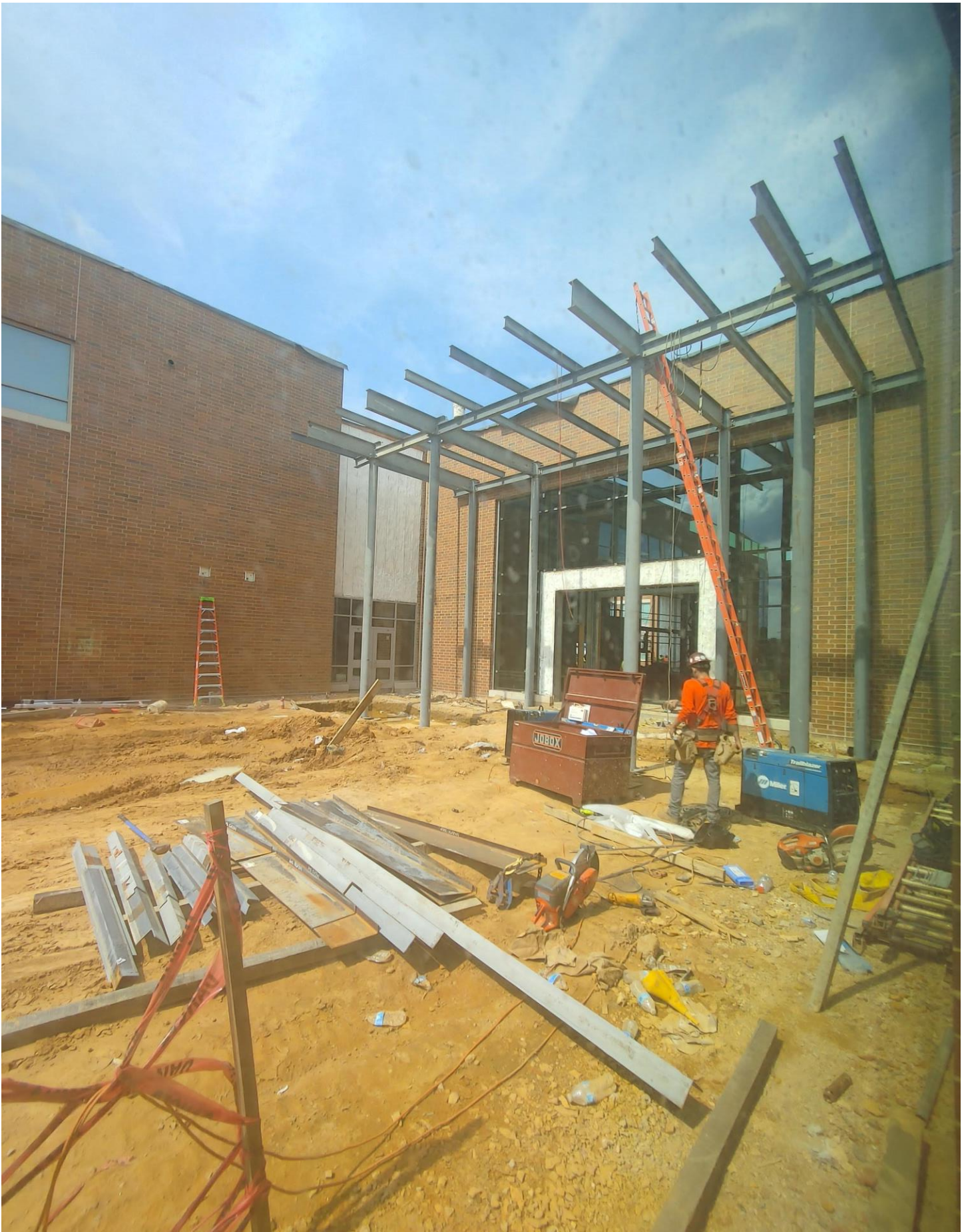
Photo 17 - The Canopy is being Installed on the South side of Area C