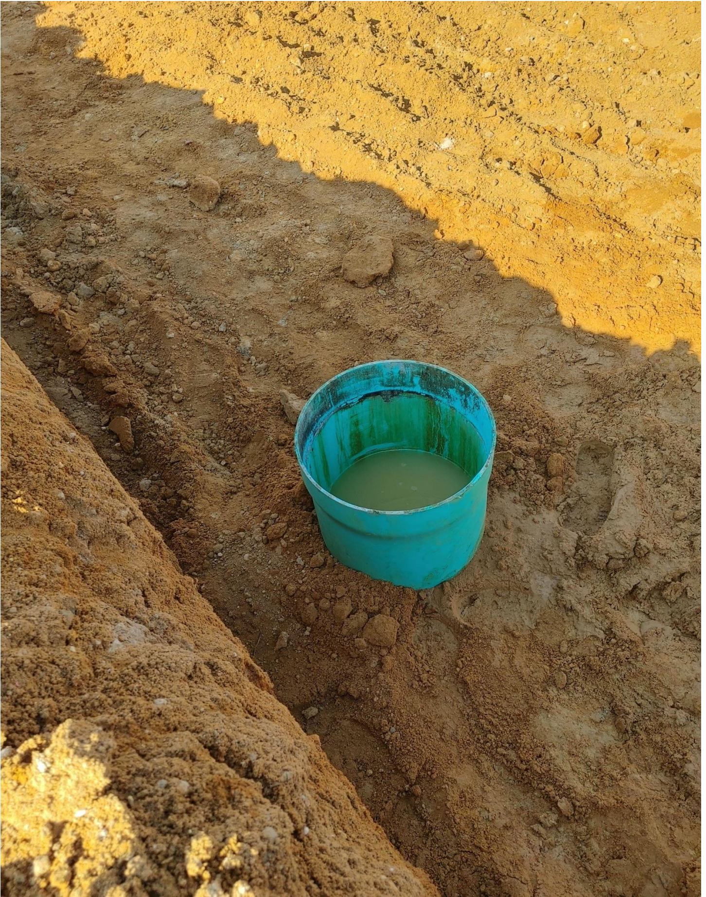
Photo 3 - 2nd Infiltration Test being conducted in the BMP on the West side of the site.