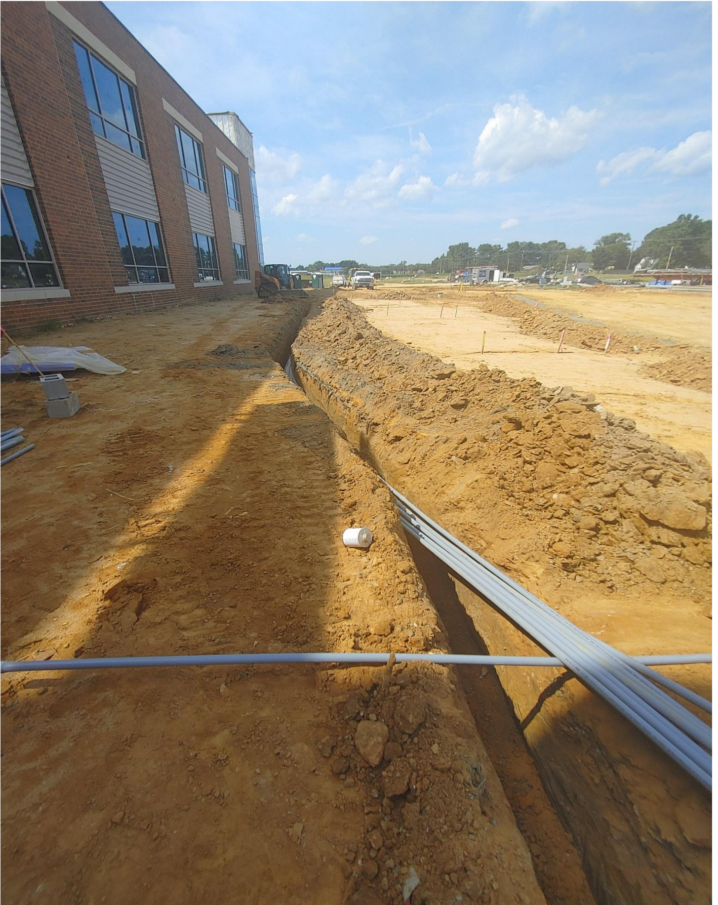
Photo 8 - The masons are running conduit for Pole Lights