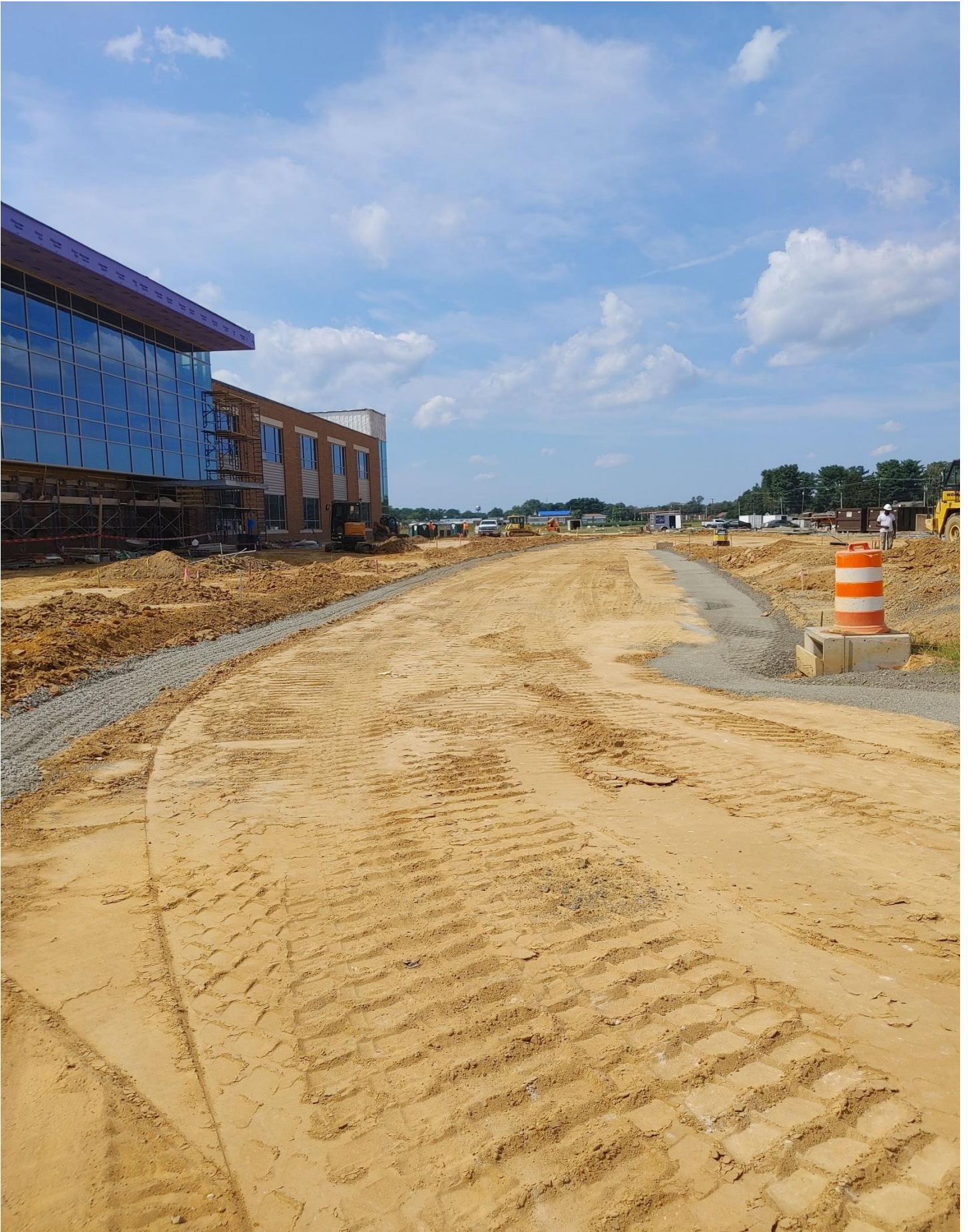
Photo 5 - Drive lane