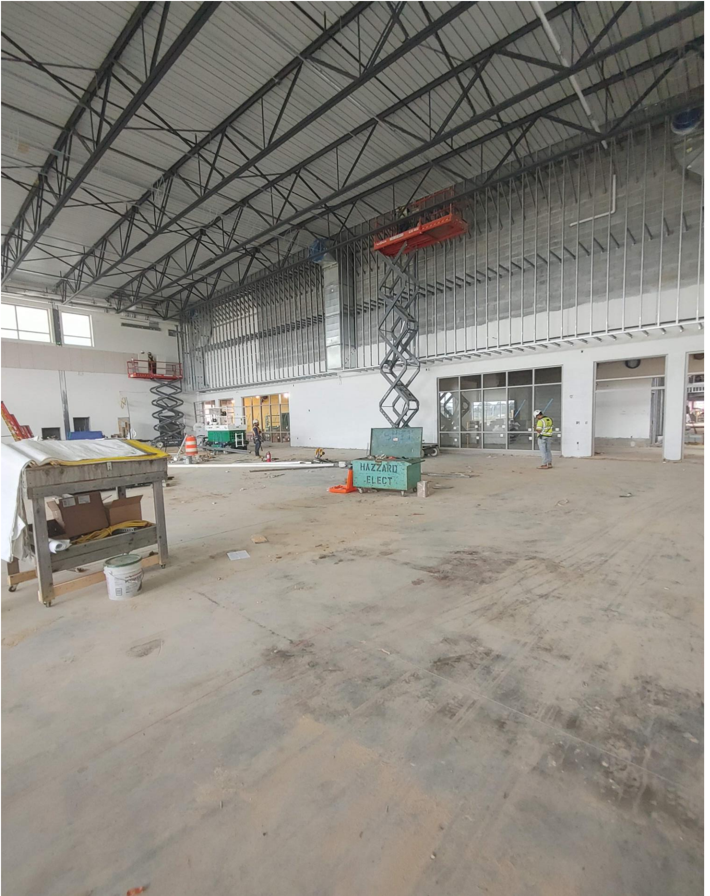
Photo 10 - Metal Stud Framing on the North wall of the Gym.