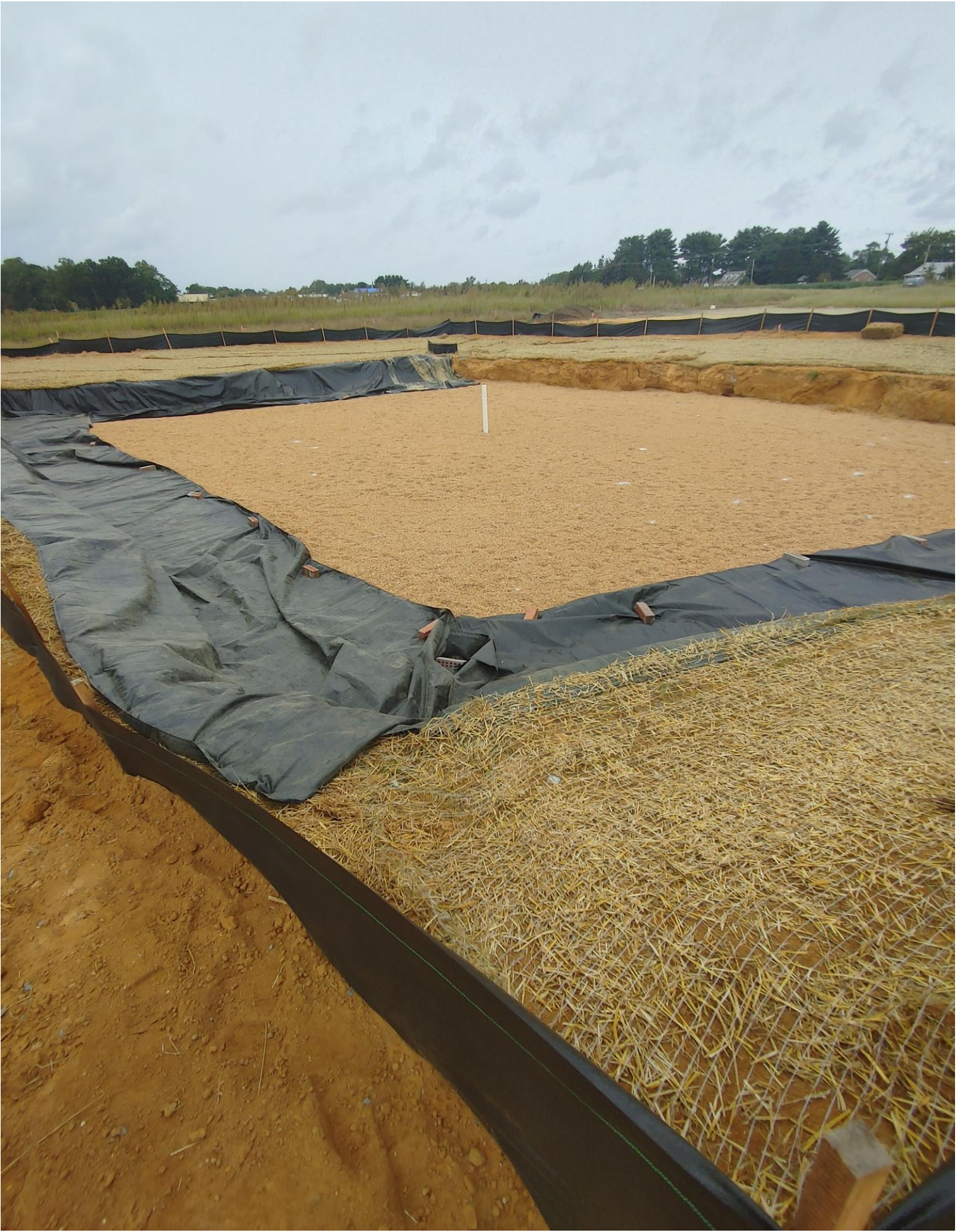
Photo 12 - Pea Gravel installed in smaller BMP