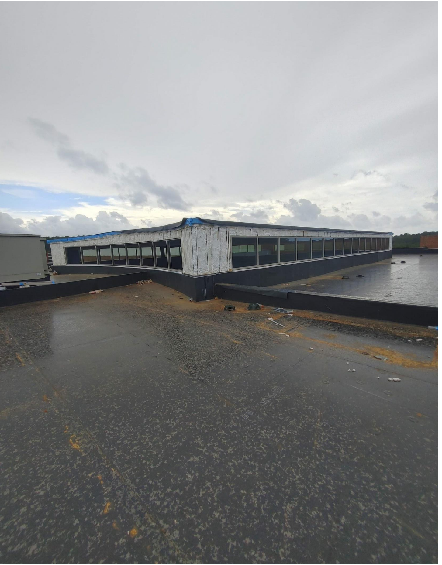
Photo 21 - Glass has been installed in three of the four sides of Area C.