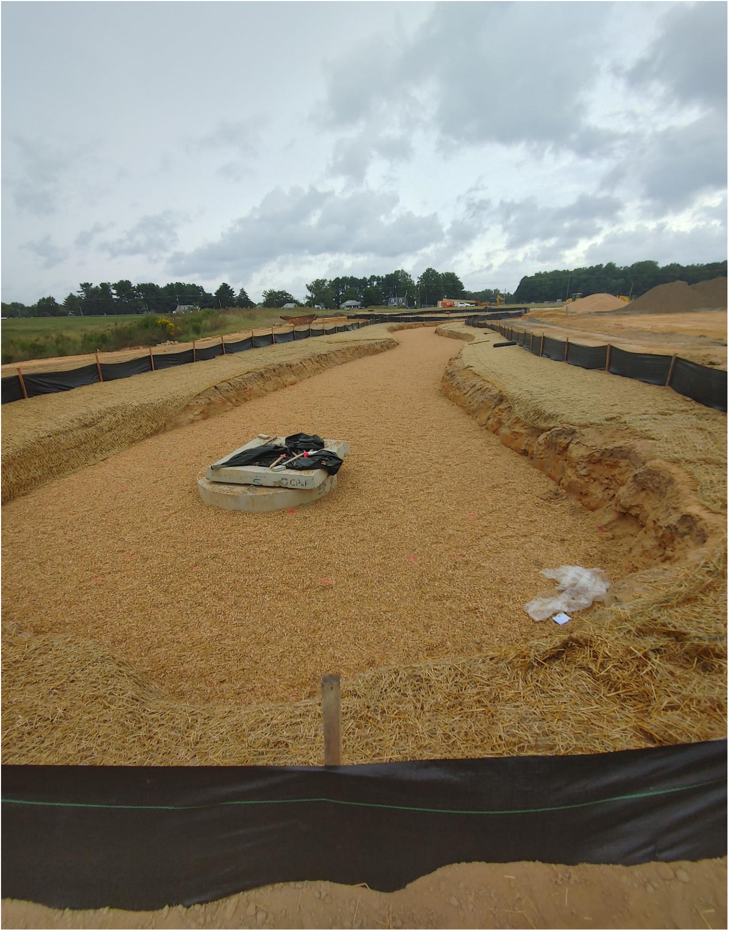
Photo 11 - Pea Gravel has been installed in BMP