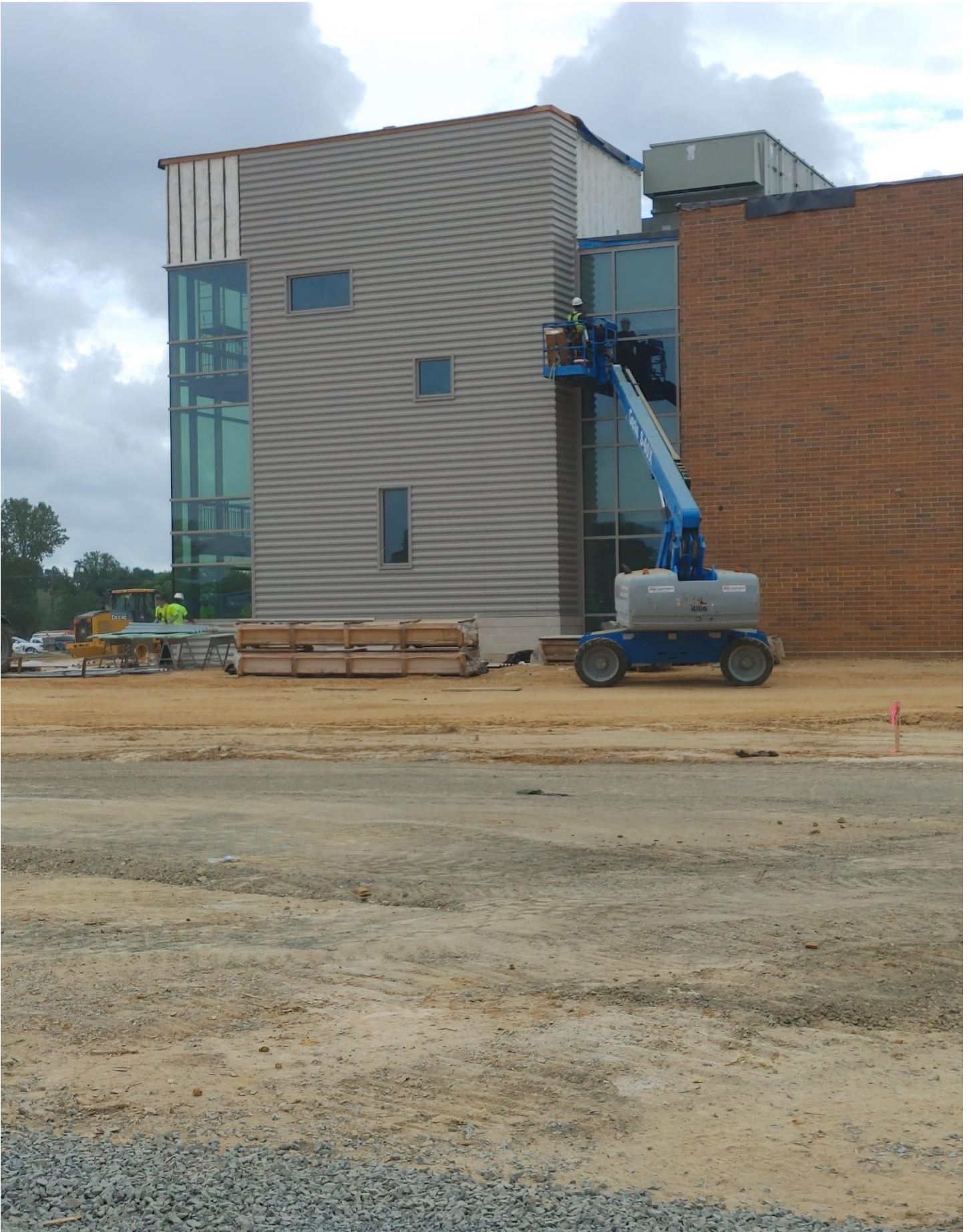
Photo 13 - Metal Panels are being installed on the West side of Area B.