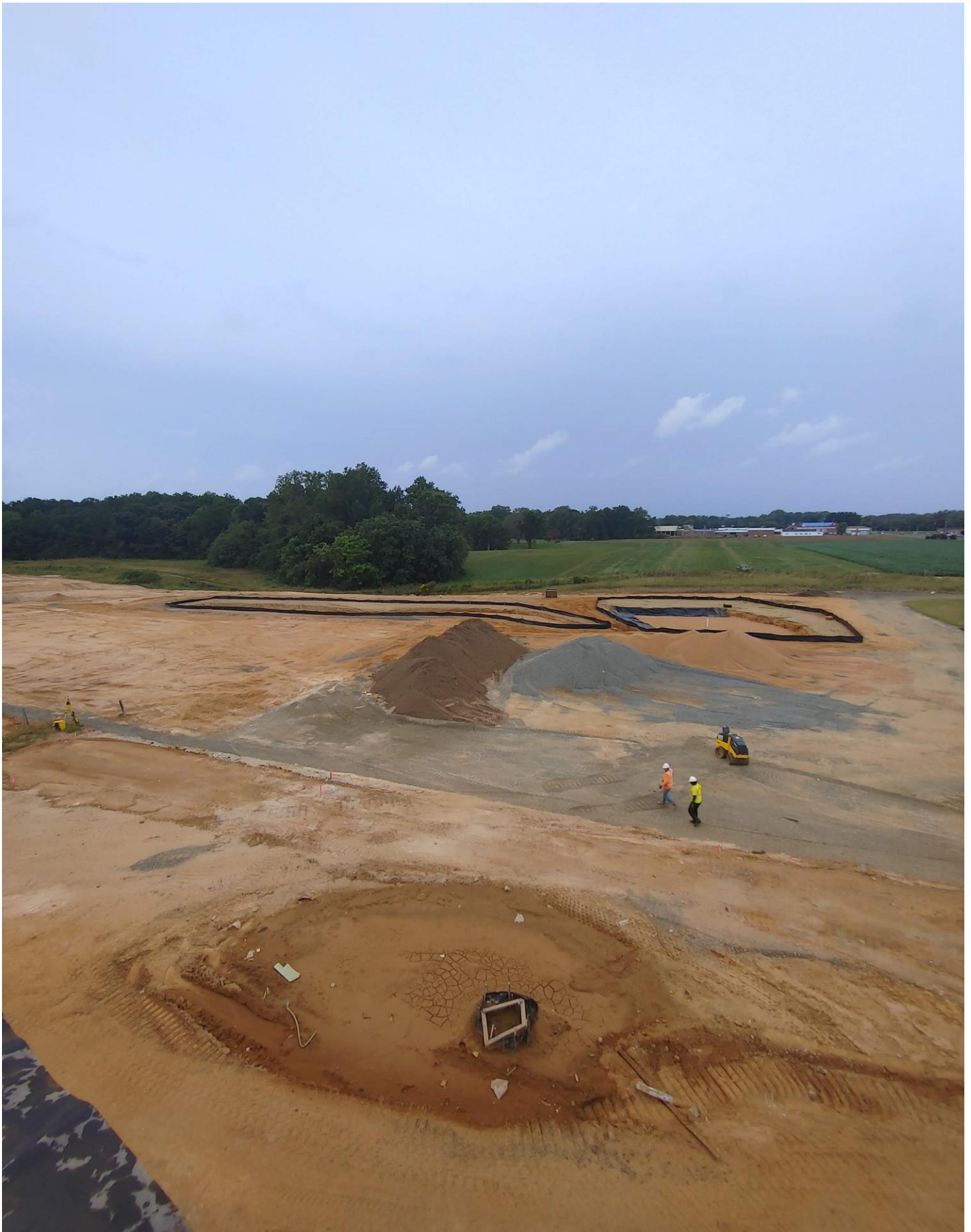
Photo 20 - BMPs and Bus Parking area.