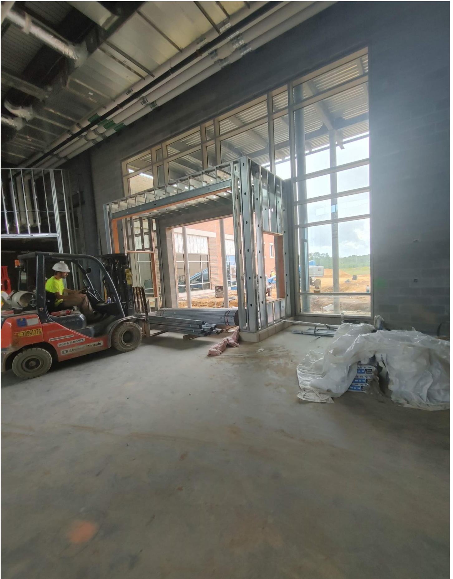
Photo 8 - Vestibule has been constructed on the South Side of Area C