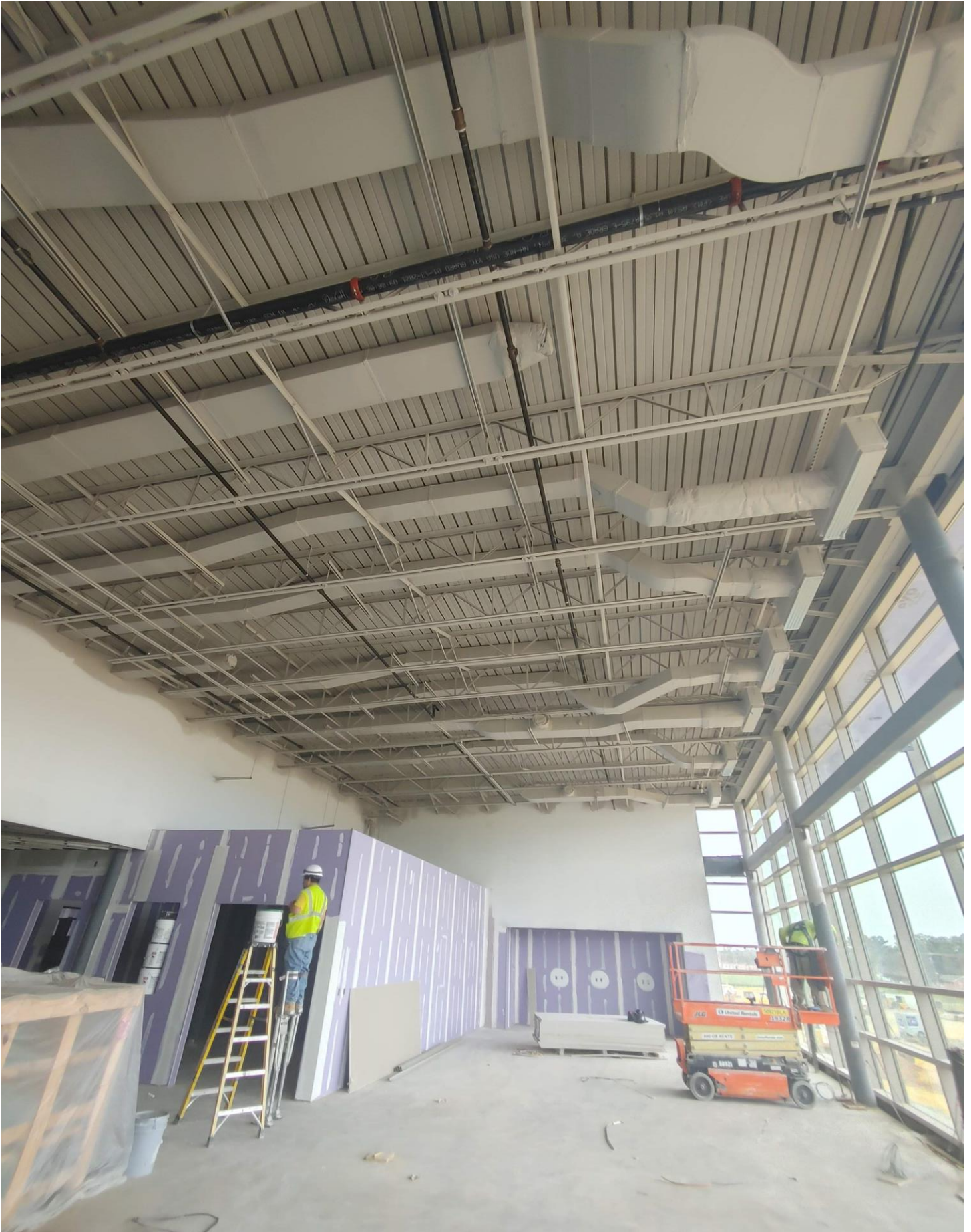
Photo 17 - Metal Deck and Duct has been sprayed in Area A.