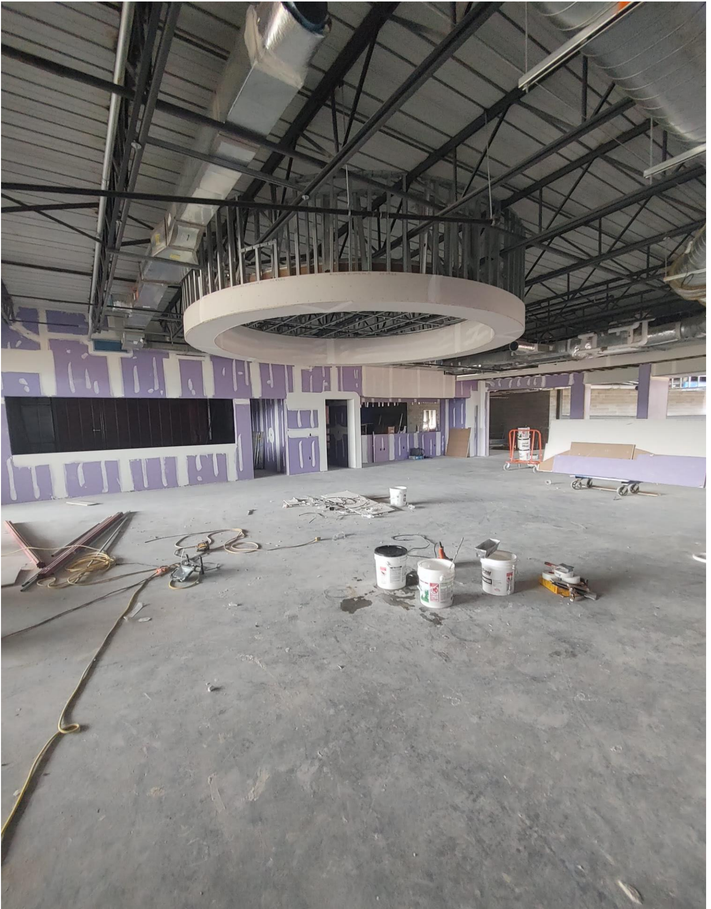
Photo 16 - Sheetrock continues to be hung and finished on the 2nd floor of Area A.