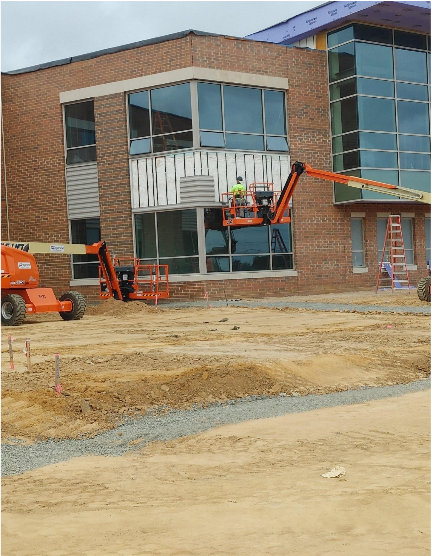
Photo 1 - Metal Panels are being installed on the North side of Area A