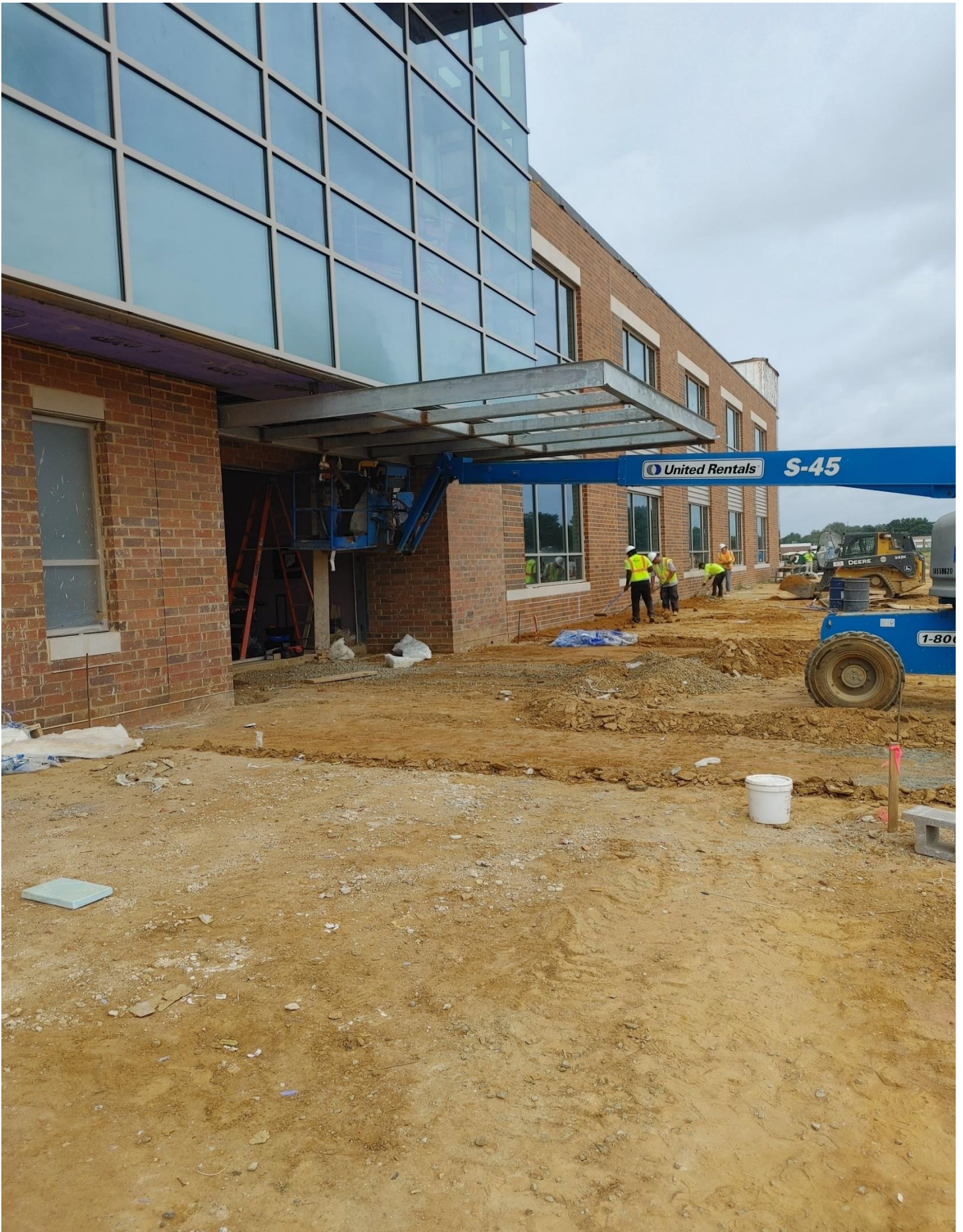
Photo 2 - Insulation is being installed in the Entrance area on the Northside of Area A.