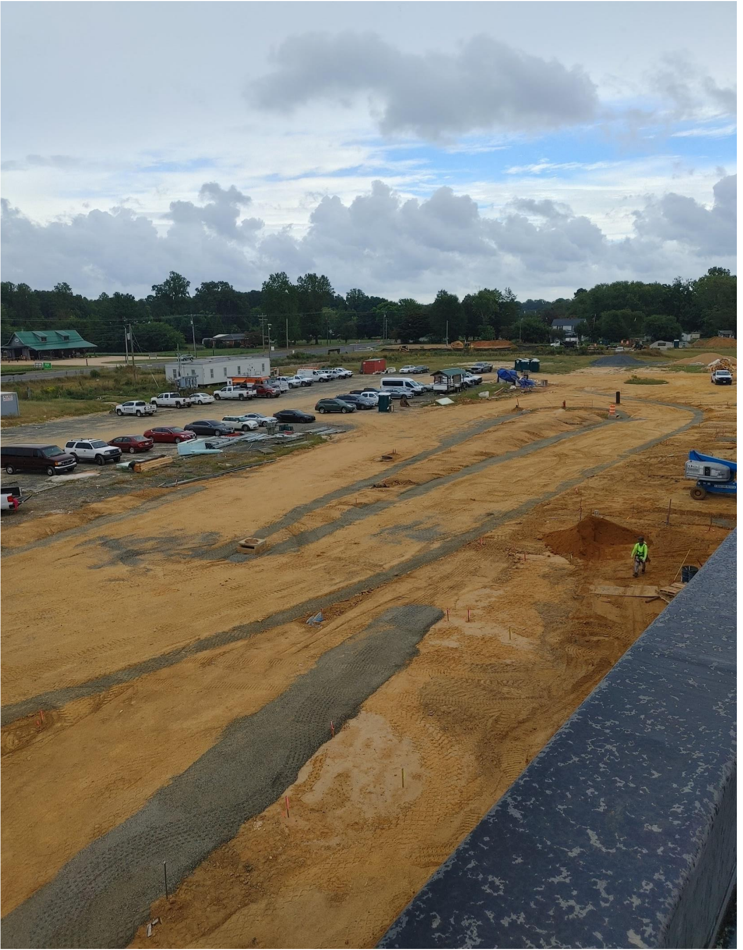
Photo 19 - Drive lane and drop off loop has been rough graded. Stone has been placed for curb and gutter.