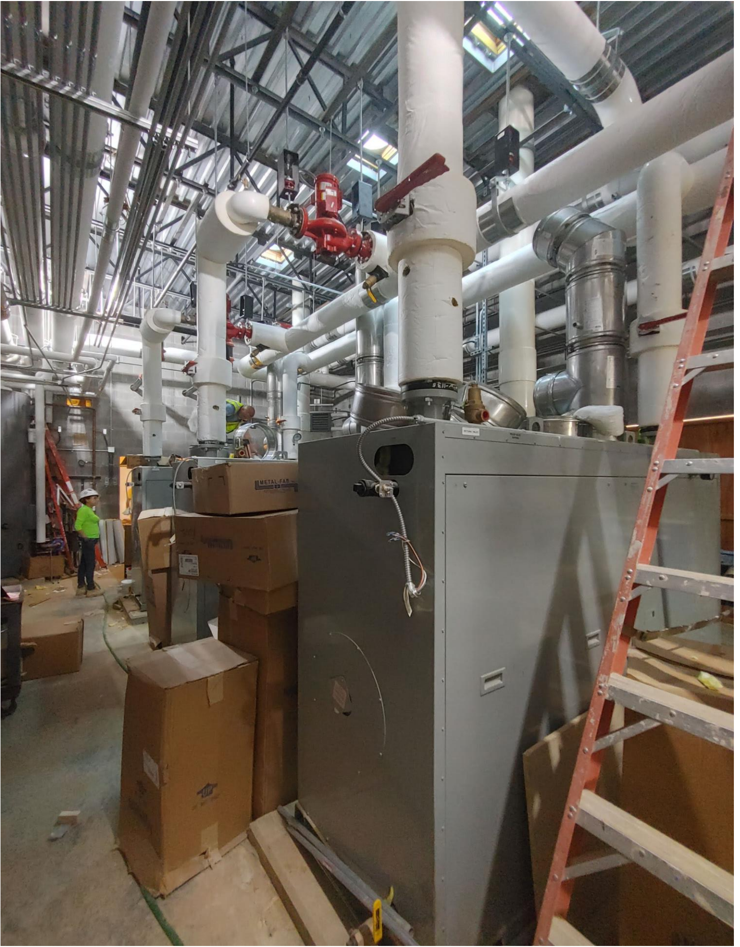
Photo 5 - Work continues on the Boilers in the Mechanical room.