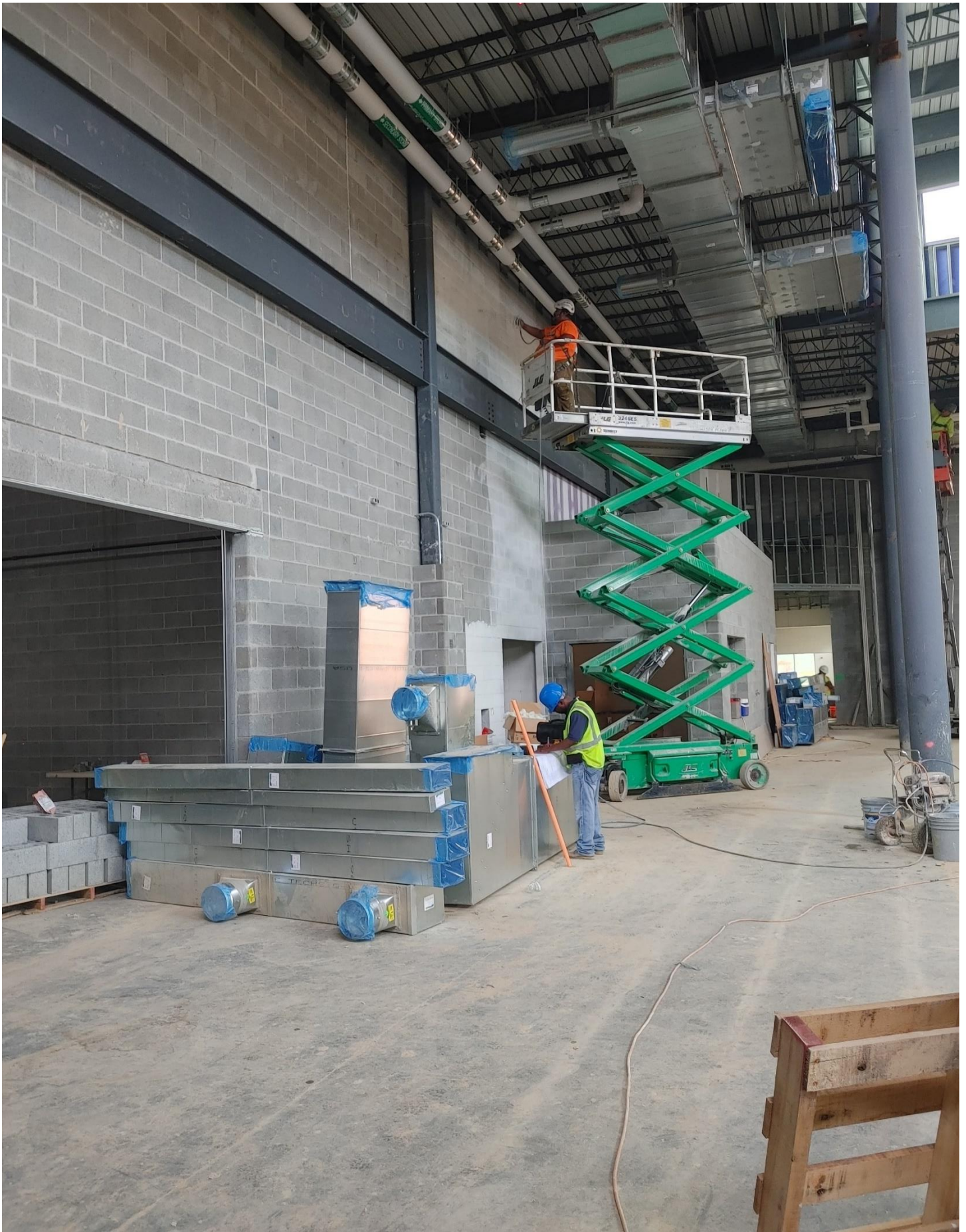
Photo 4 - Block Filler/Sealer is being applied in Area C.