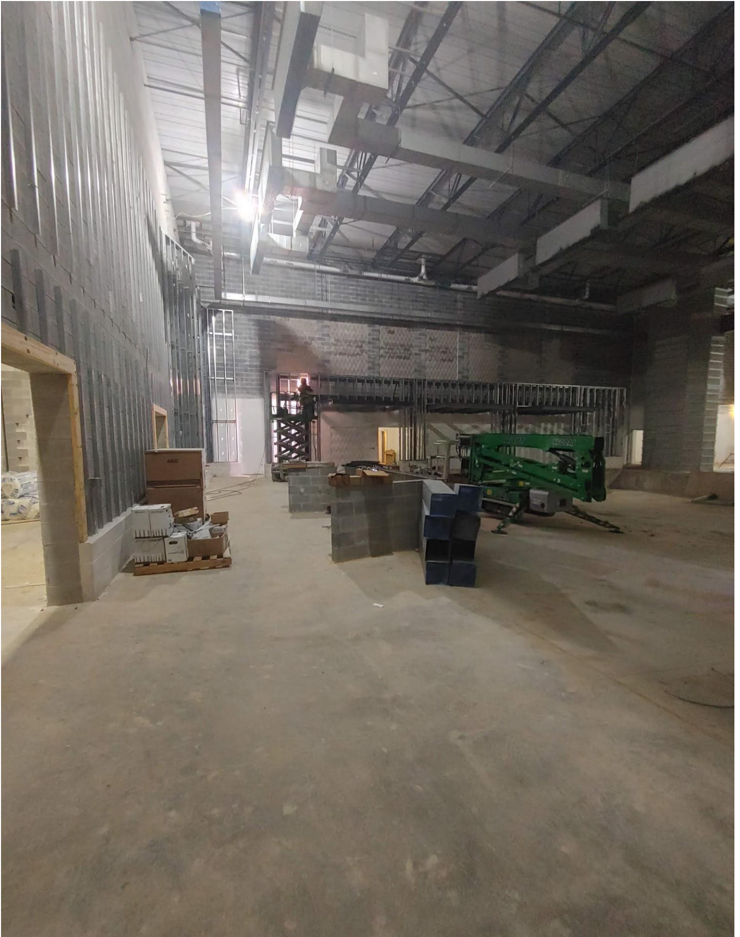
Photo 7 - Metal Beams are being welded in the Auditorium.