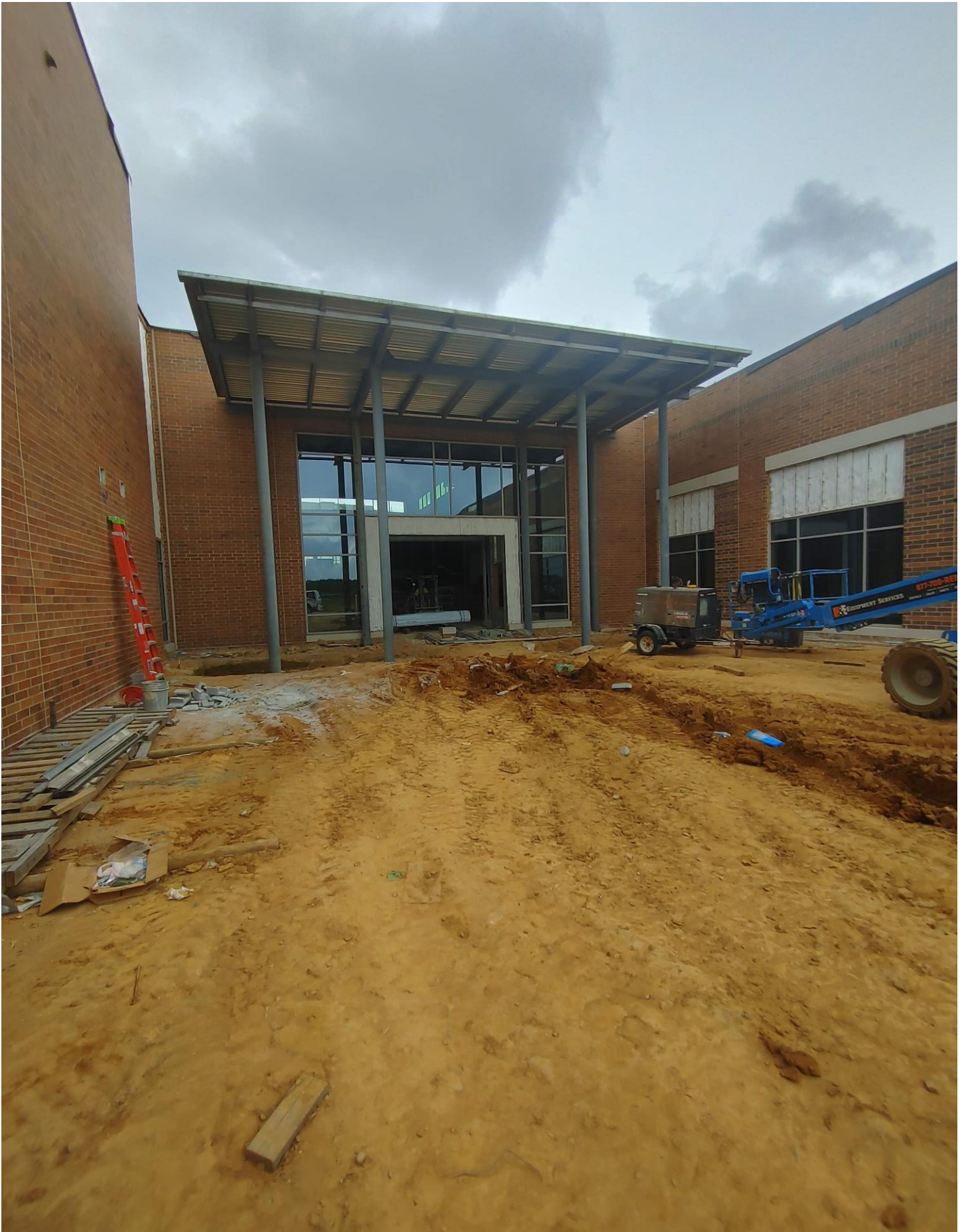
Photo 9 - Metal Pan has been installed on the Canopy on the South side of Area C.