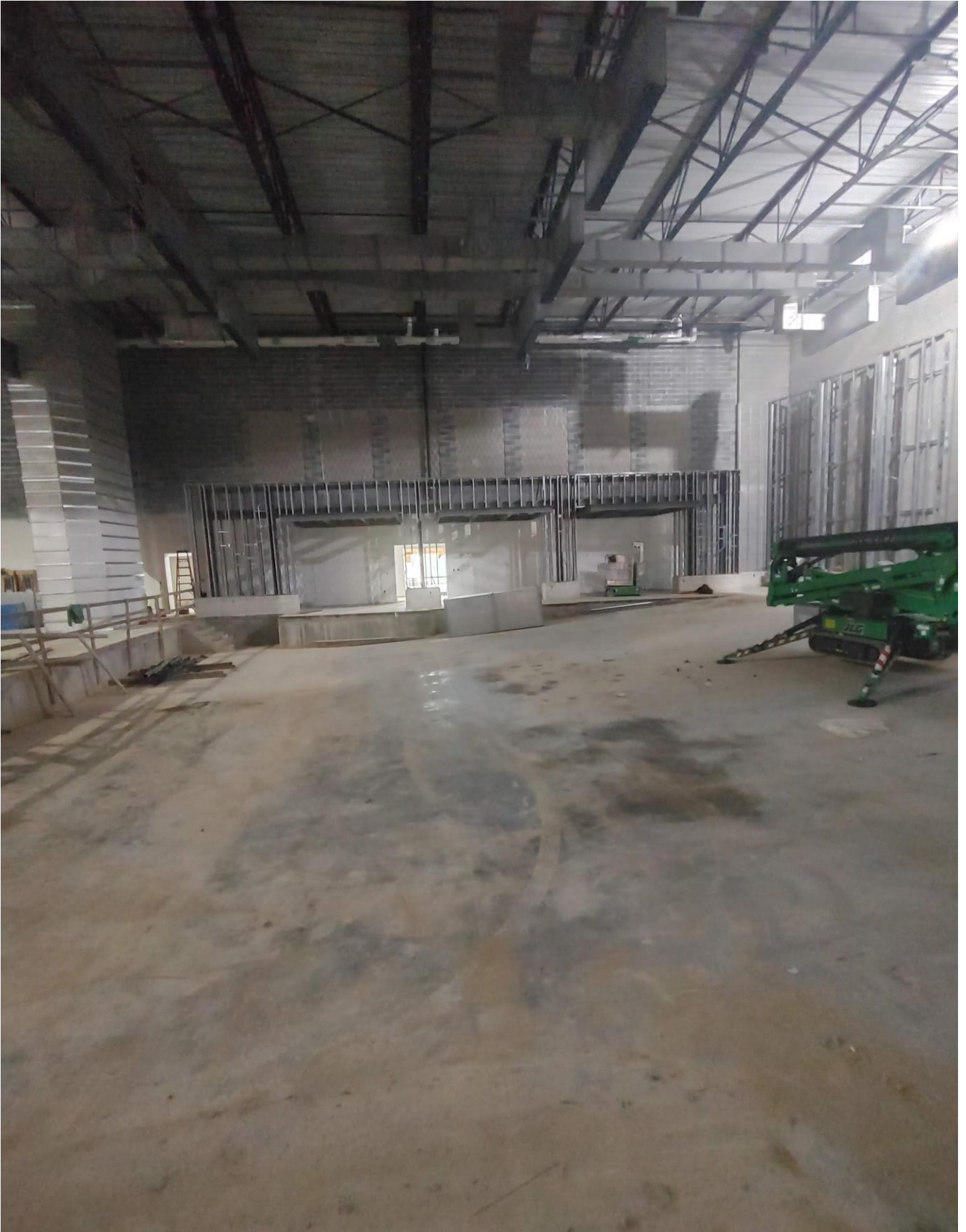
Photo 6 - Metal Stud framing has been completed on the North and South side of the Auditorium.