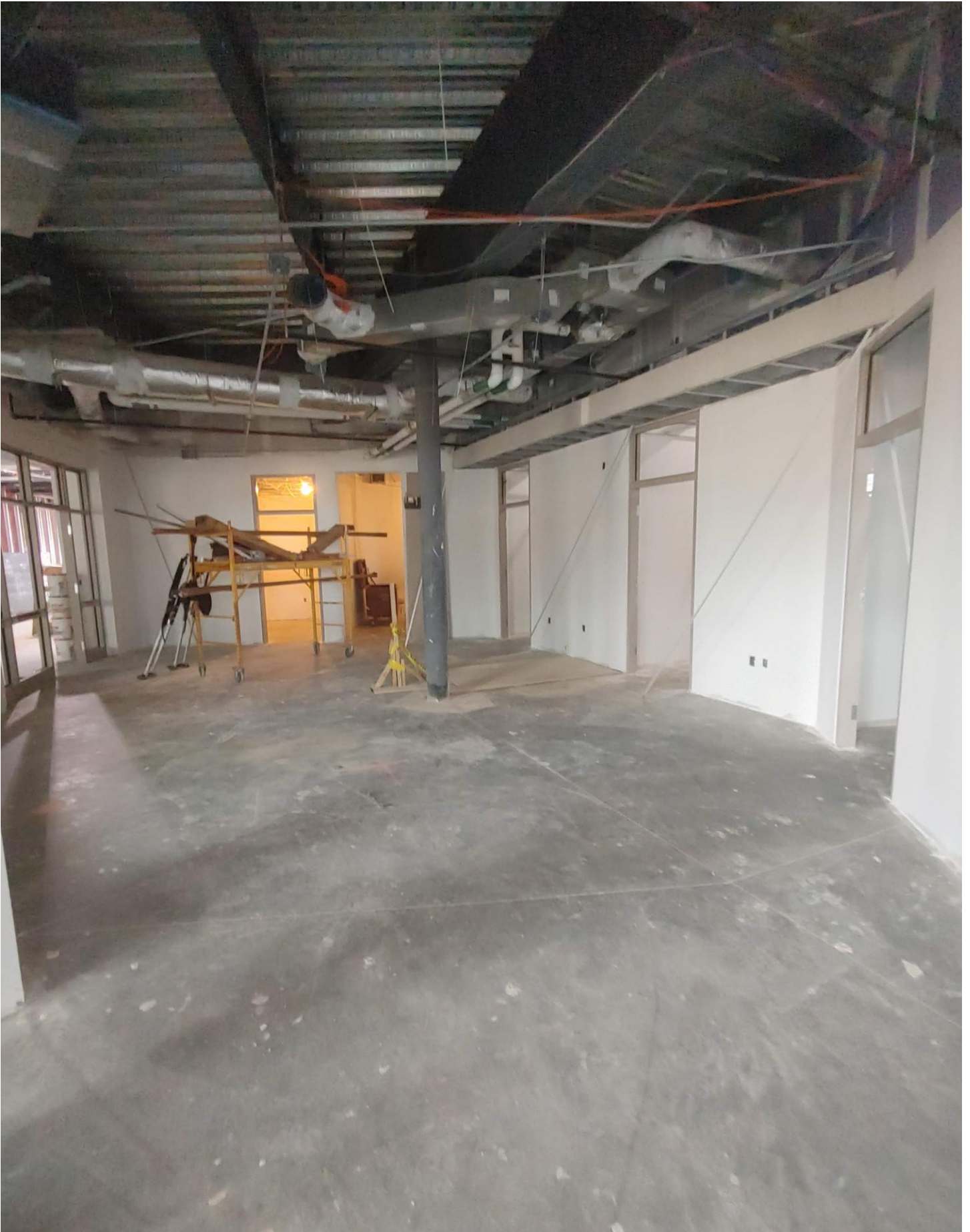
Photo 3 - Frames have been installed A134