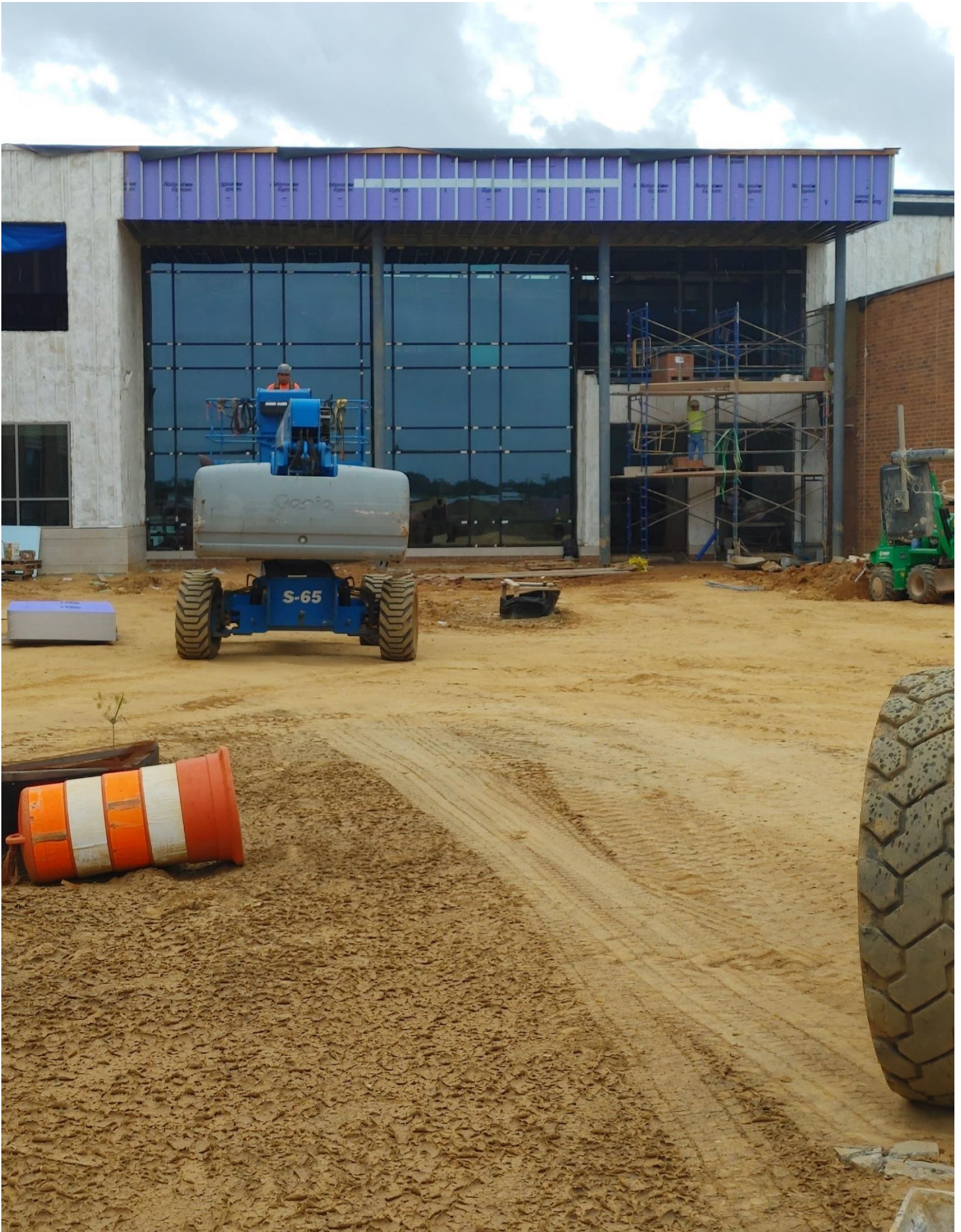
Photo 14 - Glass has been installed in the Curtain Wall on the West side of Area C.