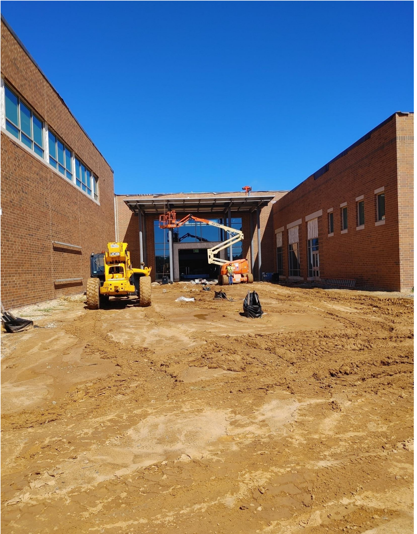
Photo 8 - South side of Area C. Steel is being welded on Canopy.