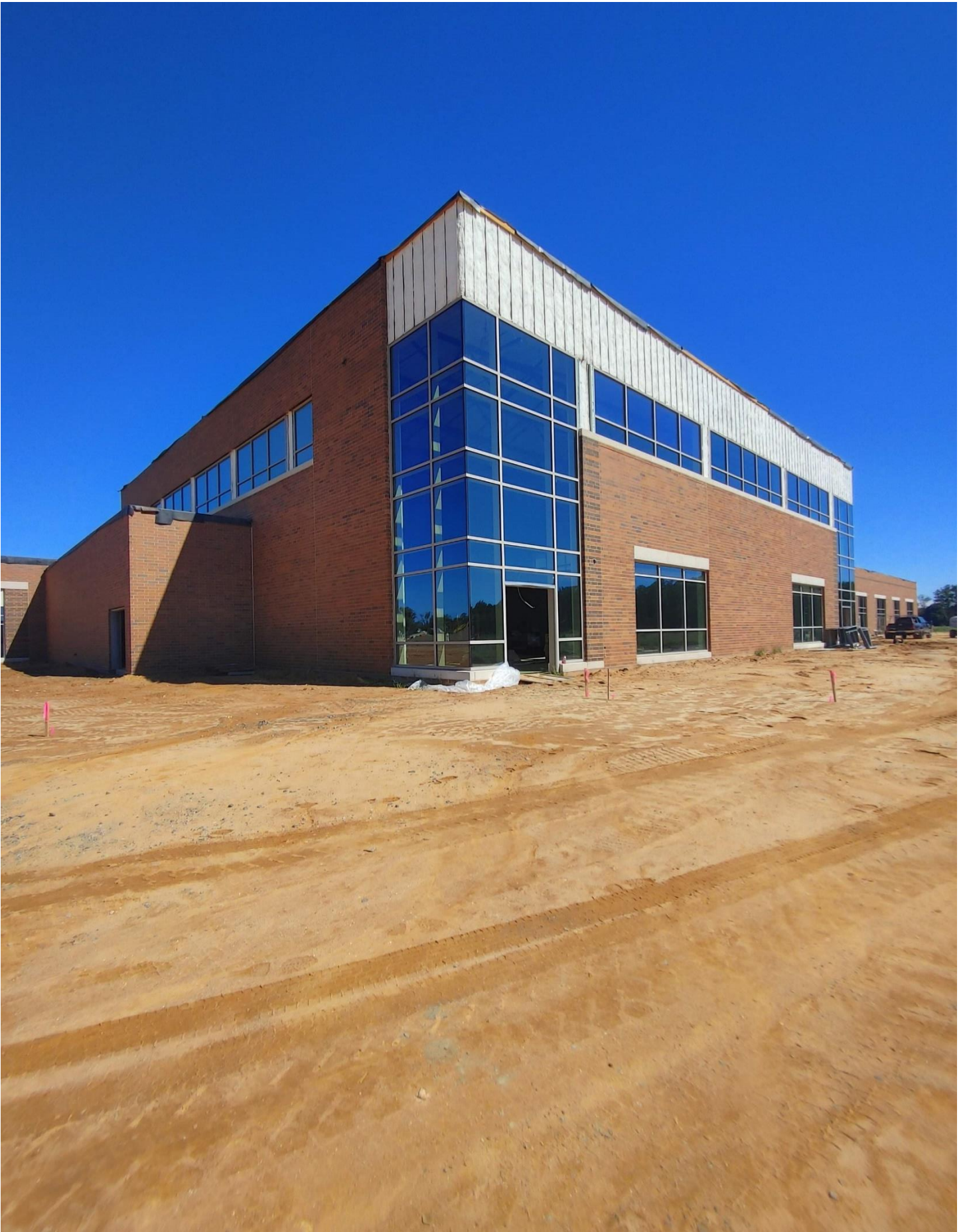
Photo 7 - South side of Gymnasium.