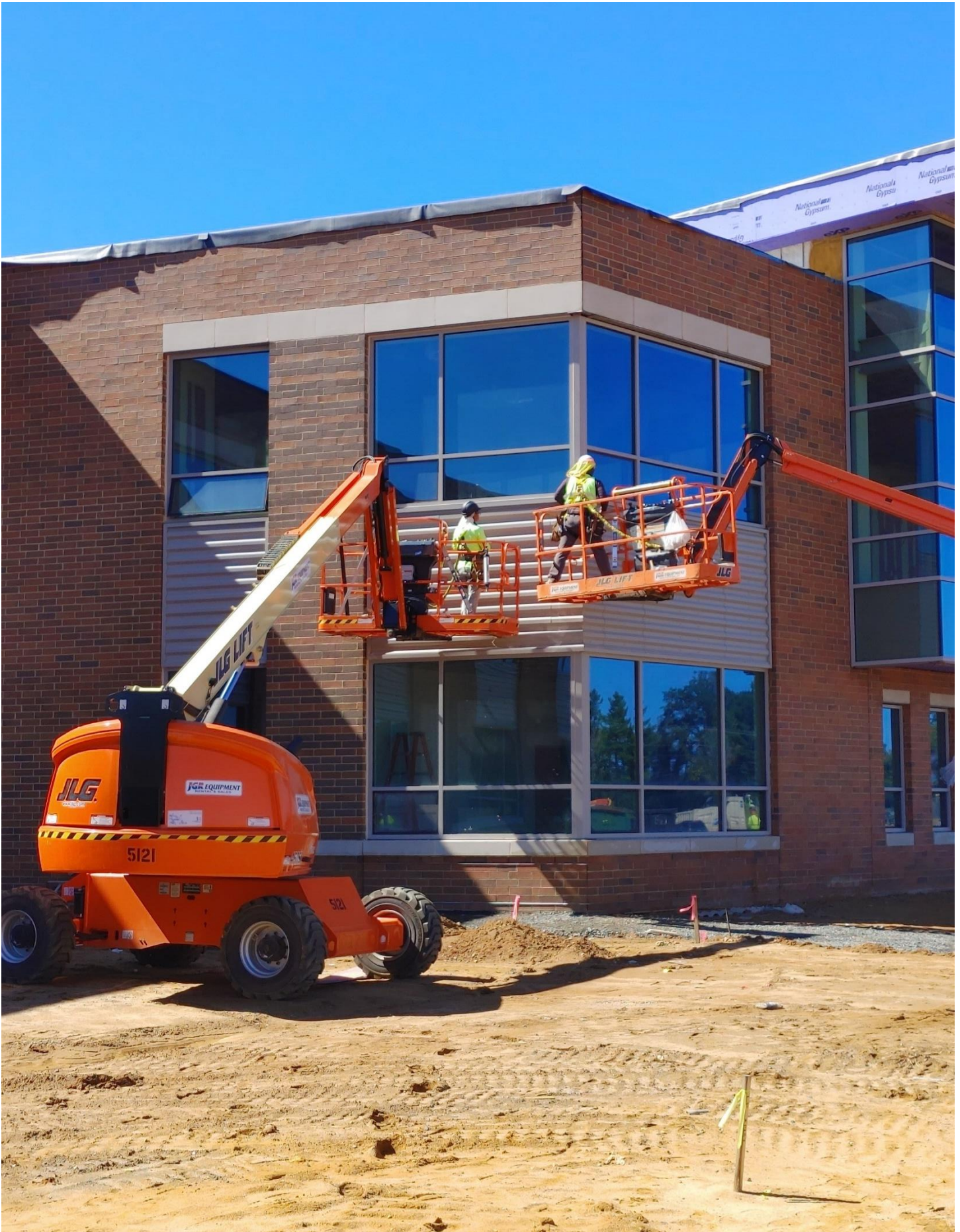
Photo 1 - Metal Panels are being installed on Area A