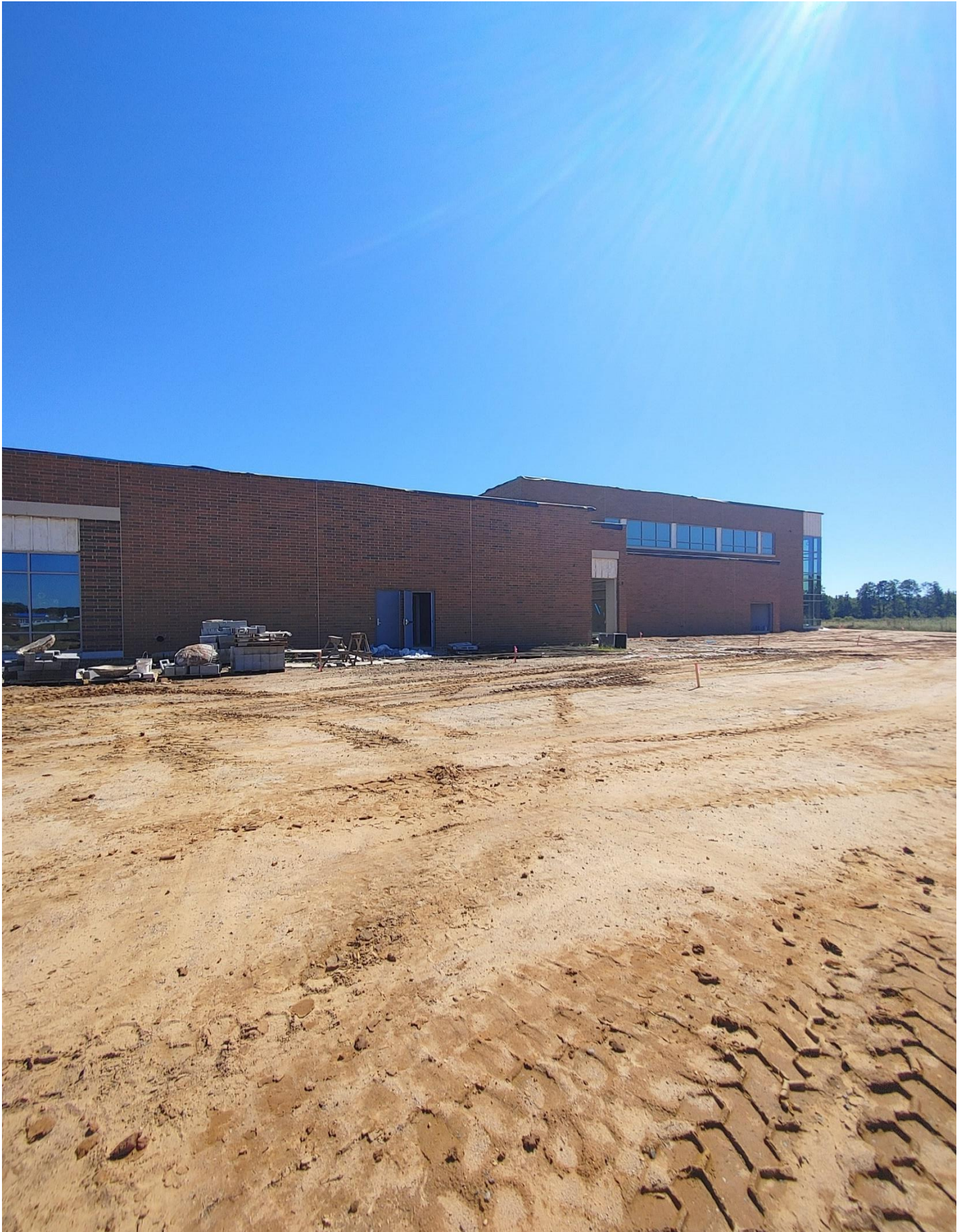
Photo 5 - West side of Gymnasium