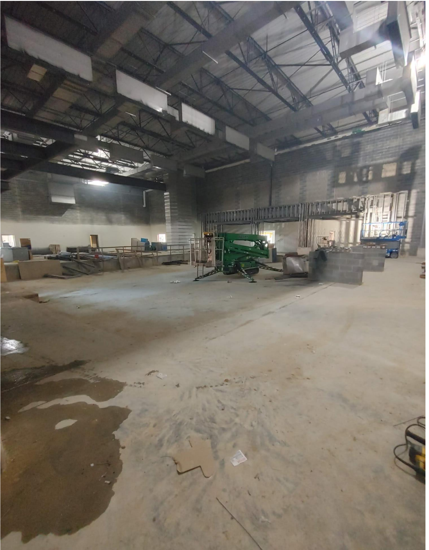
Photo 13 - Auditorium