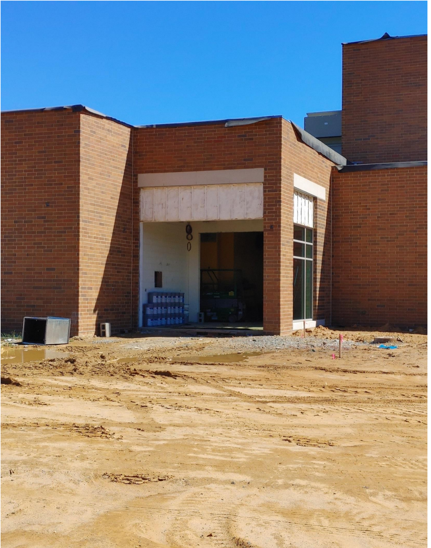
Photo 6 - Curtain wall still needs to be installed on the Gym Hallway.