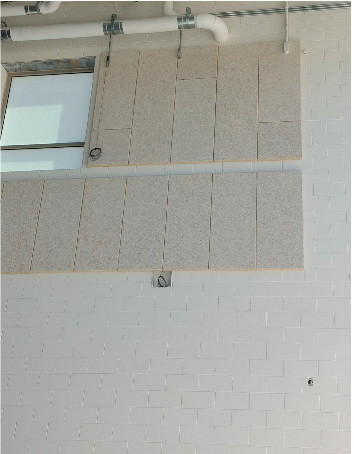
Photo 16 - Acoustical panels in Gym.