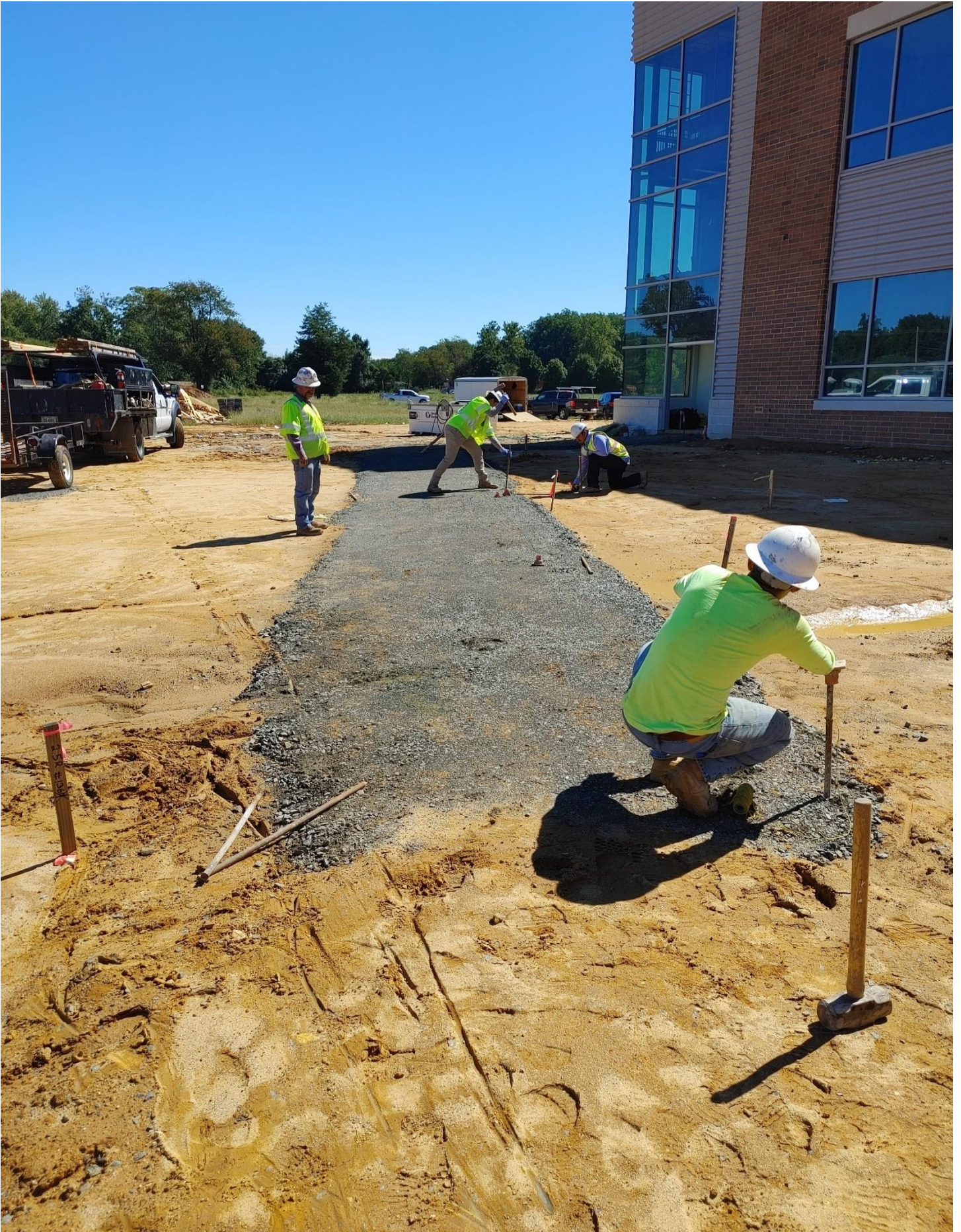
Photo 2 - Sidewalks are being laid out on the front of the building.