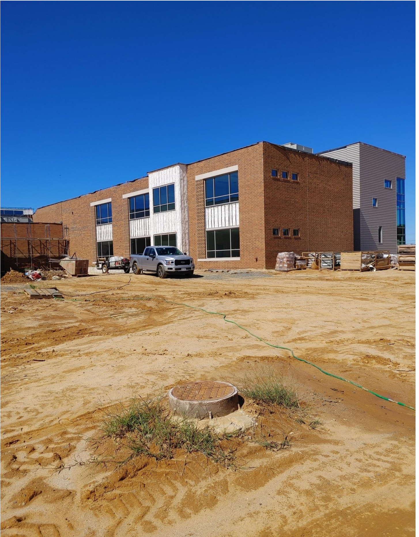
Photo 10 - South side of Area A.