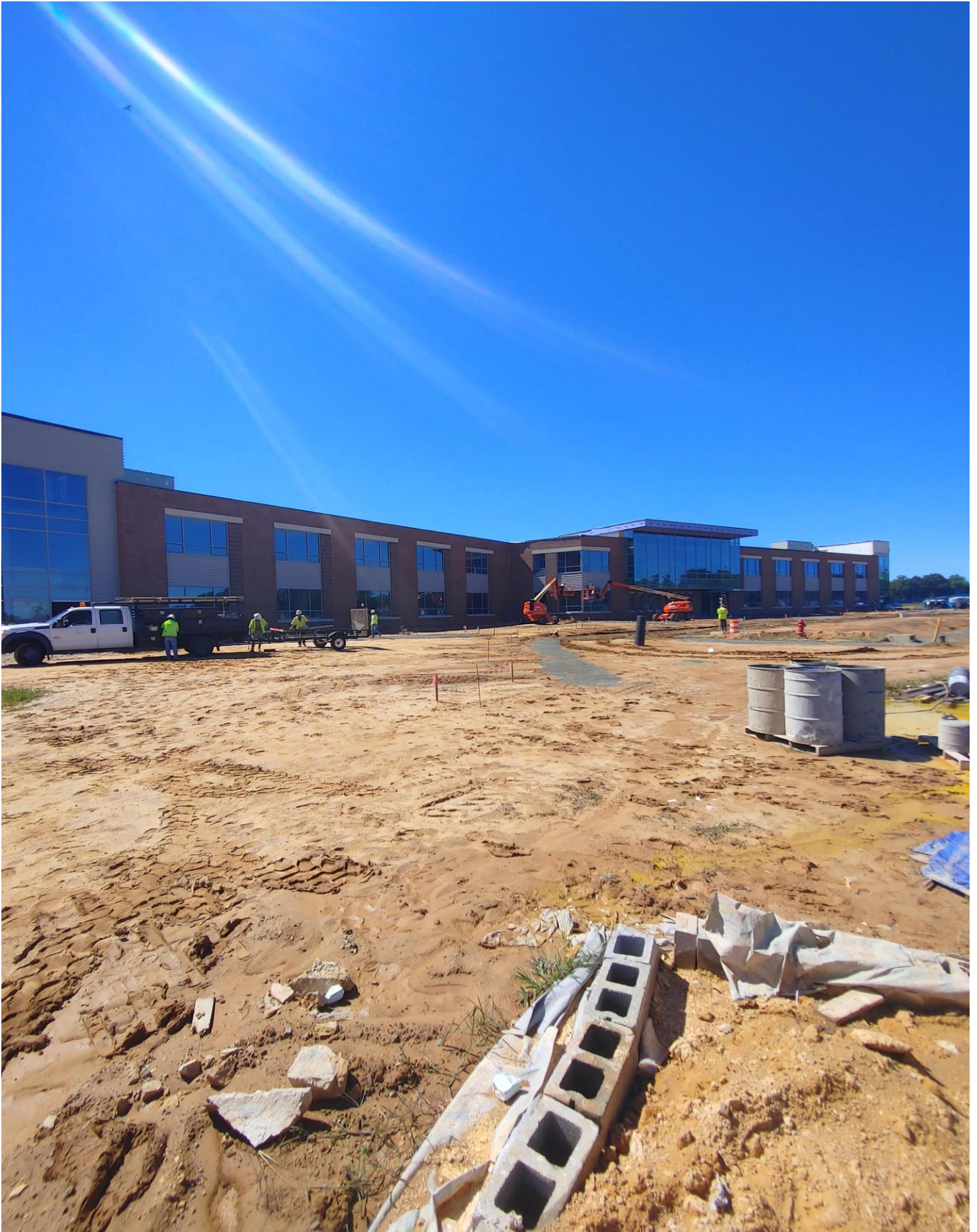
Photo 11 - Front of School.