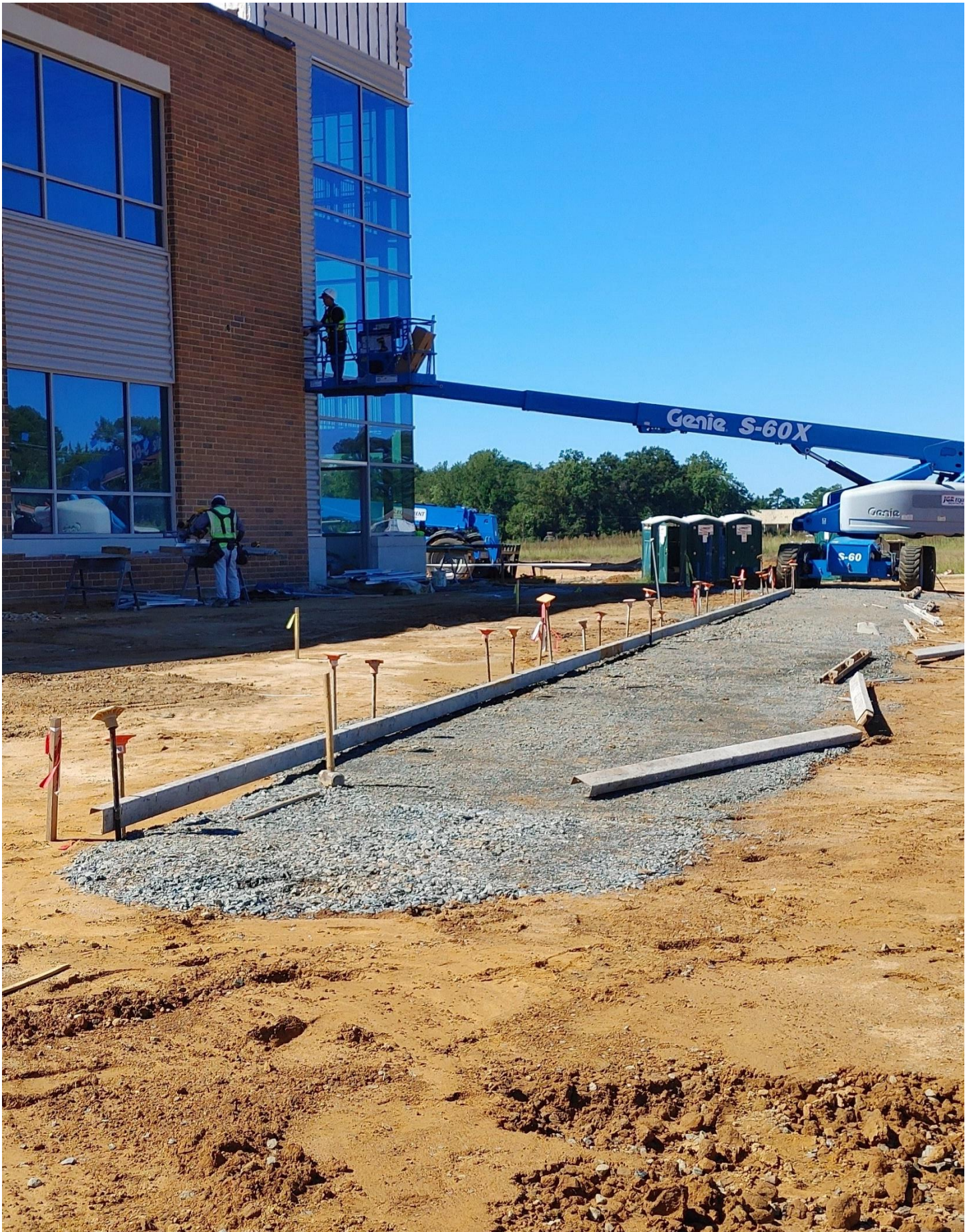
Photo 3 - Sidewalks are being formed in front of Area B.