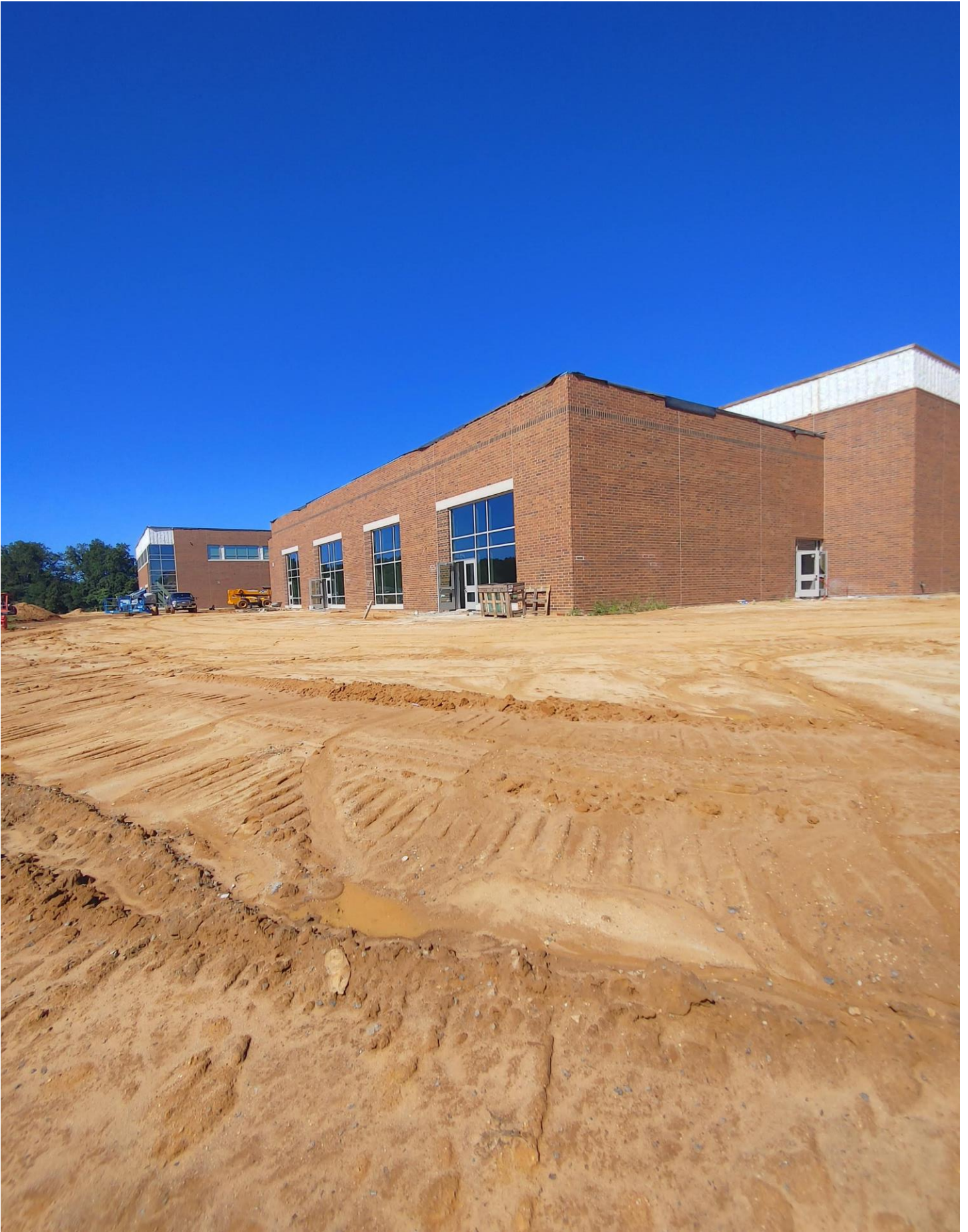
Photo 9 - South side of Area D.