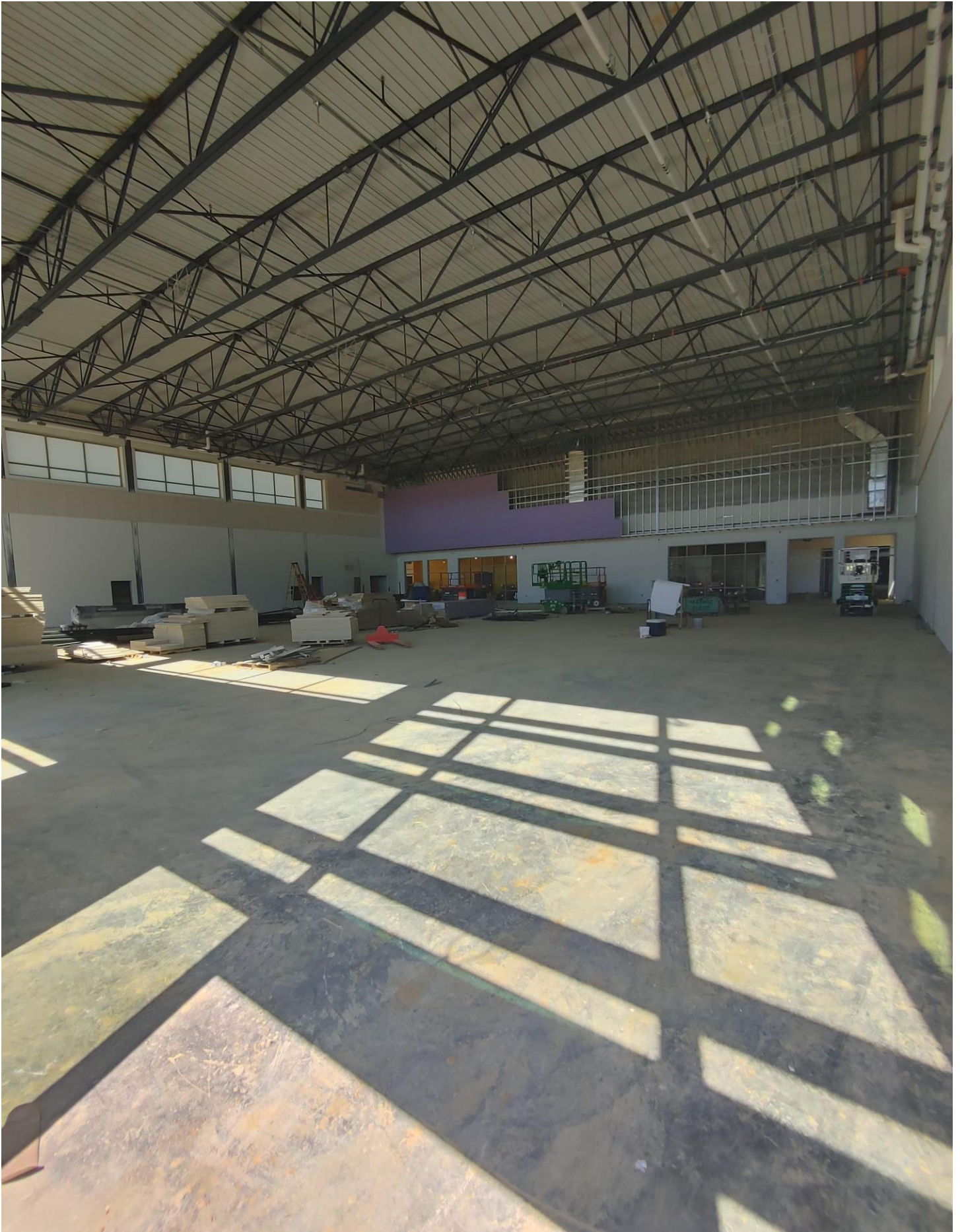
Photo 15 - Gymnasium. Sheetrock is being hung.