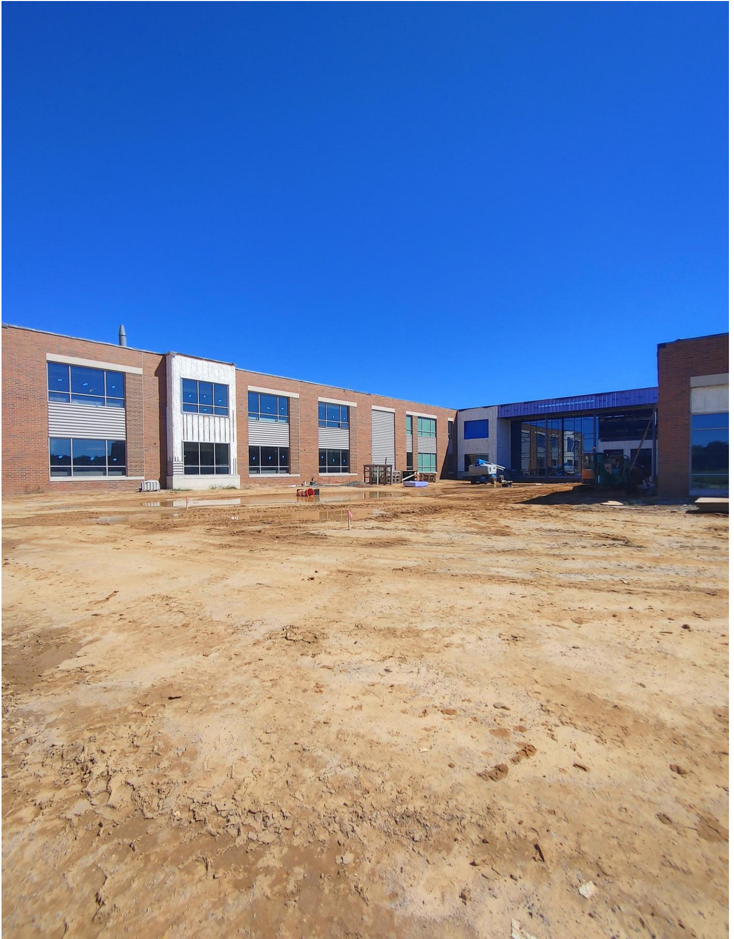
Photo 4 - South side of Area B and Curtain wall of Area C.