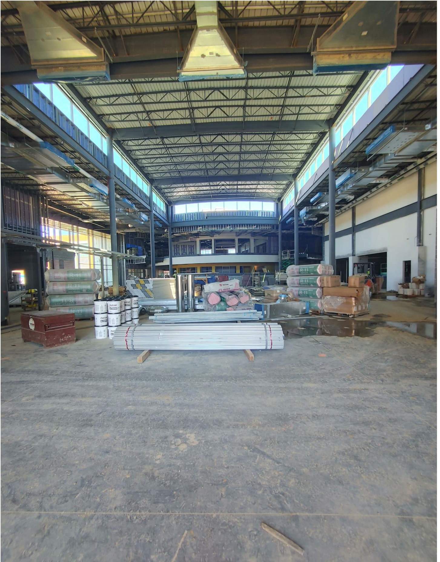
Photo 14 - Area C looking North to Area A.