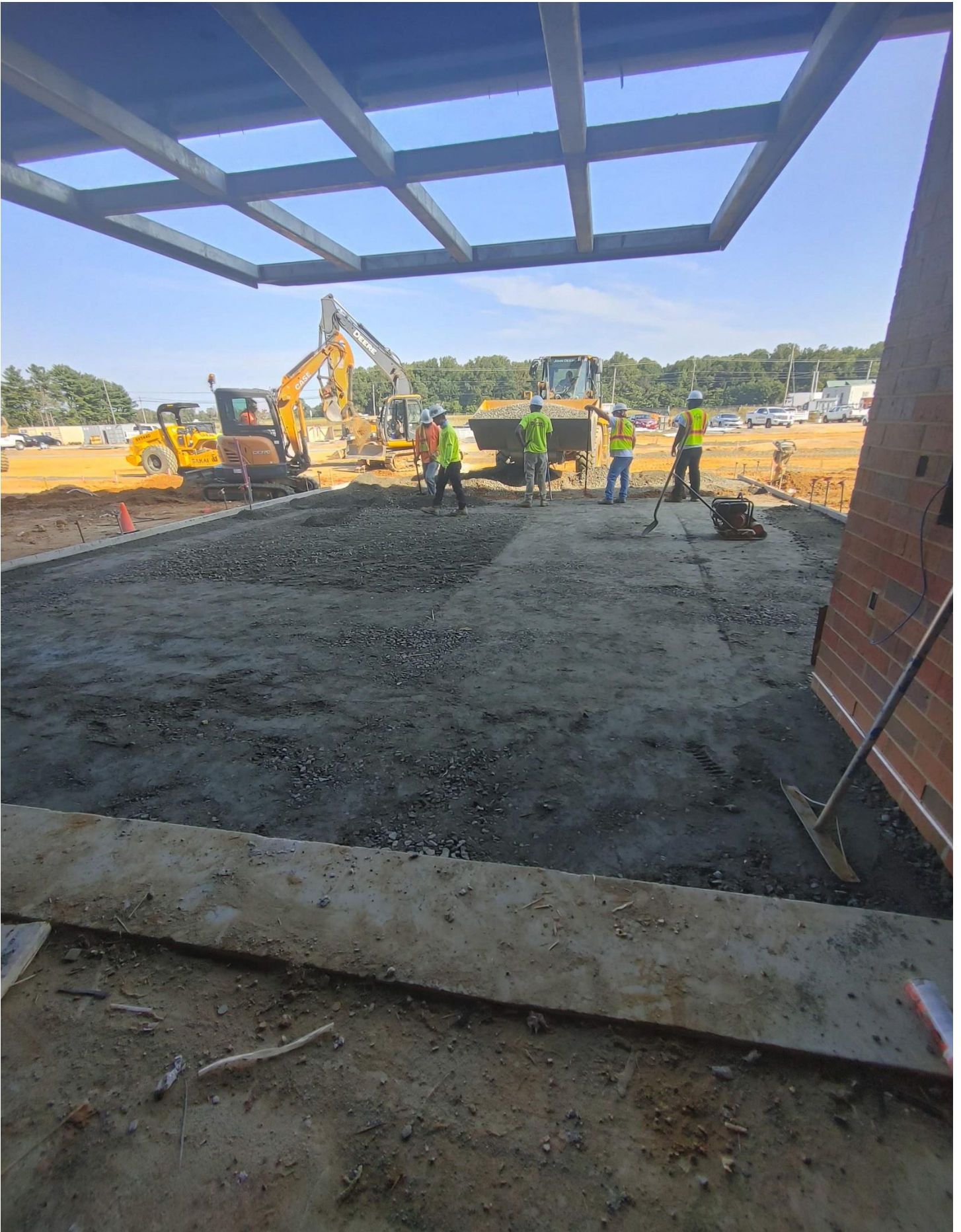
Photo 17 - Trenching for Conduit at the Main Entrance