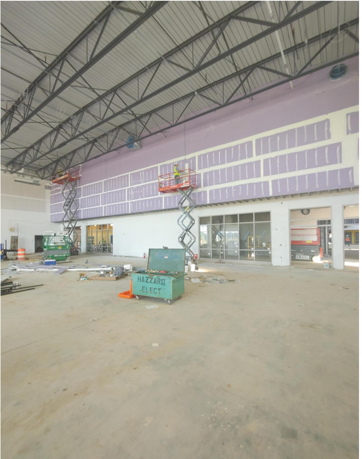
Photo 7 - Sheetrock is being finished in the Gym.