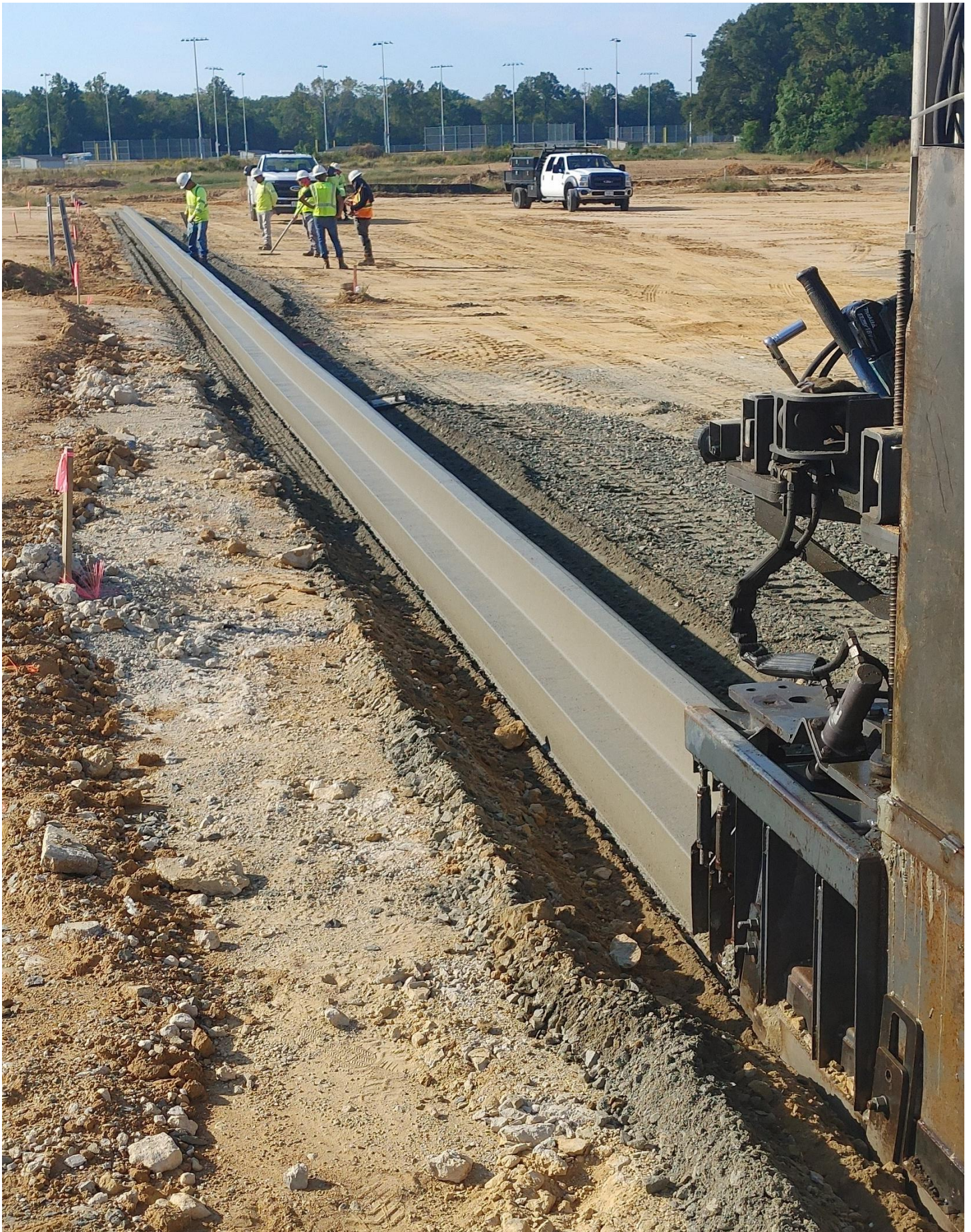
Photo 5 - Curb is being poured in the Bus Loop Area.