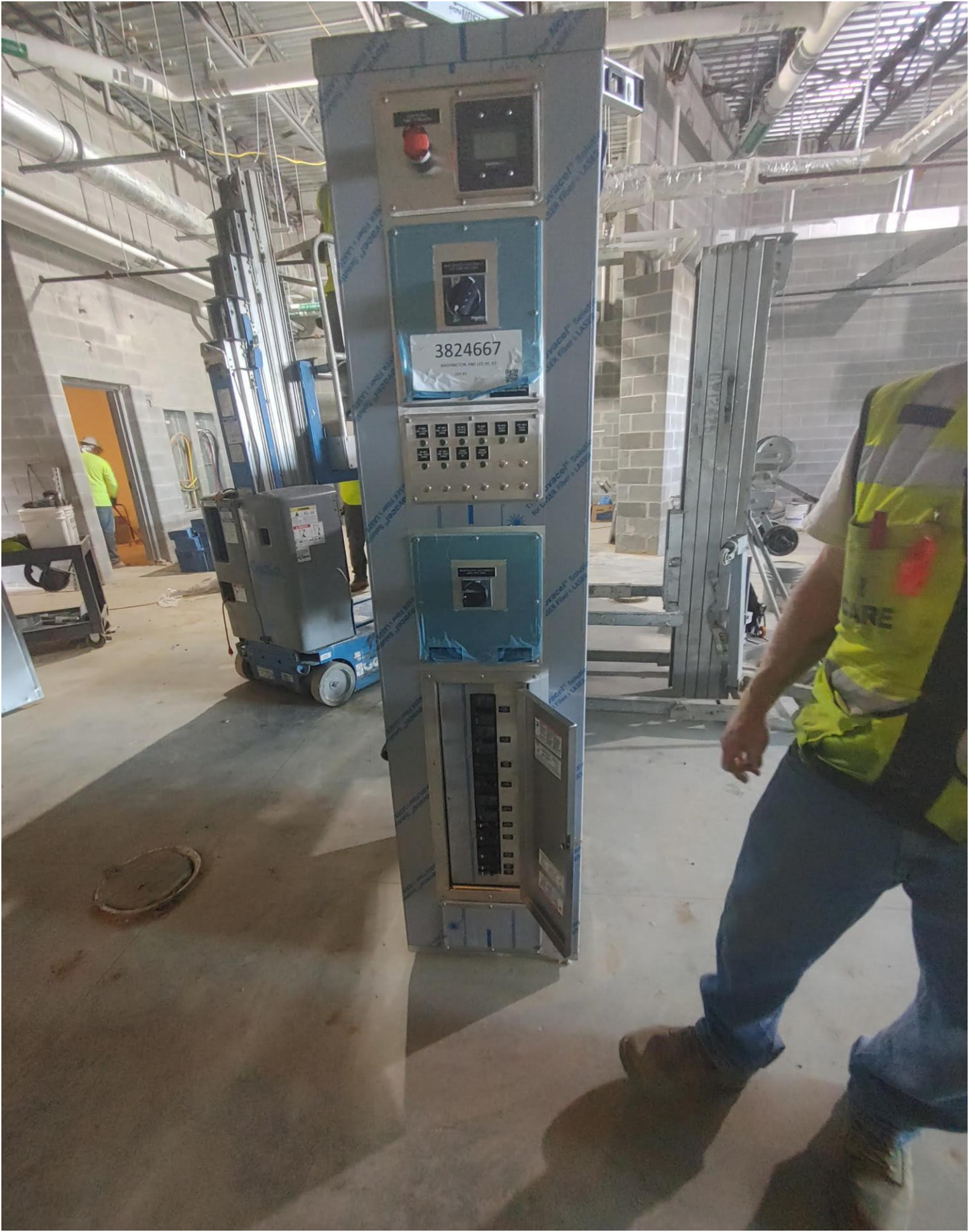
Photo 16 - Utility Distribution System