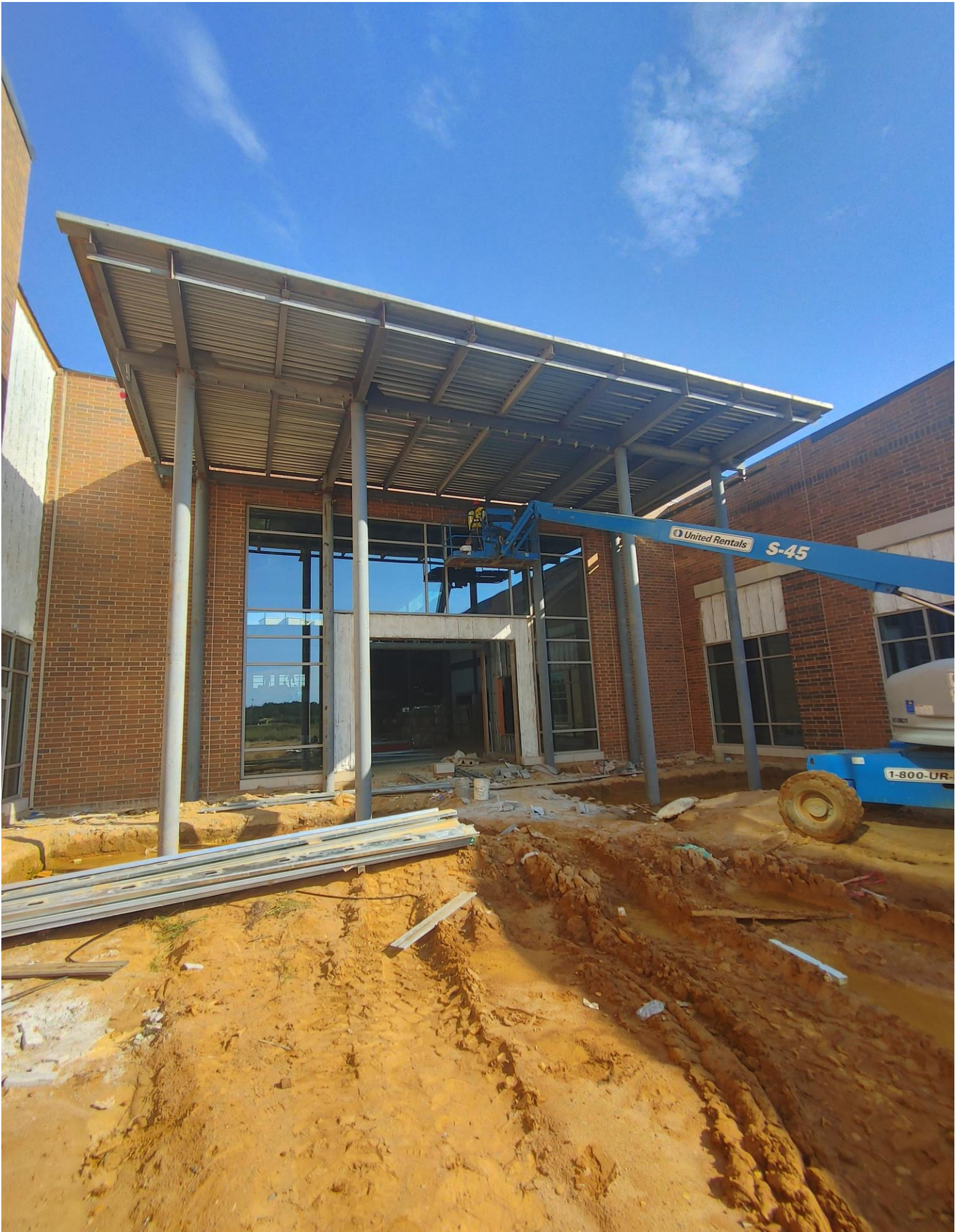
Photo 8 - Metal Stud Framing of the Canopy on the South side of Area C.