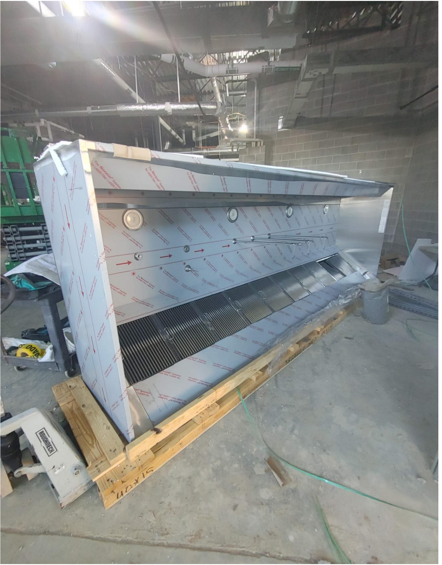
Photo 11 - One of two Range hoods has been delivered.