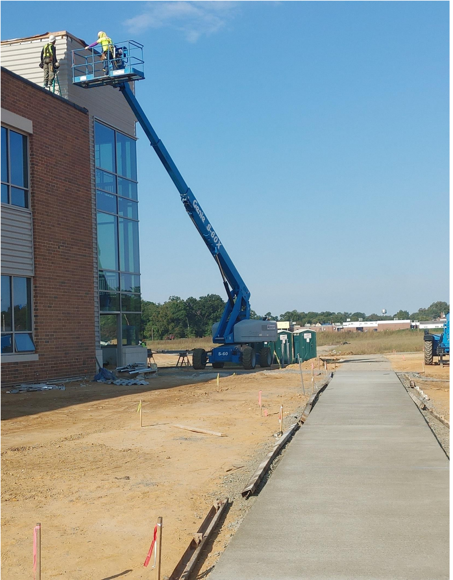
Photo 3 - Sidewalk poured in front of Area B and Metal Panels are being installed.