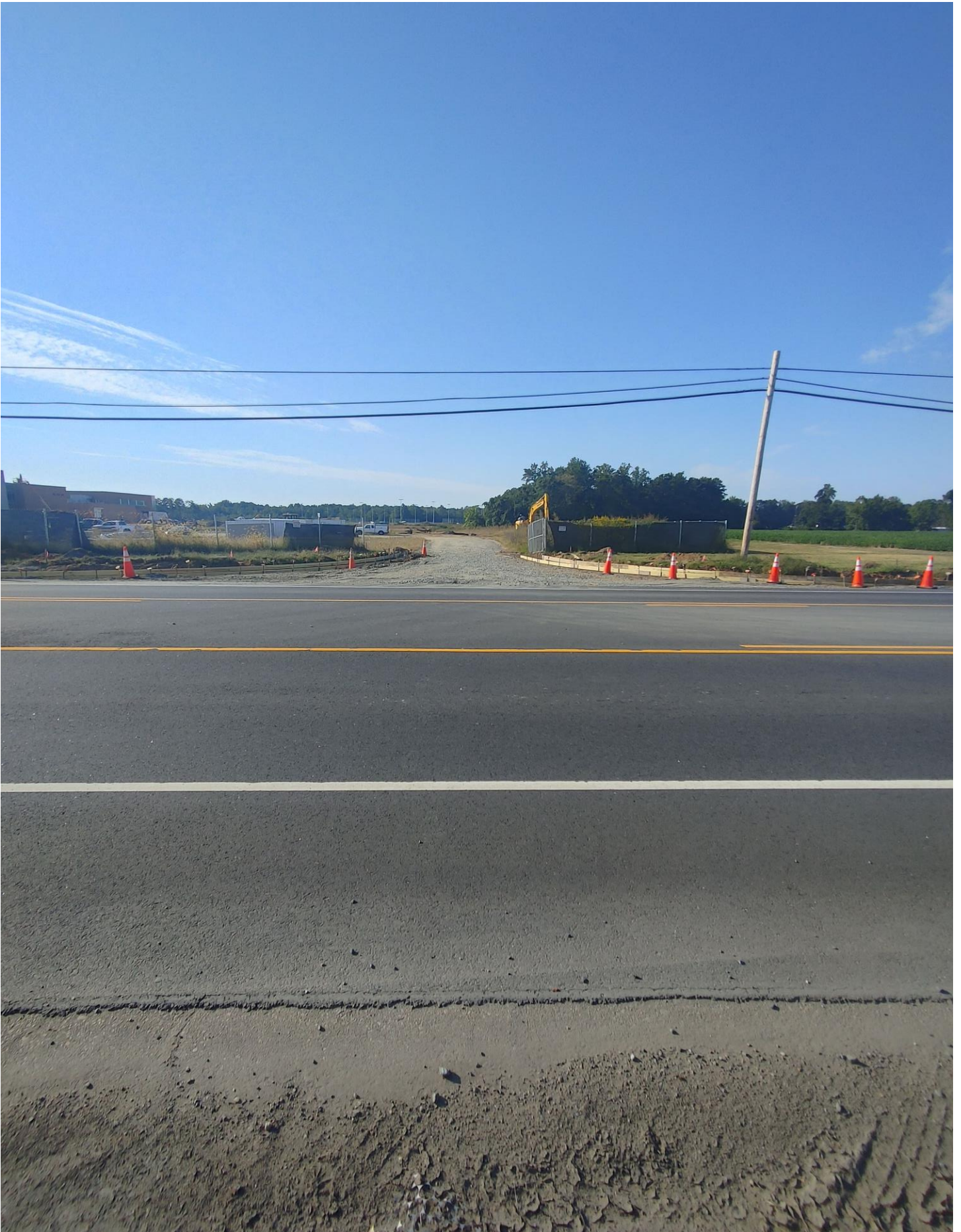
Photo 1 - Bus Loop Entrance Curb & Gutter is being formed