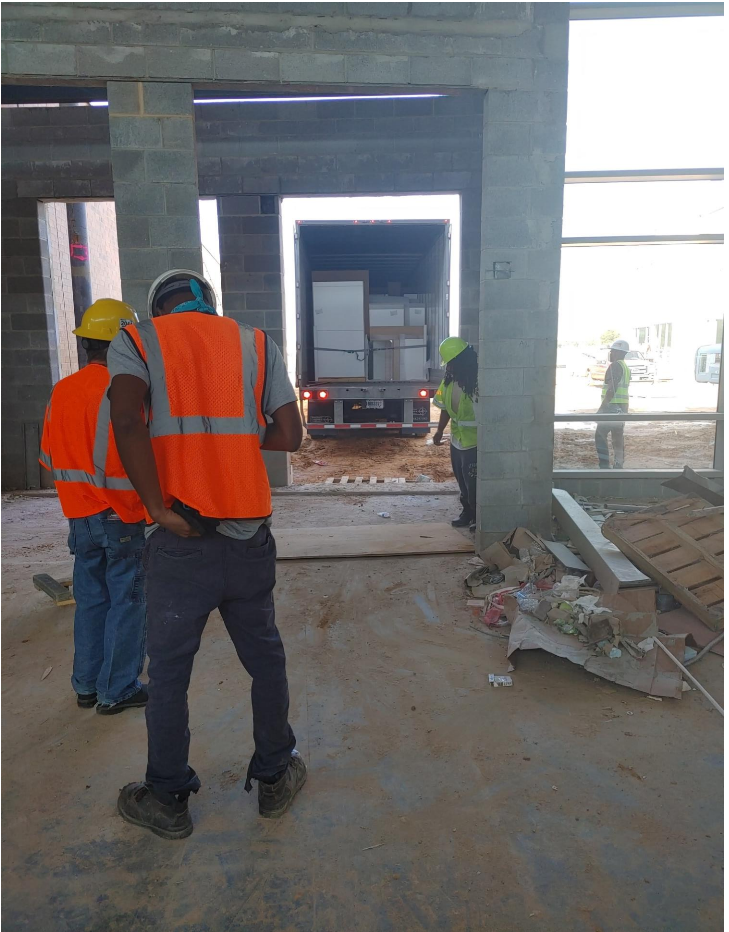
Photo 6 - Millwork delivery is being unloaded.