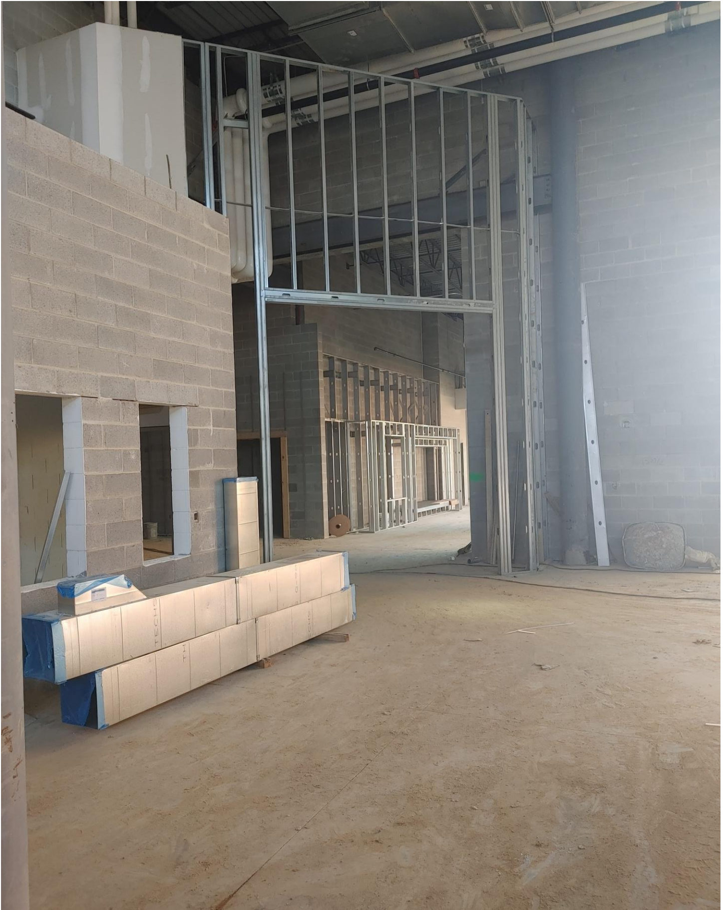
Photo 10 - Metal Studs have been erected between Areas C & D.