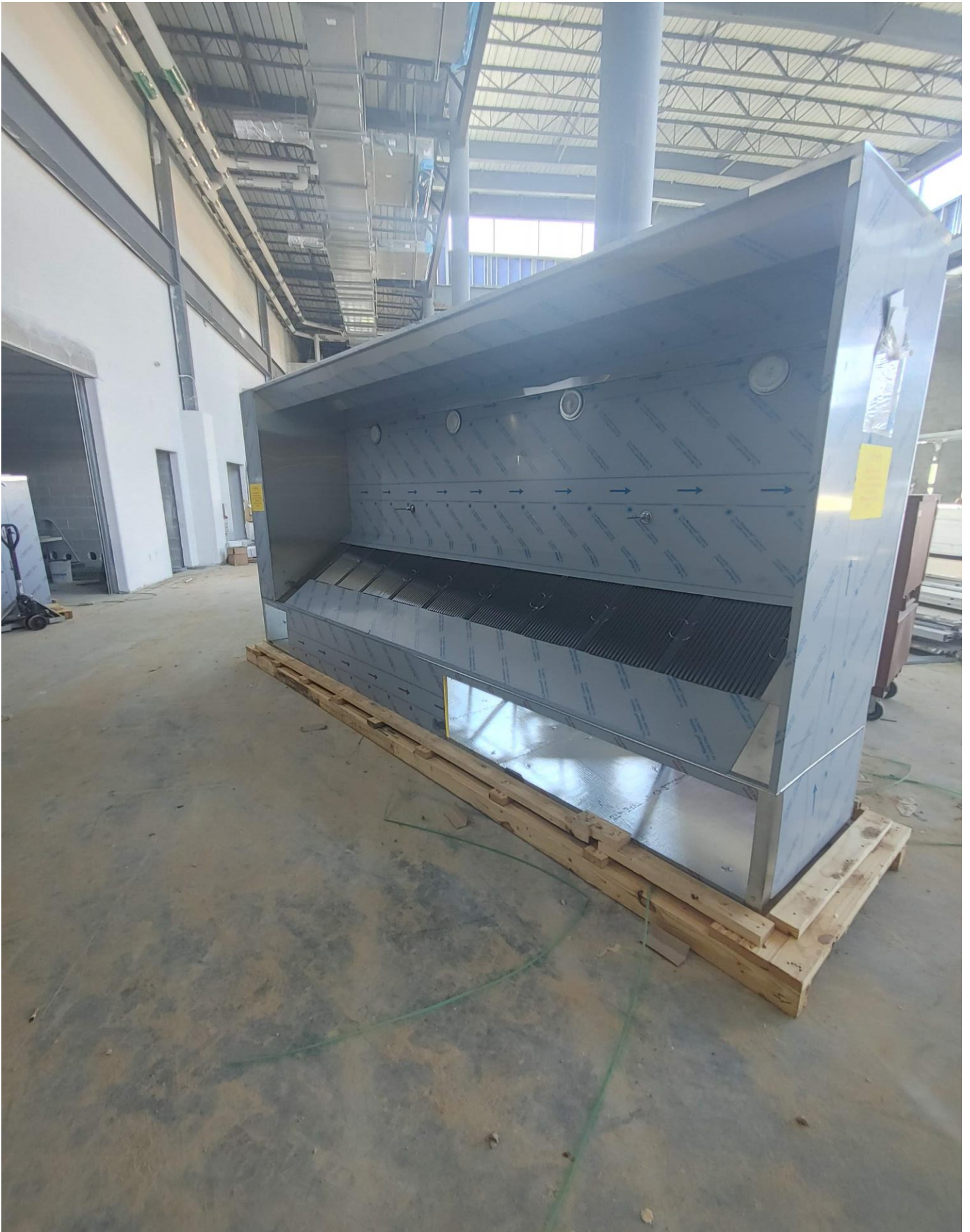
Photo 12 - 2nd Range Hood.