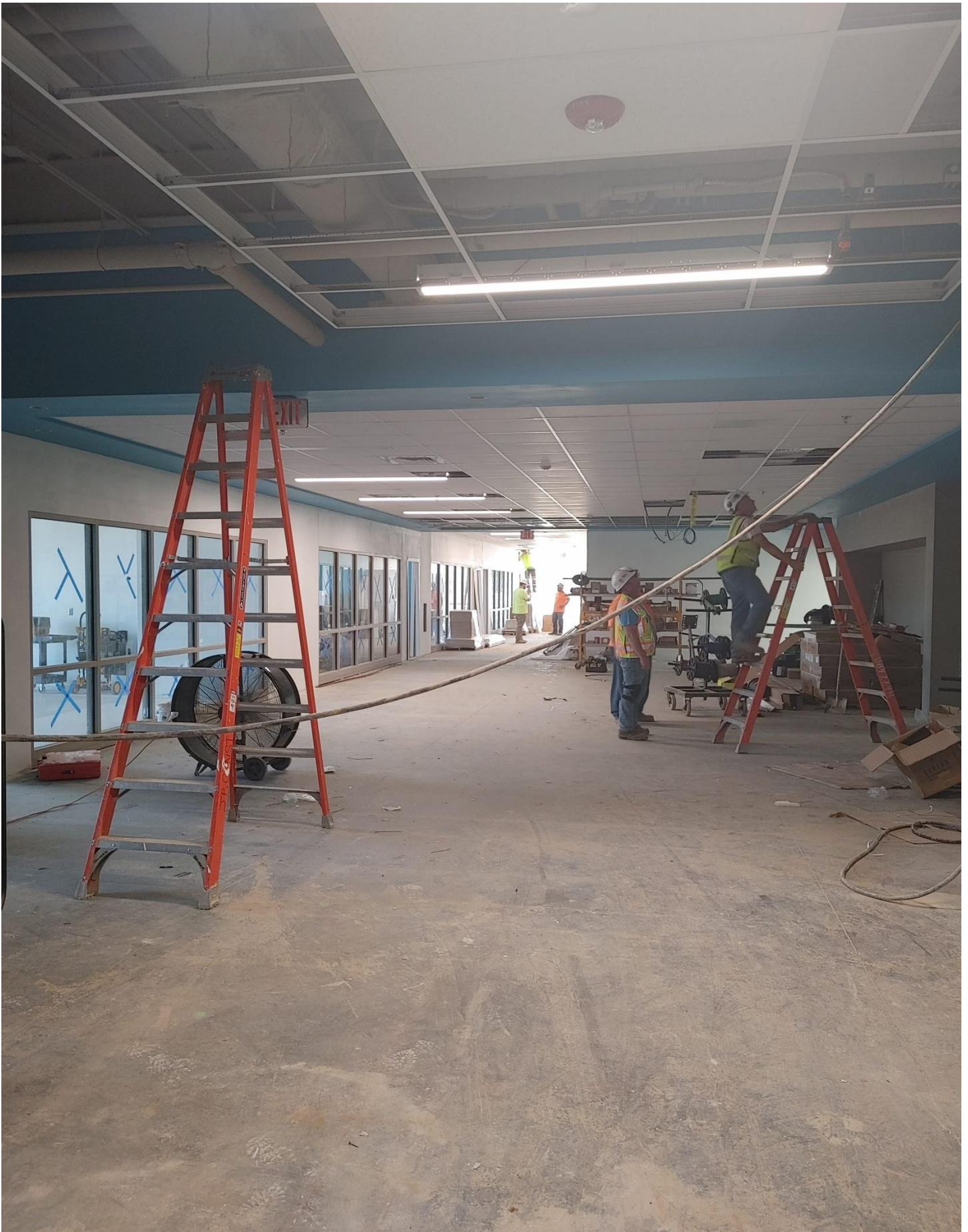
Photo 14 - Lighting installed and energized in Area A, 1st floor.