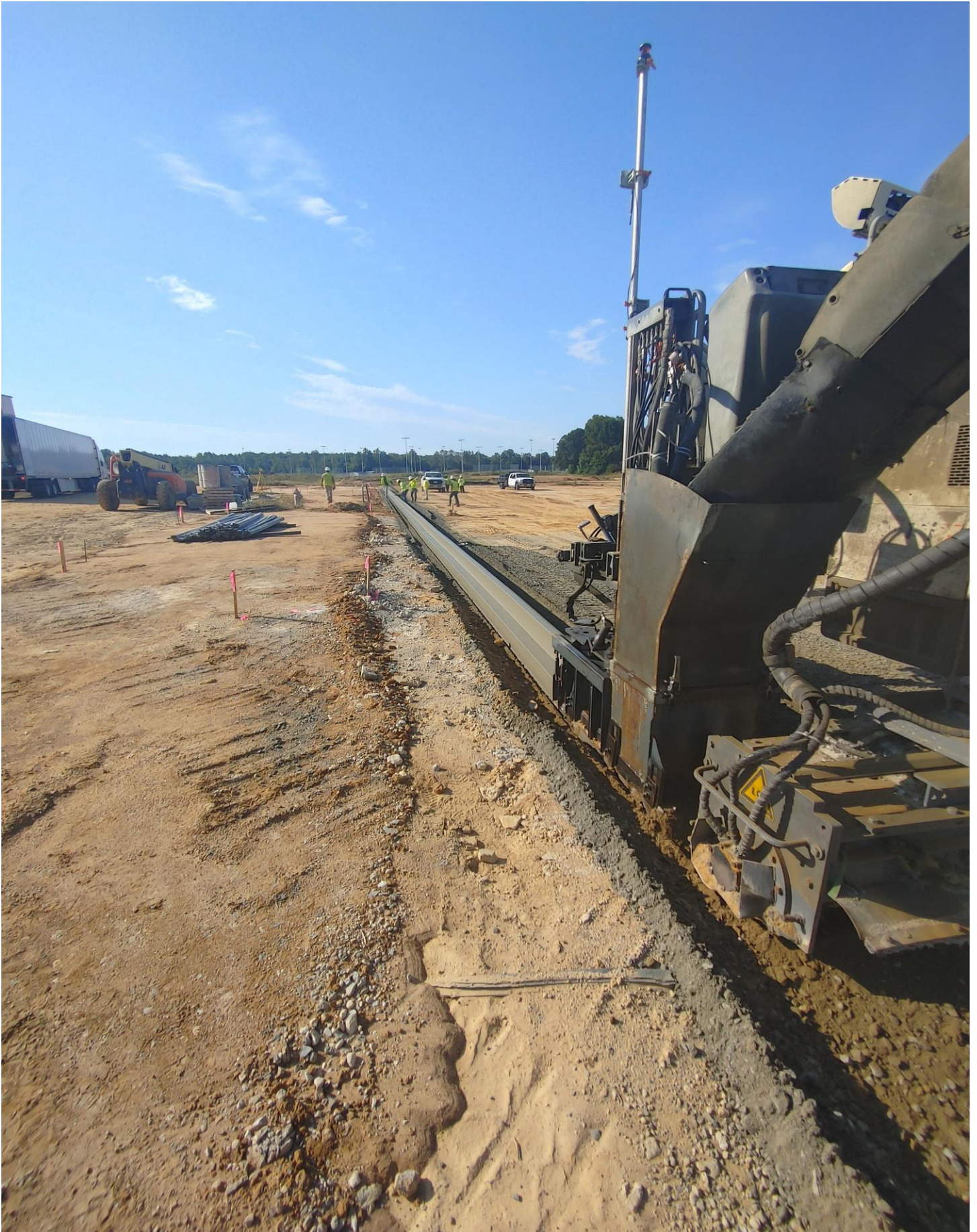
Photo 4 - Curb is being poured in the Bus Loop area.