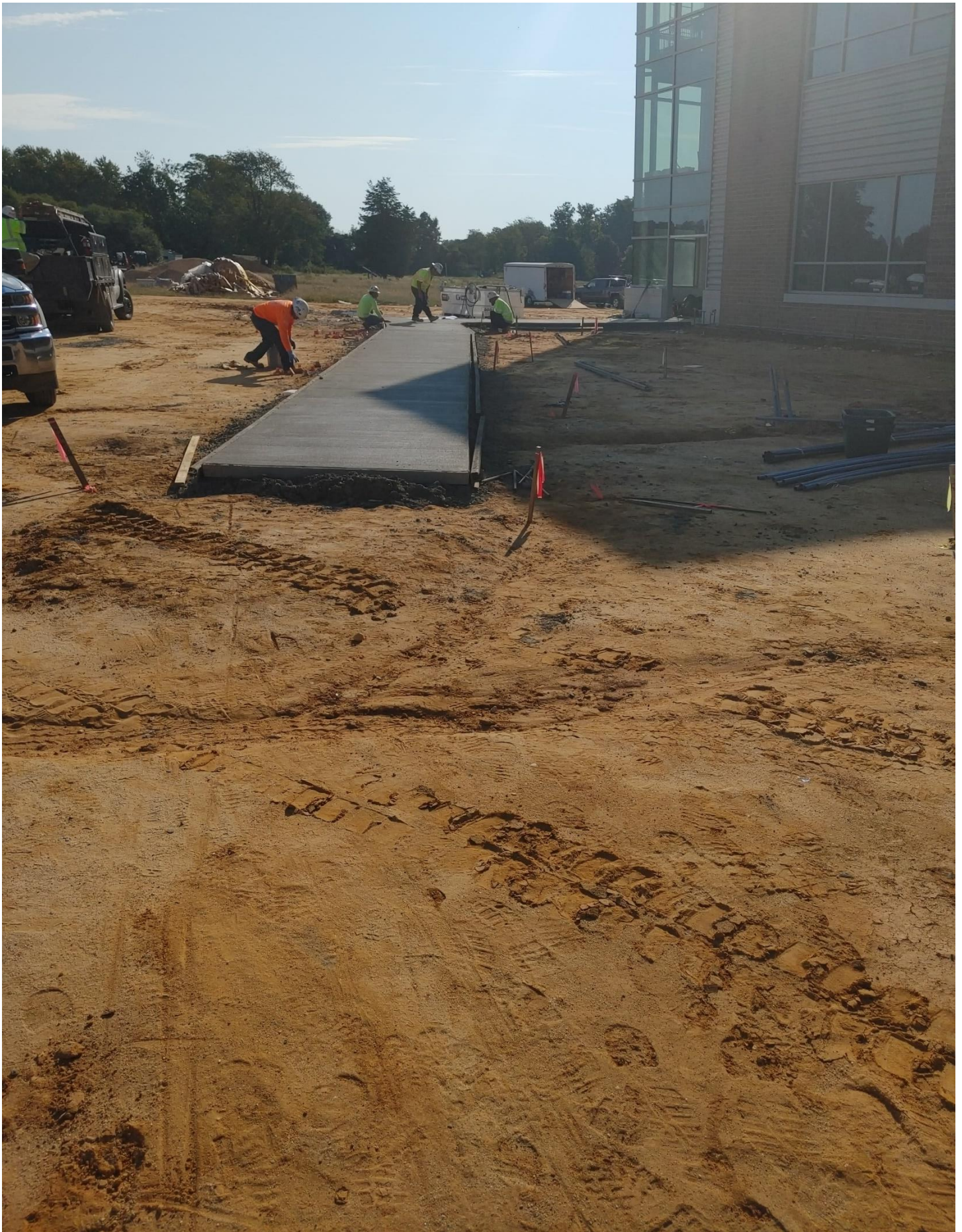
Photo 2 - Sidewalk is being poured in front of Area A.