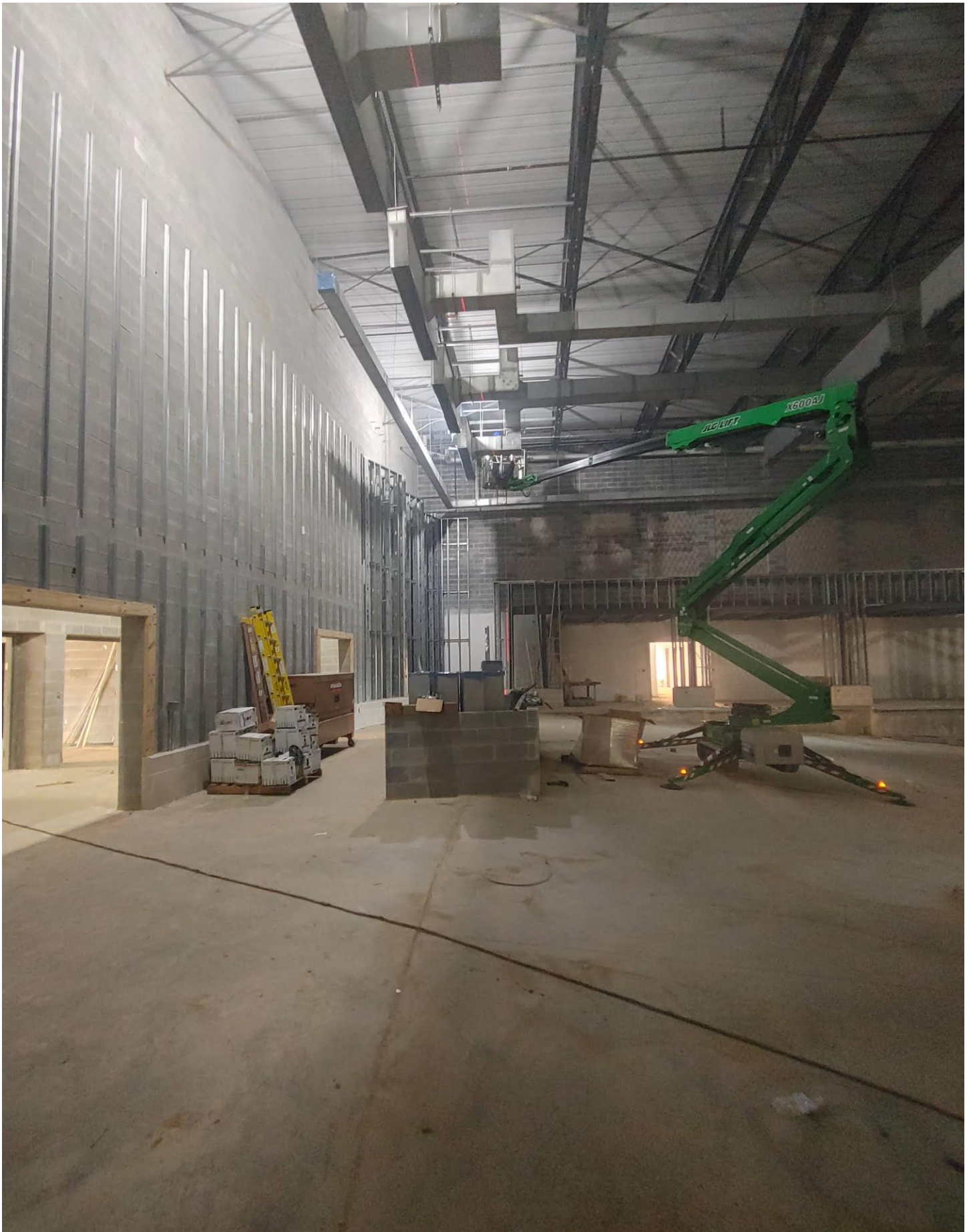
Photo 9 - HVAC Duct is being installed in the Auditorium.