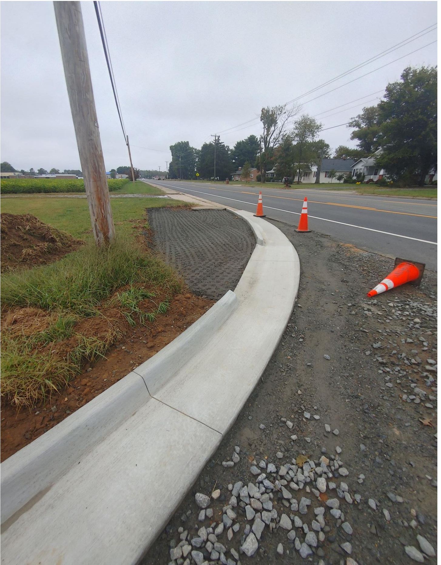
Photo 2 - Handicap Sidewalk transition has been prepped and formed for concrete on both sides of the Bus Loop Entrance