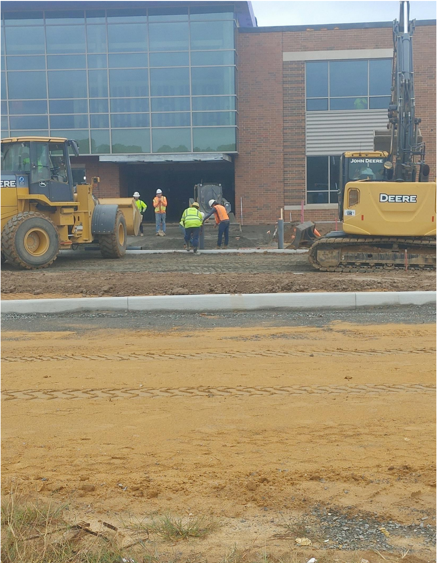
Photo 18 - Bollards are being set at the front entrance to the building.