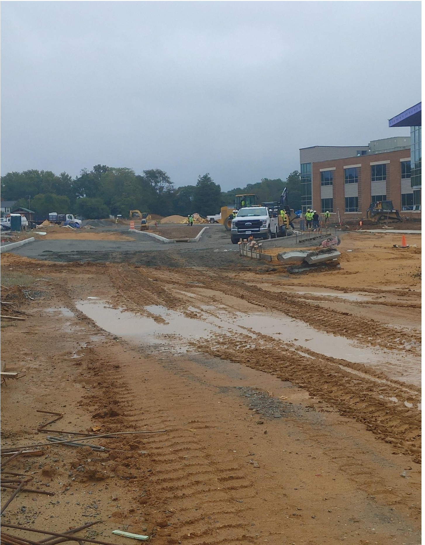
Photo 3 - Curb work continues in front of the School.