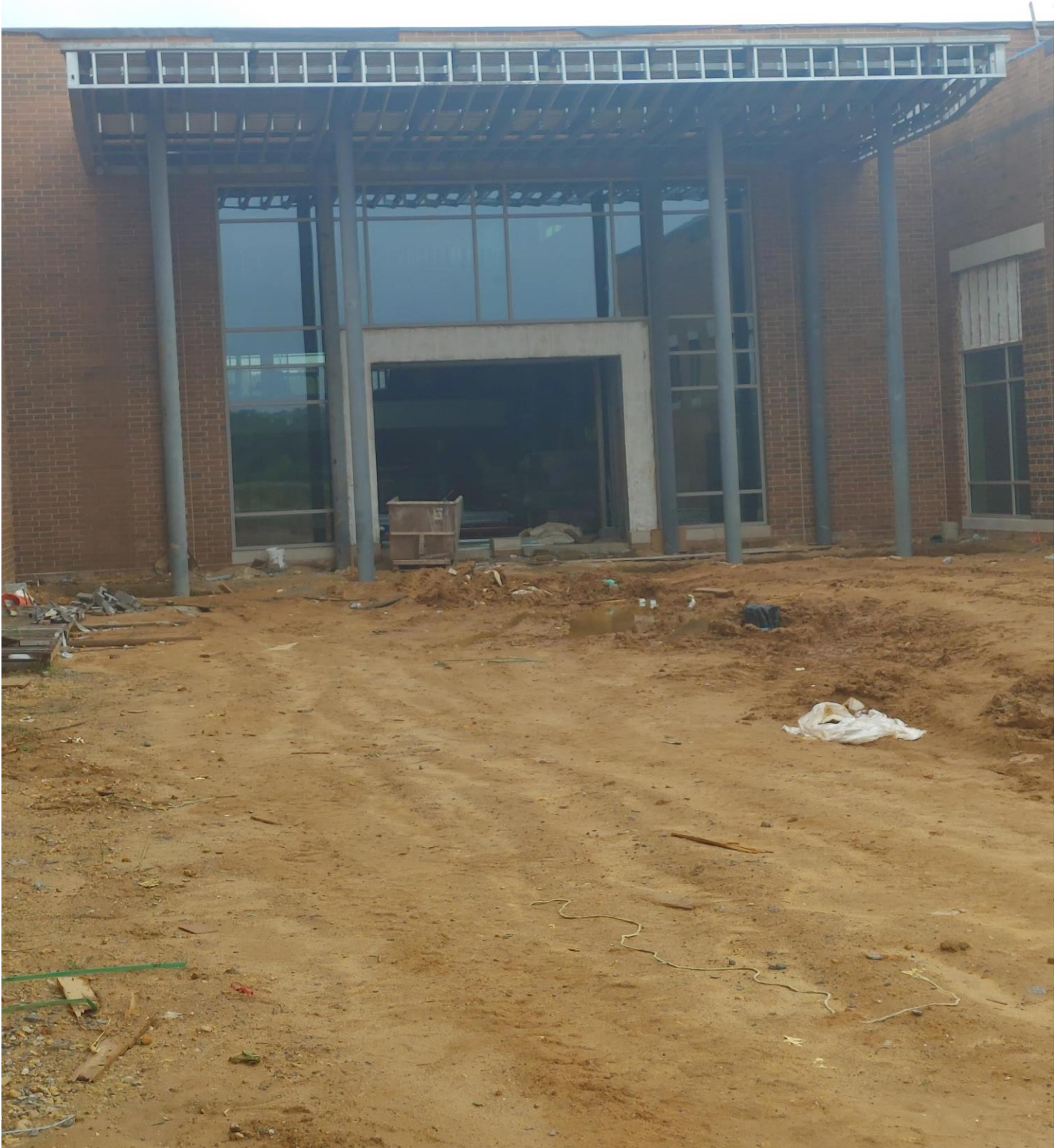
Photo 8 - Framing of the Canopy has been completed on the South side of Area C.