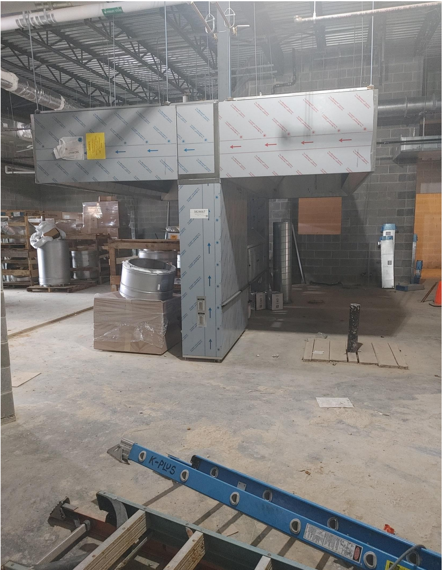
Photo 11 - The Kitchen Hood System has been installed