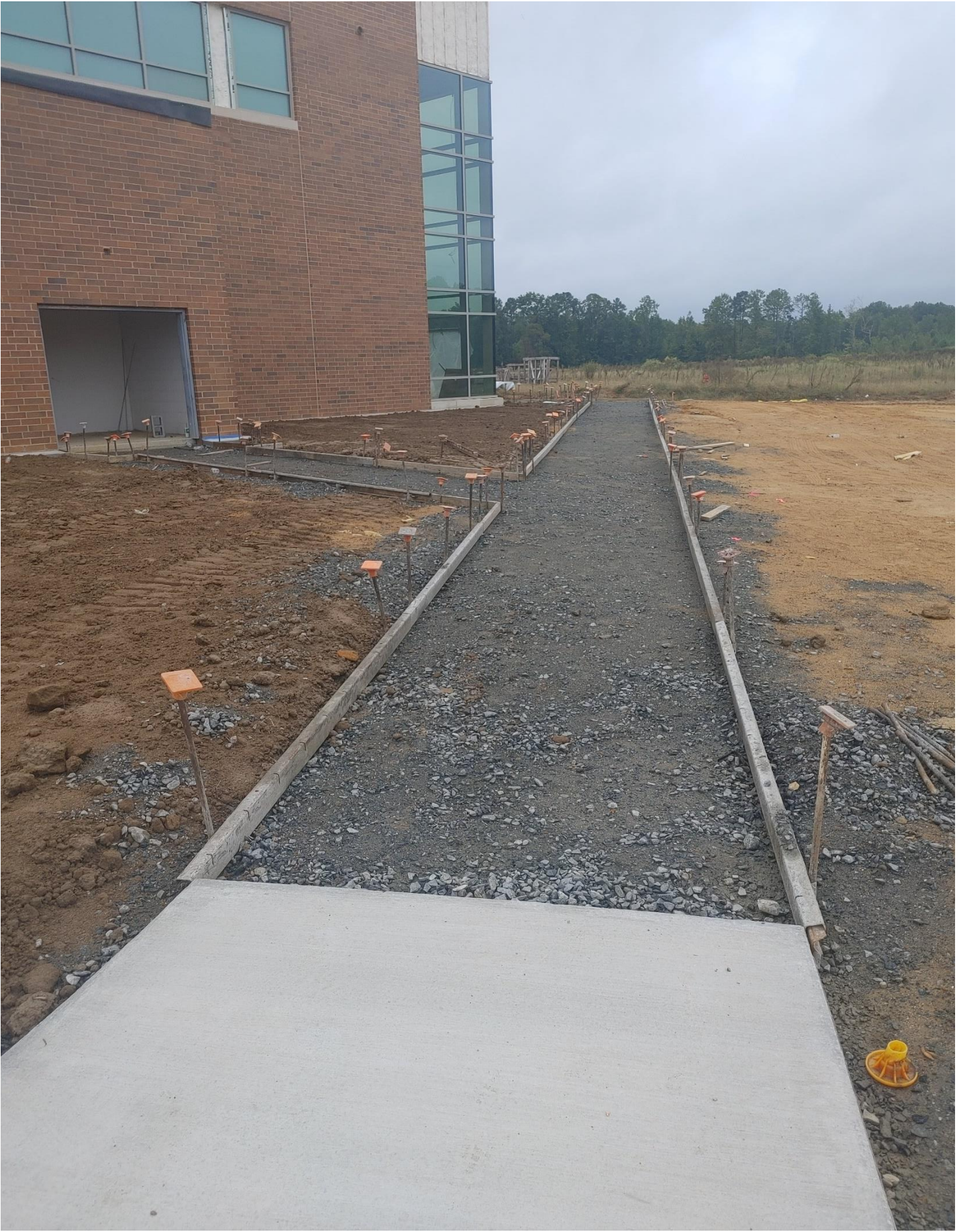
Photo 7 - Sidewalk prepped to be poured on the West side of Area E