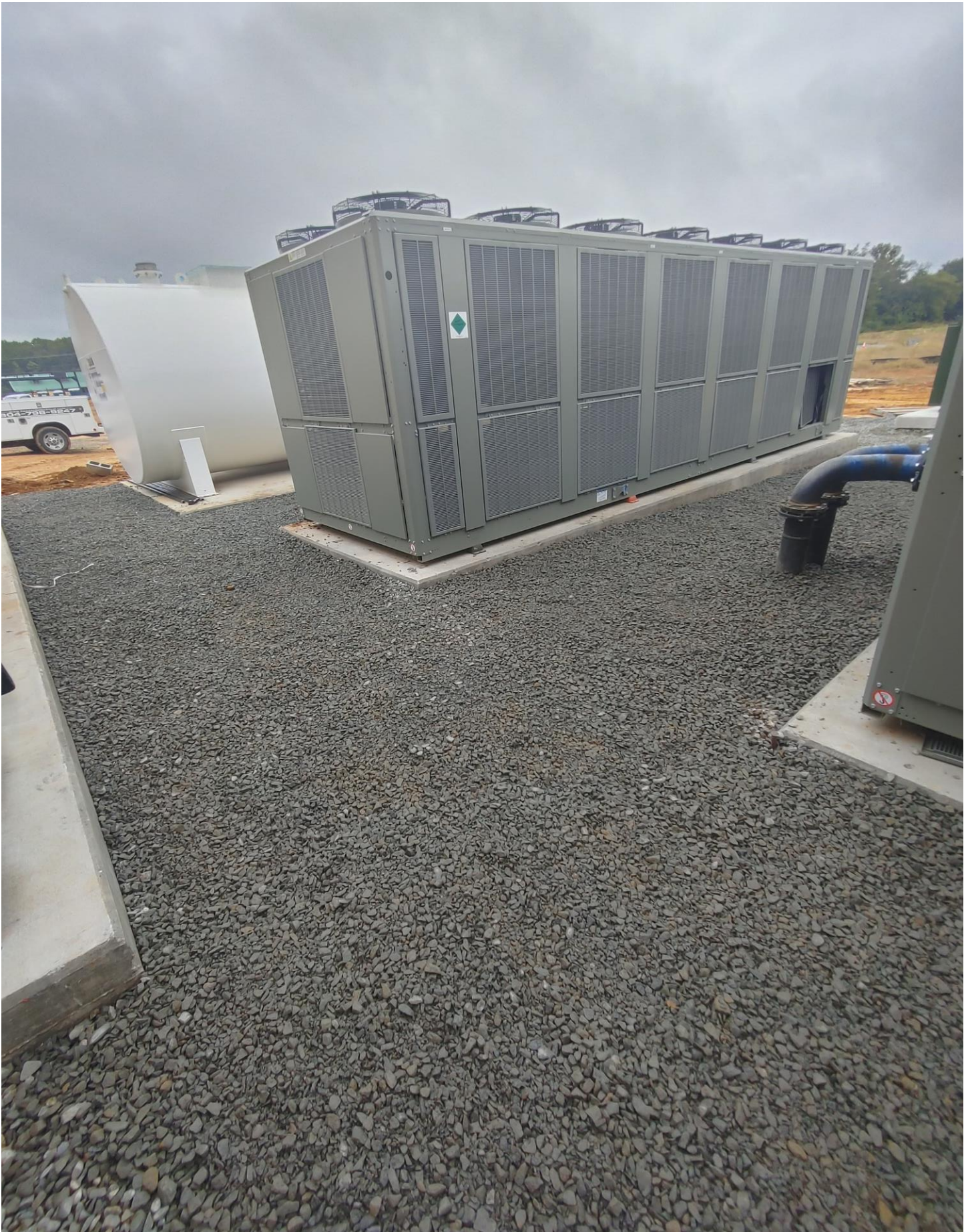
Photo 9 - Stone has been places around the Chiller, Generator and Fuel Storage Tank