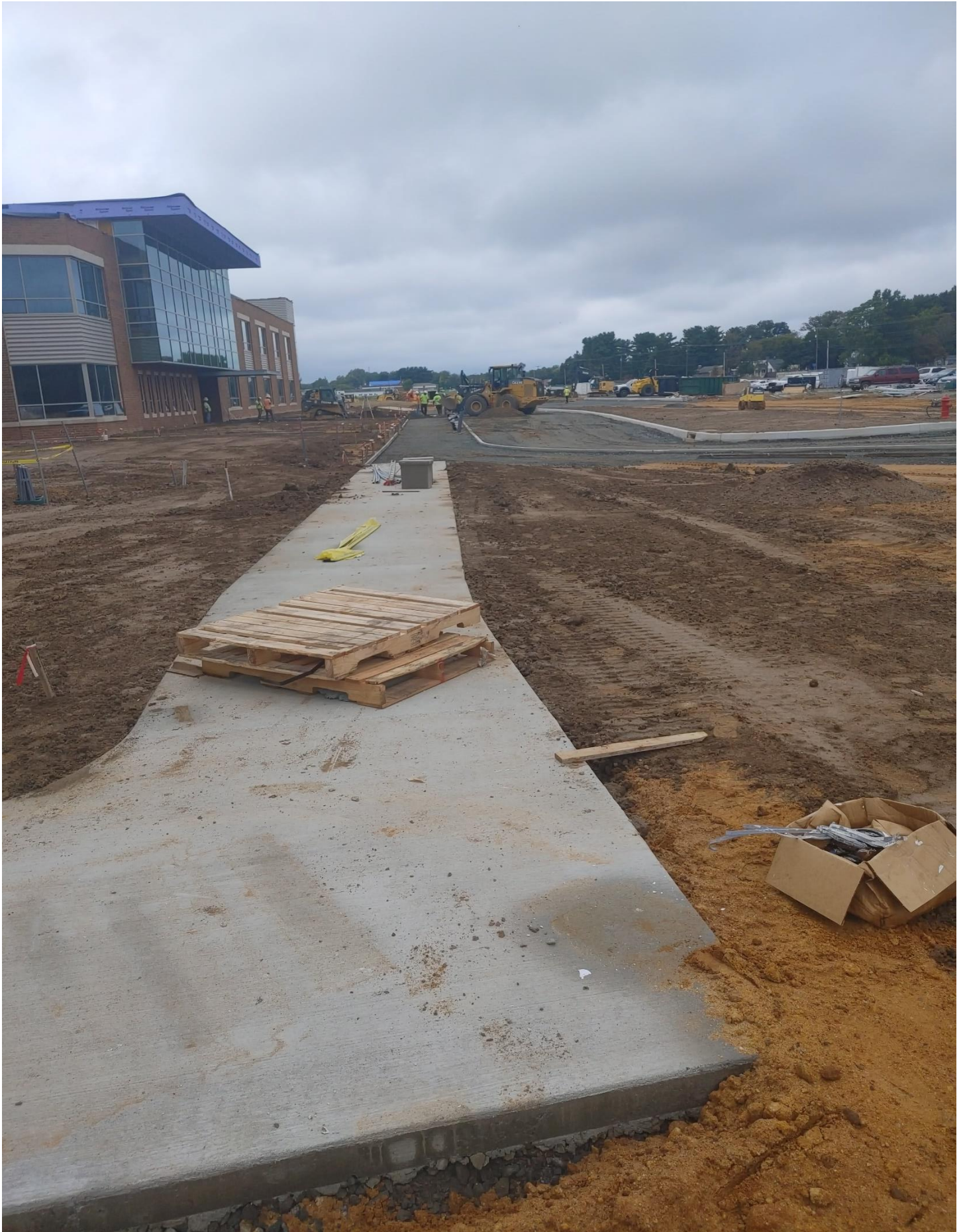
Photo 17 - Concrete Sidewalks are being prepped, formed and poured on the North side of Area A