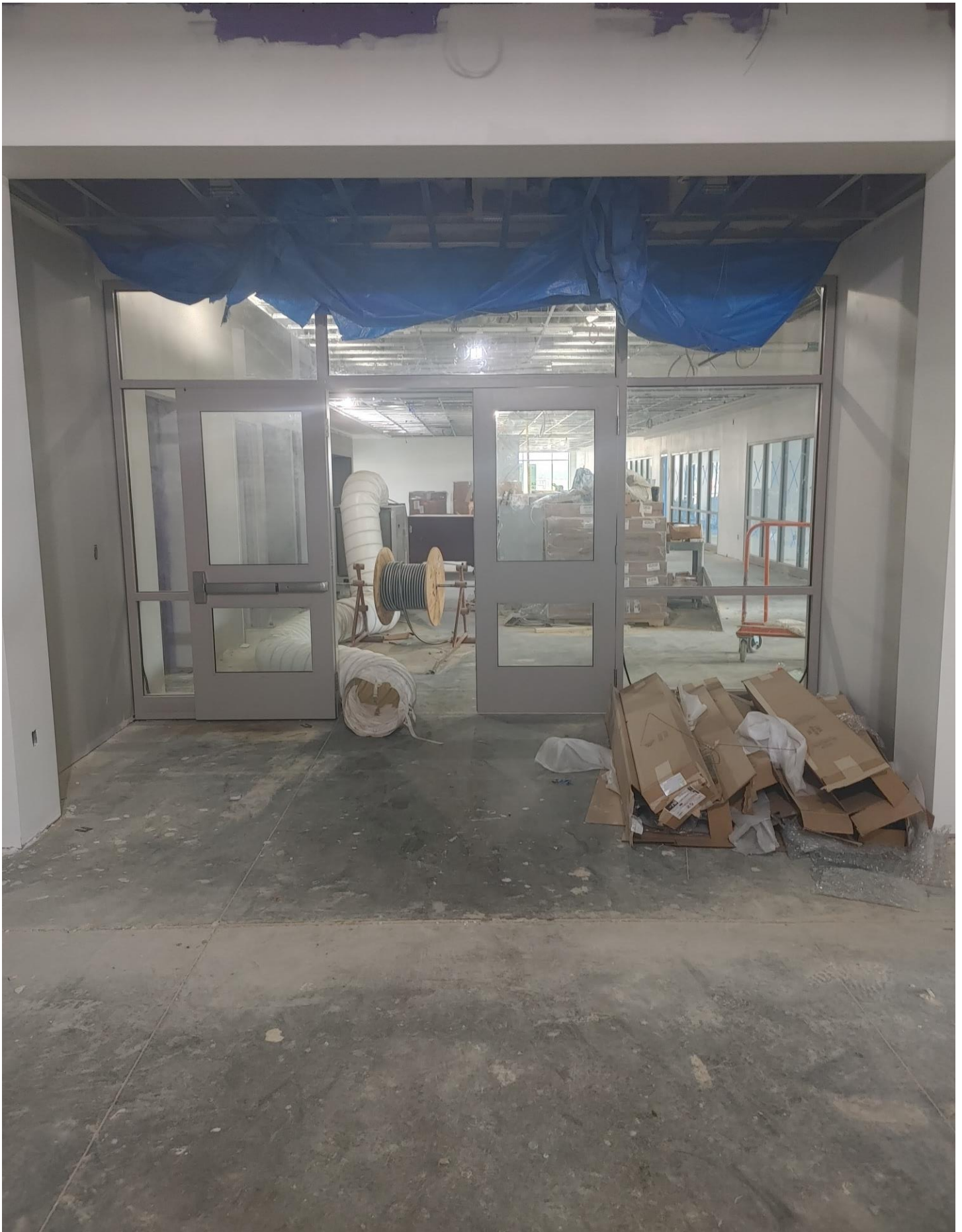
Photo 14 - SF53B has been completely installed