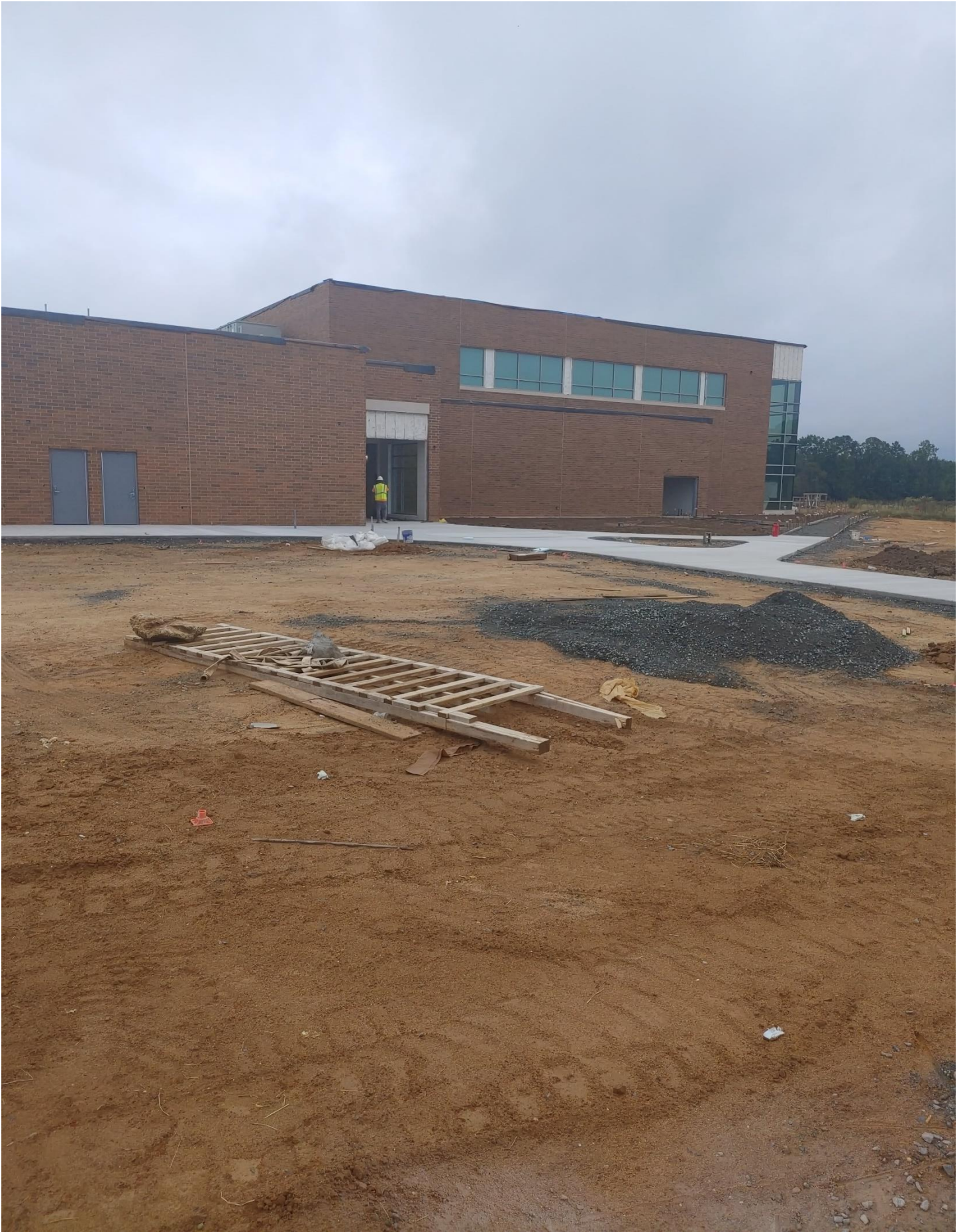
Photo 6 - Sidewalks from the Bus Loop to the Gym continue to be prepped and poured