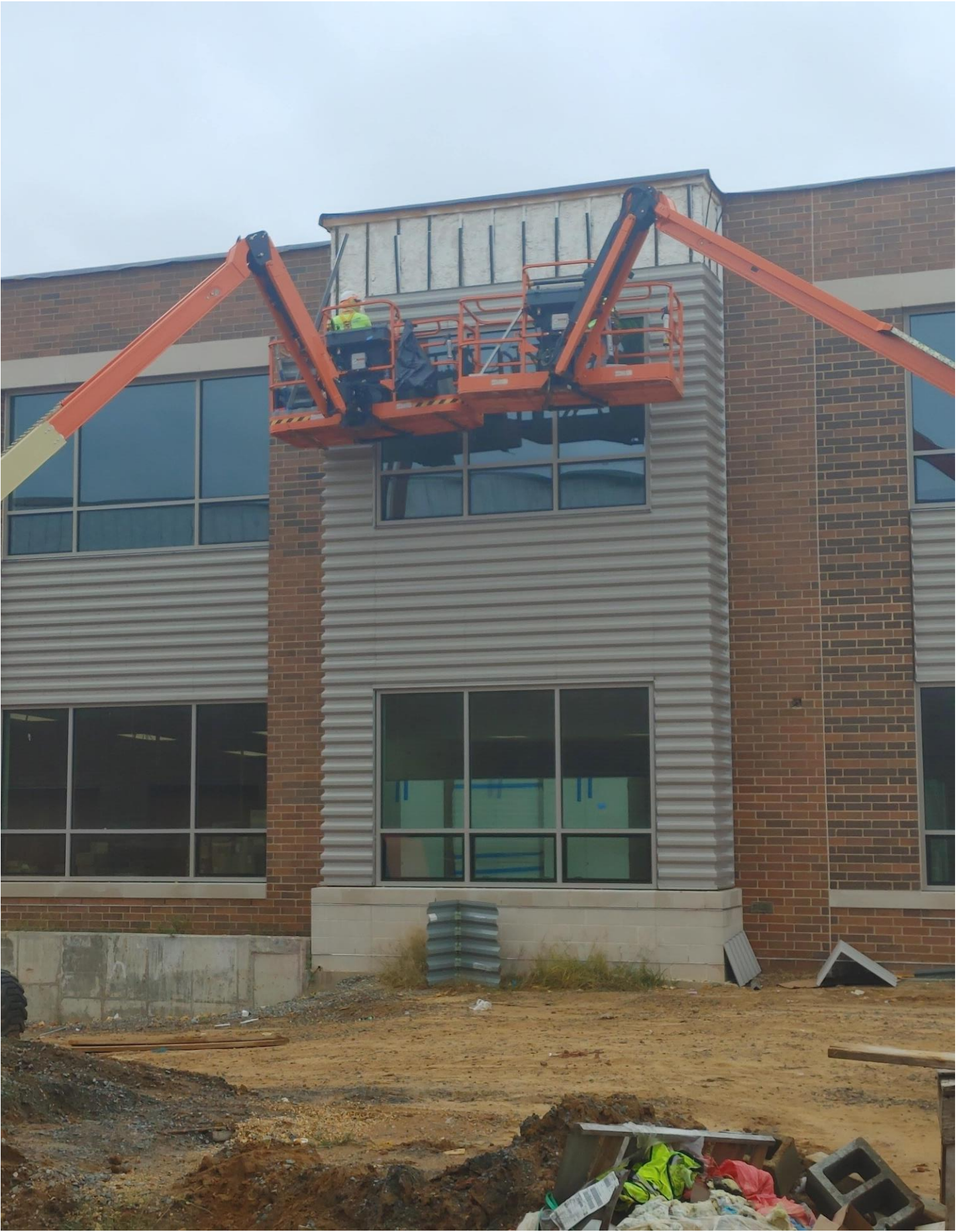
Photo 10 - Metal Panels are being installed on the South side of Area A