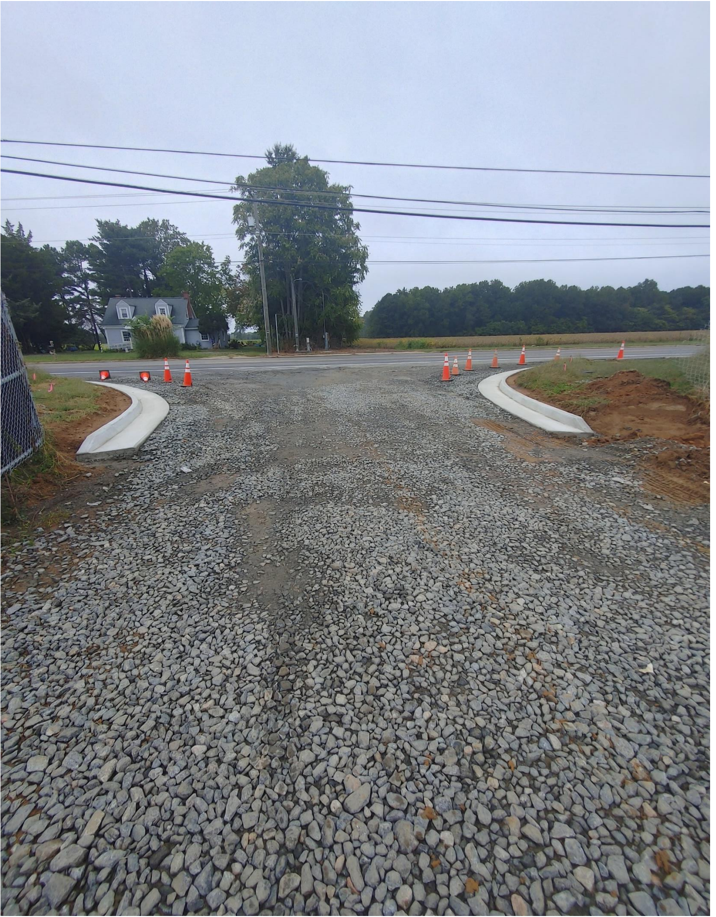
Photo 1 - Bus Loop Entrance Curb and Gutter has been installed