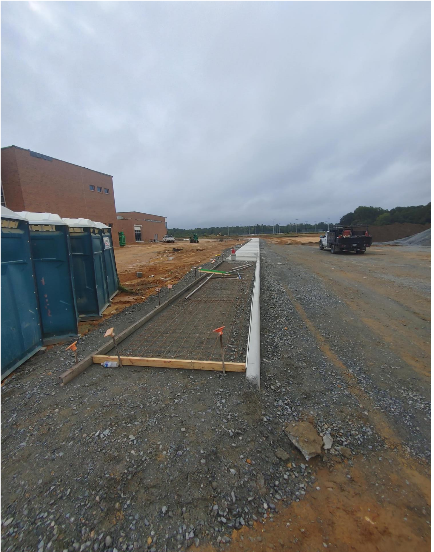
Photo 5 - Bus Loop Sidewalk prep and forms continues