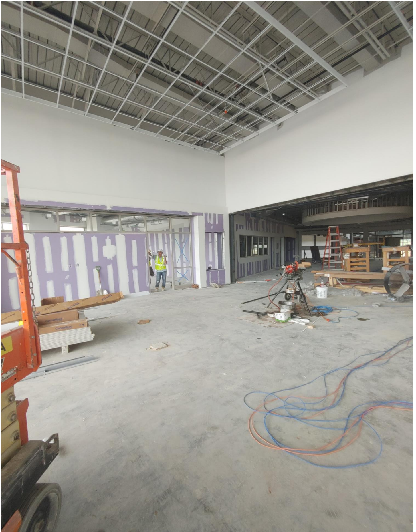
Photo 16 - Sheetrock is being finished on the 2nd floor of Area A