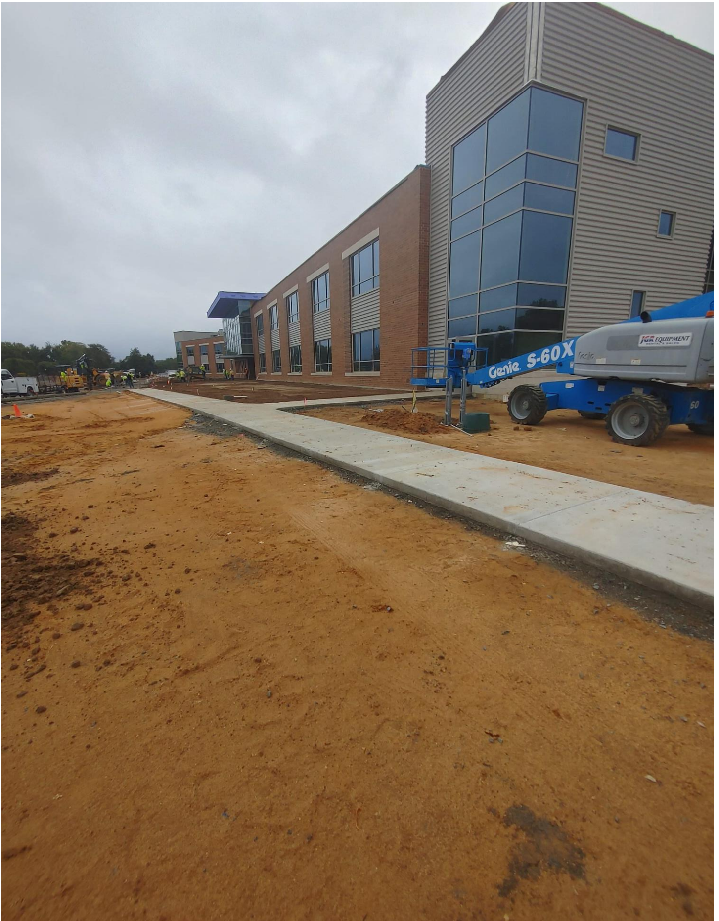
Photo 4 - Sidewalks have been poured in front of Area B