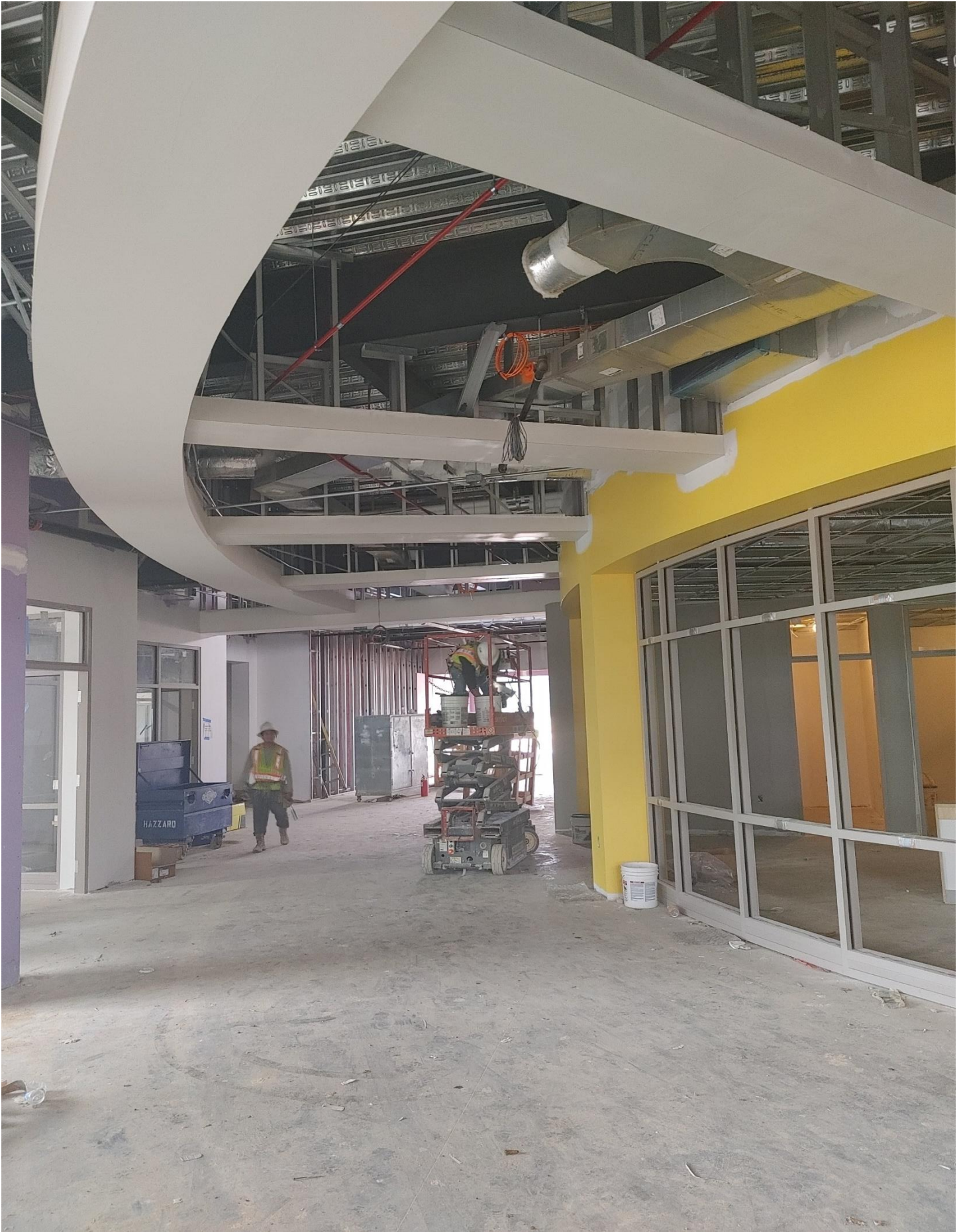
Photo 13 - Sheetrock is being finished on the radius ceiling on the 1st floor of Area A