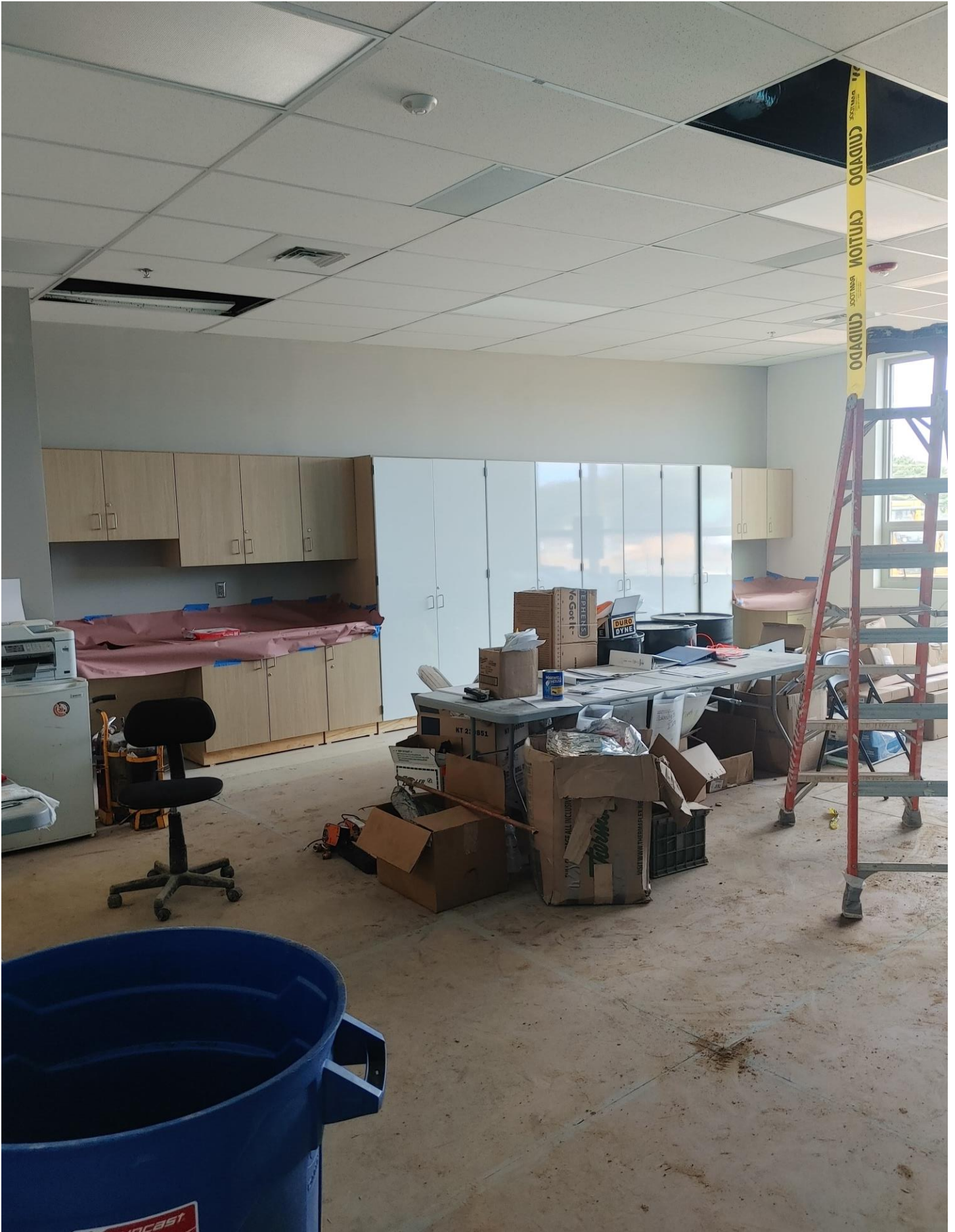
Photo 14 - Cabinetry installed in A103