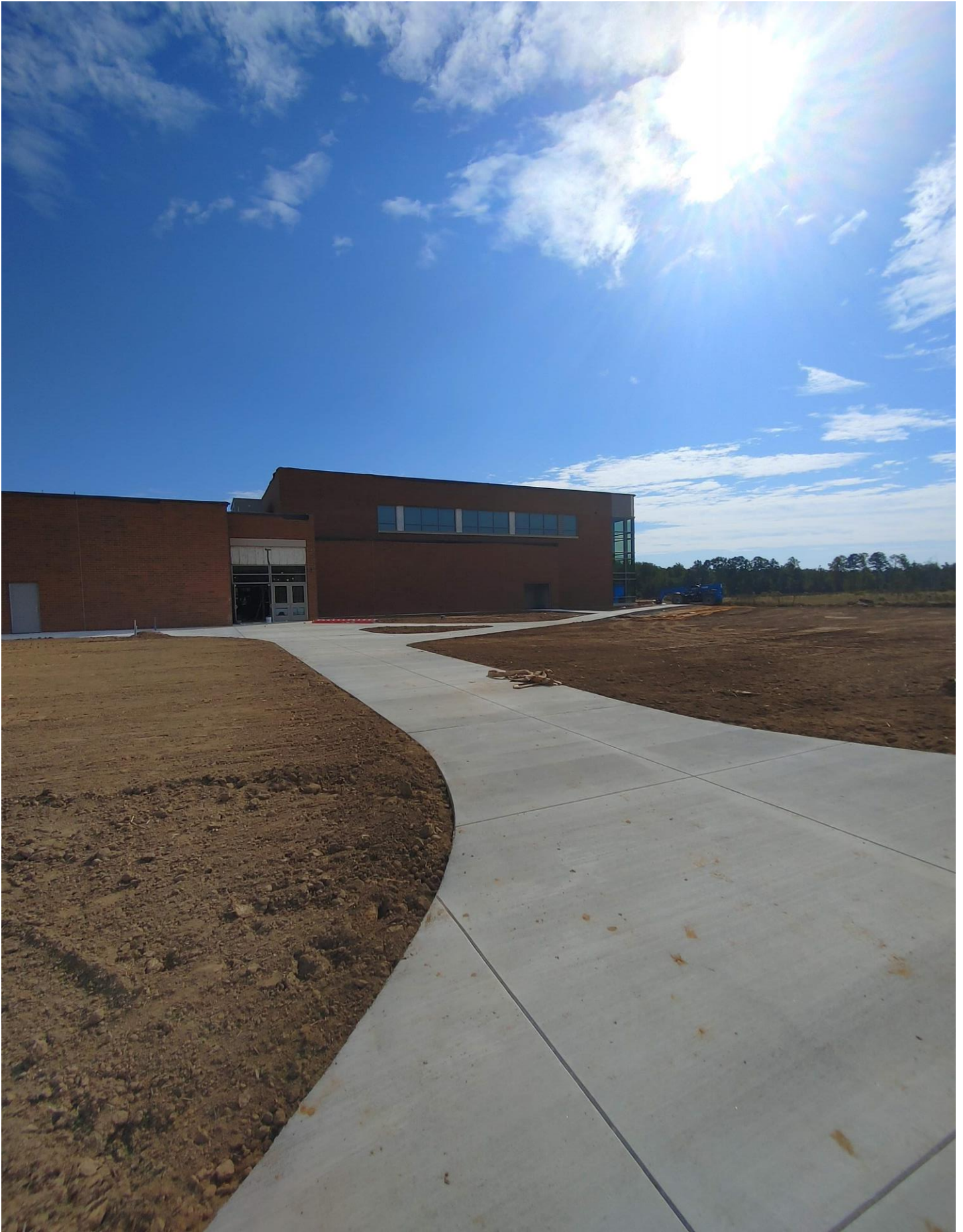
Photo 6 - Topsoil has been spread and graded on the West side of the Gym