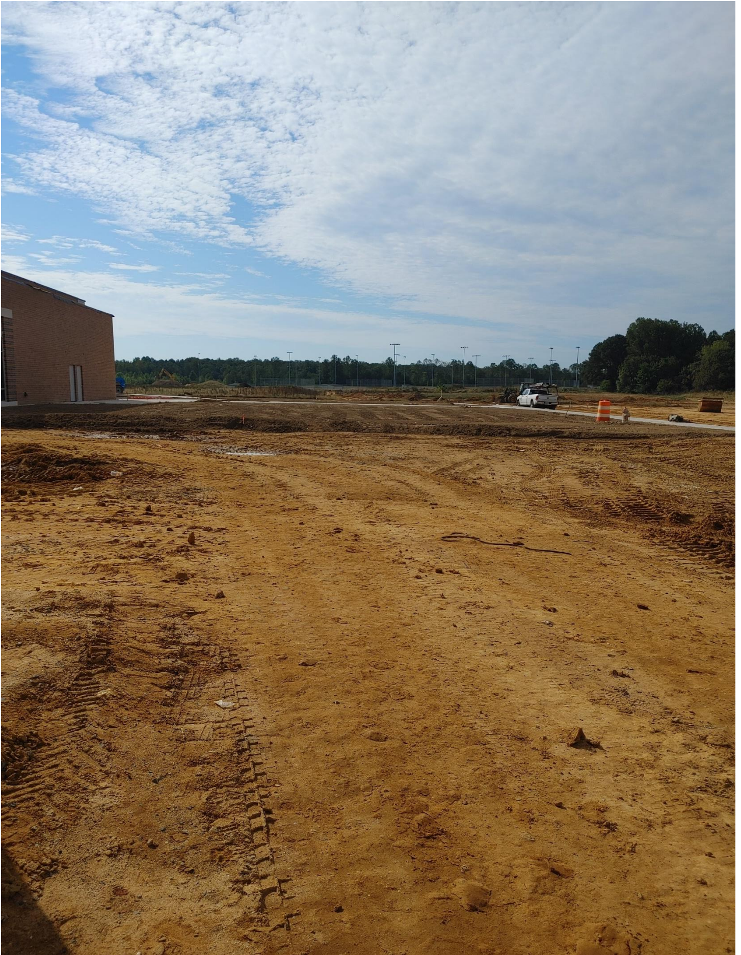
Photo 5 - Topsoil is being spread on the West side of Area E