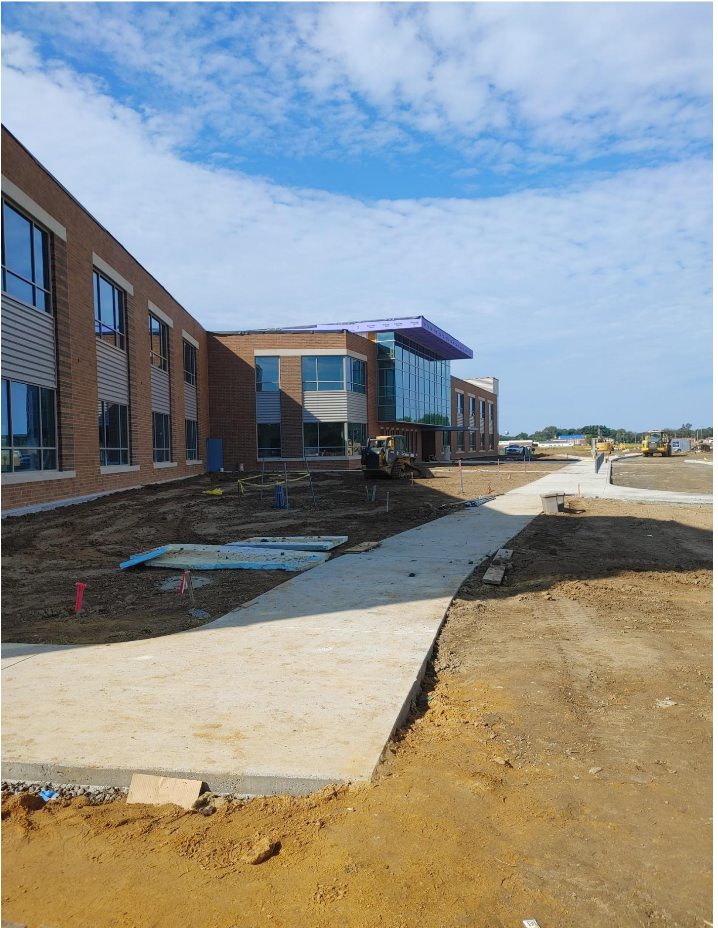
Photo 1 - Sidewalks from Entrance and Stairwells have been completed.