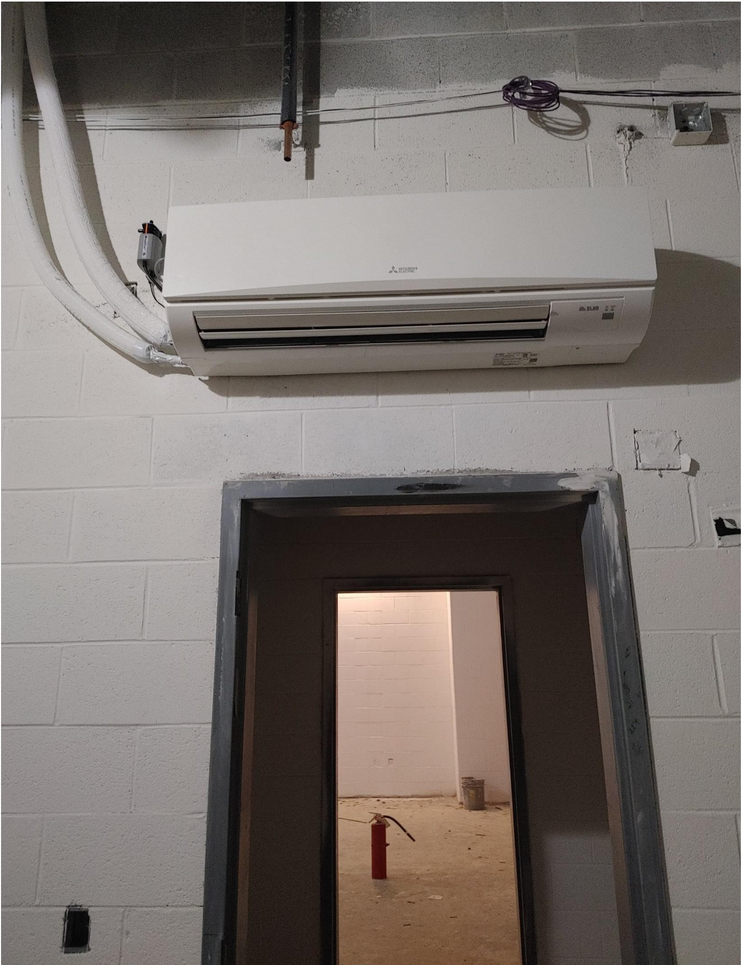
Photo 17 - Mitsubishi Head unit install almost on Door Frame D131.