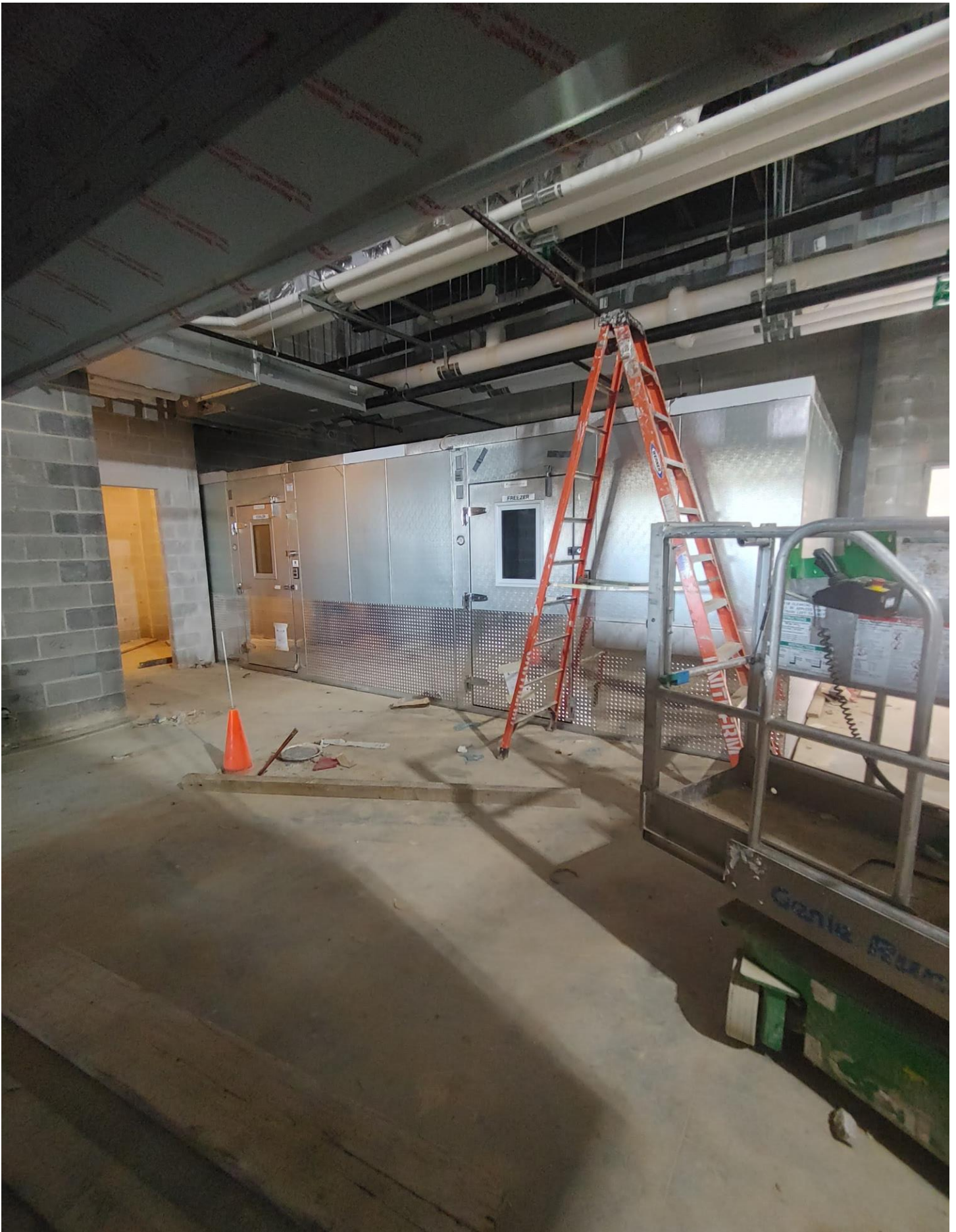
Photo 15 - Cooler and Freezer have been installed