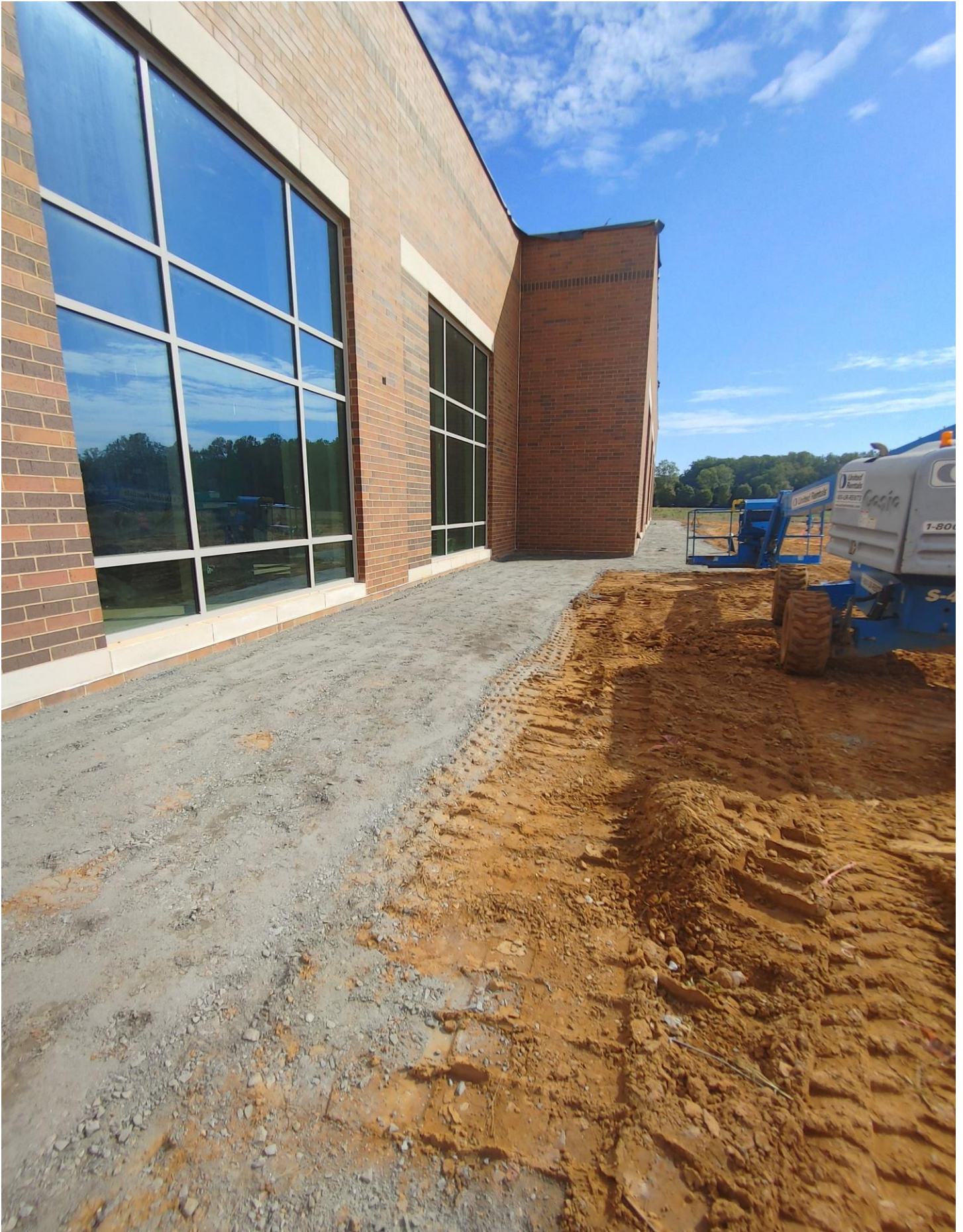
Photo 8 - South side of Area D prepped for Concrete