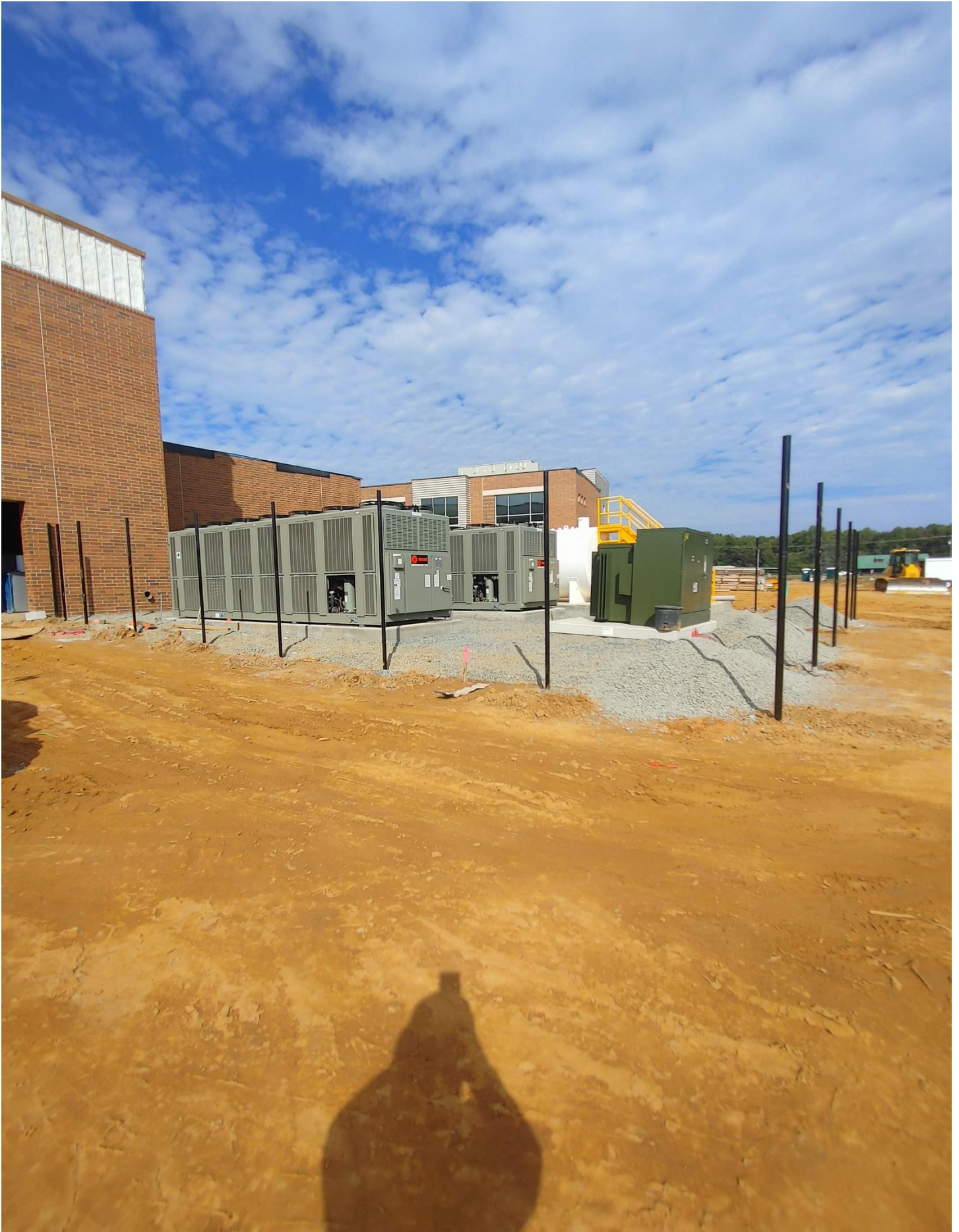
Photo 9 - Fence Posts have been installed