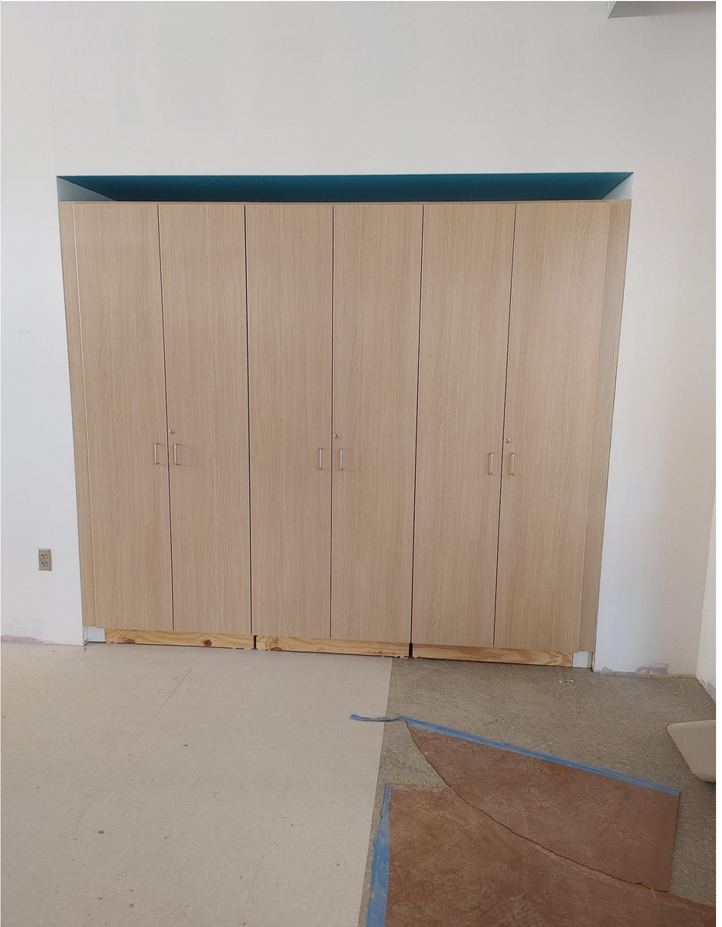
Photo 13 - Cabinetry in A105