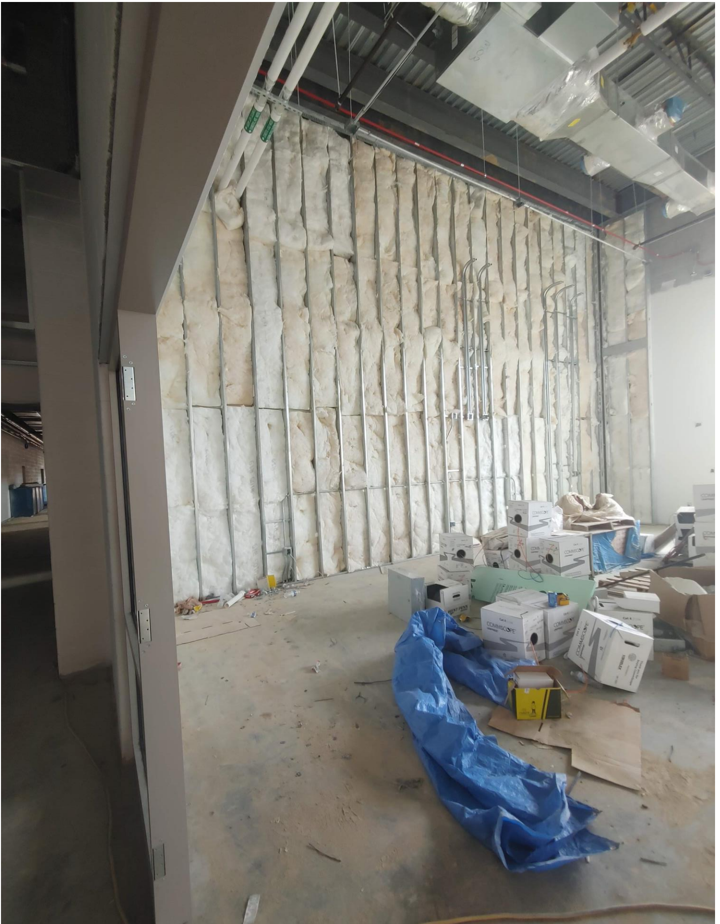
Photo 18 - Insulation has been installed on the East wall of Room D112