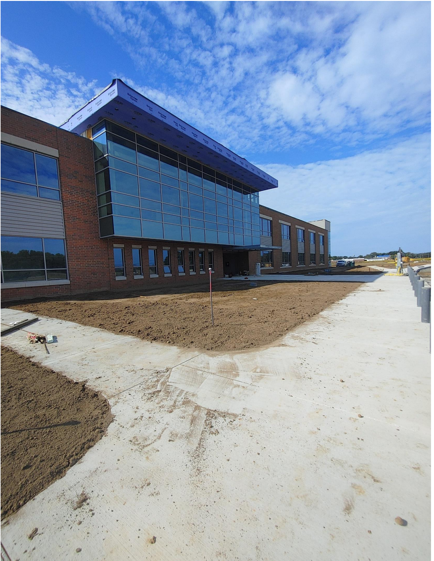
Photo 2 - Top Soil in being spread & Bollards have been installed.