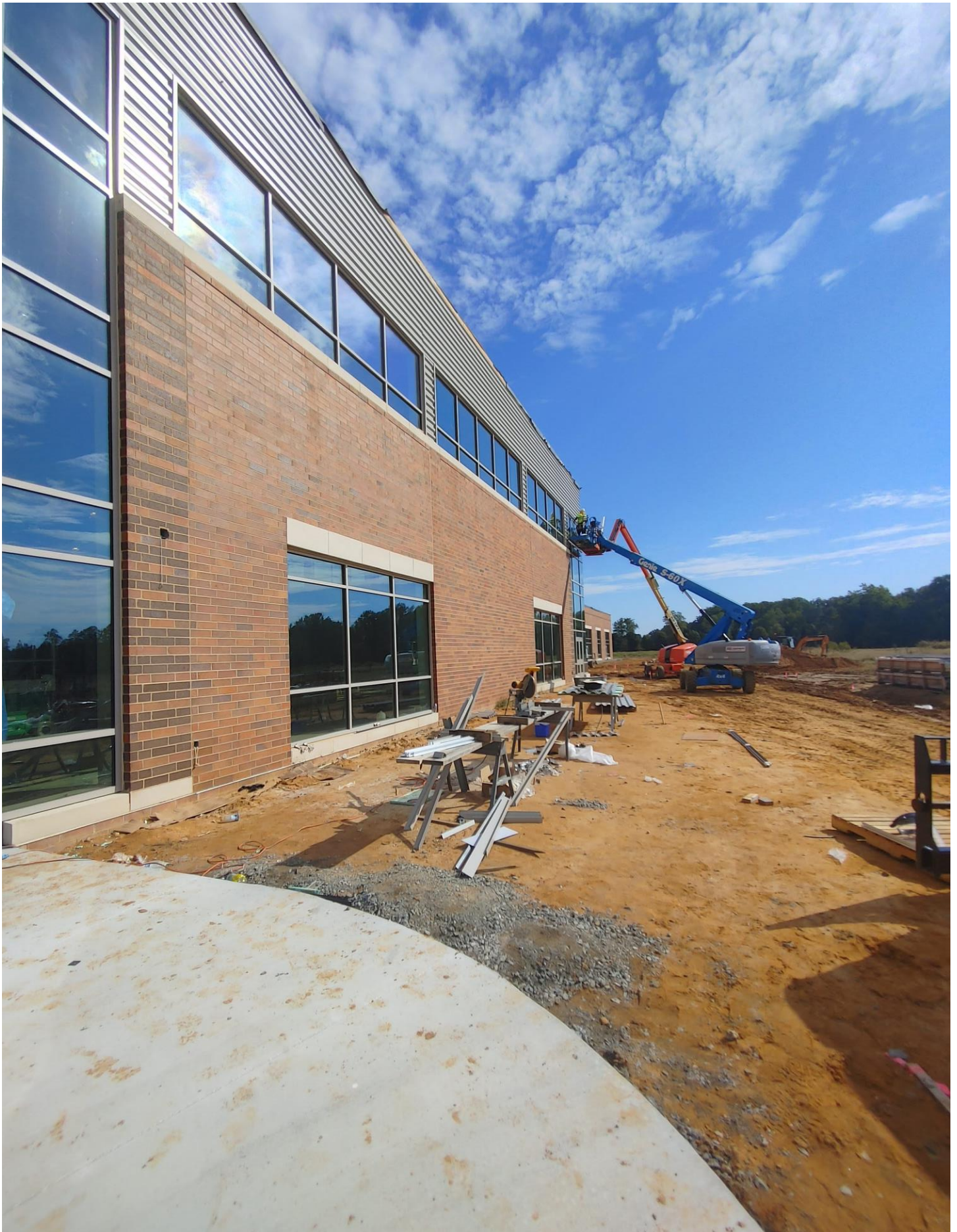
Photo 7 - Metal Panels are being installed on the South side of the Gym