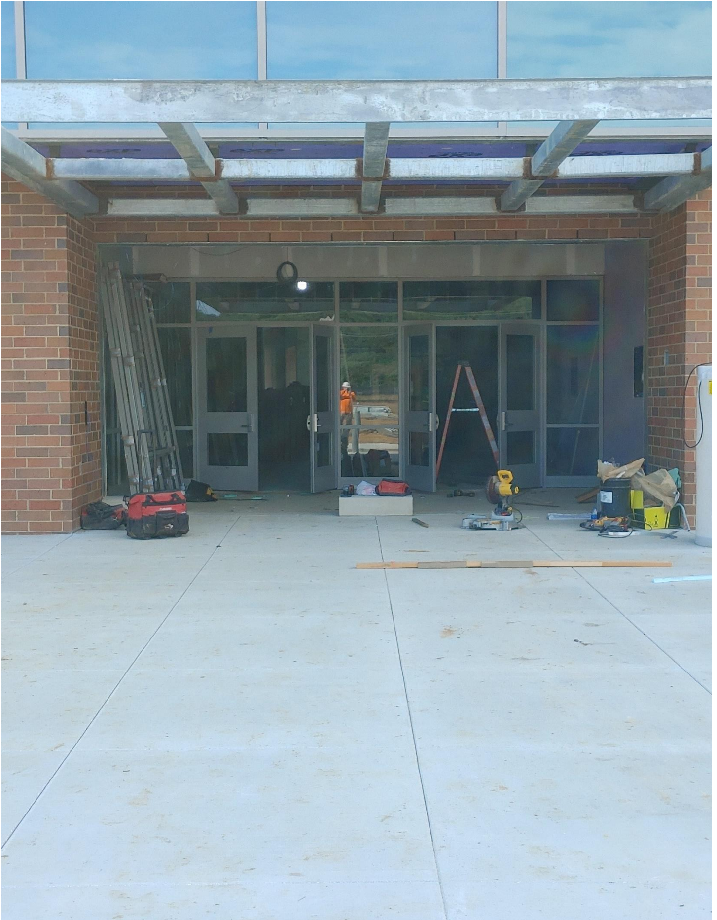
Photo 3 - Front Doors are being installed