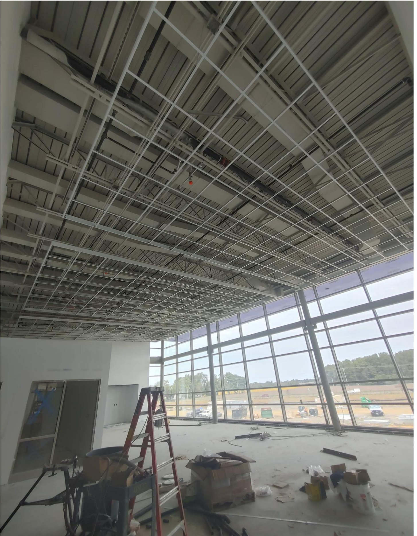
Photo 20 - Track has been installed for Cloud Ceiling in Area A