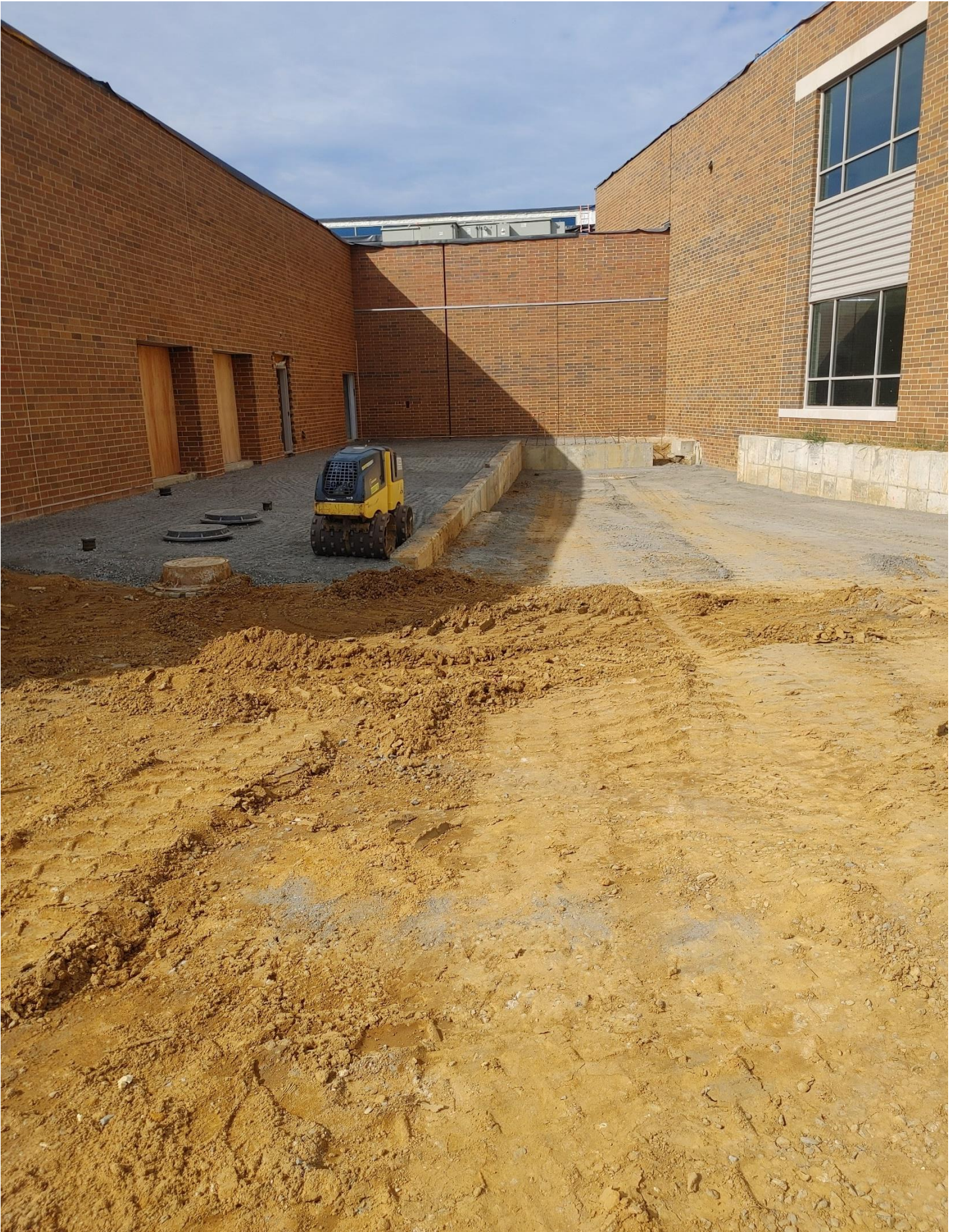
Photo 10 - Load Dock Area is being prepped for Concrete