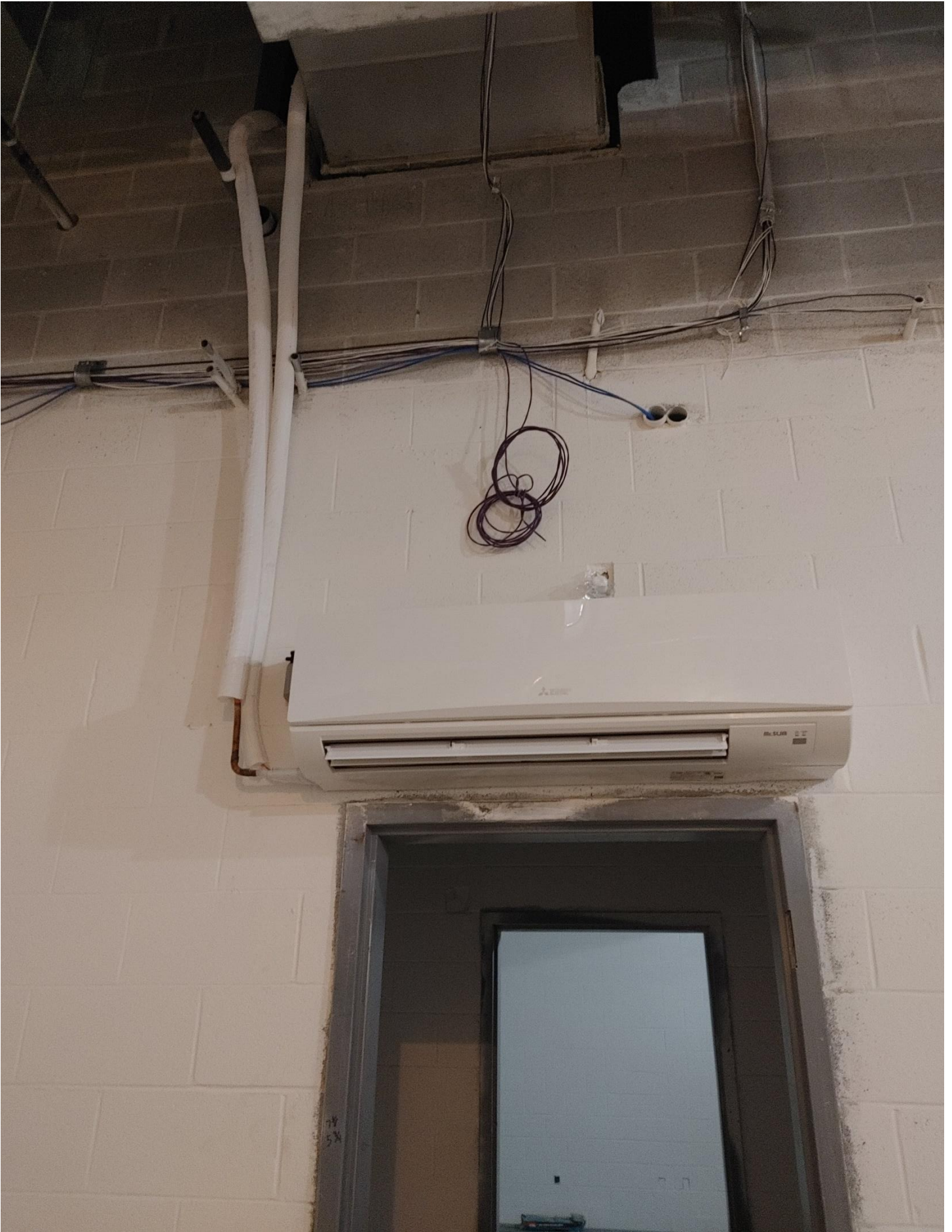
Photo 16 - Mitsubishi Head unit install almost on Door Frame D132. (Todd will have unit moved).