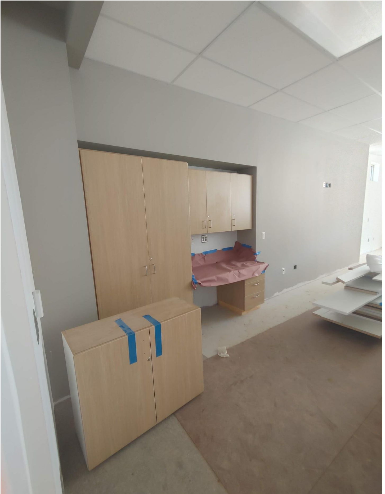
Photo 12 - Cabinetry has been installed in A105