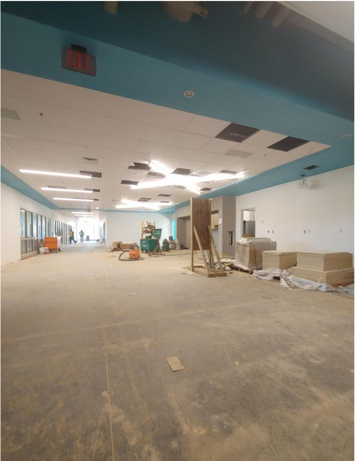
Photo 12 - LED Lights in Area A