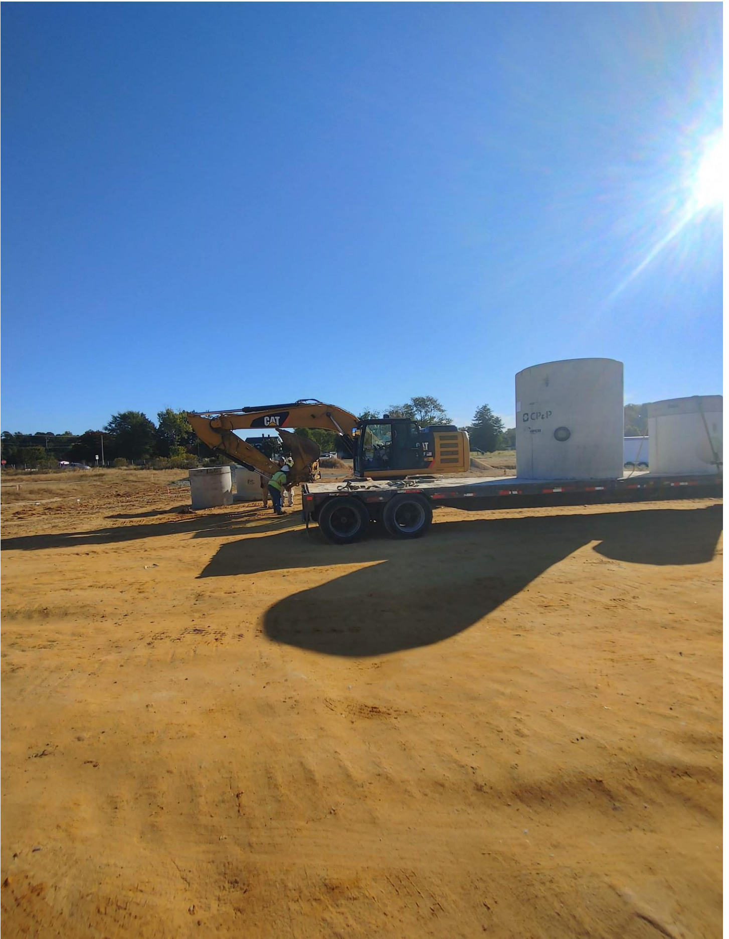
Photo 1 - Sewage Tank is being off loaded