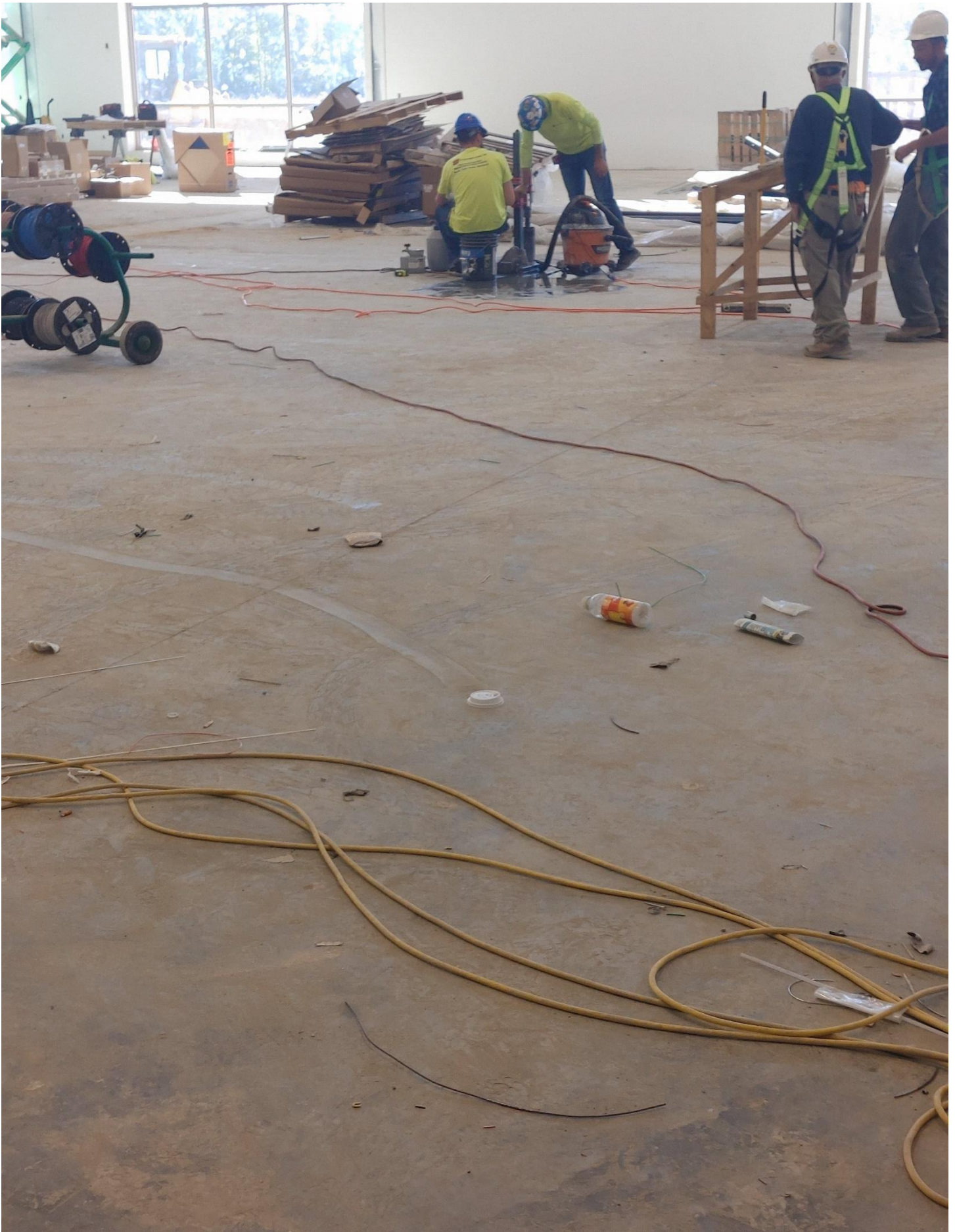
Photo 5 - Gym Floor is being cored for Volley Ball Pole Sleeves.