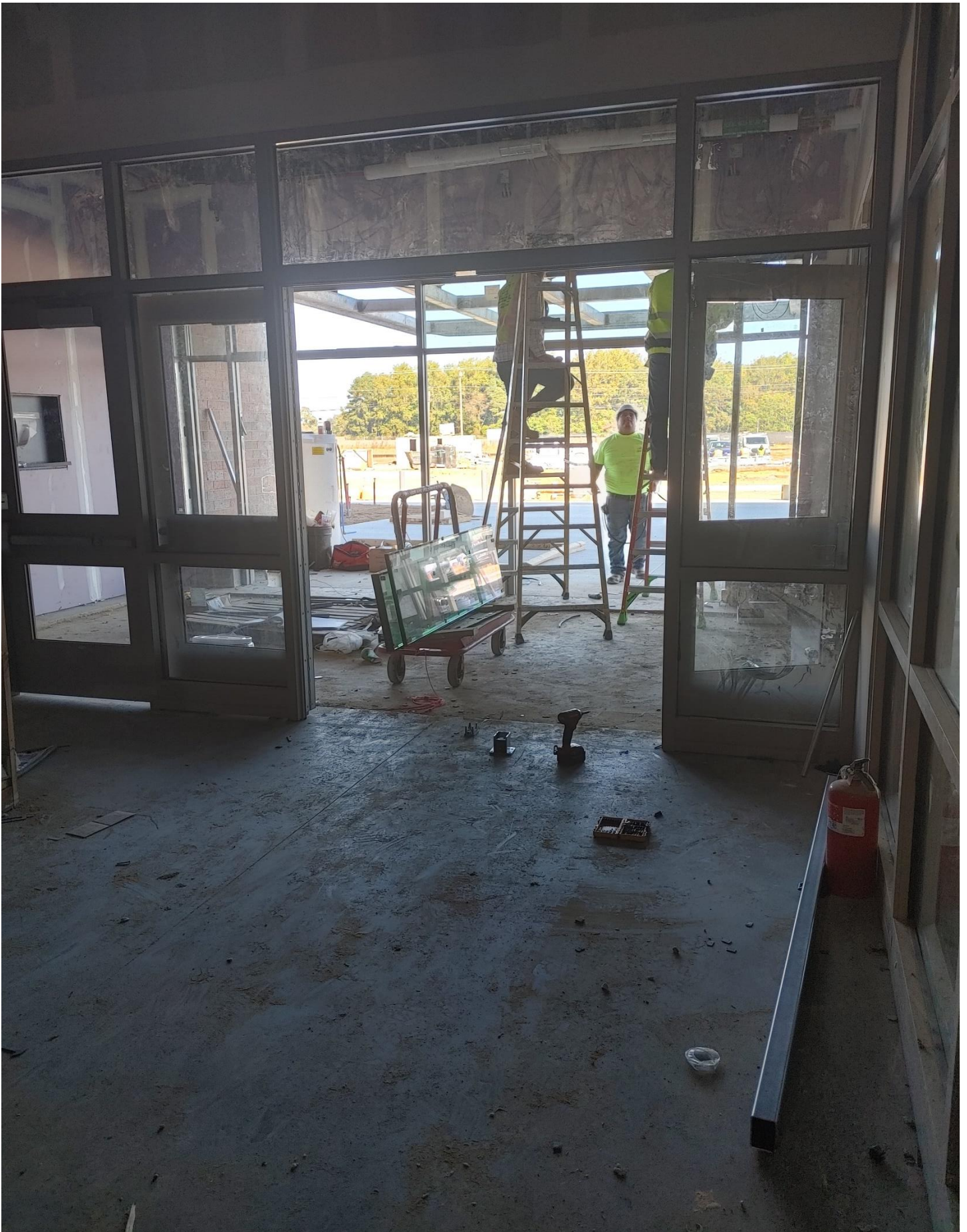
Photo 10 - FG&M is working on SF69