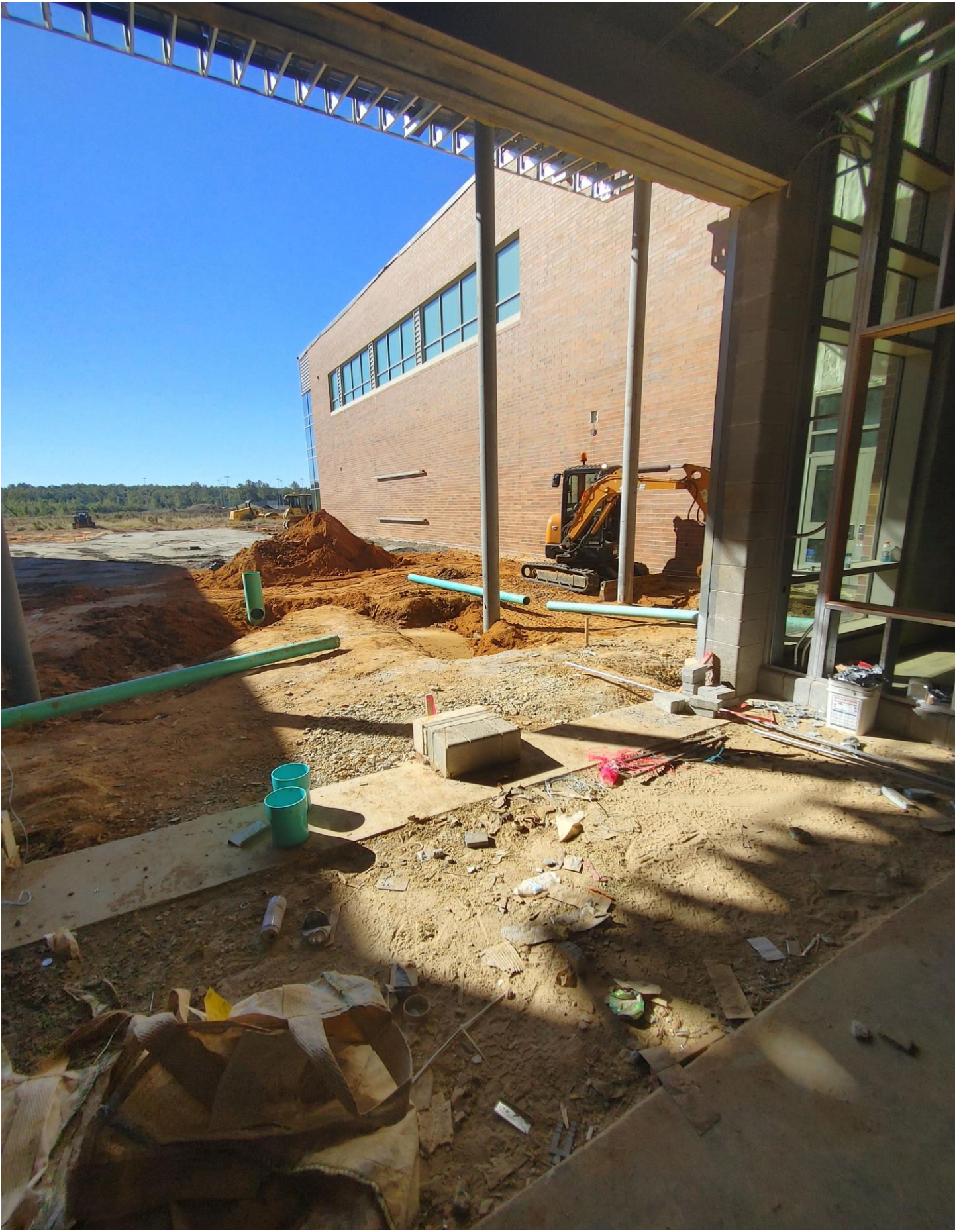
Photo 2 - Storm Water Pipe is being laid on the South side of Area C