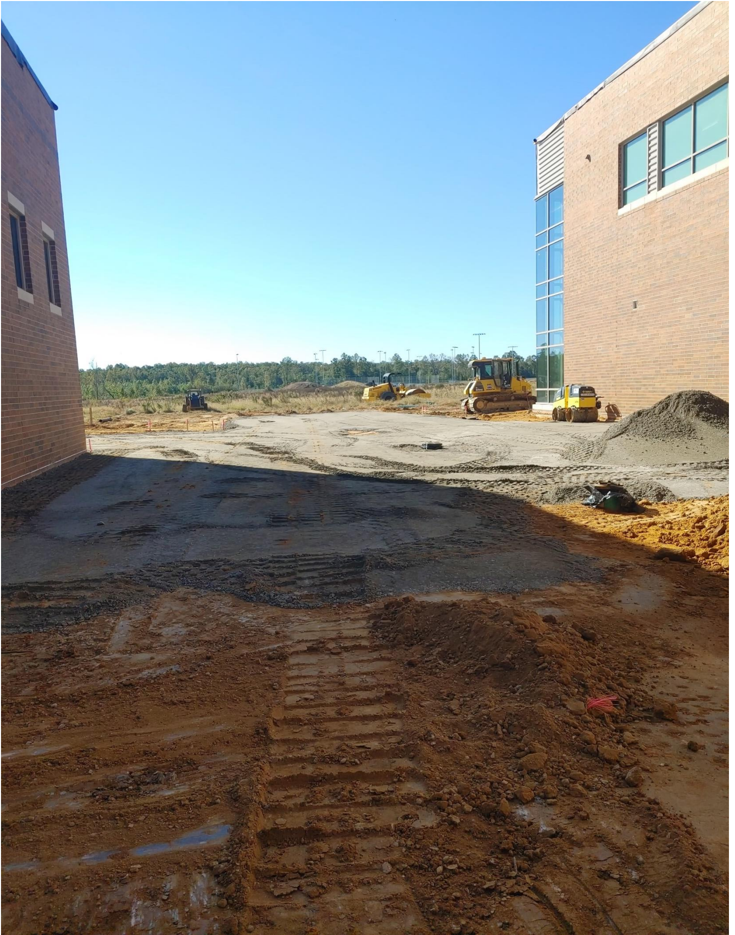
Photo 3 - They have begun to lay stone between Areas D & E.