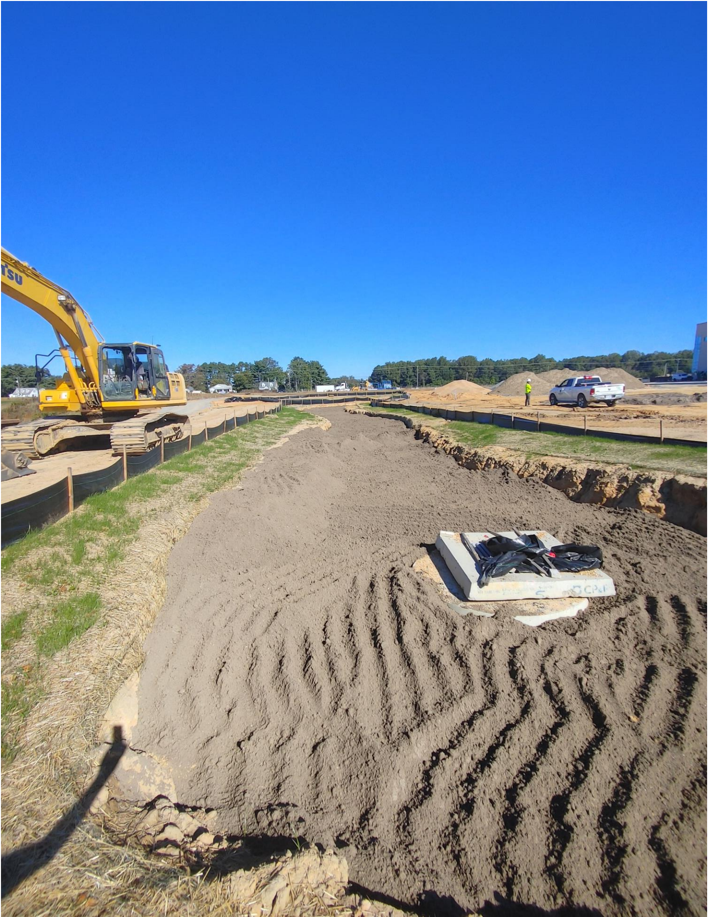
Photo 8 - First lift of Bio Material has been installed.