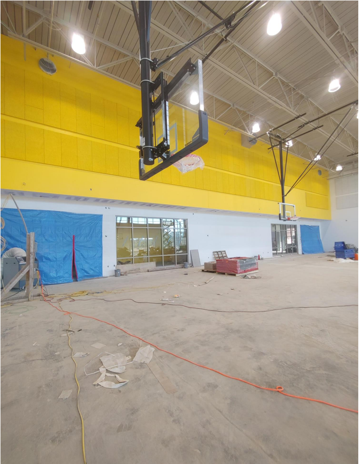
Photo 6 - North wall of Gym has received a coat of paint.