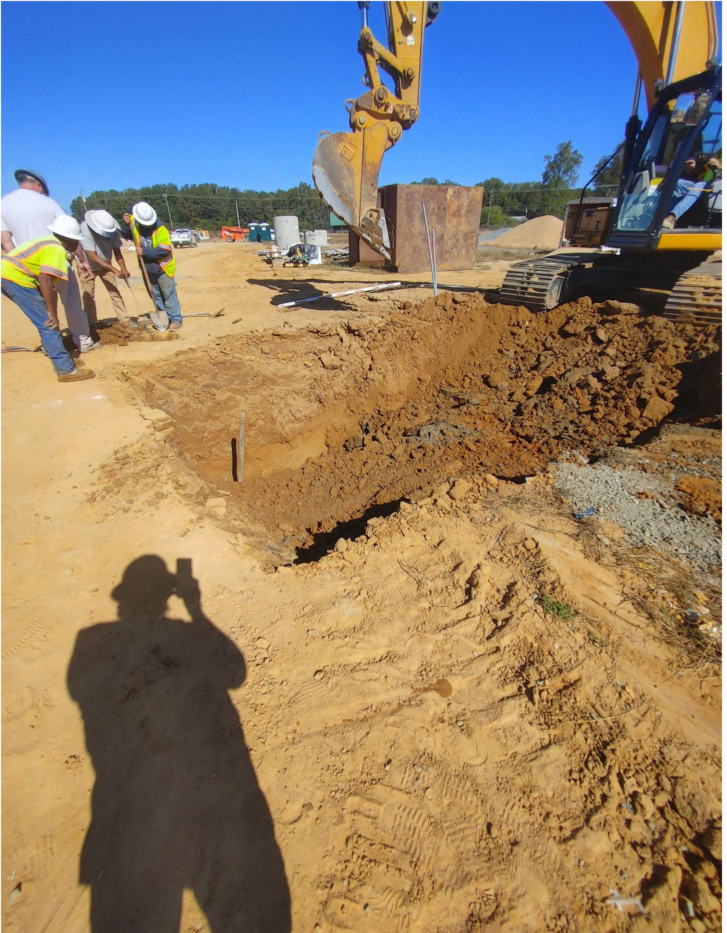
Photo 13 - Excavation for the Sewage Tank has begun.