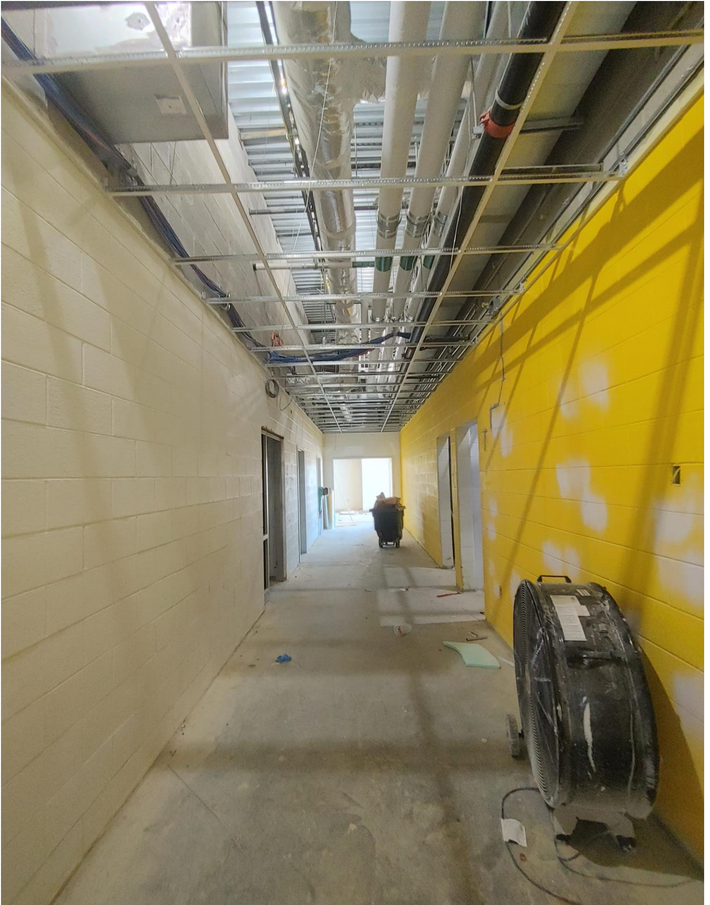
Photo 9 - Acoustical Ceiling Grid has been installed throughout Area E.