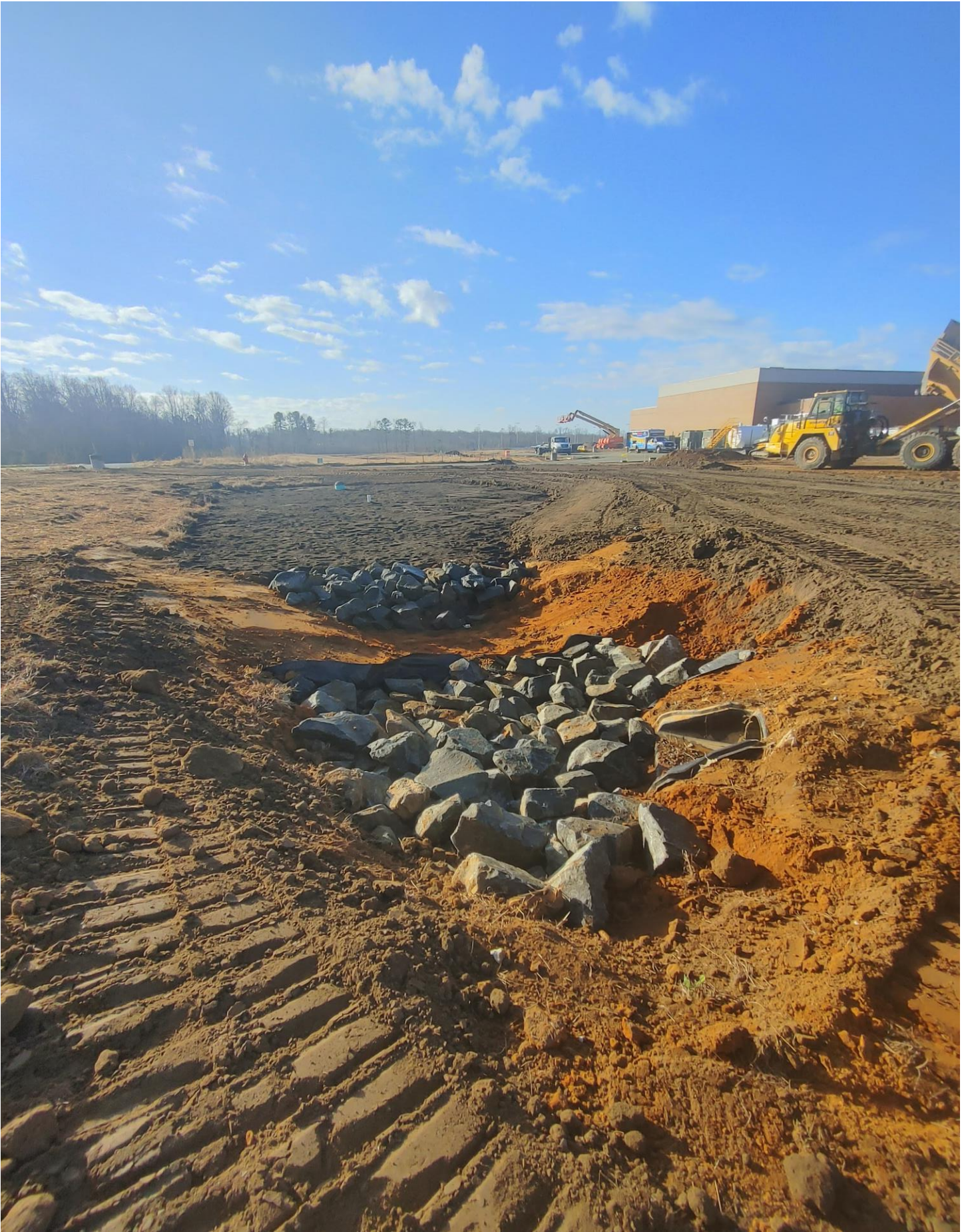
Photo 2 - Bio Retention Pond on the Northeast side of High School