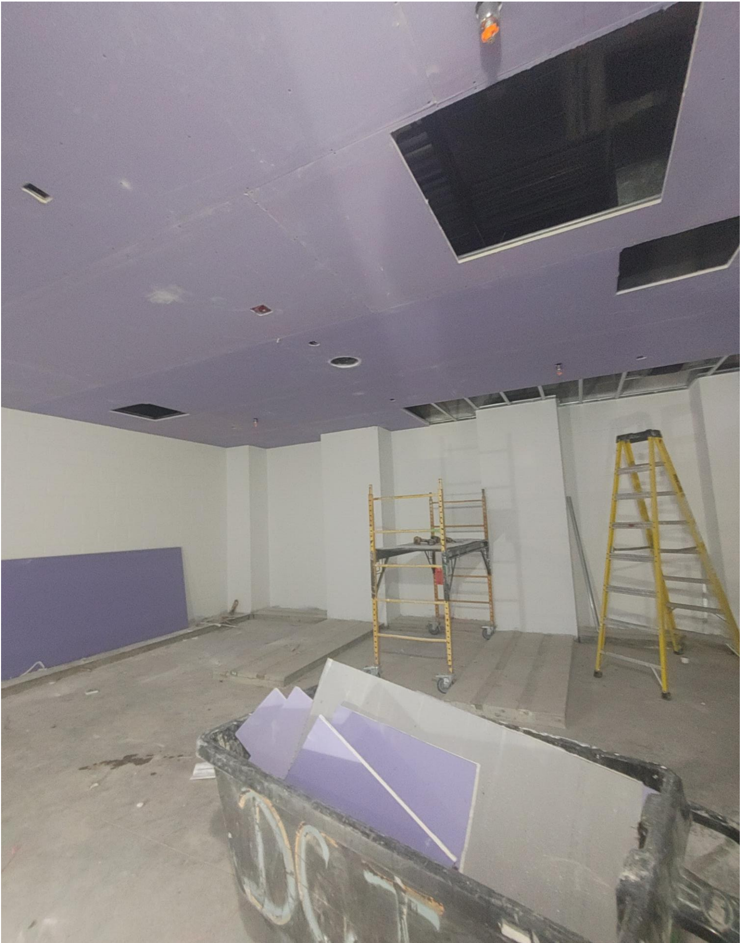
Photo 6 - Ceilings are being hung in locker rooms.