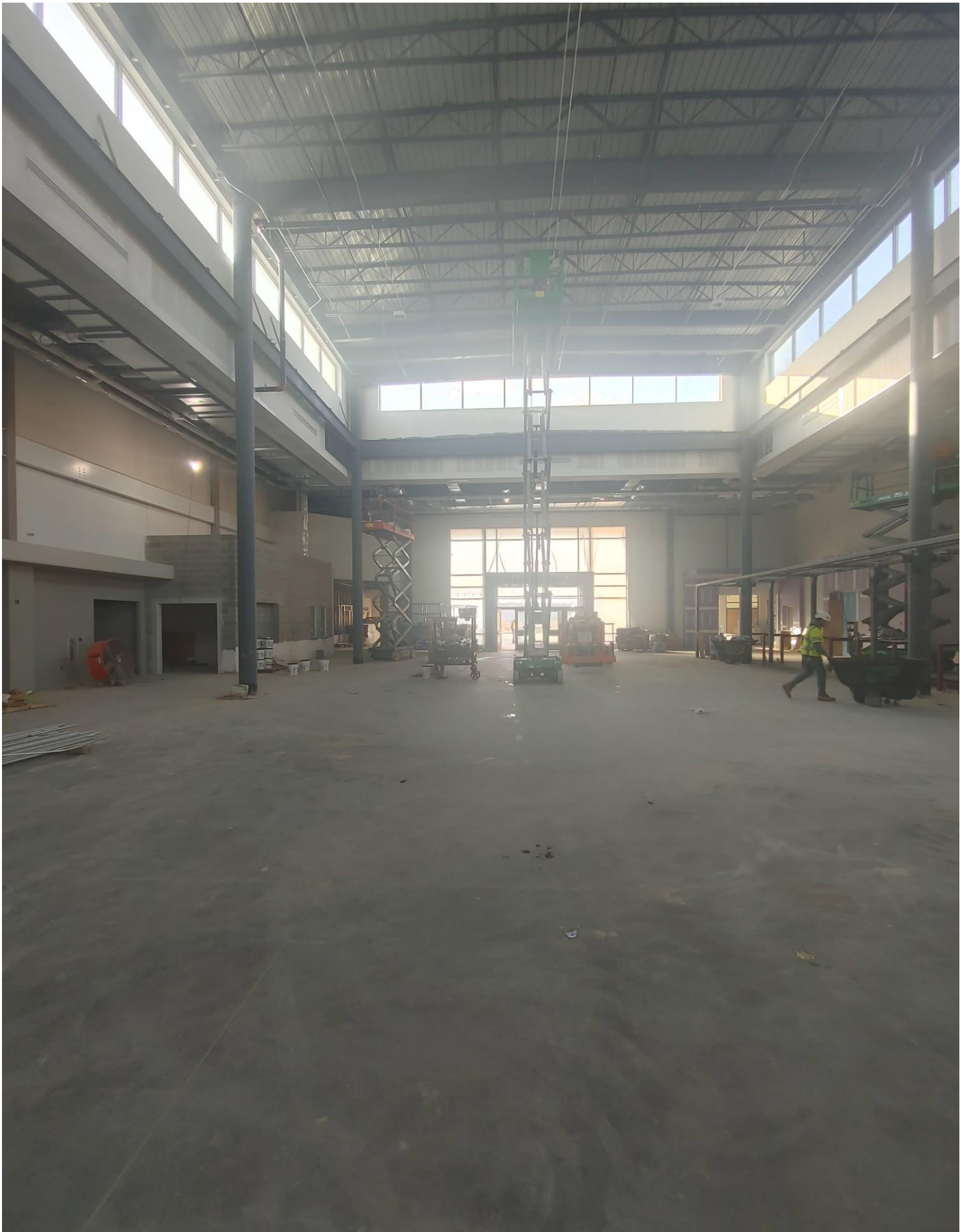
Photo 3 - Sheetrock is being finished in Area C