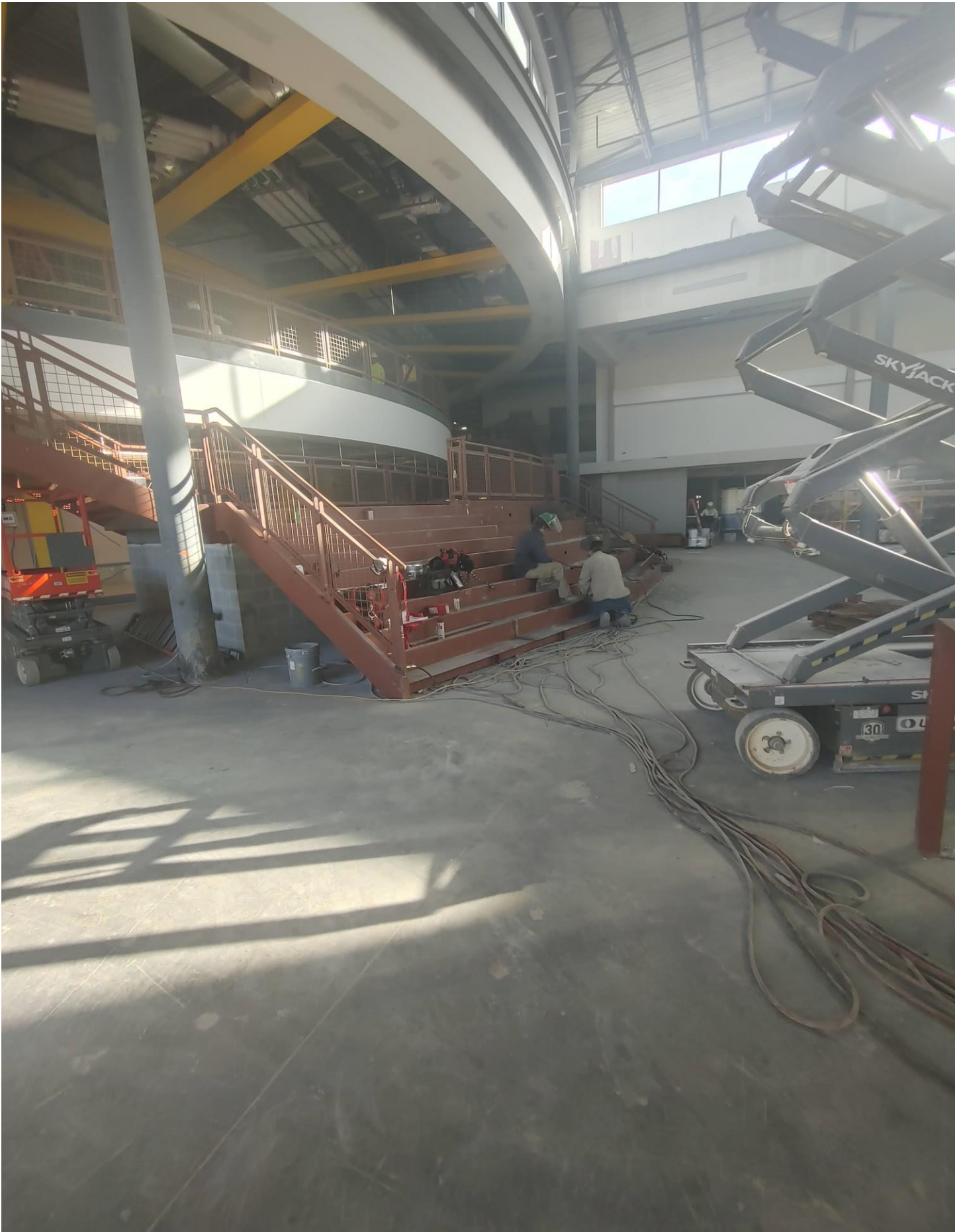
Photo 7 - Work is progressing on the Grand Staircase.