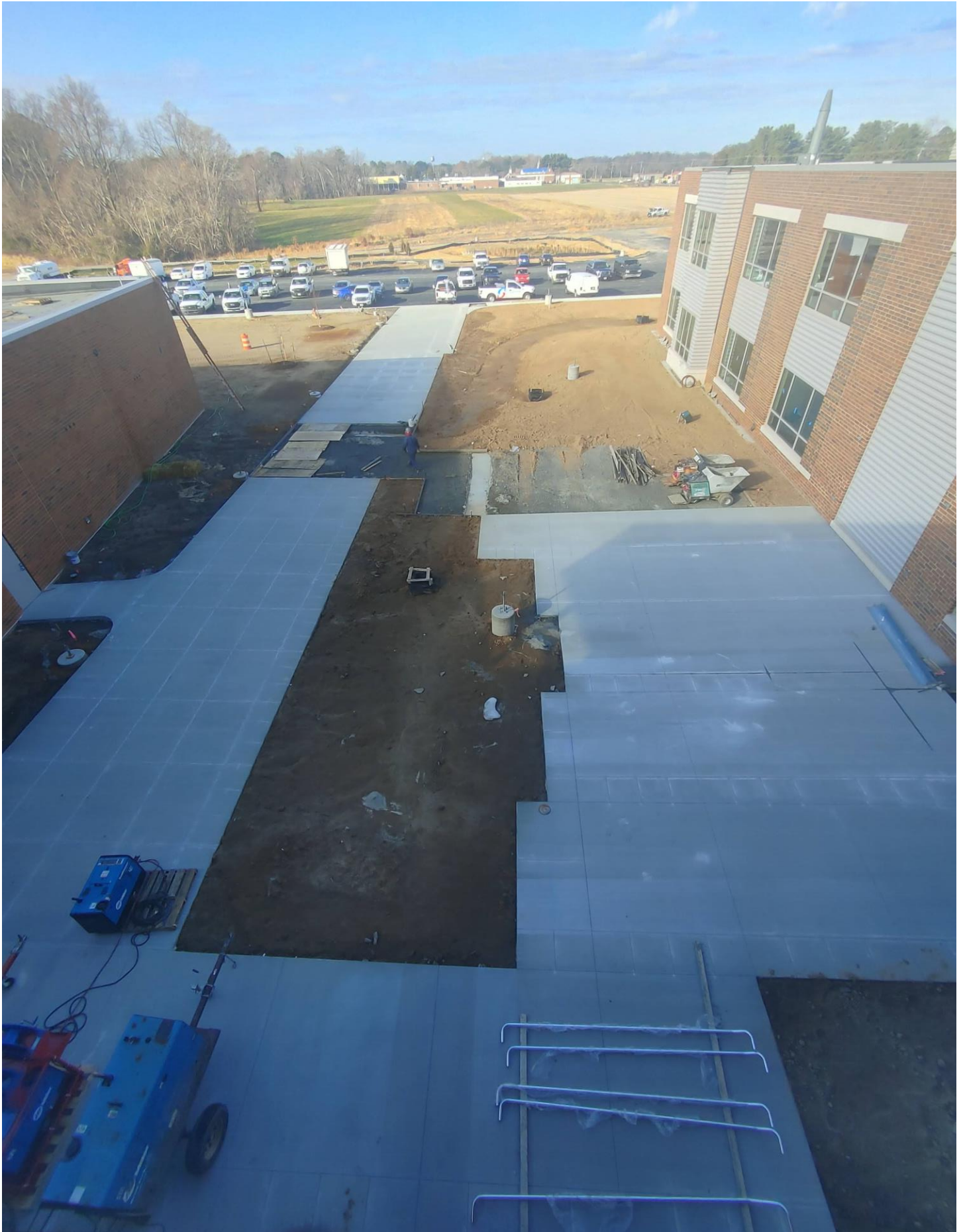
Photo 11 - Student Entrance Area