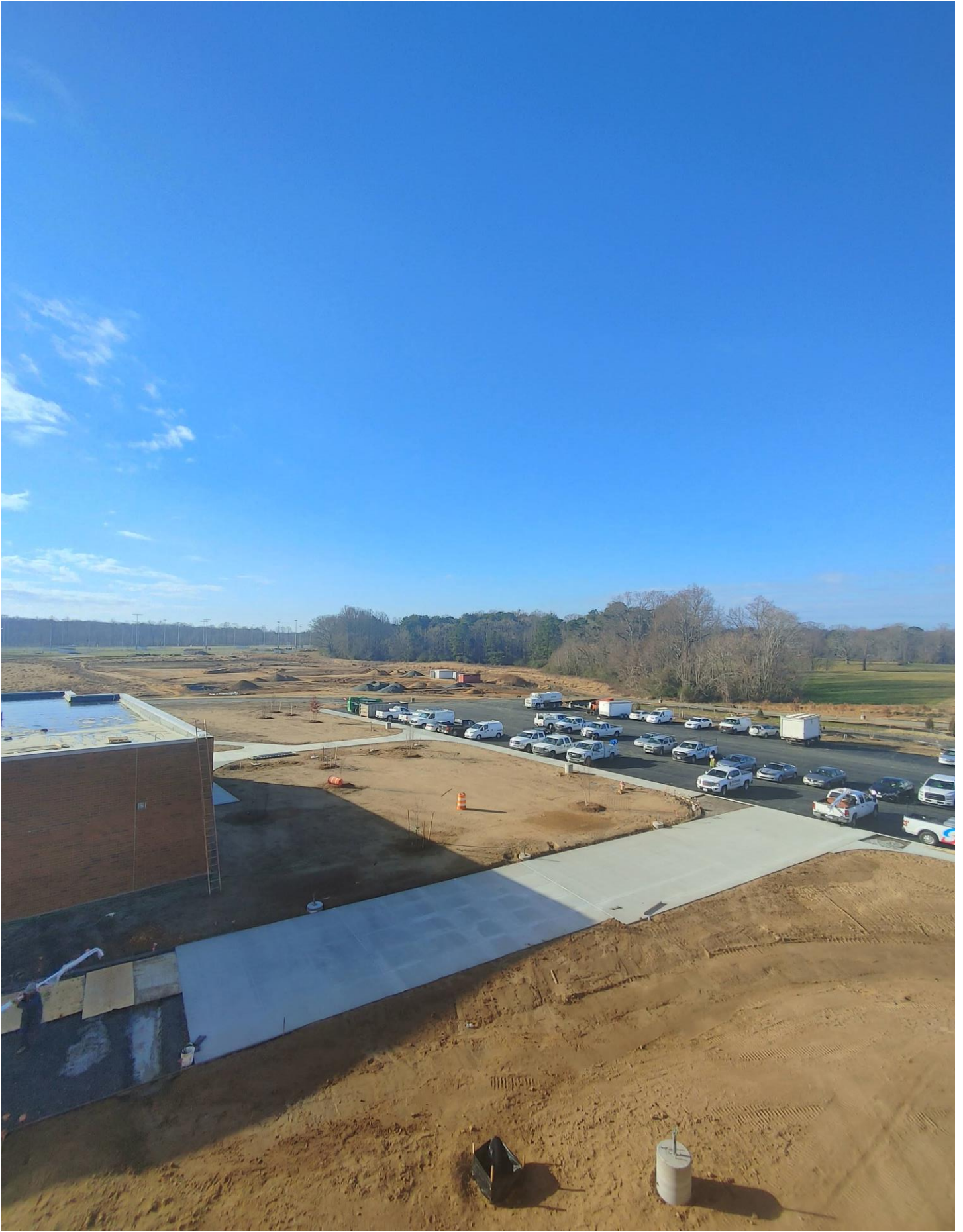
Photo 10 - West side of site