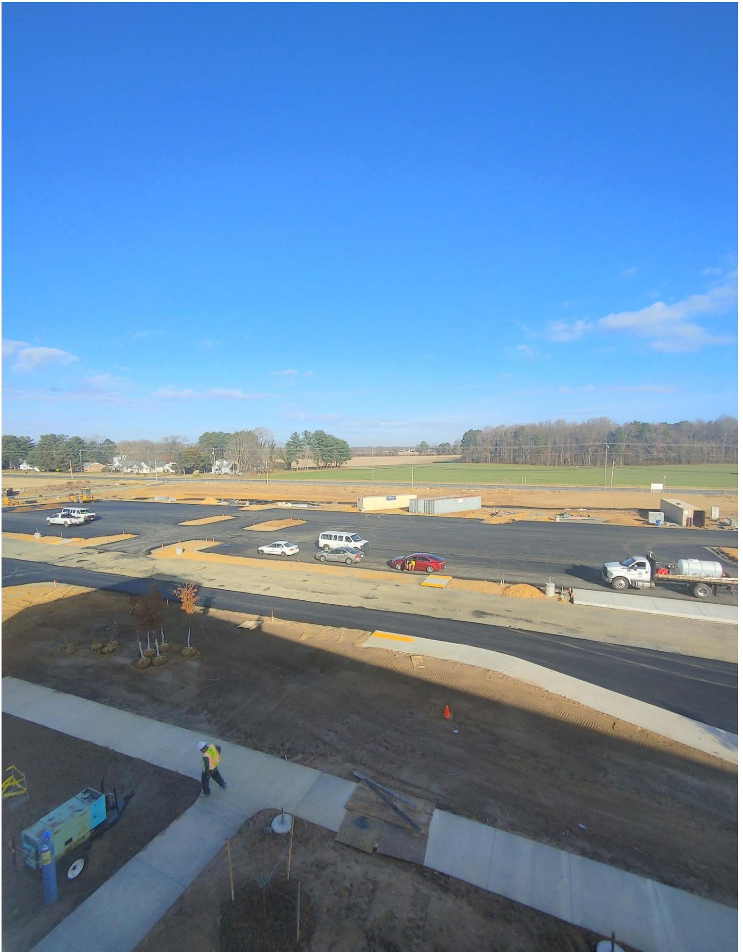
Photo 9 - Northwest Student Parking Lot.