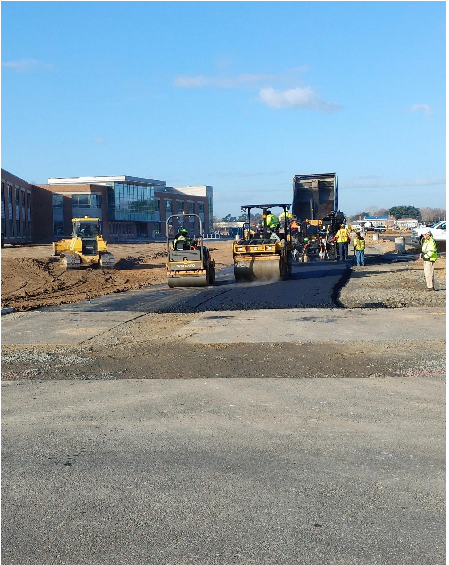
Photo 1 - Base Asphalt is being tied into County Park Drive