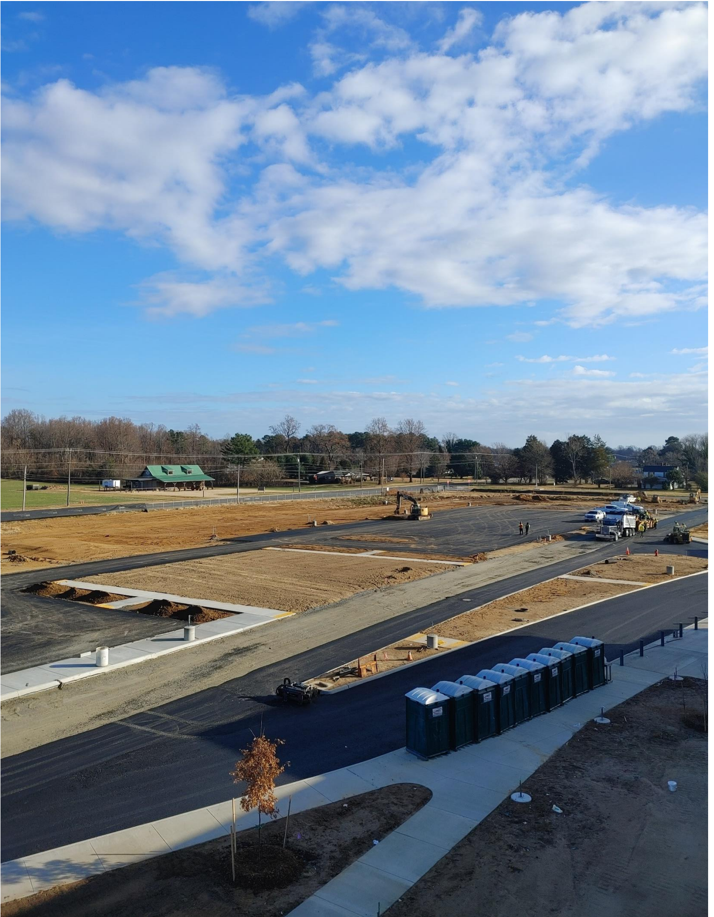
Photo 8 - Main Drive Lane in front of the school is receiving the Base Layer of Asphalt.