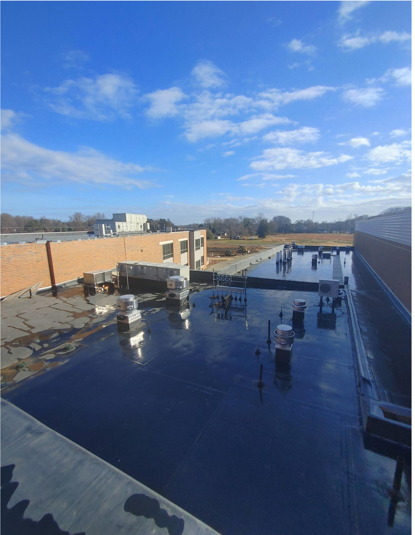
Photo 12 - Roof top units above Kitchen and Mechanical room