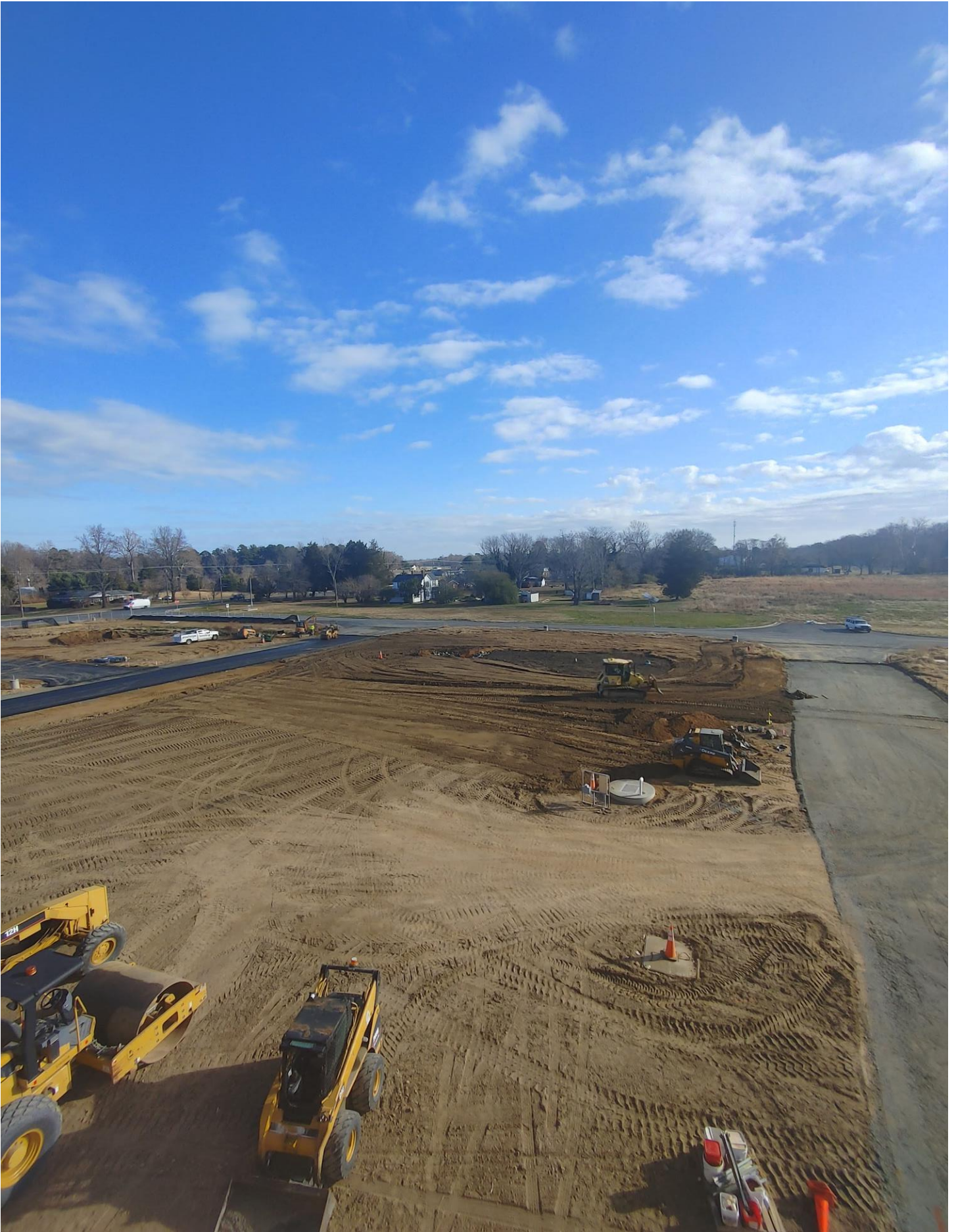
Photo 13 - East side of the site