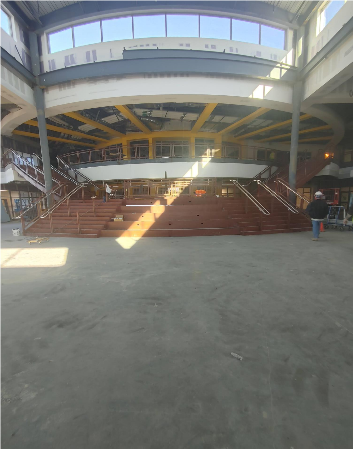
Photo 1 - Work is progressing on the Grand Staircase