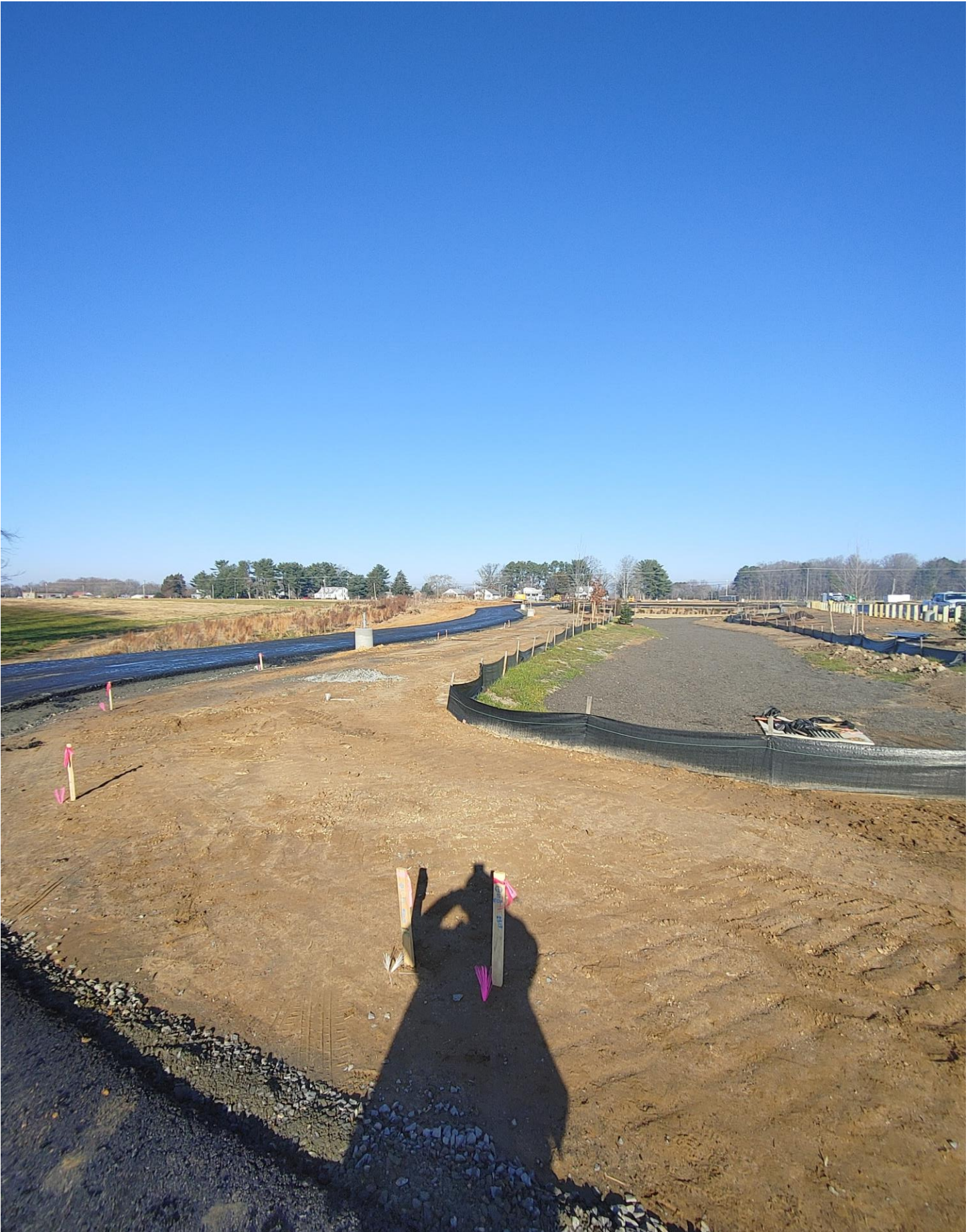
Photo 7 - Bus Loop Road