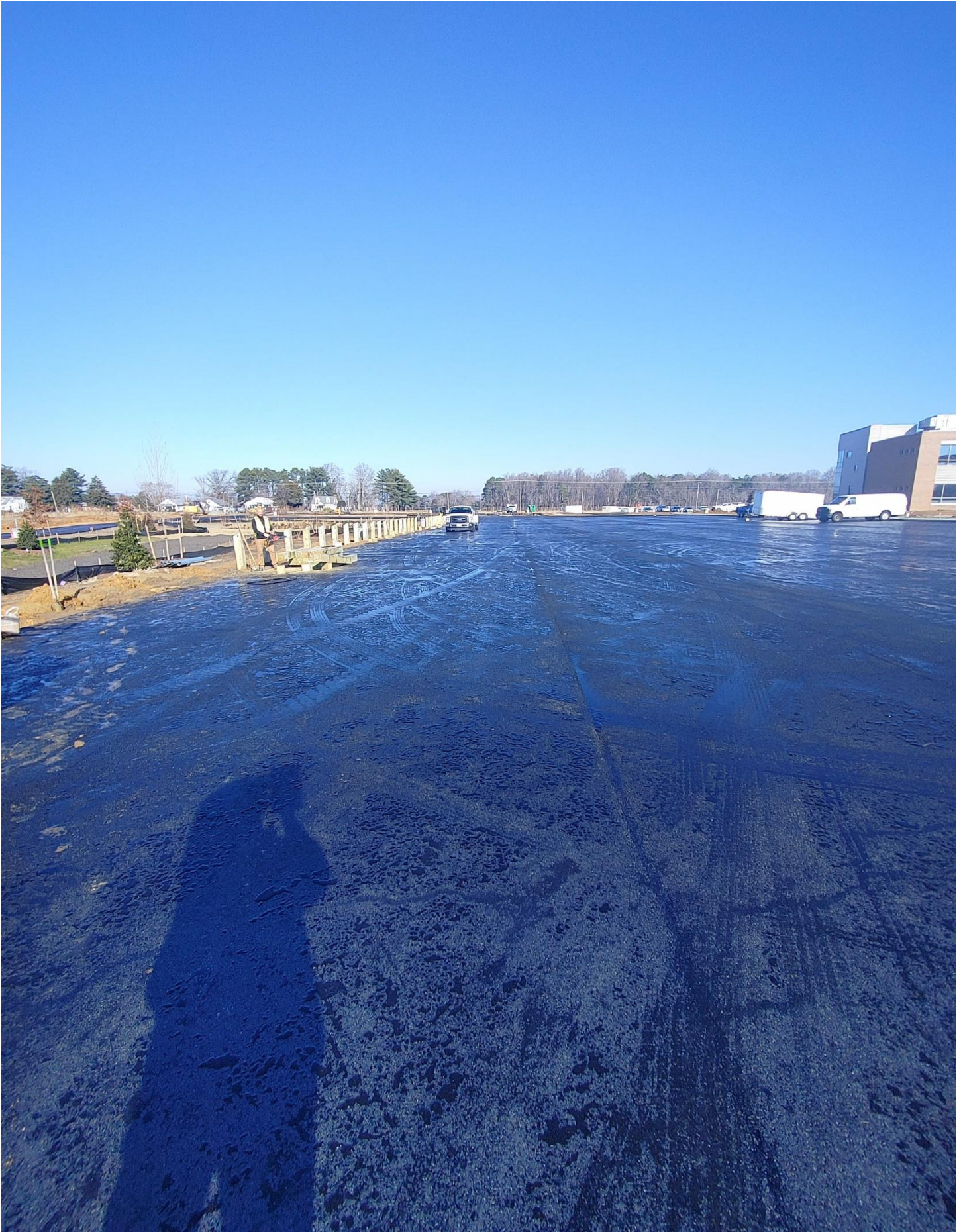
Photo 6 - Fence Posts are being installed between the Bus Parking Area and the BMP