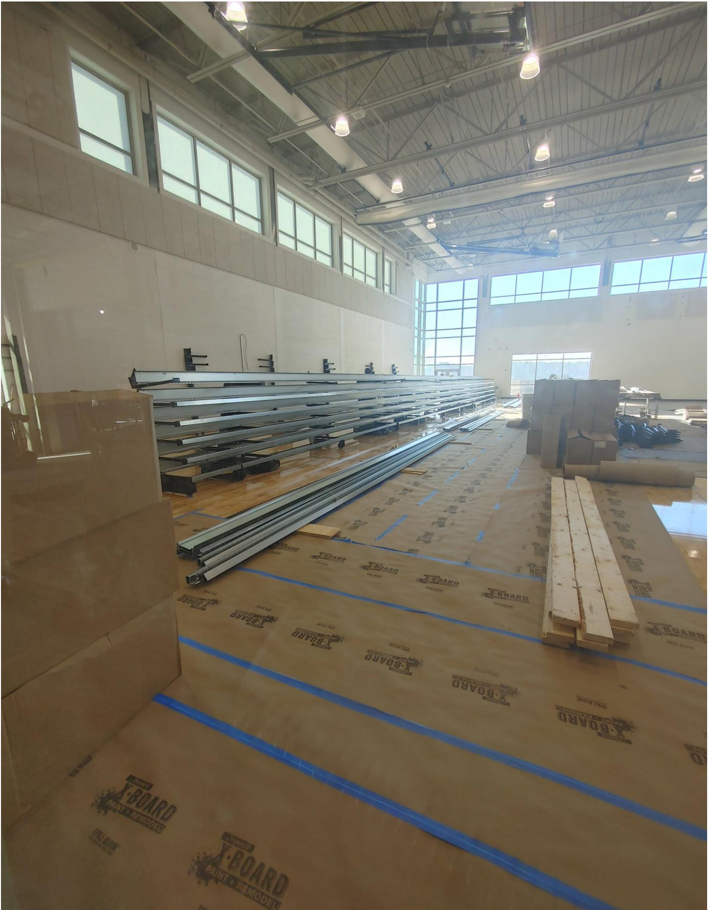
Photo 2 - Bleachers are being erected in the Gym.