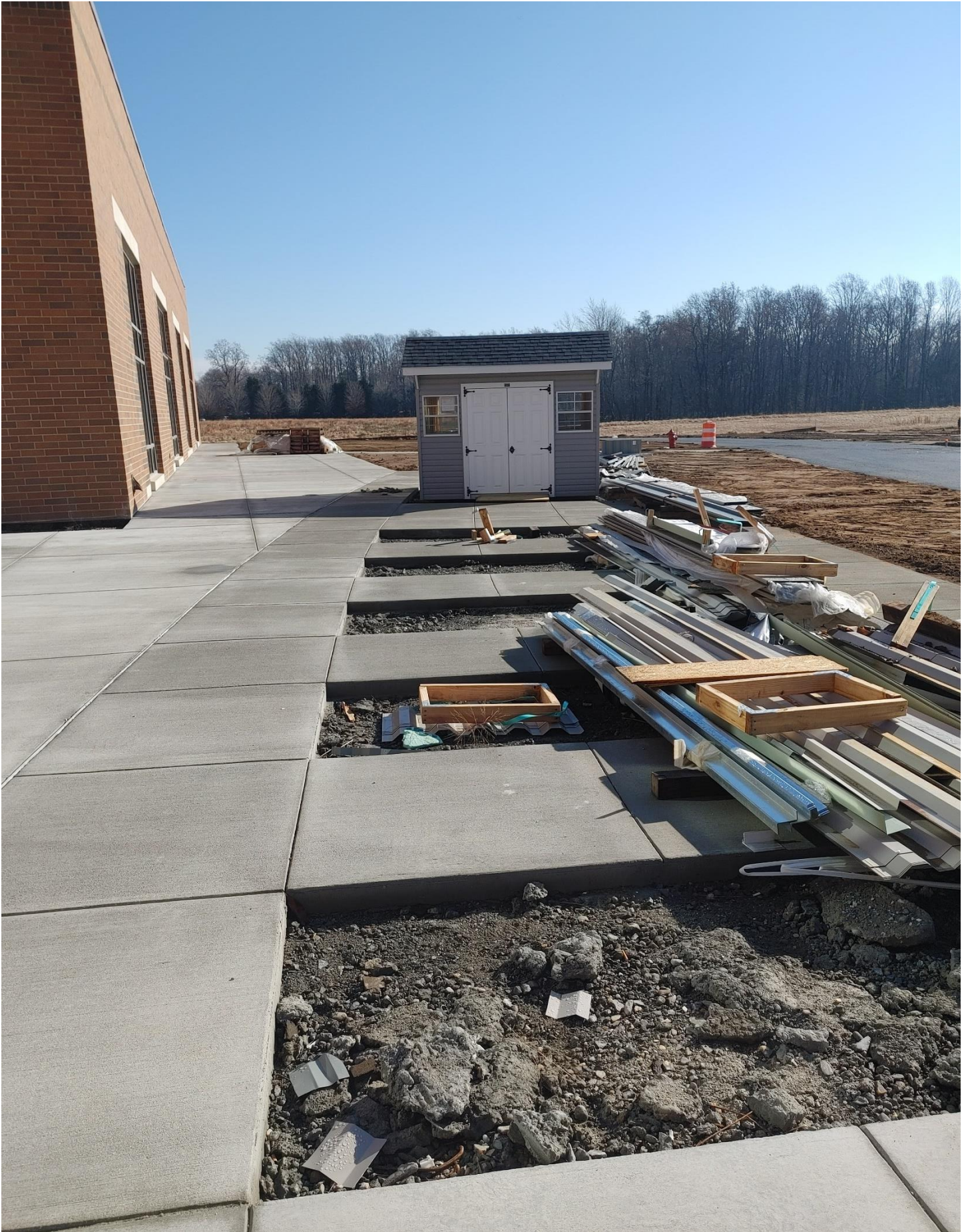
Photo 8 - South side of the School.