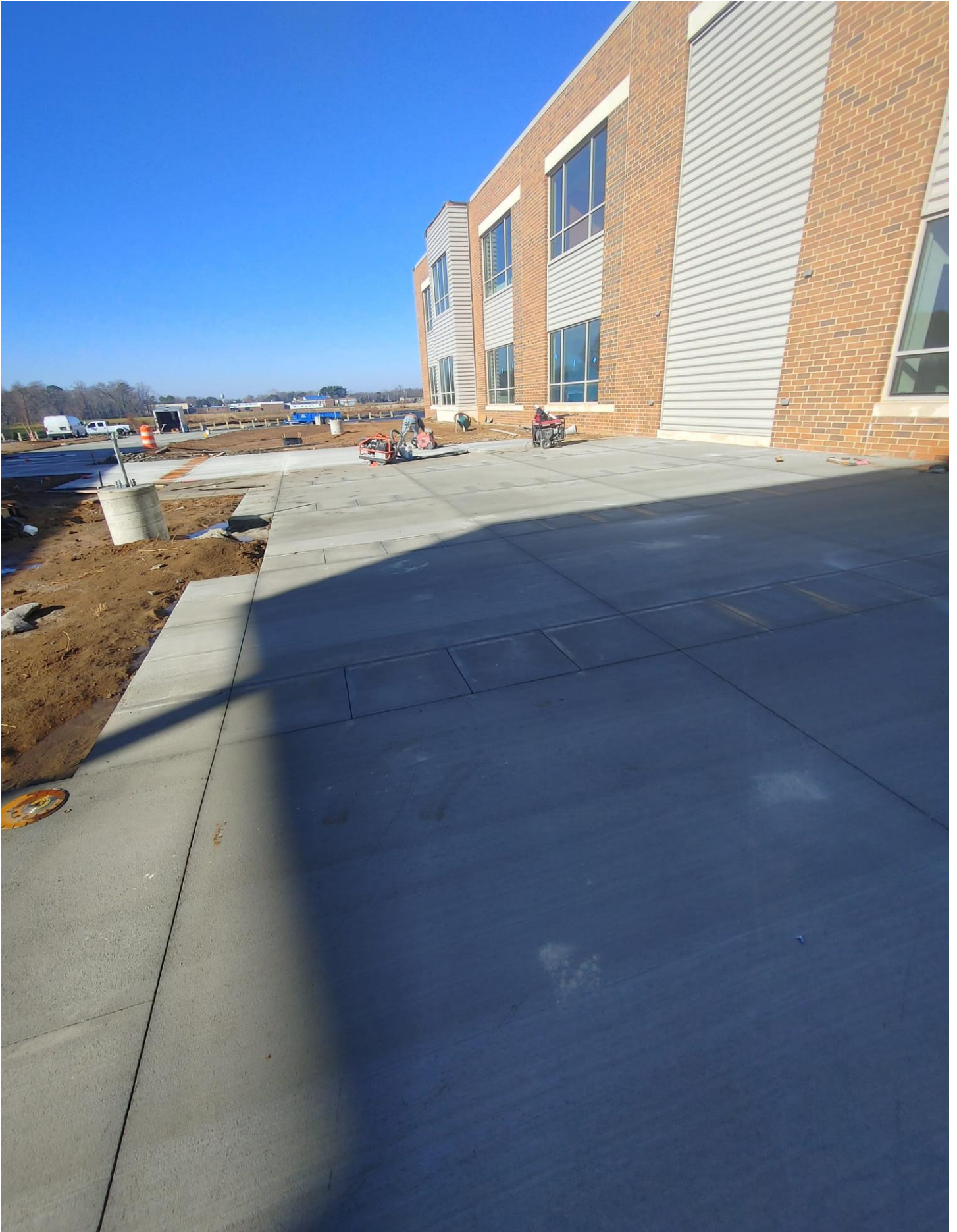
Photo 4 - Concrete is being Scored