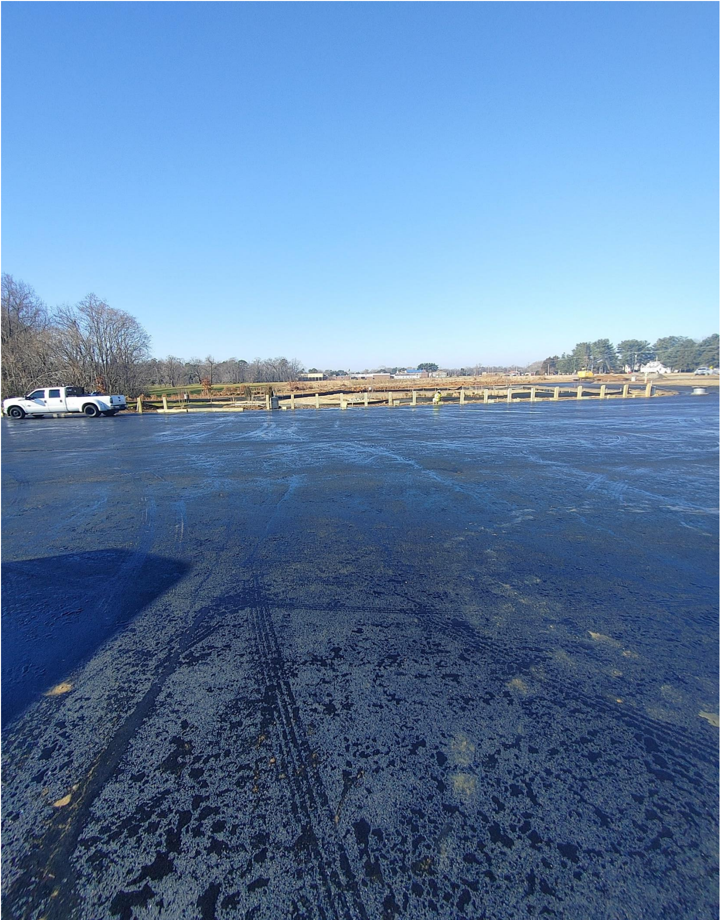
Photo 5 - Fence Posts are being installed