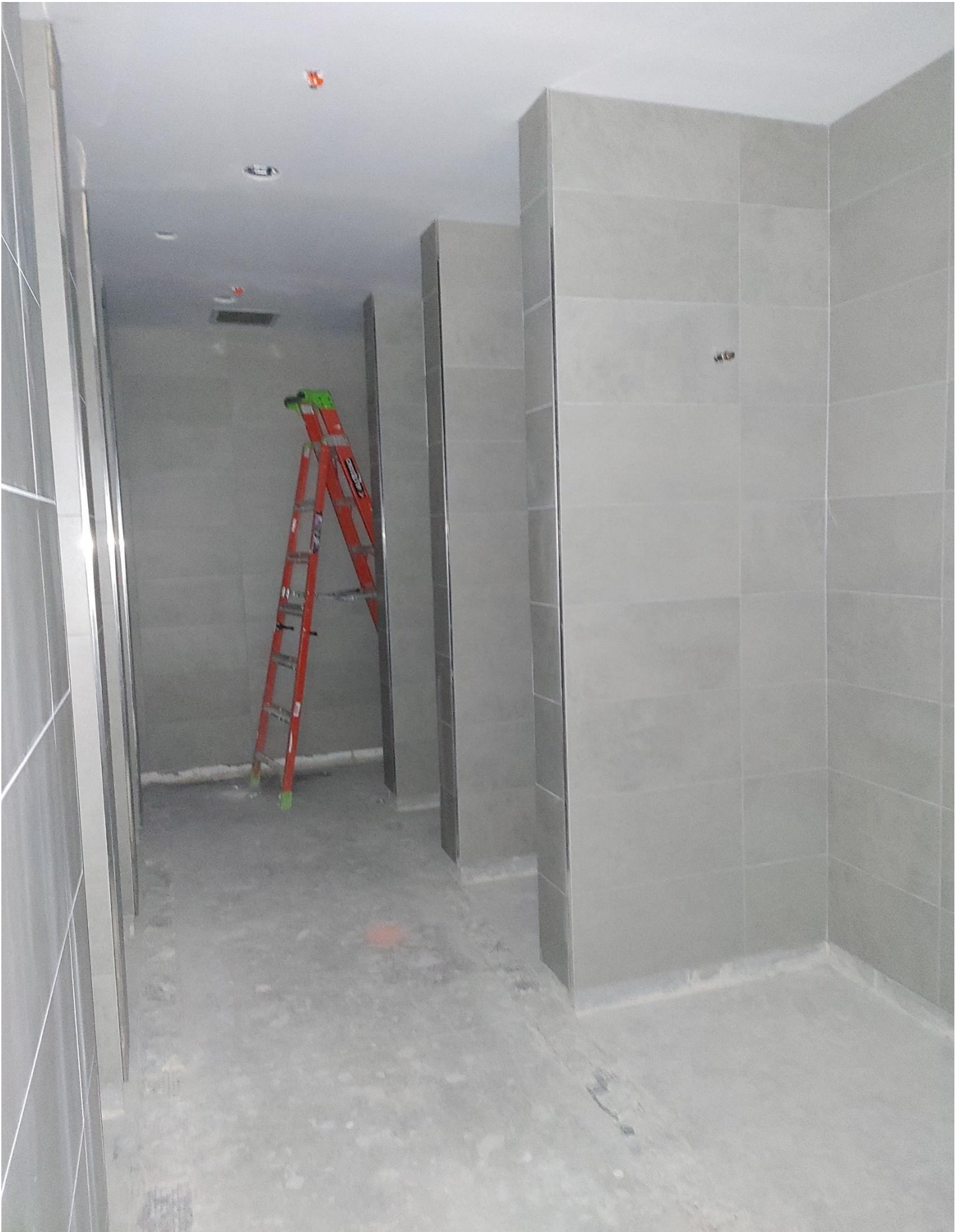
Photo 9 - Wall Tile E126 - Boys Locker room