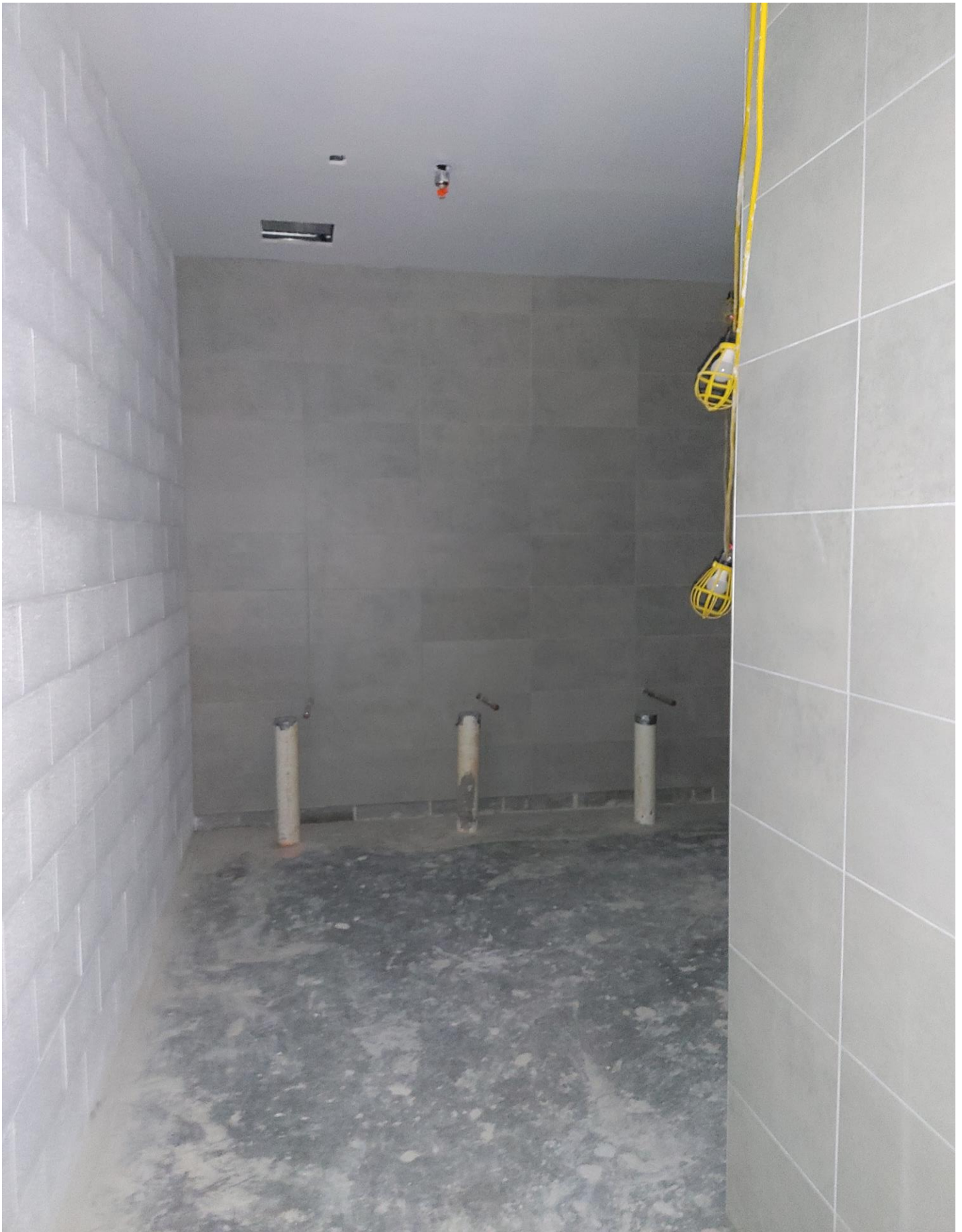
Photo 6 - Girls Locker Room - E104