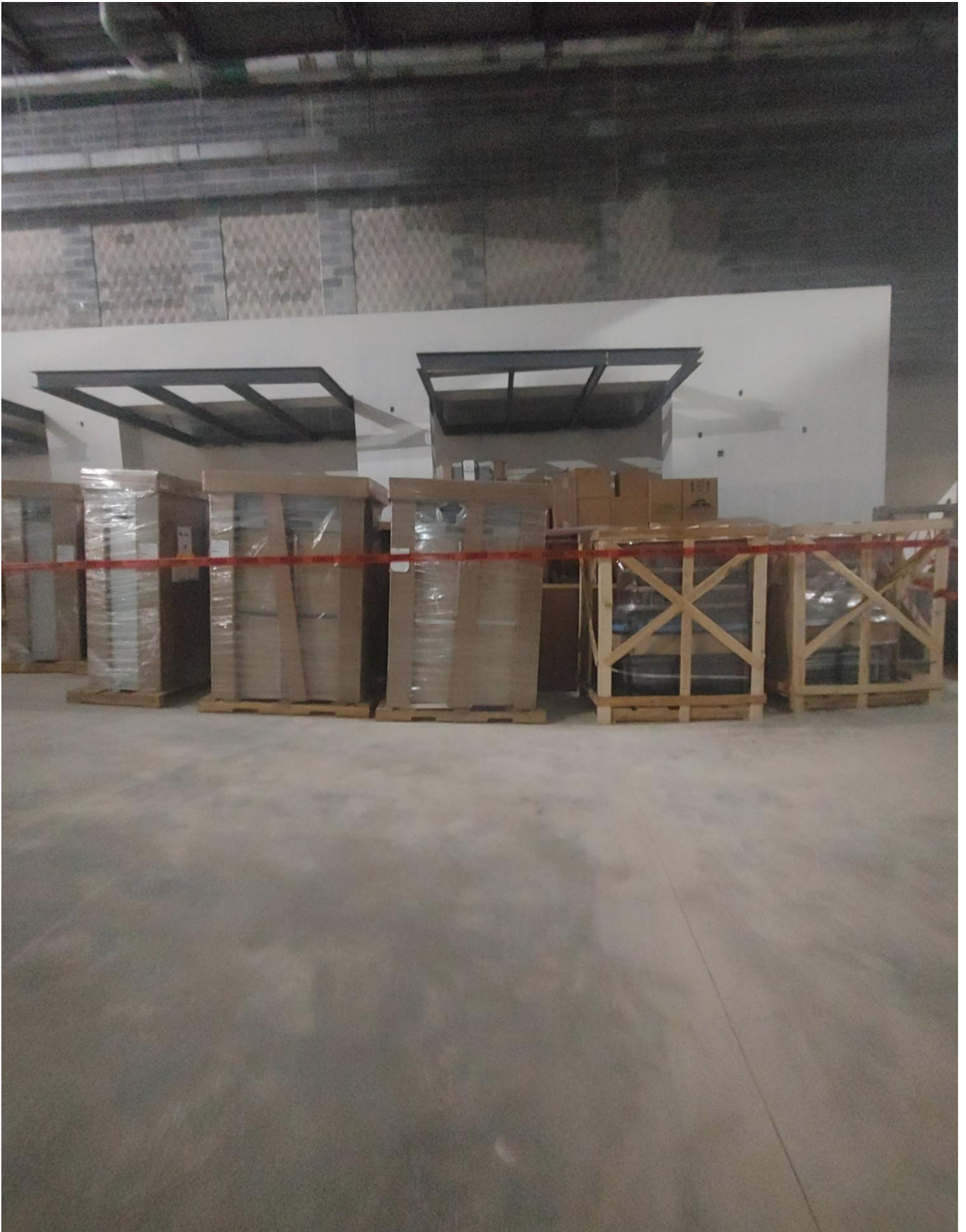
Photo 13 - Kitchen Reach-in Cooler & Equipment stored in Auditorium