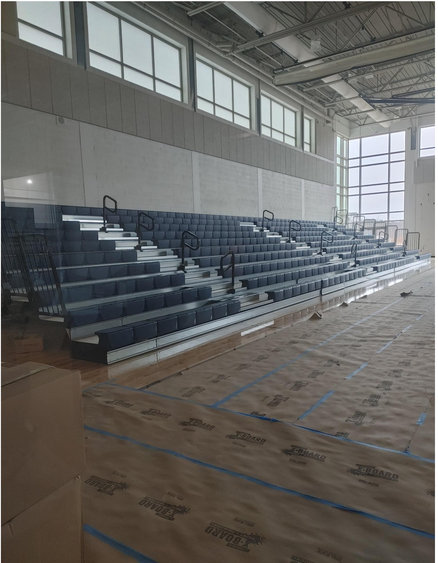
Photo 3 - Bleacher on the East side of Gym have been completed.