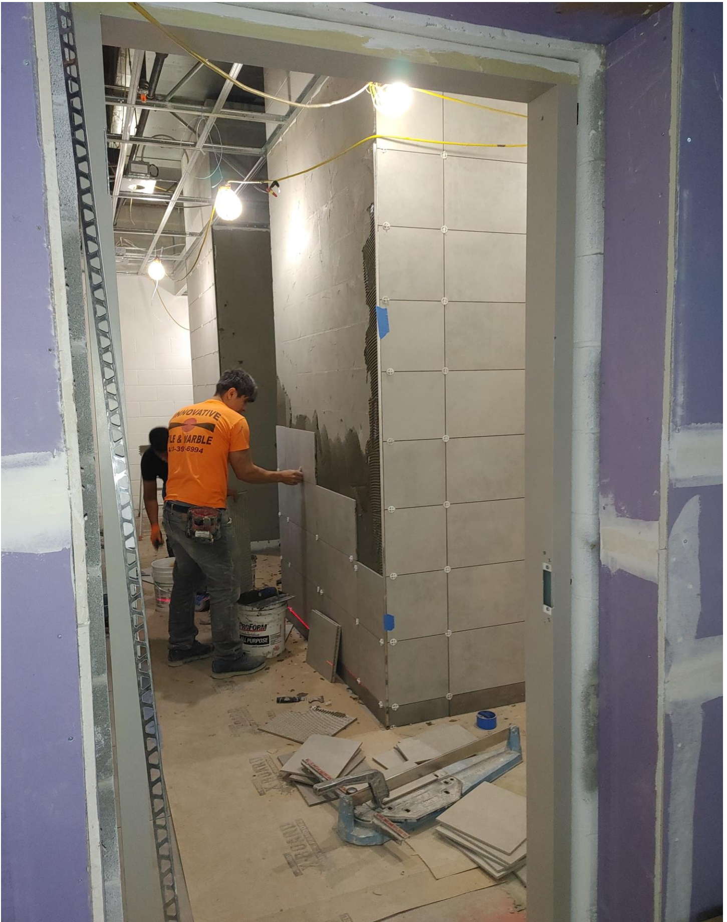
Photo 2 - Tile being laid in the Entryway of E103/E104