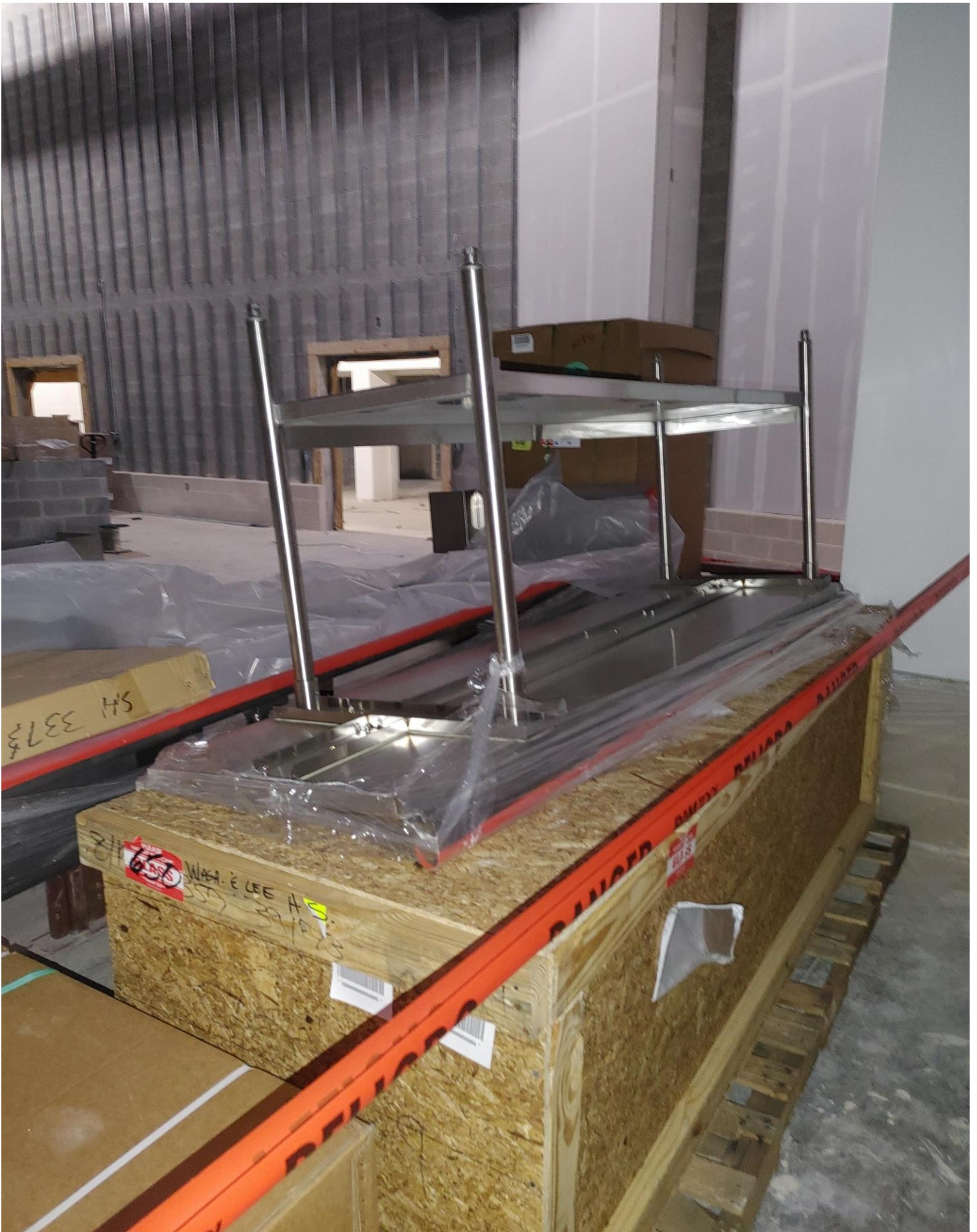
Photo 12 - Stainless steel table & Equipment stored in Auditorium