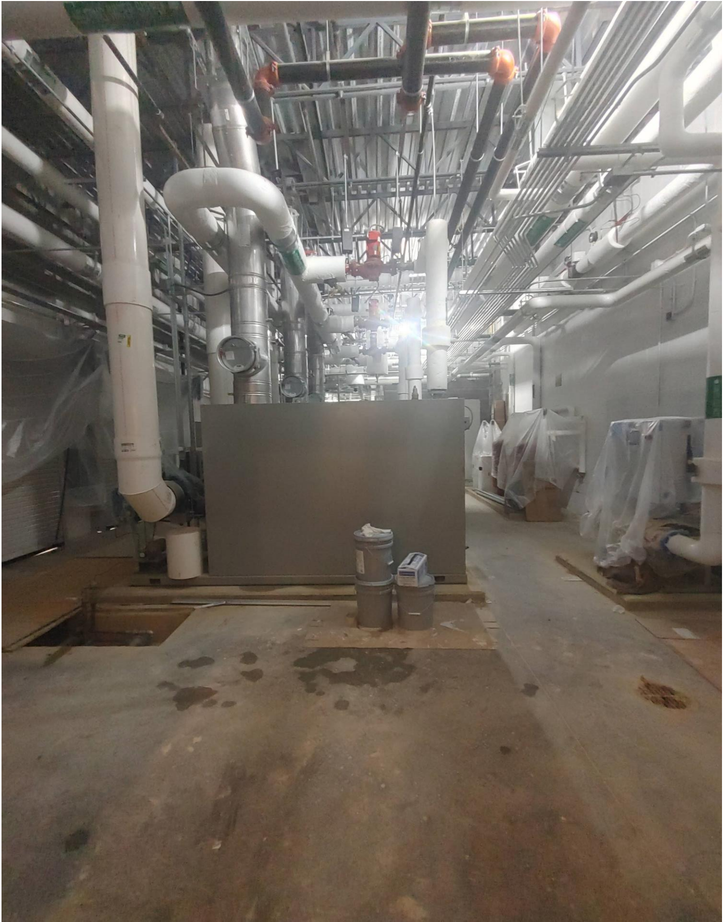
Photo 14 - D154 - Mechanical Room is being painted.