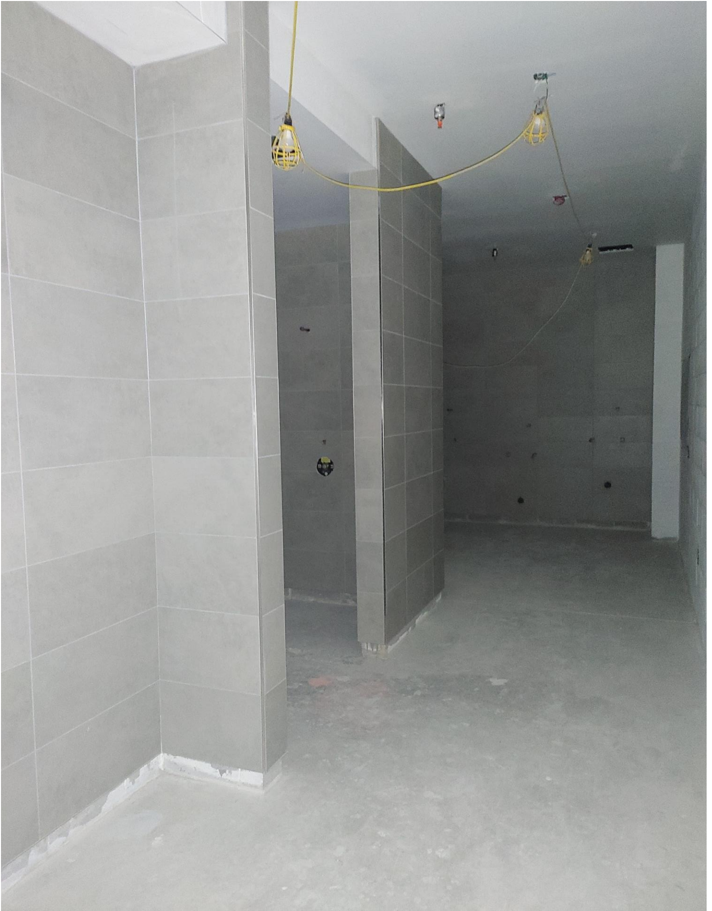
Photo 8 - Wall Tile has been laid in E126 Boy's Locker Room