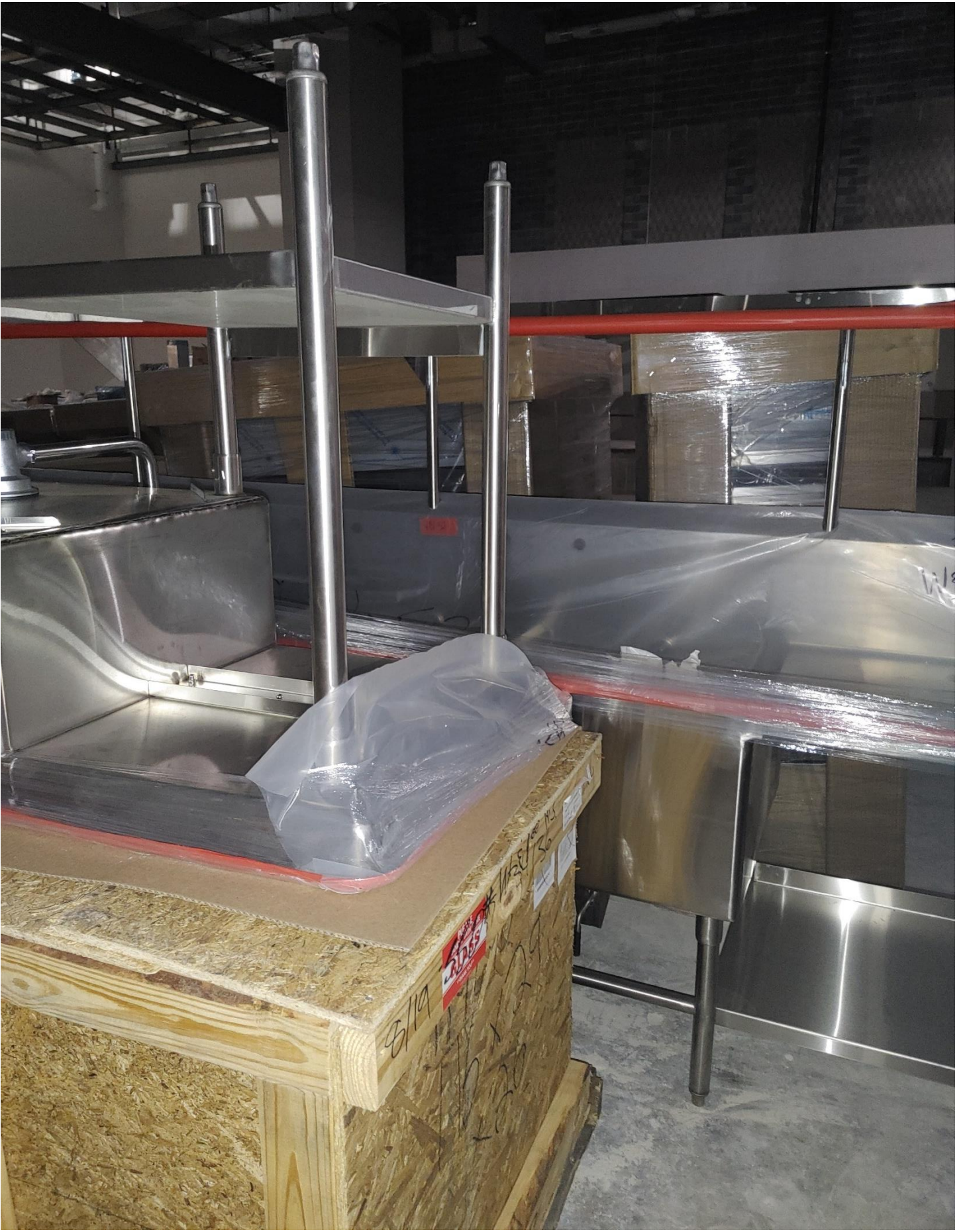
Photo 11 - Kitchen Sinks, Tables, Equipment stage in Auditorium