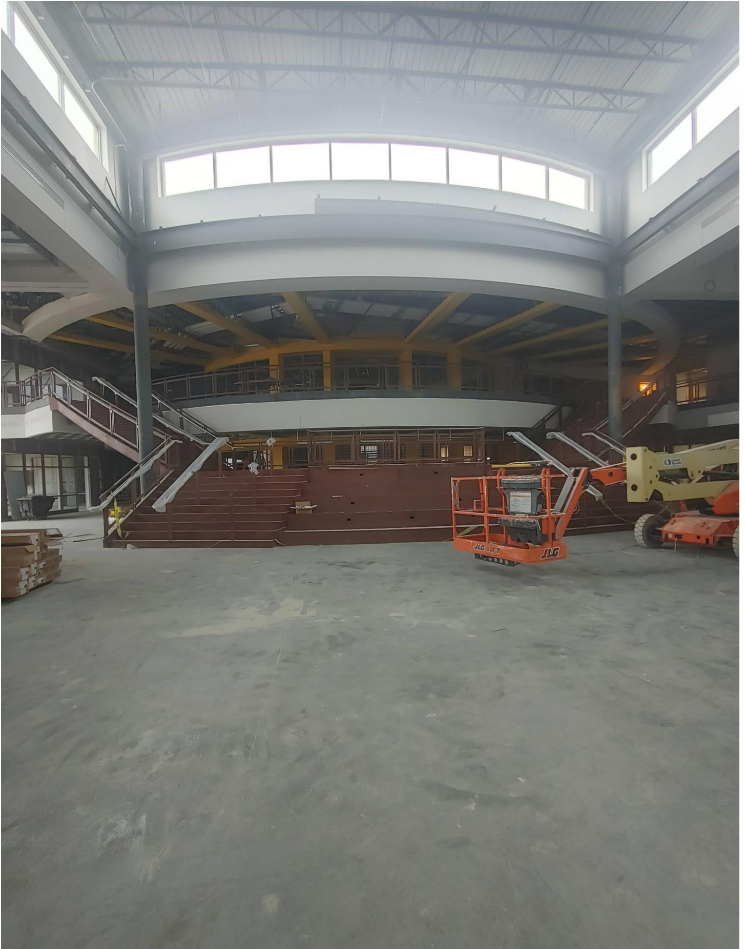
Photo 1 - Work continues on and around the Grand Staircase.