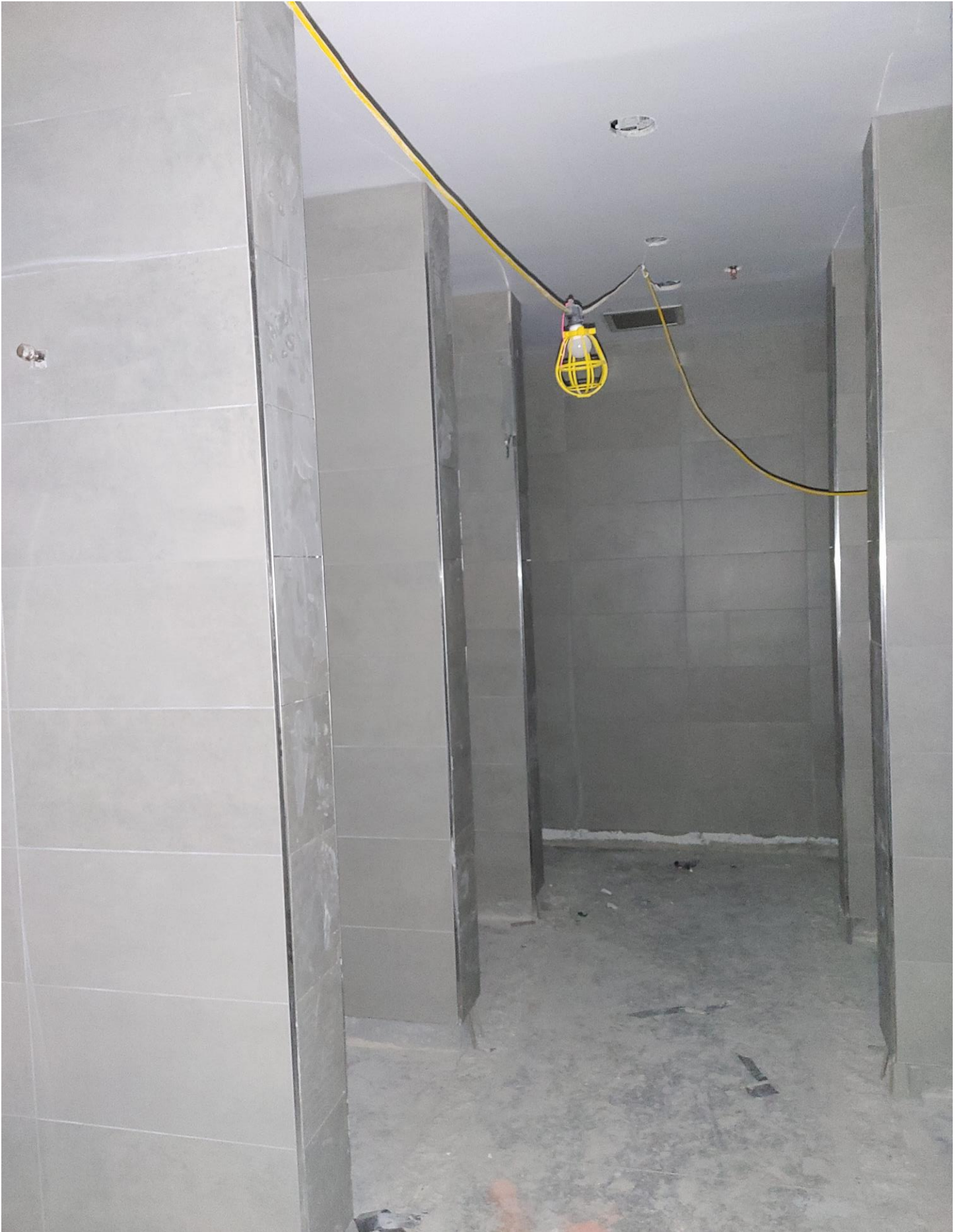
Photo 5 - Wall Tile has been laid in E104 Girls Locker Room