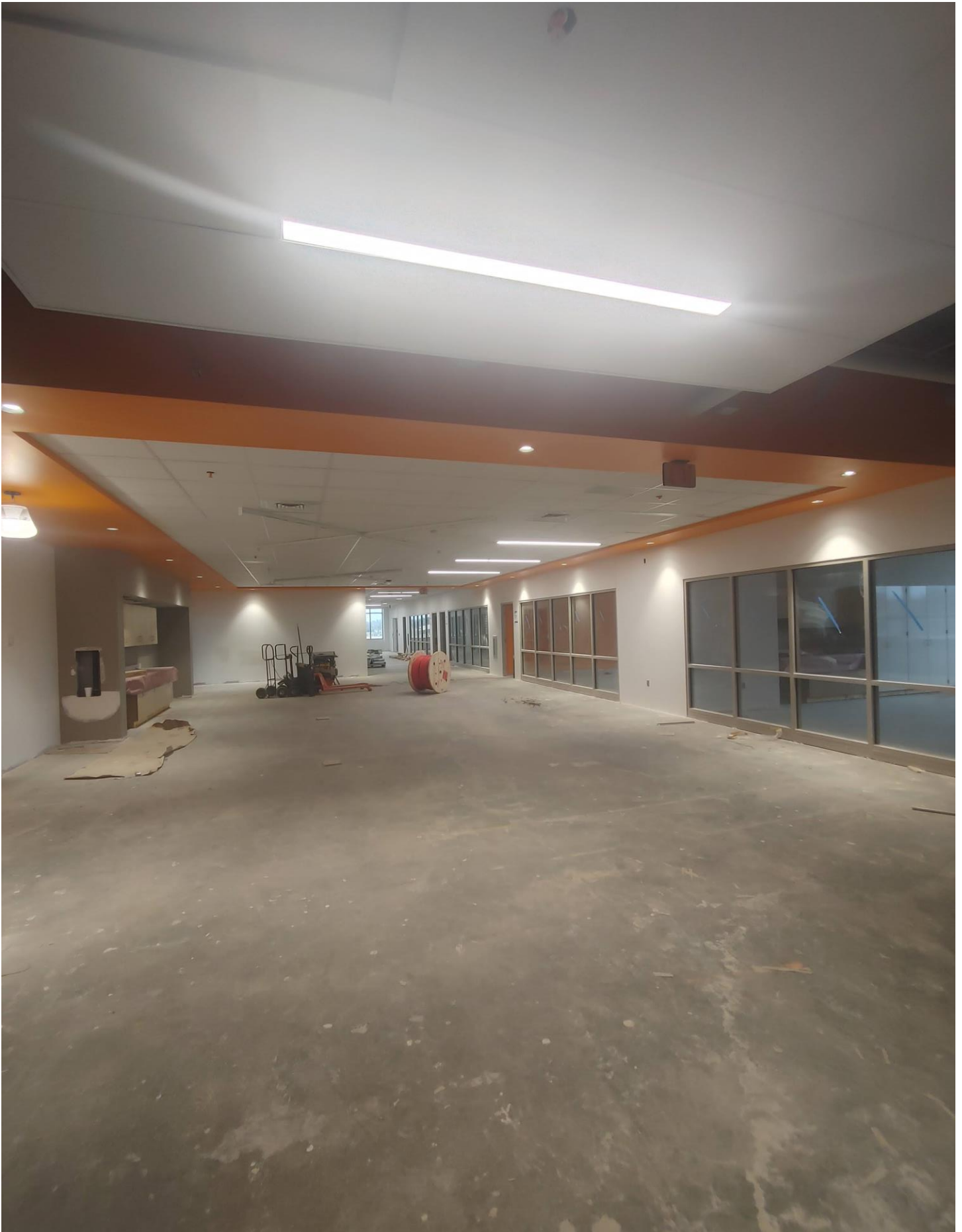
Photo 15 - Border Bulkhead has been painted Orange on the 2 nd floor of Area B.